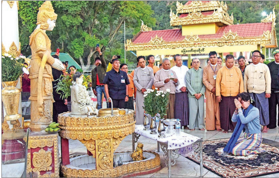
State Counsellor pays homage to the Buddha image at Sulamuni Pagoda in Taunggyi, Shan State.

For example, who was responsible to achieve peace? All must have the mindset of being responsible for it. The country will develop only through peace. Only when the country develops can each and every one have sustainable development. We should not be proud of being rich alone when the country is poor. In fact, it is something to be ashamed of. All need to share the fruits as well as the burdens. Challenges must be faced and overcome together. Only with this spirit can our country become a true Federal Democratic Union. The belief that this was possible was due to a region like Taunggyi. We have places like Taunggyi in our country where different ethnic nationals with different languages and different religious belief lived together peacefully. If such places expand into the whole