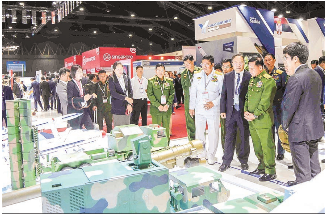
Senior General Min Aung Hlaing visits Myanmar Tatmadaw exhibition displayed at the Defense & Security 2019 event in Thailand.