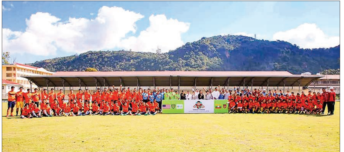
The attendees at the Community Champions Football Clinic programme pose for a group photo at the event in Taunggyi on 19 November.