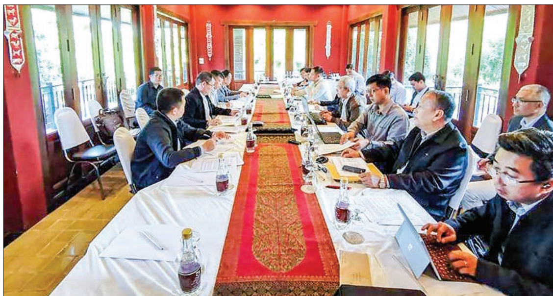
Representatives from National Reconciliation and Peace Center (NRPC), Restoration Council of Shan State (RCSS) hold a meeting in Chiang Mai, Thailand yesterday.