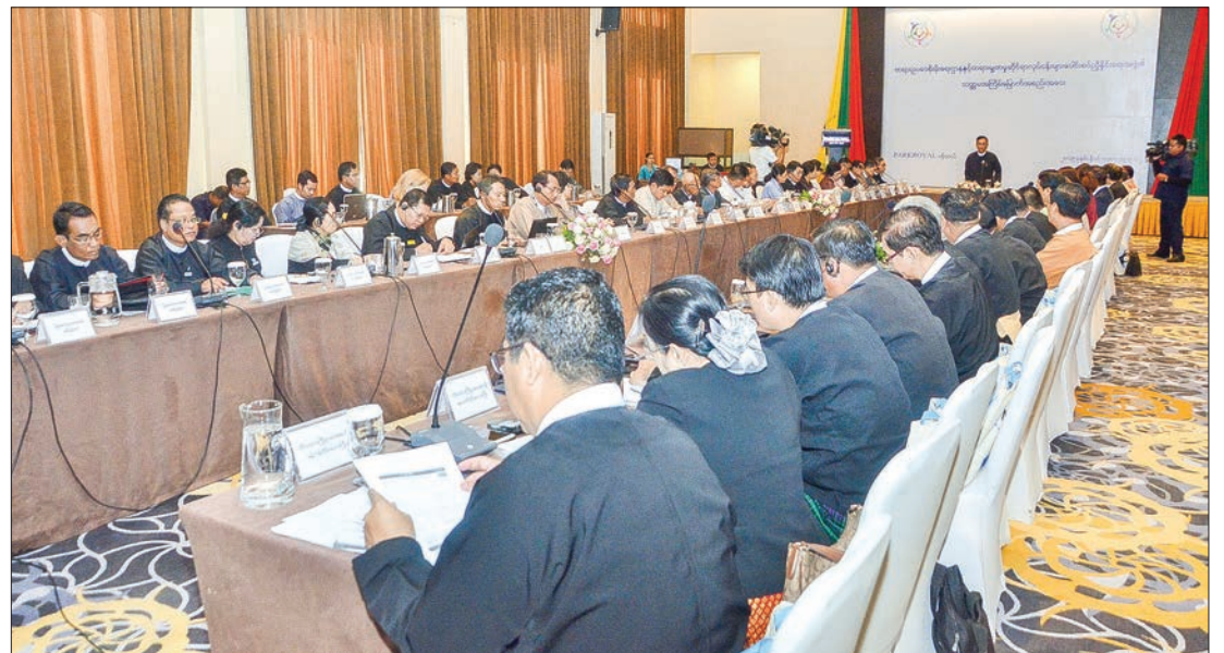
Union Attorney-General U Tun Tun Oo delivers the opening speech at the 7 th meeting of the coordination body of Rule of law department and judiciary fairness works in Nay Pyi Taw.

THE Rule of Law Centres and Justice Sector Coordinating Body organized its 7 th meeting at Park Royal Hotel in Nay Pyi Taw yesterday morning.