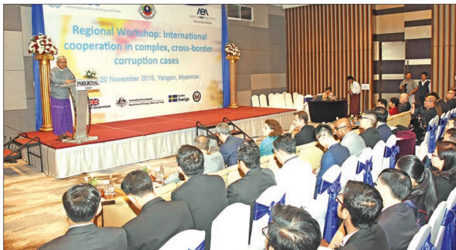
Cross-border Corruption Cases workshop taking place in Yangon.

Jointly organized by the United Nations Office on Drugs and Crime-UNODC, American Bar Association-ABA and the Anti-Corruption Commission of Myanmar, Regional Workshop on International Cooperation in Complex, Cross-border Corruption Cases was held at the Park Royal Hotel in Yangon yesterday.