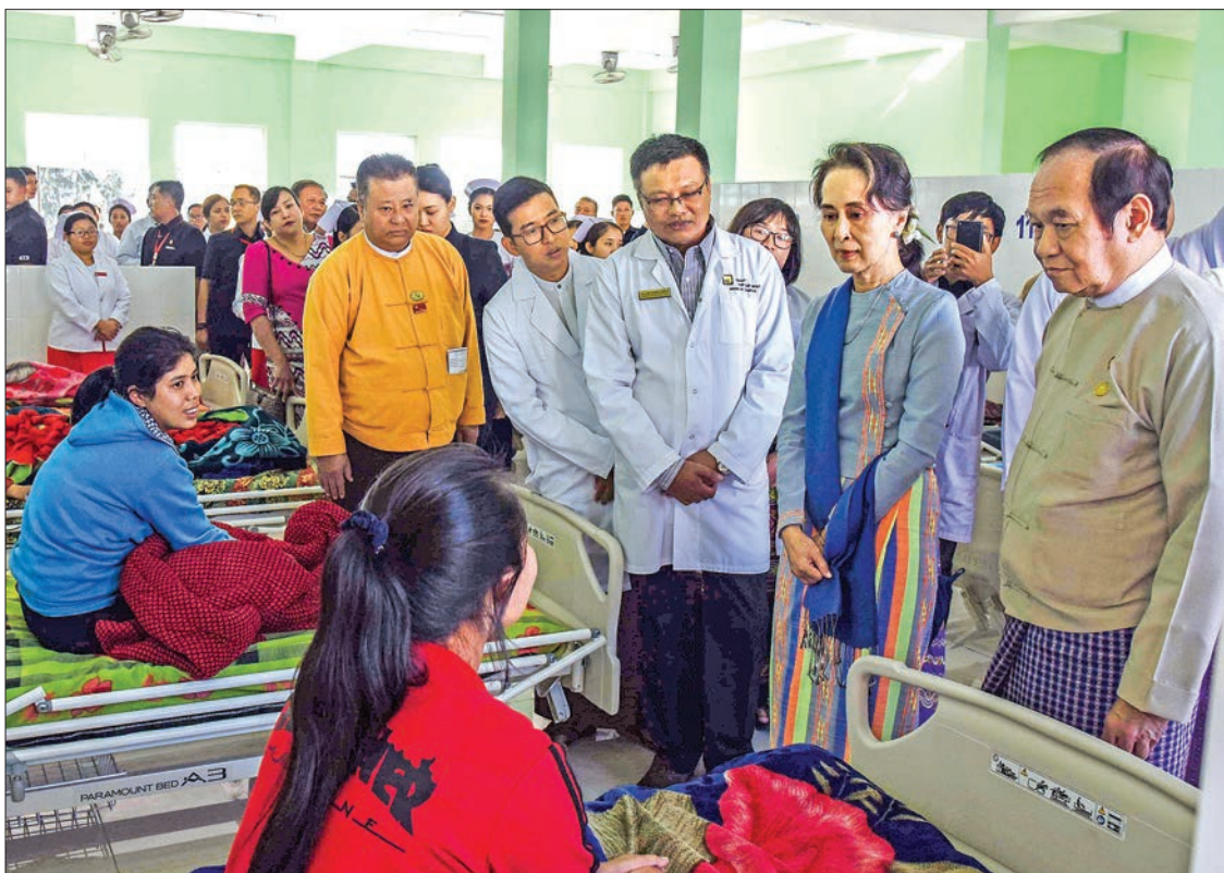
State Counsellor Daw Aung San Suu Kyi encourages patients at the Women and Children Hospital in Taunggyi, Shan State yesterday.

For our country to develop, the mindset of each citizen needs to be correct. Not only mindset, but effective support by work is also required. Hope or expectation not supported by work will become a dream that disappears. If hope or expectation is to be achieved, work must be done.