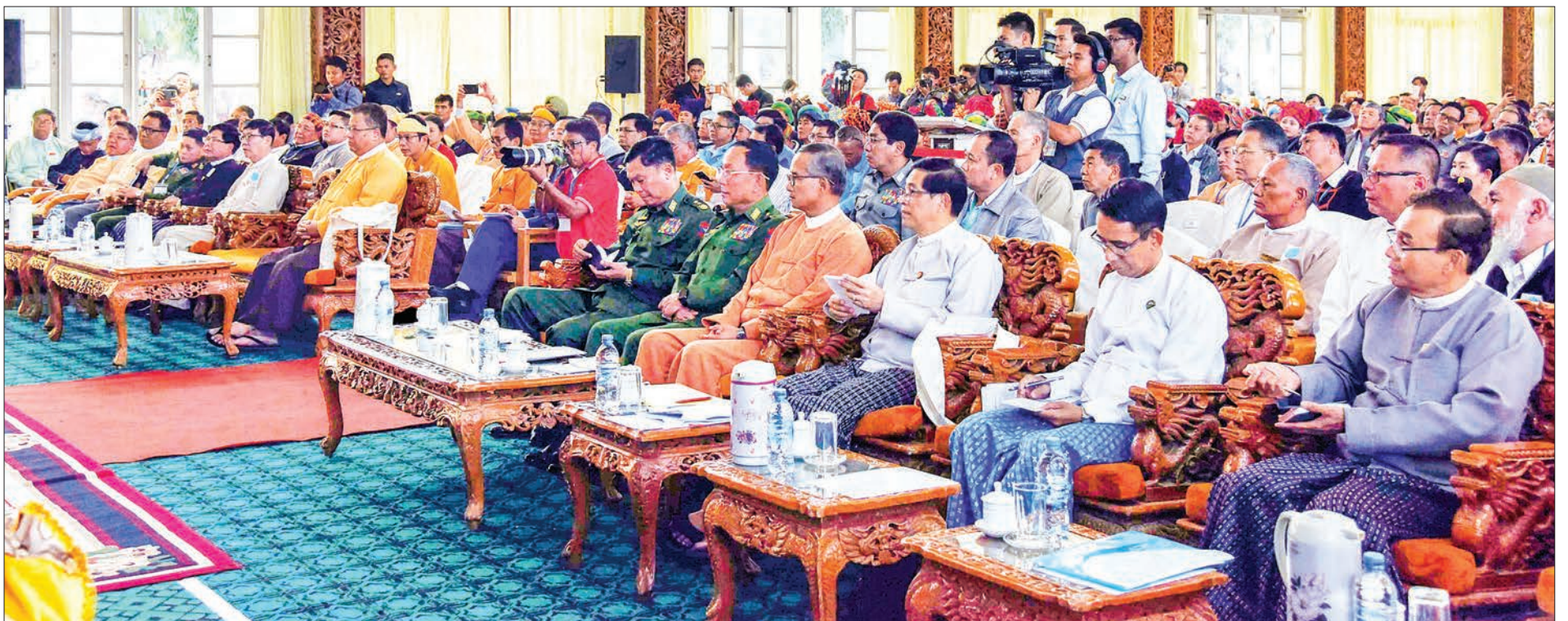
State Counsellor Daw Aung San Suu Kyi meets with locals of Shan State at the Town Hall in Taunggyi yesterday.