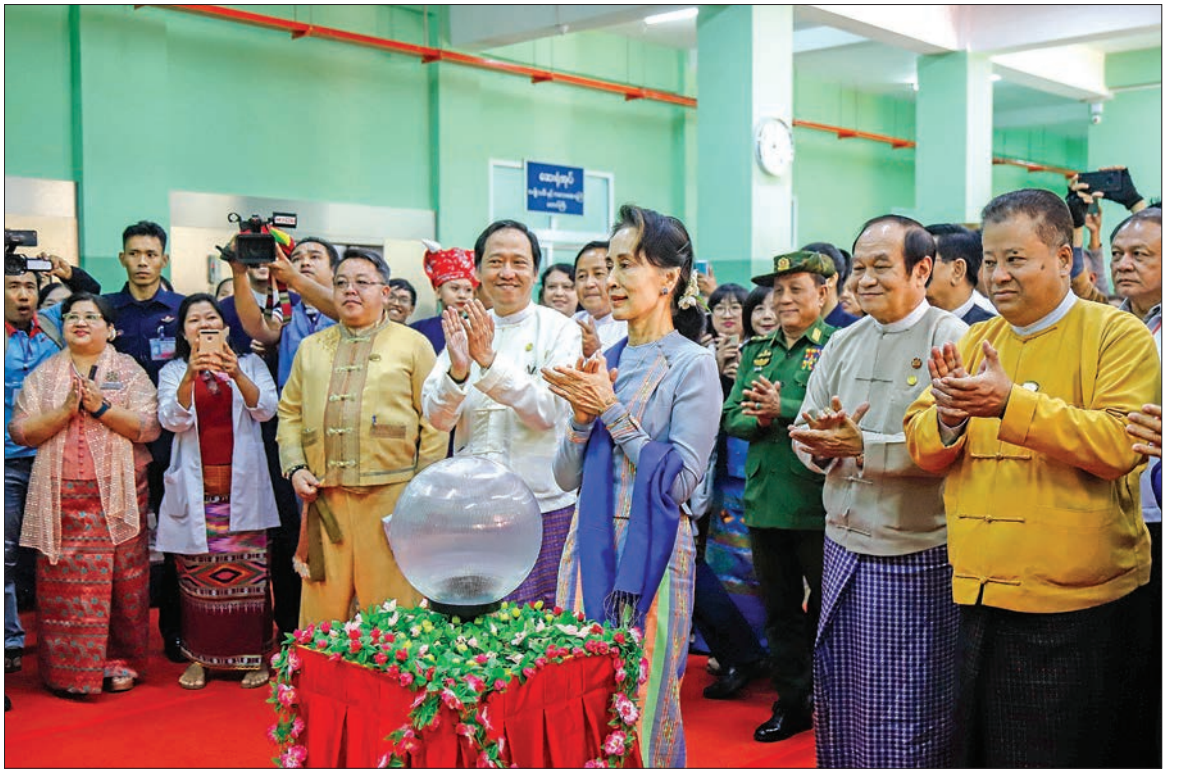
State Counsellor Daw Aung San Suu Kyi officially opens the new building of Women and Children Hospital in Taunggyi, Shan State yesterday.