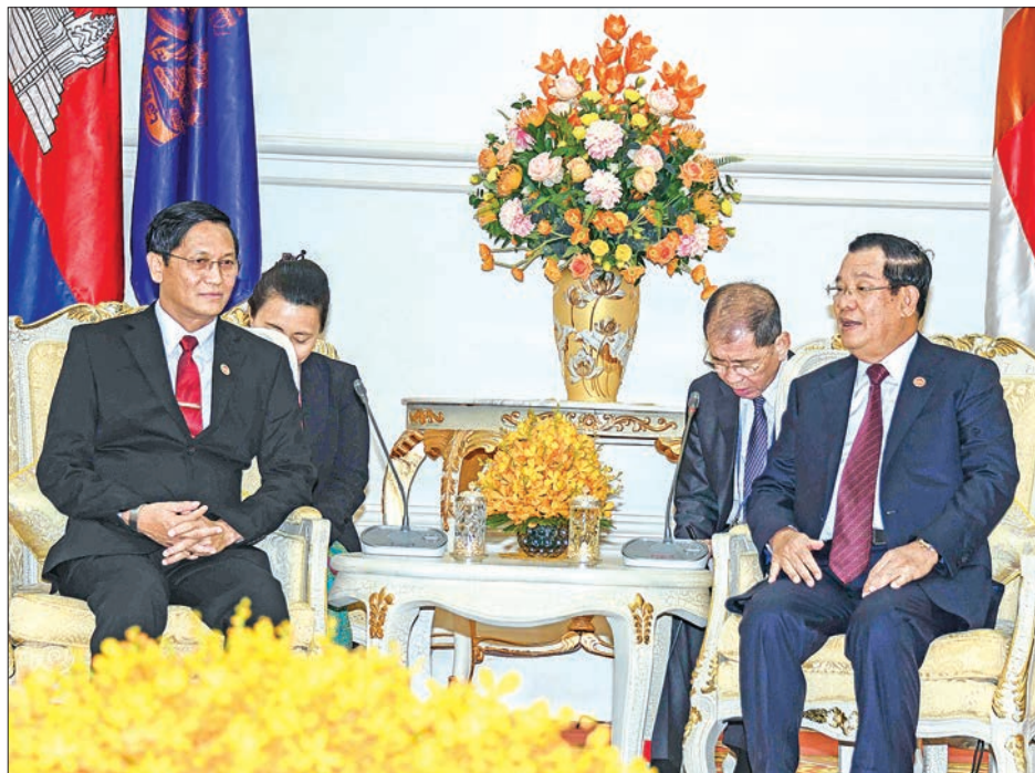
Vice President U Henry Van Thio meets with Cambodian Prime Minister Samdech Hun Sen at the Peace Palace in Phnom Penh, Cambodia yesterday.