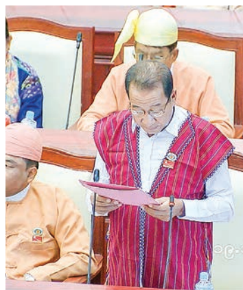
MP U Pe Du of Prusho constituency.