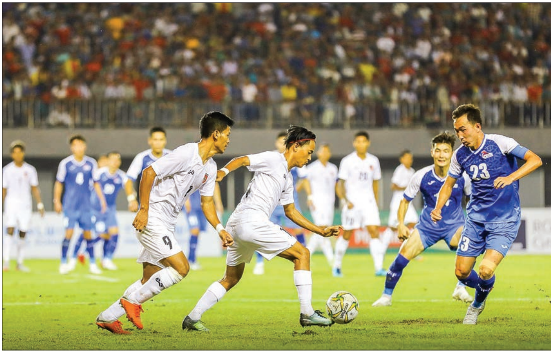
Myanmar players (white) and Mongolian players (blue) vie for the ball in the 2022 World Cup Qualifiers match at the Mandalay Thiri Stadium in Mandalay on 19 November.

MYANMAR beat Mongolia 1-0 in the 2022 World Cup Qualifiers match at the Mandalay Thiri Stadium in Mandalay yesterday.