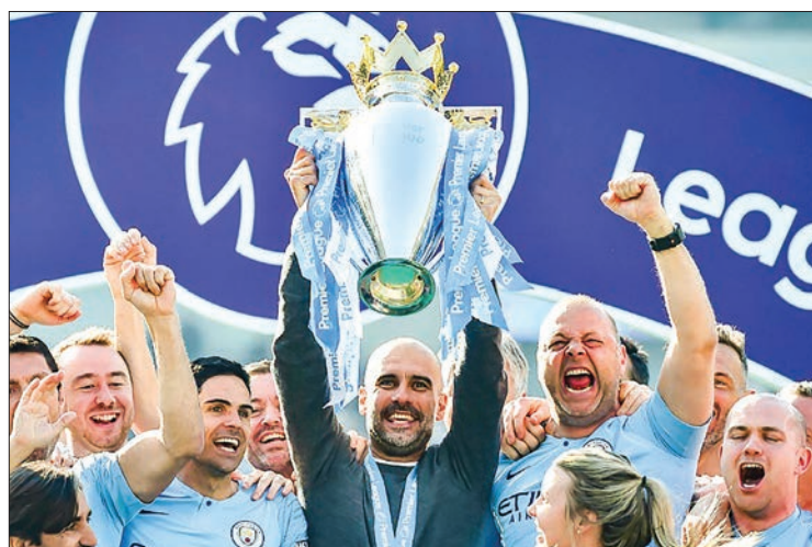
Manchester City posted record revenues of £535 million after winning a domestic quadruple of trophies last season.

The sale of a host of players unable to break into the first team helped boost profits to £10.1 million. Prior to Sheikh Mansour's takeover of City in 2008, the club's