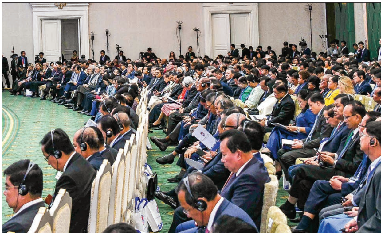
Vice President U Henry Van Thio addresses the inaugural ceremony of 2 nd Asia Pacific Summit in Phnom Penh, Cambodia yesterday.

VICE PRESIDENT U Henry Van Thio delivered a speech at the inaugural ceremony of 2 nd Asia Pacific Summit held the Peace Palace in the Prime Minister's Office in Phnom Penh, Cambodia, yesterday morning.