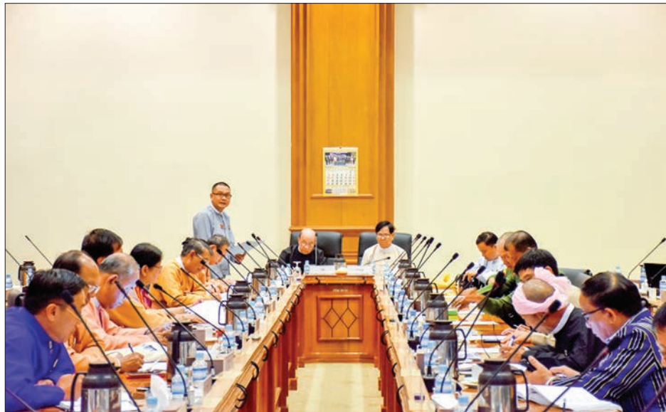
Pyidaungsu Hluttaw Deputy Speaker U Tun Tun Hein attends the meeting 59/2019 of the Joint Committee on Amending the 2008 Constitution in Nay Pyi Taw.

MEETING 59/2019 of the Joint Committee on Amending 2008 Constitution was held at Pyidaungsu Hluttaw Building D in Nay Pyi Taw yesterday afternoon.