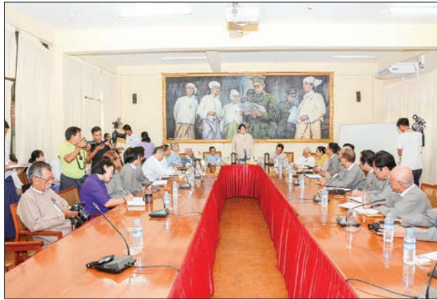
Union Minister for Information Dr Pe Myint addresses the meeting with members from Myanmar Motion Picture Organization in Yangon yesterday.

UNION Minister for Information Dr Pe Myint held a meeting with the patrons and new executive body of Myanmar Motion Picture Organization at the meeting hall of organization in Yangon yesterday morning.