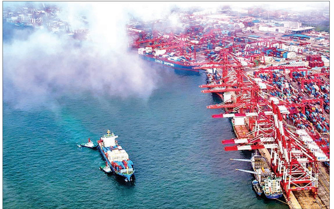
The long-running trade war between Washington and Beijing has weighed on the global economy and spooked markets.