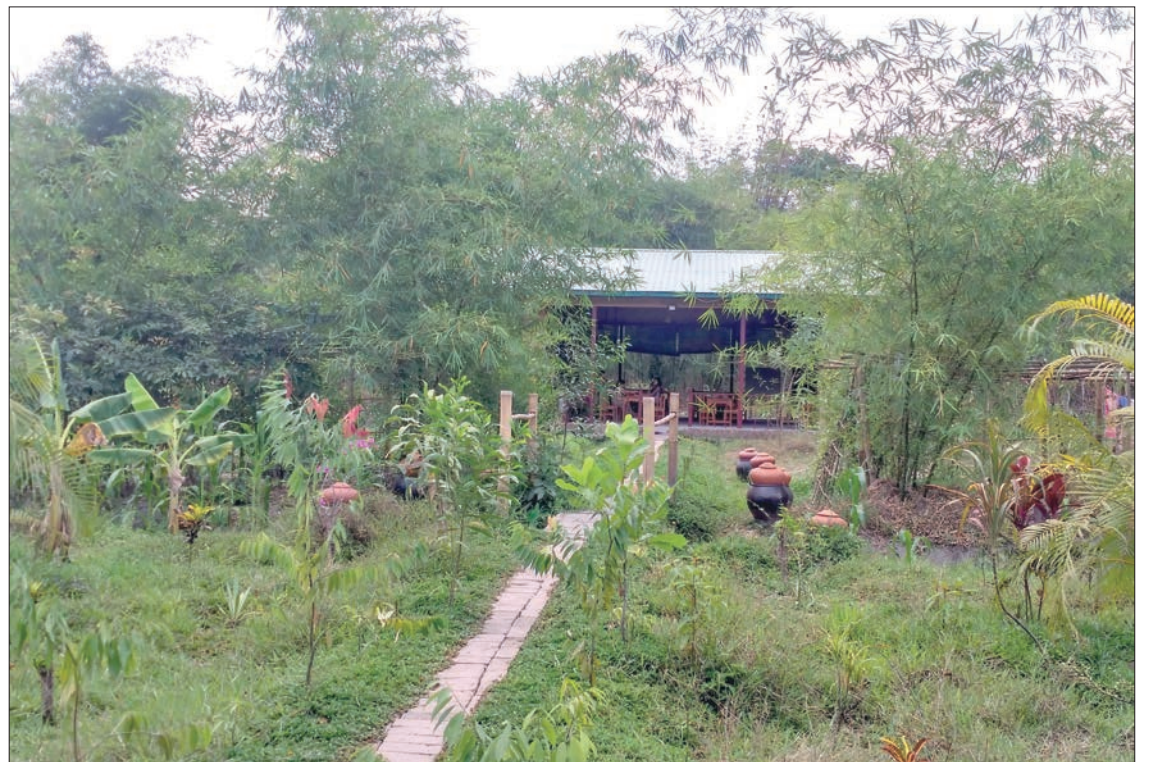
Mingalar Bar Bio Garden Community Based Tourism in Kyaikthale Village in Twantay Township.

need to open up its unspoiled beach and natural sceneries to the world where globetrotters can observe honesty, openness and customs of local people. The CBT has played a small role in Myanmar's tourism boom. Visitors at home and abroad visit some villages which are located