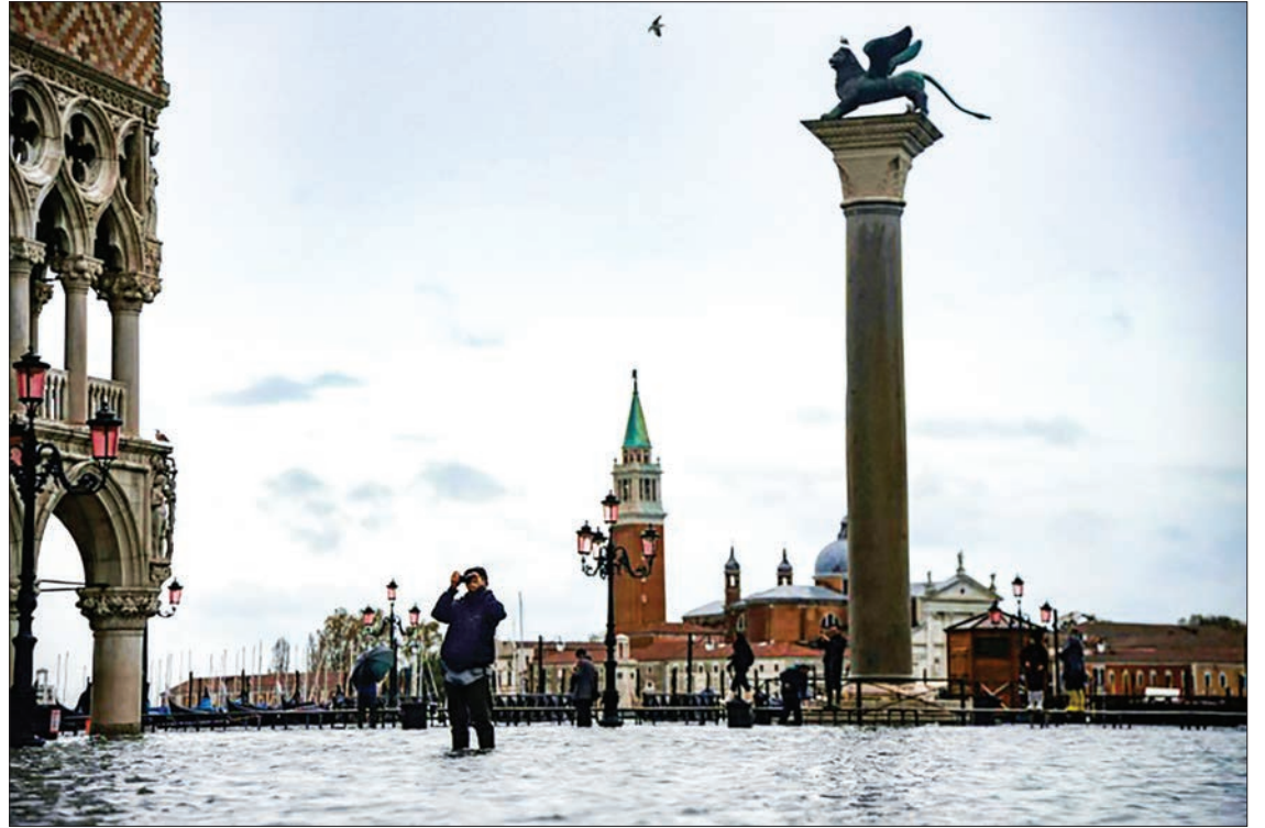
Churches, shops and homes have also been inundated in the city, a UNESCO World Heritage site.

Firefighters tweeted footage of a hovercraft being deployed to rescue stranded citizens in southern Tuscany's Grossetano province. —AFP ■