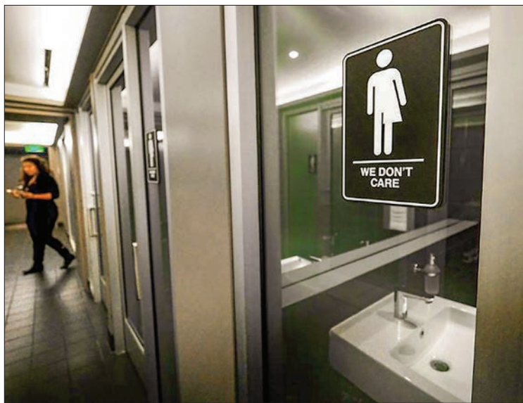
Gender-neutral signs are posted in public restrooms in a hotel in Durham, North Carolina in May 2016.