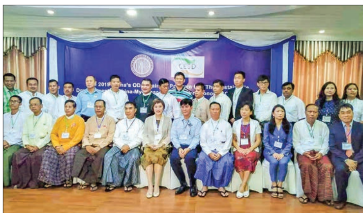
Officials and trainees pose for a group photo at the opening ceremony of the training course for sustainable economic cooperation between Myanmar and China in Mandalay yesterday.