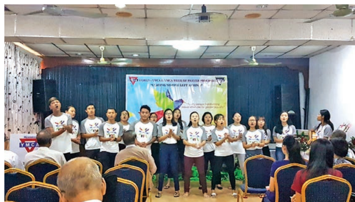
Youths performing at the World Week of Prayer by the World YMCA and YWCA event in Yangon.

THIS year's World Week of Prayer by the World YMCA and YWCA was held from 10 to 16 November, under the theme "Young people transforming