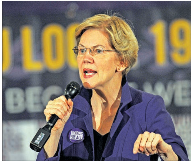
Democratic presidential candidate Elizabeth Warren has taken aim at billionaires in a new campaign ad.

The one-minute campaign ad shows clips of several leading businessmen criticizing her plans for a wealth tax and predicting economic ruin if she is elected to succeed Donald Trump, a