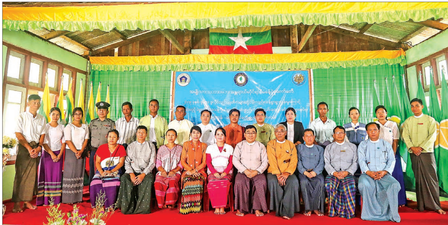
Union Minister Dr Win Myat Aye and officials pose for a group photo at the opening ceremony of the four-day course of training for trainers to conduct grading and registration of persons with disabilities in Nyaunglebin yesterday.