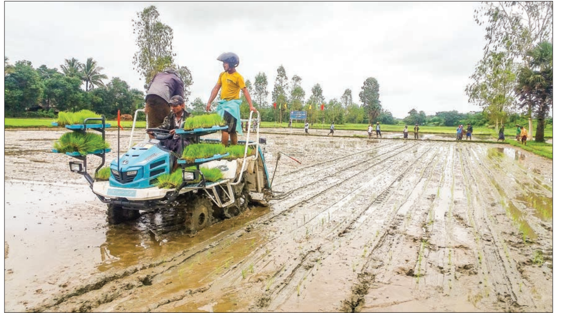
Farmers planting rice in the field by using rice planting machine.