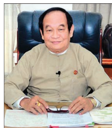
Union Minister for Health and Sports Dr Myint Htwe.

"In order to do this, we organize training courses and send them abroad for international