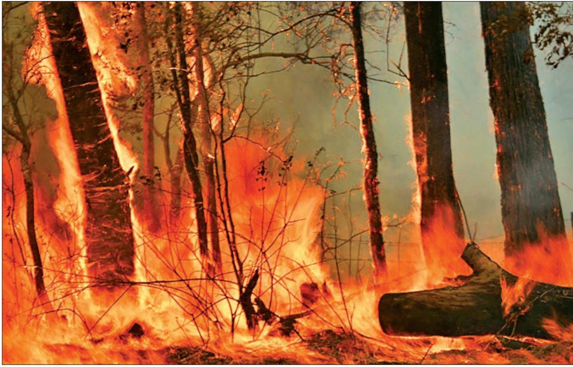
Devastating bushfires have razed more than a million hectares along Australia's seaboard.

SYDNEY (Australia)—An Australian man has been accused of deliberately lighting a fire to protect his cannabis crop, sparking an out-of-control bushfire as blazes rage along the country's east coast.