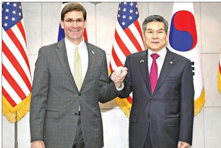
US Secretary of Defense Mark Esper (L) and South Korean Defense Minister Jeong Kyeong Doo shake hands in Seoul on 15 November 2019. They held the annual Security Consultative Meeting.

The gesture toward Pyongyang, which has protested the upcoming drills, appears aimed at reviving nuclear negotiations between North Korea and the United States.