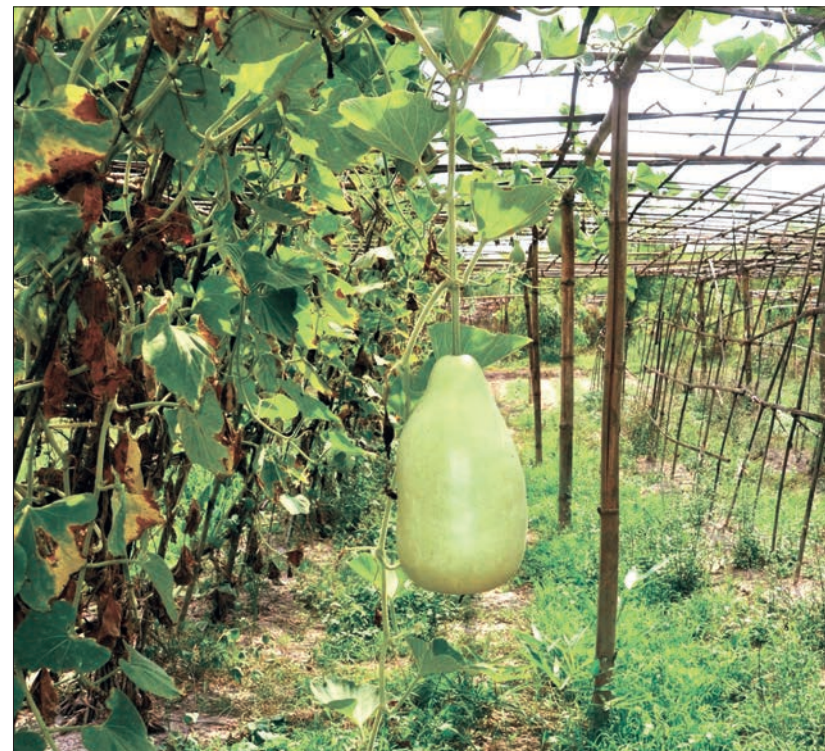
Fresh green vegetable plantations of the Community based tourism (CBT) in Kyaikthale Village in Twantay Township.