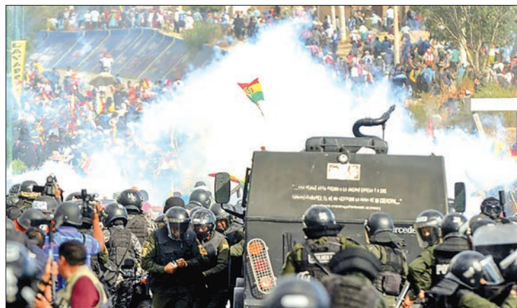
There have been frequent clashes between supporters of ex President Evo Morales and Bolivian riot police.

Thousands of coca growers had tried to reach the city to join a protest against Anez but they were blocked by riot police, who stopped them from crossing a bridge and dispersed the crowd after dark with the support of the army. Five protesters were initially reported dead in the confronta-