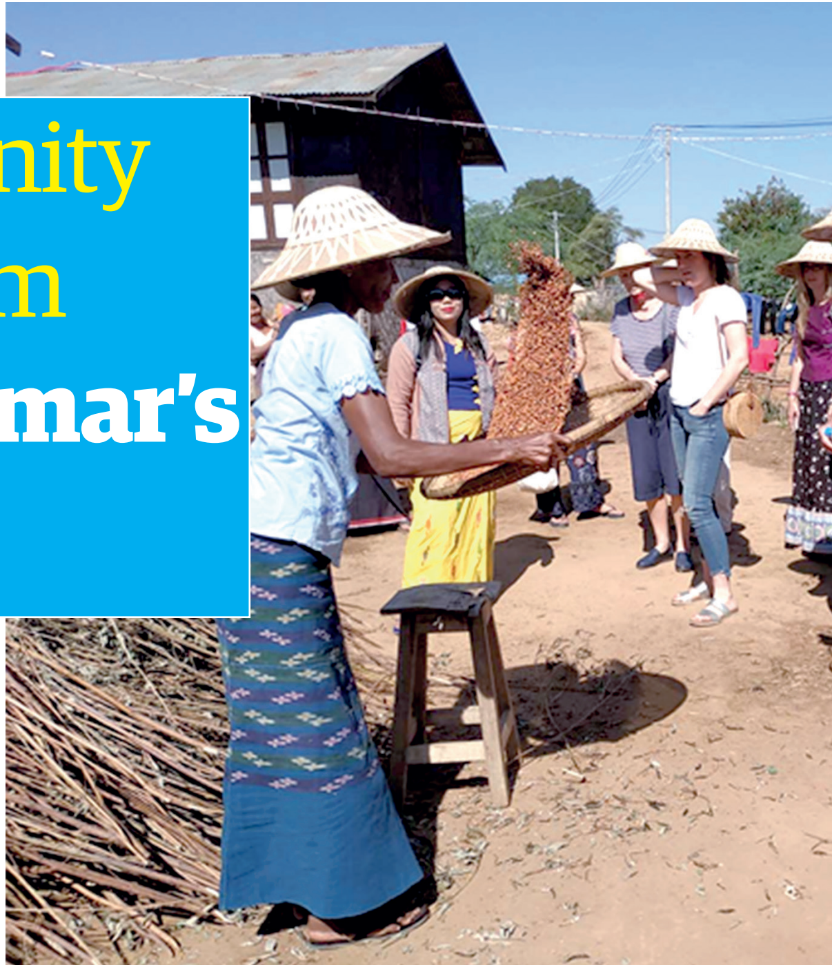
Tourists visit a CBT village in Meiktila Township, Mandalay Region.

mains for generations to come. The CBT provides opportunities for local people to bring in income and also to introduce their culture to visitors. The CBT can provide income and opportunities for all people, including women and other disadvantaged groups such as people with disabilities. In addition, the CBT gives local people a chance to share their culture with the world, as well as learn more about other peoples' cultures and experiences. Tourism activities should not damage the local community's way of life or traditions. Safety is important to CBT travelers, especially because some developing countries are politically unstable. Most international tour operators do not offer holi-