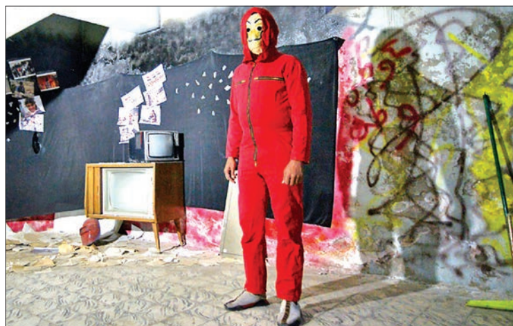
The viral music video has scored hundreds of thousands of hits despite frequent internet blackouts in Iraq.

internet blackouts, hold up signs that read "Justice for our martyrs" and "I want my rights."—AFP ■