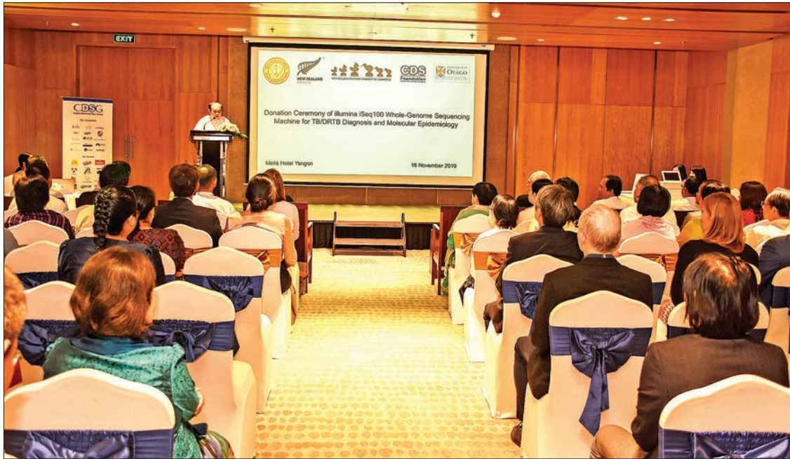
Union Minister Dr Myint Htwe delivers the speech at the Donation ceremony of the Whole Genome Sequencing machine in Yangon on 16 November.

MINISTRY of Health and Sports has received a modern Whole Genome Sequencing machine which can determine complete genome sequence for a given organism at one time.