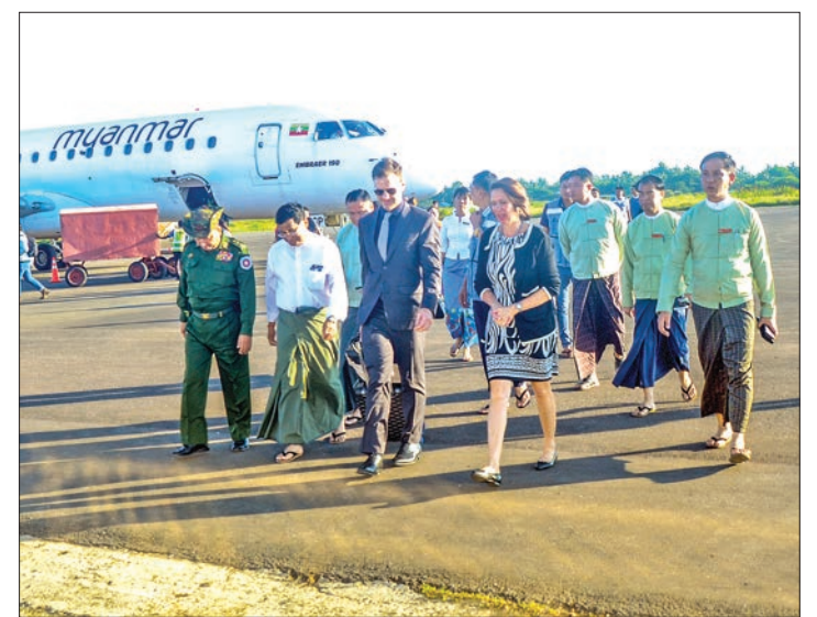
Officials welcome Deputy Minister U Soe Aung and Special Envoy of United Nations Secretary-General to Myanmar Ms. Christine Schraner Burgener at Sittway Airport yesterday.

A delegation led by Deputy Minister for Social Welfare, Relief and Resettlement U Soe Aung and Special Envoy of United Nations Secretary-General to Myanmar Ms. Christine Schraner Burgener arrived at Sittway from Yangon by air at