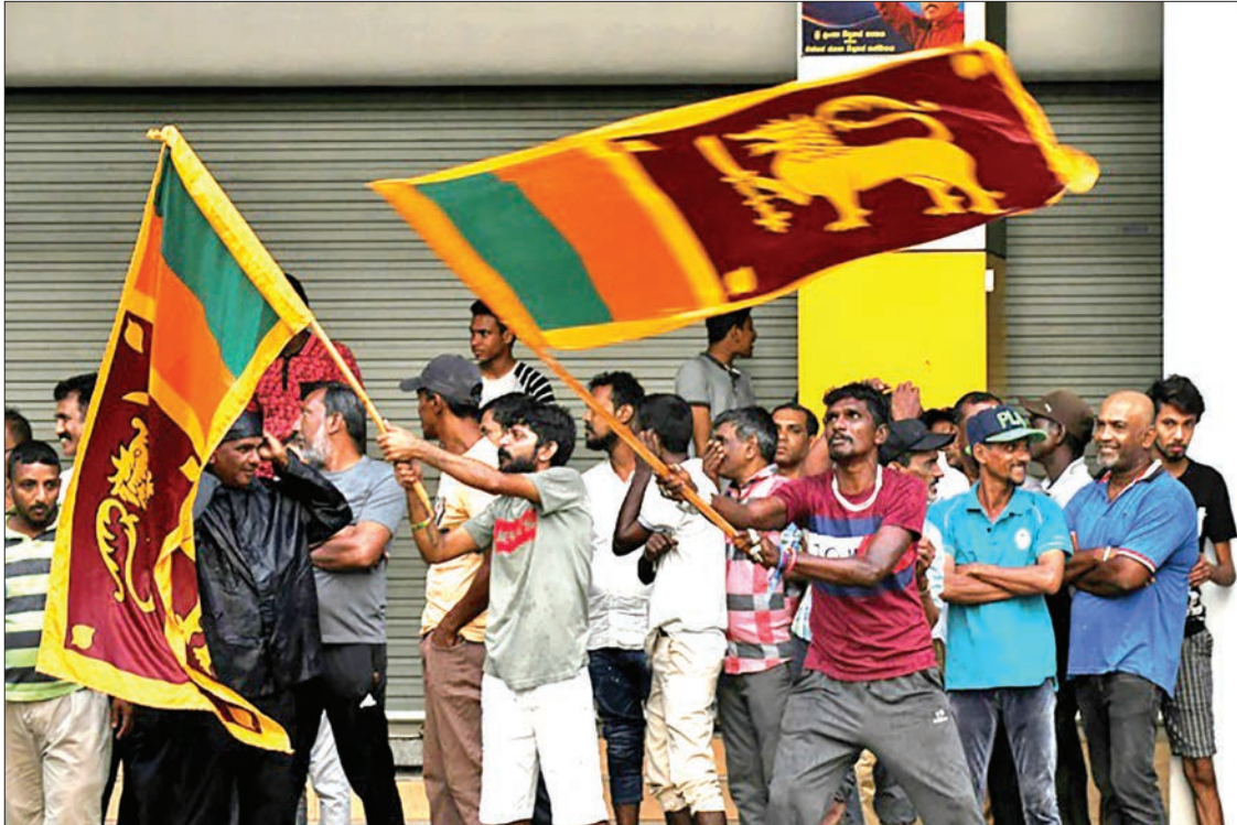
The election was relatively peaceful by the standards of Sri Lanka's fiery politics.

COLOMBO (Sri Lanka)—Gotabaya Rajapaksa, who spearheaded the brutal crushing of Tamil Tigers a decade ago, stormed to power Sunday but promised to be a president for all Sri Lanka's races and religions after a divisive election.