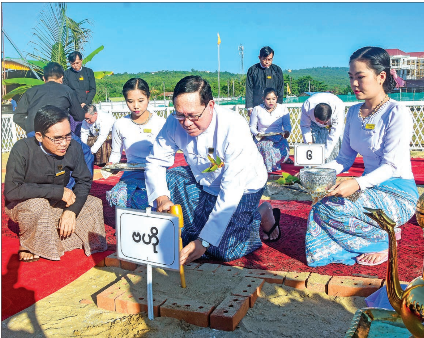
Union Chief Justice U Htun Htun Oo strikes the stake at the groundbreaking ceremony to build Judicial College of the Union Supreme Court in Nay Pyi Taw yesterday.

THE groundbreaking ceremony of Judicial College of the Union Supreme Court was held at the projected site of the building on Naygya Street, Zawana Theikdi Ward, Ottarathira District, Nay Pyi Taw