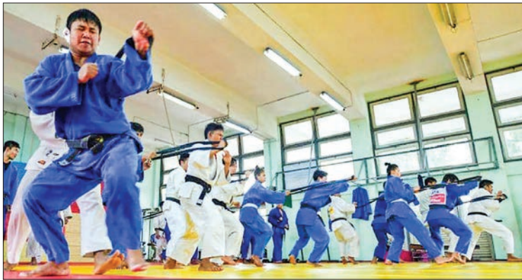
Myanmar athletes take intensive judo training under the supervision of Japanese Judo rainer from Japan's Kodokan Judo Institute.

The team will leave for the Philippines for the SEA Games on 23 November, according to the Myanmar Football Federation.