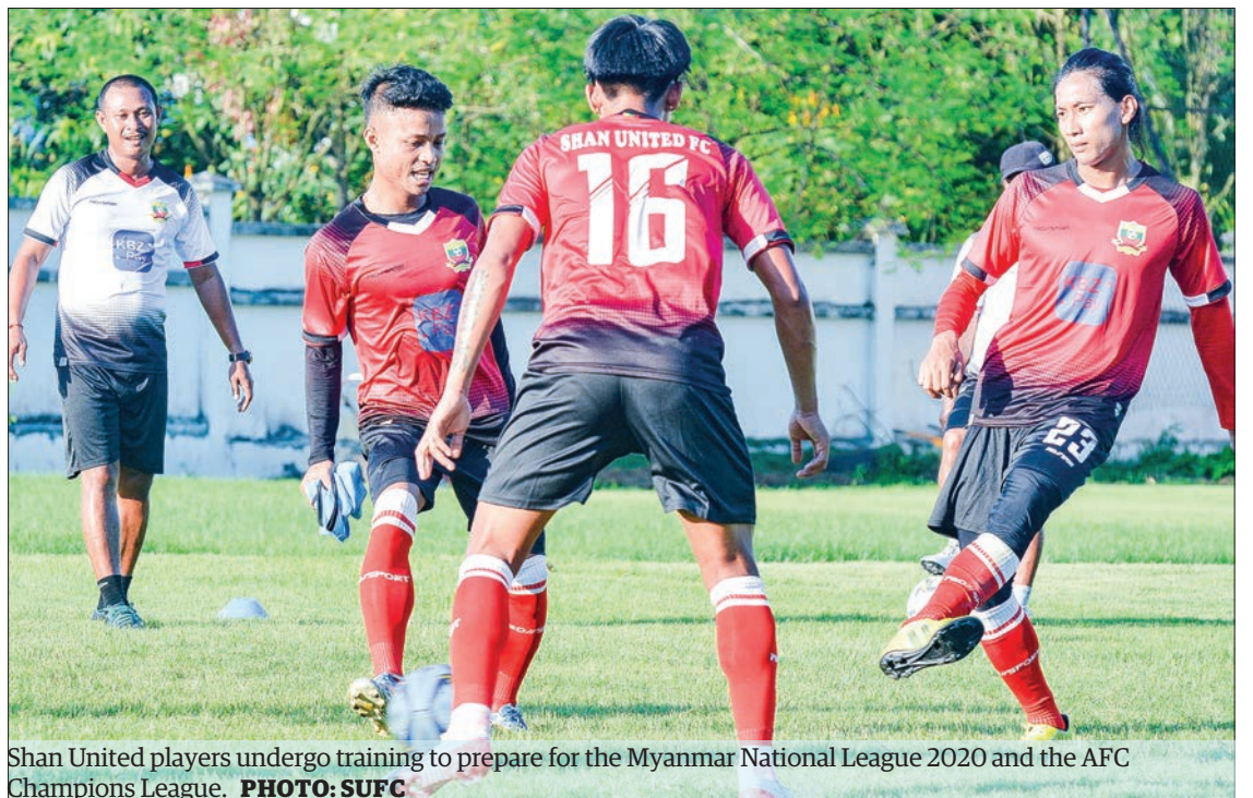
Shan United players undergo training to prepare for the Myanmar National League 2020 and the AFC Champions League.

In 2020, Shan United is slated to compete in two international tournaments — AFC Champions League and the AFC Cup 2020. The team will also compete in a domestic competition — the General Aung San Shield 2020.—Lynn Thit (Tgi)