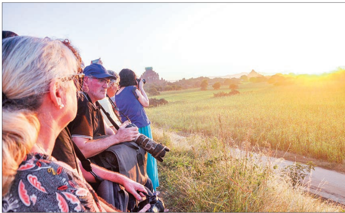
Tourists visit Bagan to catch the glimpse of historical temples in the backdrop of sunset.

"Starting from the first week of November, tourists are increasingly thronging to Bagan, a famous tourist destination in Myanmar, and they are mostly visiting in the high season. They like to enjoy Bagan's sunset views. Most of them are Chinese,