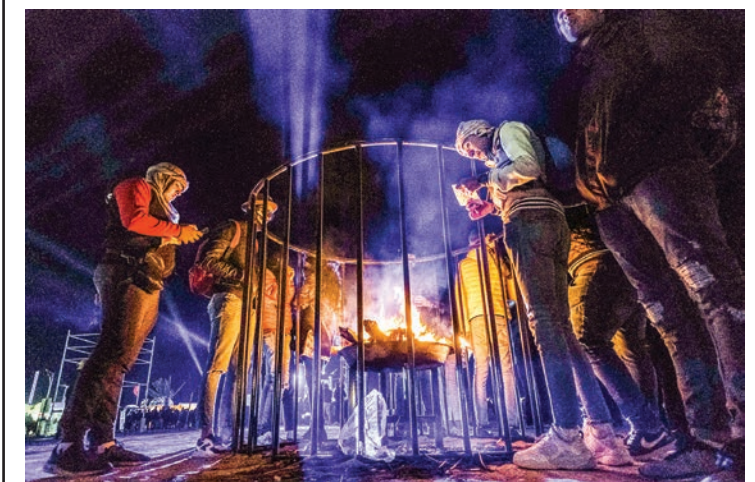
People dance at the electronic music festival “Les Dunes Electroniques” at Ong Jmel, near the town of Nefta in western Tunisia on 16 November 2019, where the original Star Wars film was shot.

It is organised by a Franco-Tunisian hotelier with backing from the Tunisian tourism ministry. This year the festival — named “Les Dunes Electroniques” — has drawn around 20 musicians, including award-winning Swiss-Chilean DJ Luciano.—AFP ■