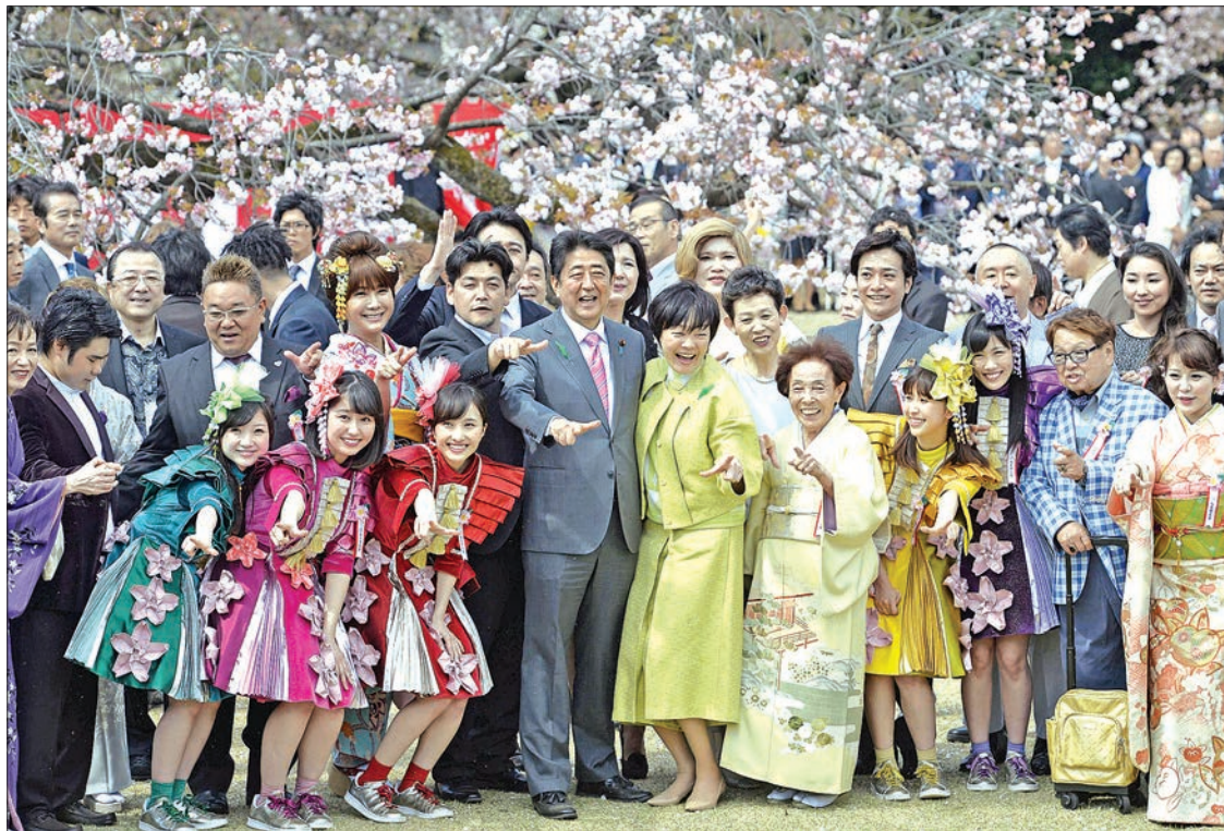
A cherry blossom-viewing party hosted by Prime Minister Shinzo Abe at Shinjuku Gyoen National Garden in Tokyo in April 2017.

He added the cancellation of the event next April was Abe’s own decision. Held at a Tokyo park famous for its cherry blossoms,