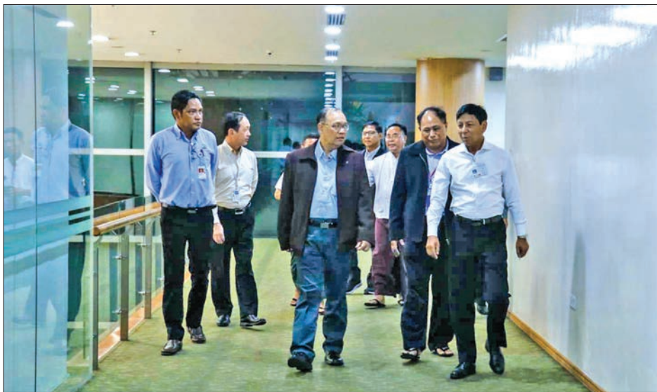
Union Minister U Thant Sin Maung seen off by officials at Yangon International Airport before departs for Viet Nam.

The meetings will be held from 14 to 15 November.—MNA (Translated by GNLM)