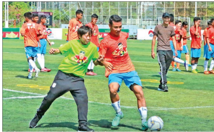
Youths take part in the Community Champion Football Clinic yesterday on the artificial turf of the National Football Academy in Yangon.

A Community Champion Football Clinic — a sports program that provides information about the harmful effects of drugs and aims to combat drug use by promoting football — was held yesterday on the turf of the National Football Academy in Yangon.