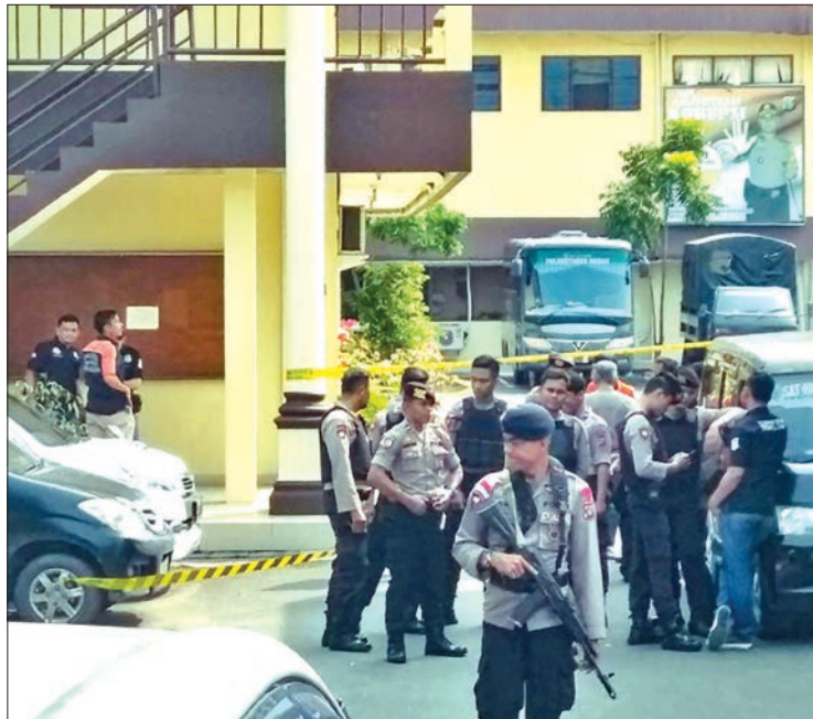
Indonesian police at their headquarters in Medan after the suspected suicide attack.

Police said the attacker was active on social media, while CCTV footage showed him entering the compound wearing a uniform worn by drivers of a popular ride-hailing service. —AFP ■