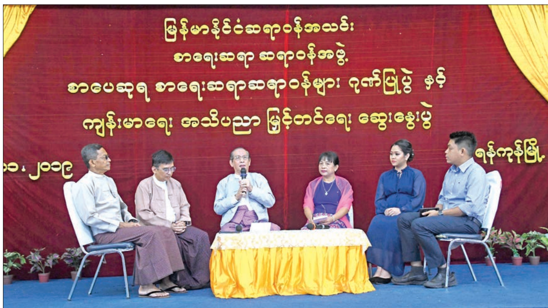
The roundtable discussion for health promotion held at the Myanmar Medical Association, Yangon, yesterday.

THE Writer's Society of Myanmar Medical Association (MMA) held a ceremony to honour