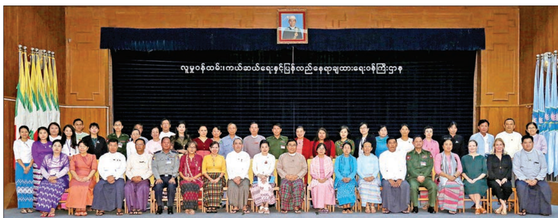
Union Minister Dr Win Myat Aye poses for a photo with attendees at the meeting in Nay Pyi Taw.

formed the National Committee with the five assignments to draft the action plan for implementing