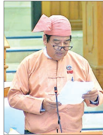
MP Dr Sein Mya Lay.