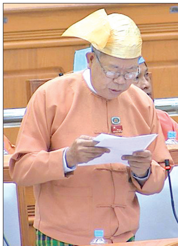
MP U Kyaw Thung.

The MP then discussed the 15/2019 Report on the findings and recommendations of the Joint Public Accounts Committee on in the implementation of construction projects with the funds of 2018-2019 fiscal year for the Basic Education Department under the Ministry of Education.