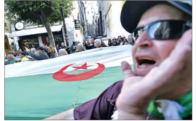
The draft law on Algeria's energy sector has been added to protesters' list of grievances with the ruling class.