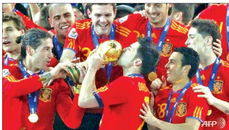
Finest hour: David Villa kisses the World Cup after Spain's victory in 2010.

However, Kerr — the all-time leading scorer in the Australian and American leagues — said she felt Chelsea were a team that had laid a solid base for winning silverware.—AFP ■