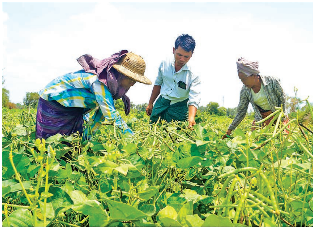
Farmers harvesting green peas in a farm.

MYANMAR’S exports of agricultural products between 1 October and 1 November in the current fiscal year crossed US$264.47 million from $204.7 million in the corresponding period of the 2018-2019FY, which is an increase of $59.749 million, according to trade figures released by the Ministry of Commerce.