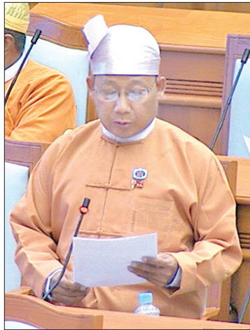
MP Dr Hla Moe.

The Hluttaw agreed to discuss the emergency motion tabled by Pyithu Hluttaw MP Dr Hla Moe from Aungmyethazan constituency for the unconditional and immediate release of these hostages.