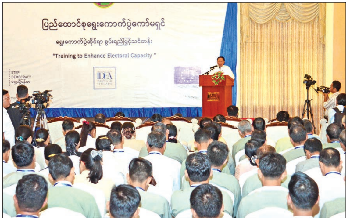
Union Election Commission Chairman U Hla Thein addresses the opening ceremony of the “Training to Enhance Electoral Capacity” for the 2020 General Election in Nay Pyi Taw yesterday.

U Hla Thein also urged the trainees to systematically learn