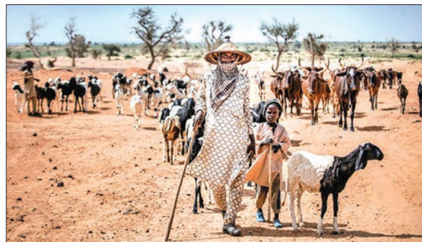
Dairy farmers in arid portions of West Africa are nomadic, making developing business to fully meet demand difficult.

SAINT-DIERY (France) — There is little that farmers in the Sahel need to know about the art of survival.