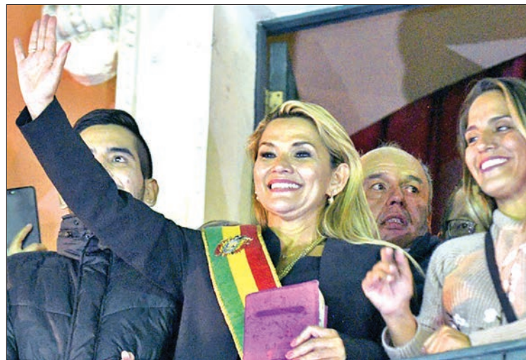
Jeanine Anez vowed to ‘pacify’ Bolivia after weeks of protest.

lead the country out of its crisis, sparked by claims that Morales rigged his re-election last month. “According to constitutional order, it is my role to take up this challenge with the sole aim of calling new elections,” she said in televised comments.—AFP ■