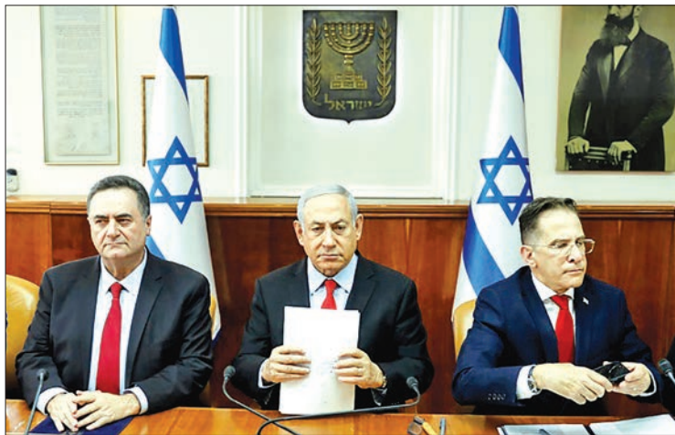
Flanked by cabinet members, Israeli Prime Minister Benjamin Netanyahu warns Palestinian militant group Islamic Jihad it will have to “absorb more and more blows” if it keeps up its rocket fire into Israel.

Israel said the commander was responsible for rocket fire