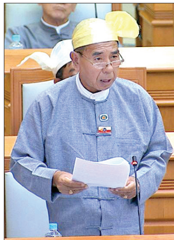
MP U Kyaw Shwe. PHOTO: MNA