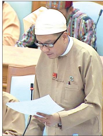
MP Dr Myat Nyana Soe.