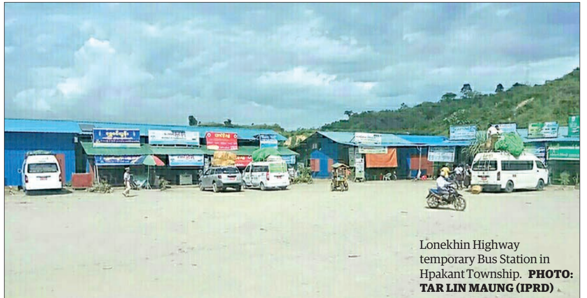
Lonexhin Highway temporary Bus Station in Hpakant Township.

“Illegal transportation services are a big concern for us. The fare is set at K3,000 for particular trips, but illegal operators are charging lower fares to get passengers from us. They are hurting us tax