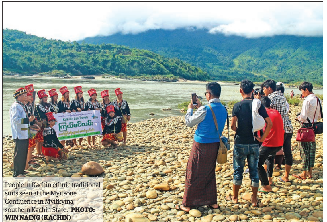
People in Kachin ethnic traditional suits seen at the Myitstone Confluence in Myitkyina, southern Kachin State.

There is smooth transportation with concrete roads