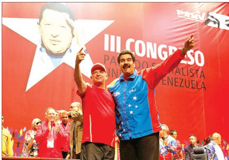
Hugo Carvajal, left, served as military intelligence chief under the late Venezuelan leader Hugo Chavez.

If convicted, Carvajal could face between 10 years and life in prison, the US Justice Department said in April following his arrest. Carvajal has denied any “links to drug trafficking and the FARC”, Spanish judicial sources said at the time.—AFP ■