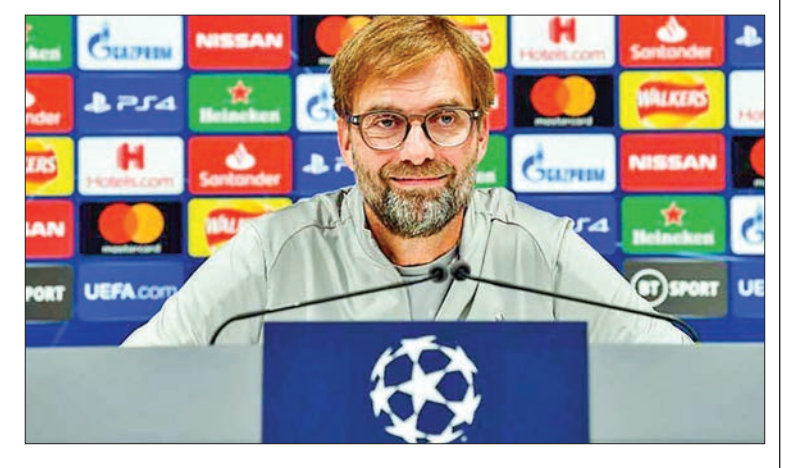
Liverpool's German manager Jurgen Klopp attends a press conference at Anfield stadium.