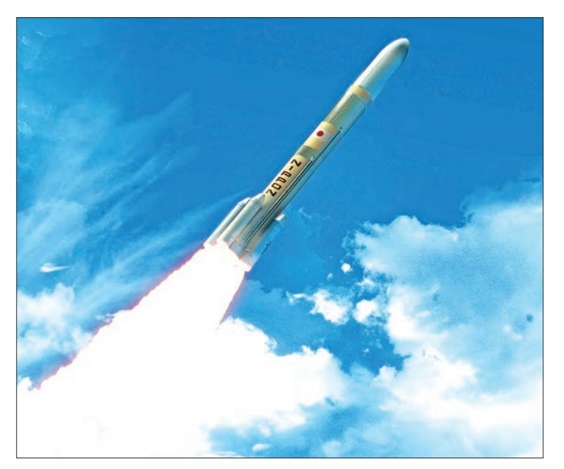
Image of an upgraded version of Japan's mainstay next-generation H-3 rocket.

"It will be cheaper to launch a rocket twice than develop a new rocket," he said. In order to cover the cost of operating the more powerful H-3 rocket, "It is necessary to increase demand for large rockets in the country," Sasaki said. The 63-metre long