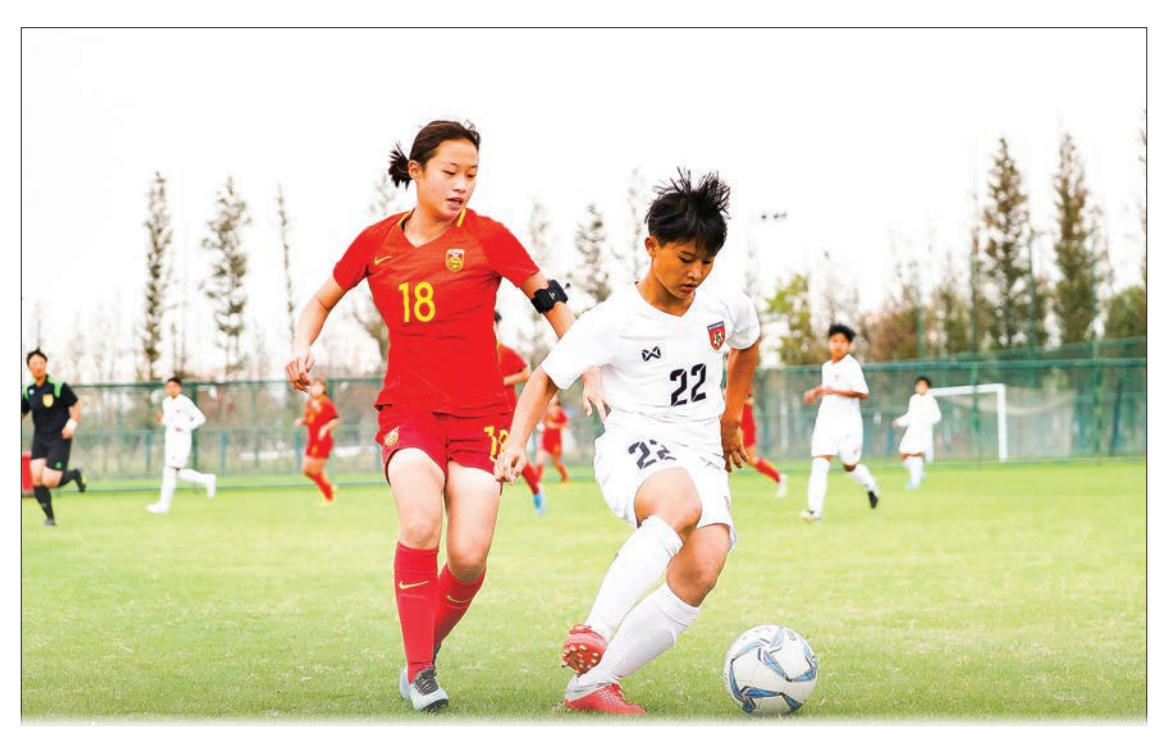
A Myanmar footballer (white) tries to block a China Women's Youth Selection team player (red) during a friendly match yesterday in Suzhou, China.

THE Myanmar women's national football team beat China Women's Youth Selection team by 4-0 in a friendly match yesterday afternoon at Suzhou, Jiangsu Province, China.