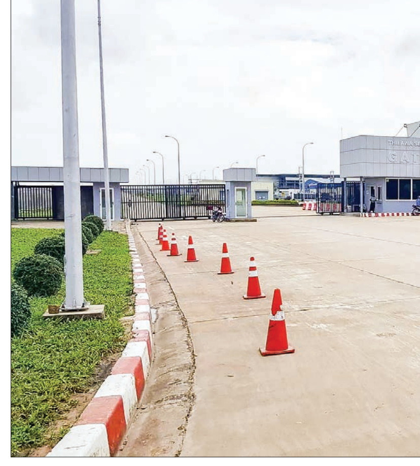
Thilawa SEZ Zone A Gate 2.

A new four-lane tarred road from Thanlyan Bridge to Thilawa SEZ and the Bago River crossing bridge (Thanlyan Bridge No-3) are being built with the Official