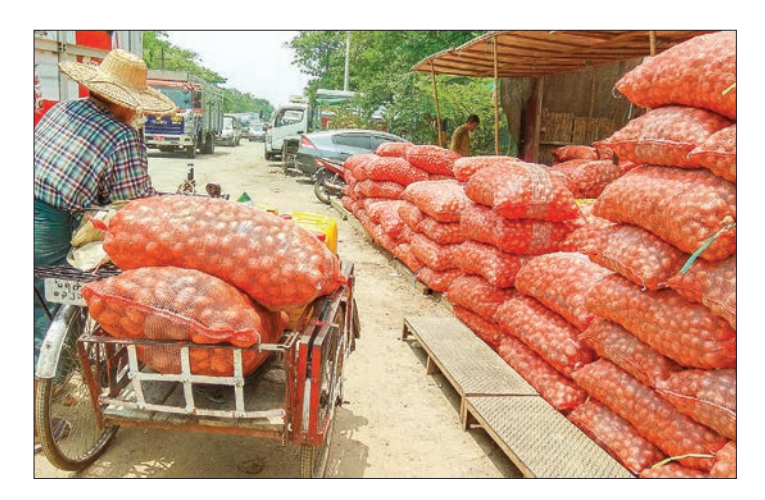
Red onions for sale at the market in Yangon.