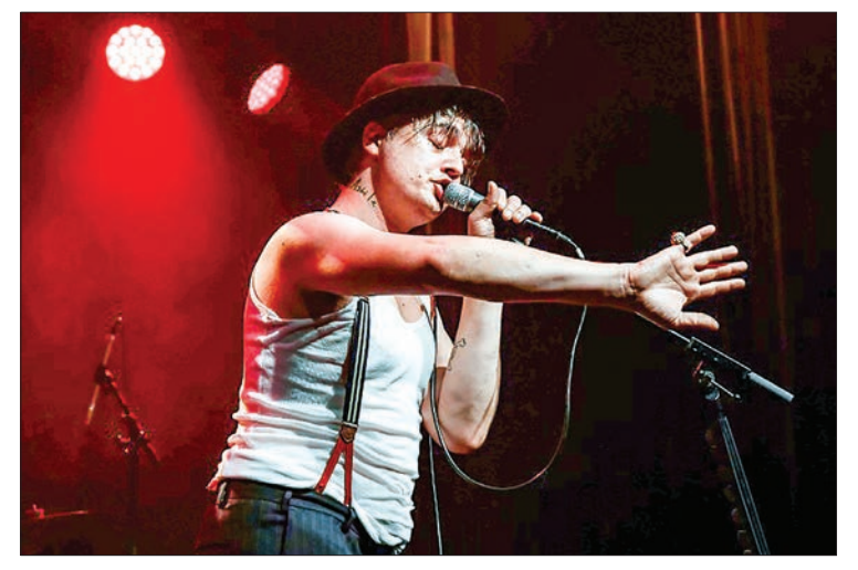
Doherty has a long history of drug and alcohol abuse.

After being released Saturday from custody following an