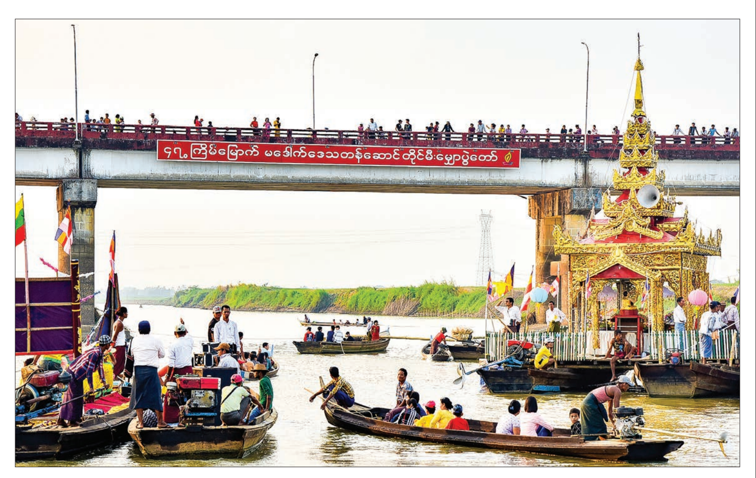
Local people seen on boats to float paper lamps along the Sittoung River during light festival in Madauk.

WITH rains brought on by cyclonic storm 'Bulbul' letting up, thousands of locals and visitors gathered yesterday for the annual festival of traditional boat rowing and dances and floating of lamps on the Sittoung River in Madauk, Bago Region.