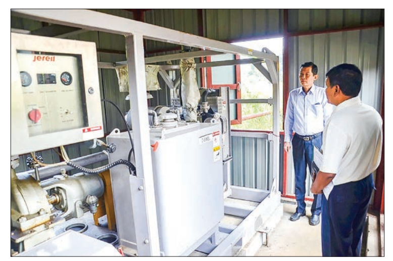
Deputy Minister Dr Tun Naing inspects petroleum product storage and distribution division of Myanma Petroleum Product Enterprise in Thaton.