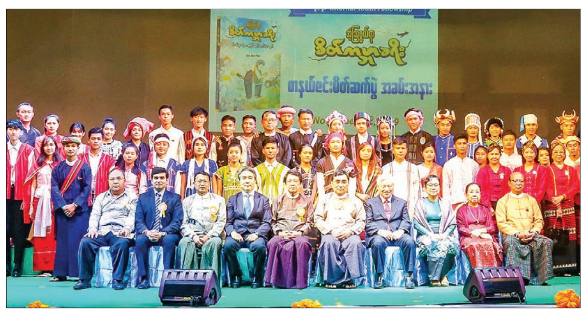
Union Minister Dr Win Myat Aye and attendees pose for a photo at the ethnic youth conference organized by the Internal Youth Fellowship (Myanmar) in Yangon, yesterday.