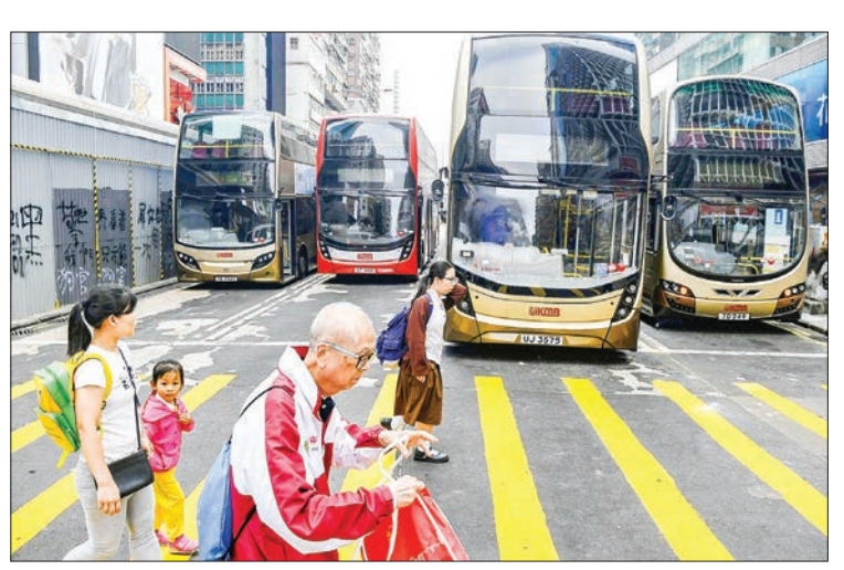
Buses are stranded on a road in Hong Kong on Nov. 12, 2019, after getting flat tires during the previous day's clash between police and protesters.

Demonstrators occupied road junctions, threw objects into railway tracks and disrupted