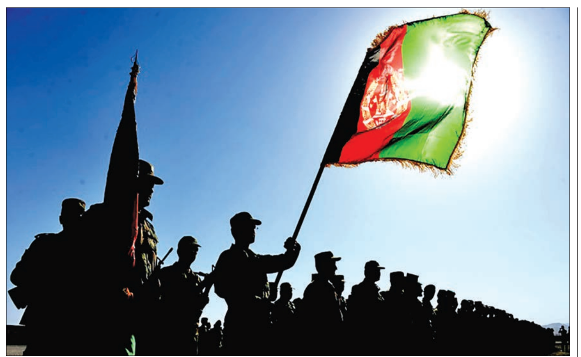
Afghan President Ashraf Ghani said the prisoner release would 'pave the way' for unofficial talks with the Talihan

12 ASIA 13 NOVEMBER 2019 THE GLOBAL NEW LIGHT OF MYANMAR