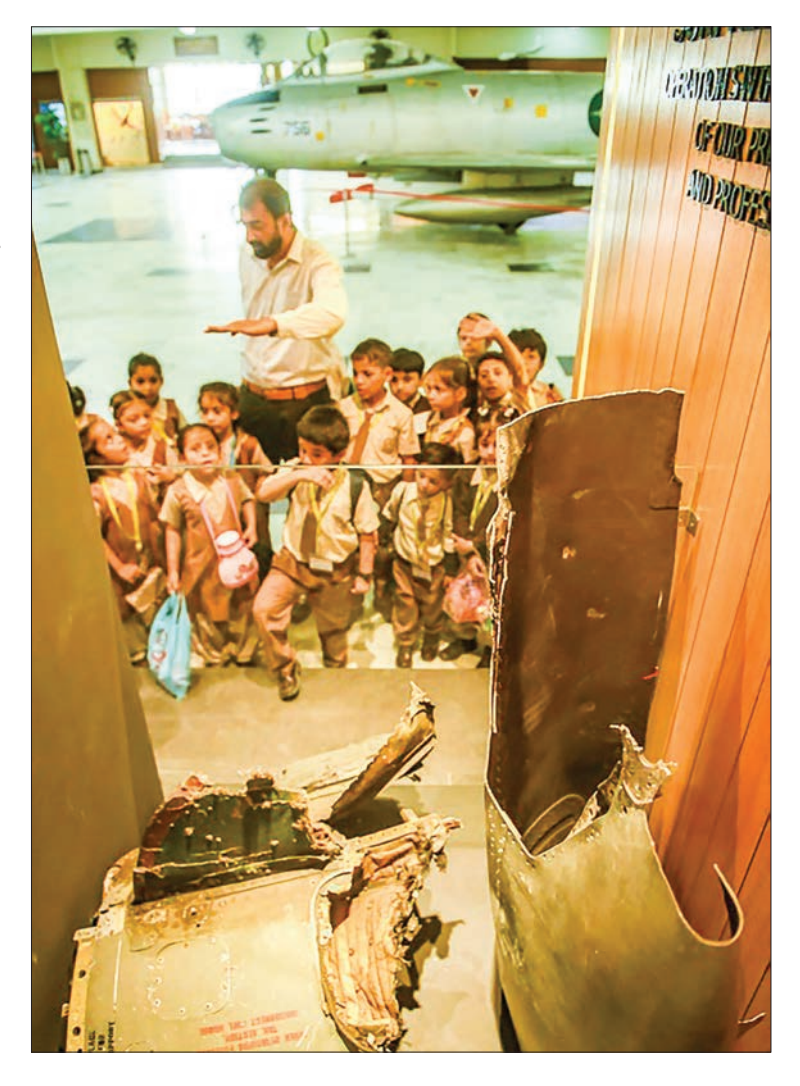
Pakistan students look at parts of the wreckage of an Indian Mig-21 being flown by Indian pilot, Abhinandan Varthaman when he was shot down over Kashmir.

The exhibit includes what Pakistan says are parts of the fuselage and tail of Varthaman's