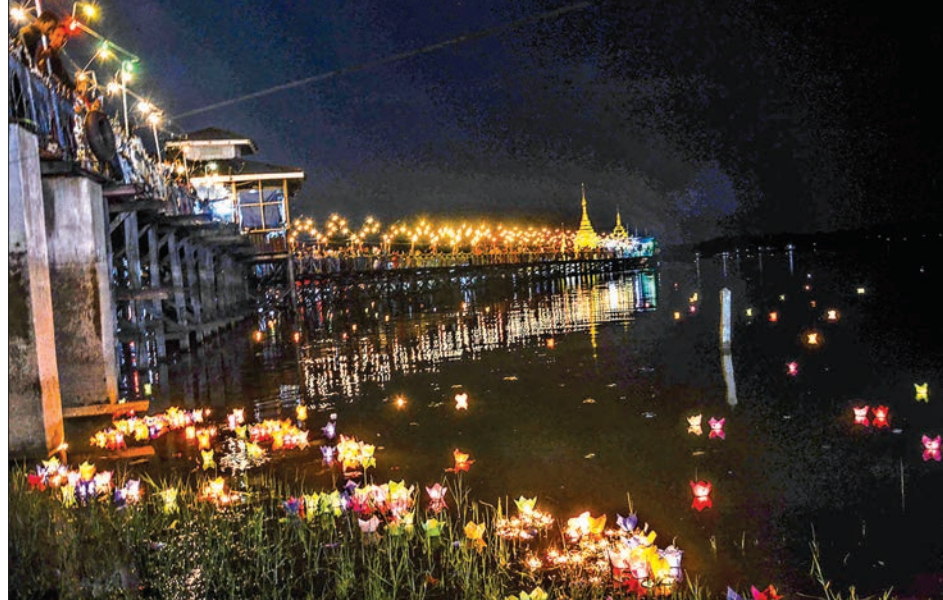
Local people celebrate light festival with lotus lamps at Andaku Mogaung Yele Pagoda in Meiktila from 10 November to 12 November.

27<sup>th</sup> Tazaungdine lamp on lotus festival of Andaku Mogaung Yele Pagoda in Meiktila was held for three days from 10 November (14<sup>th</sup> Waxing of Tazaungmon) to 12 November (1<sup>st</sup> Waning of