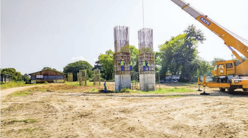
Union Minister U Han Zaw inspects the construction project site of Ayeyawady Bridge (Thayet-Aunglan) in Magway Region.

et-Aunglan) was in Thayet District Magway Region and connects Aunglan Town on the east bank of the river with Thayet Town on the west bank of the river. The bridge has a