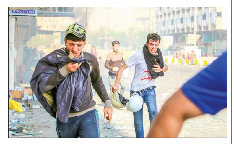
A lack of jobs is a key driving force behind the popular anger, with demonstrators accusing the government — the country's biggest employer by far — of handing out jobs based on bribes or nepotism.

They were bolstered by a meeting Monday between the UN's top Iraq official Jeanine Hennis-Plasschaert and senior Shiite cleric Grand Ayatollah Ali Sistani.— AFP