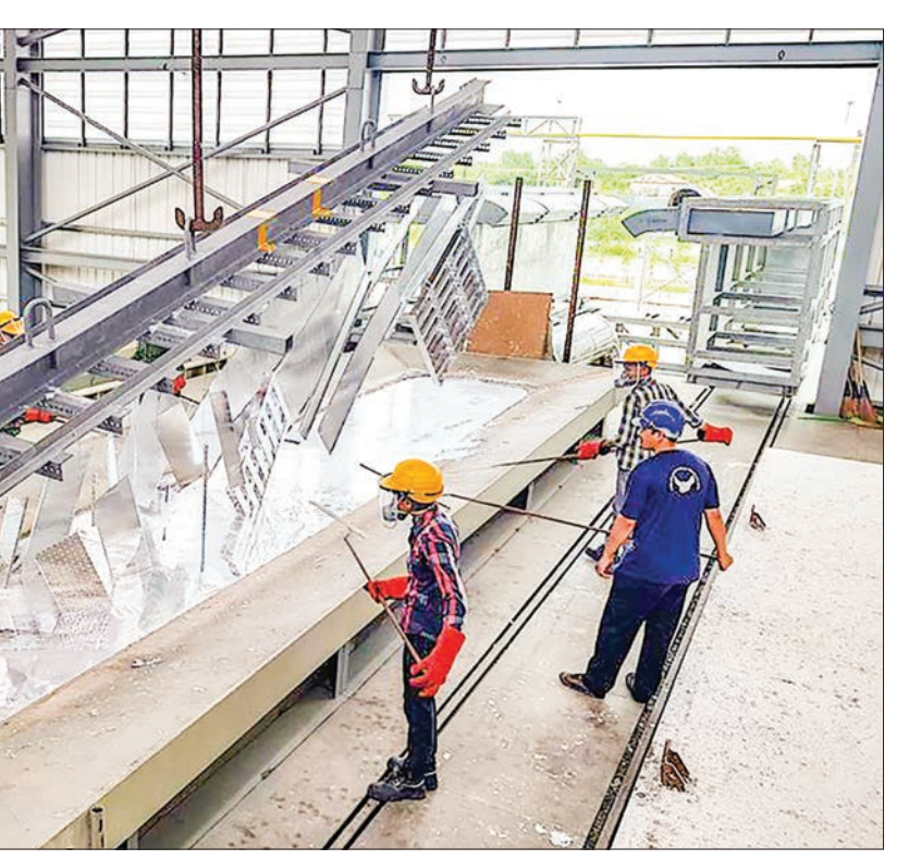
Hot-dip galvanization is a form of galvanization. It is the process of coating iron and steel with zinc, which alloys with the surface of the base metal when immersing the metal in a bath of molten zinc at a temperature of around 840 °F (449 °C).