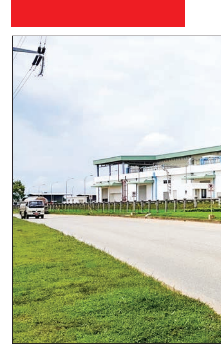
Yakult factory which is located at Thilawa Special Economic Zone's Zone A . PHOTO: YE HTUT TIN (NLM)