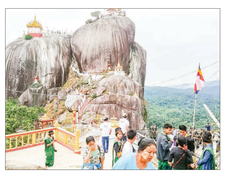
Visitors seen with the beautiful scene of Zalon Mountain in Sagaing Region.