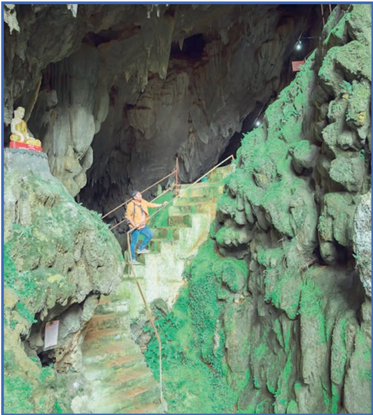
Kaungdaw natural cave.

There were many more places of interests near Pinlaung