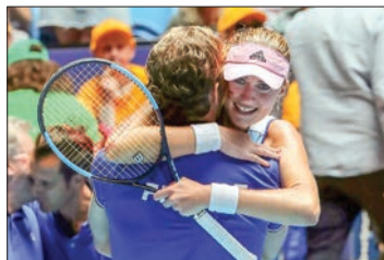
Kristina Mladenovic of France celebrates her victory against Ashleigh Barty of Australia with team's captain Julien Benneteau during the third rubber of the Fed Cup tennis final match between Australia and France in Perth on November 10, 2019.

the planet right now, I'm so proud of my girls and my team.—AFP ■