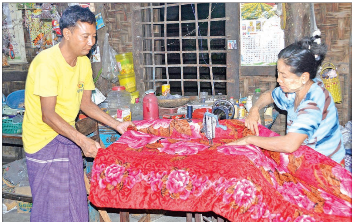
Workers make the mattress in Monywa, Sagaing Region.

There are 1,500 houses in Monywa village and 700 houses in Kyemon village. About 75 per cent of the households are mainly involved in mattress and bedding production.