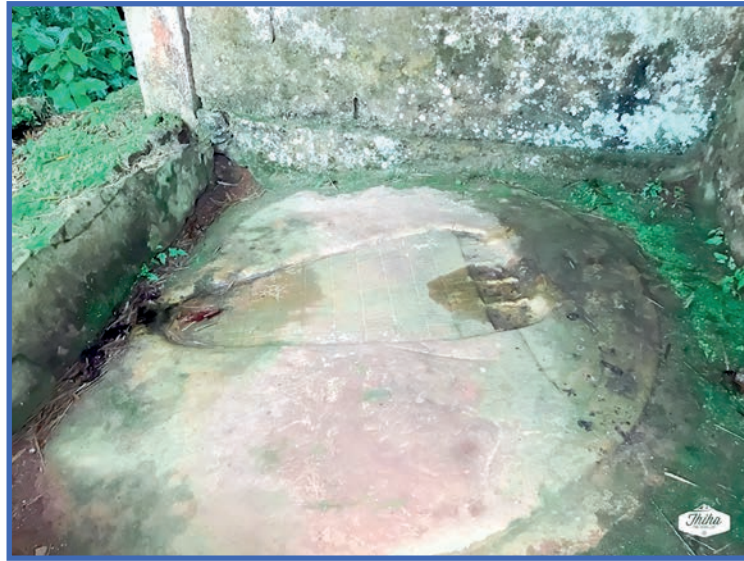
Footprint of King Kyansittha.

least would be a very attractive souvenir for any visitors be they locals or foreigners.