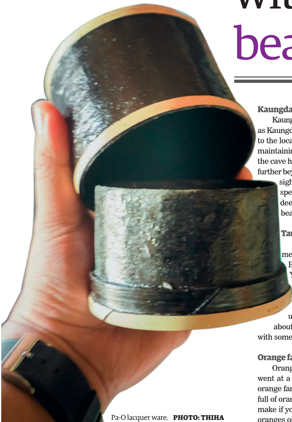
Pa-O lacquer ware.

Oranges from Pinlaung were good. Even though we went at a time when it was not available, we visited an orange farm. During winter time, the orange tree will be full of oranges. A visit to an orange farm is one you must make if you ever made it to Pinlaung whether there are oranges or not.