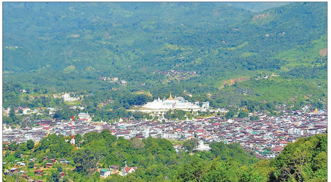
Photo shows the panoramic view of Mogok which is also known as Ruby Land.

Mogok in October, and the number of visitors is rising month by month. The tourists arrived in the region via Mandalay. To develop tourism in the region, the authorities in February gave the green light to foreigners visiting three more villages — Kyaukp-yathet, Panling, and Bernard.