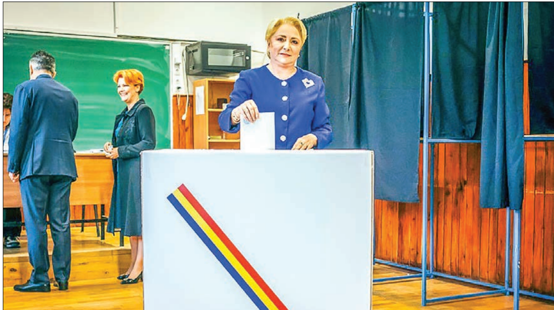
Former prime minister and presidential candidate Viorica Dancila casts her ballot.

BUCHAREST—Romania voted in the first round of a presidential election on Sunday, with pro-European incumbent Klaus Iohannis the favourite to win, potentially adding to a liberal fightback against the region's prevailing nationalism.