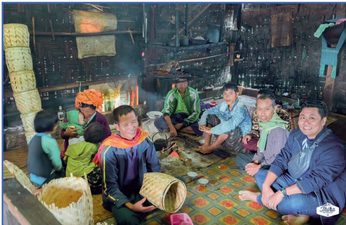
People sitting around the fire.