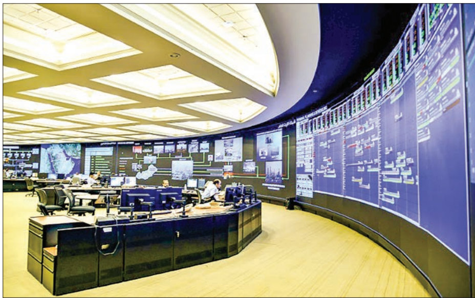
In recent years Saudi Aramco, the world's most profitable company, increased spending on research and development as most of its competitors scaled back.

"Aramco has never had to answer to investors