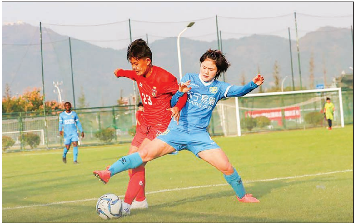
In the second half, the Myanmar National Women's Team was again forced to play but failed to score.

The Myanmar Women's National Team will be training in China until November 15, and plans to play two more matches with the China Women's Youth National. — Lynn Thit (Tgi)