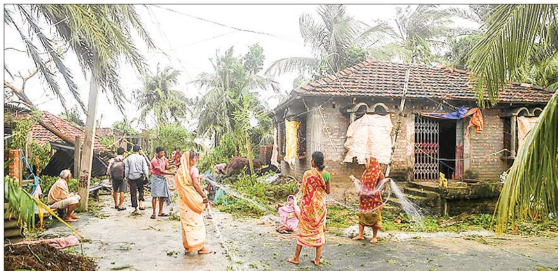
Villagers gather in front of a collapsed house after Cyclone Bulbul hit the area in Bakkhali, Bangladesh, on November 10, 2019.

Three people were killed in India's West Bengal state, two after uprooted trees fell on their homes and another after being struck by the falling branches of a tree in Kolkata. A fourth person died in a wall collapse in nearby Odisha state.