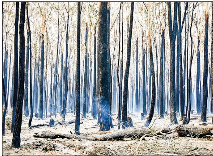
In Old Bar, hectares of bushland had turned charcoal and small pockets of flames continued to smoulder.

It is the first time Sydney has been warned of a “catastrophic” fire danger, the highest possible level, since the grading system was introduced