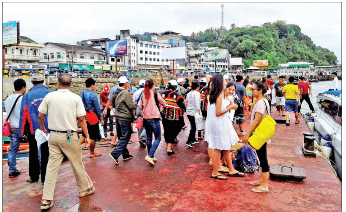
Visitors seen at the Kawthoung Myoma Jetty during the Tazaungmone holidays.

There are 30 untouched islands featured in the archipelago trips in Kawthoung District.