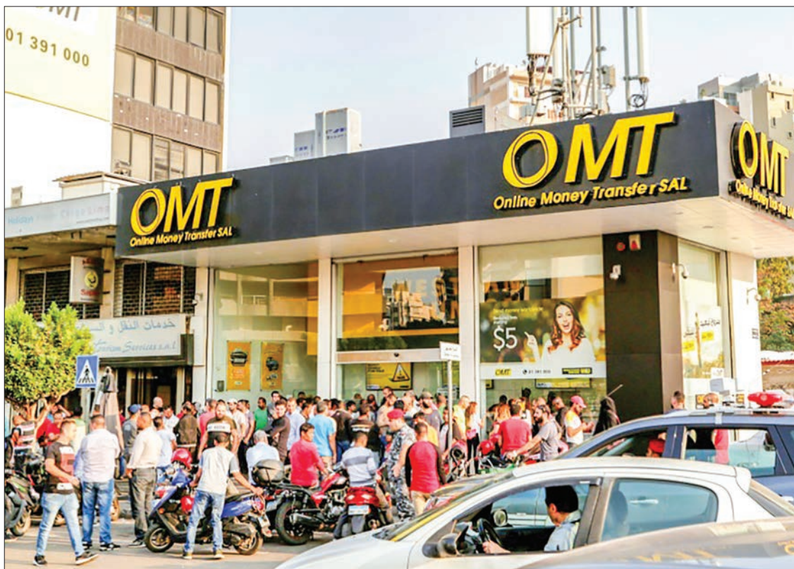
A big queue formed outside this money transfer shop in Beirut.

BEIRUT — A rationing of dollars by banks in protest-hit Lebanon sparked growing alarm on Saturday as some petrol pumps ran dry and grocery stores hiked prices.