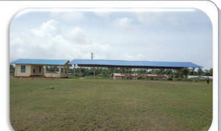
Construction of Passenger Terminal at Sittwe Railway Station