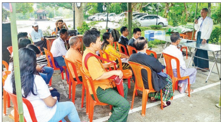
The second day of 5th Irrawaddy Literary Festival held in Mandalay yesterday.

More than a hundred literary enthusiasts from across Myanmar and over 30 international literates are attended the Irrawaddy Literary Festival, which will hold its last day today. —Mahn Sub-printing House (Translated by Zaw Htet Oo) ■