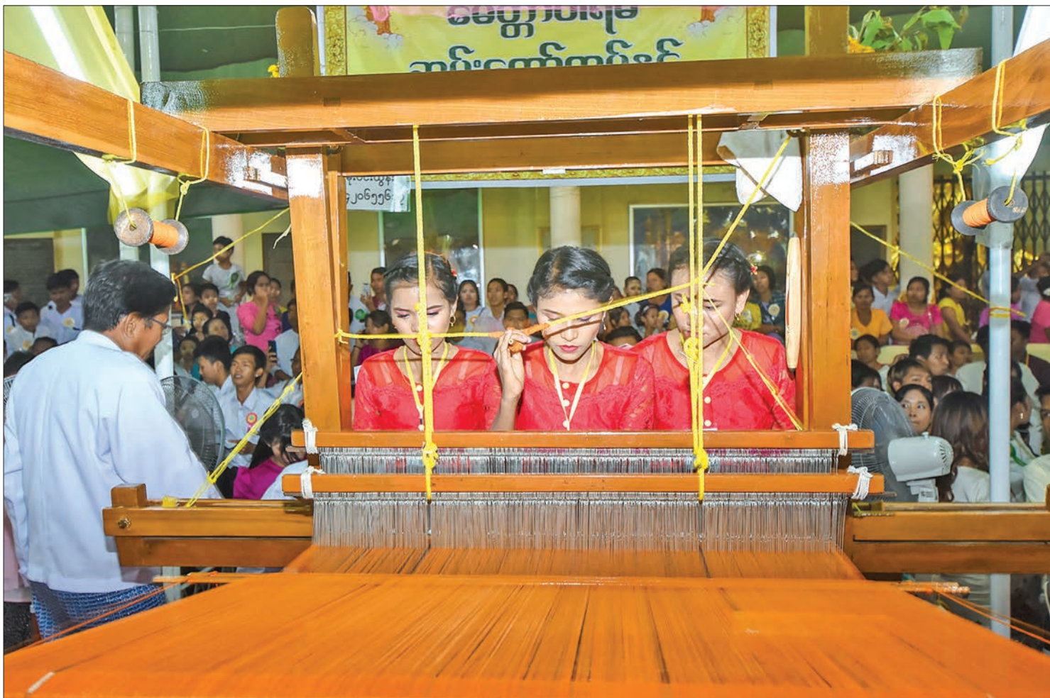
Contestants weaving a robe at the Matho Robe-Weaving Contest at the Shwedagon Pagoda in Yangon yesterday.

T RADITIONAL robe-weaving contests were organized at famous pagodas across the country yesterday, on the eve of the Full Moon Day of Tazaungmon.