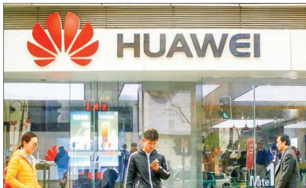
A Huawei store in Shanghai. The company increased phone shipments in China as new models sold briskly.

BEIJING—Huawei took the lead in China's tablet market for the first time due to the popularity of