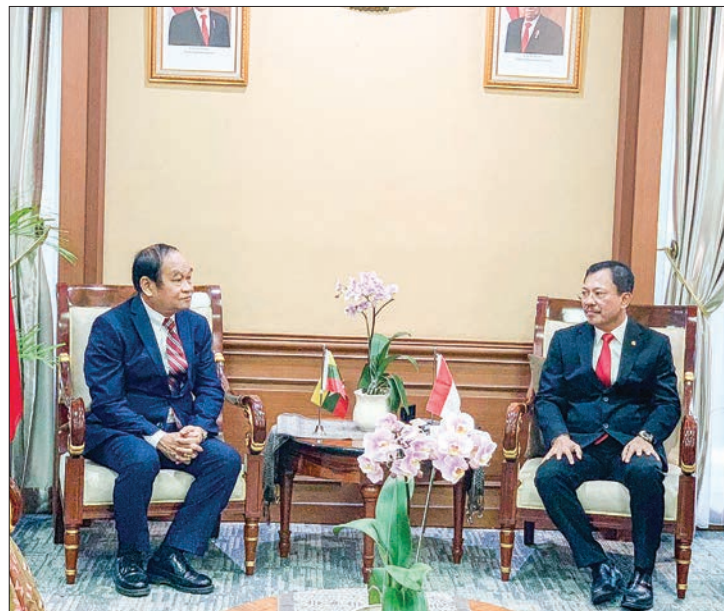
Union Minister Dr Myint Htwe meets with Indonesian Health Minister Dr. Terawan Agus Putranto on 8 November.

From there, the Union Minister participated in the panel discussion of the Health