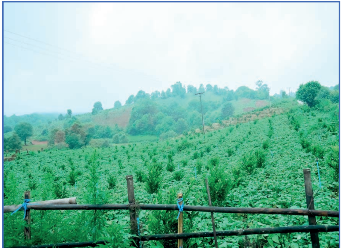
Orange farm.