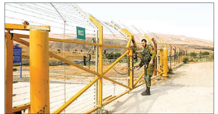
The gate on the Israeli side of the border with Jordan at Naharayim / Baqura was locked on Sunday.

The lands have been privately owned by Israeli entities for decades, but the 1994 deal saw the kingdom retain sovereignty there. Since the heady days of Israel's second peace treaty with an Arab state -- after Egypt -- relations with Amman have been strained. Opinion polls have repeatedly found that the peace treaty with Israel is overwhelmingly opposed by Jordanians, more than half of whom are of Palestinian origin.—AFP ■