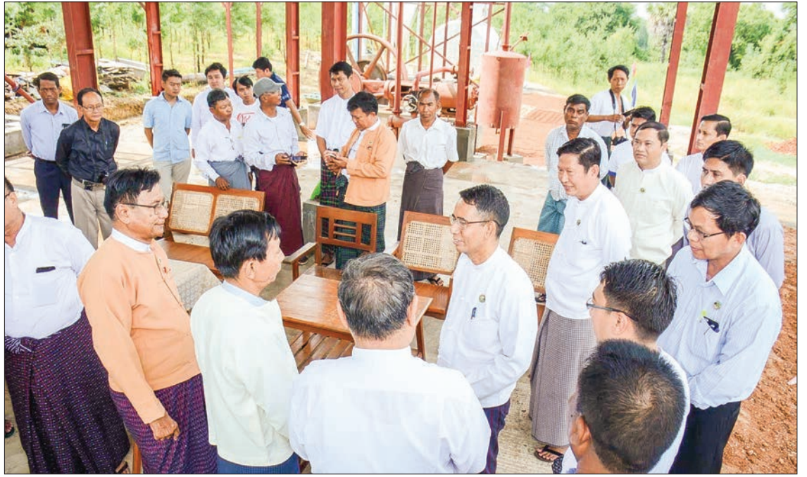
Union Minister Dr Aung Thu meets officials at Shwe Hintha Company's palm powder factory in Yesagyo Township, Magway Region yesterday.

ister handed over 250 packets of veterinary medicine to Regional