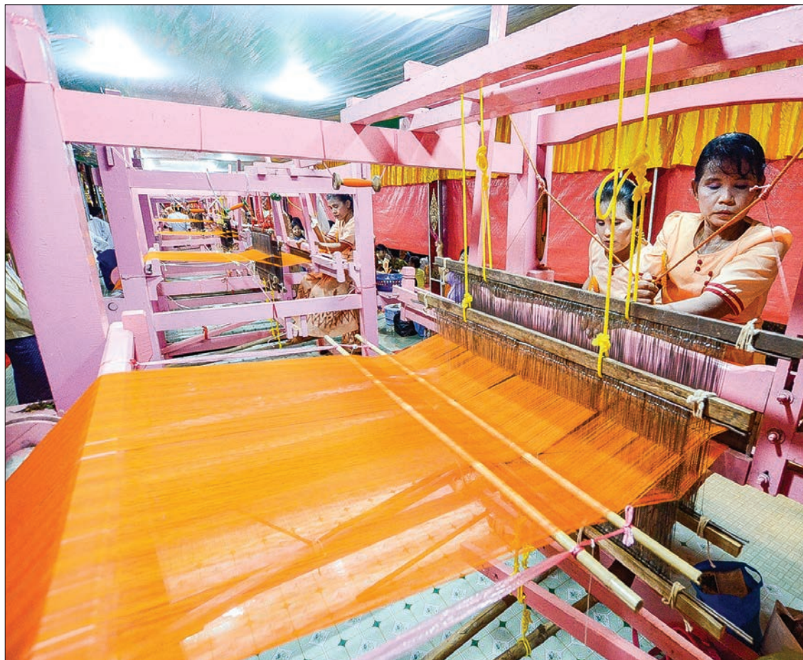
Women weaving of Matho Thingan (robe) at the Botahtaung Pagoda, Yangon yesterday.