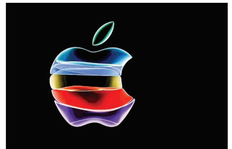
Apple began offering the Apple Card credit card, issued by Goldman Sachs, in March 2019.