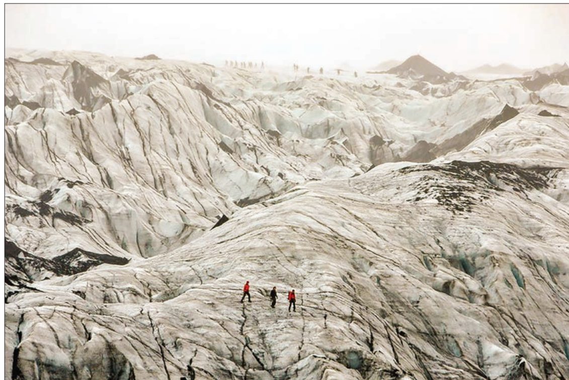
The Solheimajokull glacier has shrunk by an average of 40 metres per year in the past decade.

“When (the first students) started here, you couldn’t see any water. So it (the glacier) was very big at first,” says Lilja.—AFP ■