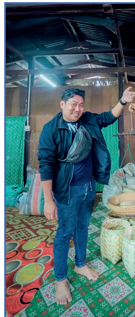
Traditional scale and wicker wares.