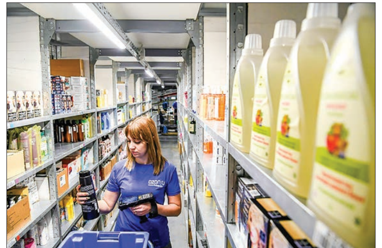
Online retailer Ozon handles over 100,000 packages a day at one of its logistics centres in the town of Tver.