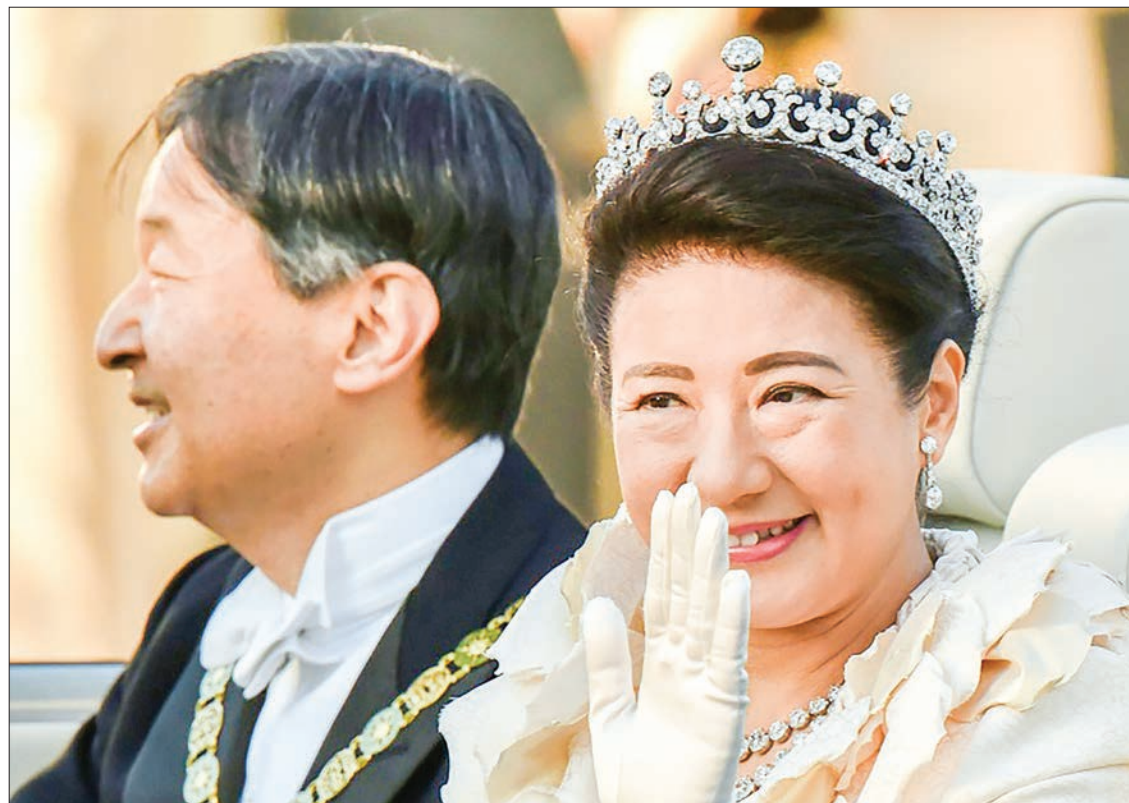
Japan's Emperor Naruhito and Empress Masako wave during their royal parade in Tokyo.

TOKYO—Tens of thousands of flag-waving spectators cheered Japan's new Emperor Naruhito on Sunday during a rare open-top car imperial parade that was rescheduled after a deadly typhoon.