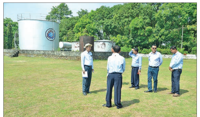
Deputy Minister Dr Tun Naing inspects the storage and distribution sub-department of Myanmar Petroleum Product Enterprise (MPPE) in Mawlamyine, Mon State, yesterday. PHOTO: MNA

Afterwards, the Deputy Minister and entourage visited MPPE's petrol station No. 0862 in Hpa-an, Kayin State, where he gave instructions to ensure private petrol stations serve good quality products, to regulate for illegal sales, and ensure there are no losses prior to the tender process. The Ministry of Electricity and Energy helping SMEs in rural areas develop by issuing licenses to operate rural petrol shops beginning from 4 November.—MNA (Translated by Zaw Htet Oo)