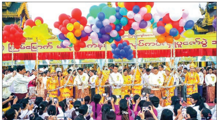
Yangon Region Chief Minister U Phyo Min Thein and members of the board of trustees of the pagoda cut ribbon to open the 35 th Matho robe-weaving contest at Shwedagon Pagoda, Yangon yesterday.