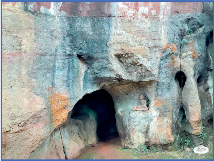
A cave where Kyansittha hid.