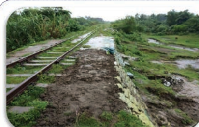
Maintenance of Raised Roadway in Pyitawthar-Yaychanpyin Section of the Road