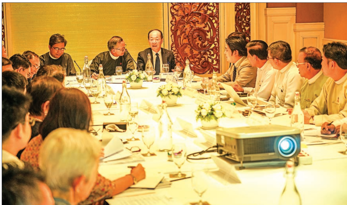
Union Minister for Hotels and Tourism U Ohn Maung attends the coordination meeting to promote Japan market for tourism held in Yangon yesterday.

THE Ministry of Hotel and Tourism organized a coordination meeting to promote the Japan