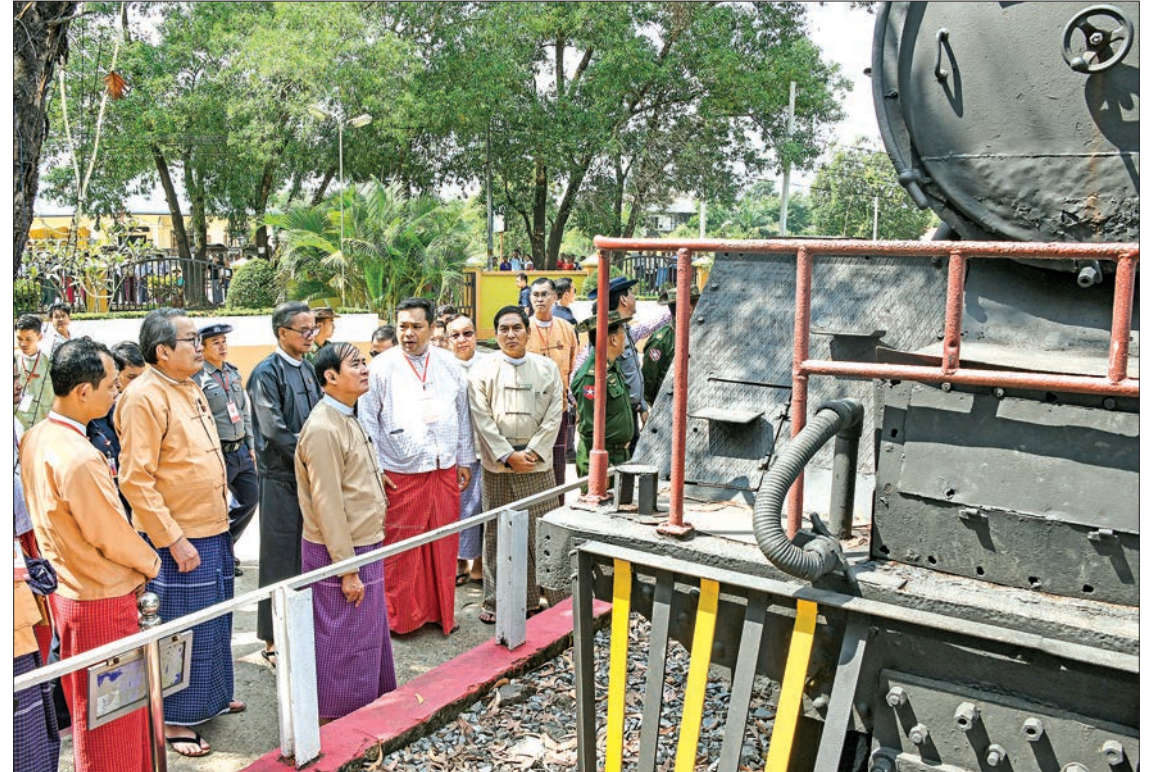
President U Win Myint observes the Japanese-era locomotive at Death Railway Museum in Thanbyuzayat, Mon State yesterday.