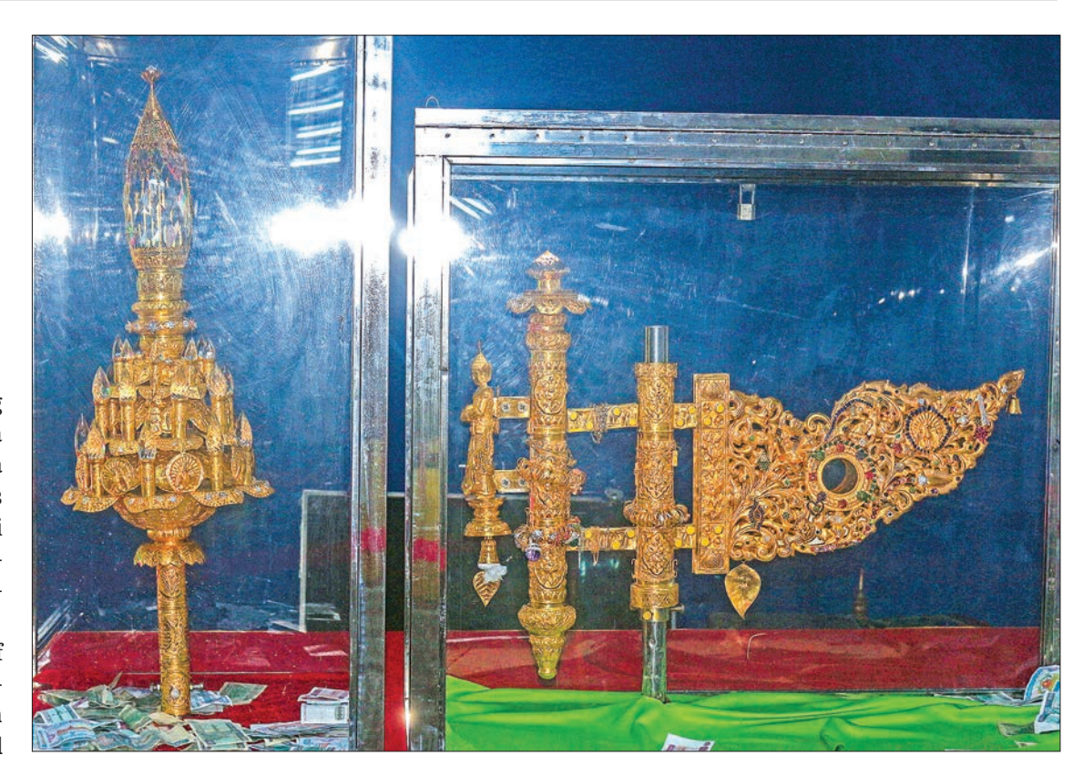
Photo shows the religious objects of the Eternal Peace Pagoda at the Sasana Beikman of the Eternal Peace Pagoda in Nay Pyi Taw.

On the fullmoon day of Tazaungmone, the Golden Umbrella Hoisting and consecration ceremony will be grandly held and broadcast live on MRTV.—MNA (Translated by Kyaw Zin Tun)