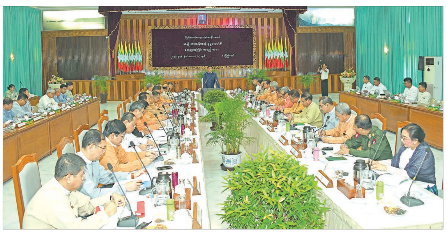
Vice President U Henry Van Thio addresses the fourth meeting of the National Land Use Council in Nay Pyi Taw yesterday.

As a repercussion of climate changes, Myanmar suffered severe weather conditions such as 2008Cyclone Nargis, floods, landslides and excess day temperatures, causing more devastations which impacted on the socioeconomic situation. As a result, Myanmar ranked third in the list of most vulnerable countries and territories in the world from 1998 to 2017.