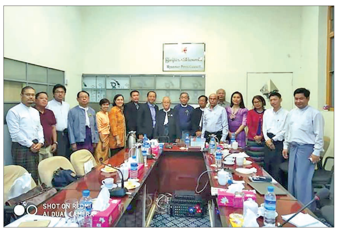
Members of Myanmar Press Council and delegation members of Indonesia Press Council and UNESCO officials pose for a documentary photo at the meeting in Yangon yesterday.