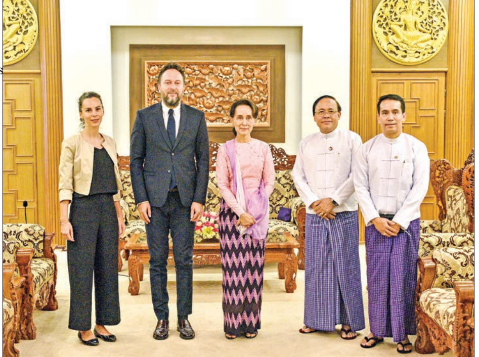
State Counsellor Daw Aung San Suu Kyi and Ambassador of the Republic of Croatia Mr. Kreso Glavac pose for a photo in Nay Pyi Taw on 6 November 2019.