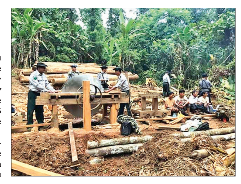
Forest Department officials inspect seized illegal teak logs in Bamauk Township, Katha District, Sagaing Region.