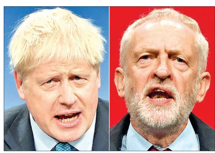
Prime Minister Boris Johnson (I) has compared his rival Jeremy Corbyn (r), leader of the Labour Party, to Stalin as Britain's election campaign formally gets underway.

Johnson is hoping the December 12 poll will help his minority government secure the majority needed to push through his separation terms with Brussels quickly enough for Britain to finally leave by the new deadline of 31 January. But the ruling Conservatives' lead in opinion polls over Labour is similar to the one former prime minister Theresa May all-but wasted in Britain's last election in 2017. Johnson will formally launch the five-week campaign after visiting Queen Elizabeth II in Buckingham Pal-