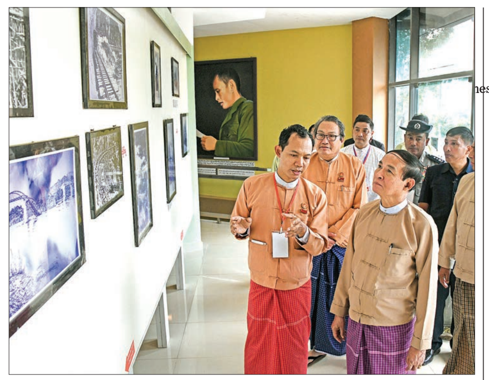
President U Win Myint looks at documentary photos at Death Railway Museum in Thanbyuzayat in Mon State on 6 November 2019.