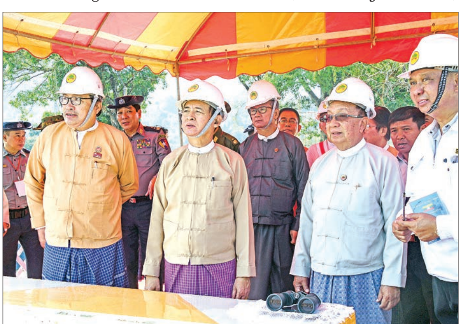
President U Win Myint inspects the upgrading of Attayan (Sabel Gu) Bridge project in Mon State yesterday.