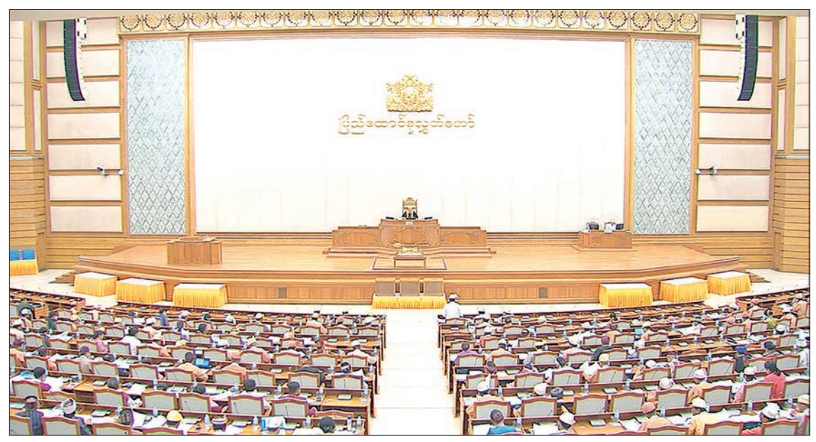
Second Pyidaungsu Hluttaw's 14th regular session is being convened in Nay Pyi Taw yesterday.