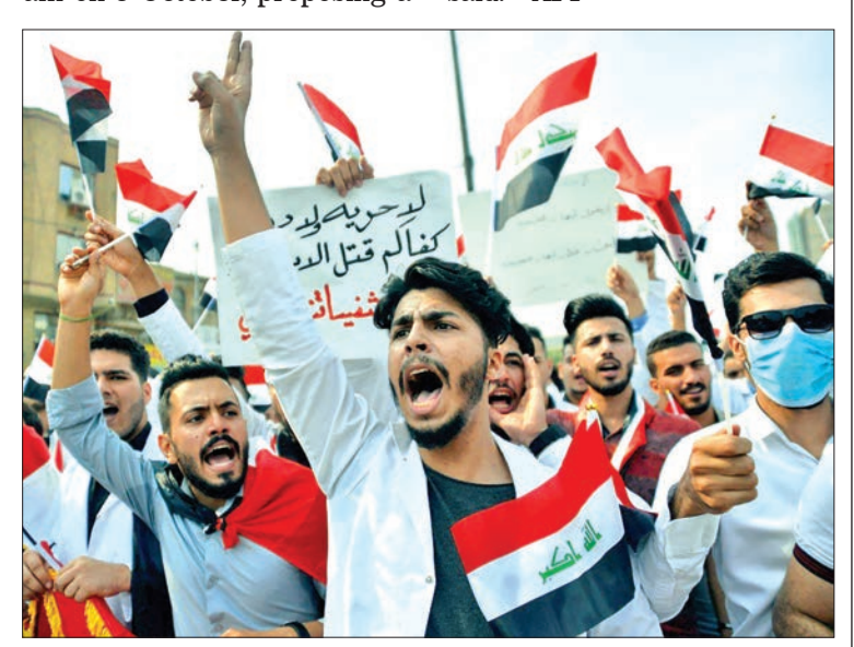
Baghdad and south Iraq have been rocked by a second wave of rallies over government corruption, unemployment and poor services.

"The premier is shackled by the political parties that brought him to power," a second official said.—AFP