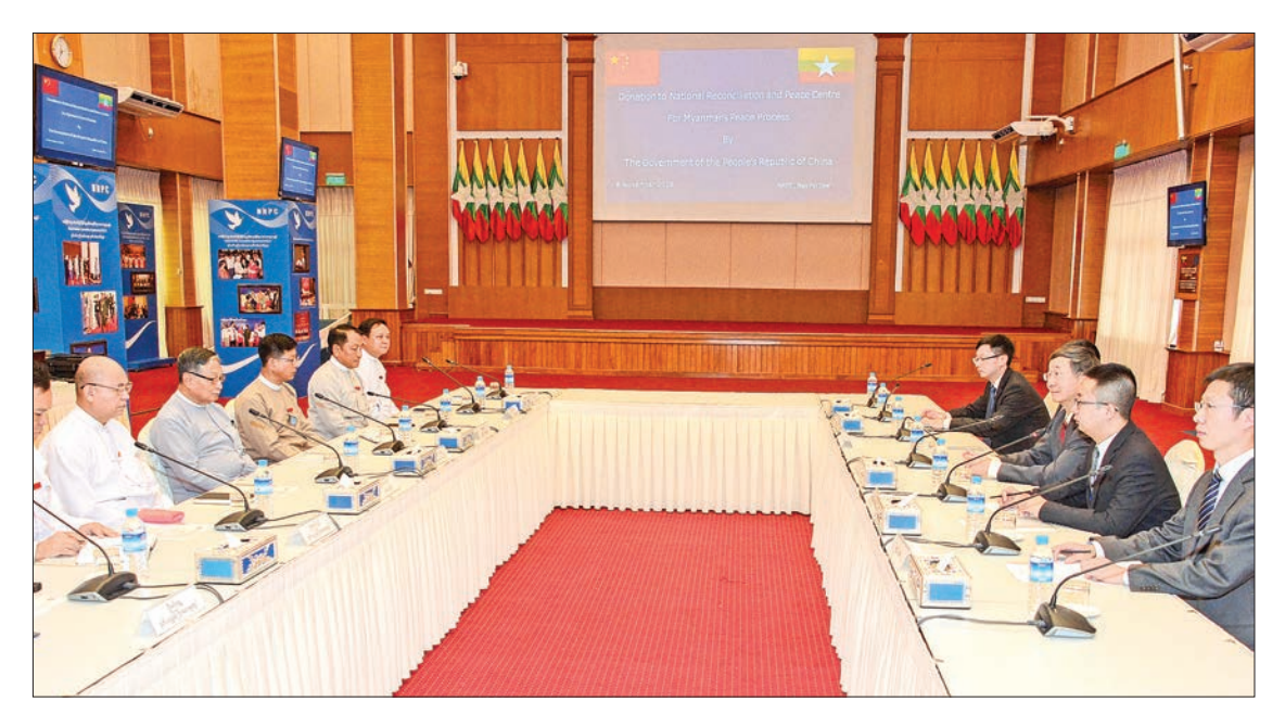
Union Minister for the State Counsellor Office U Kyaw Tint Swe attends the cash donation ceremony for National Reconciliation and Peace Centre by the People's Republic of China in Nay Pyi Taw.