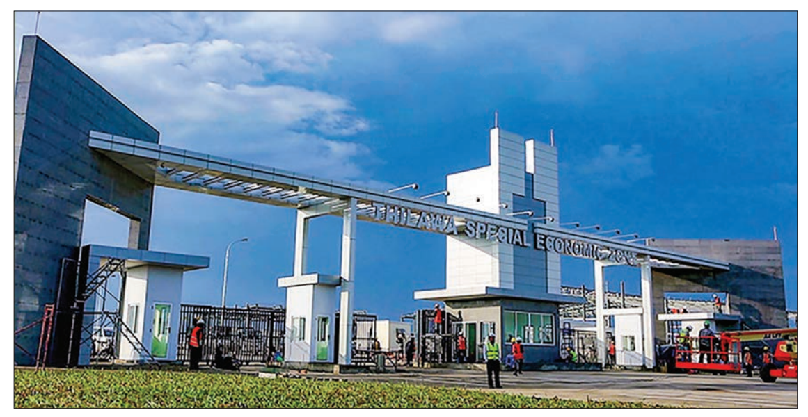
Thilawa Special Economic Zone.

According to a discussion conducted on 30 October, con-