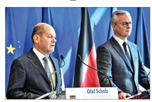
FILE: German Finance Minister Olaf Scholz and French Economy Minister Bruno Le Maire give a press conference following the 50<sup>th</sup> French-German economic and financial council in Paris on 19 September 2019.

"This is no small step for a German finance minister," he added, noting that Britain's looming departure from the European Union has upped the pressure to strengthen its financial sector against competition from the US and China.