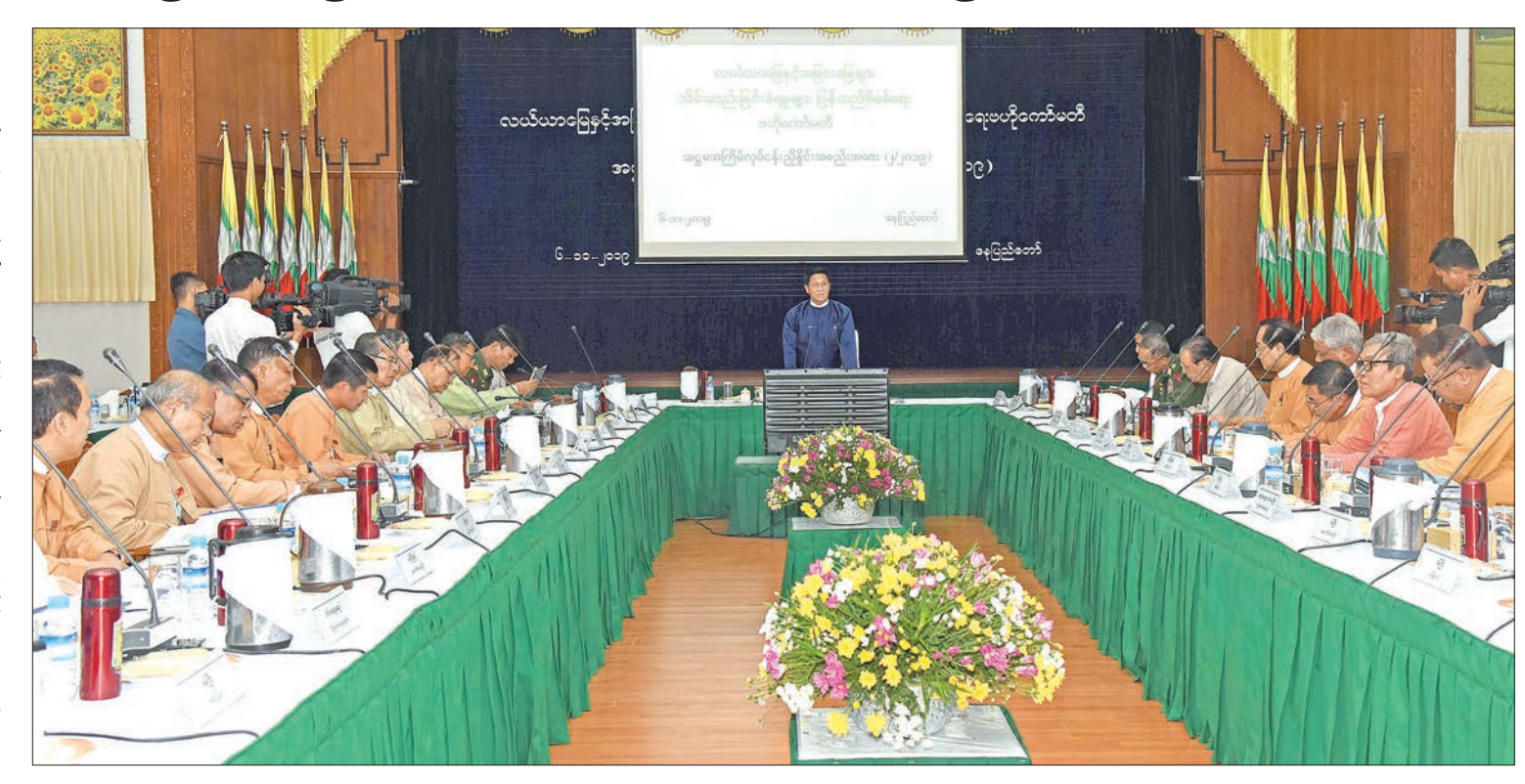
Vice Presdient U Henry Van Thio delivers the speech at the meeting of Central Committee for Scrutinizing Confiscated Farmlands and Other Lands in Nay Pyi Taw yesterday.

The Central Committee was expanded with the forming of its branches for Nay Pyi