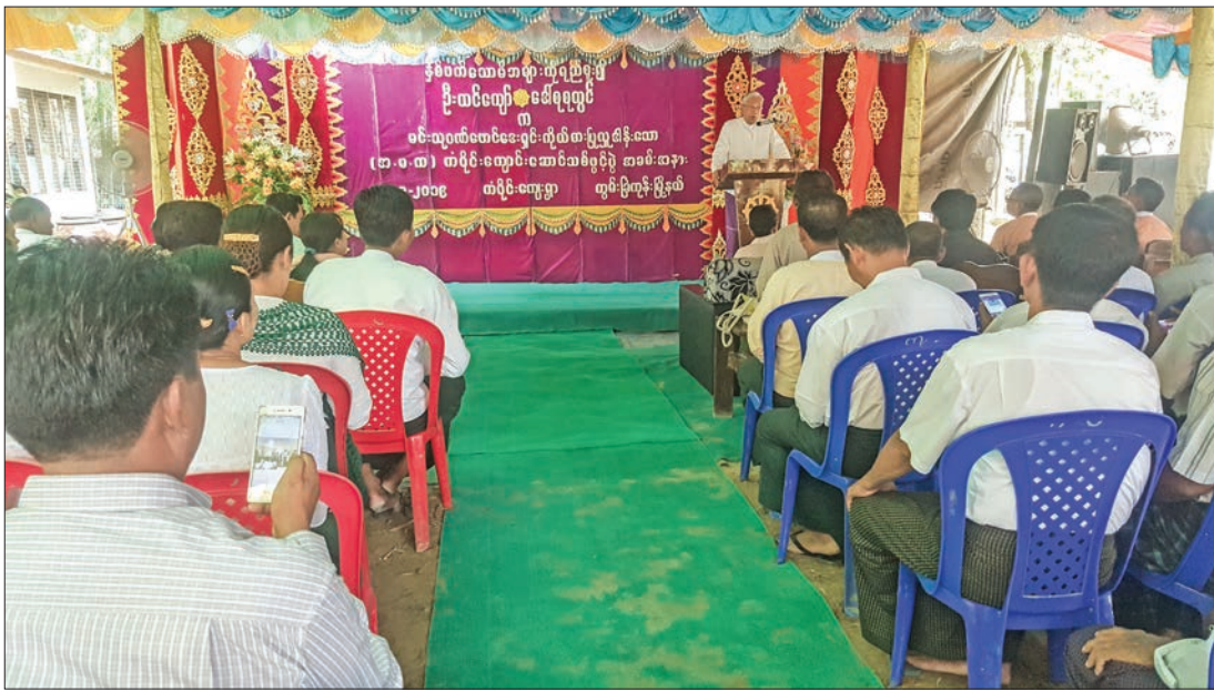
Former President U Htin Kyaw addresses the opening ceremony for a new school building in Kungyangon Township in Yangon yesterday.