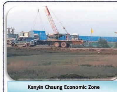
Kanyin Chaung Economic Zone

The construction of Kanyin Chaung Economic Zone-"A" covering an area of 49.58 acres in Maungdaw Town implemented to contribute to the socio-economic development of Rakhine State is now 82% completed.