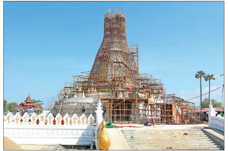
The Buddha consecration ceremony of the Eternal Peace Pagoda in Nay Pyi Taw will be held on 11 November.