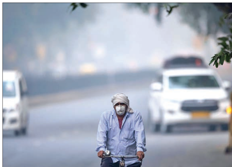
A poisonous haze envelops New Delhi every winter, caused by vehicle fumes, industrial emissions and smoke from agricultural burning in neighbouring states.

A group of environmentalists wrote to Prime Minister Narendra Modi on Sunday urging him to "take leadership" on the issue. The environmentalists said political parties were "intent on fixing the blame while Indians continue to die", PTI reported. —AFP ■