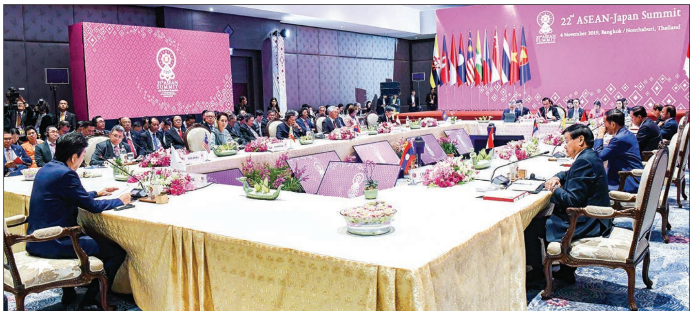
State Counsellor Daw Aung San Suu Kyi attends the 22 nd ASEAN-Japan Summit held in Bangkok, Thailand, on Monday.