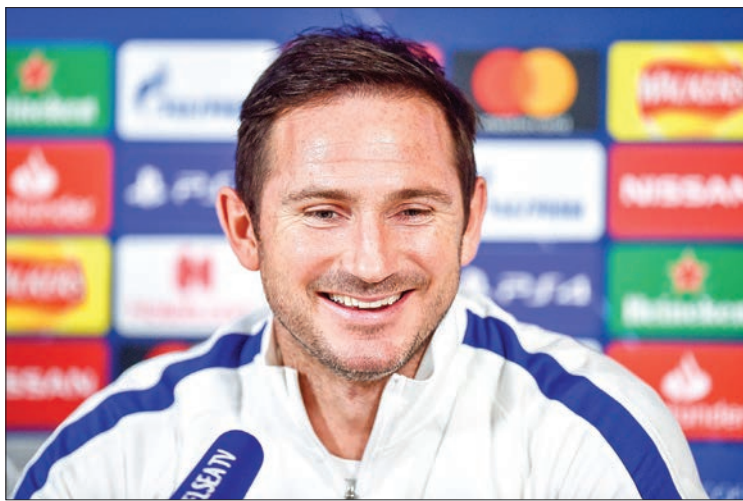
Chelsea's English head coach Frank Lampard attends a press conference at Chelsea's Cobham training facility in Stoke D'Abernon, southwest of London on 4 November 2019.

LONDON (United Kingdom) — Chelsea boss Frank Lampard has called for an “open conversation” on VAR after another weekend of controversy in the Premier League as he prepares his team to face Ajax in the Champions League.