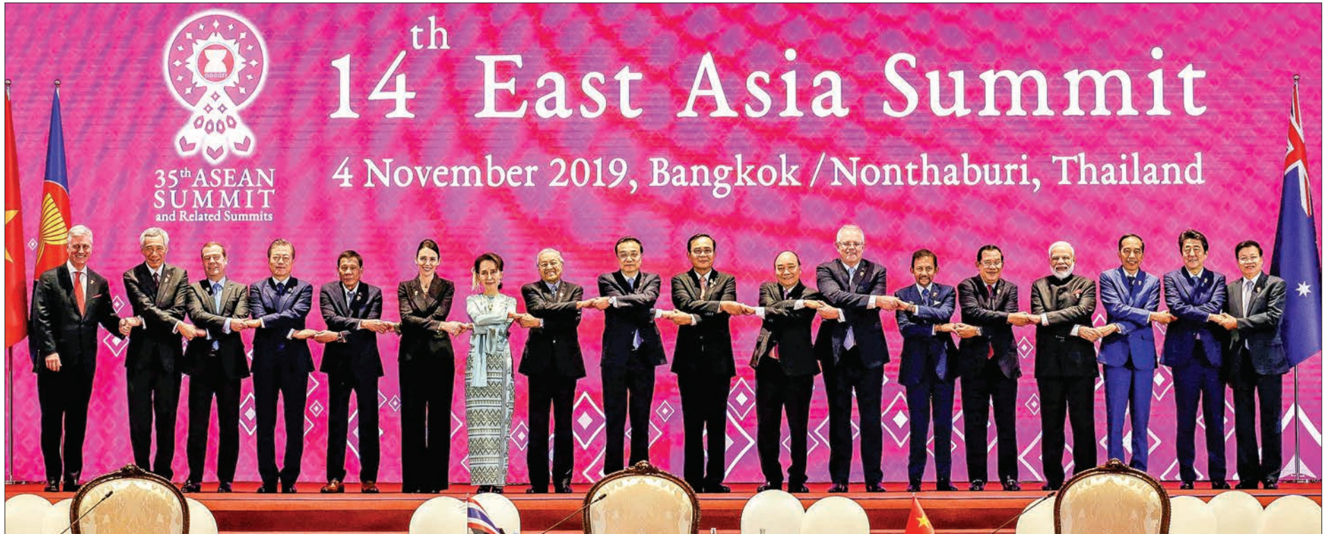
State Counsellor Daw Aung San Suu Kyi and the Association of Southeast Asian Nations (ASEAN) leaders pose for a commemorative photo together with leaders from East Asian countries at the 14 th East Asia Summit in Bangkok, Thailand, on 4 November 2019.