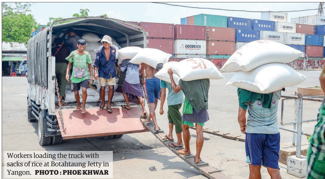
Workers loading the truck with sacks of rice at Botahtaung Jetty in Yangon.

At present, the Bago, Ayeyawady, and Yangon region