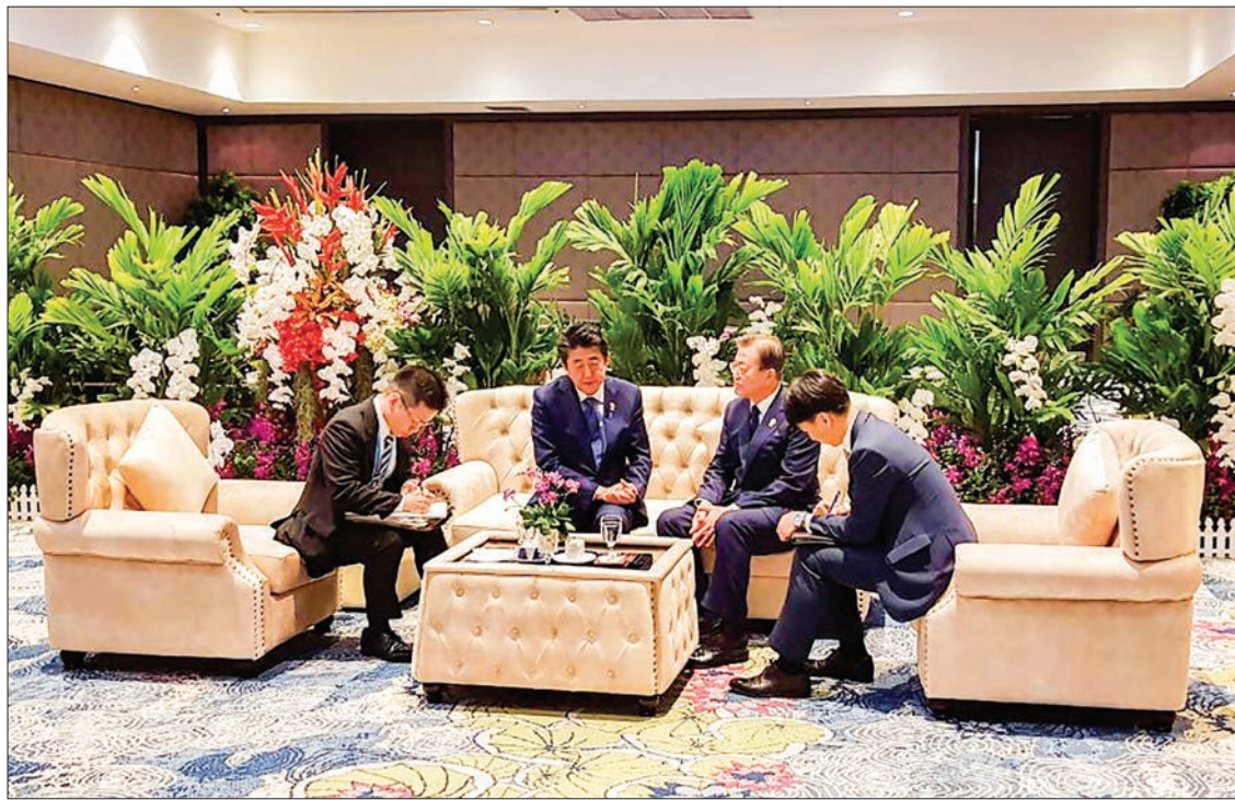
This picture taken on 4 November 2019 and released by the presidential Blue House via Yonhap shows South Korea's President Moon Jae-in (2nd R) talking with Japan's Prime Minister Shinzo Abe (2nd L) during their meeting in Bangkok, on the sidelines of the 35th Association of Southeast Asian Nations (ASEAN) Summit.

BANGKOK — Japanese Prime Minister Shinzo Abe on Monday urged South Korean President Moon Jae In to stick to a 1965 bilateral agreement designed to settle all wartime compensation issues amid a lingering dispute over the matter.