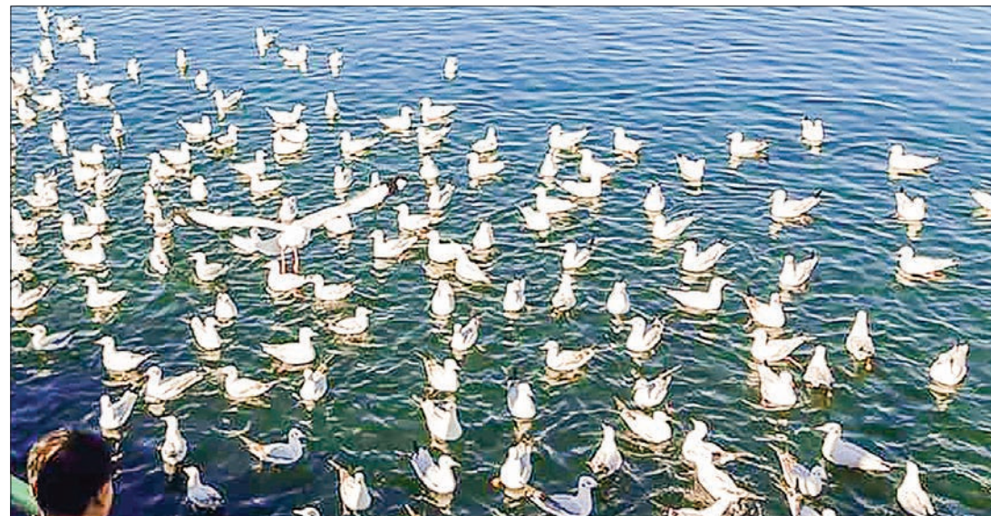
Migratory bird species at Indawgyi Lake. PHOTO: WIN NAING

THE population of birds at the Indawgyi Lake has registered an increase with flocks of winged visitors returning to the lake for