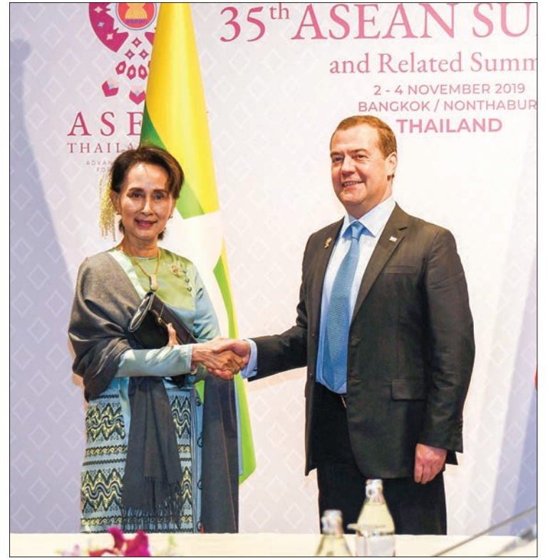
State Counsellor Daw Aung San Suu Kyi shakes hands with Prime Minister of the Russian Federation Mr Dmitry Medvedev.

S TATE Counsellor Daw Aung San Suu Kyi held separate talks with Prime Minister of the Russian Federation Mr Dmitry Medvedev and United States National Security Advisor Mr Robert Charles O'Brien at the Impact Exhibition and Convention Center in Bangkok, Thailand, yesterday.