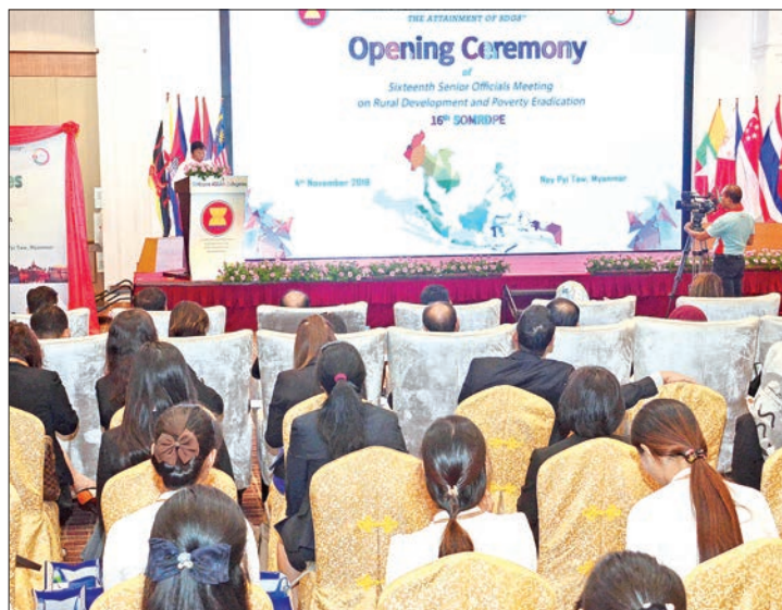
Deputy Minister U Hla Kyaw delivers the speech at the opening ceremony of Sixteenth Senior Officials Meeting on Rural Development and Poverty Eradication of ASEAN.