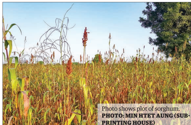
Photo shows plot of sorghum.