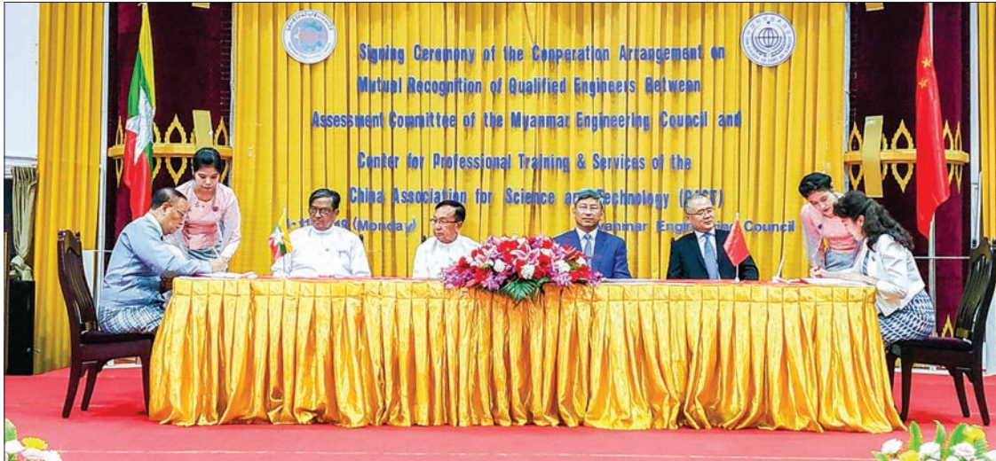
The signing ceremony between MEngC and the CAST witnessed by Union Minister U Han Zaw and Chinese Ambassador Mr Chen Hai in Yangon yesterday.

THE Myanmar Engineering Council (MEngC) and the China Association for Science and Technology (CAST) signed a mutual recognition agreement (MRA) yesterday afternoon, as part of a programme conducted by Myanmar to expand such agreement with other foreign engineering associations.