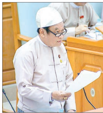
Union Minister for Health and Sports Dr Myint Htwe.

Afterwards, Myanmar acceding to an agreement on establishing ASEAN centre for the aged; Convention on Limitation of Liability for Maritime Claims, 1976 (LLMC 1976), Protocol of 1996 to amend the Convention on Limitation of Liability for Maritime claims, 1976 (LLMC PROT 1996); International Convention for the Unification of Certain Rules of Law Relating to Bills of Lading ("Hague Rules") Hague Visby Rules and SDR Protocol sent by the President were explained by Union Minister for Health and Sports Dr Myint Htwe and Deputy Minister for Transport and Communications.