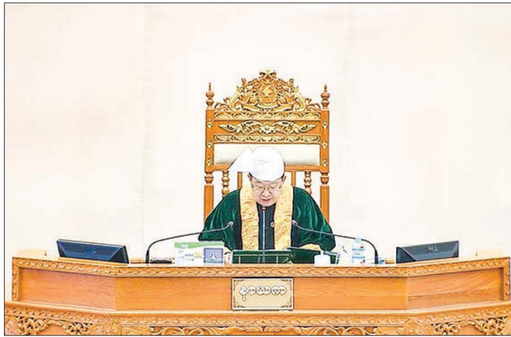
Pyidaungsu Hluttaw Speaker U T Khun Myat.

He said the 14 th regular session will continue the Constitution amendment process and conduct other Hluttaw works including discussions and debates on bills. Of the 325 townships permitted to conduct works in Fiscal Year 2018-2019 with Pyidaungsu Hluttaw Development Fund, 309 town-