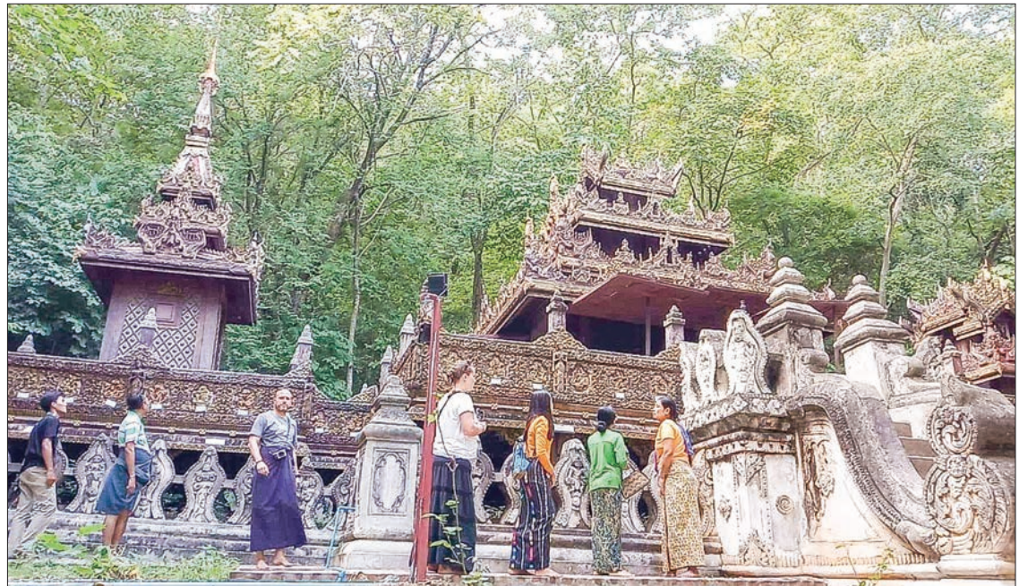
Travellers visit the Sagaing Yoke Sone monastery on Sagaing Hill.

monastery is a fine example of the architecture of the Inwa era. It was built and donated by the second king of Inwa to Ariyawuntha Sayadaw. The monastery has