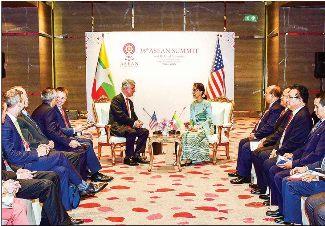
State Counsellor Daw Aung San Suu Kyi holds talks with United States National Security Advisor Mr Robert Charles O'Brien at the Impact Exhibition and Convention Center in Bangkok, Thailand, yesterday.