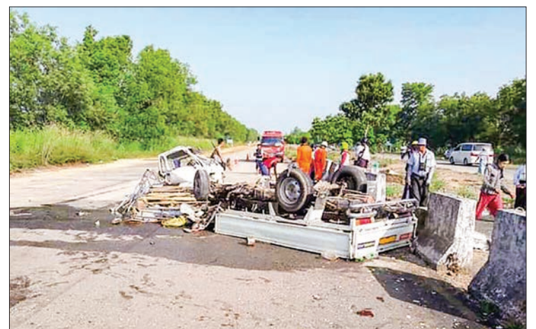
A fatal accident is seen on Yangon-Mandalay Highway.