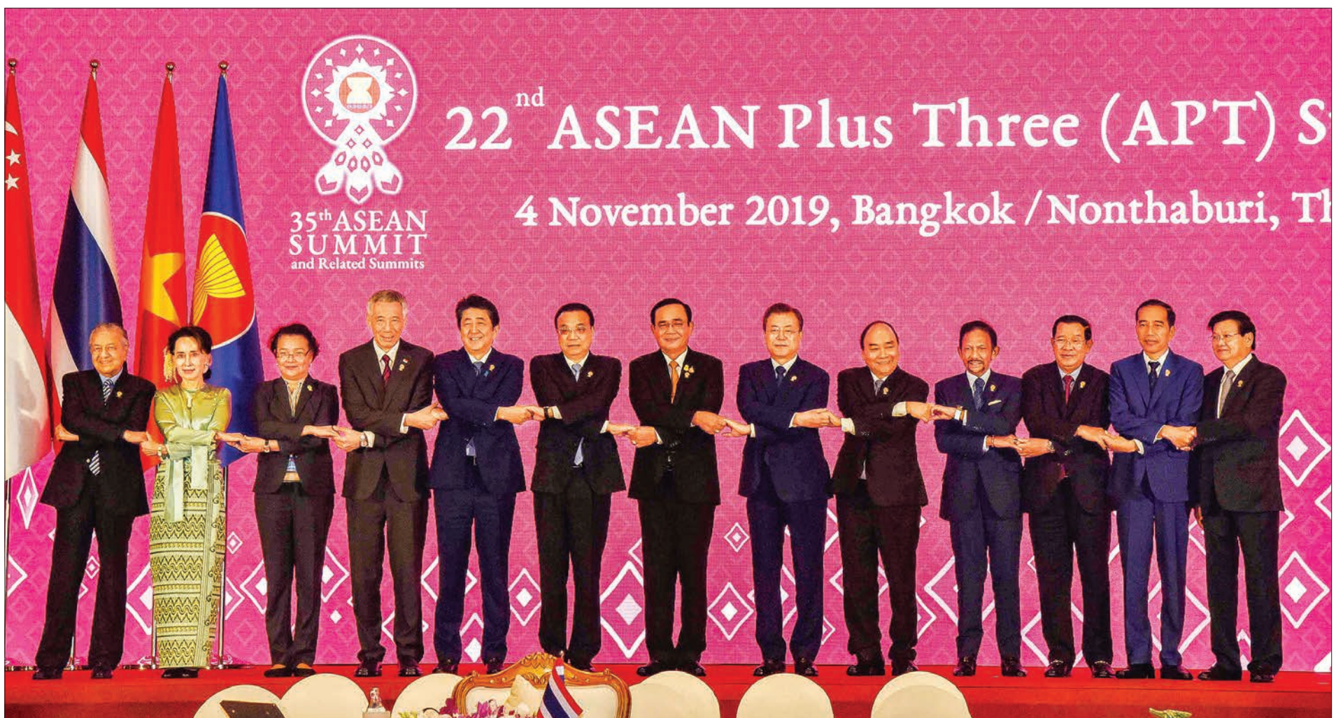
State Counsellor Daw Aung San Suu Kyi poses for a commemorative photo with leaders from the member states of the Association of Southeast Asian Nations (ASEAN), the People's Republic of China, Japan, and the Republic of Korea, at the 22 nd ASEAN Plus Three Summit in Bangkok, Thailand on 4 November 2019.

S TATE Counsellor Daw Aung San Suu Kyi attended the 22 nd ASEAN Plus Three (APT) Summit, the Special Lunch on Sustainable Development, the 14 th East Asia Summit, the 22 nd ASEAN-Japan Summit, the 3 rd Regional Comprehensive Economic Partnership (RCEP) Summit, and the closing ceremonies of the 35 th ASEAN Summit and