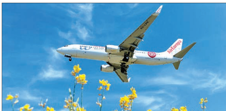
The acquisition is to help Madrid's airport take on bigger rivals

The company had decided at the start of 2019 not to make a formal bid for low-cost airline Norwegian Air Shuttle, after its informal approaches were rejected as too low.—AFP ■