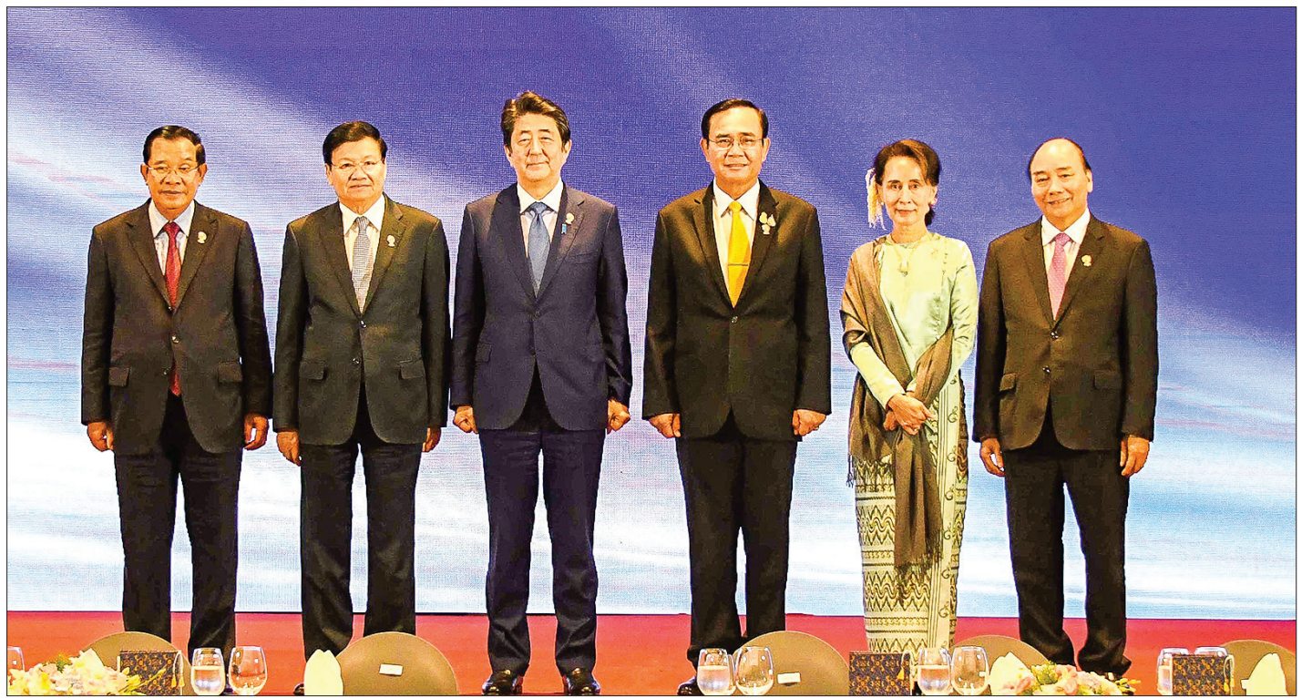
State Counsellor Daw Aung San Suu Kyi, Prime Minister of the Kingdom of Thailand (Retd) General Prayut Chan-o-cha, Prime Minister of Japan Mr. Shinzo Abe and Leaders from Mekong countries pose for a photo at the 11 th Mekong-Japan Summit in Bangkok.

At 8:30 pm, the State Counsellor joined the 11 th Mekong-Japan Summit Working Dinner at Sapphire 20 at the same venue. — MNA ■