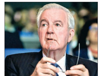
WADA president Craig Reedie is stepping down after two terms overshadowed by the Russian doping crisis.

It's the scandal which refuses to die but the burning issue over potential new sanctions for Russia is not even on the agenda of WADA's executive committee on Monday and Thursday in Poland. The affair, which has dominated the global anti-doping fight — as well as creating splits in how to deal with it — for the past five years, reappeared in September due to suspicions of manipulation of the electronic data from the former Moscow laboratory handed over to WADA investigators in early 2019.