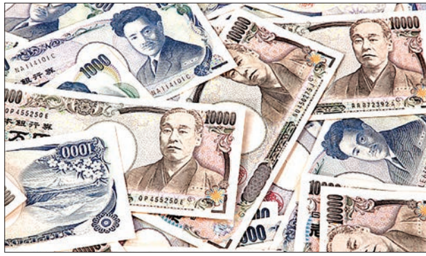
File photo shows Japanese banknotes.