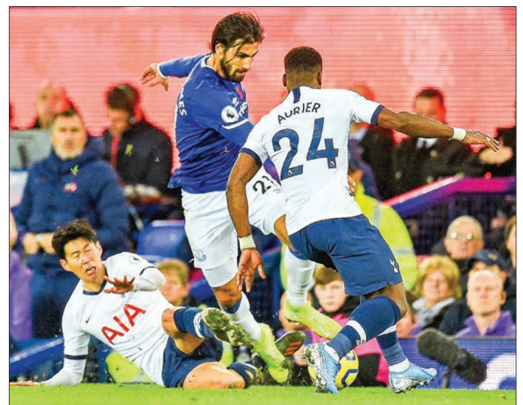
Everton midfielder Andre Gomes (centre) was injured following a challenge by Tottenham's Son Heung-min (left).

Tottenham manager Mauricio Pochettino felt the injury led to an over-reaction.