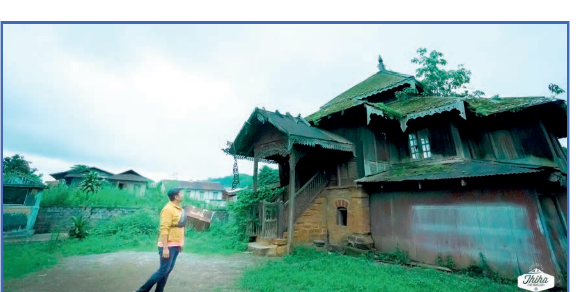
Pinlaung Haw Nan

were many natural waterfalls and caves that are of interest. There were even places to go trekking or hiking or even rock climbing! As I'm not that sporty type of person, I'll only mention places that I went to.