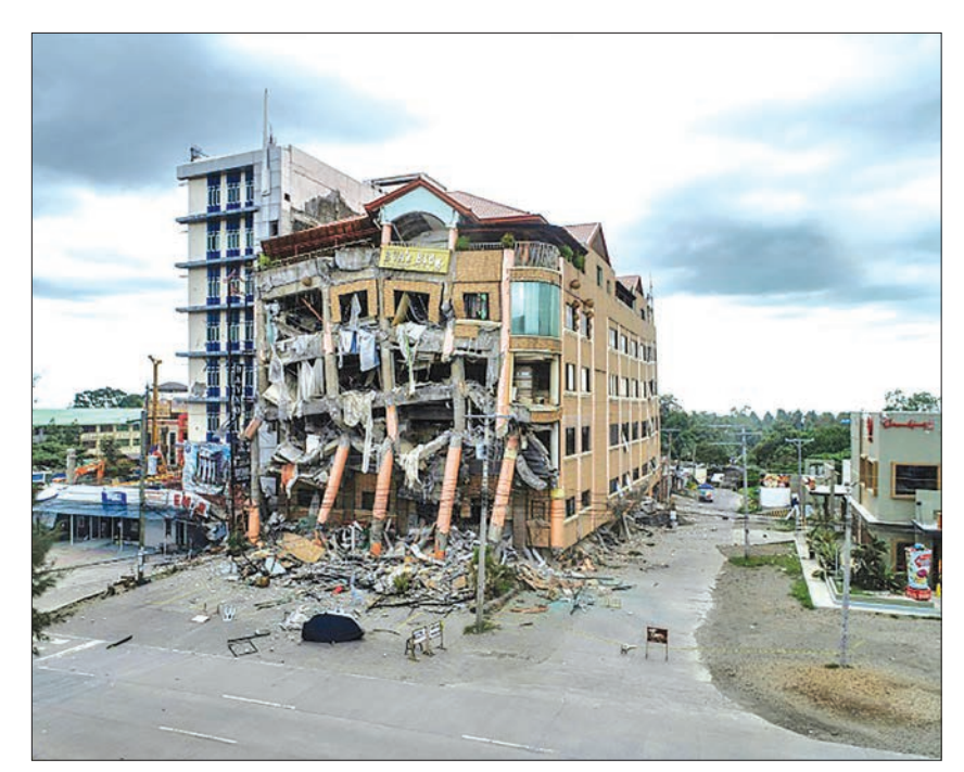
The 6.6-magnitude and 6.5-magnitude quakes struck the Philippine island of Mindanao two days apart.

MANILA—The death toll in two powerful quakes that struck the southern Philippines in the past week has risen to 21, authorities said Sunday, as survivors struggled to access food and water.