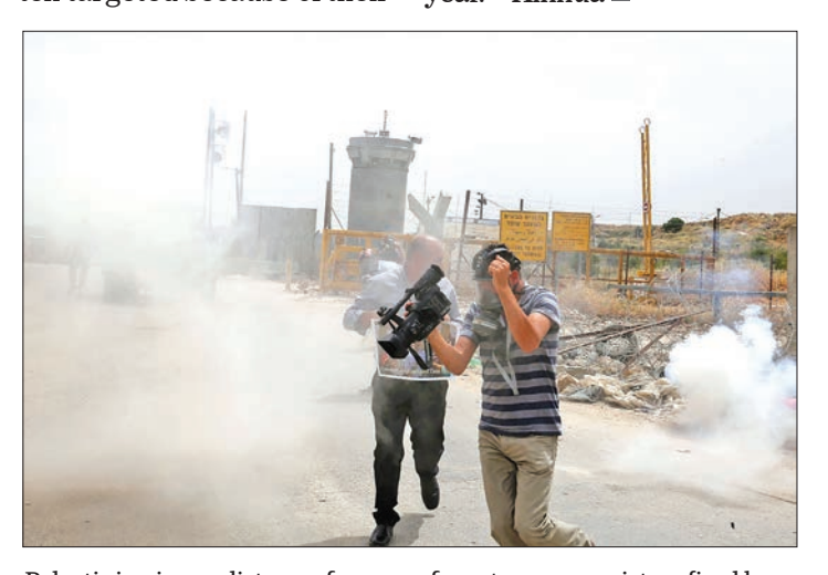
Palestinian journalists run for cover from tear gas canisters fired by Israeli forces during a demonstration on World Press Freedom day near Betunia in the West Bank, 3 May 2016.

The UN General Assembly proclaimed Nov. 2 as the International Day to End Impunity for Crimes against Journalists in a resolution adopted in 2013. The date was chosen in commemoration of the assassination of two French journalists in Mali in November that year.—Xinhua