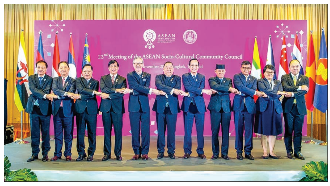
Union Minister Thura U Aung Ko and ministers from the ASEAN countries pose for a documentary photo at the 22<sup>nd</sup> Meeting of the ASEAN Socio-Cultural Community Council in Bangkok.

The Union Minister signed agreements in the "Advancing Partnership for sustainability" the theme developed during the ASEAN chairmanship term of Thailand in 20109, the establishment of ASEAN Socio-Cultural Community centers which will be implemented by Thailand, and the six declarations of the ASEAN Joint Statement on Cli mate Change to the 25th Session of the Conference of the Parties to the UNFCCC (COP25), the Declaration on the Protection of Children from All Forms of