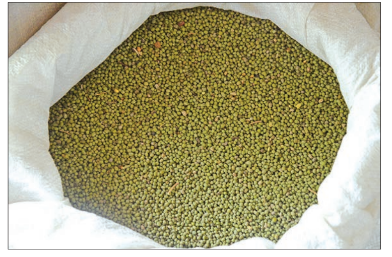
The mung beans are fetching K1.18 million per ton in the Yangon market.