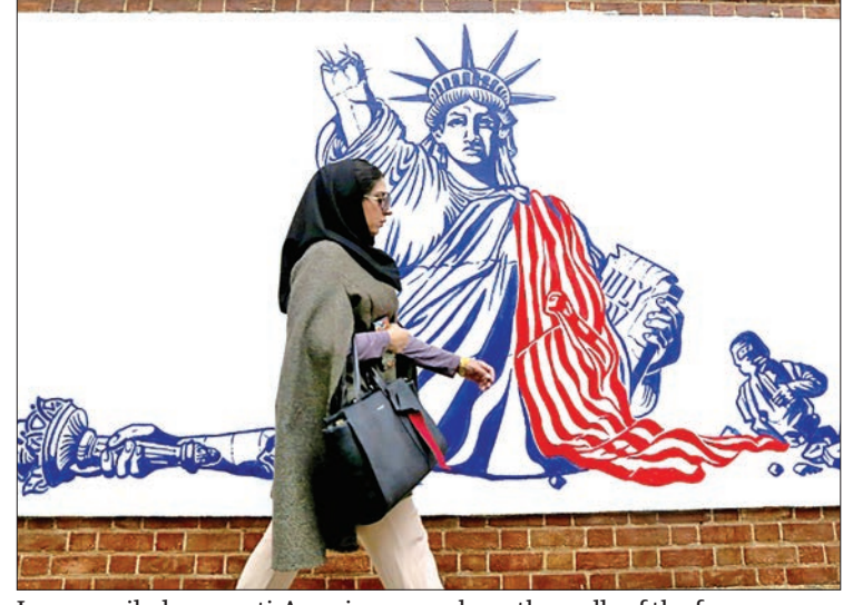
Iran unveiled new anti-American murals on the walls of the former US embassy ahead of the 40^{\rm th} anniversary of the Tehran hostage crisis.

crisis to end with the release of 52 Americans, but the US broke off diplomatic relations with Iran in 1980 and ties have been frozen ever since.