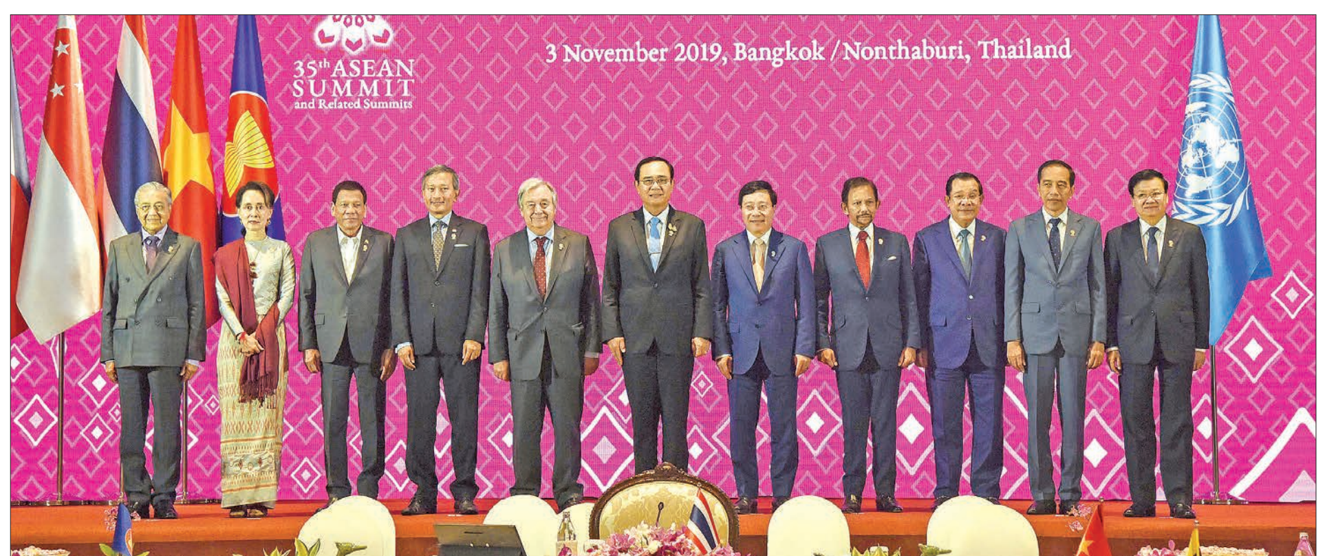
State Counsellor Daw Aung San Suu Kyi and leaders from ASEAN and China pose for a group photo at the 10th ASEAN-UN Summit in Bangkok yesterday.