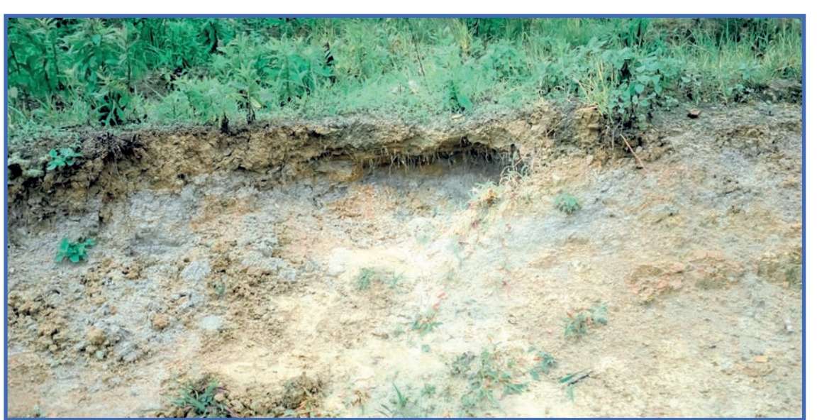
Edibal earth pits

At such height, the weather at the top of the mountain is severe and changes drastically in a moment. It might be misty but can become sunny and hot within a moment or the other way round. At the summit is a monastery, a pagoda and a communication tower. The mountain is very attractive for active sports persons, mountaineers and hikers alike. As the summit can also be reached by cars or motorcycles, even non-sporty person like me can enjoy the view up there. Inle Lake as well as other peaks can be seen from the summit. Most went up to