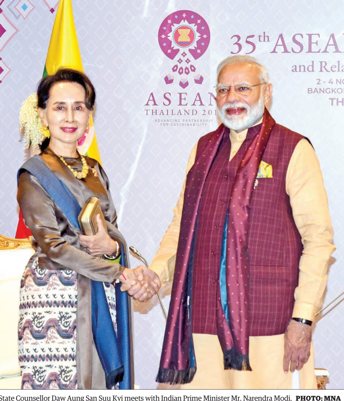
State Counsellor Daw Aung San Suu Kyi meets with Indian Prime Minister Mr. Narendra Modi.

during the talks, they cordially exchanged views on extending cooperation between the two countries, exchange of high-level visits, continued constructive assistance from India, and ASEAN-India cooperation, based on common interest, and other issues including cementing bilateral relations, trade, transport, soonest operation of Sittway port, a sector of Kaladan Multi-Modal Transit Transport Project, demarcation of the remaining part of the common border between Myanmar and India, soonest reaching of cross-border