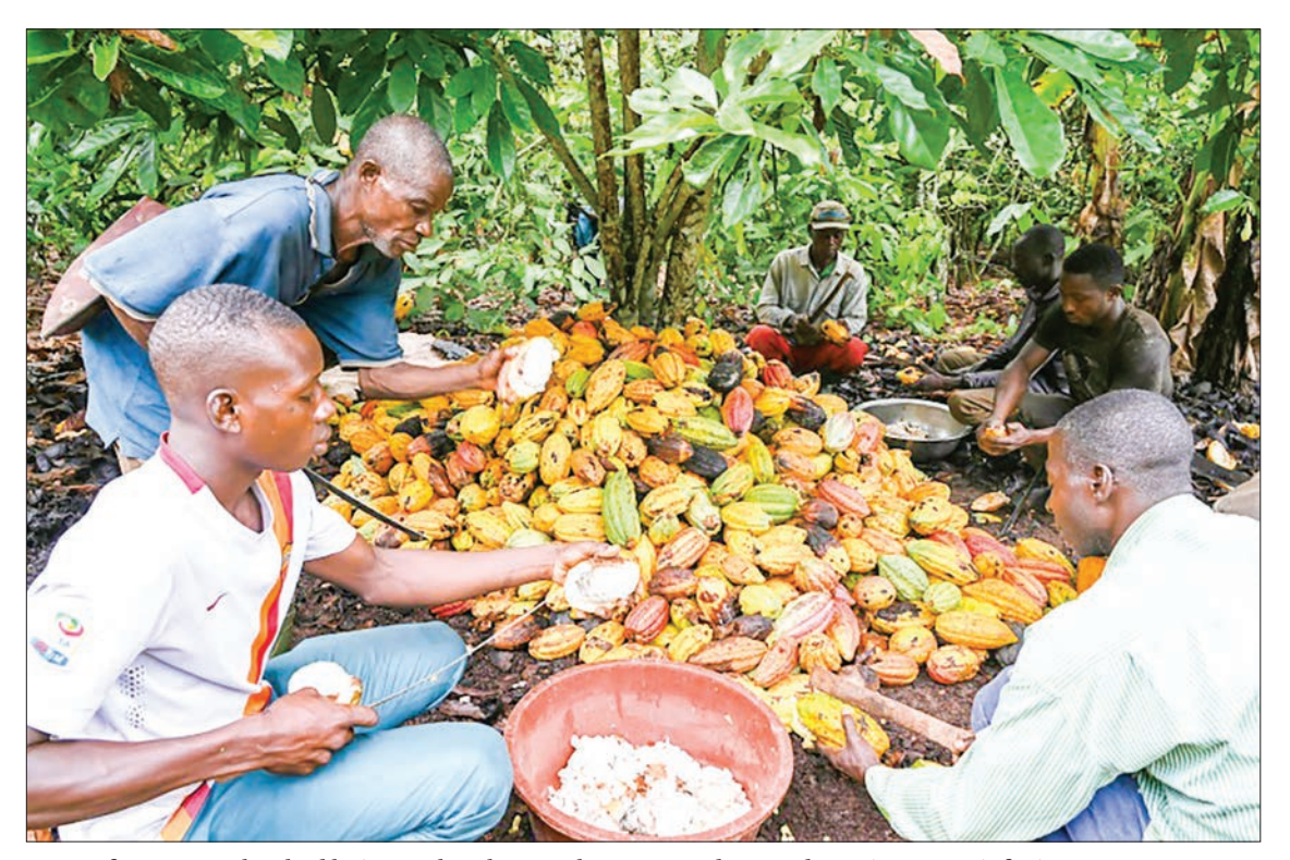
Cocoa farmers use hooked knives to break open the cocoa pods on a plantation near Sinfra in Ivory Coast's Central region.

YAMOUSSOUKRO — The willingness of some multinational firms to pay a cost-of-living bonus for African cocoa planters is welcome but will not save many farmers from grinding poverty, industry sources say.