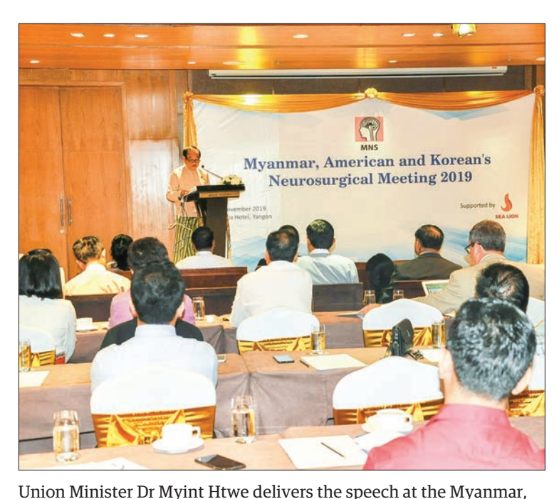
American and Korean's Neurosurgical Meeting 2019 in Yangon yesterday.

THE Myanmar, American, Korean's Neurosurgical Meeting 2019 was held at the Melia Hotel in Yangon yesterday morning.