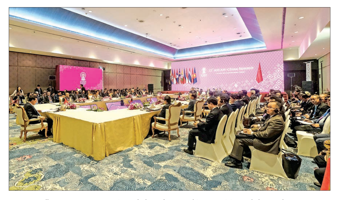
State Counsellor Daw Aung San Suu Kyi attends the 22^{nd} ASEAN-China Summit in Bangkok yesterday.