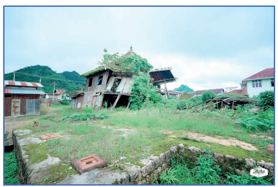
PInlaung Haw Nan or Palace.