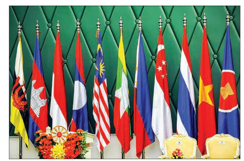
The Association of Southeast Asian Nations will likely delay finalising a regional trade pact at a summit in Bangkok.

Concluding the deal has been made more pressing by the brutal tit-for-tat trade war with the US, which has chipped back at growth in China, the world's second-largest econ-