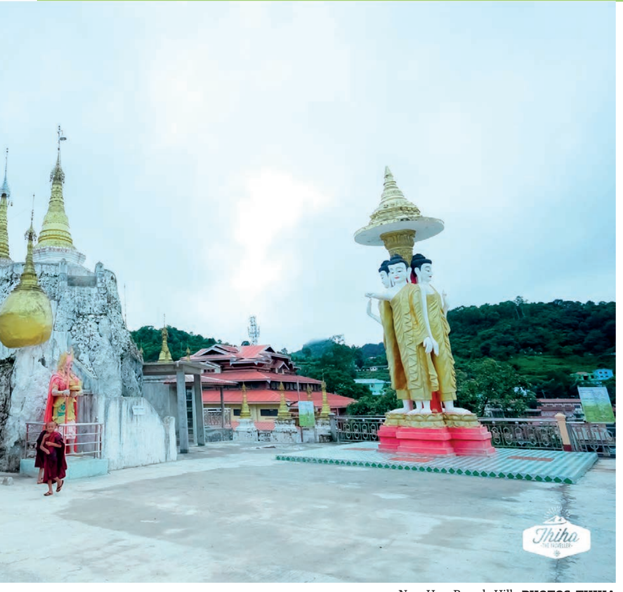
Nam Hoo Pagoda Hill.

Ya Lake as you enter Pinlaung Town. The lake itself was always crowded with local and foreign visitors.