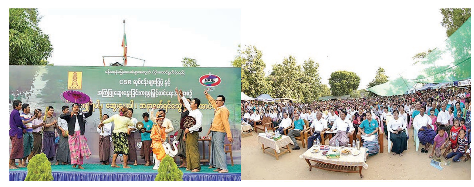
The dance troupe performs traditional dance and song to raise awareness about Operational Grievance Mechanism in the Mann oil field.

The MPRL E&P Pte Ltd conducted a campaign to raise awareness about the Operational Grievance Mechanism-OGM in the Mann oil field where the oil and gas exploration company is carrying out win-win cooperation with the state-owned Myanma Oil and Gas Enterprise.