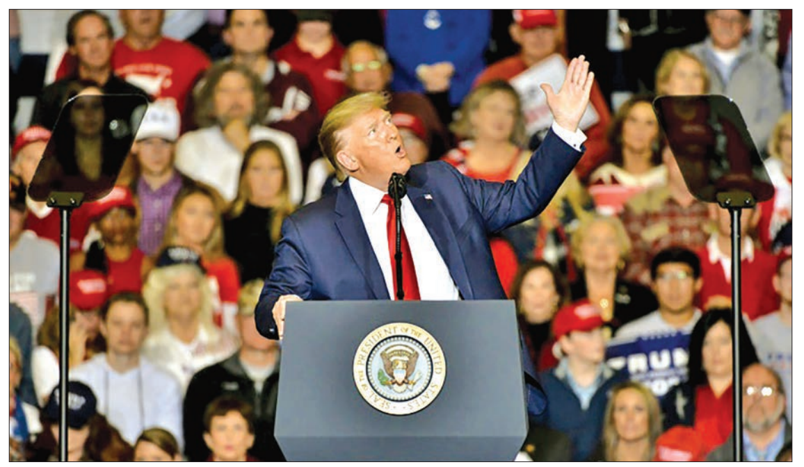
US President Donald Trump told supporters at a rally November 1, 2019 in Tupelo, Mississippi that Democratic leaders were "mentally violent".

WASHINGTON—America on Sunday kicks off the one-year countdown to Election Day 2020, with President Donald Trump betting an "angry" Republican surge can deliver him a second term, as the Democratic battle to win back the White House heats up. The building political clash — dramatically fueled by the House of Representatives' impeachment inquiry into Trump — appears to virtually guarantee another year of sharp division in a nation long weary of such drama.