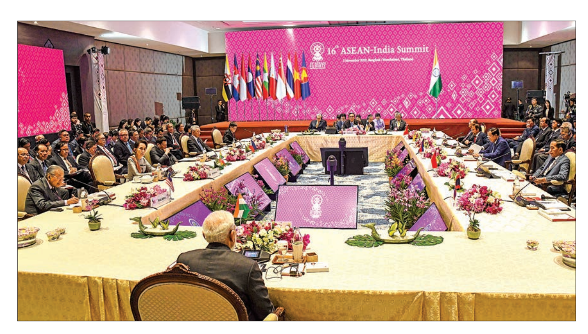
State Counsellor Daw Aung San Suu Kyi attends the 16<sup>th</sup> ASEAN-India Summit in Bangkok yesterday. PHOTO: