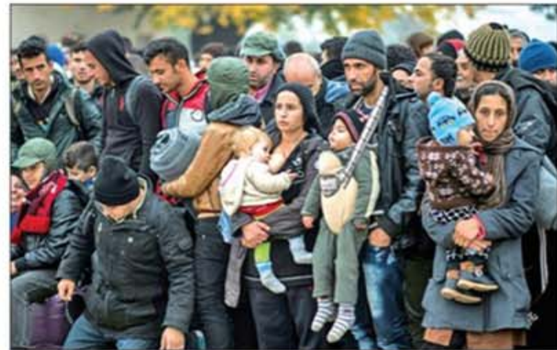
The migrant crisis the EU faced in 2015 ended up being addressed by a deal with Turkey the next year that greatly reduced the number of arrivals.

many of them from war-torn Syria, the European Union announced a temporary mechanism to relocate thousands of refugees from the hardest-hit countries of Italy and Greece to other parts of the bloc. But the Czech Republic, Hungary and Poland refused, triggering a complaint against them by the European Commission. Sharpston decided the three countries' arguments invoking security concerns were insufficient because they still had the right to bar individuals deemed a threat, and a "spirit of mutual trust and cooperation must prevail".—AFP ■