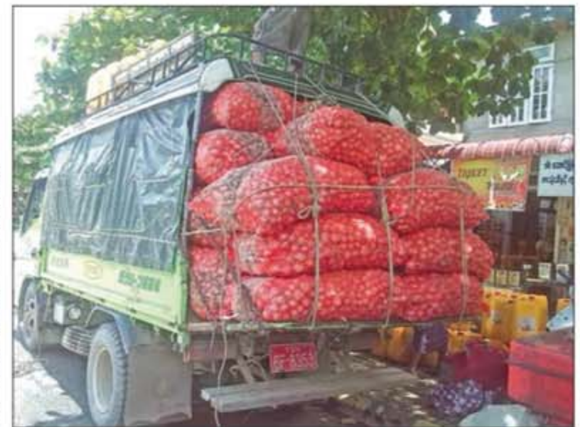
Pickup truck loaded with sacks of onion at a wholesale market in Chin State.

"As onion is one of the main kitchen ingredients, its prices have hit a high. The price of onions has climbed to over K1,000 per viss in the Kalsay market because of high demand from Mandalay and Monywa markets," said a depot owner from Kalsay Town.