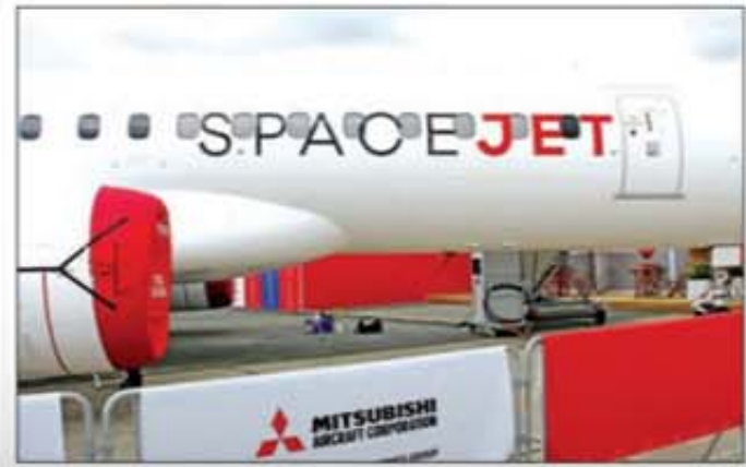
Mitsubishi Aircraft Corp.'s SpaceJet arrives in Le Bourget, near Paris, on 16 June, 2019, for the International Paris Air Show.