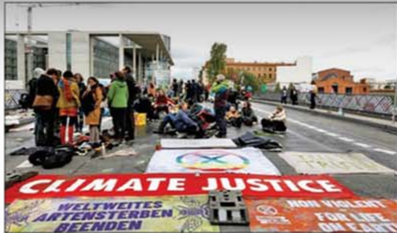
Climate change has become a global rallying cry, with Germany notably seeing large demonstrations such as the Extinction Rebellion protest in Berlin on 10 October.