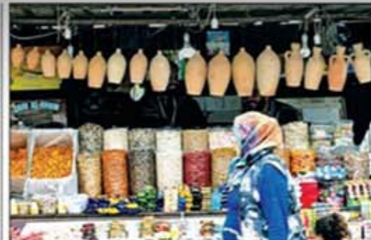
Qamishi has been out of regime control since 2012, when Damascus withdrew its forces to fight rebels and jihadists elsewhere.