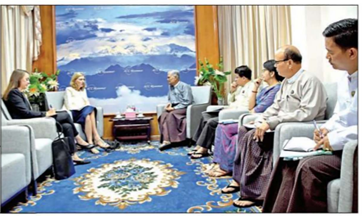
Anti-Corruption Commission Chairman U Aung Kyi meets with Norway Ambassador Ms Tone Tinnes yesterday.

Anti-Corruption Commission Chairman U Aung Kyi received Norway Ambassador Ms Tone Tinnes and party at Anti-Corruption Commission Office guest hall yesterday noon. During the meeting works conducted on resolving bribery and corruption in public service sector, educational programme on developing integrity and straight for wardness conducted by the commission and status of setting up the Corruption Prevention Units (CPUs) and works conducted by the CPUs were discussed.—MNA (Translated by Zaw Min)