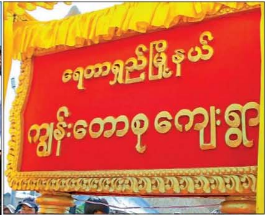
Vice President U Henry Van Thio, Bago Region Chief Minister U Win Thein and an official of the Myanmar Construction Entrepreneurs' Association - MCEA open the signboard of new Kyuntawsu village in Yedashe Township, Bago Region yesterday.

B AGO Region Government and the Myanmar Construction Entrepreneurs Association handed over 175 houses to the flood victims in new Kyuntawsu village in Thinewa village-tract of Yedashe Township, Bago Region, yesterday morning.