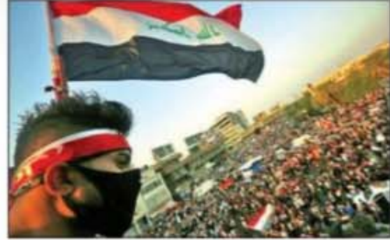
Anti-government protests in Iraq have left more than 250 people dead and 10,000 wounded since 1 October.

BAGHDAD — One protester killed. Then five. Suddenly, more than 40. As Iraq's anti-government demonstrations turned