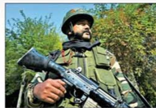
A soldier stands guard near Raj Bhavan, the official governor's residence, ahead of the swearing-in ceremony of first lieutenant governor of Jammu and Kashmir union territory, in Srinagar.

Speaking next to a colossal statue of independence hero Sardar Vallabhbhai Patel in his home state of Gujarat, Prime Minister Narendra Modi on Thursday hailed a "bright fu-