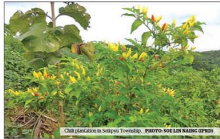
Chili plantation in Seikpyu Township.