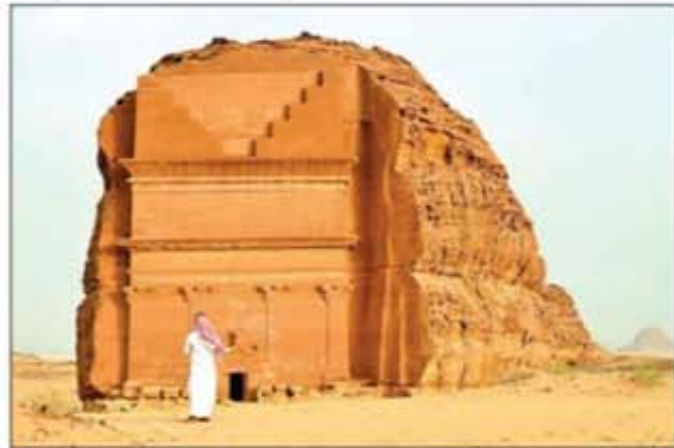
Conservative Saudi Arabia has launched a drive to attract tourists to places such as UNESCO World Heritage site Madain Saleh.

But he added that the Red Sea project alone promises to deliver 70,000 jobs and $5.9 billion towards Saudi GDP annually.—AFP