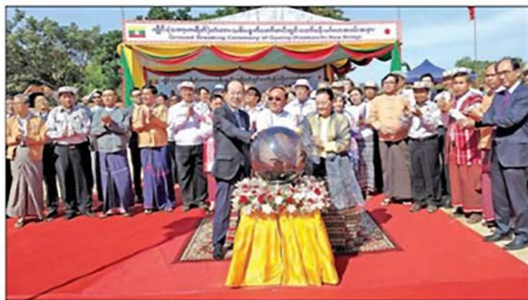
Union Minister U Han Zaw, State Chief Minister Daw Nang Khin Htwe Myint and Japanese Ambassador Mr Ichiro Maruyama press a button to drive a Stand Pipe of the bridge pile in Kawkaik.

UNION Minister for Construction U Han Zaw attended a stake and pile driving ceremony for Gyaing (Kawkareik) Bridge held