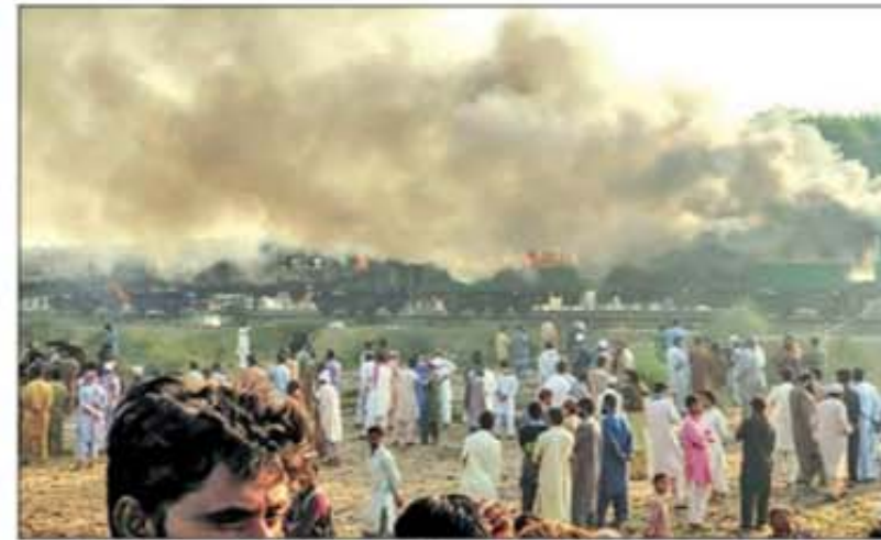
Some of the passengers — many of whom were religious pilgrims travelling to a congregation in the eastern city of Lahore — had been cooking breakfast when two of their gas cylinders exploded, officials said. © Pakistan's Punjab Emergency Service Rescue II22. PHOTO: AFP

Zia said that some of the victims were killed by head injuries sustained as they leapt from the moving train.—AFP ■