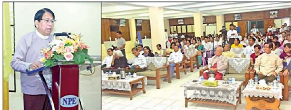
Union Minister for Information Dr Pe Myint delivers an opening speech at the ceremony of the 8 th Global Media and Information Literacy Week in Yangon yesterday.

The Union Minister said the participation of citizens is