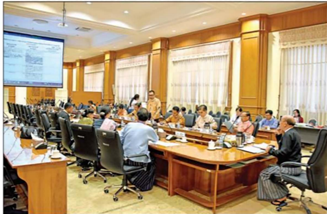
Pyidaungsu Hluttaw Deputy Speaker U Tun Tun Hein attends the Joint Bill Committee meeting in Nay Pyi Taw yesterday.

THE Pyidaungsu Hluttaw Joint Bill Committee held a meeting yesterday afternoon at the meeting hall of Pyidaungsu Hluttaw D Building over the Basic Education Bill that caused a controversy between the two