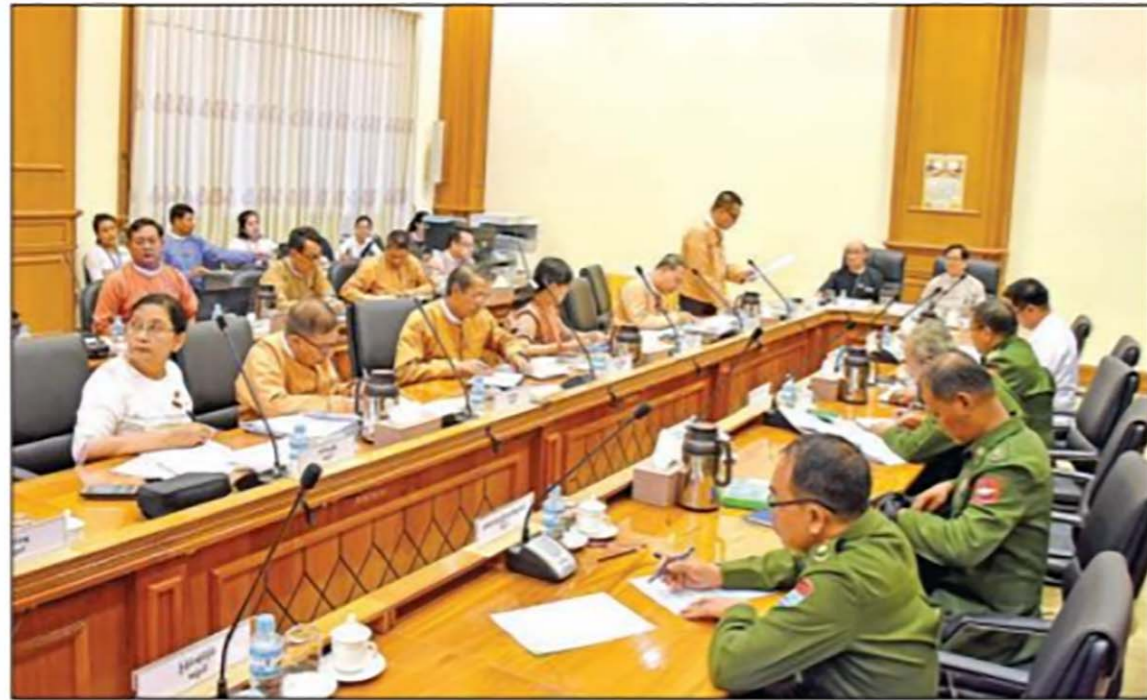
Meeting 53/2019 of the Joint Committee on Amending the 2008 Constitution held in Nay Pyi Taw yesterday.

MEETING 53/2019 of the Joint Committee on Amending the 2008 Constitution was held at Pyidaungsu Hluttaw Building D in Nay Pyi Taw yesterday morning.