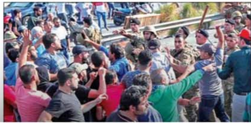
Lebanese army soldiers clash with protesters as they attempt to reopen the main highway that links the cities of Saida and Beirut near the town of Ijeh, south of the Lebanese capital Beirut, on 30 October, 2019.

BEIRUT — Demonstrators kept up their road-blocks across Lebanon on Thursday, as their unprecedented protest movement