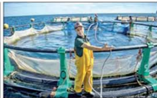
Aquaculture offers hope to struggling fishermen in the Moroccan city of Mdq.

and 46 more under construction many on key tributaries of the Mekong, according to monitor International Rivers. The Mekong River Commission (MRC), a body governing regional water diplomacy, said the water levels from June to October are the lowest in nearly 30 years. In Nong Khai, which faces the Laos' capital Vientiane, the water dropped to around one metre (3.2 feet) on Tuesday, several times shallower than average, the MRC said. Measurements across the river "are significantly below the minimum levels for this time of year and are expected to decrease further", it said in a statement to AFP. "The concern is for the upcoming dry season."—AFP ■