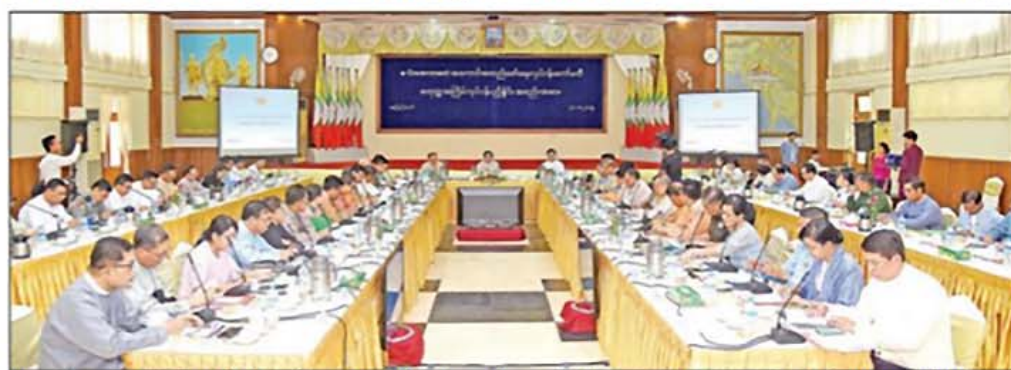
Union Minister for the Office of the Union Government U Min Thu presides over the 4 th meeting for implementation of e-Government in Nay Pyi Taw yesterday.

The working committee and sub-committees will have to link with relevant departments and organizations to provide assistance for technology; human resources and cybersecurity to the steering committee that is implementing the processes included in the e-Government Master Plan. He