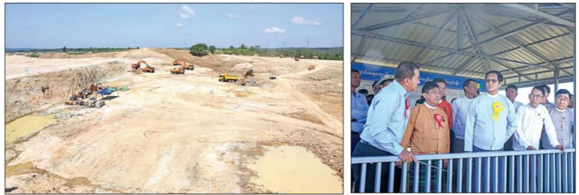
Vice President U Henry Van Thio inspects the construction of new spillway of the Swa Chaung Dam in Yedashe Township yesterday.