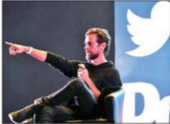
Twitter CEO and co-founder Jack Dorsey announced the short message platform would bar all political ads as part of an effort to curb misinformation.