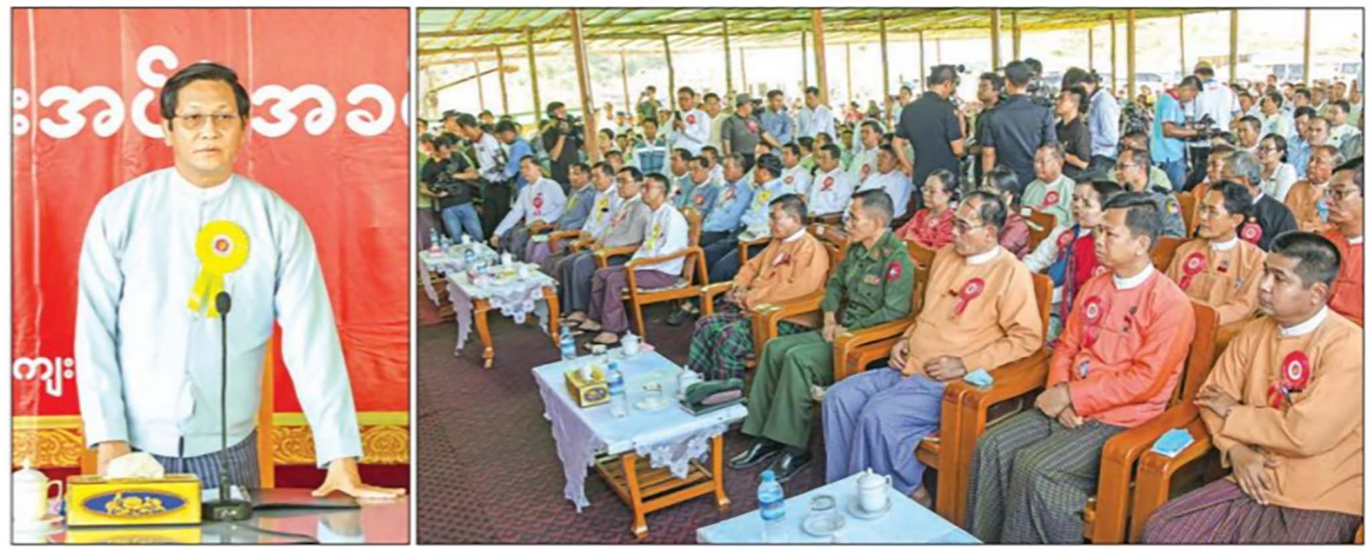
Vice President U Henry Van Thio addresses the ceremony to hand over new houses to flood victims at the Kyuntawsu village in Yedashe Township, Bago Region, yesterday.