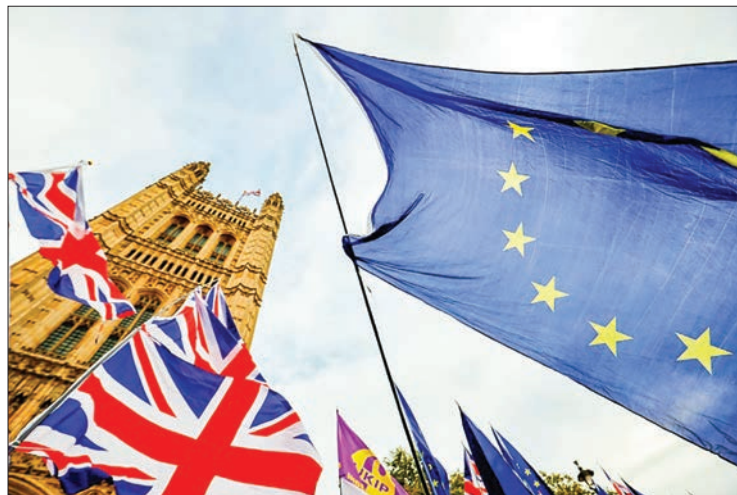
Britain has now delayed the date of Brexit three times.

Britain's inability to break its half-century bond with the EU has halted costly "no-deal"