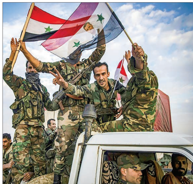
Damascus forces are deploying in much of the formerly Kurish-controlled zone along the border with Turkey but a 10-kilometre-deep strip is to be jointly patrolled by Russian and Turkish troops.

Turkey subsequently reached a deal with the Syrian government's main backer Russia for Kurdish forces to pull back from the entire border area.—AFP ■