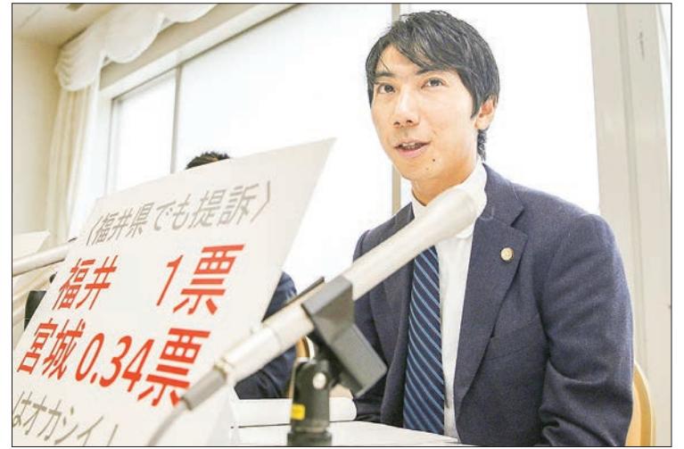
A lawyer speaks to the press in Kanazawa on 29 October, 2019, after the Kanazawa branch of the Nagoya High Court ruled the same day that the July upper house election was constitutional, tolerating a disparity of up to 3.00 times in the weight of a single vote between the most and least populated constituencies.

The plaintiffs immediately appealed the ruling to the Supreme Court.—Kyodo News ■