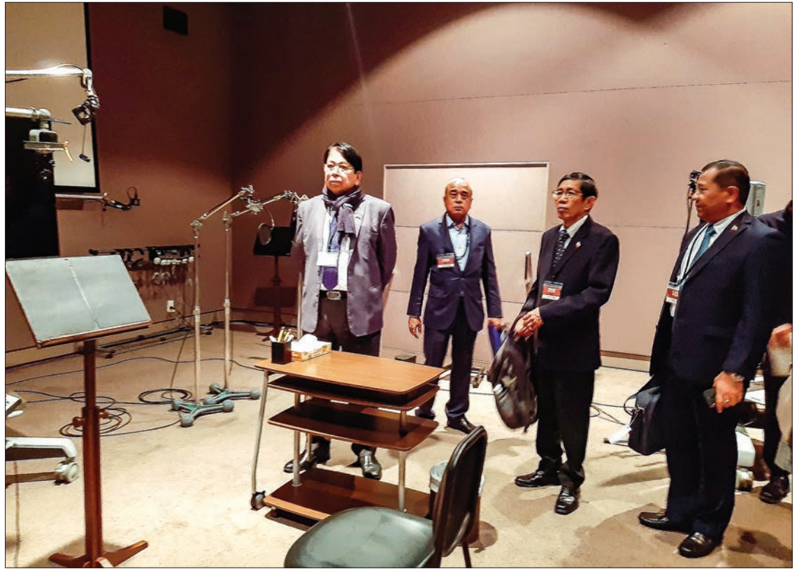
Union Minister for Information Dr Pe Myint visits Toho Studios in Tokyo, Japan, yesterday.