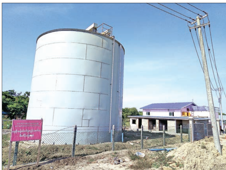
Wastewater treatment plant project seen in the industrial zone in Monywa.

"The construction of the plant is estimated to cost K1,500 million. And, the RBF has agreed to pay 50 per cent of the total cost of the project. When we entered into a contract with the RBF team, the