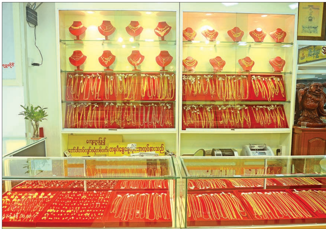
Gold jewelleryes are displayed at a shop in Yangon.

With global gold prices on the uptick, the domestic price hit fresh highs this year, reaching K1,000,000 per tical between 17 January and 21 February, crossing K1,100,000 (22 June to 7 August), climbing to 1,200,000 (7 August-4 September), and then reaching a fresh peak of