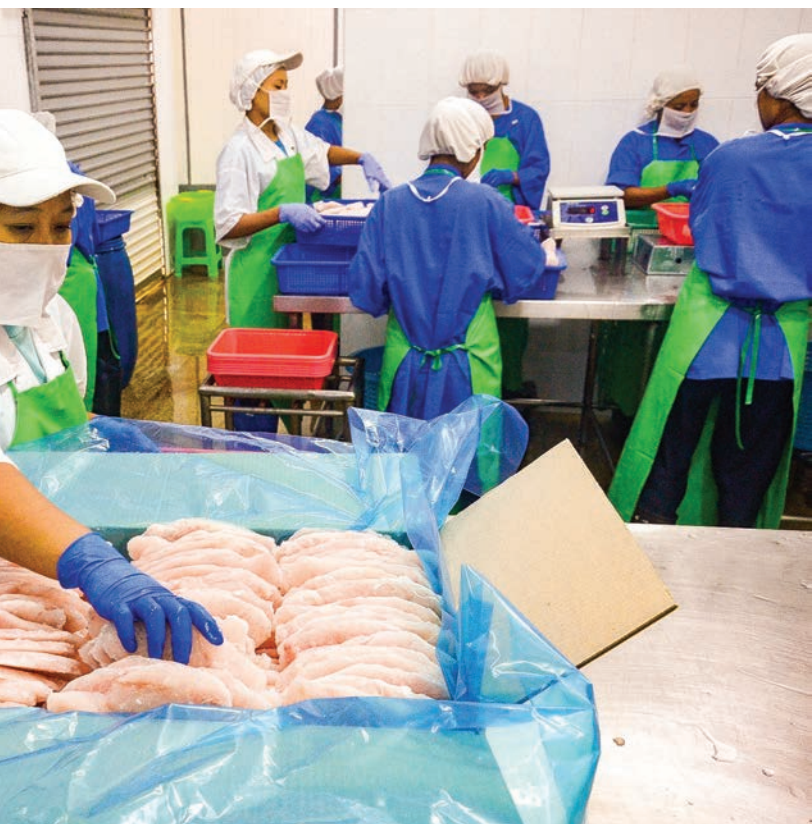
Workers at a fish factory preparing fish for export.

The country also exported 430,000 tons of marine products worth $600 million in the fiscal year 2016-2017 and shipped 560,000 tons of fishery products valued at $700 million in the financial year 2017-2018, according to the statistics from the Ministry of Commerce.