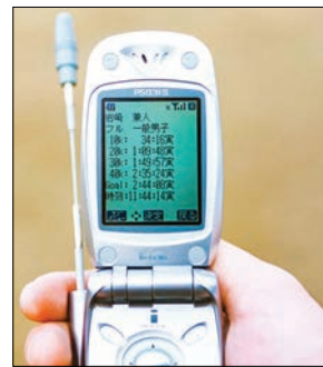
Supplied photo shows the i-mode internet service on an NTT mobile phone.

NTT Docomo aimed to export the technology overseas, but only managed a limited introduction in parts of Europe, partly because there were not many i-mode capable handsets available from major manufacturers, and the service was based on a closed system, which