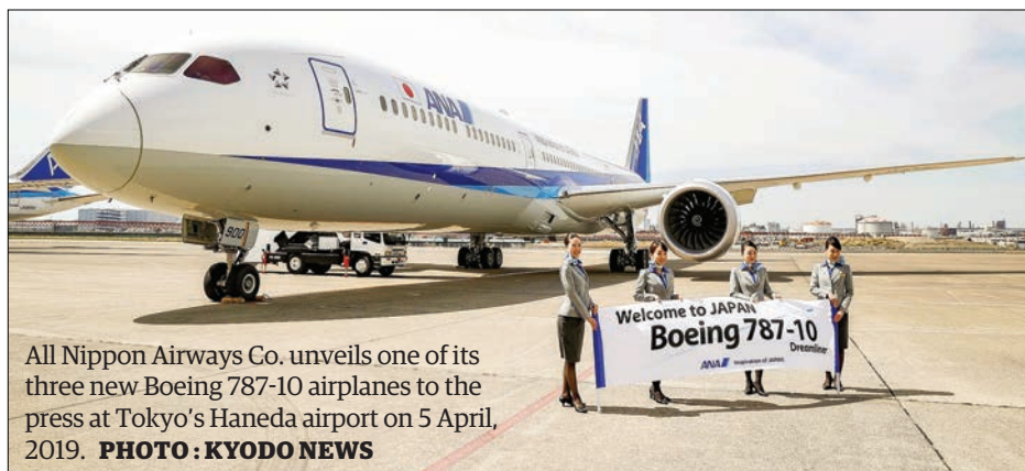
All Nippon Airways Co. unveils one of its three new Boeing 787-10 airplanes to the press at Tokyo's Haneda airport on 5 April, 2019.

group in terms of passenger numbers also said group operating profit is expected to fall to 140 billion yen from its previous forecast of 165 billion yen, on sales of 2.09 trillion yen