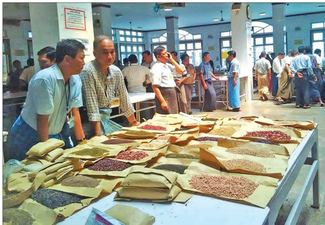
Merchants appraise quality of peas and pulses at the Mandalay wholesale market.

IMPORTS of foreign green garden peas into Mandalay has caused a decline in prices of local garden peas and chick peas, buffeting the local market and bringing hardships to local farmers and pea millers, according to U Soe Win Myint of the Soe Win Myint brokerage.