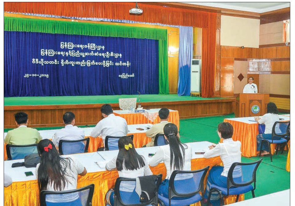
Deputy Minister U Aung Hla Tun delivers the speech at the opening ceremony of four-day training course on video reporting in Nay Pyi Taw yesterday.

THE Ministry of Information conducts a four-day training course on video reporting to upgrade its MOI Web portal that is now presenting the news in texts and photos.