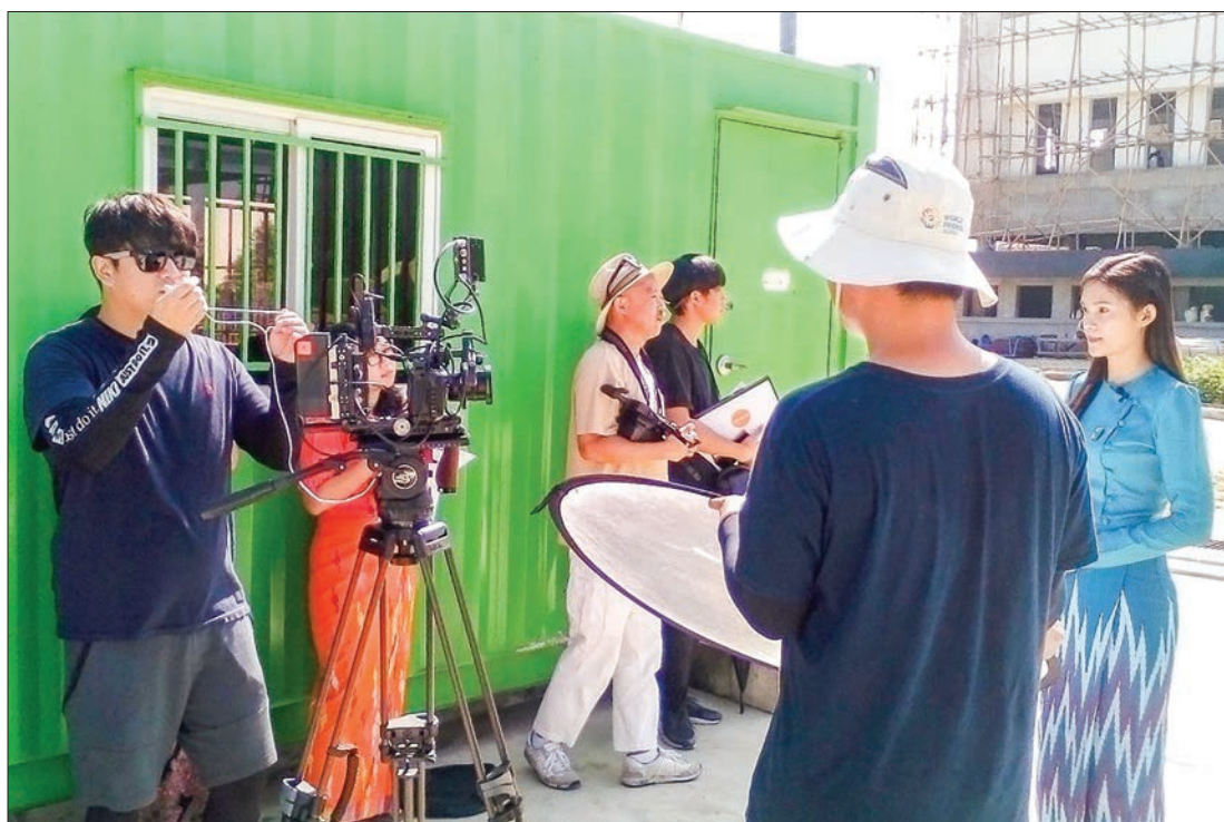
NALBAL film crew shoot the scene of interviewing KOICA and Myanmar Development Institute at Yezin Agricultural University.

FILM production NALBAL based in Seoul, the Republic of Korea, took a documentary film in Nay Pyi Taw Union Territory from 26 to 28 October.