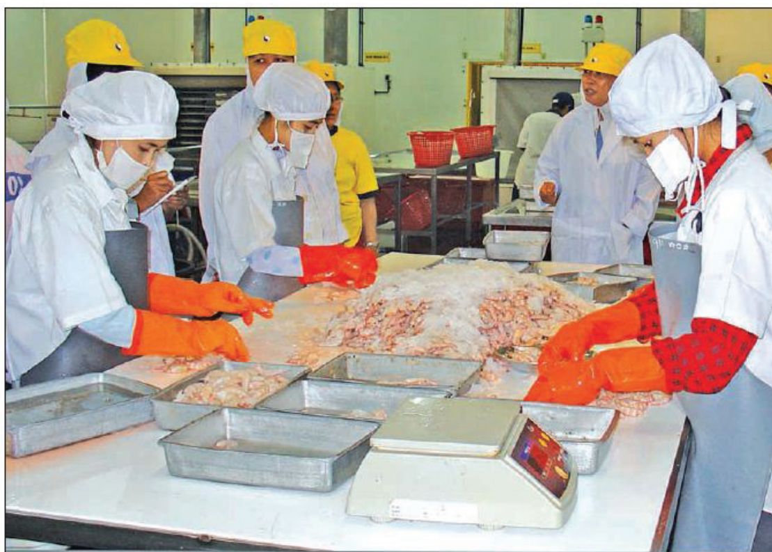
Workers sort out prawns at a factory.