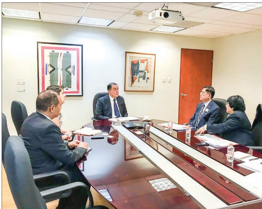
Deputy Minister U Maung Maung Win meets with officials from Mexico's Ministry of Finance and Public Credit in Mexico City, Mexico.