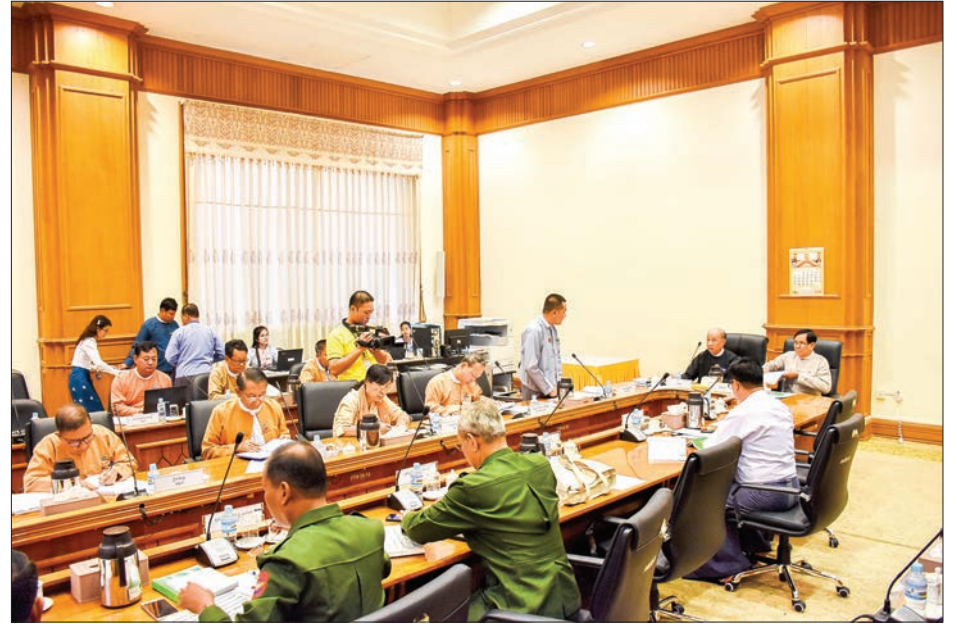
Meeting of the Joint Committee on Amending the 2008 Constitution 51/2019 held in Nay Pyi Taw yesterday.

MEETING 51/2019 of the Joint Committee on Amending the 2008 Constitution was held at Pyidaungsu Hluttaw Building D in Nay Pyi Taw yesterday morning. The meeting was attended by Chairman of the Joint Committee Pyidaungsu