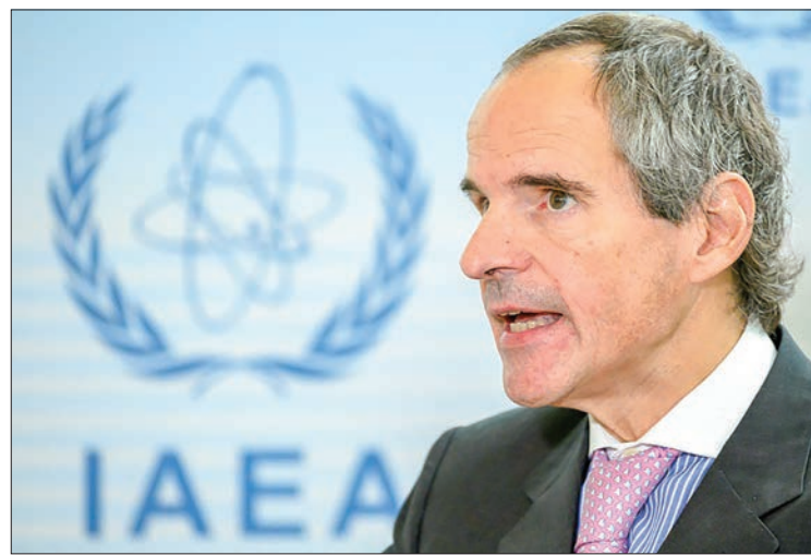
Grossi becomes the first IAEA head from Latin America and is believed to have had the backing of the US.

An IAEA general conference is expected to approve the