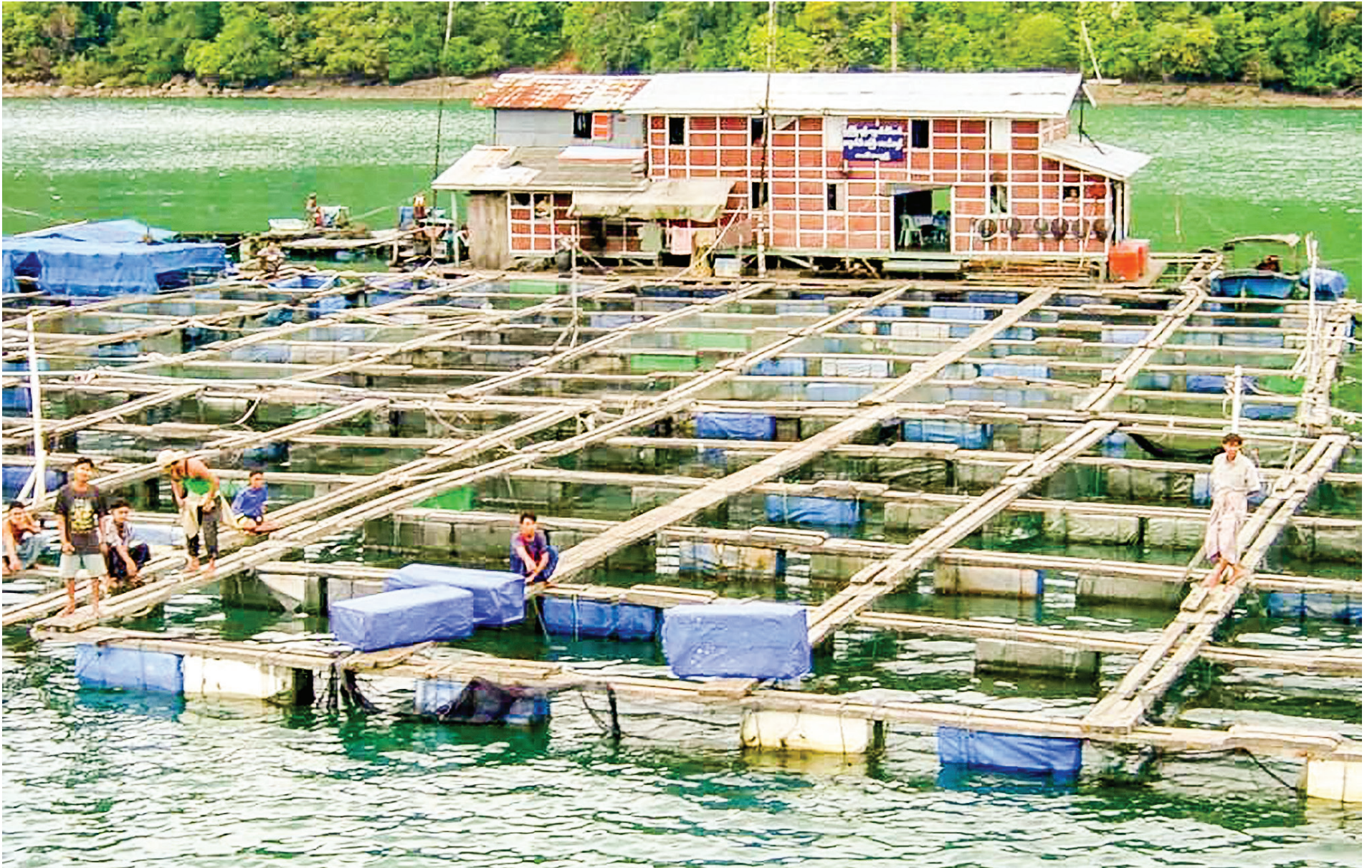
Fish are farmed in an artificial pond in Ayeyawady Region, where fish and shrimp farming businesses are likely to receive funding as part of an EU aquaculture project.