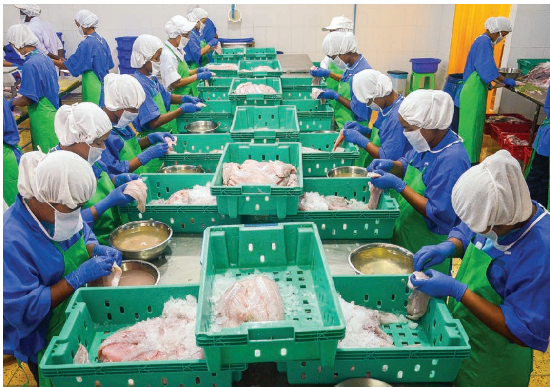
Workers processing fish at a marine product industry.

system so as to boost the country's fish and prawn farming sector.