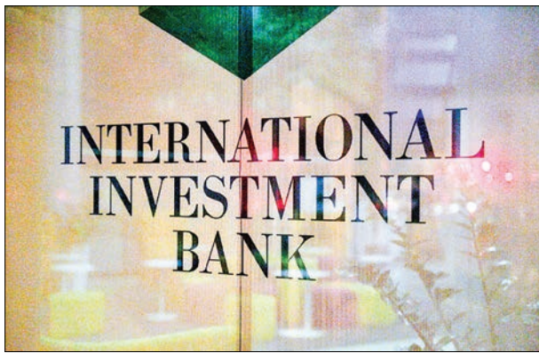
Politicians in both Hungary and abroad fear the bank is being used as a conduit of the Russian intelligence service.

ly seen as an arm of the Russian secret service," they wrote.