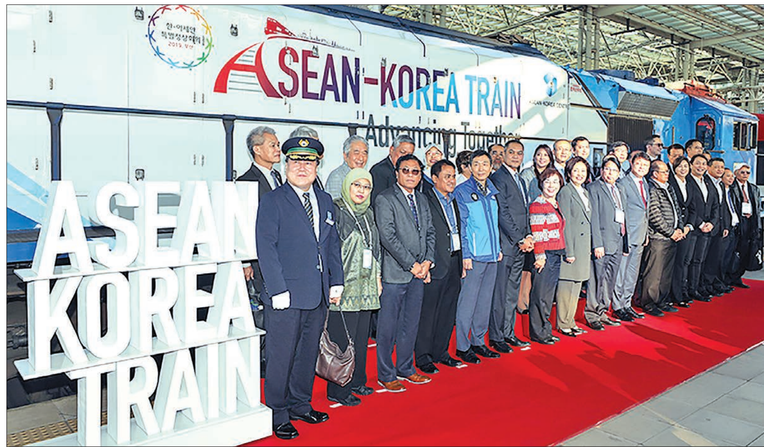
Participants pose at the launching ceremony for the ASEAN-Korea Train at Seoul Station in Seoul on Oct. 16, 2019, ahead of a special summit between South Korea and the 10-member Association of Southeast Asian Nations (ASEAN) set for Nov. 25-26 in the southeastern port of Busan.

The ASEAN-Korea train trip was intellectually stimulating and very enjoyable for all of us. It created a unique opportunity for all delegates to travel together, share knowledge, and develop a bond of friendship. This event embodied the fundamental 3P elements of the NSP – People, Prosperity and Peace. The train trip connected 200 people from ASEAN and South Korea with different backgrounds to include ministers, ambassadors, business people, academics, media professionals, artists, and youth. Over the course of the journey, the participants had many opportunities to interact with each other. We shared each other's cultures and histories. As such, all of