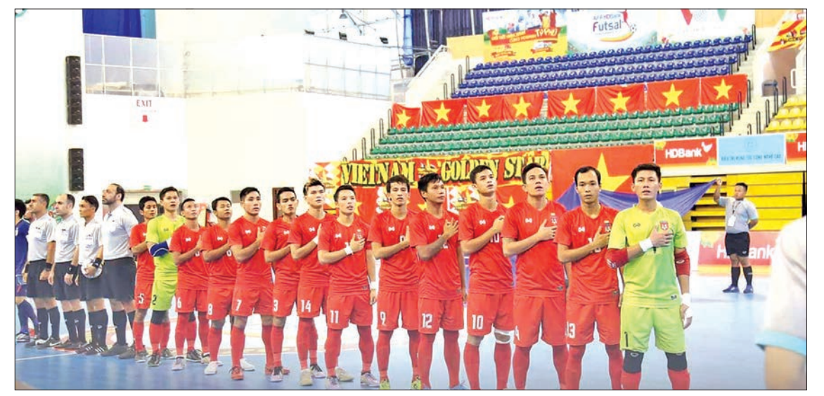
The Myanmar national futsal team sing the national anthem before the match against Thailand in the group stage of the AFF Futsal Championship 2019 in Ho Chi Minh City, Viet Nam.

THE Myanmar national futsal team will play against the Indonesian futsal team today in the semifinal of the ASEAN Football Federation (AFF) HD Bank Futsal Championship 2019 at the Phu Tho Indoor Stadium in Ho Chi Minh City, Viet Nam.