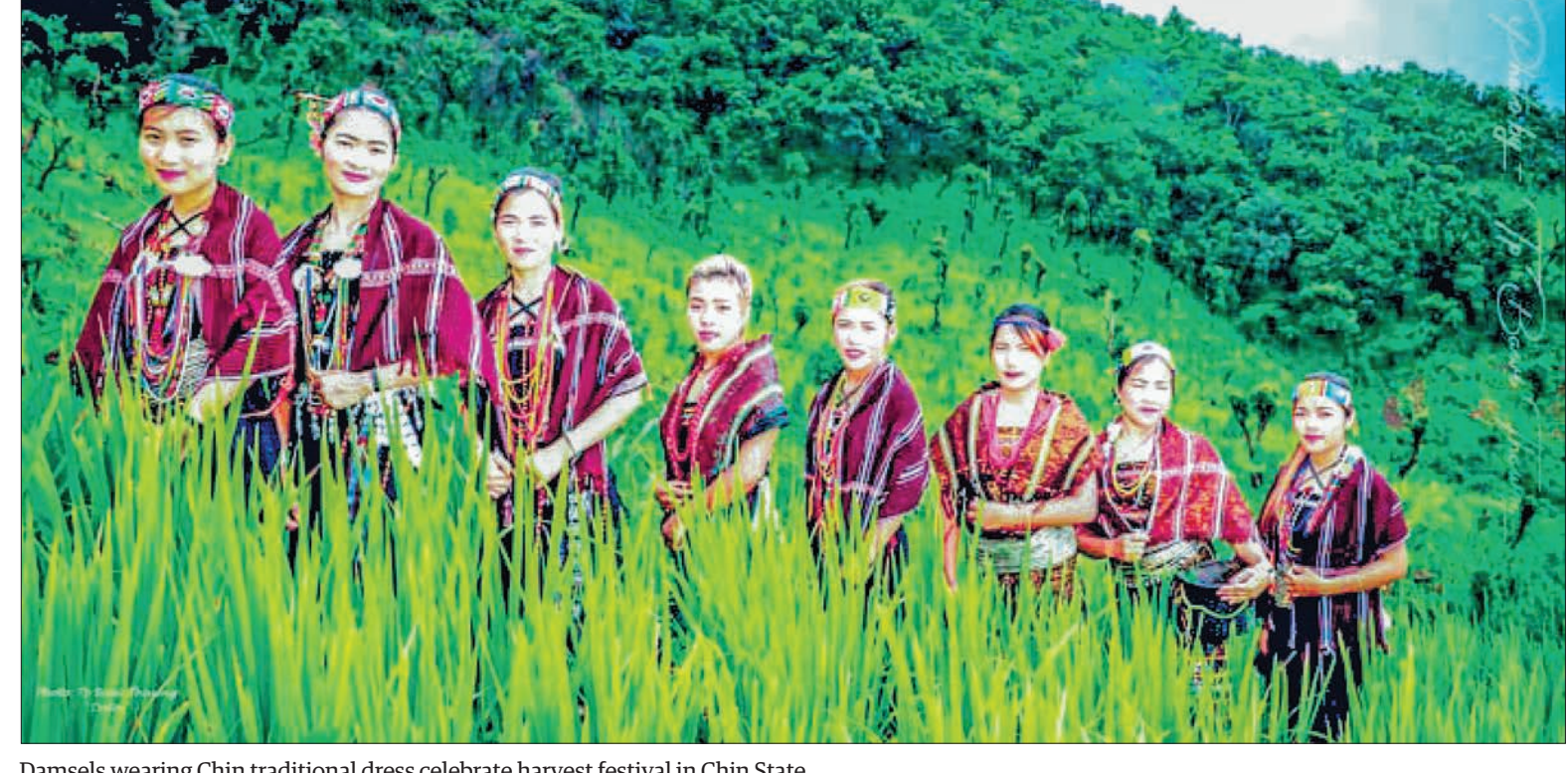
Damsels wearing Chin traditional dress celebrate harvest festival in Chin State

They were more interested in finding employment overseas a secure job overseas are living