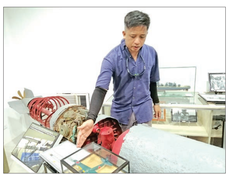
A local historain explains about some items on display at the Battle of Surigao Strait Museum.

Prayers were offered and wreaths were laid at a section of a public school identified as cremation site for up to some 500 Japanese naval personnel and soldiers who died when American forces, out to regain the Phil-