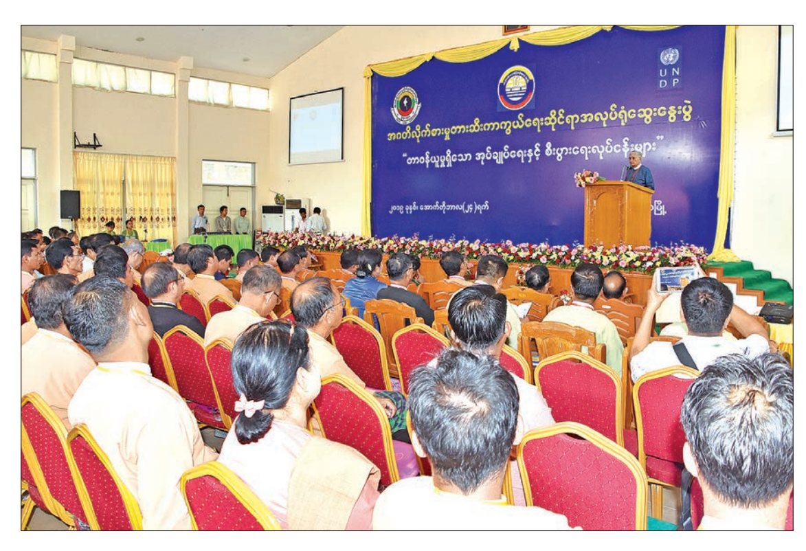
Anti-Corruption public workshop being convended in Monywa.