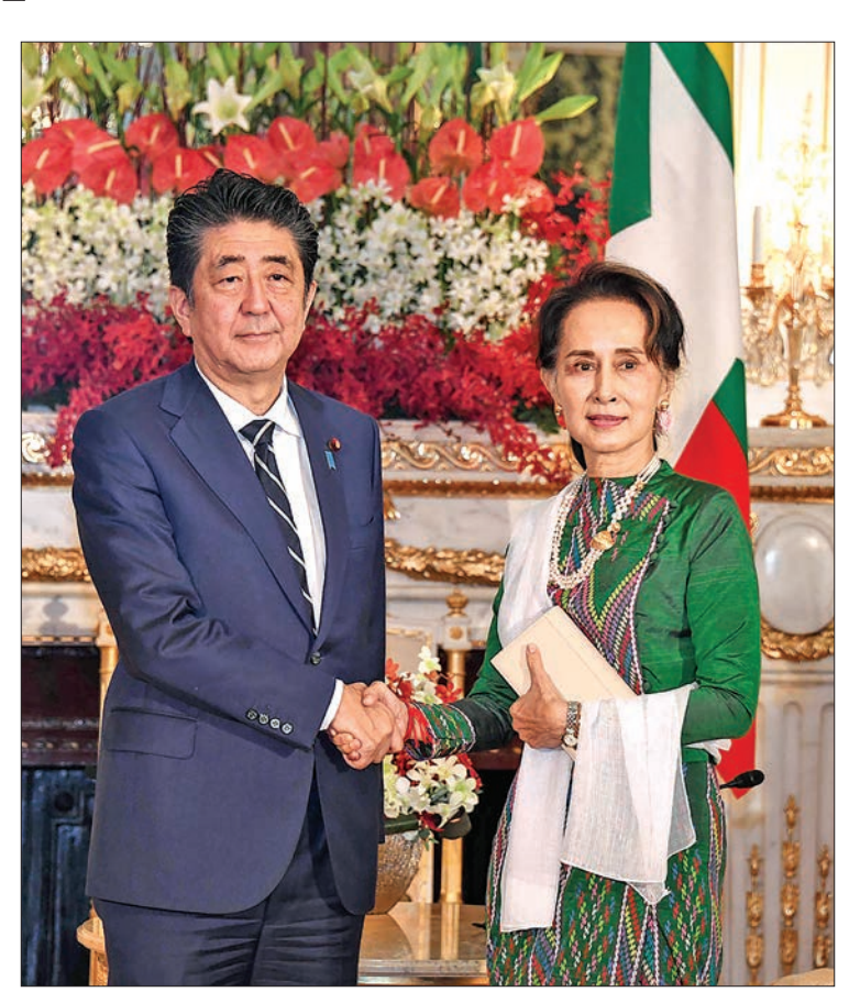
State Counsellor Daw Aung San Suu Kyi meets with Japanese Prime Minister Shinzo Abe at the State Guest House in Tokyo on 21 October.

Ministry of Foreign Affairs Nay Pyi Taw 24 October 2019