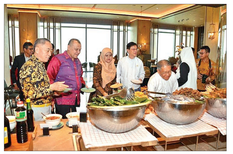
The Indonesian Embassy holds an Indonesian food festival yesterday with a reception and cultural performance at the Pan Pacific Hotel in Yangon.