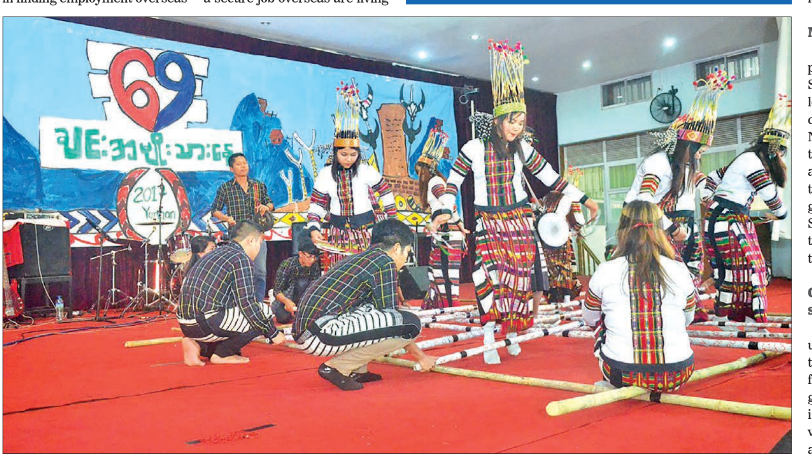
FILE PHOTO: Chin ethnic dancers perform traditional dance at a ceremony to mark the 69th Chin National Day in Yangon on 20 February, 2017.

circulation@globalnewlightofmyanmar.com) သတင်းစာမှာယူဇတ်ရှုလိုပါကဆက်သွယ်နိုင်ပါသည်။ 09-974424114 Circulation order is in easier way.