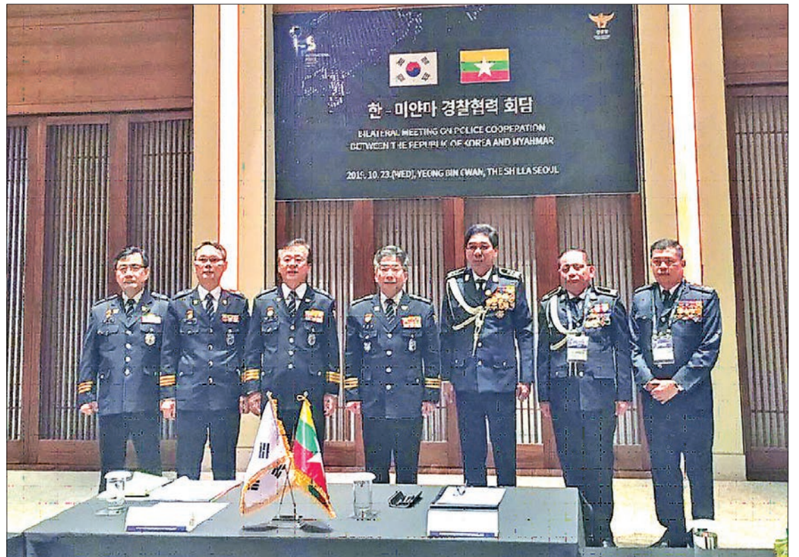
The Myanmar delegation is seen together with Korean police officers before the Bilateral Meeting on Police Cooperation between the Republic of Korea and Myanmar.