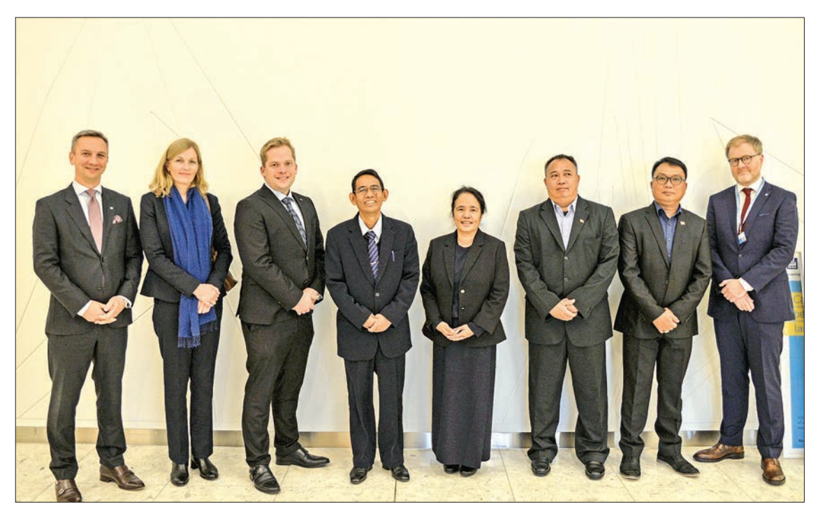
Myanmar delegation led by Union Minister Dr Aung Thu is seen together with officials of the Norway-based Yara International crop nutrition company.

DR Aung Thu, Union Minister for Agriculture, Livestock and Irrigation, held talks with officals of the Yara International headquarters in Oslo, Norway, on 22 October over development of agro sector in Myanmar.