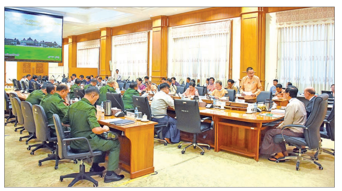
The joint committee meeting on amending the 2008 Constitution in progress.