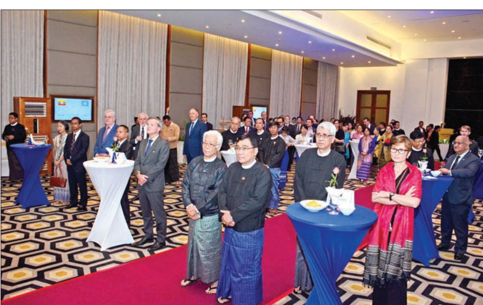
Union Minister U Thaung Tun reads out the message from the President of the Republic of the Union of Myanmar at the ceremony to mark the 74<sup>th</sup> Anniversary of the United Nations in Nay Pyi Taw.

It was then followed by a video clip presentation on the establishment and progress of the United Nations and the cooperation between Myanmar