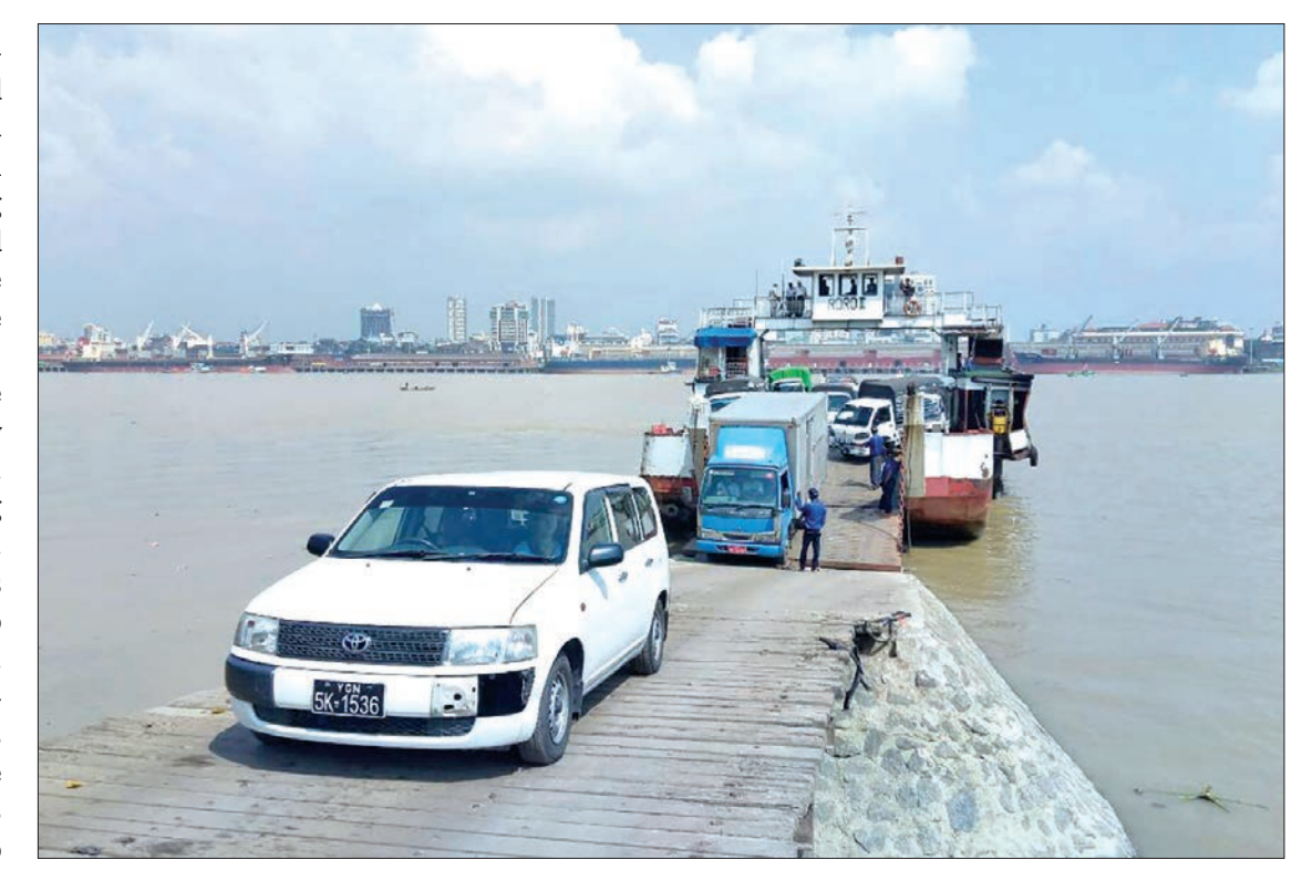
The Z-crafts are operating hourly from 5 am to 7 pm every day.

"Cars can save two hours' time driving to towns from Ayeyawady region through Wahdan and Dala.