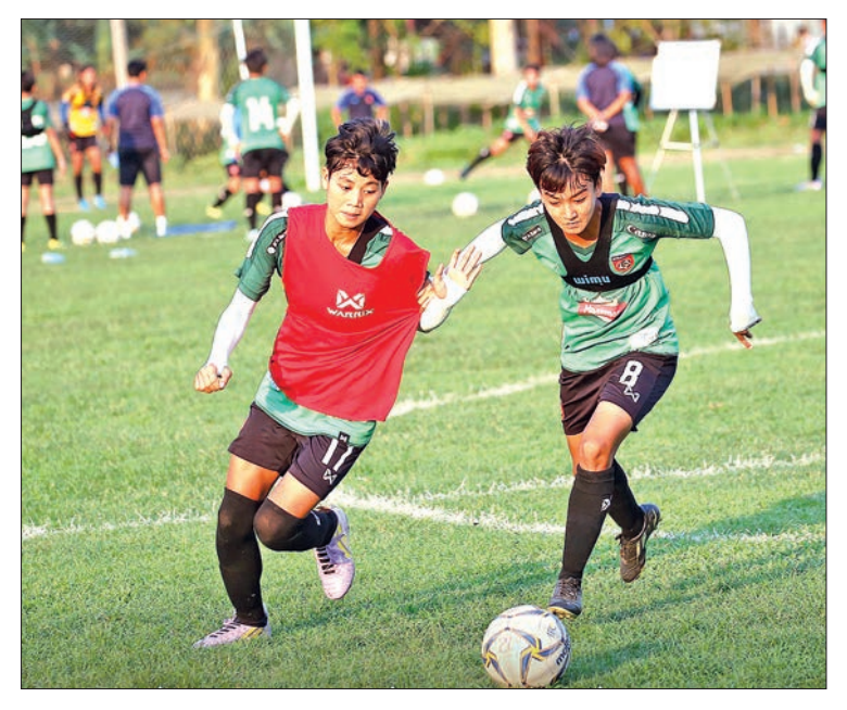
Myanmar U-19 women footballers train in Yangon ahead of the AFC U-19 Women's Championship 2019.

Myanmar will take on Asian football powerhouse Japan on 28 October, China PR on 31 October, and South Korea on 3 November.—Lynn Thit (Tgi)