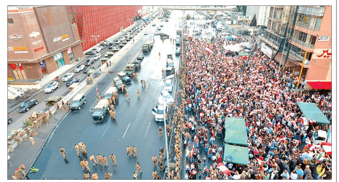
Protesters have cut major highways across Lebanon, crippling the capital Beirut and other cities.

"People think we're playing but we're actually asking for our most basic rights: water, food, electricity, healthcare, pensions, medicine, schooling," he told AFP.—AFP ■