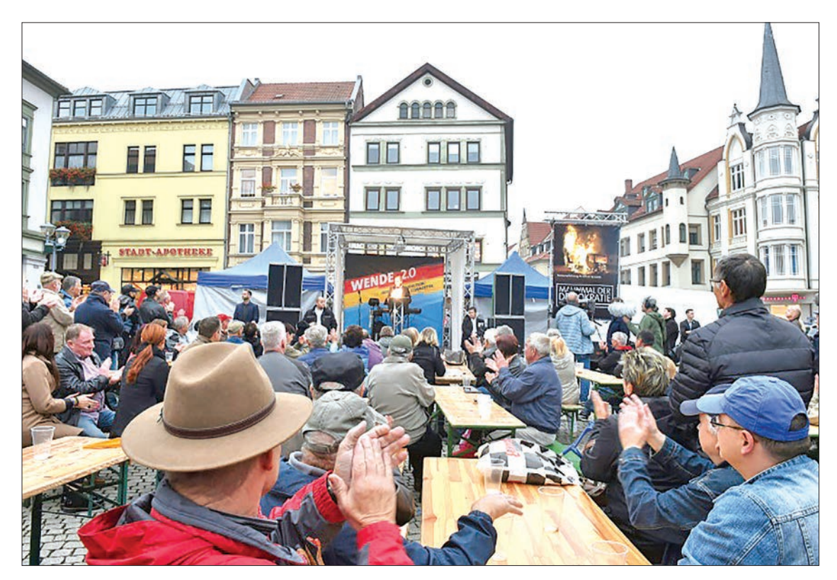
In regional elections in the eastern German state of Thuringia on Sunday, the far-right Alternative for Germany (AfD) party faces a key test of support.

ERFURT (Germany) — Germany's far-right AfD party faces a key test of support in a state election in former communist east Germany on Sunday, following national outrage over a deadly shooting at a synagogue.