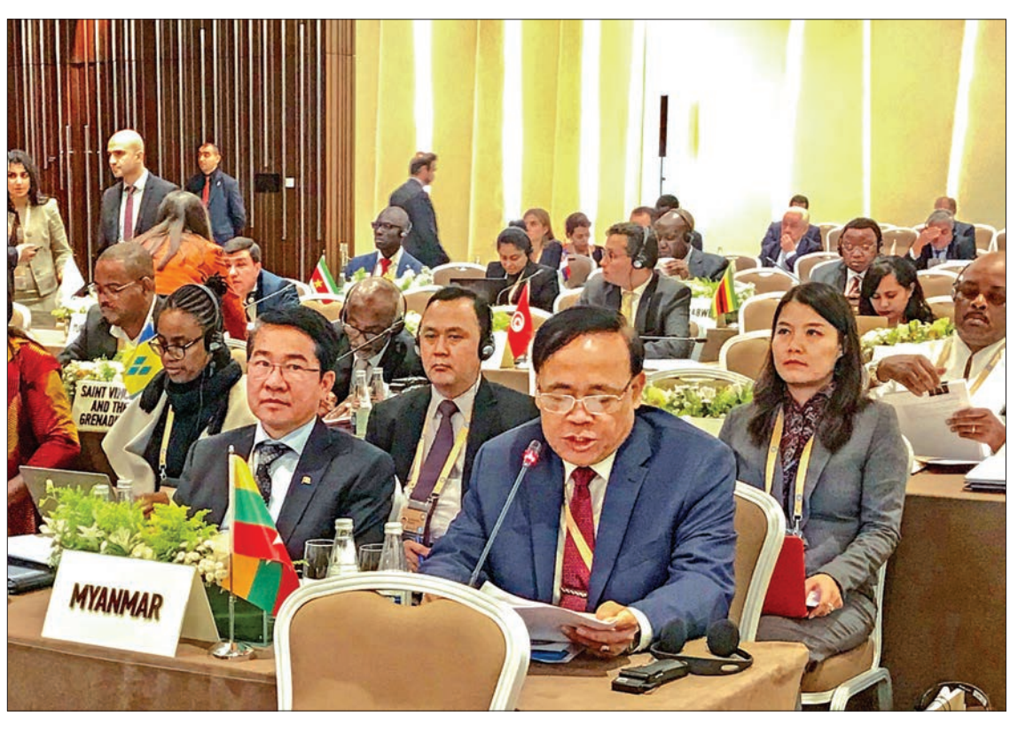
Union MInister U Kyaw Tin delivers the statement at the Preparatory Ministerial Meeting of the 18<sup>th</sup> Non-Aligned Movement on 23 October in Baku, Azerbaijan.

Union Minister U Kyaw Tin pointed out that the dream of the Movement to enjoy the right to determine their own destiny or resolve their own internal problems in their own way is still far from realization. The power of globalization made the national boundaries blurred and encroached upon the sovereignty and independence of nations.