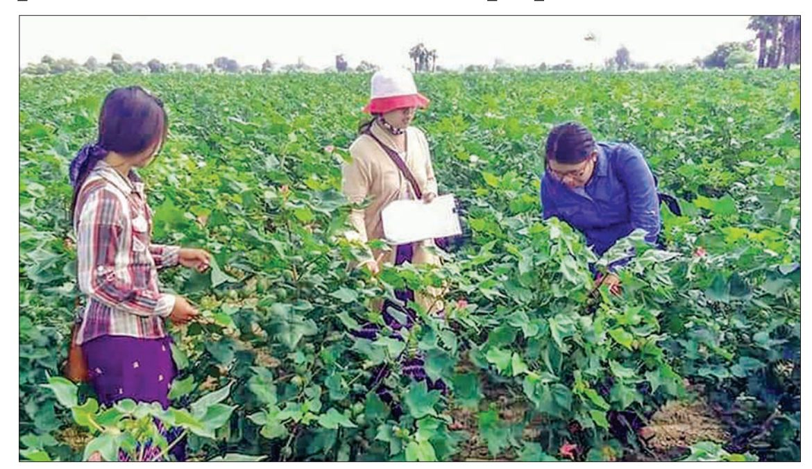
The Township Agriculture Department is currently distributing seeds of long staple cotton with the aim to increase the acreage in Meiktila Township.

THE yield of long staple cotton, grown on 50 acres at the agriculture service centre in Kantaung Village, Meiktila Township, has reached 750 viss (a viss equals 1.6 kg) per acre.