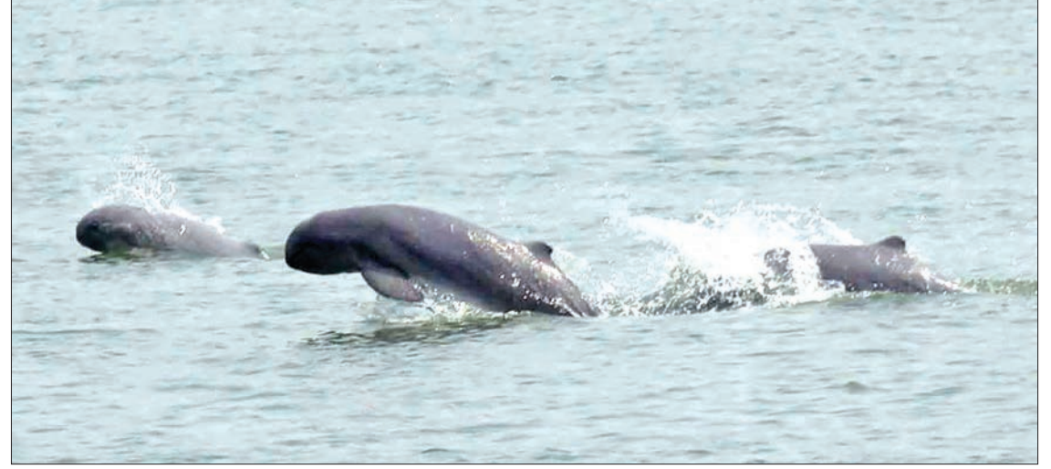
The baby Ayeyawady dolphins were spotted in the conservation area between Mandalay and Kyaukmyaung.