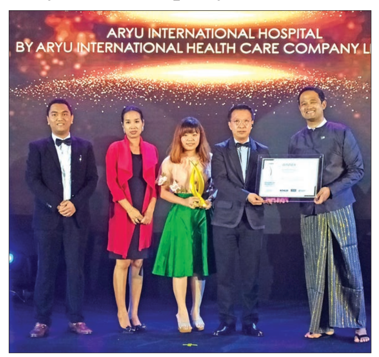
The 5th Property Guru Myanmar Property Awards 2019 ceremony held on 23 October in Yangon to honour the best construction companies in Yangon Region.

The company constructed Gamone Pwint Wholesale Mall between Myanmar Gone Yi and Bo Min Yaung