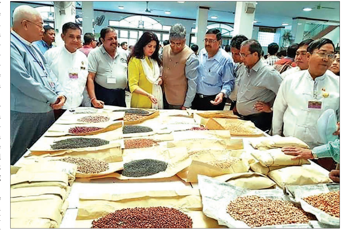
Indian Ambassador and party observe pulses trade at the Mandalay wholesale market.

Myanmar is importing raw materials for garments, textiles, and traditional loom businesses from India. Therefore, the MRCCI called for technical as-