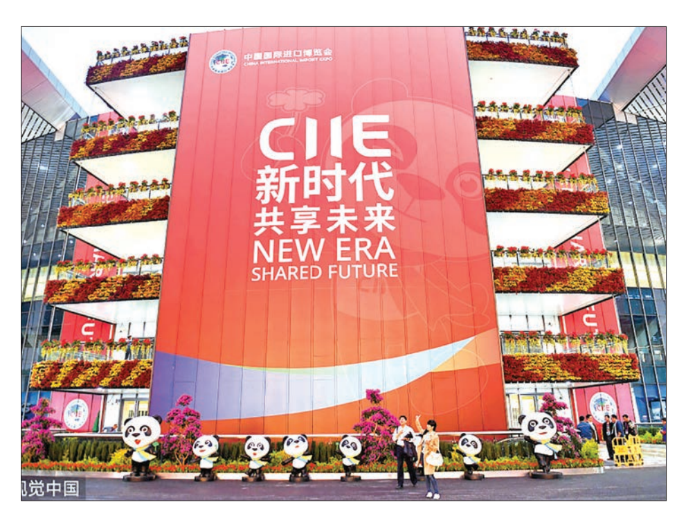
FILE PHOTO: The first China International Import Expo (CIIE) in Shanghai.

Organized by Greater Houston Partnership, a delegation of more than 20 business leaders in Greater Houston will go to China attending the second CIIE early next month. —Xinhua