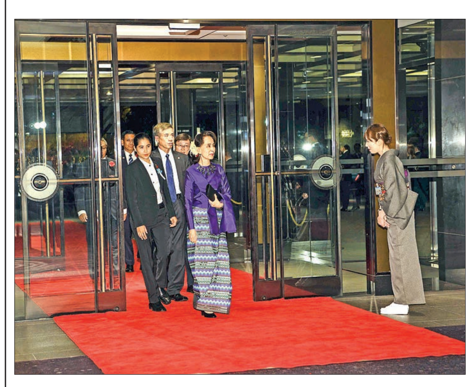
State Counsellor Daw Aung San Suu Kyi arrives for Emperor Naruhito's enthronement banquet at Hotel New Otani in Tokyo yesterday.