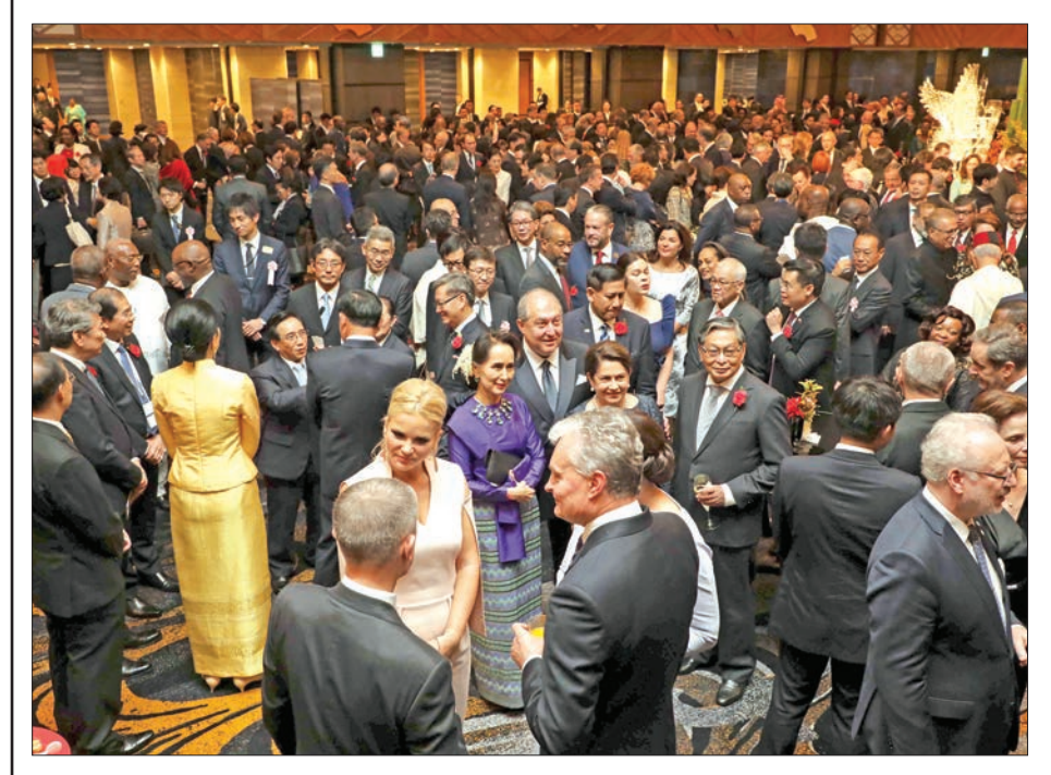
State Counsellor Daw Aung San Suu Kyi socializes with royal and high-ranking dignitaries during Emperor Naruhito's enthronement banquet in Hotel New Otani, Tokyo.