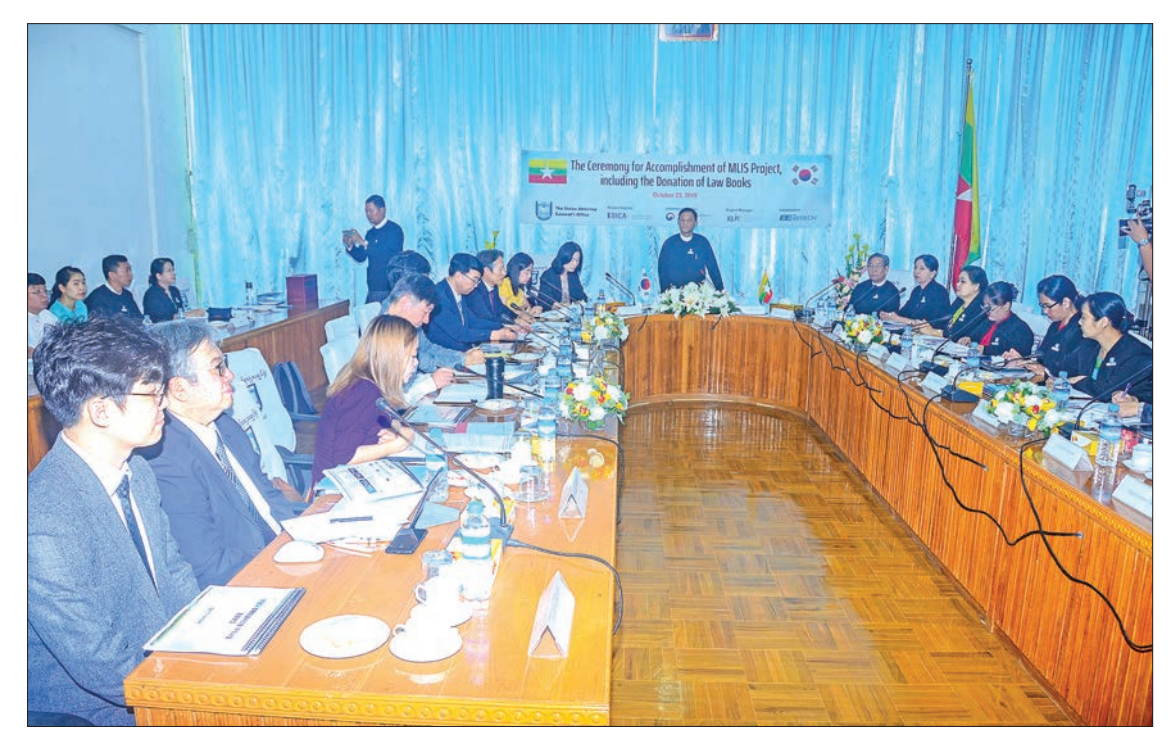
Union Attorney-General U Tun Tun Oo addresses the ceremony for accomplishment of Myanmar Law Information System (MLIS) project in Nay Pyi Taw yesterday.

Sang Su, the Director General of MOLEG presented three sets of law books for 2,788 Subordinate Legislation of Union Laws.