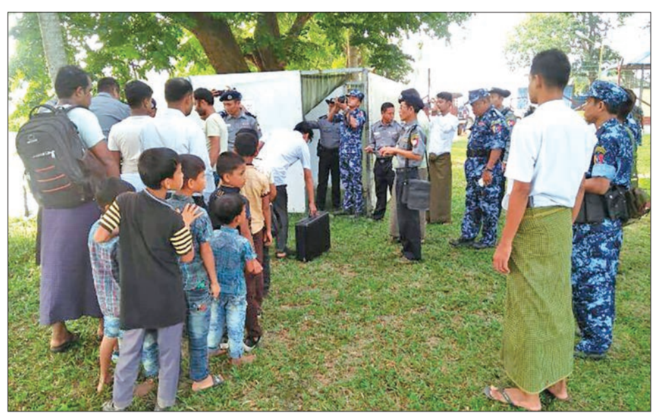
Immigration officers conduct procedures for scrutinizing the returnees at Taung Pyo Letwe Reception Centre in Maungtaw.

After handing them over to the respective village administrators they left the centre at 4 pm.— Zaw Zaw San (IPRD) (Translated by Aung Khin)