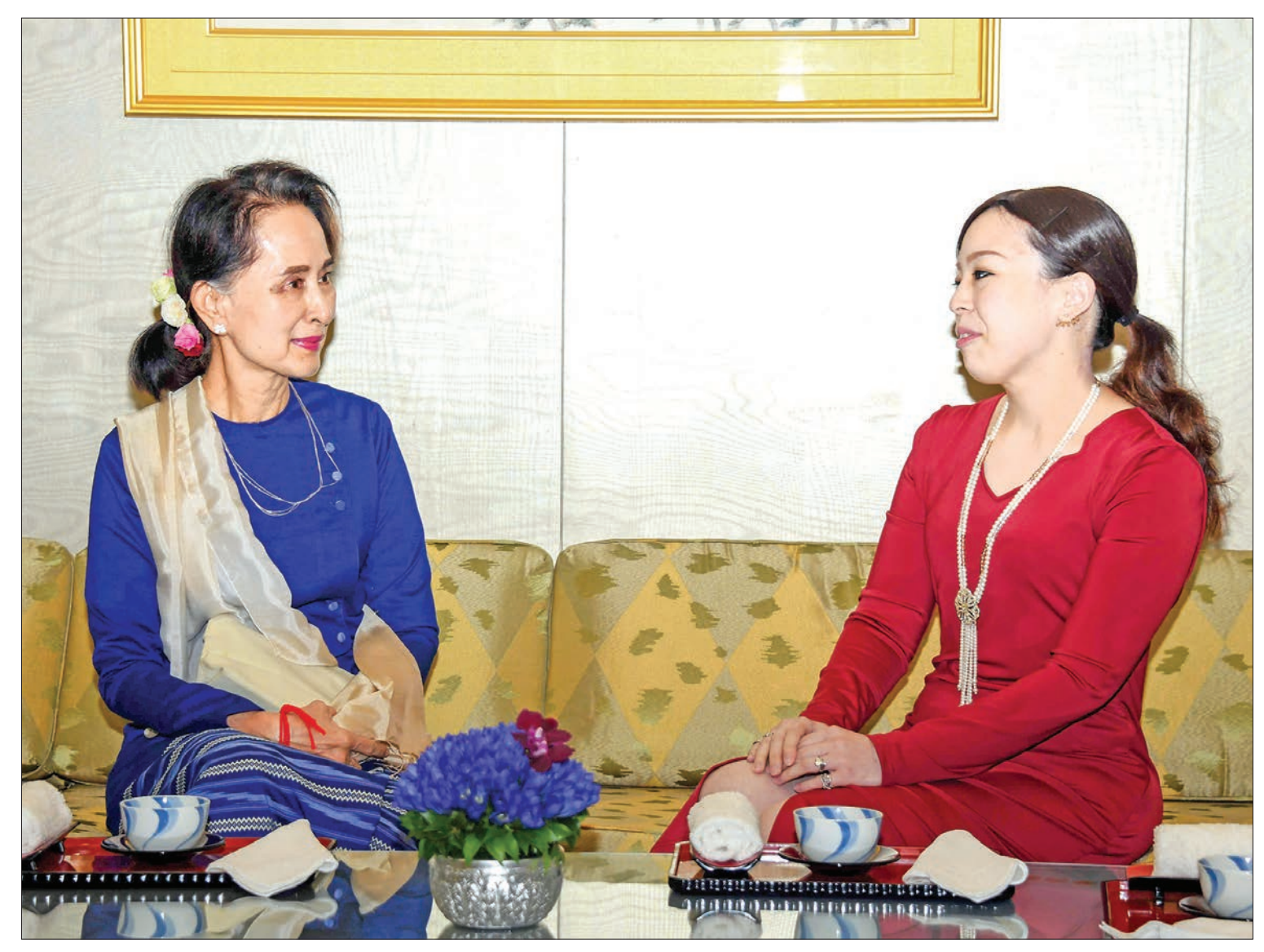
State Counsellor Daw Aung San Suu Kyi meets with Princess Yoko at the State Guest House in Tokyo, Japan yesterday.

State Counsellor attended a banquet for newly enthroned