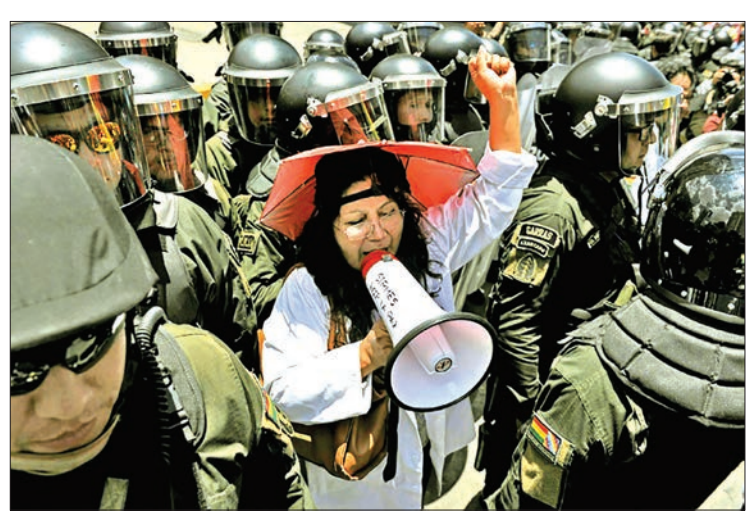
Opposition supporters reacted with fury on Monday to delayed results that showed Morales, Latin America's longest-serving president, edging towards the 10 percentage-point margin.

The government on Tuesday asked the OAS to conduct an audit of the vote counting process as soon as possible.—AFP ■