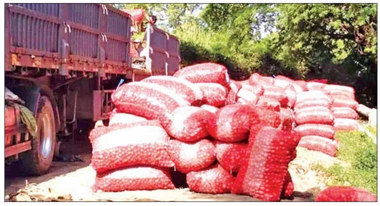
Workers unload bags of onions from a truck at the depot in Kyaukpadaung.

At present, new onions are selling for just K600 per viss. The price of onions increased to K700 per viss in September and K1,000 in October, an increase of K300 within a month, according to the Chogyi onion depot.—Ko Htein (Ngathatyout) (Translated by Hay Mar)