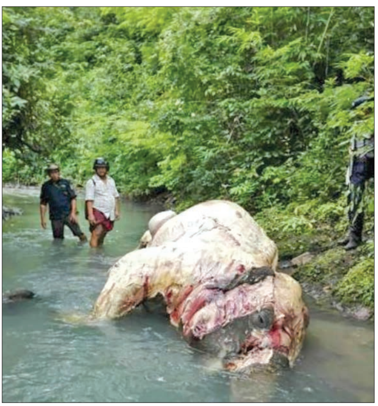
An elephant carcass is found completely skinned in Ngapudaw Township, Ayeyawady Region.