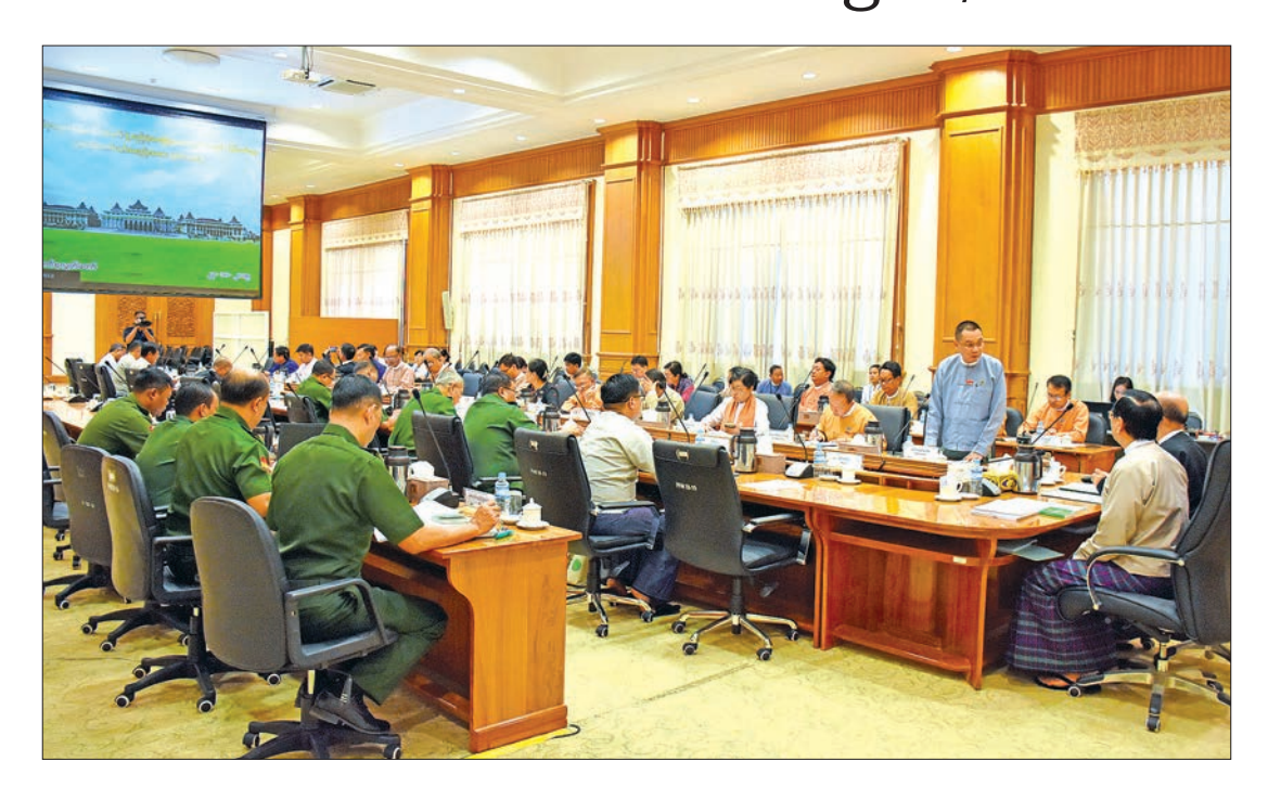
Meeting 48/2019 of the Joint Committee on Amending the 2008 Constitution held in progress in Nay Pyi Taw yesterday.

MEETING 48/2019 of the Joint Committee on Amending the 2008 Constitution was held at Pyidaungsu Hluttaw Building D in Nay Pyi Taw yesterday morning.