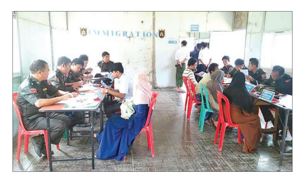
Immigration officers issue national verification cards to returnees at Taung Pyo Letwe Reception Centre in Maungtaw Township, Rakhine State.

A total of 29 persons comprising five families returned on their own volition to Taung Pyo Letwe Reception Centre in Maungtaw Township, Rakhine State at 8: 15 am on 22 October morning.