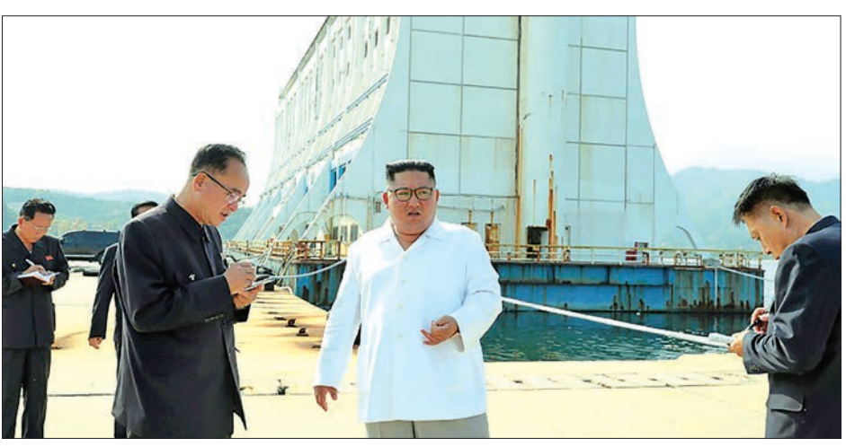
Mount Kumgang tours came to an abrupt end in 2008 after a North Korean soldier shot dead a Southern tourist who strayed off the approved path.

Pyongyang has long wanted to resume the lucrative visits, but they would now violate international sanctions