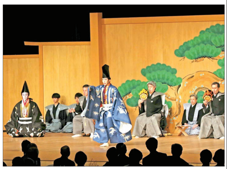
Japanese actors perform a kabuki drama at Emperor Naruhito's enthronement banquet hosted by Prime Minister Shinzo Abe in Hotel New Otani, Tokyo.