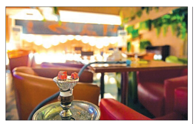
A hooka (shisha) is pictured at a restaurant in Saudi Arabia's western city of Jeddah on 20 October 2019.