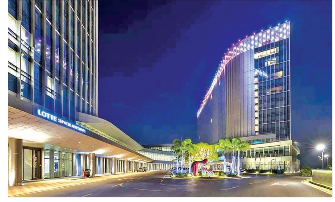
Lotte Hotel located near the scenic Inya Lake in Yangon.

Additionally, a Community-Based Tourism (CBT) site was created in Kyaikthale Village in Twantay Township, Yangon Region in February, 2017. More than 2,000 local and foreign trav-