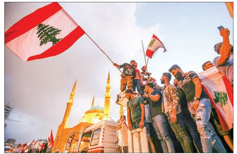
Hundreds of thousands of people have joined protests demanding a sweeping overhaul of Lebanon's political system. PHOTO: AFP

"We want the fall of the regime," they went on.—AFP