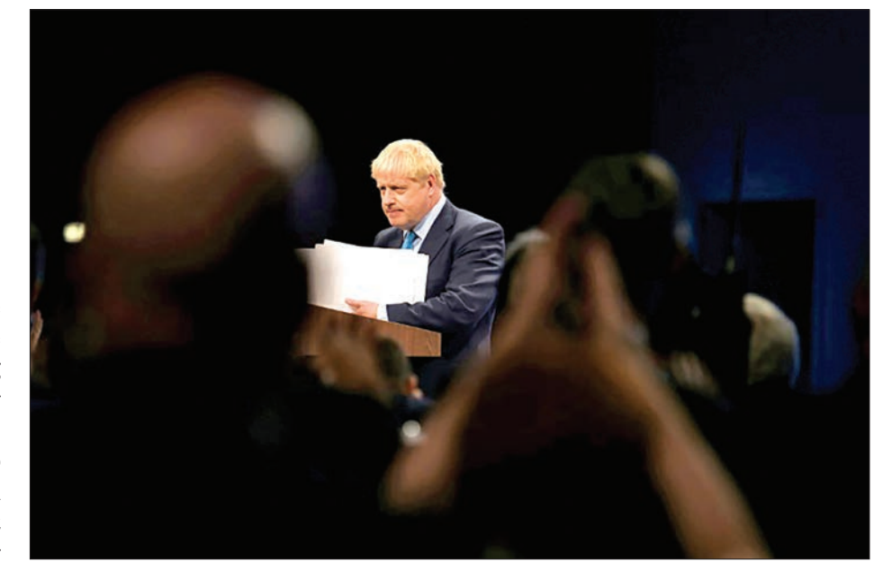
Johnson's foes are forging new alliances and trying to attach amendments.

The only one he actually signed said an "extension would damage the