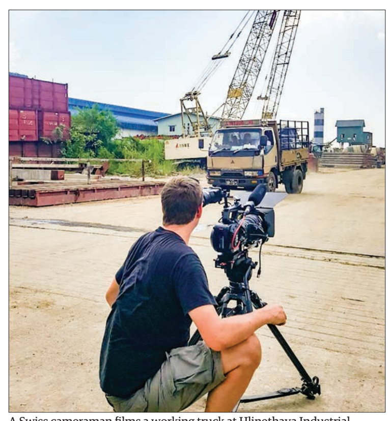
A Swiss cameraman films a working truck at Hlinethaya Industrial Zone.

On October 18 and 19, the film crew shot scenes at Shwedagon and Sule pagodas, people going about in Bogyoke Market and Myanmar Plaza, and how Ericsson Myanmar and Telenor Myanmar operate communication activities in their offices. They will be filming students studying in Yangon Technological University in Insein Township today. Sweden's Ericsson and Telenor are teaming up successfully in Myanmar's telecommunication arena. Their progress, Myanmar's natural en-