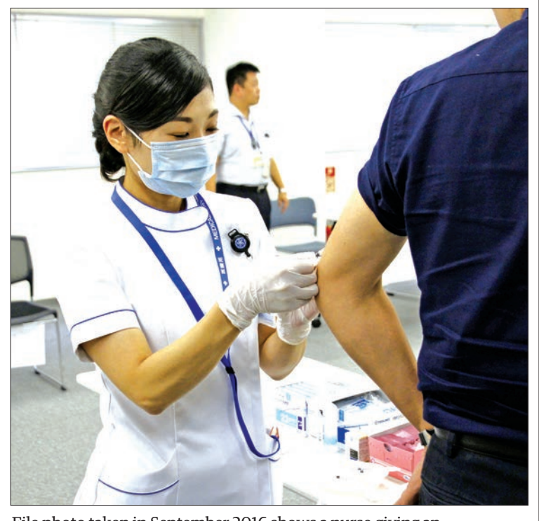
File photo taken in September 2016 shows a nurse giving an immunization shot in Osaka Prefecture.

Local governments need to "revise their health care plans and strive to secure skilled workers in line with the actual situation," an official of the ministry said. —Kyodo News ■