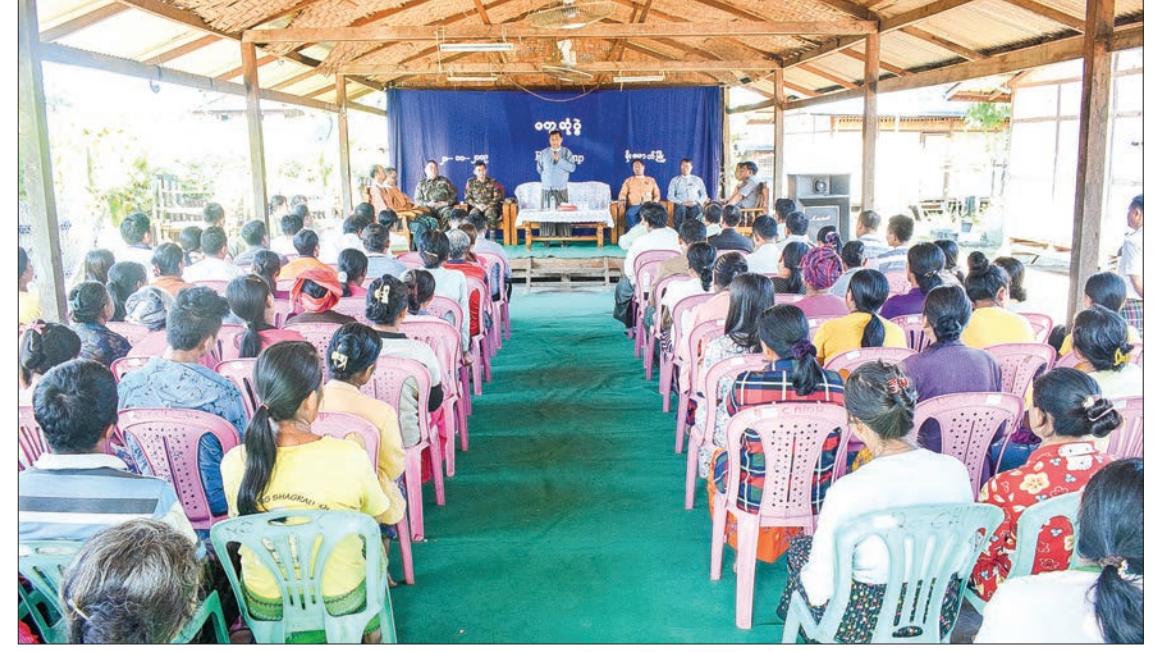
Deputy Minister for Social Welfare, Relief and Resettlement U Soe Aung meeting with displaced persons at Year 2000 Baptist IDP camp in Bhamo yesterday.