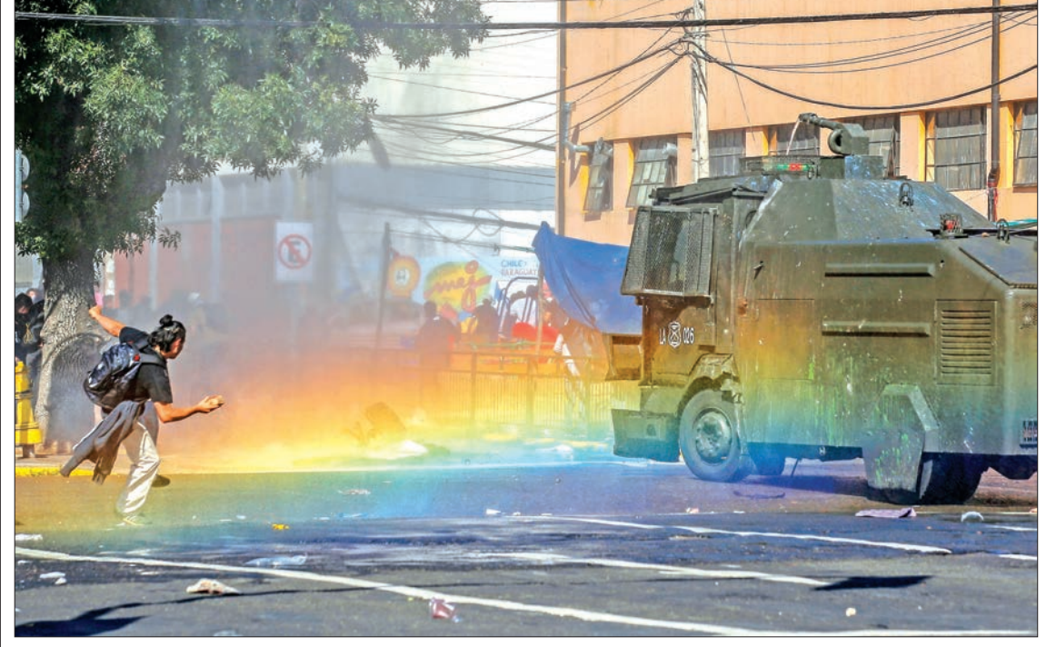
Clashes in Chile have seen police and military fire tear gas and water cannon against protesters. PHOTO: AFP

Soldiers, though, patrolled outside metro stations and military vehicles were parked in streets near the presidential palace as tensions remained high.—AFP