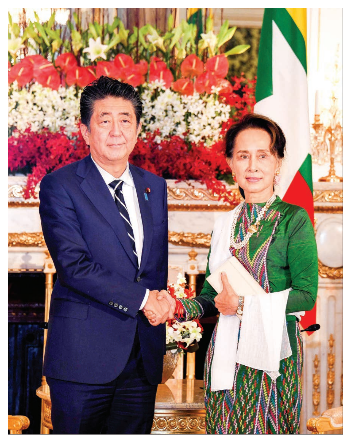
State Counsellor Daw Aung San Suu Kyi shakes hands with Prime Minister of Japan Mr Shinzo Abe at the State Guest House in Tokyo, Japan yesterday.

speech of State Counsellor. Secure investment opportunities in Myanmar