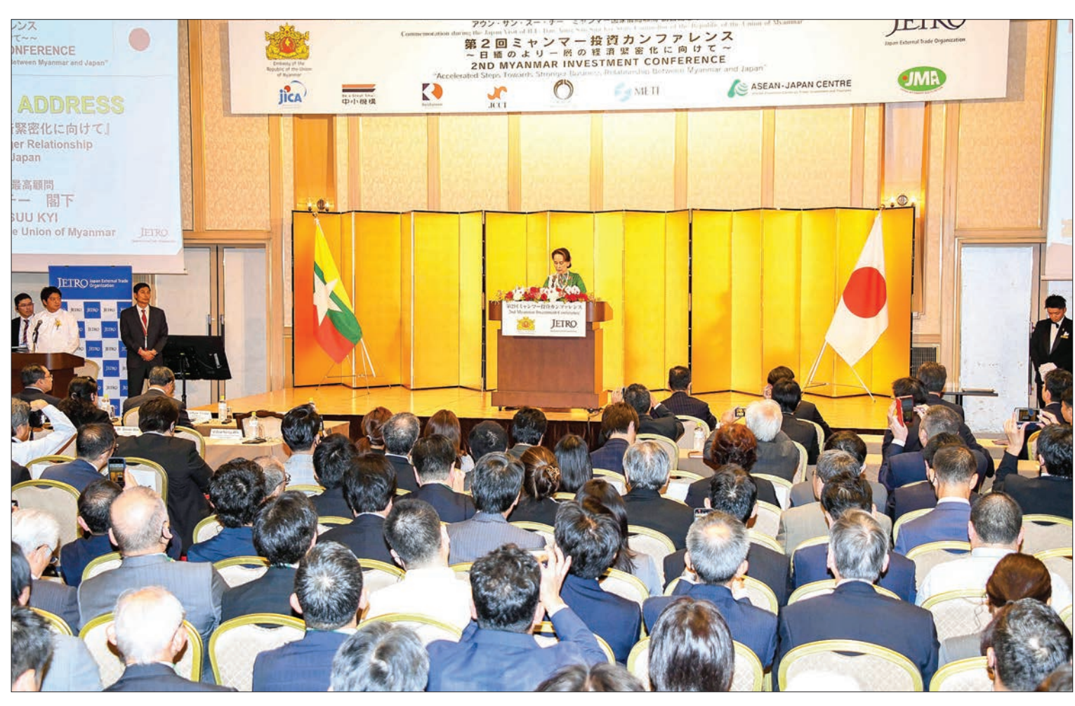
State Counsellor Daw Aung San Suu Kyi delivers the speech at the 2<sup>nd</sup> Myanmar Investment Conference in Tokyo, Japan yesterday.

We in Myanmar believe that quality investment, one that is responsible and sustainable, can and must play a role, and it is for this reason that I value forums such as this. We can offer participants a chance to capitalize on Myanmar's new found economic vibrancy. At the same time, it gives us an opportunity to