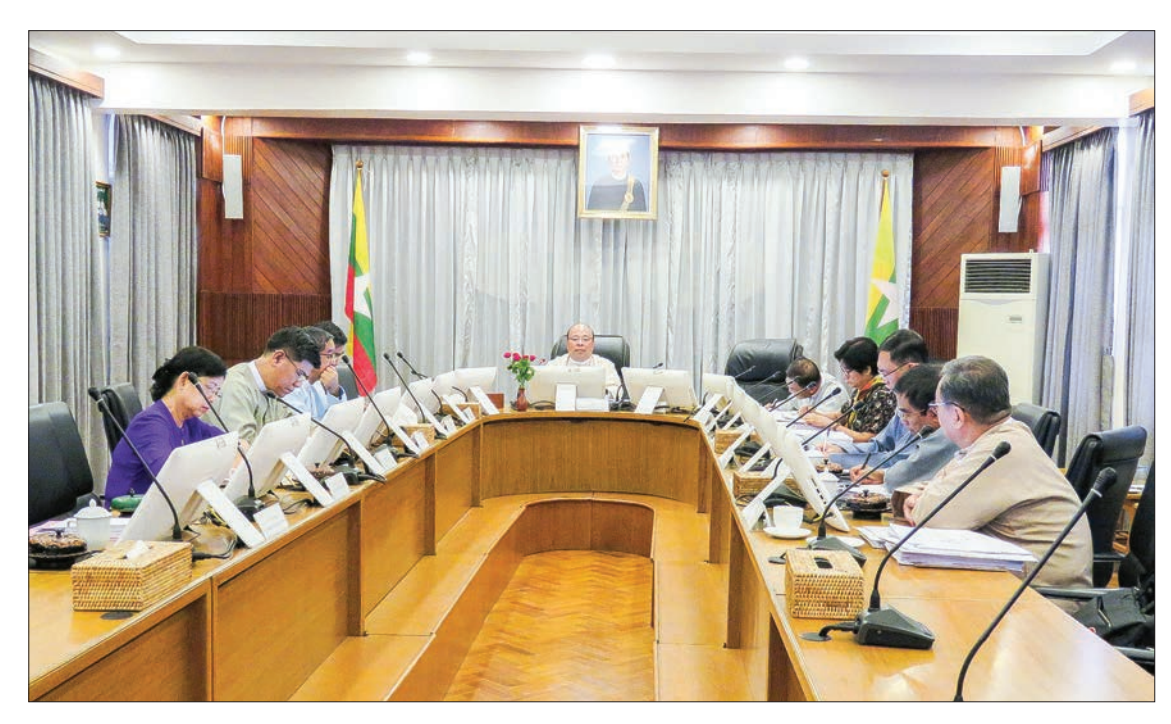
MIC Chairman U Thaung Tun and members discuss the approval of eight projects worth over hundreds of million of US dollars during a meeting at their office in Yangon.

The top investment sector is oil and gas, which accounts for 27.38 per cent of the total permitted foreign investment, followed by the power sector (25.87 per cent), and the manufacturing sector (14.08 per cent).—MNA