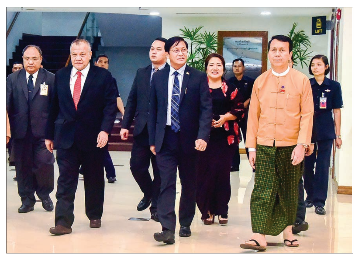
Vice President U Henry Van Thio welcomed back by Yangon Region Chief Minister U Phyo Min Thein and officials at the Yangon International Airport, yesterday.

The Vice President and party arrived at Yangon International Airport at 5:15 pm. They were welcomed back by Yangon Re-