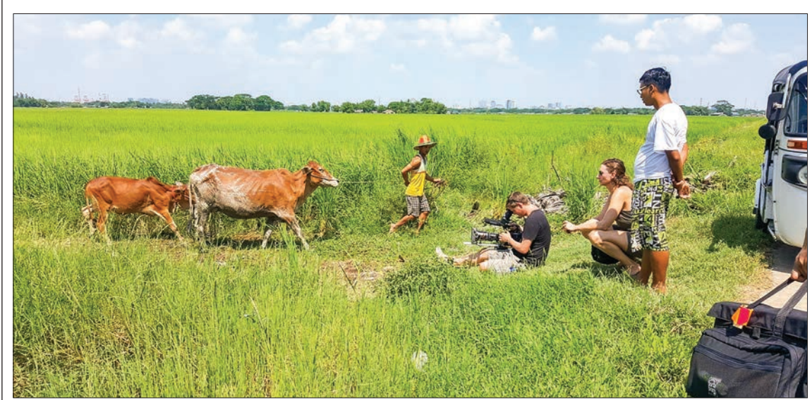
Swiss-based Seventy Agency films farmers in Dala Township.