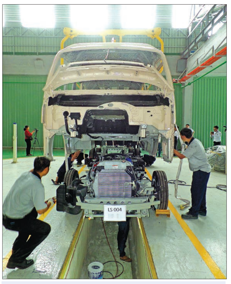
Workers assembling a mini bus at Daewoo Bus Myanmar Factory in Mingaladon Township, Yangon.

"Although foreign investors have entered Myanmar's automobile manufacturing industry, most of them are producing only family cars. Fewer trucks and buses are being manufactured. There is no difference in the tax levied on imported CBU (Completely