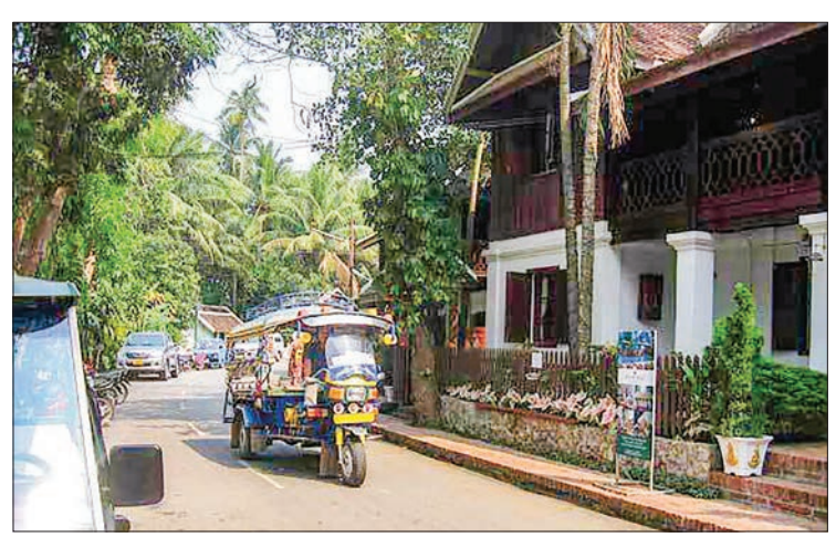
An undated photo shows a street in the ancient town of LuangPrabang in Laos. Nippon Koei Co. will cooperate in the town's smart city project with details slated to be set by 2020.

LuangPrabang is among 26 pilot cities in the ASEAN smart city program. Nippon Koei also agreed with another pilot city, Makassar on Sulawesi Island in Indonesia, to cooperate in the program.— Kyodo News