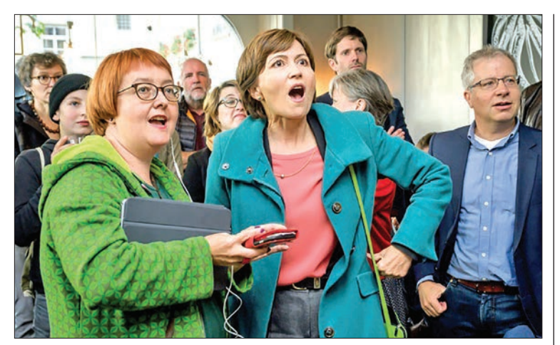
Green Party president RegulaRytz, centre, said the results marked a "tectonic shift".

22 OCTOBER 2019 THE GLOBAL NEW LIGHT OF MYANMAR WORLD 1.