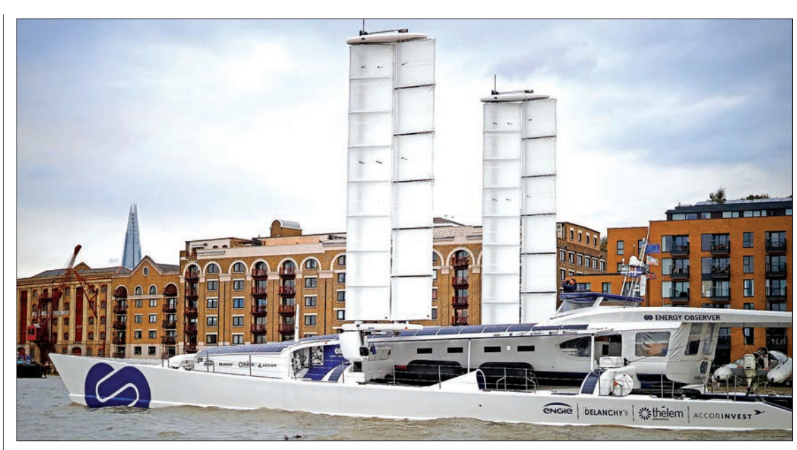
The first ever hydrogen-powered boat, the Energy Observer, sails on the River Thames in central London on 3 October 2019, one stop on it's round-the-world voyage.