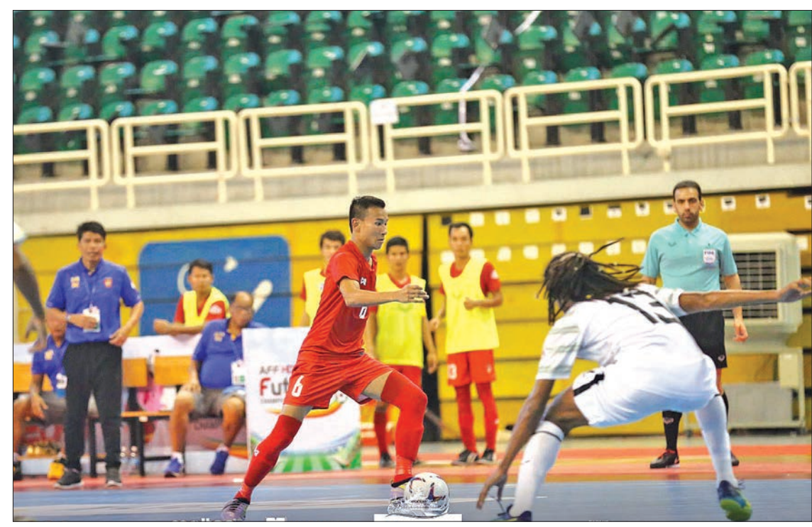
The Myanmar futsal player (red) and the Timor-Leste player (white) vie for the ball at the Phu Tho Indoor Stadium in Ho Chi Minh City, Viet Nam on 21 October.

The winner of Group A and the runner-up of Group B will meet in the semifinals, scheduled for 2 p.m. on 25 October. Meanwhile, the winner of Group B and the runner-up of Group A will meet at 5 p.m.