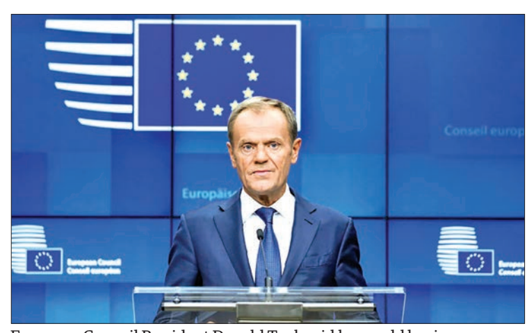
European Council President Donald Tusk said he would begin consulting EU leaders 'on how to react' - a process one diplomat said could take a few days.

The Conservative leader sent a second, signed letter insisting he was not seeking an extension to the Brexit deadline, which has