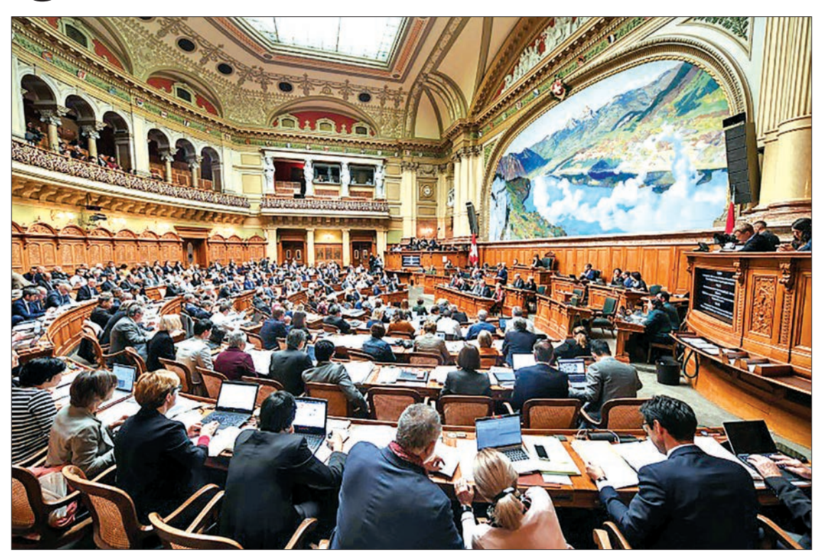
Switzerland is electing members of the House of Representatives and the Senate for the next four years.

GENEVA—Switzerland was counting votes on Sunday in an election that could see unprecedented gains for parties demanding bold climate action and a possible slip for the anti-immigrant right-wing.