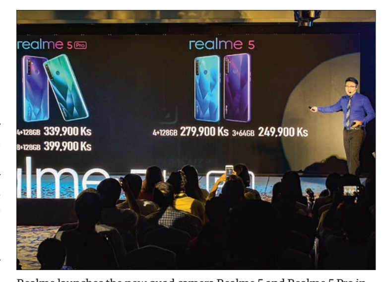
Realme launches the new quad camera Realme 5 and Realme 5 Pro in Yangon on 17 October.

By comparison, the 5 Pro has a 4,035mAh battery (which is still rather large), a 6.3-inch FHD+ (1,080 x 2,340) display,