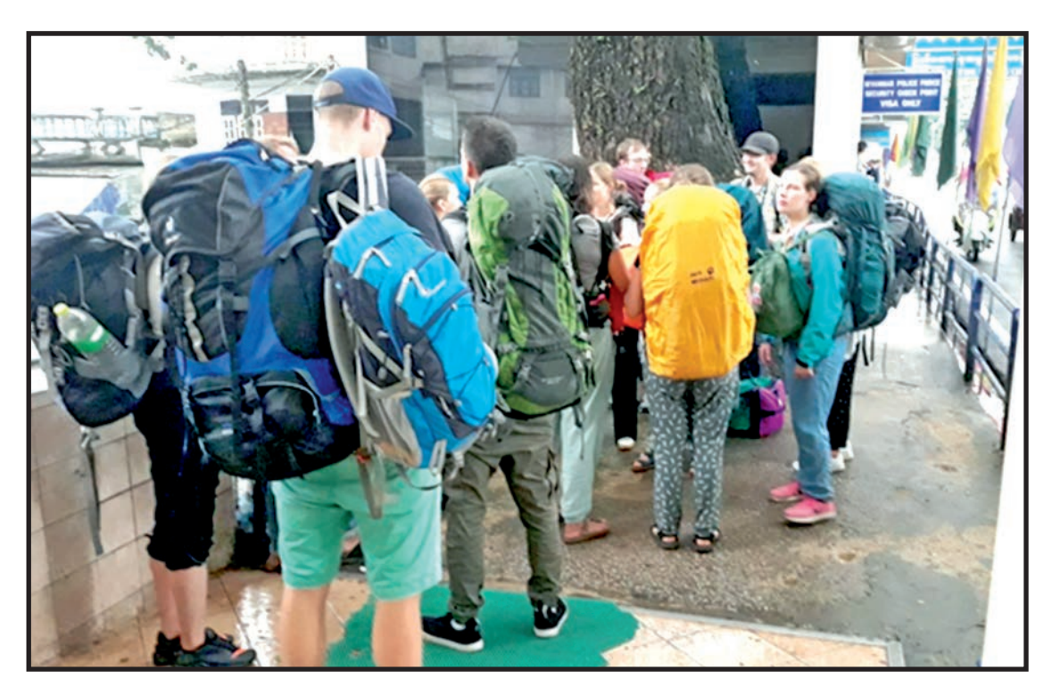
The number of tourists who visit Myanmar via Tachilek border checkpoint reaches 943,831 in total. PHOTO:

The foreign visitors entered Myanmar via Tachilek to visit well-known destinations in Mongphyat and Kengtung on a one-day visit or overnight trip. The top locations for both day-trippers and