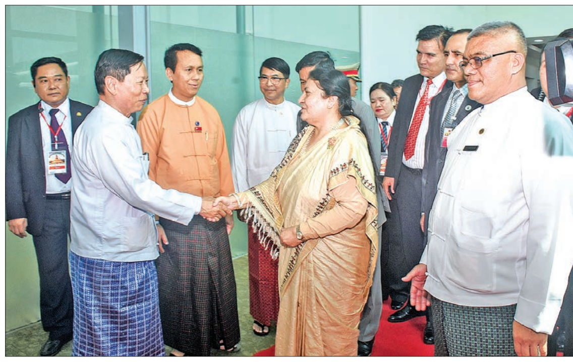
Union Minister Thura U Aung Ko sees off President of the Federal Democratic Republic of Nepal, Mrs Bidya Devi Bhandari yesterday.