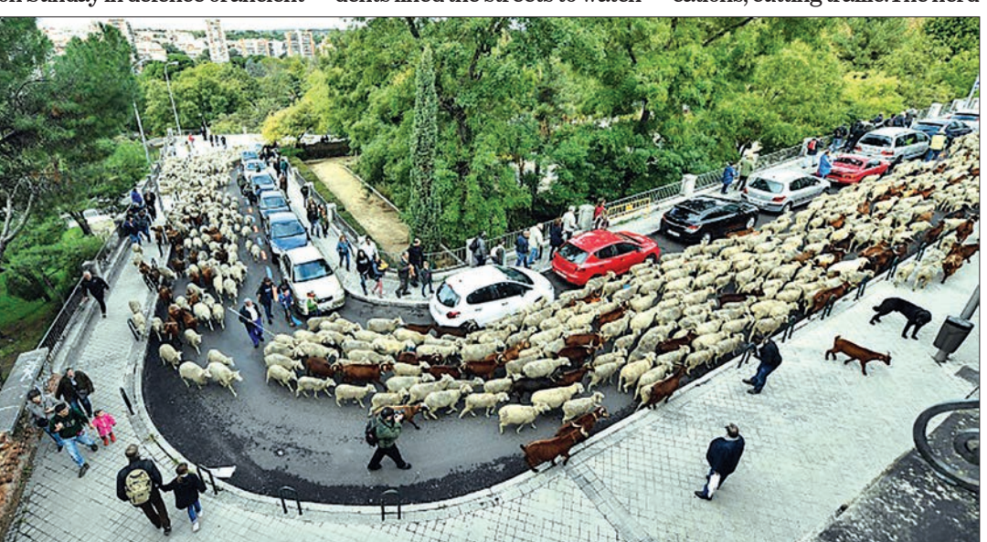
Every year since 1994 sheep farmers have paraded their livestock through the city along a route that once cut through undeveloped countryside on their way to winter grazing pastures in southern Spain.

as the bleating, bell-clanking parade passed the Spanish capital's most emblematic locations, cutting traffic. The herd