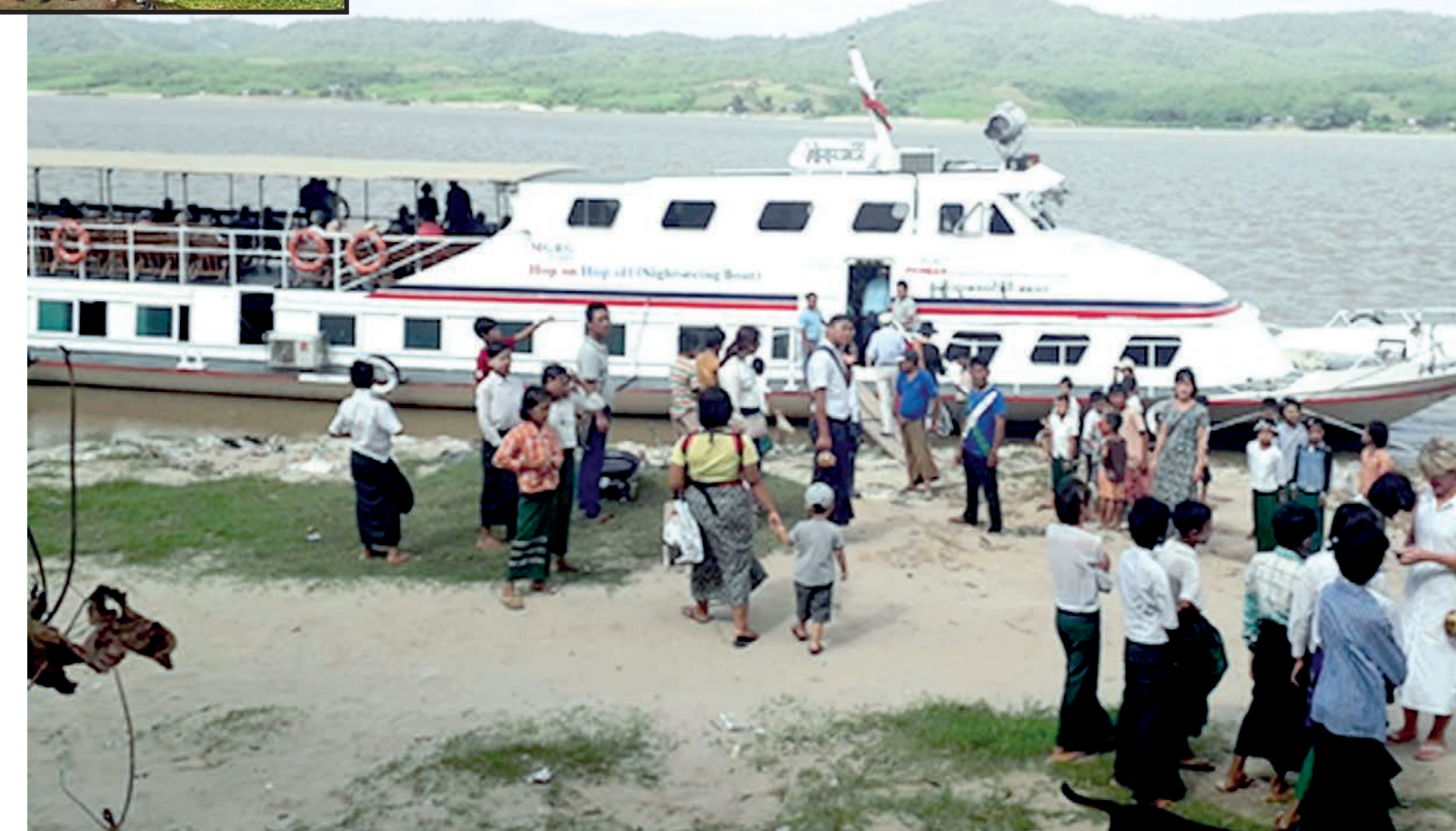
Some tourists are very interested in the river cruise tours along Ayeyawady and Chindwin Rivers to enjoy looking at natural sceneries.

Myanmar is rapidly gaining popularity among Thai visitors thanks to the country's reward to citizens from seven ASEAN countries—Thailand, Indonesia, Vietnam, Brunei, Cambodia, Laos and the Philippines-to stay 14 days in the country without any visa. The number of Thai visitors to Myanmar is estimated to reach about 500,000 in one or two years, and about one million in five years, according to the Royal Thai embassy in Yangon. Thai tourists travel to Myanmar through international entry points and border checkpoints to enjoy its natural landscapes, tour attractive tourist destinations and observe a diverse range of cultures and traditions of ethnic tribes. The ease of visa restrictions on Asian tourists has considerably prompted the increase of tourist arrivals in the first nine months of 2019.