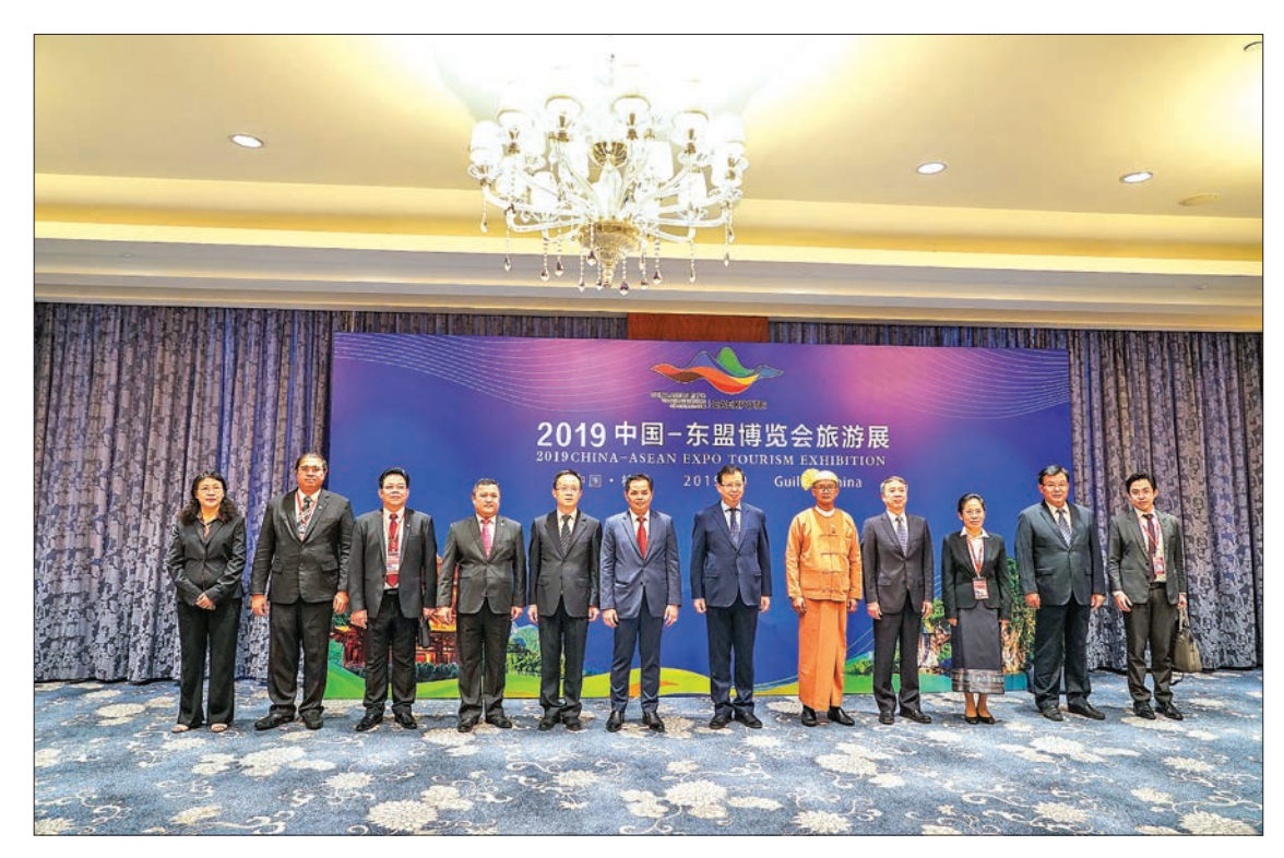
Union Minister U Ohn Maung and other dignitaries pose for a documentary photo at the opening ceremony of the 2019 China-ASEAN Expo Tourism Exhibition at Guilin, Guangxi Zhuang autonomous region, China on 18 October.