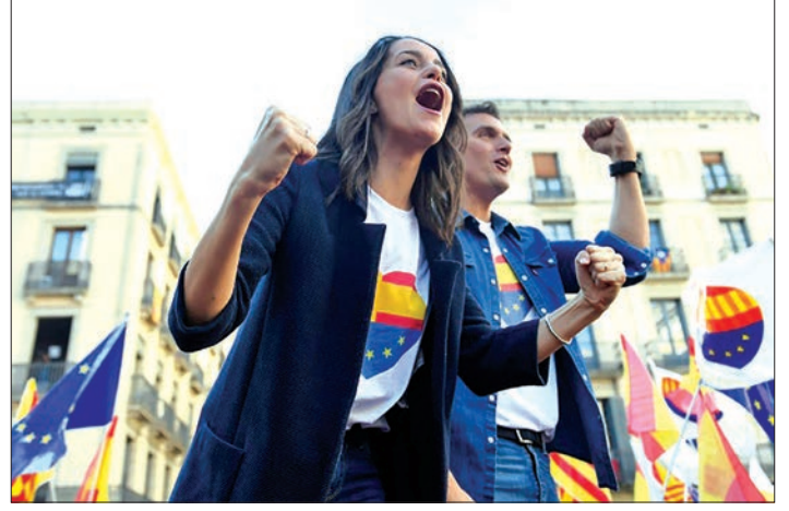
The centre-right Spanish party Ciudadanos rallied in Barcelona against Catalan separatism.

The streets of Barcelona and other Catalan cities have been rocked by protests since Spain's Supreme Court sentenced nine separatist leaders, many of them former regional government ministers, last Monday to jail terms of up to 13 years for sedition over the failed 2017 independence bid.—AFP