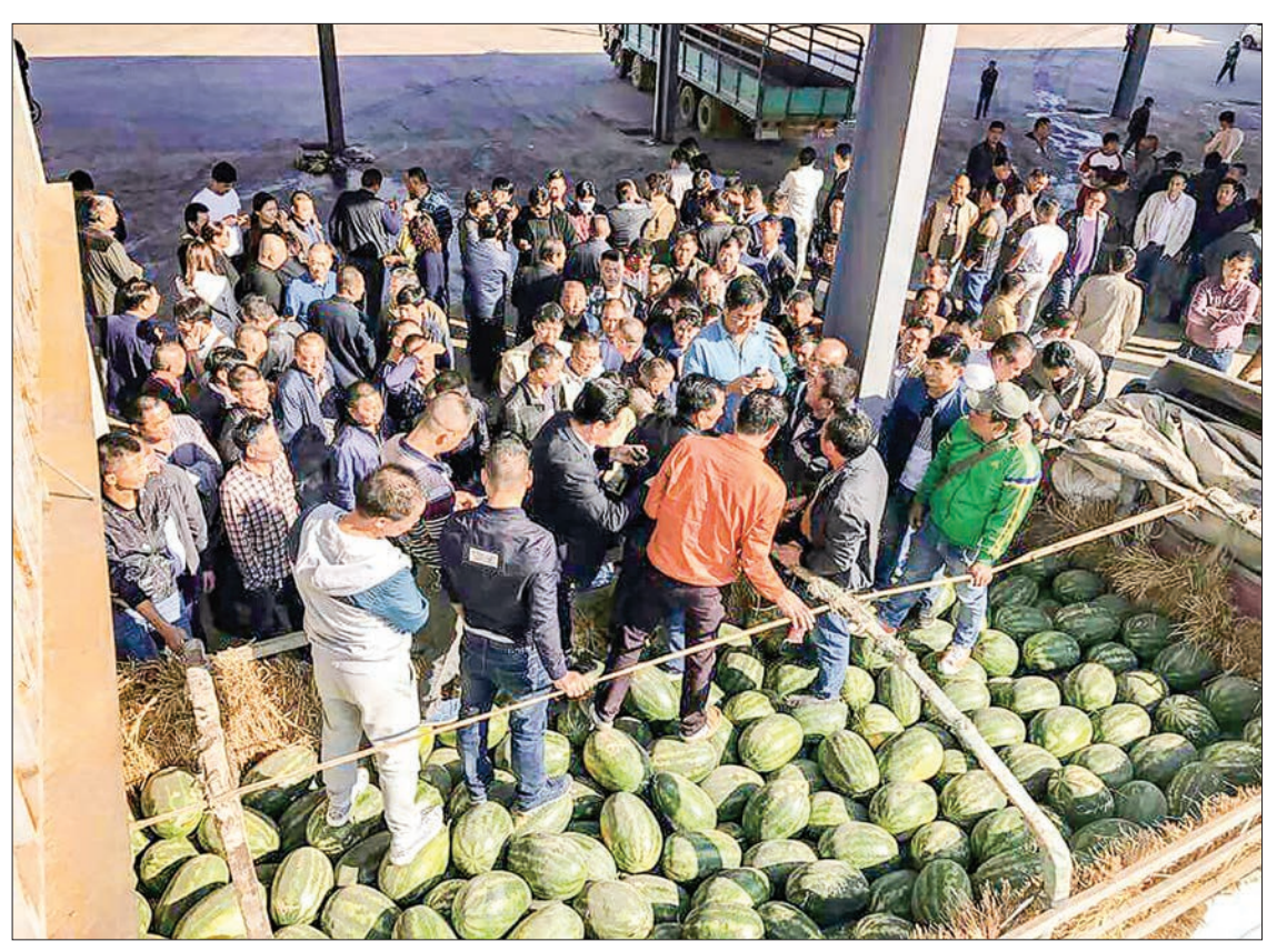
Fruit dealers engaging in trading at the Muse gate.

WATERMELONS have been flooding Muse gate in recent days, resulting in a sharp drop in the price of the fruit, according to Khwarnyo Trading Co. Ltd.