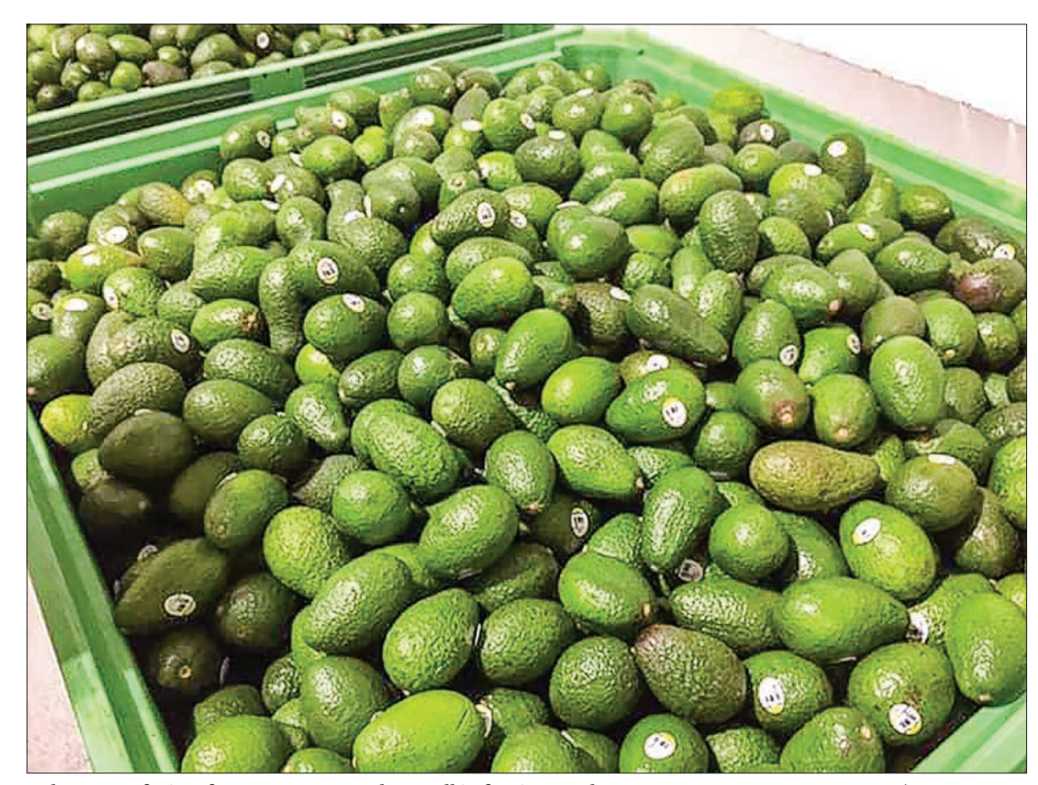
Pulpy green fruits of Myanmar get ready to sell in foreign markets.

MYANMAR Avocado Producer and Exporter Association will begin exporting sample shipments of their systematically homegrown avocados to China, India and Thailand on 3 November.