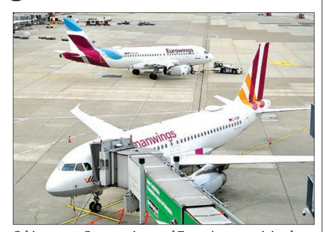
Cabin crew at Germanwings and Eurowings were joined by colleagues at SunExpress and CityLine during a day-long strike for higher wages and better working conditions.

The walkout, called by the UFO cabin crew union, was initially set to last from 5:00 am until 11:00 am (0300-0900 GMT) but a worsening spat with Lufthansa bosses prompted the union to extend the strike until midnight.The industrial action at Eurowings, Germanwings, Sun-Express and CityLine led to at least 12 departures being scrapped at Hamburg airport, around 10 in Munich and around 15 at Berlin-Tegel, according to DPA news agency.