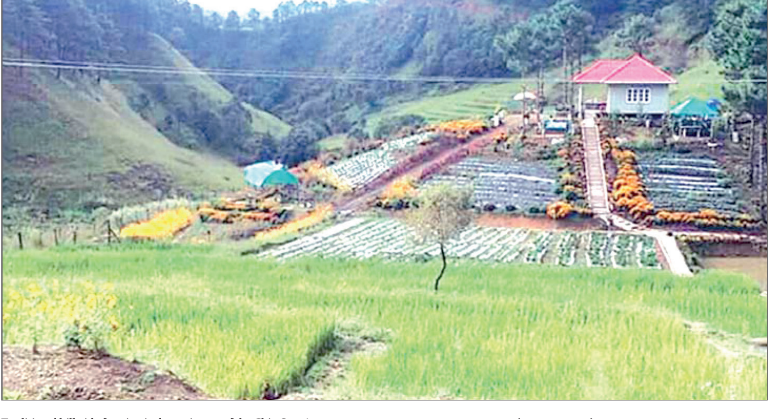
Traditional hill-side farming is the mainstay of the Chin State's economy.

Avocados were once only grown for home consumption but have been selected in the six crop varieties. The Agriculture Department is working to provide farmers with quality avocado seeds, agricultural methods, packaging and distribution systems. They are also enlisting produce silk.