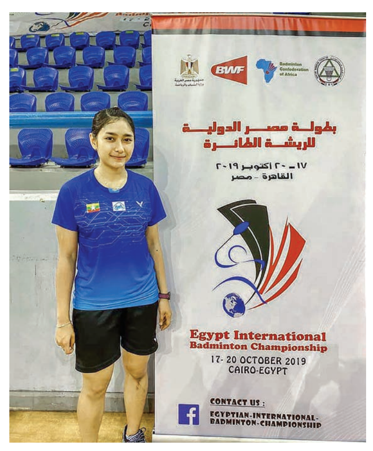
Myanmar badminton star Thet Htar Thuzar seen at the Egypt International Badminton Championship in Cairo.