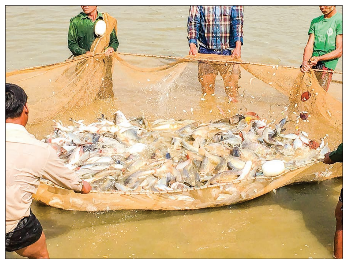
Fish breeding farm workers catching fish using the net in Twante Township in Yangon Region.

Myanmar exports fisheries products, such as fish, prawns, and crabs, to markets in 40 countries, including China, Saudi Ara-