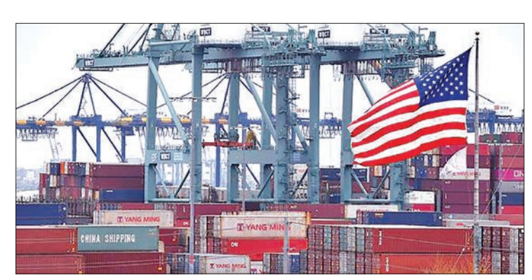
Chinese shipping containers are stored beside a US flag after they were unloaded at the Port of Los Angeles in Long Beach, California on May 14, 2019.

She also said members recognized the need to build more "peer pressure for everybody to