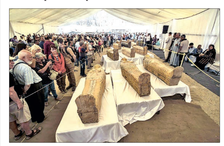
Tourists observe sarcophagi displayed in front of Hatshepsut Temple in Egypt's Valley of the Kings in Luxor. PHOTO: AFP

A sealed coffin belonging to a young ancient Egyptian child was incomplete and unpainted. — AFP \blacksquare