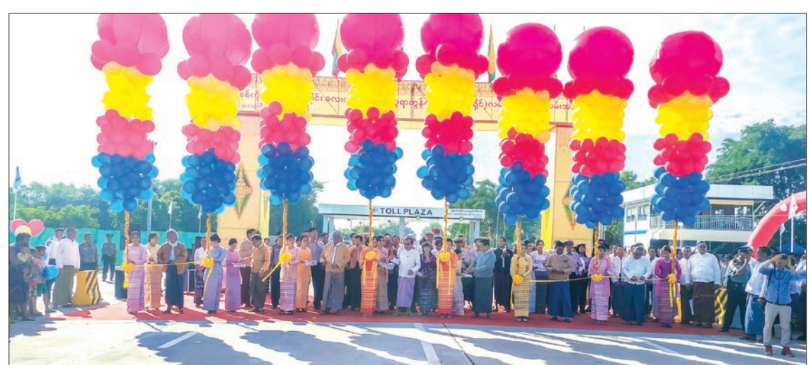
Union Minister U Han Zaw and other dignitaries open the Sagaing-Monywa four lane concrete road yesterday.

Minister inspected the site for building a new bridge near Nyaungpin Wun Bridge on the Allakapwa-Taw ChaungU, Sagaing-Monywa road.—MNA (Translated by Zaw Htet Oo)