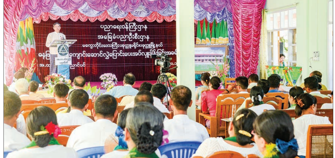
Union Minister Dr Myo Thein Gyi delivers the speech at the donation ceremony of new school building in Nyaungbin village, Pakokku Township yesterday.