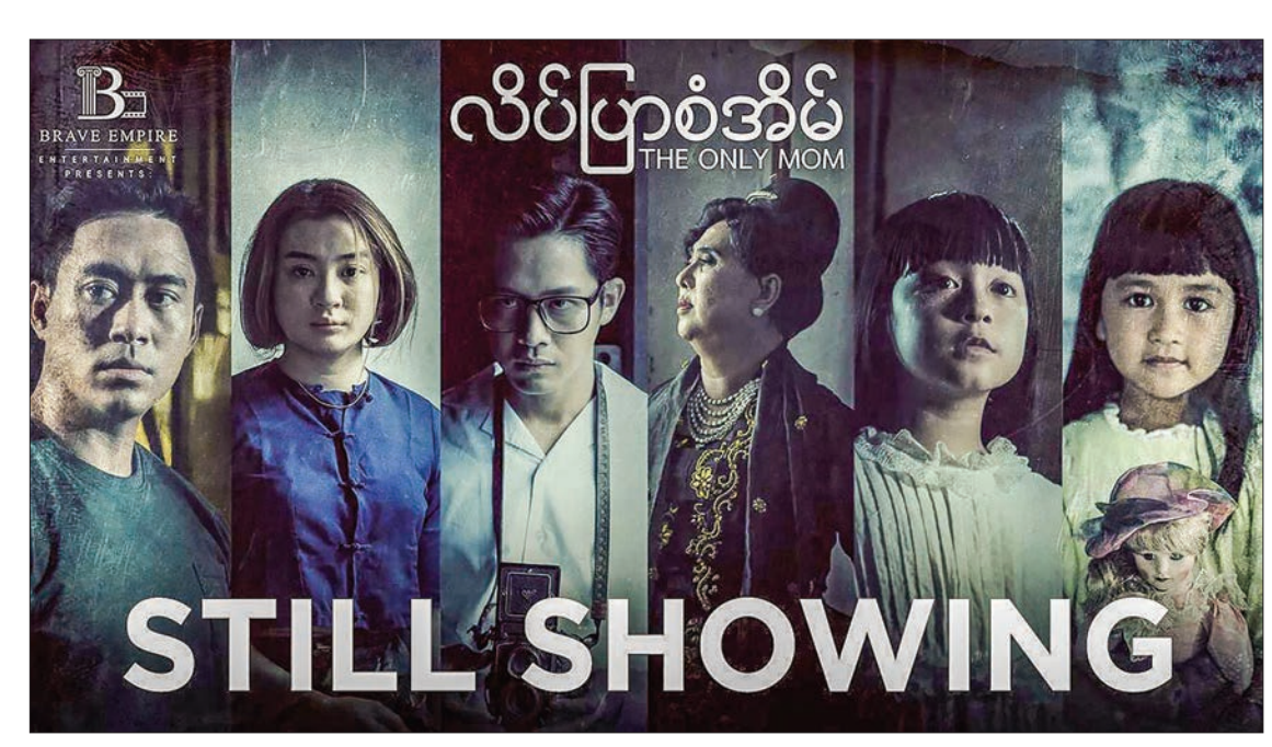
"The Only Mom" displays the artistic quality of Myanmar.

Actor Daung said the unique lyrics and melody of a Myanmar nursery rhyme in the