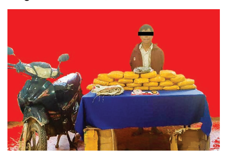
Sein Pe, (a) Kyaw Win seen with seized drugs.

A COMBINED team comprised of members of the Mandalay (South) anti-drug squad and Kyaukse police arrested a man carrying 29.9kg of opium in Kyaukse on 16 October.