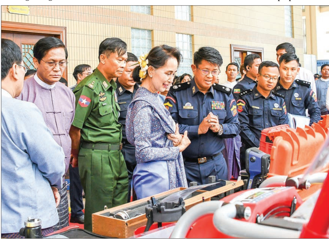
State Counsellor Daw Aung San Suu Kyi observes the booth displayed at the event to mark International Day for Disaster Risk Reduction (IDDRR) in in Nay Pyi Taw yesterday.

than the developed countries. Losses due to natural disasters for poor people were so severe to be unrecoverable. On the other hand, progress and development took time but these were destroyed within minutes of a natural disaster. At the moment, earthquakes and tsunamis were most dangerous and most destructive. Earthquakes