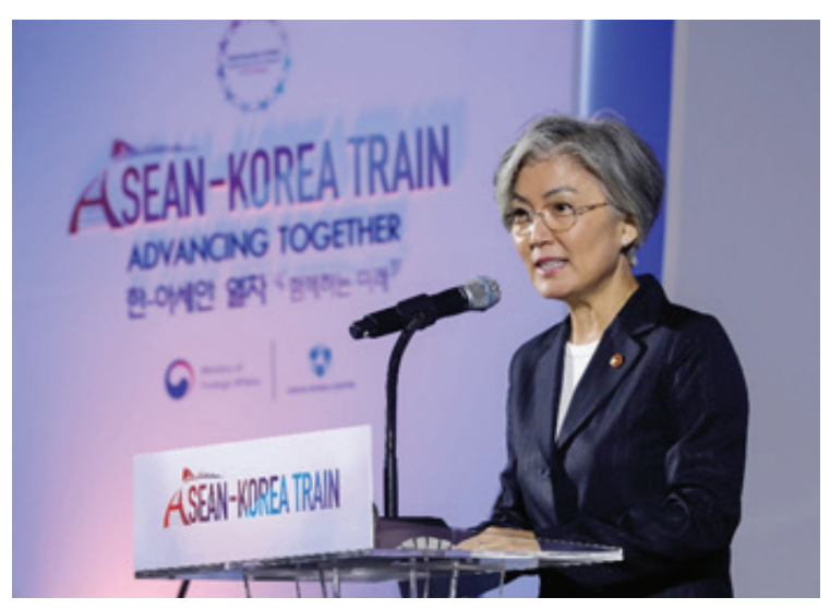
Minister of Foreign Affairs of the Republic of Korea Mrs Kang Kyungwha delivers congratulatory remarks at the ASEAN-Korea Peace Wishing & Closing Ceremony at Grand Hyatt Seoul.

Yesterday afternoon, the Union Minister visited Hanok Village and N Seoul Tower in the capital. He also gave an interview from Korea TV where he answered about his visit to South Korea and the New Southern Policy.—MNA (Translated by Zaw Htet Oo)