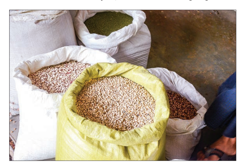
Mung beans are kept on display for sale in a shop.