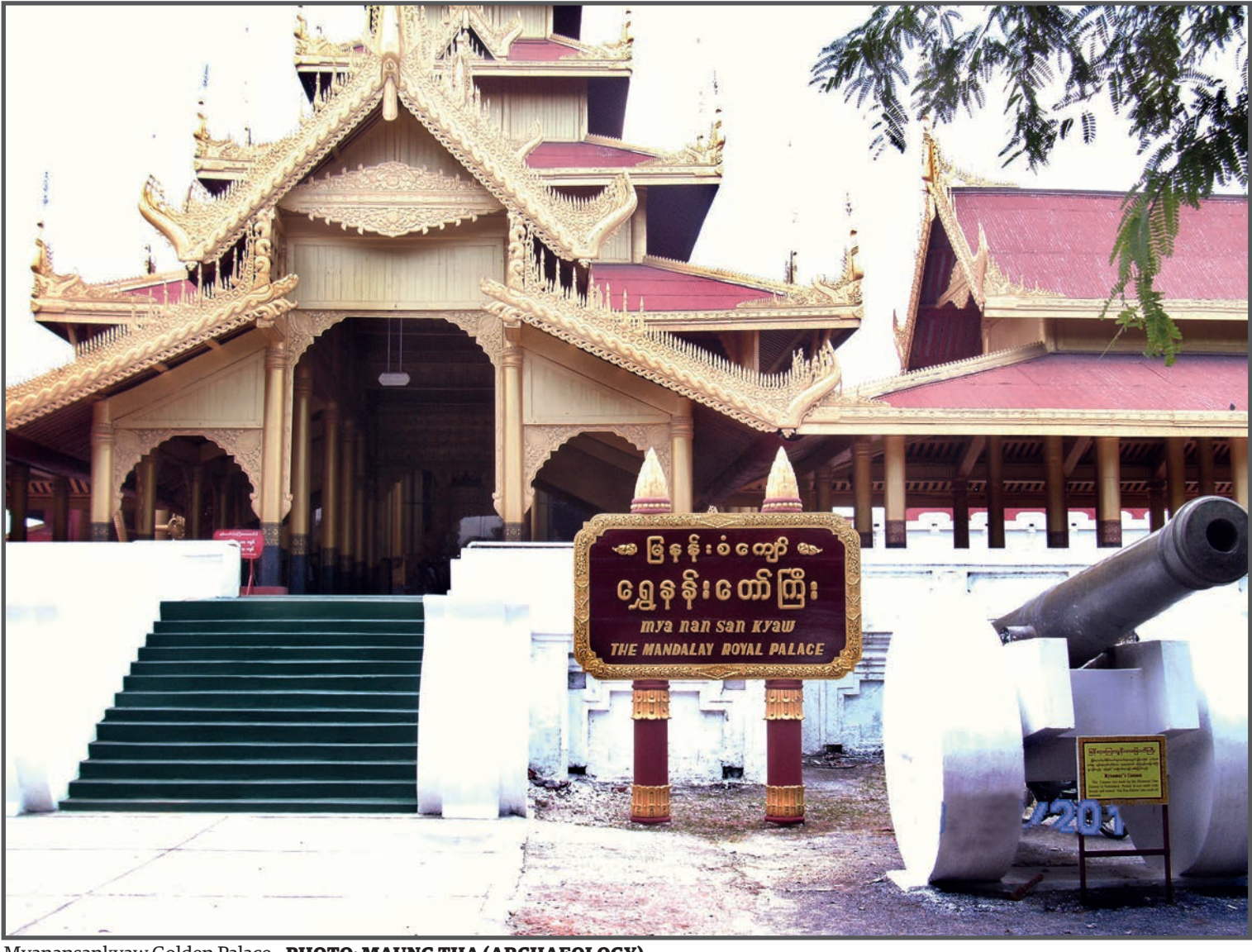
Myanansankyaw Golden Palace.

On 16 July 1858 when Yadanabon Royal City and Royal Palace had been built, King Mindon and the First Queen entered