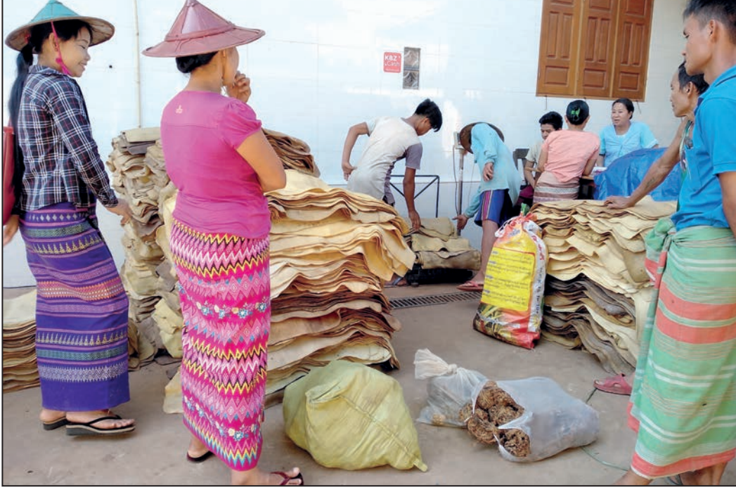
Latex being collected from a tapped rubber tree. Rubber sheets are sold by local farmers in Mon State.

Gaining suitable price to meet modern standards