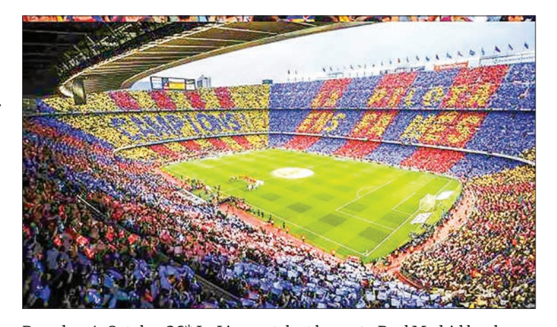
Barcelona's October 26<sup>th</sup> La Liga match at home to Real Madrid has been postponed over security concerns amid violent political demonstrations in Catalonia.

"The club has the utmost confidence in the peaceful behaviour of its members and fans who always express themselves in exemplary fashion at Camp Nou.—AFP