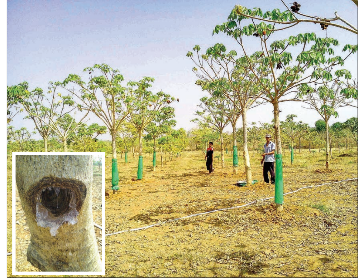
A Sterculia versicolor gum plantation thriving in Pwintbyu Township, Magway region.

"Local farmers are taking advantage of the good climate and geographical location to cultivate Sterculia versicolor gum, thanakha, and acacia mangium using good agricultural practices to produce quality products and create a stable market," said U Aung Phyo Wai, an official from the Pwintbyu Township