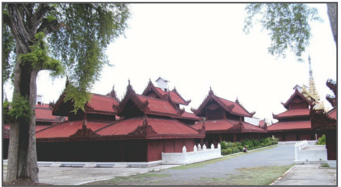
Royal halls in Myanansankyaw Golden Palace.

Three royal ladders were installed for the king and the first queen on the front wing of the golden palace. The east Samok hall was located for princes and staff of the palace to attend the royal conference at the foot of the ladders. The ground Sanu