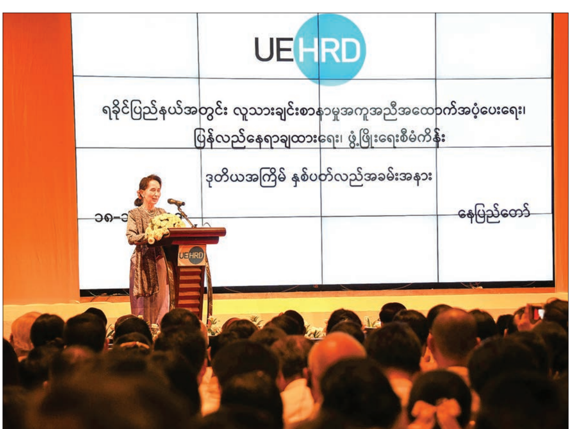
State Counsellor Daw Aung San Suu Kyi addresses the second anniversary of the Union Enterprise for Humanitarian Assistance, Resettlement and Development in Rakhine State (UEHRD) in Nay Pyi Taw yesterday.