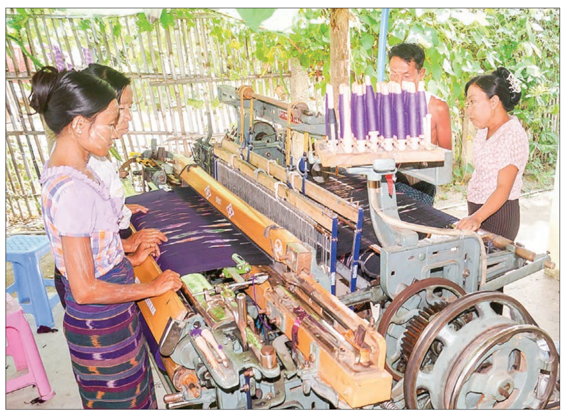
Workers check the quality of a textile rolling out from a weaving machine in Seikpyu Township.

Earlier, the entire village was engaged in weaving cloth by hand, with weavers earning K1,500 per day. The weavers began to switch careers because they could earn K4,000 per day in farming. Due to shortage of weavers, weaving businesses began facing difficulties. But now, three machinery looms, textiles, dying subjects, and other necessary items have been provided to weavers by World Vision Myanmar. Additionally, training courses on weaving, dying, and maintaining machines have been offered to 37 students from August to October. With the use of powerloom machines, weav-