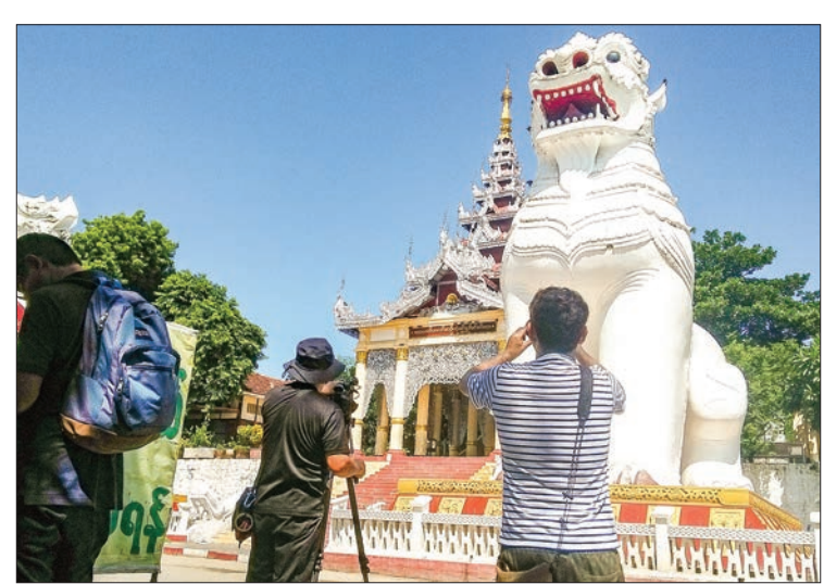
Film crew shooting the foot of Mandalay mountain in Mandalay.

They also filmed Ayeyawady dolphins helping fishermen in Shein Makar, Sin Kyun, Sein Pan Kone, Myaysun, and Aye Kyun villages of Madaya Township and will continue filming to 28 October.