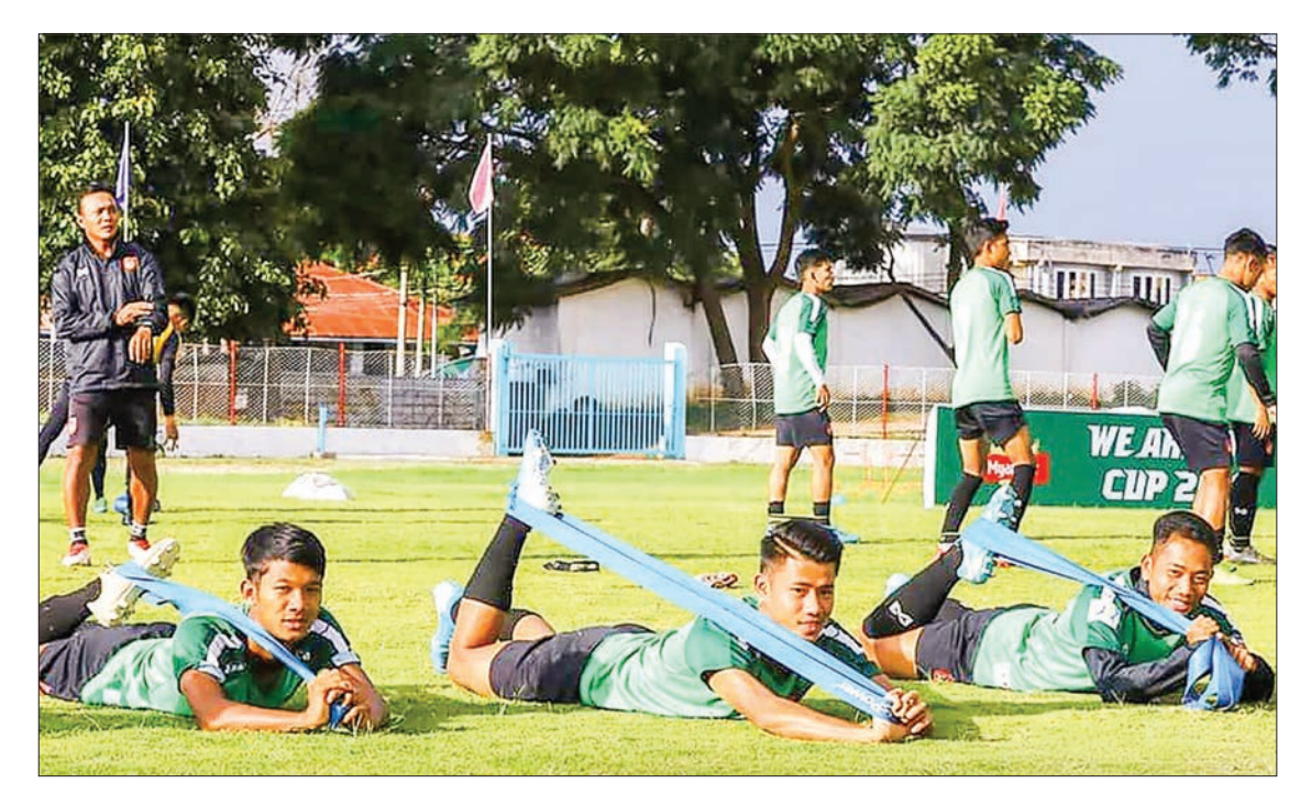
Myanmar U-19 footballers undertake physical exercise as part of preparation for the AFC U-19 Championship 2020 Qualifiers.

THE Asian Football Confederation (AFC) U-19 Championship 2020 Qualifiers will be held from 6 November at the Thuwunna Stadium in Yangon, Myanmar, according to the Myanmar Football Federation.