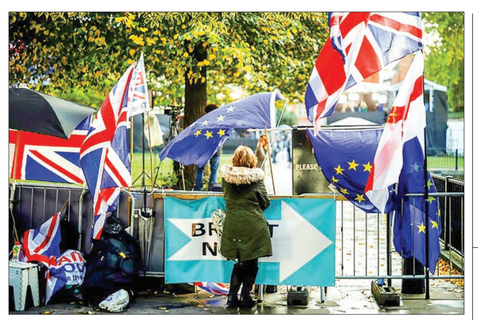
Prime Minister Boris Johnson and the European Union's Brexit deal must still pass the House of Commons and many MPs are strongly opposed.