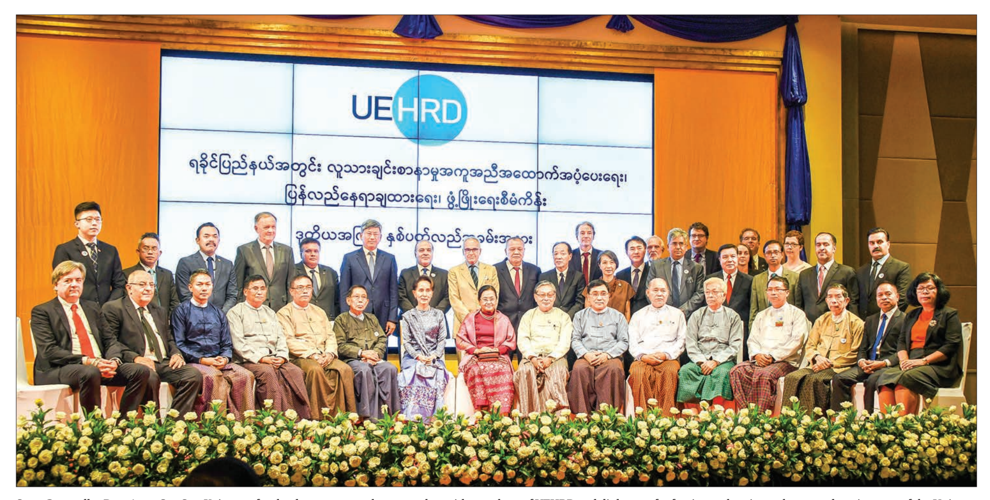
State Counsellor Daw Aung San Suu Kyi poses for the documentary photo together with members of UEHRD and diplomats for foreign embassies at the second anniversary of the Union Enterprise for Humanitarian Assistance, Resettlement and Development in Rakhine (UEHRD) in Nay Pyi Taw yesterday.

THE second anniversary of the Union Enterprise for Humanitarian Assistance, Resettlement and Development in Rakhine (UEHRD) was held at the Hilton Hotel in Nay Pyi Taw yesterday afternoon.