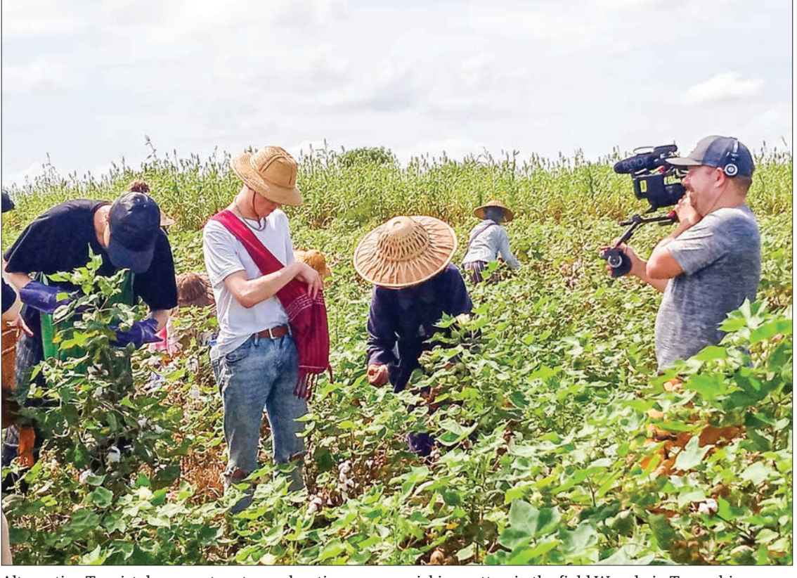
Alternative Tourist documentary team shooting women picking cotton in the field Wundwin Township.

In the past few days, the same team travelled to Wundwin Township where they filmed