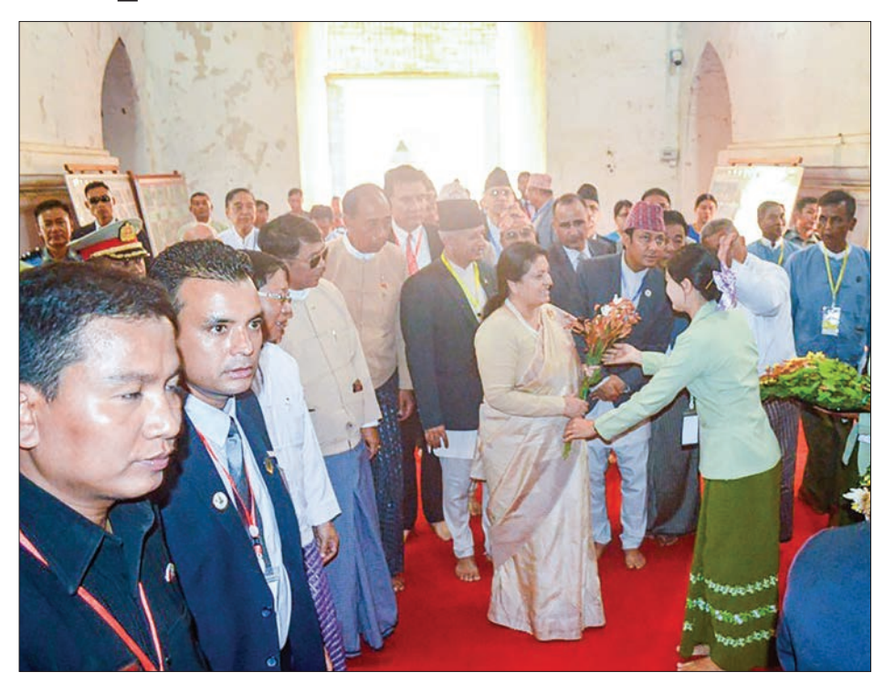
Nepali President Mrs Bidya Devi Bhandari visits the famous Ananda Temple at the UNESCO World Heritage Site in Bagan yesterday.