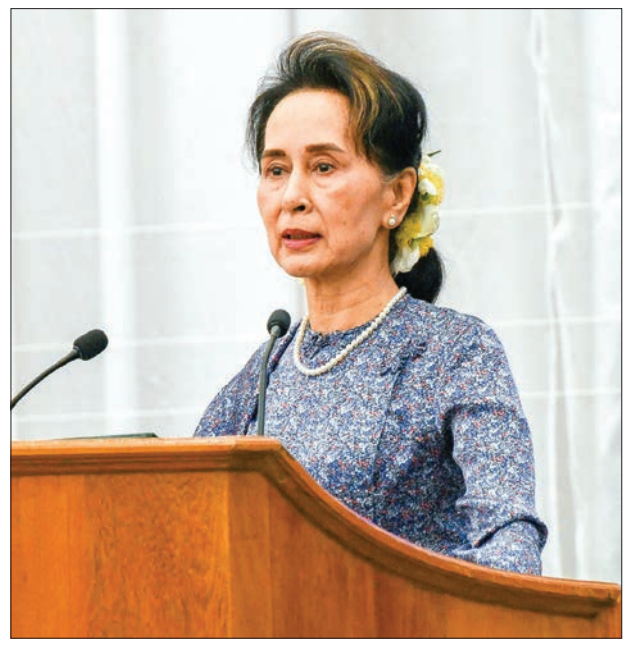
State Counsellor Daw Aung San Suu Kyi delivers the opening address at the event to mark International Day for Disaster Risk Reduction (IDDRR) in Nay Pyi Taw yesterday.

Stan Suu Kyi addressed an event commemorating the International Day for Disaster Risk Reduction (IDDRR) held with the theme "Build to Last" at the Myanmar International Convention Centre II (MICC-II) yesterday morning.