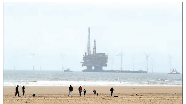
Germany called a special meeting of international partners this week to pressure Royal Dutch Shell to remove old rigs containing crude oil in the North Sea.

Greenpeace campaigners on Monday boarded Shell's Brent Alpha and Bravo platforms, which lie northeast of Scotland's Shetland Islands and are no longer operational, to protest what Greenpeace said were threats to the environment.—AFP