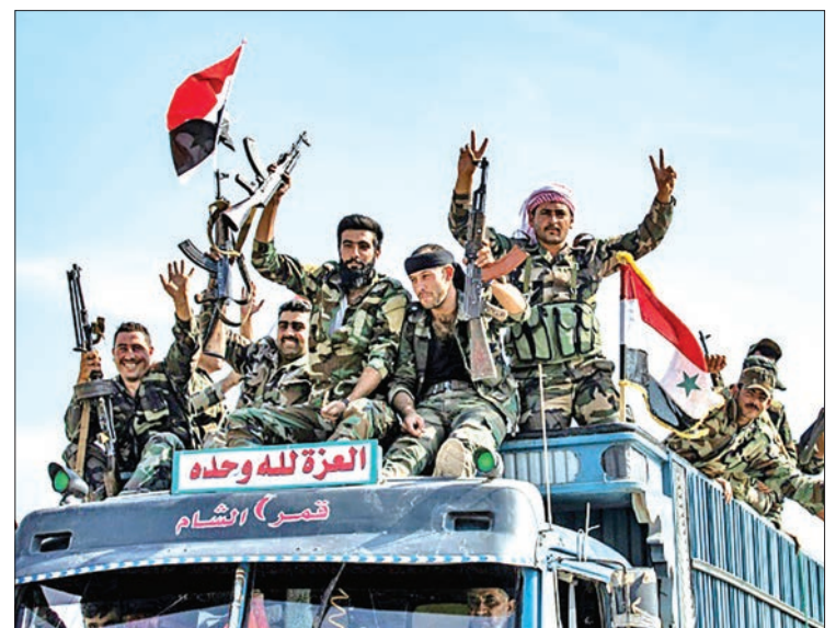
Syrian government troops have returned to a string of Kurdish-held areas for the first time in years under a weekend deal to fight Turkey’s invasion together.

On Monday, artillery fire by the Syrian former rebels killed another soldier in the flashpoint city of Manbij, it added.—AFP ■