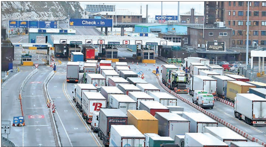
The government’s own worst-case scenario assumes trade flows across the Channel slowing by 45 to 65 per cent and taking up to a year to recover in full.

The National Audit Office (NOA) said Wednesday that government departments “have done a great