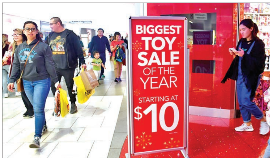
Shoppers took home fewer autos and spent less on gasoline, groceries and building supplies while buying less online as well, according to the Commerce Department.

Compared to August, total retail sales fell 0.3 per cent to $525.6 billion, the first decline since February. Economists had instead expected a 0.3 per cent increase, as shoppers moved to buy at lower prices ahead of looming tariff increases on Chinese goods. Compared to September of last year, sales were up 4.1 per cent. Sales of autos and parts slumped 0.9 per cent while gasoline stations were down 0.7 per cent.—AFP ■