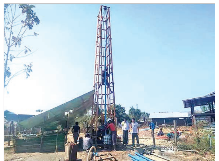
A tube-well being sunk in Yinmabin District, Sagaing Region.

In the 2019-2020 FY, a total of 400 wells, including 200 wells in Yinmabin Township and 200 wells in Salingyi Township, will