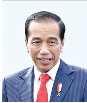
Indonesian President Joko Widodo.

All of the suspects are members of Jamaah Ansharut