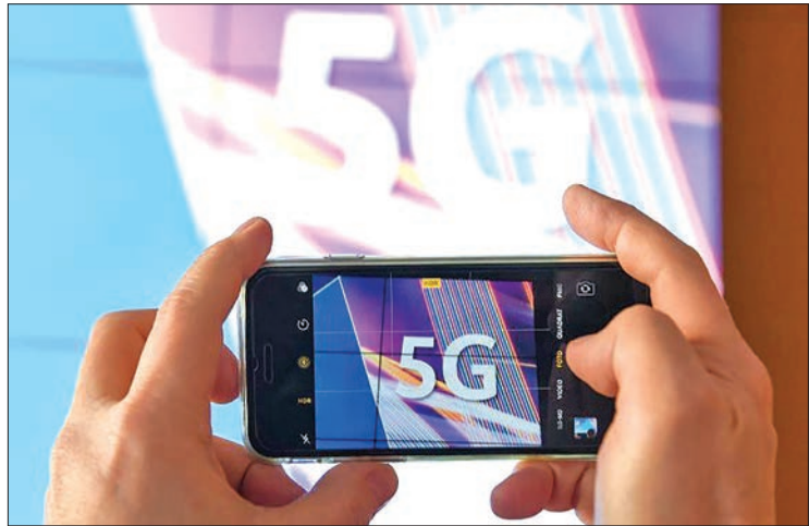
A journalist takes pictures of a projection screen prior to the start of Germany's auction for the construction of an ultra-fast 5G mobile network in Mainz on 19 March.

SHANGHAI — Chinese tech giant Huawei said on Wednesday that its revenue for the first nine months of the year grew by almost a quarter despite a US campaign to isolate the company globally.