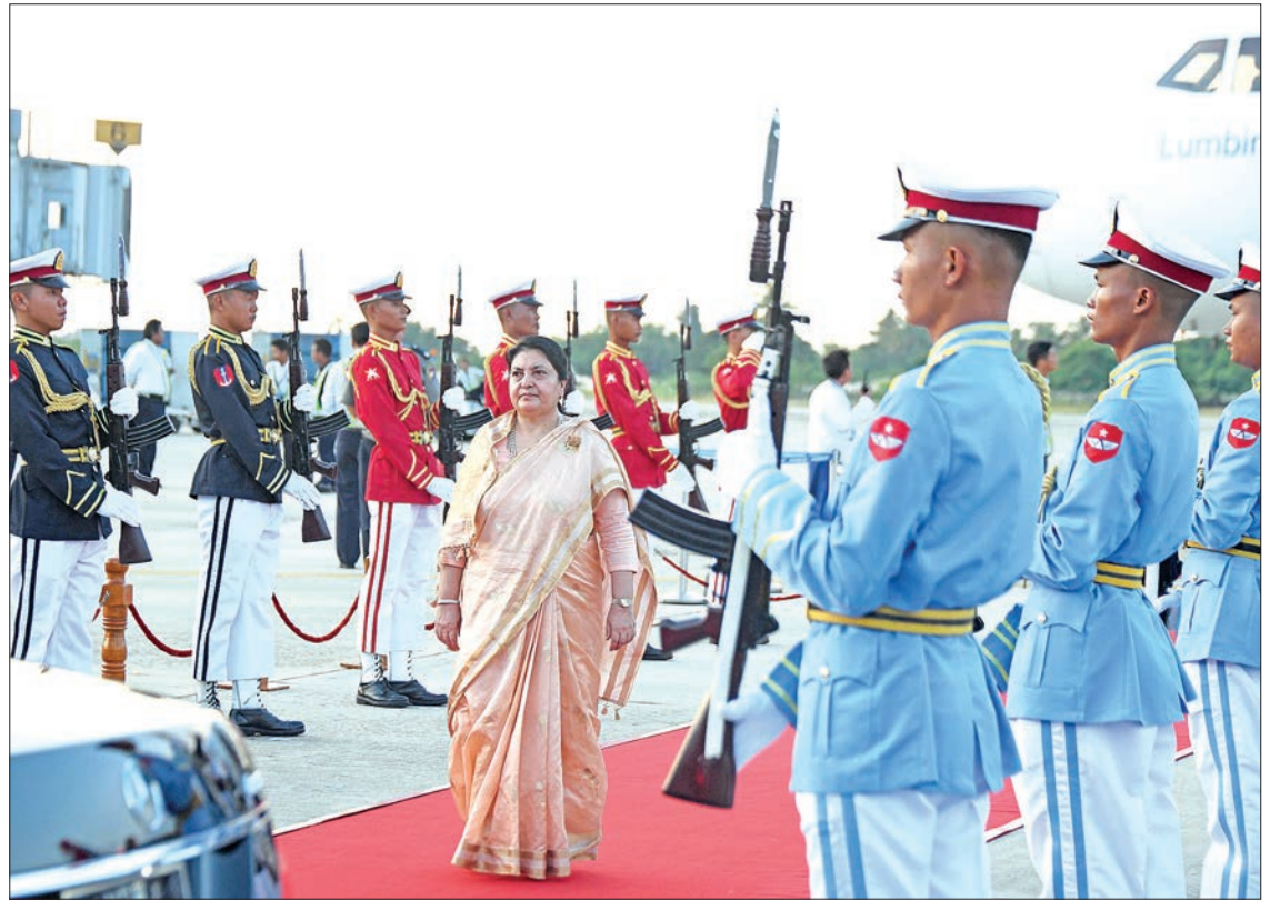
President of the Federal Democratic Republic of Nepal Mrs Bidya Devi Bhandari walks past the Honour Guard as she arrives at the Nay Pyi Taw International Airport yesterday.