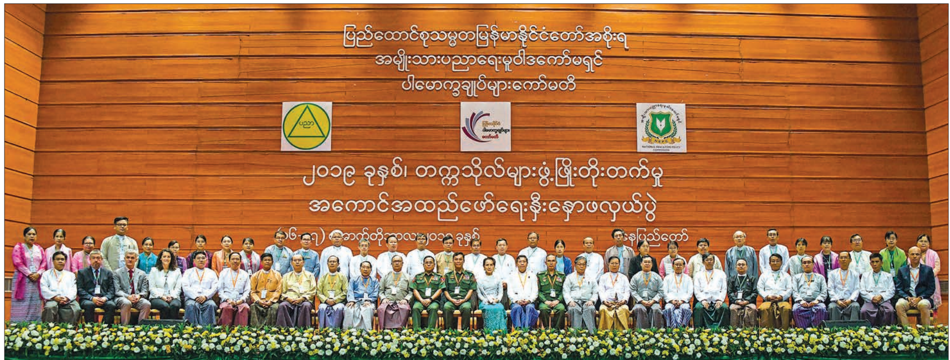
State Counsellor Daw Aung San Suu Kyi poses for a documentary photo together with senior officials at the 2019 Conference on Implementing Development of Universities at MICC II in Nay Pyi Taw yesterday.