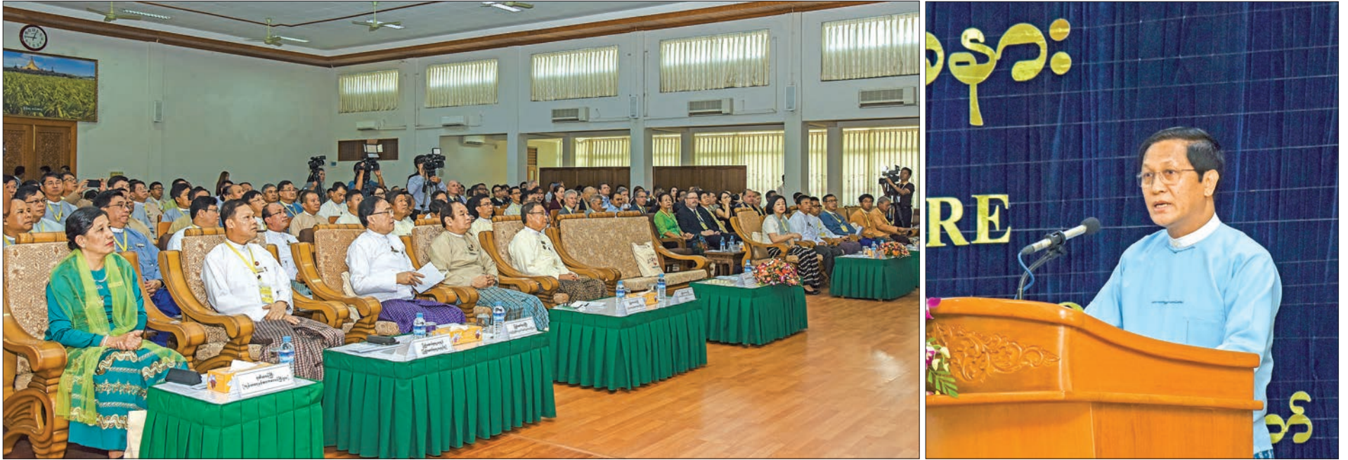
Vice President U Henry Van Thio delivers the opening speech at the ceremony to mark World Food Day 2019 in Nay Pyi Taw yesterday.

THE Union Government commemorated World Food Day with an exhibition at the Ministry of Agriculture, Livestock and Irrigation in Nay Pyi Taw yesterday.