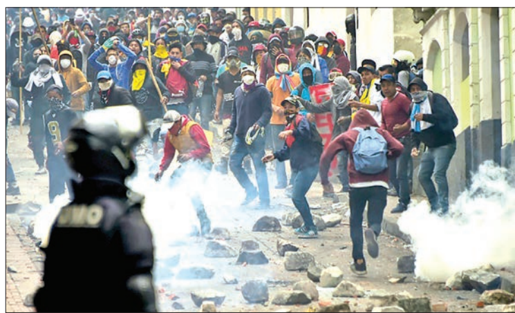
Demonstrators clash with riot police in Quito, as thousands march against President Lenin Moreno’s decision to slash fuel subsidies.

Ongoing technical talks are variously described as “intense” or “constructive”, but no-one familiar with the closed-door process would point to progress on issues like Northern Ireland’s place in or out of the EU customs zone.—AFP ■