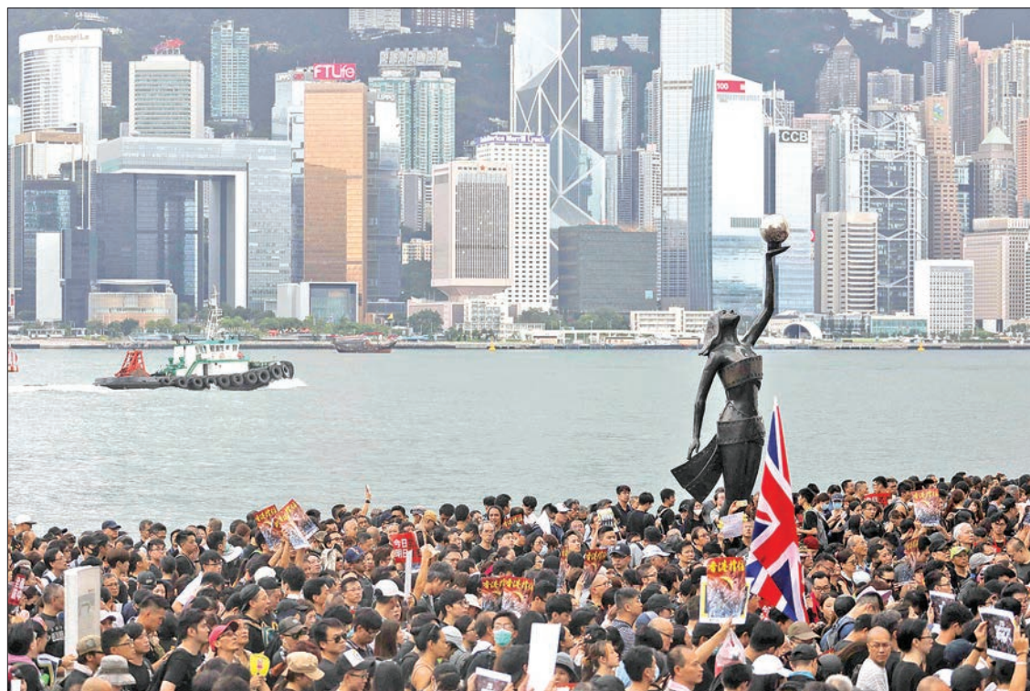
FILE PHOTO: Protesters gather before a march to the West Kowloon railway station, where high-speed trains depart for the Chinese mainland, during a demonstration against a proposed extradition bill in Hong Kong on 7 July, 2019.

The first tremor is expected to cause damage and aftershocks, the institute said. However, it said the second quake will not cause any damage or generate aftershocks. — Xinhua ■