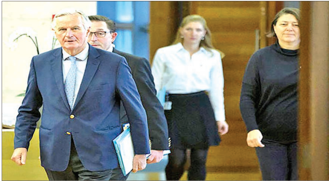
British and EU negotiators played down hopes of breakthrough in their bid to strike Brexit deal.

The last planned European Council summit before Britain is due to leave the bloc on 31