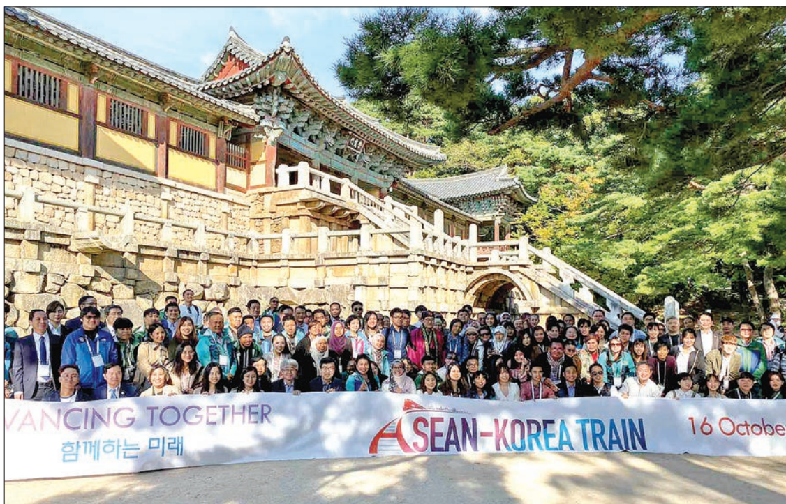
Participants pose for a group photo during the ASEAN-Korea Train tour in Seoul, the Republic of Korea, yesterday.