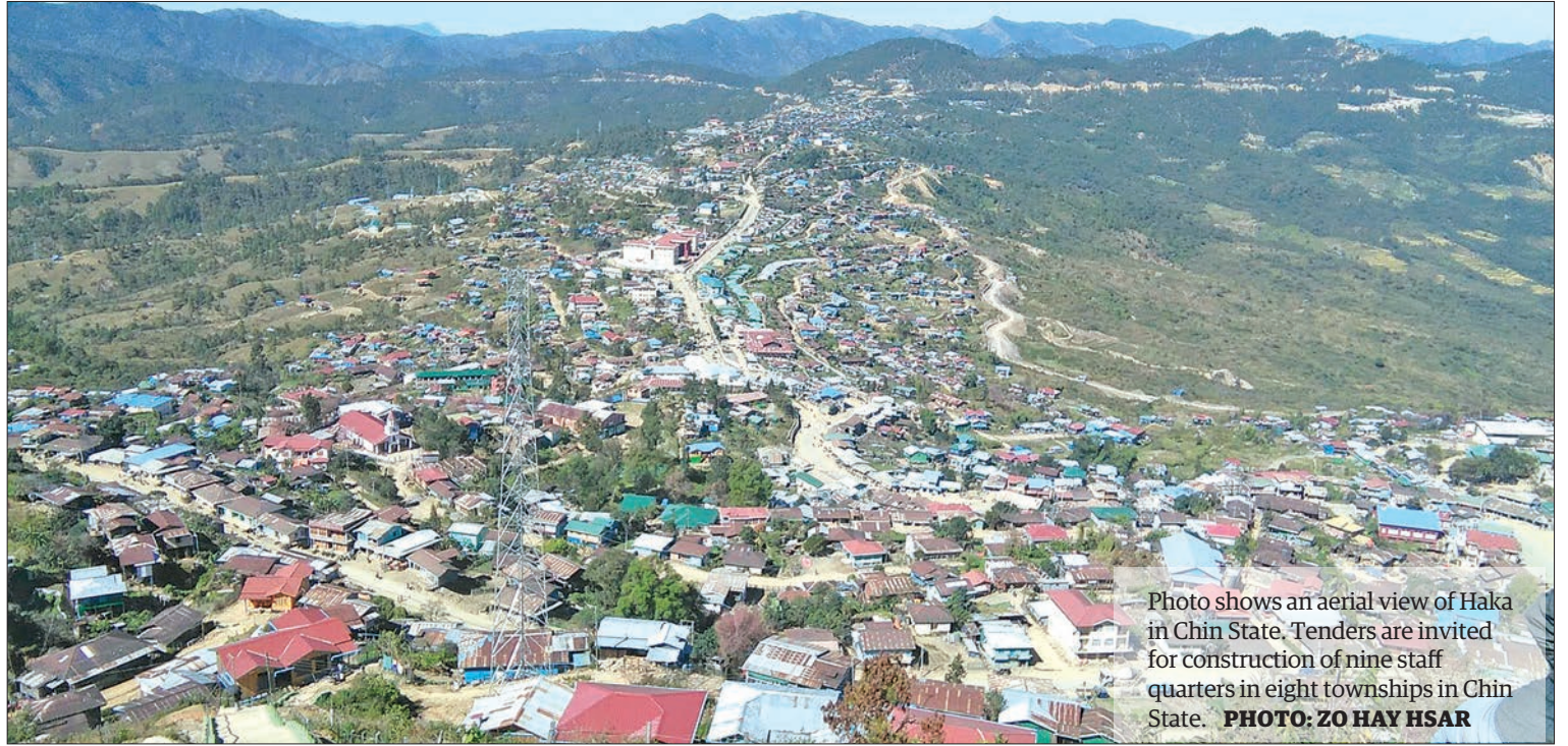
Photo shows an aerial view of Hakha in Chin State. Tenders are invited for construction of nine staff quarters in eight townships in Chin State.

Companies submitting a bid will be screened according to standard norms and procedures, starting with the cost estimate from blueprints and material take offs. Companies will have to forward a copy of their registration and profile to the tender evaluation team. Companies applying for more than one project must