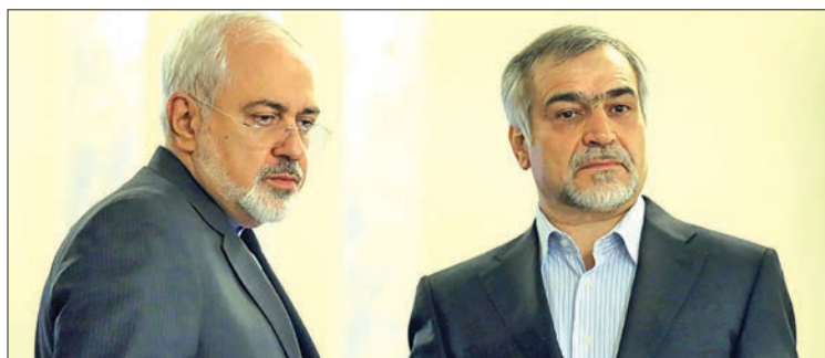
Hassan Rouhani's brother Hossein Fereydoun, seen here with Foreign Minister Mohammad Javad Zarif, was a key adviser to the Iranian president before his arrest.

TEHRAN — Iranian President Hassan Rouhani's brother entered prison Wednesday to begin a five-year sentence after he was convicted of corruption, the semi-official ISNA news agency reported, citing his lawyer.