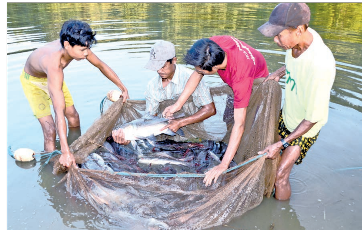
Sustainable fisheries and aquaculture are vital to reducing hunger and poverty. Fish farming (aquaculture) contains 57% of the total area of inland fish ponds in the Ayeyawady Delta.

So, it's clear, we have both a personal and collective best interest in changing our ways. But where to start and who leads?