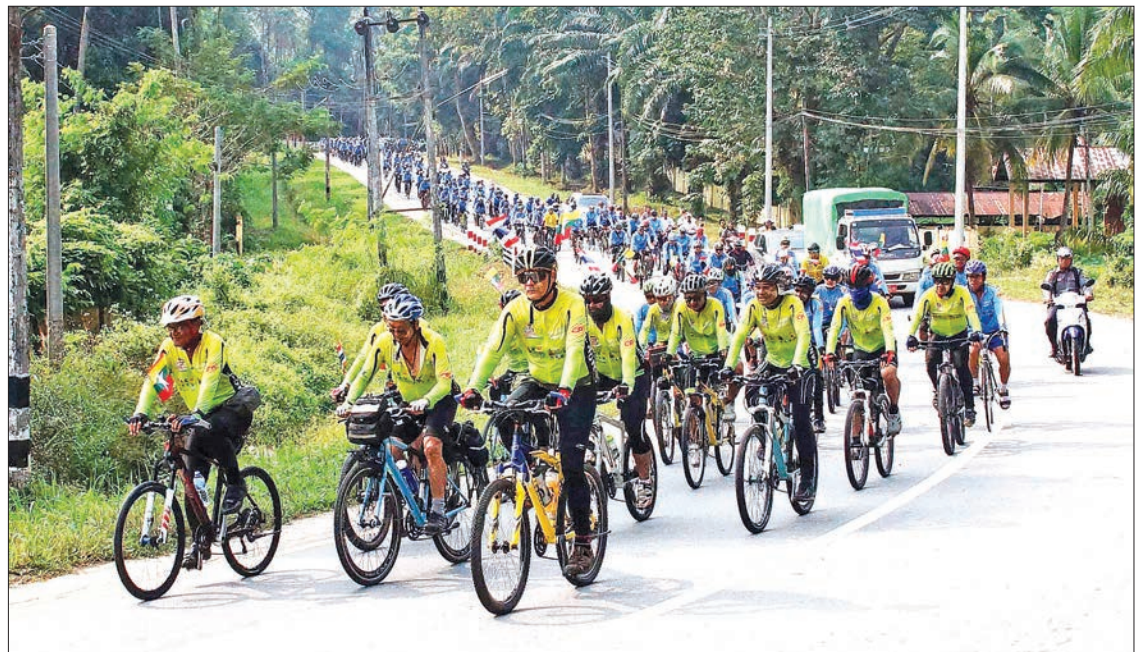
Cyclists participate in mountain bike competition in Kawthoung, Taninthayi Region. Mountain Bike Challenge 2019 will be held on 19 October 2019.

Cyclists and bike lovers from Dawei, Myeik, and Kawthoung districts have been invited to participate in the mountain bike competition. The competition has been divided into two categories — for challengers above 40 years old and players under 40 years of age. The first, second, and third place winners from each category will be awarded and cyclists who arrive at the finish point within an hour and 30 minutes will be awarded finisher prizes. The objectives of