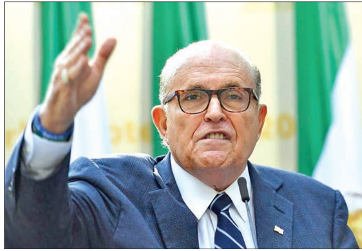
FILE PHOTO: White House and Trump's personal lawyer Rudy Giuliani refused to turn over subpoenaed documents on the Ukraine affair to Congress.

former White House Russia expert Fiona Hill reportedly told Congressional investigators in closed-door testimony that several high-level aides reported the Trump-Zelensky phone call to a White House lawyer as possible wrongdoing by the president.