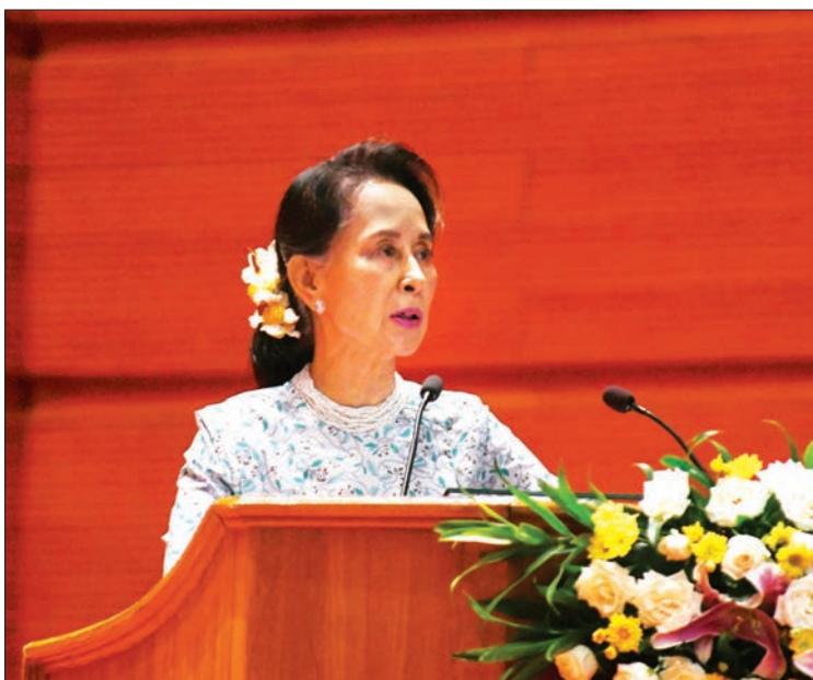
State Counsellor Daw Aung San Suu Kyi addresses the 2019 Conference on Implementing Development of Universities in Nay Pyi Taw yesterday.

THE 2019 Conference on Implementing Development of Universities was held at the Myanmar International Convention Centre II in Nay Pyi Taw yesterday morning.