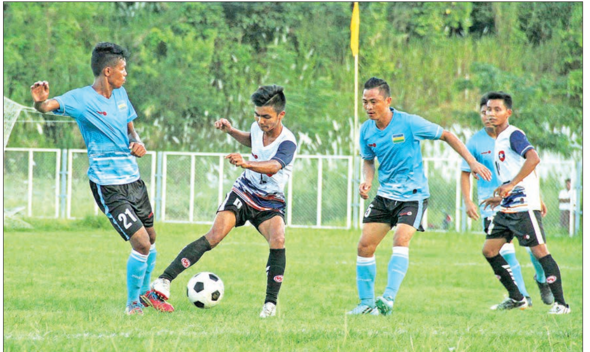
A player from the football team of the Ministry of Defense (white) tries to take the ball past players from the football team of the Ministry of Home Affairs (blue) during the quarterfinals yesterday of the inter-ministries football tournament at the Wunna Theikdi Stadium training ground in Nay Pyi Taw.