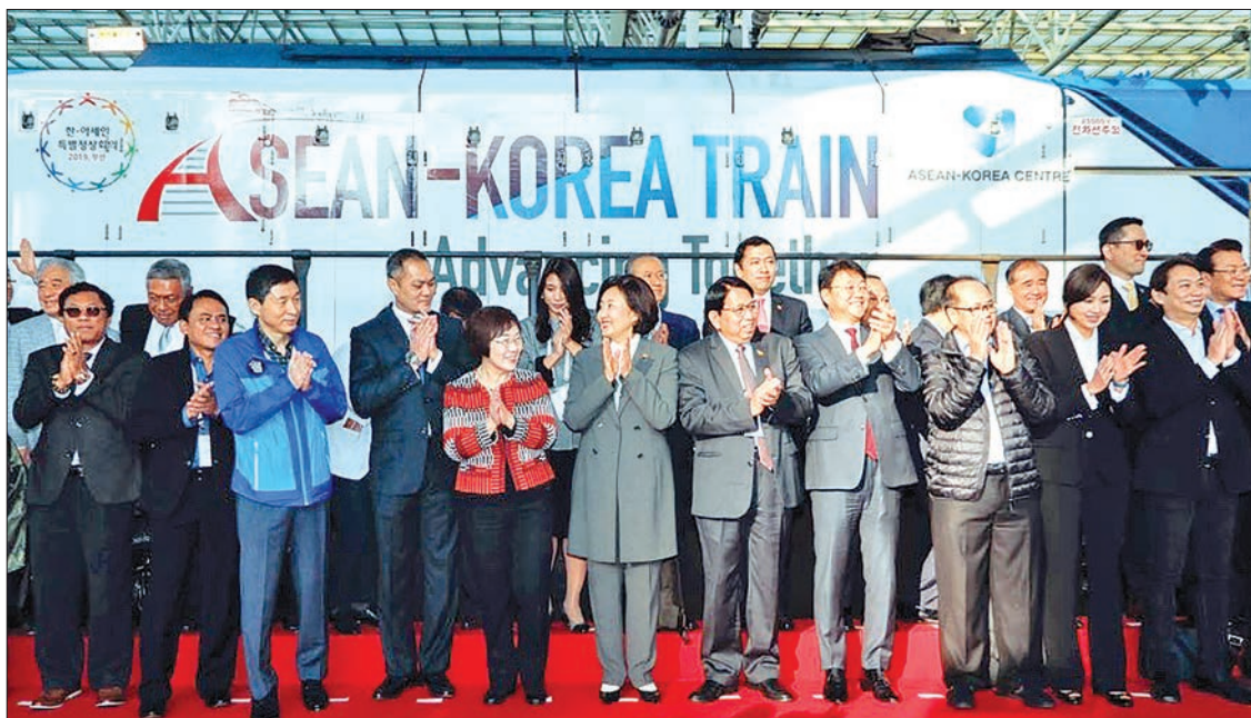
Union Minister for Information Dr Pe Myint attends the launching ceremony for the ASEAN-Korea Train tour at Seoul Station in Seoul, the Republic of Korea, yesterday.