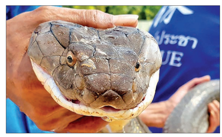
A KrabiPitakpracha Foundation snake handler holds the fourmetre (13 feet) king cobra he pulled from a sewer in southern Thailand.

Kritkamon said the snake was more than four metres long, weighed 15 kilos (33 pounds), and was the third-largest they had