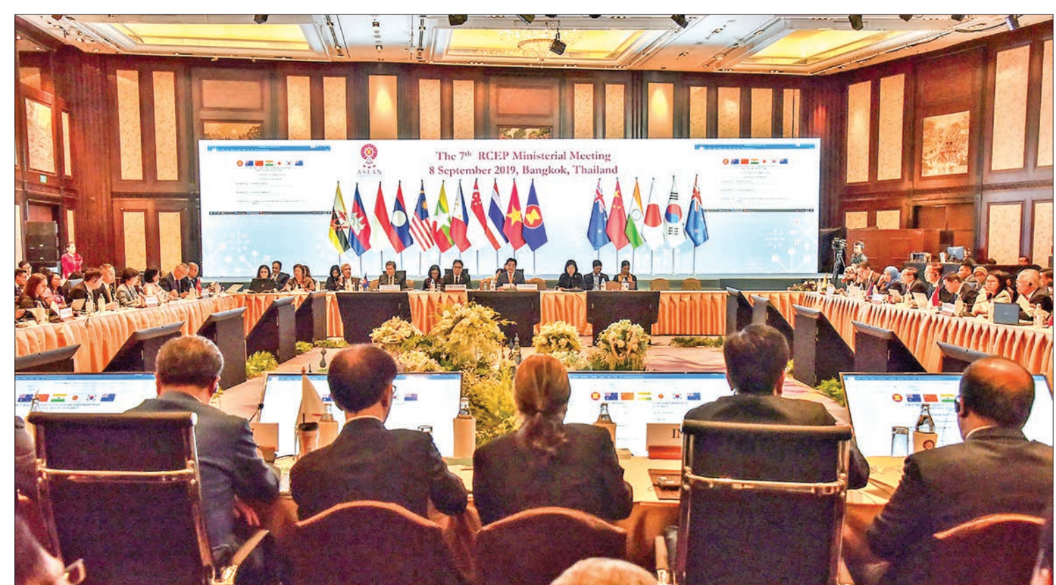
7<sup>th</sup> RCEP Ministerial Meeting in progress.

Because it was in a group of countries that were less de-