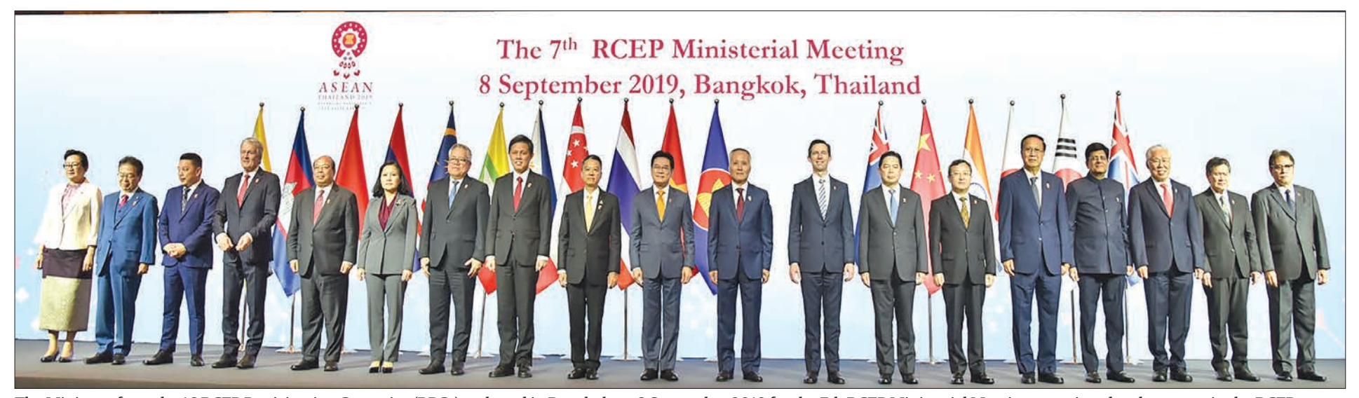
The Ministers from the 16 RCEP Participating Countries (RPCs) gathered in Bangkok on 8 September 2019 for the 7th RCEP Ministerial Meeting to review developments in the RCEP negotiations since the Ministers last met in Beijing on 2-3 August 2019. The Meeting was chaired by H E Jurin Laksanawisit, Deputy Prime Minister and Minister of Commerce of Thailand.

14 BUSINESS 16 OCTOBER 2019 THE GLOBAL NEW LIGHT OF MYANMAR