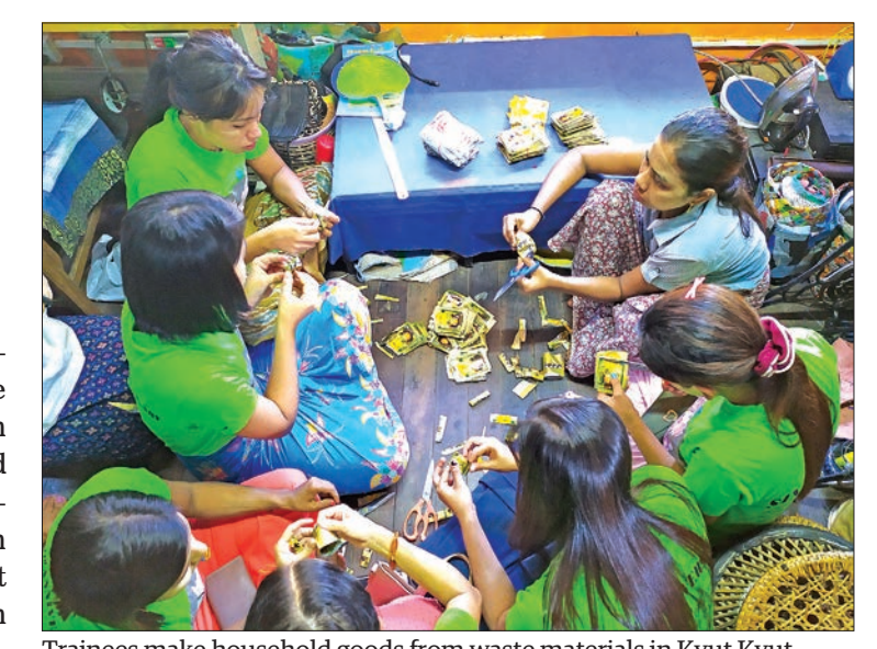
Trainees make household goods from waste materials in Kyut Kyut center in Dala Township.

The training courses include making household items, such as bags, boxes and