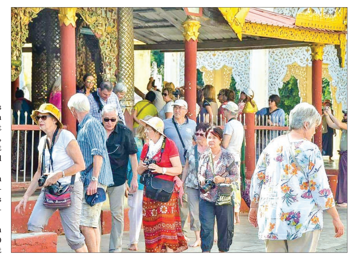
Foreign tourists tour the Shwedagon Pagoda in Yangon.