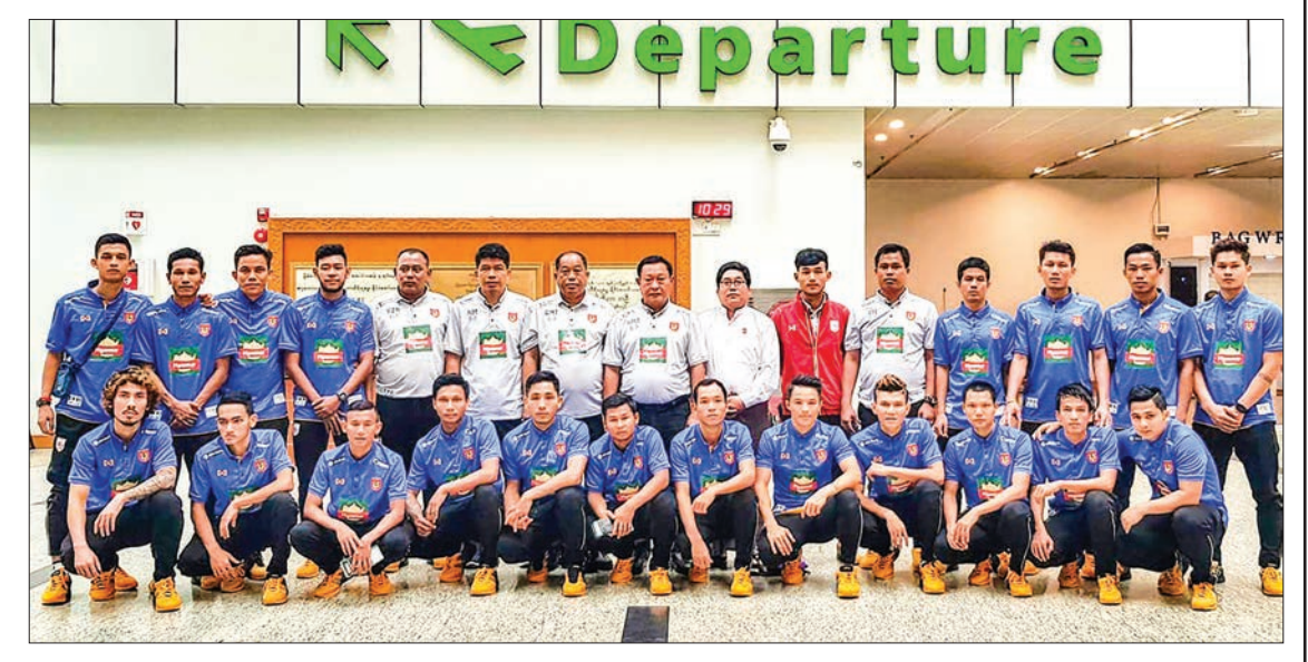
Myanmar futsal team seen off by officials from Myanmar Football Federation at Yangon International Airport yesterday.

THE Myanmar national futsal Airport yesterday. team left for Ho Chi Minh City yesterday to compete in the ASEAN Football Federation (AFF) Futsal Championship 2019, which will be held in Ho Chi Minh City, Viet Nam, from 21 to 27 October, according to the Myanmar Football Federation.