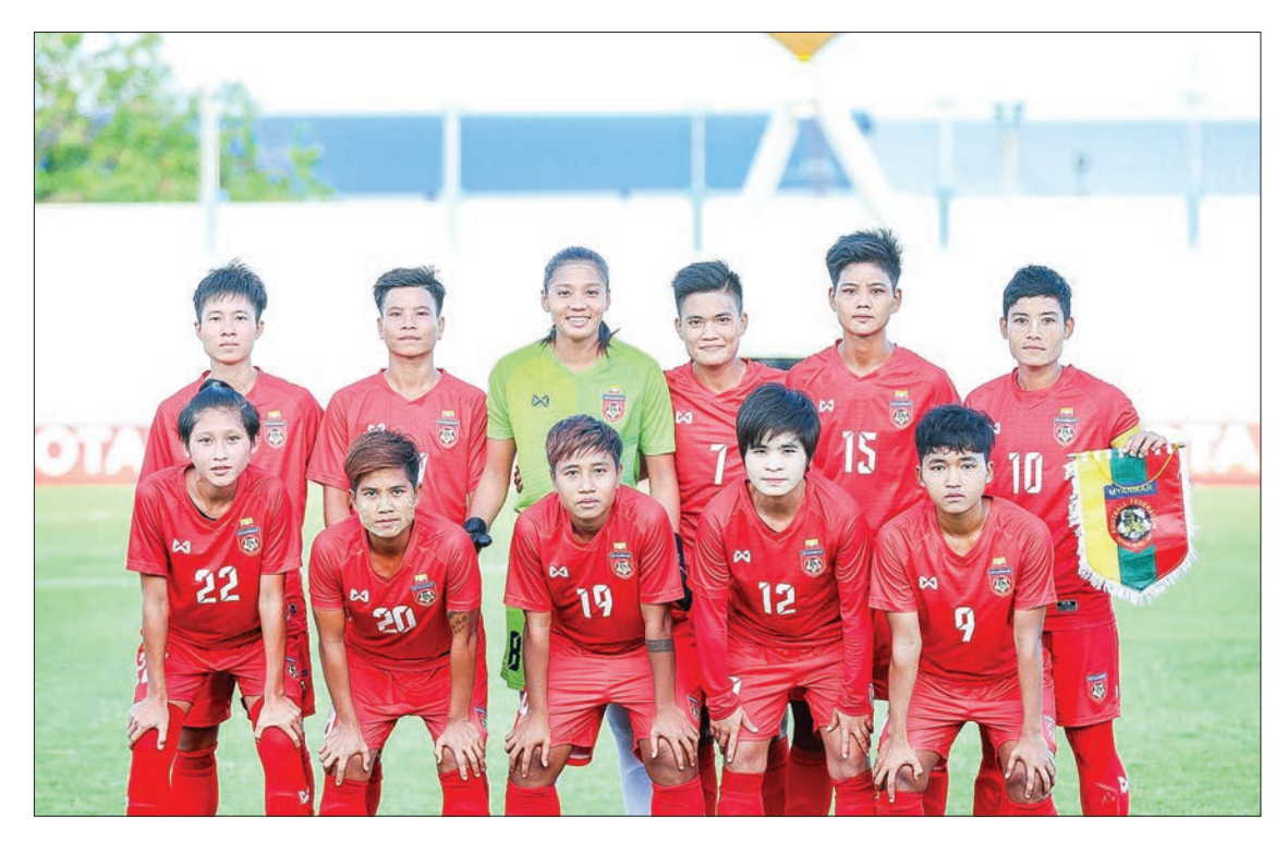
The Myanmar national women's football team pose for a group photo on 18 August, before an international match against the Cambodian team.

"We will first play a group match with the host Philippines team, and the match will be a decisive match for my team to enter the next stage. We are hoping to reach the final match. If we reach the semifinal, we will have five days for preparation, and that will be enough time for our team, and it is good," the head coach added.