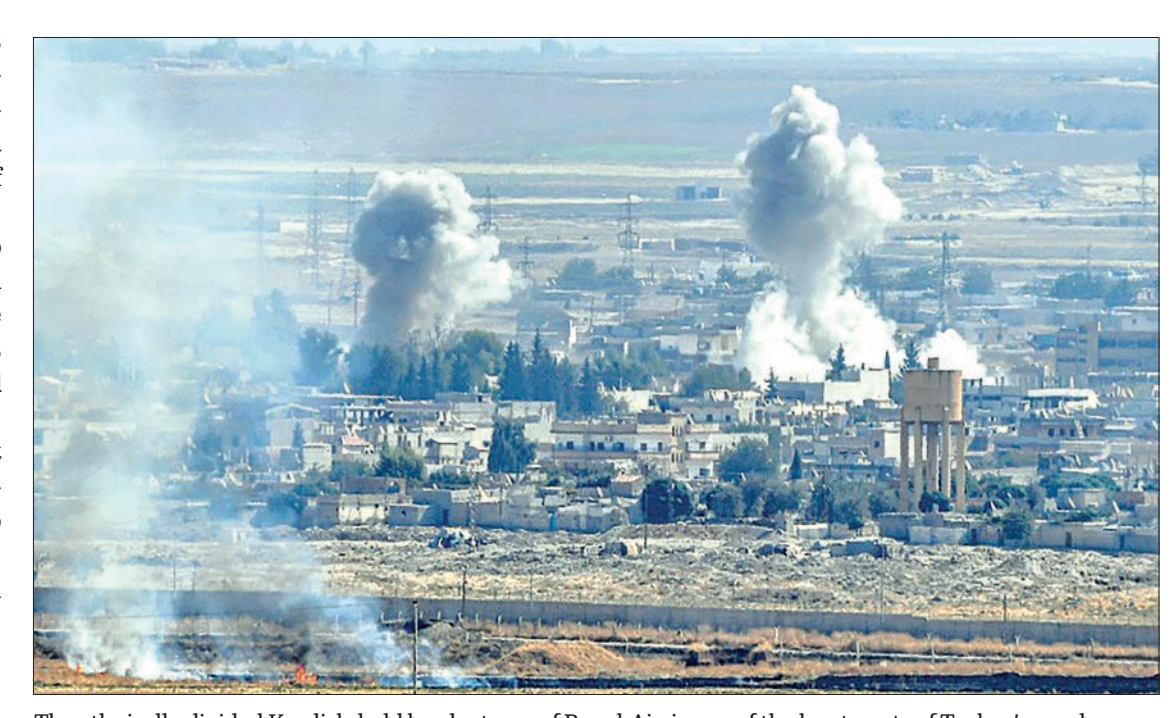
The ethnically divided Kurdish-held border town of Ras al-Ain is one of the key targets of Turkey's nearly week-old invasion and has come under heavy bombardment.

Aid groups, which have warned of a new humanitarian disaster in Syria's eight-year-old war, have been forced to pull out of the conflict zone, Kurdish