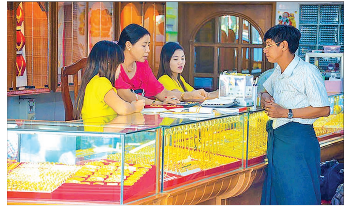
A man negotiates the price of gold jewellery at a gold jewellery shop in Yangon.

According to gold traders, the lowest price for gold in June was K1,099,000 (1 May) and the