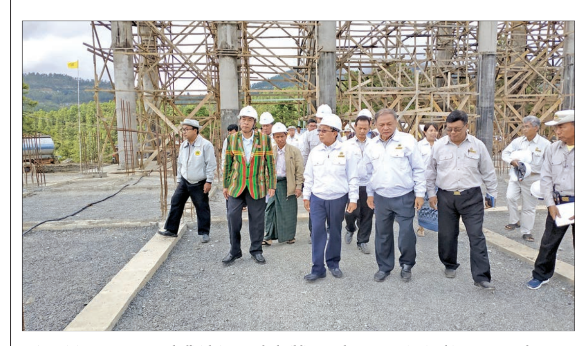
Union Minister U Han Zaw and officials inspect the buildings under construction in Chin State yesterday.

UNION Minister for Construction U Han Zaw, accompanied by Chin State' Chief Minister U Salai Lian Lwal, looked into the constructions and developments of roads, bridges and state-owned buildings in Chin State on 15 October.