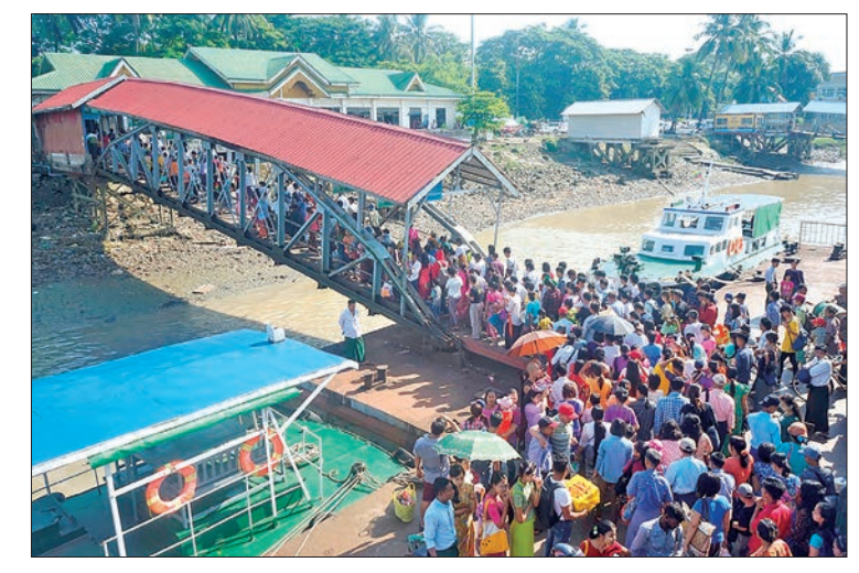
Passengers get off a ferry at the Dala Jetty in Botahtaung Township, Yangon.

Currently, the department is serving the Yangon-Dala ferry boat service with three vessels - Cherry 1, 2 and 3 -which were donated by Japan. The Yangon-Dala ferry boats run 48 trips per day, with over 30,000 passengers. The department can earn over K3 million per day, especially during the holidays. As Yangon is the commercial hub of Myanmar,