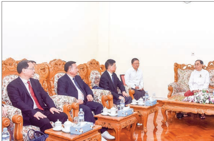
Union Minister Nai Thet Lwin meets with Mr Yu Fei, Chinese Deputy Inspector of Ethnic and Religious Affairs Commission of Guangxi Zhuang Autonomous Region in Nay Pyi Taw yesterday.