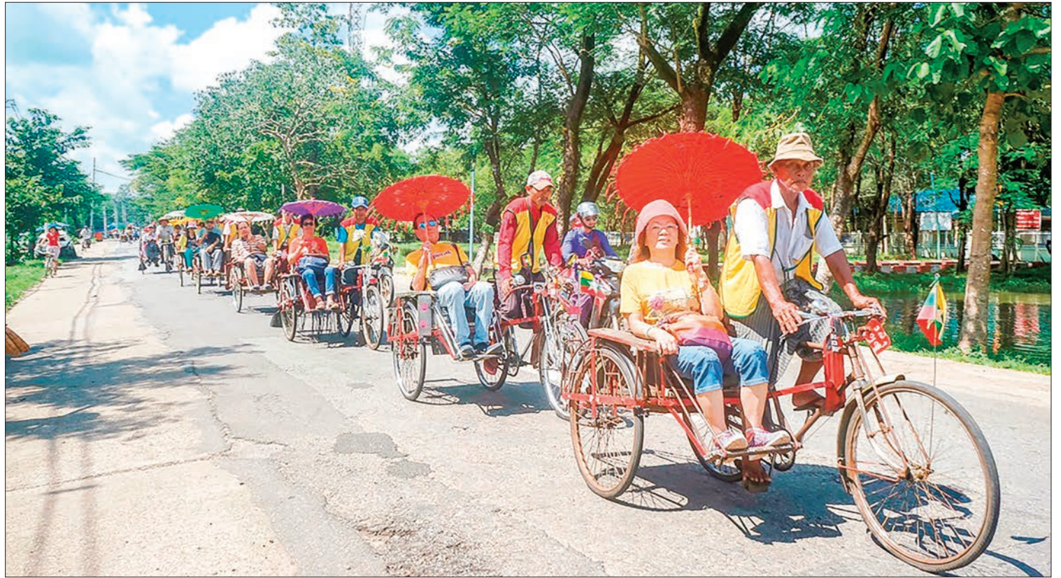
Tourists enjoy riding trishaws to explore places in Dala Township.

TOURIST arrivals in Dala Township, located on the southern bank of Yangon River, are increasing gradually in the high season, with visitors showing a keen interest in observing the livelihoods of local residents and exploring tourist spots.