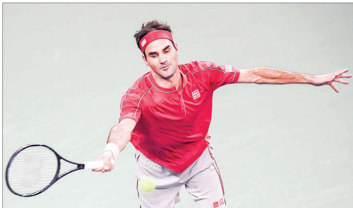
Roger Federer's trademark cool evaded him as the new generation of men's tennis stars took centre stage in Shanghai.

SHANGHAI (China) — Roger Federer's trademark cool spectacularly deserted him and he was given a point penalty as he followed Novak Djokovic out of the Shanghai Masters quarter-finals on Friday.