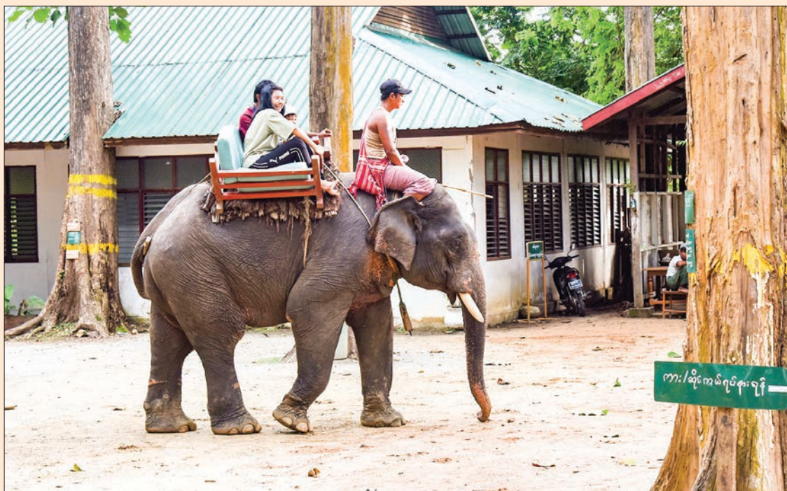
Visitors enjoy riding an elephant at Pho Kyar Elephant Camp on 11 October.