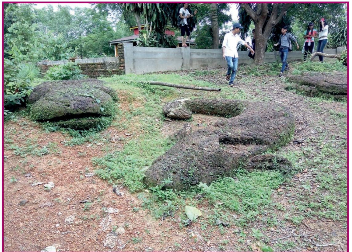
Students and outstanding trainees looking around the site.

Whatever it maybe, laterite images, pagodas and walls are