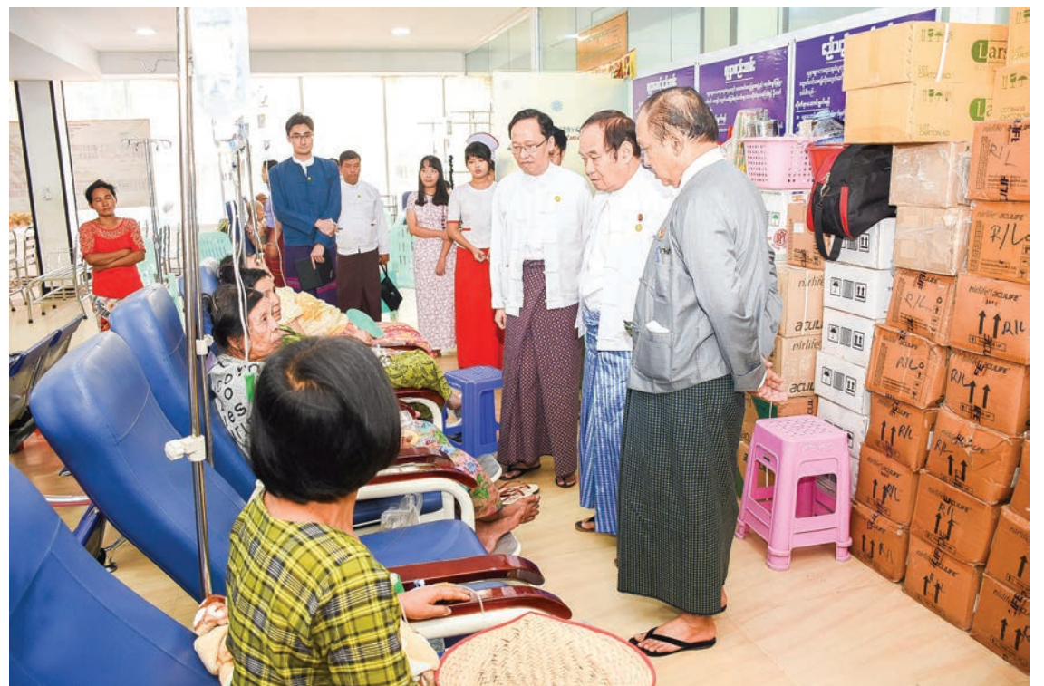
Union Minister Dr Myint Htwe visits North Okkalapa General Hospital in Yangon yesterday.