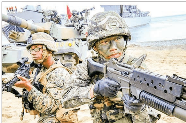
FILE PHOTO: Troops will be cut down from the current level of 464,000 by 2022, the Army said in a report to MPs, according to the South's Yonhap news agency.

Currently 51 million, the population is projected to fall to 39 million in 2067, when the median age will be 62.—AFP ■