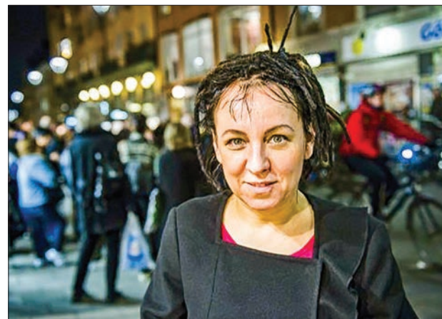
The Polish writer Olga Tokarczuk will receive the Nobel Literature Prize 2018.

Her 900-page “The Books of Jacob”, which the Swedish Academy hailed as her “magnum opus”, spans seven countries, three religions and five languages, tracing the little-known history of