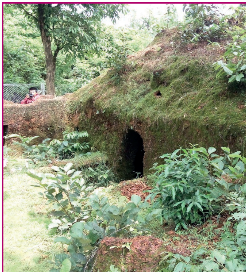
Mote So Ma Cave.