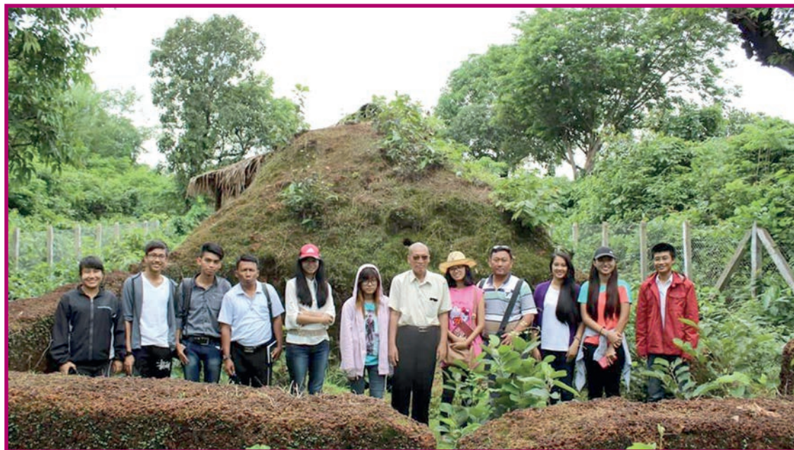
Students from post-graduate diploma course of Archaeology Department from Yangon University and some outstanding trainees pose for documentary Photo.

ancient objects bearing historical images of laterite culture. They are firm evidences for new generations to conduct researches. However, it needs to preserve laterite works without strengths of resilience as stones against impacts of raining and flooding.