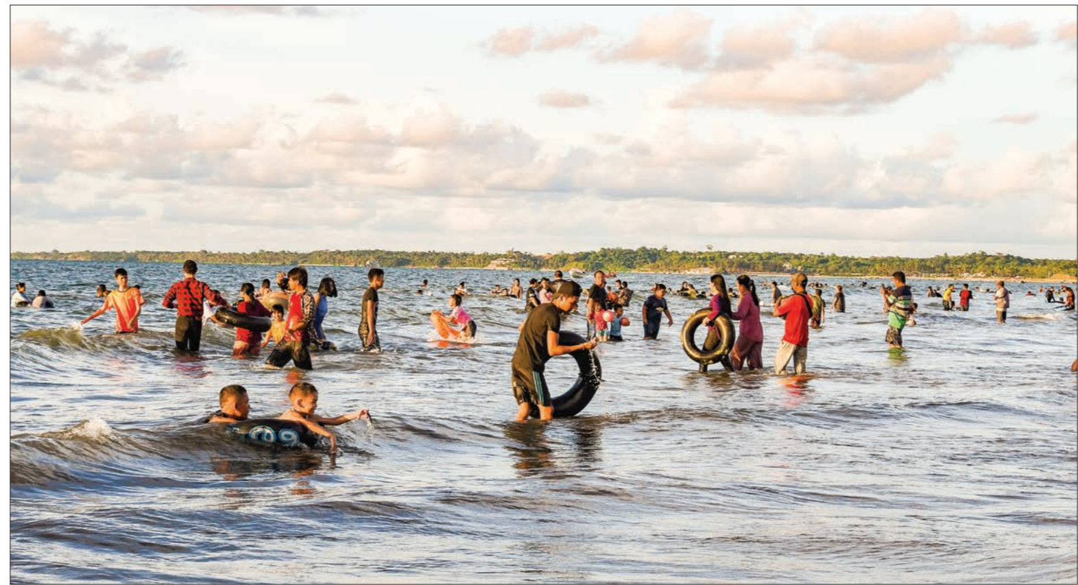
Holidaymakers enjoy the beautiful beach of Chaungtha.

are visiting Phokalar island by motorboat. It is more pleasant with beautiful scenic views than Chaungtha beach.