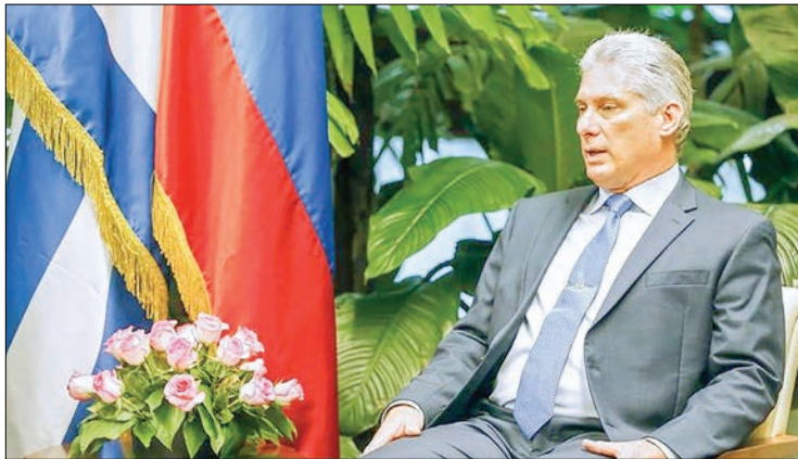
Cuban President Miguel Diaz-Canel meets with Russian Prime Minister Dmitry Medvedev (out of frame) at the Revolution Palace in Havana, on 3 October, 2019.

The extraordinary session, held at Havana's Convention Center, was attended by the first secretary of the PCC, Raul Castro. Since September 18, the members of the National Candidacy Commission have been consulting with lawmakers over