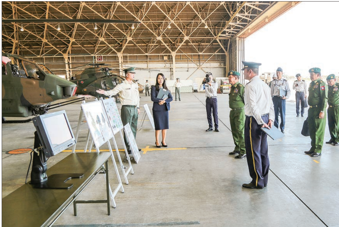
Defence Services Commander-in-Chief Senior General Min Aung Hlaing observes Tachikawa Camp in Tokyo yesterday.

Next, the Tatmadaw Commander-in-Chief and party visited Japan's own design helicopters, pre-deployed helicopters for natural disaster relief and rescue works, air-defence preparations and conducted aerial ob-