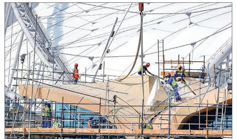
The UN study praised measures taken to reduce the effects of heat on 4,000 workers at one World Cup stadium project.