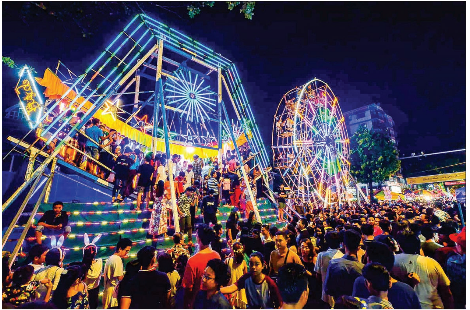
Yekyaw Thadingyut Festival is seen crowded with the visitors on second Day.

lice Force and Auxiliary Fire Brigade were found taking security measures together with the helps of local people and security cameras. Meanwhile,