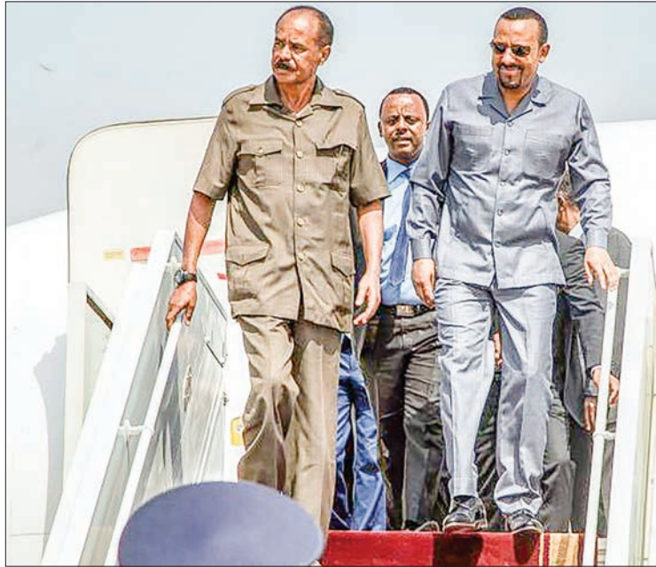
Eritrea's President Isaias Afwerki (l) and Ethiopia's Prime Minister Abiy Ahmed (r) disembark from an airplane upon arrival at Juba International Airport in South Sudan on 4 March.

“It is a prize given to Africa, given to Ethiopia.” Abiy also said he hoped it would inspire other African leaders to “think it possible to work on peace-building processes”. Since taking office in April 2018, the 43-year-old has aggressively pursued policies that have the potential to upend society in the Horn of Africa nation and reshape dynamics beyond