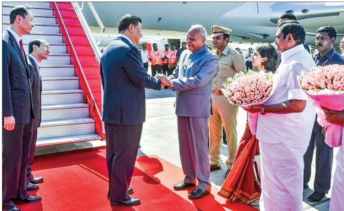
Xi landed at the Chennai airport, where Tamil Nadu state Governor Patwarilal Purohit greeted him with a bouquet as a cultural group beat drums and blew horns.

India's foreign ministry said the summit will "provide an opportunity for the two leaders to continue their discussions on overarching issues of bilateral, regional and global importance