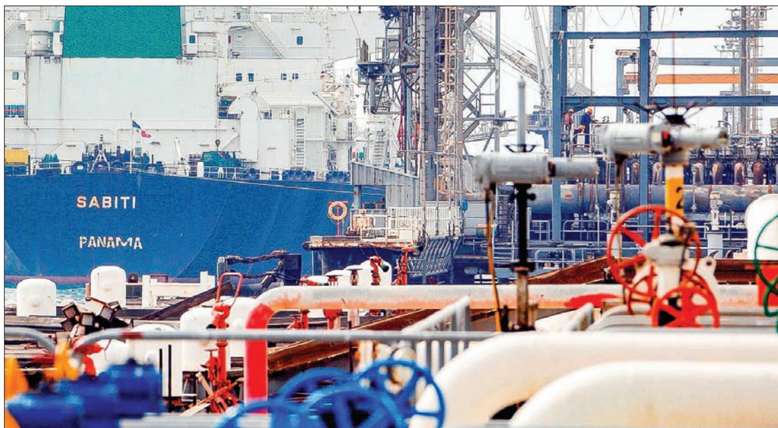
A picture taken in March 2017 shows the Sabiti docking at the platform of the oil facility in the Kharg Island.

“Fortunately, all crew on board are safe and sound and the ship is in a stable condition. Only the body of the ship has suffered damage and the crew of the ship is working to control