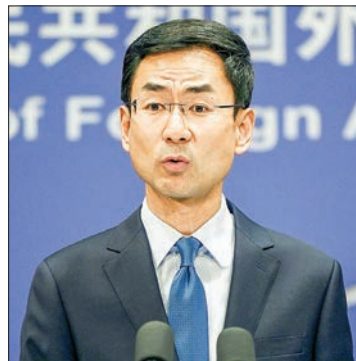
File photo shows Chinese Foreign Ministry spokesman Geng Shuang.

"Payment of UN contributions on time, in full and without