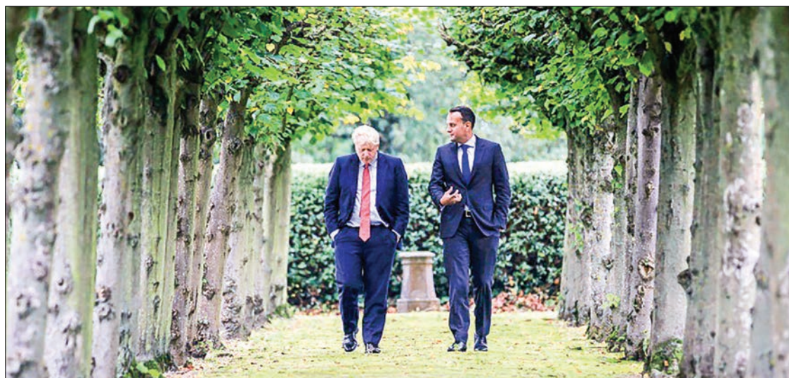
Ireland's Prime Minister, Leo Varadkar and Britain's Prime Minister Boris Johnson say they can see a "pathway" to a Brexit deal, but EU diplomats warn the road ahead is long.

As they met, the president of the European Council and host of next week's Brussels summit Donald Tusk warned that Britain has yet to come forward with a "workable, realistic proposal" for a Brexit deal. "A week ago I told Prime Minister Johnson that if