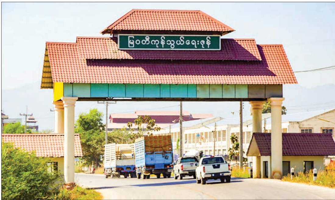
File photo shows cars passing through the Myawady Border trade zone.

MYANMAR-THAILAND bilateral trade between 1 October and 30 September in the 2018-2019 financial year exceeded US$4.1 billion, an increase of $2.4 billion from the 2017-2018FY, according to the Ministry of Commerce.