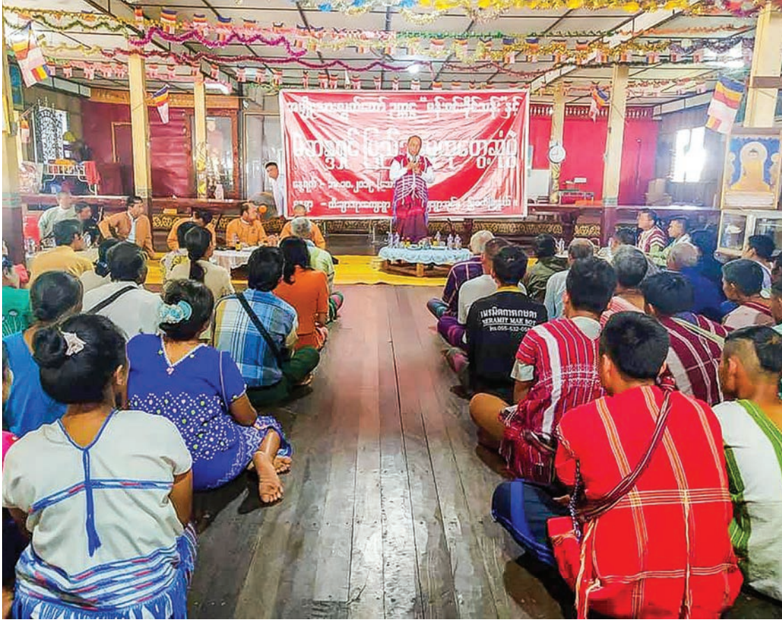
Amyotha Hluttaw Speaker Mahn Win Khaing Than meeting with local people from Htichaya Village in Myawady District.