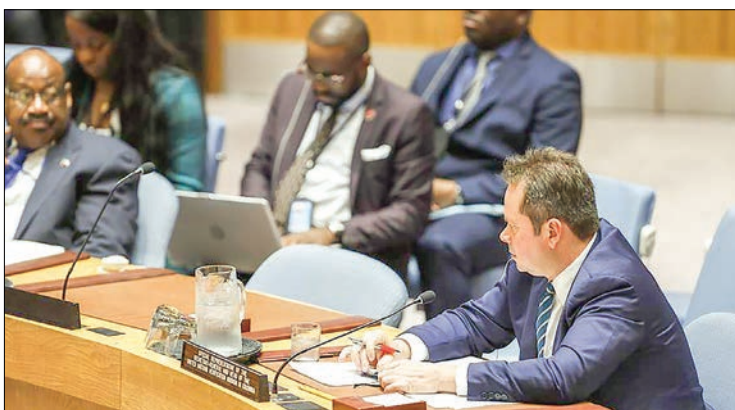
Carlos Ruiz Massieu (Front), the UN secretary-general's special representative and head of the UN Verification Mission in Colombia, attends a Security Council meeting on the situation in Colombia, at the UN headquarters in New York, on 10 October, 2019.

combatants are involved in collective and individual productive projects, ranging from agricul-