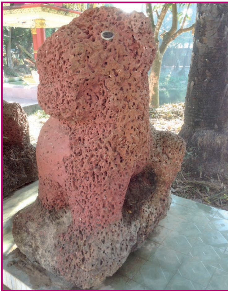
A statue made of laterite.

A brick with finger lines with 15 inches in length, 7.5 inches in