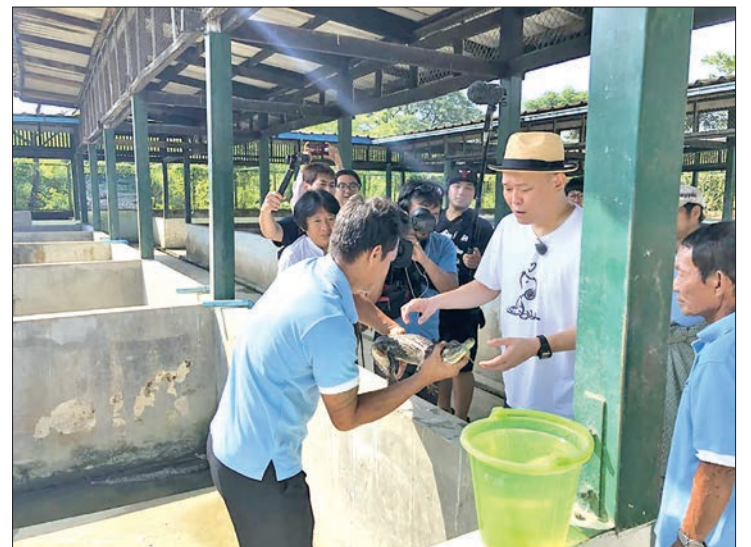
Film crew shooting the crocodile farm in Thaketa.