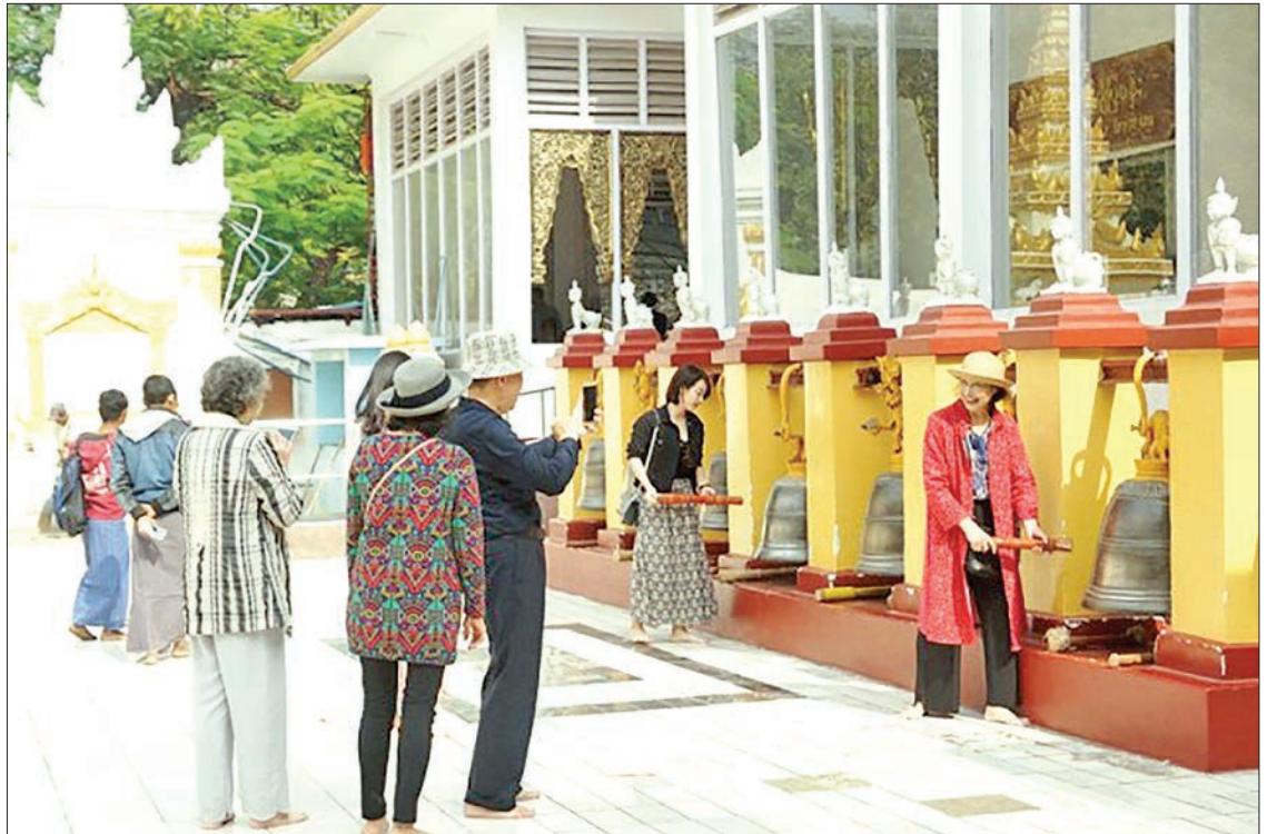
A tourist takes a photo of a fellow tourist striking a bell at the Mahamuni Pagoda in Mandalay.

Currently, tourists are being allowed to enter the Mahamuni pagoda only through the Tourist Information Center, located in the north of the pagoda. Another tourist information center is being constructed to serve the high number of tourists. Moreover, toilets, lockers, wet tissues, and other services are already being offered to international visitors, and security staff and direction boards have been placed at the entrance, according