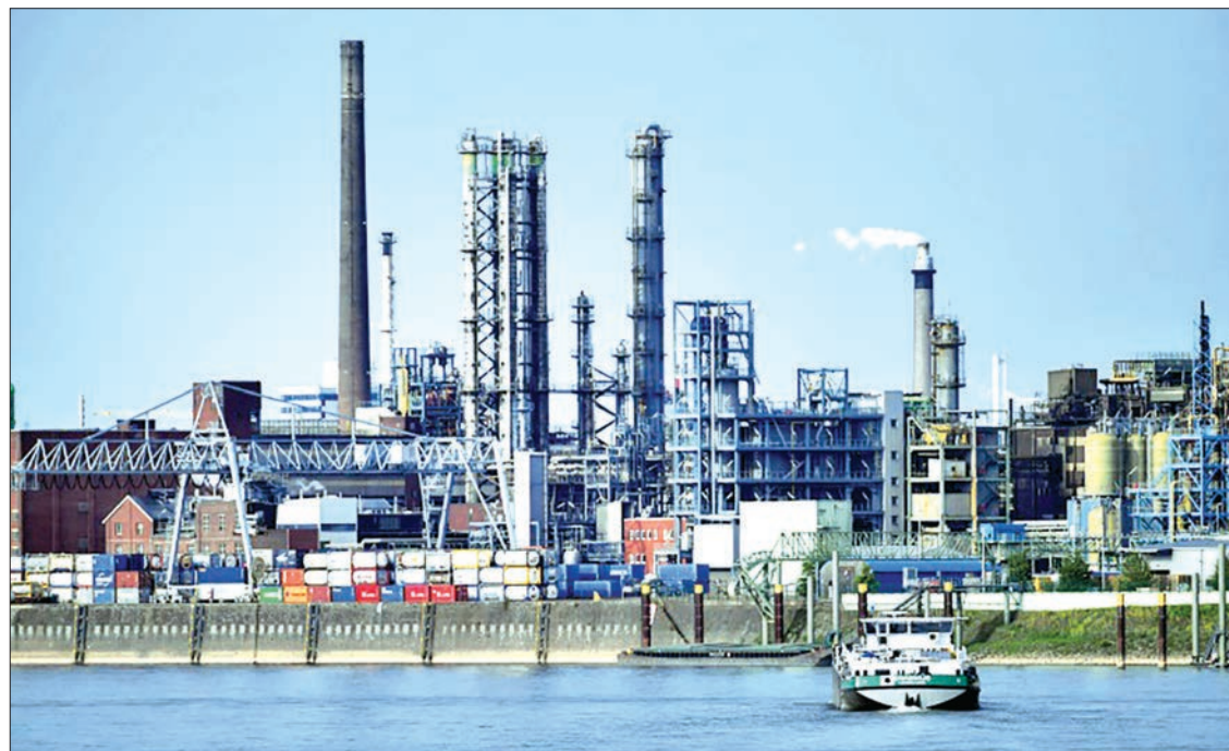
The German chemical industry has put a price tag on going carbon neutral.

By comparison, a no-new-action scenario could bring a 27-percent reduction in CO2 output using only the seven billion euros already committed to greening chemical plants.—AFP ■