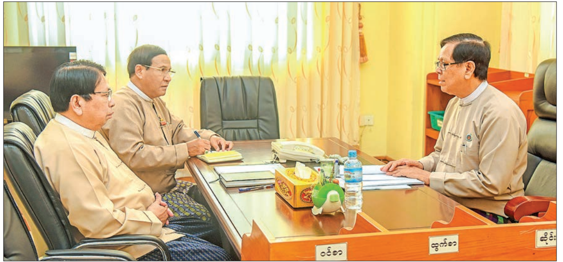
Amyotha Hluttaw Deputy Speaker U Aye Tha Aung, Union Minister Dr Pe Myint and Deputy Minister for Office of the Union Government U Tin Myint hold coordination meeting in Nay Pyi Taw.