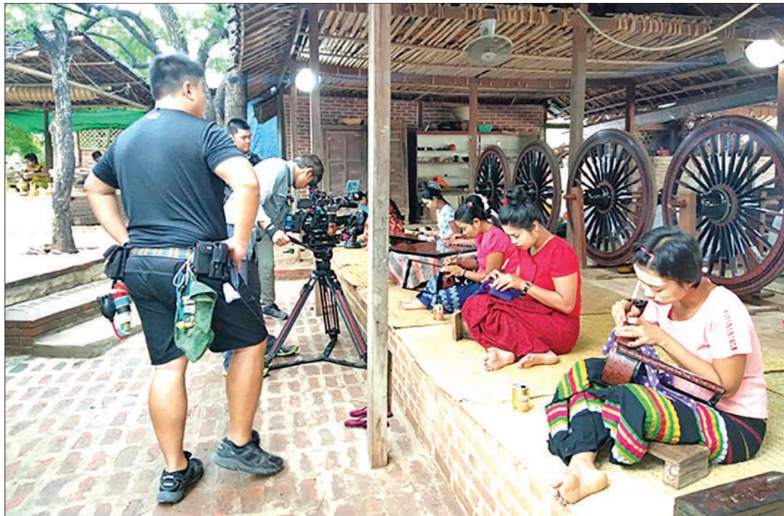
Channel News Asia crew shooting women crafting on lacquerwares in Bagan.

THE Channel News Asia filmed a travel documentary in and around ancient Bagan, the UNESCO Heritage Site of Myanmar.