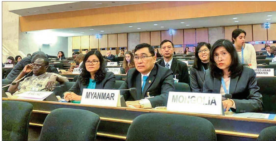
Union Minister Dr Win Myat Aye attends the 70 th Annual Plenary Session of the Executive Committee of the High Commissioner's Programme (ExCom) in Geneva.

"Although Myanmar is not a party to the 1954 Convention relating to the Status of Stateless Persons and the 1961 Convention on the Reduction of Statelessness, the Government has committed to achieving the realization of human rights based on international humanitarian principles."