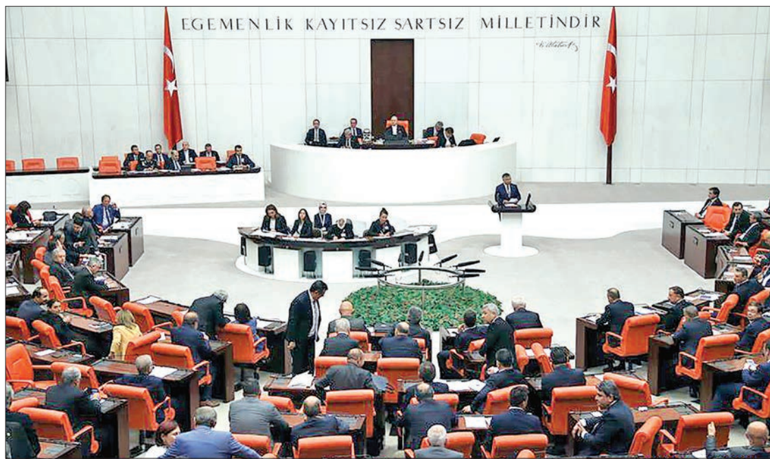
Turkish parliament members vote for a motion to extend the government's authority to launch cross-border military operations in Iraq and Syria, in Ankara, Turkey, on 8 October, 2019.

The motion stated that Turkey attaches great importance to the protection of Iraq's territorial integrity, national unity, and stability. "However, the existence of PKK and Daesh in Iraq poses a direct threat to regional peace, stability and the security of our country," it added, using the Arabic acronym of Islamic State (IS). It also said that Turkey has continued security activities in the east of Euphrates in line with its legitimate security interests.