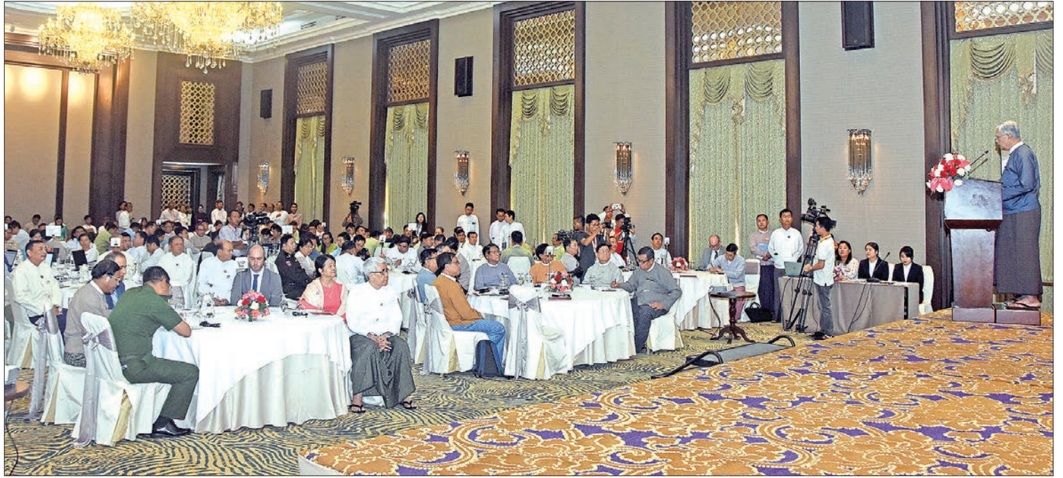
Anti-Corruption Commission Chairman U Aung Kyi delivers the opening speech at the ceremony to undergo trial the corruption prevention unit toolkit (CPU toolkit) in Nay Pyi Taw yesterday.

Currently, there are 37 CPUs under 17 union ministries and 5 Union-level institutions and all of them are assigned