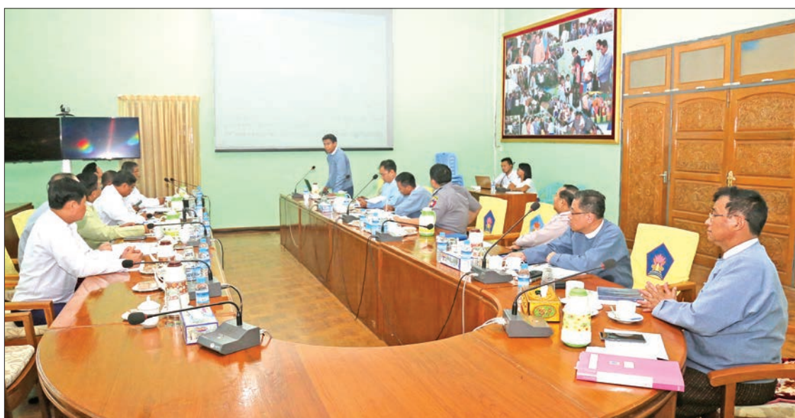
Deputy Minister U Soe Aung attends the coordination meeting on the surveys conducted by Committee for Implementation of the Recommendations on Rakhine State held in Nay Pyi Taw yesterday.

The Committee conducted a field survey in Rakhine State from 29 September to 4 October 2019. The field survey and the findings and reports of the United Nations Secretary-Gen-