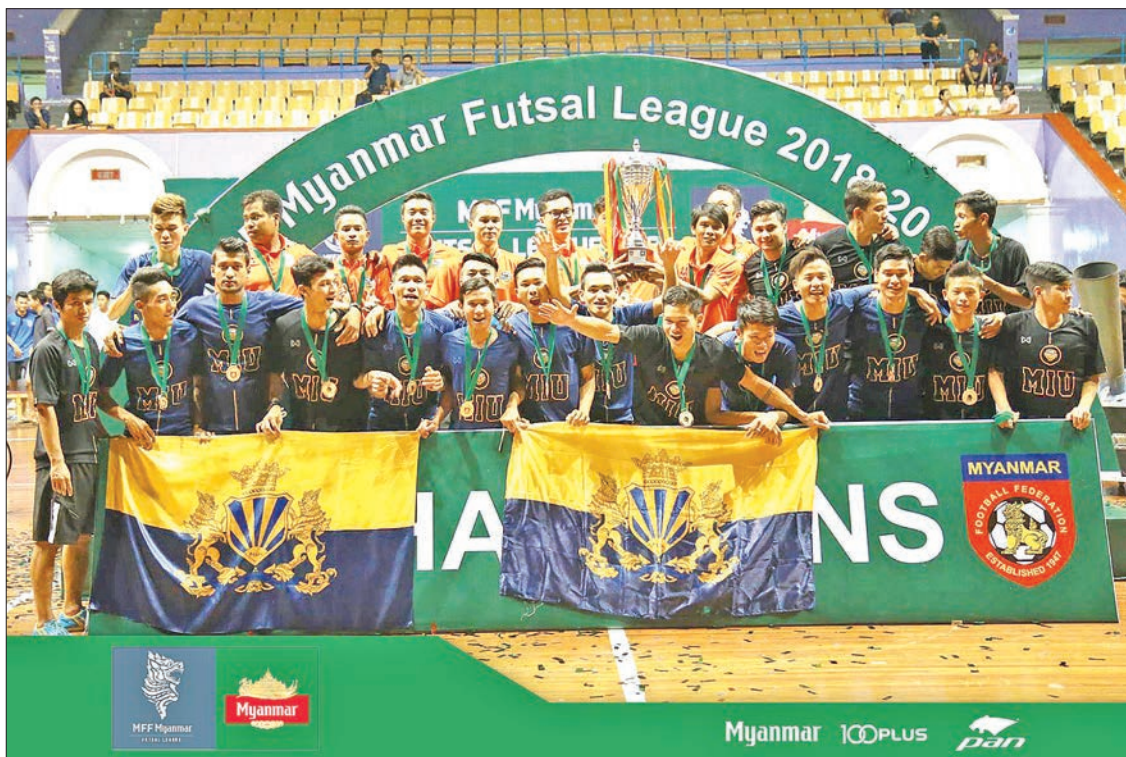
The champions of the Myanmar Futsal League 2018-2019, the Myanmar Imperial University F.C., seen holding their championship trophy.

THE Myanmar Futsal League 2019-2020, which will be supervised by the Myanmar Football Federation, will be held in November. Twelve teams will compete in the tourney, according to a statement issued yesterday by the football federation.