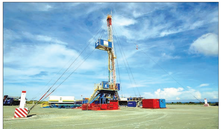
Russia sees the oil price at $50 per barrel.