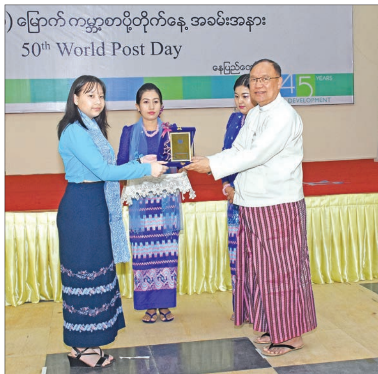
Union Minister for Transport and Communications U Thant Sin Maung presents prize to winner Ma Shwan Le Win in Nay Pyi Taw yesterday.

THE 2019 World Post Day was celebrated at the meeting hall of Ministry of Transport and Communications in Nay Pyi Taw yesterday.