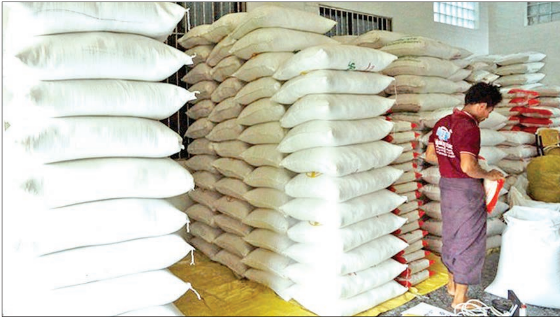
Accumulation of rice bags for export.

THE volume of rice and broken rice exported over eleven-and-a-half months since October in the previous financial year was estimated at over 2.29 million metric tons, worth $691 million, according to an announcement from the Myanmar Rice Federation.