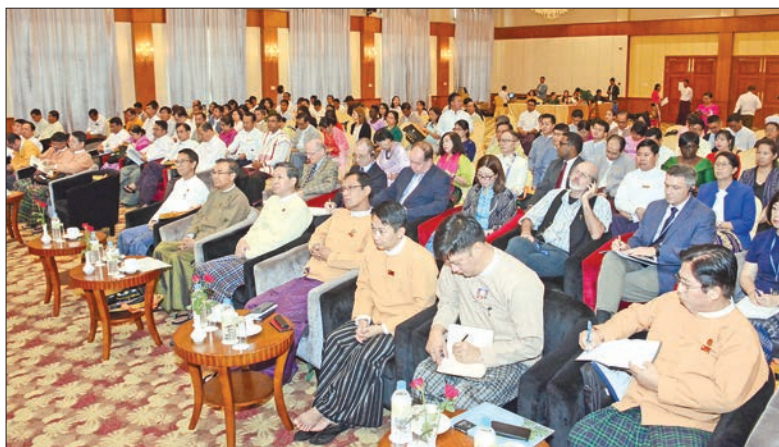
Union Minister for Health and Sports Dr Myint Htwe addresses the second coordination meeting of National Nutrition Steering Committee in Nay Pyi Taw yesterday.

THE second coordination meeting of National Nutrition Steering Committee was held at the Horizon Lake View Hotel in Nay Pyi Taw yesterday morning.