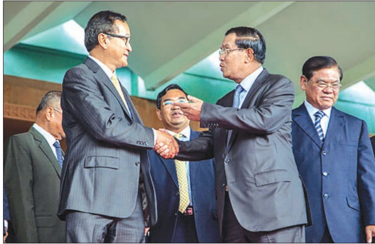
Cambodian Prime Minister Hun Sen (r) shakes hands with the President of the opposition Cambodia National Rescue Party, Sam Rainsy in July 2014.

The fresh charge of an attempted coup alone could land him in prison for as long as 30 years if found guilty.