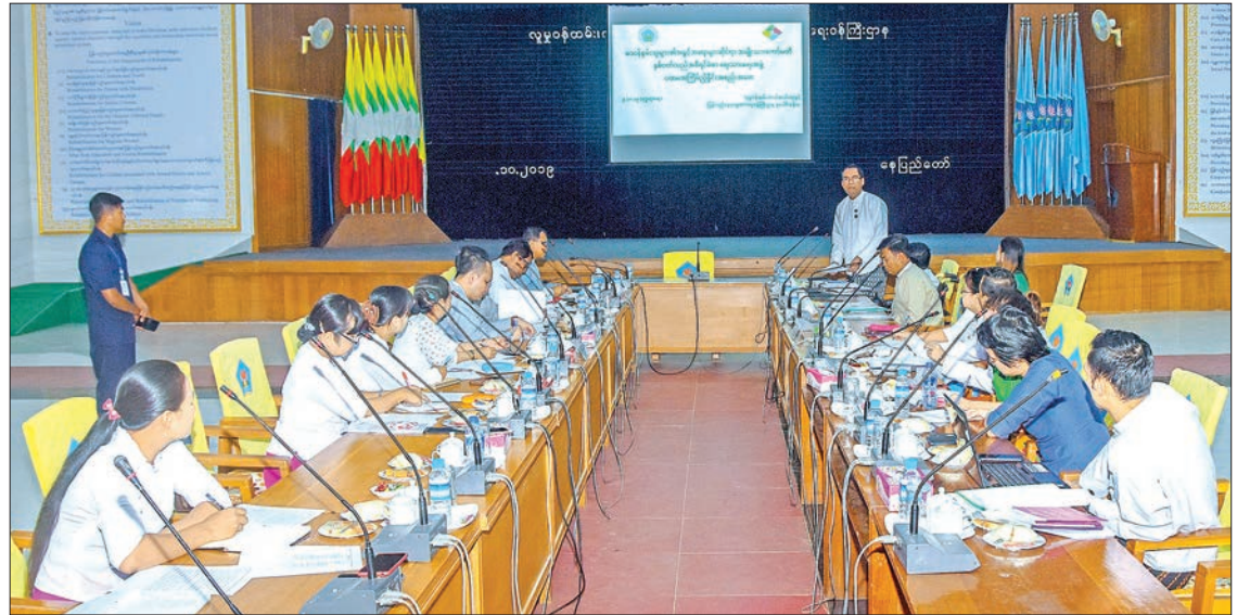
Deputy Minister for Information U Aung Hla Tun delivers the speech at the meeting for annual report of National Committee on the Rights of Persons with Disabilities (NCRPD) in Nay Pyi Taw yesterday.