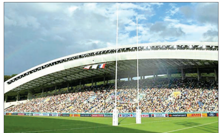
Rugby World Cup fixtures and the Formula 1 Japanese Grand Prix could be affected by Typhoon Hagibis, which is expected to bring disruption to southern Japan. The Fukuoka Hakatanomori Stadium will host the Ireland vs. Samoa pool A match on 12 October.

Hagibis, the 19 th typhoon of the season, is moving at a speed of around 15 kilometers per hour and has an atmospheric pressure of 915 hectopascals at its center. The powerful storm is packing gusts of up to 270 kph, the JMA also said. —Xinhua ■