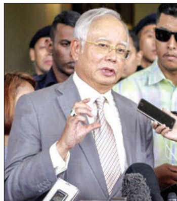
Former Malaysian Prime Minister Najib Abdul Razak speaks to reporters in Kuala Lumpur on 25 October 2018, after being released on bail.

Najib, who is facing a total of 42 corruption charges, is accused