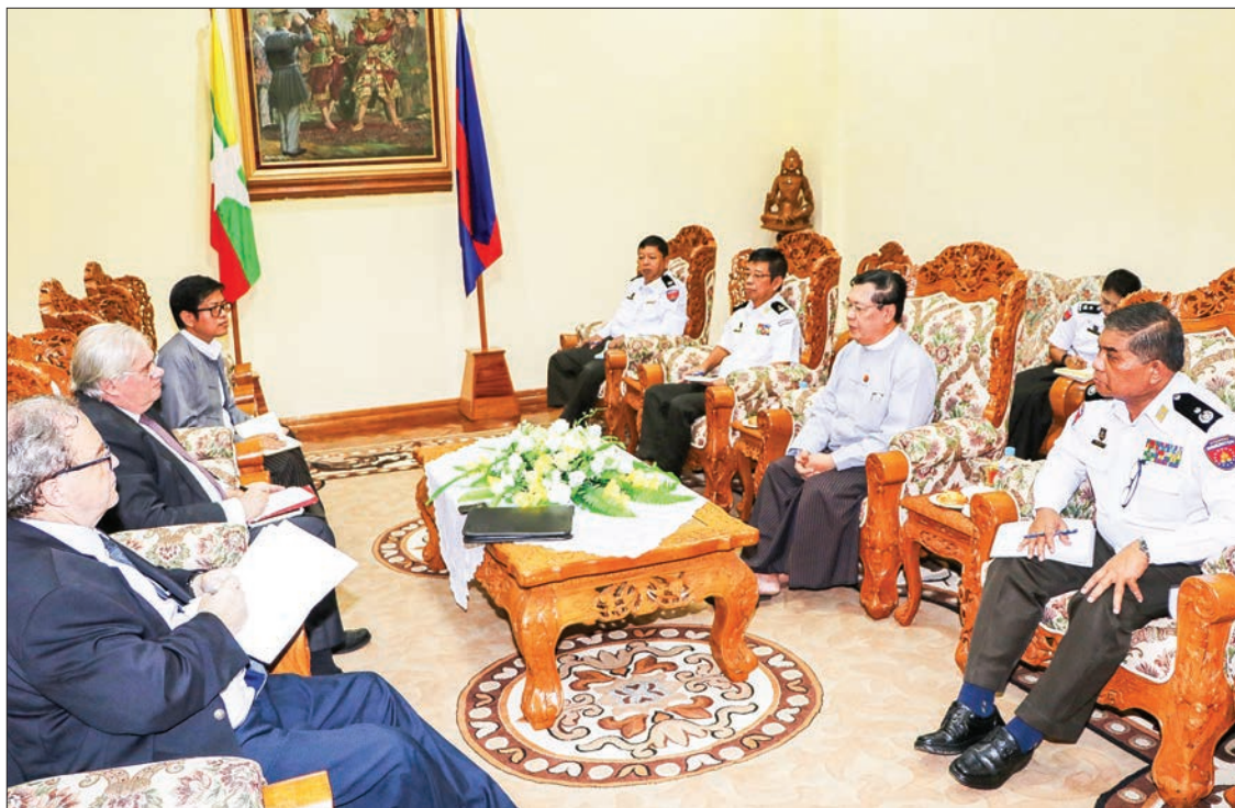
Union Minister for Labour, Immigration and Population U Thein Swe meets with Ambassador of France Mr. Christian Lechervy in Nay Pyi Taw yesterday.

UNION Minister for Labour, Immigration and Population U Thein Swe received the Ambassador of France to Myanmar, Mr Christian Lechervy, at the former's office in Nay Pyi Taw yesterday morning.