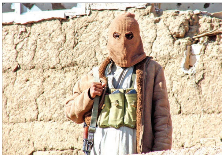
The file photo shows a masked Yemeni Huthi rebel in front of a heavily damaged building in central Saada, north of the capital Sanaa, on 28 February 2010.

Riyadh and Washington, however, blamed Iran for the attacks — a charge denied by Tehran.— AFP ■