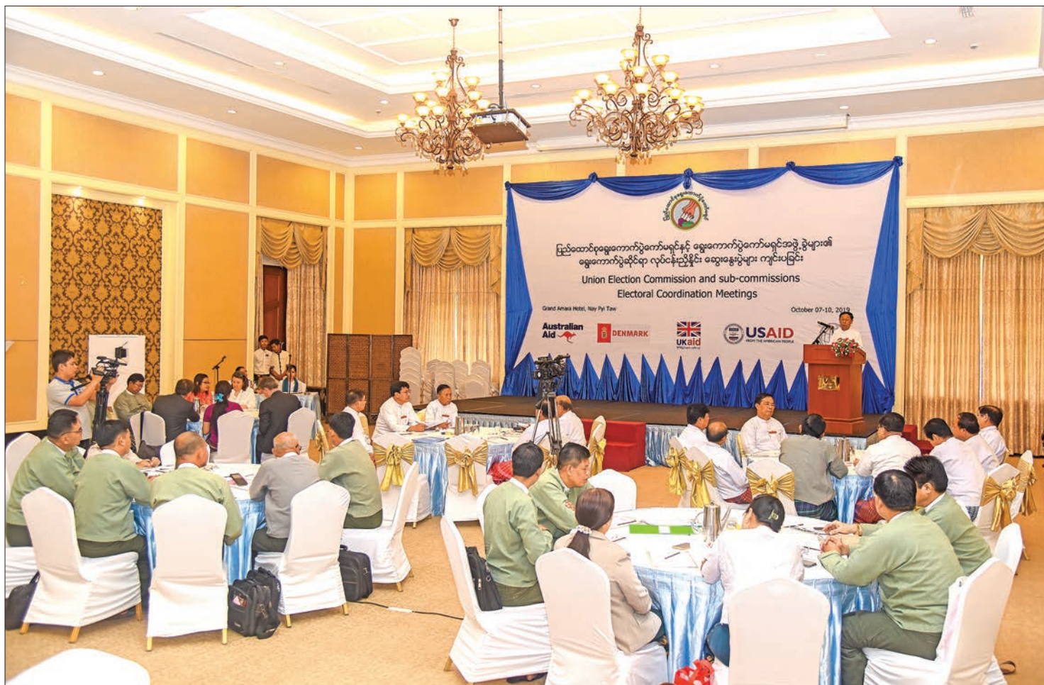
Chairman of the Union Election Commission U Hla Thein delivers the speech at the launching of Electoral Coordination Meetings between the Union Election Commission and sub-commissions in Nay Pyi Taw.

THE Union Election Commission (UEC) initiated a series of coordination meetings between the UEC and sub commissions with a launch ceremony at Grand Amara Hotel, Nay Pyi Taw, yesterday.