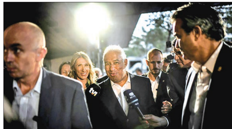
Socialist Prime Minister Antonio Costa (C) arrives at a party gathering in Lisbon as exit polls show the Socialists have taken the lead in Sunday's election.