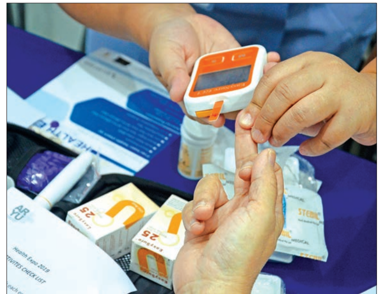
A visitor gets checked for diabetes during the health expo held at Ar Yu International Hospital, Yangon.

Ar Yu International Hospital in Yangon is conducting a health expo from 4 to 6 October, offering free medical checkups to visitors.