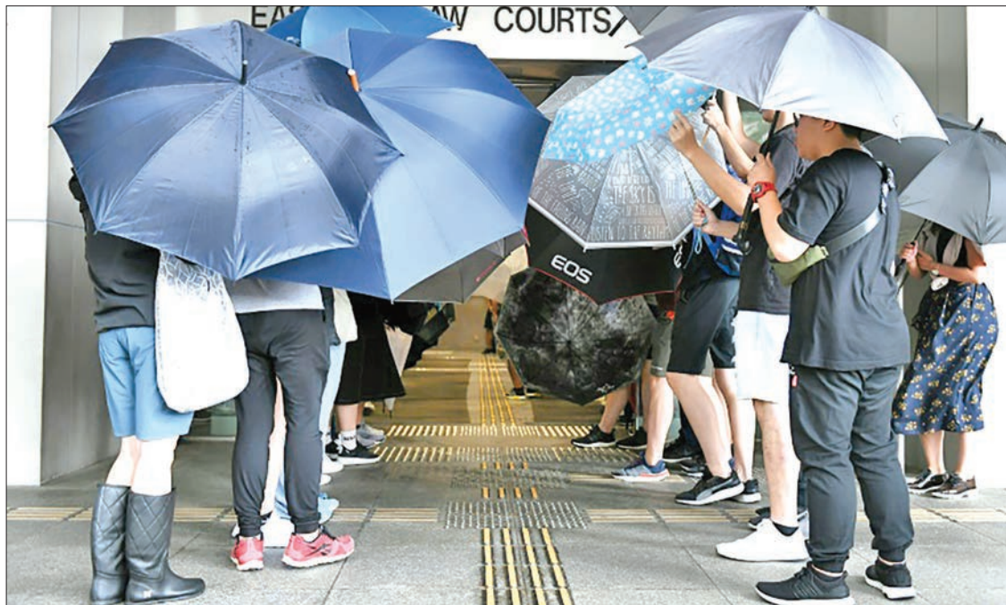
Protesters covered themselves with umbrellas as they gathered outside the Eastern District Courts in Hong Kong.

After Beijing and local leaders took a hard stance, the demonstrations snowballed into a wider movement calling for more democratic freedoms and police accountability. —AFP ■