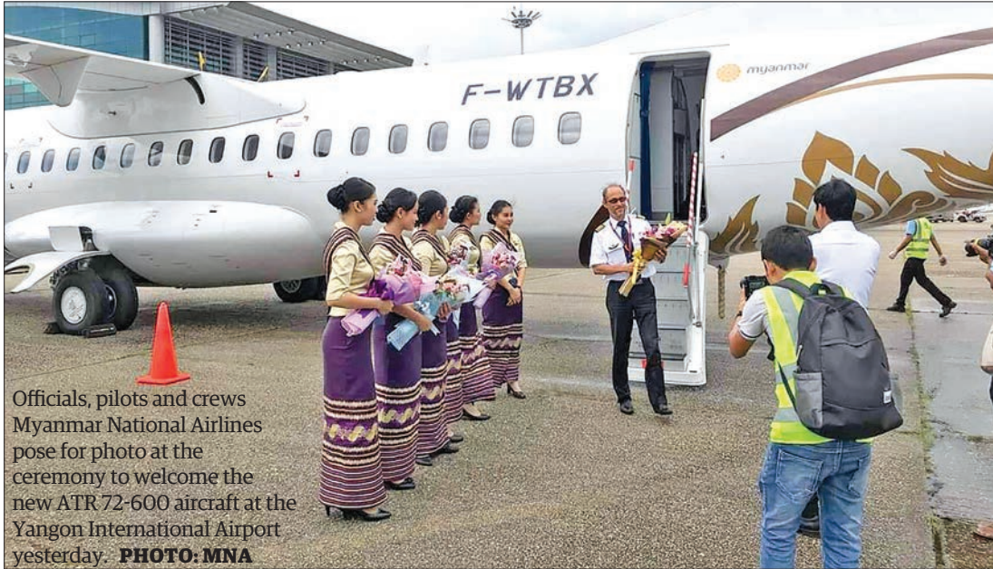
Officials, pilots and crews Myanmar National Airlines pose for photo at the ceremony to welcome the new ATR 72-600 aircraft at the Yangon International Airport yesterday.

MYANMAR National Airlines received 11 th ATR aircraft at the Yangon International Airport on 6 October.