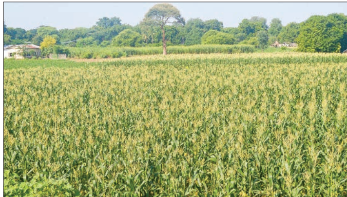
Maize crop plantation in NyaungU Township.

“With the corn market becoming stable due to high demand from corn brokers from rural regions, farmers made a profit in spite of the FAW problem,” according to U Min Nyo, a farmer from Taungphattan village.