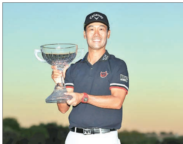
Korean-born American Kevin Na celebrates with the trophy after winning the US PGA Tour's Shriners Hospitals for Children Open at the second playoff hole in Las Vegas.

Both players birdied the 12th, 13th and 15th before Cantlay took a one-shot lead with a birdie at 16, where Na was in the