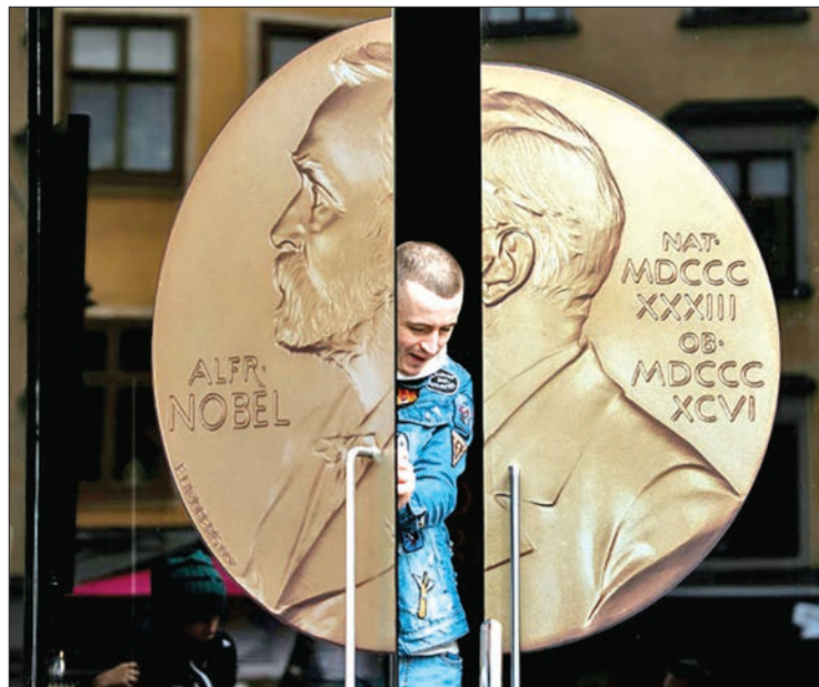
Predictions about possible winners are notoriously difficult as the prize-awarding institutions keep the names of the nominees secret for 50 years.