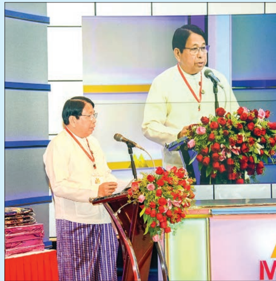
Union Minister Dr Pe Myint delivers the opening speech at the launching ceremony on completion of Broadcasting Equipment Installation in Myanmar Radio and Television in Yangon yesterday.

In his welcoming remark, Union Minister Dr Pe Myint appraised the years-long friendly relationship and broadcast media cooperation among other