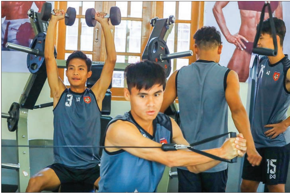
Myanmar U-19 players receive training yesterday at the Fitness Gym Center in Taunggyi Sports Stadium ahead of the 2020 AFC U-19 qualifiers.

IN preparation for the upcoming qualifiers for the Asian Football Confederation (AFC) U-19 Championship, the Myanmar U-19 men's national football team is currently undergoing special training in Taunggyi, according to the Myanmar Football Federation.