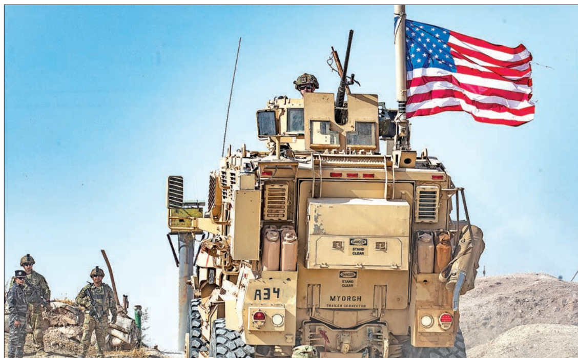
A US soldier sits atop an armoured vehicle during a demonstration by Syrian Kurds against Turkish threats at a US-led international coalition base on the outskirts of Ras al-Ain town in Syria's Hasakeh province near the Turkish border on 6 October 2019.

"As the Syrian Democratic Forces, we are determined to defend our land at all costs," it said in a statement posted on social media. —AFP ■