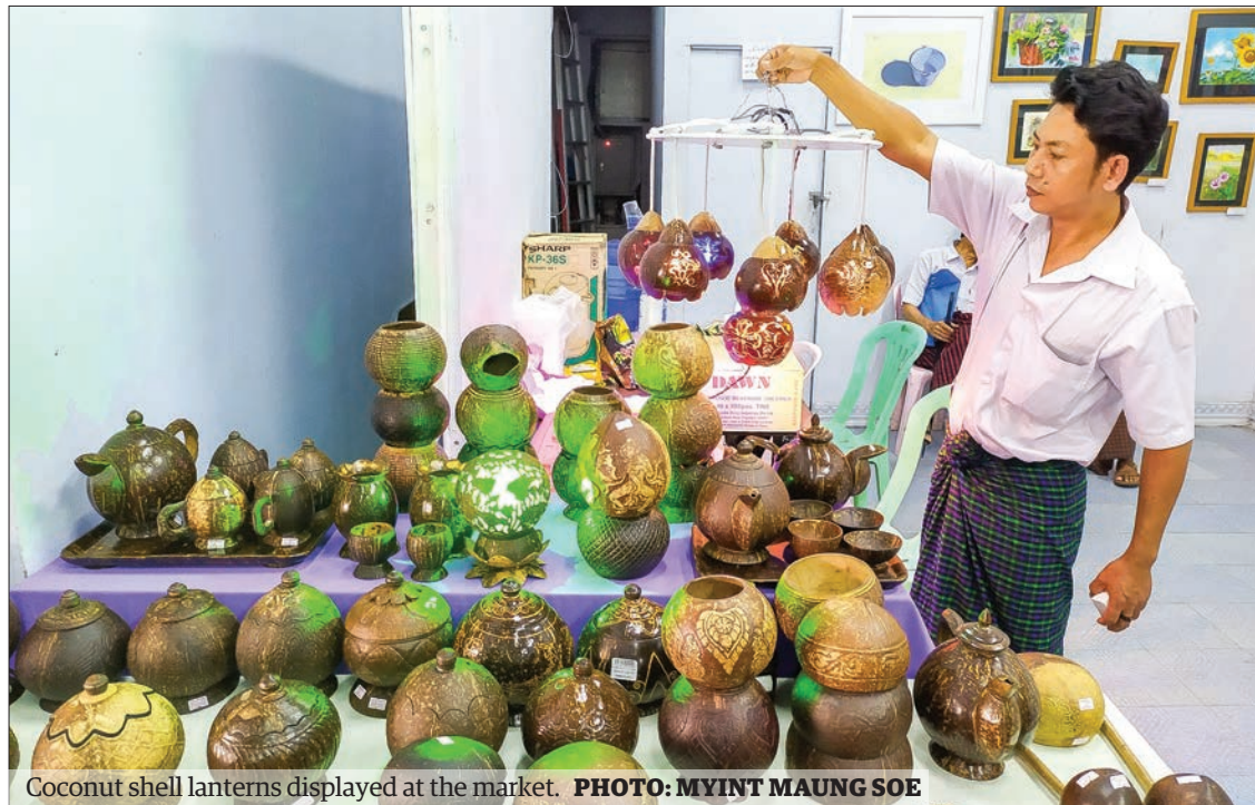
Coconut shell lanterns displayed at the market.