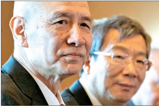
Chinese Vice Premier Liu He is due to lead a delegation to Washington to resume trade talks this week.

HONG KONG (China) — Most markets rose in Asia Monday after a mixed US jobs report eased worries about a recession in the world's top economy but maintained expectations the Federal Reserve will press ahead with more interest rate cuts.