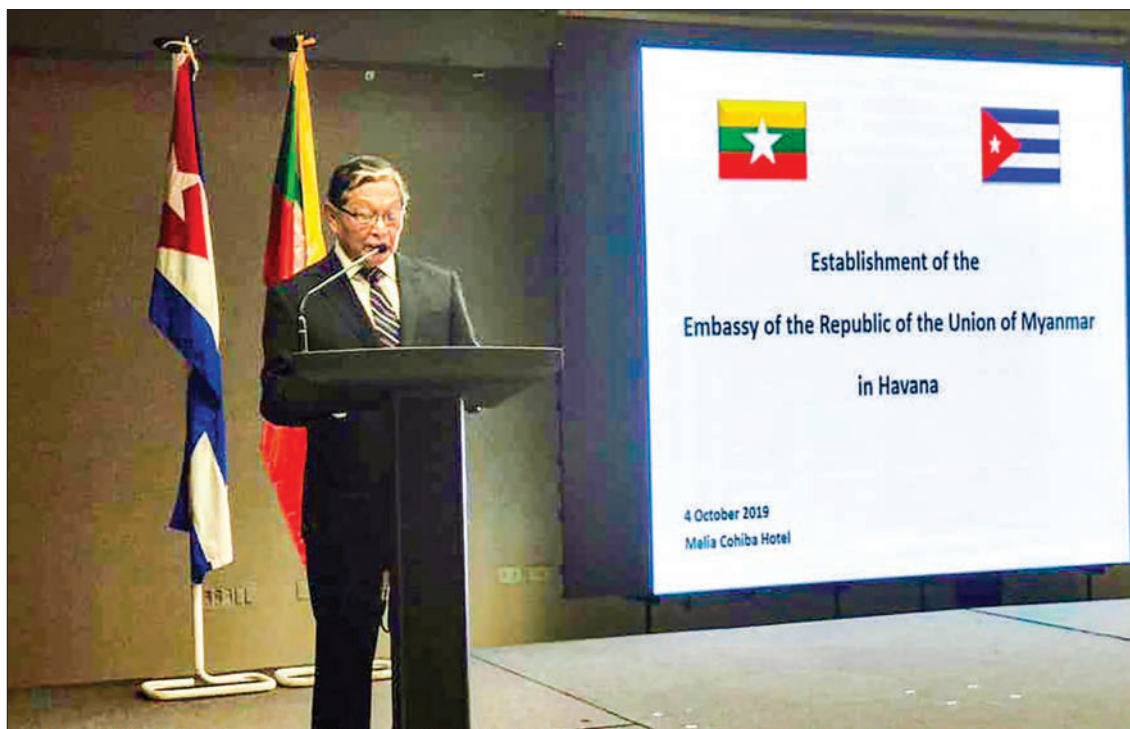
Union Minister for the Office of the State Counsellor of Myanmar U Kyaw Tint Swe delivers the speech at the reception to launch the official establishment of Myanmar Embassy in Havana on 4 October 2019.