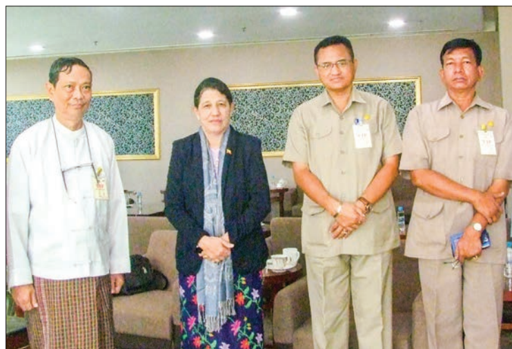
Deputy Minister Dr Mya Lay Sein seen off at the Yangon International Airport by officials from the Department of Sports and Physical Education yesterday.

In the Philippines, the Deputy Minister will attend the 1 st ASEAN Plus Japan Meeting on Women and Sports and the 2 nd ASEAN Plus Japan Senior Officials Meeting on Sports (2 nd SOMS+ Japan) on 8 October, and the 5 th AMMS