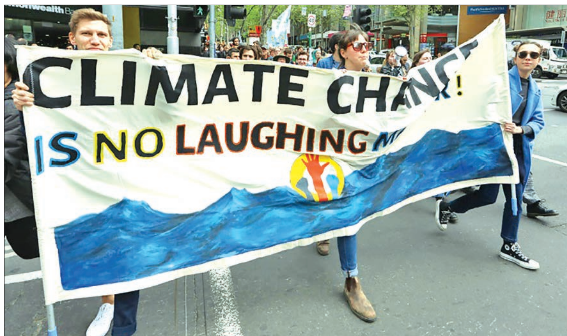
'We have tried petitions, lobbying and marches, and now time is running out.' Extinction Rebellion protesters in Melbourne, Australia.

Extinction Rebellion's tactics in Australia have prompted senior conservative politicians to call for protesters' welfare payments to be cut and for public denunciations.—AFP ■