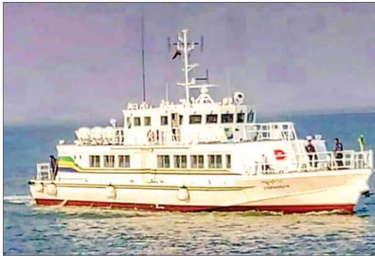
Maritime police conducting marine patrol along the coastal route.