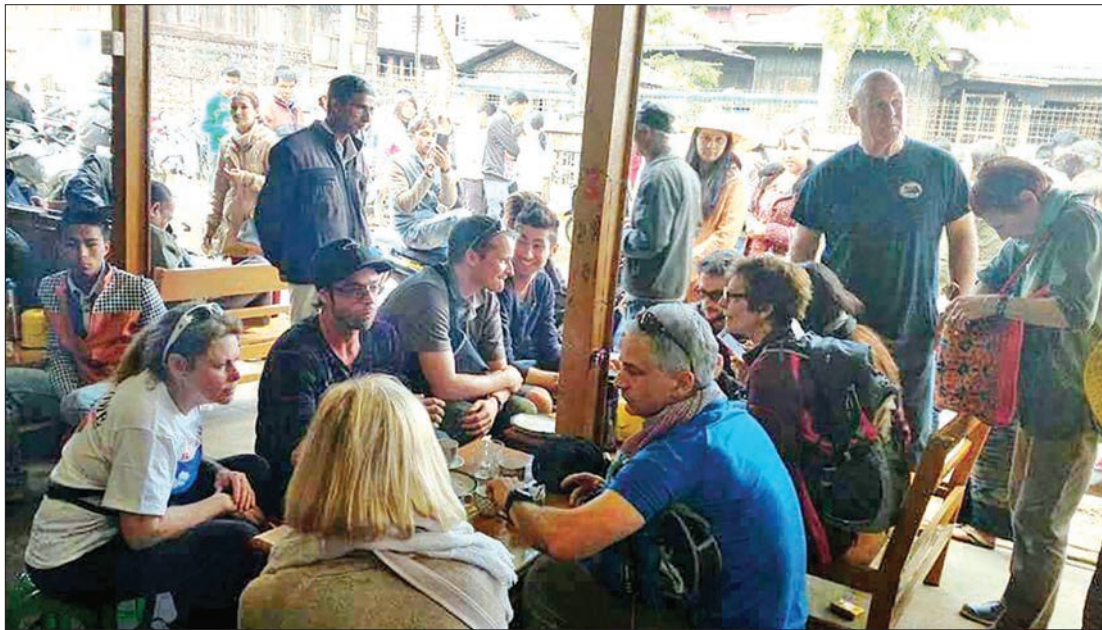
Europeans make up a third of September visits to Mogok.