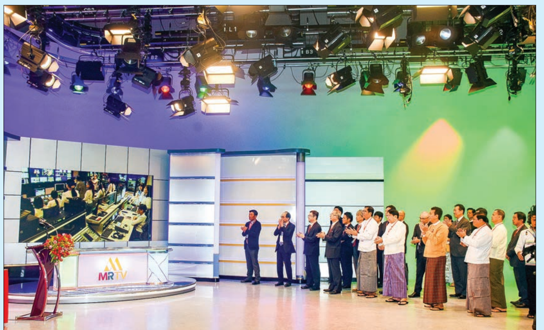
Union Minister Dr Pe Myint, Yangon Chief Minister U Phyo Min Thein, Deputy Minister U Aung Hla Tun and officials watch the video clip on the installation and expansion of broadcasting equipment.