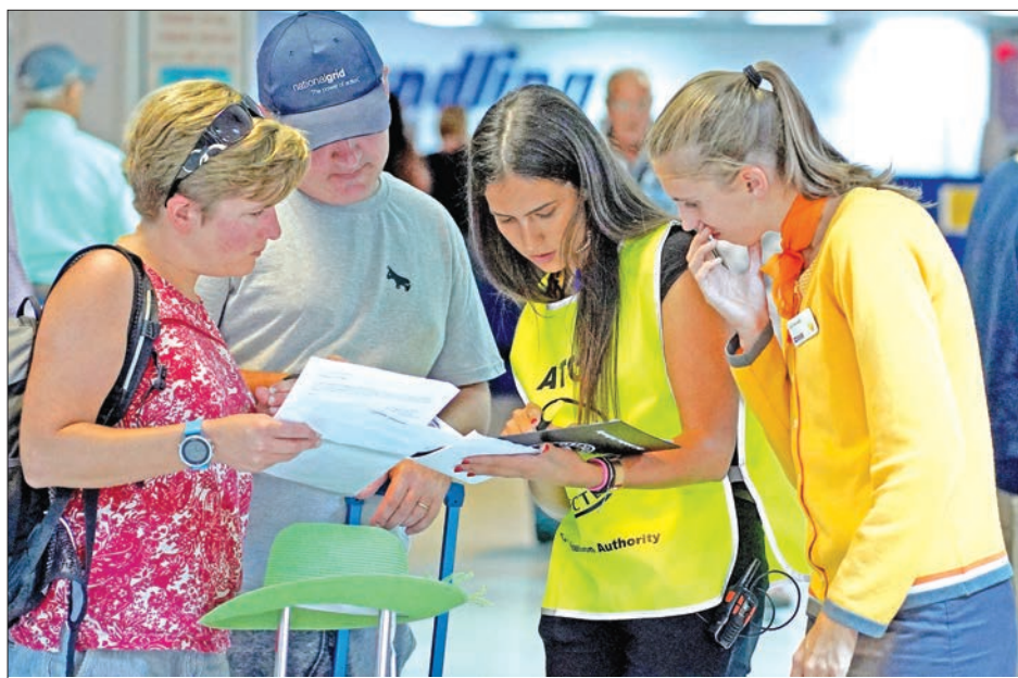
British tourists, clients of Thomas Cook travel group are helped by an airport employee at the Heraclion airport on the island of Crete on 24 September 2019.