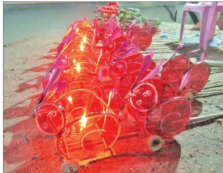
Traditional hand-made paper Lanterns.

In the 2018-2019 fiscal year, foreign investments have flowed into agriculture, livestock, manufacturing, power, transport and communications, hotels and tourism, real estate, industrial estate, and other services sectors. Under the Myanmar Investment Law, the Region and State Investment Committees are allowed to endorse local and foreign proposals, where the initial investment does not exceed K6 billion, or $5 million. This is aimed at simplifying the verification process of investment projects. ■ (Translated by Ei Myat Mon)