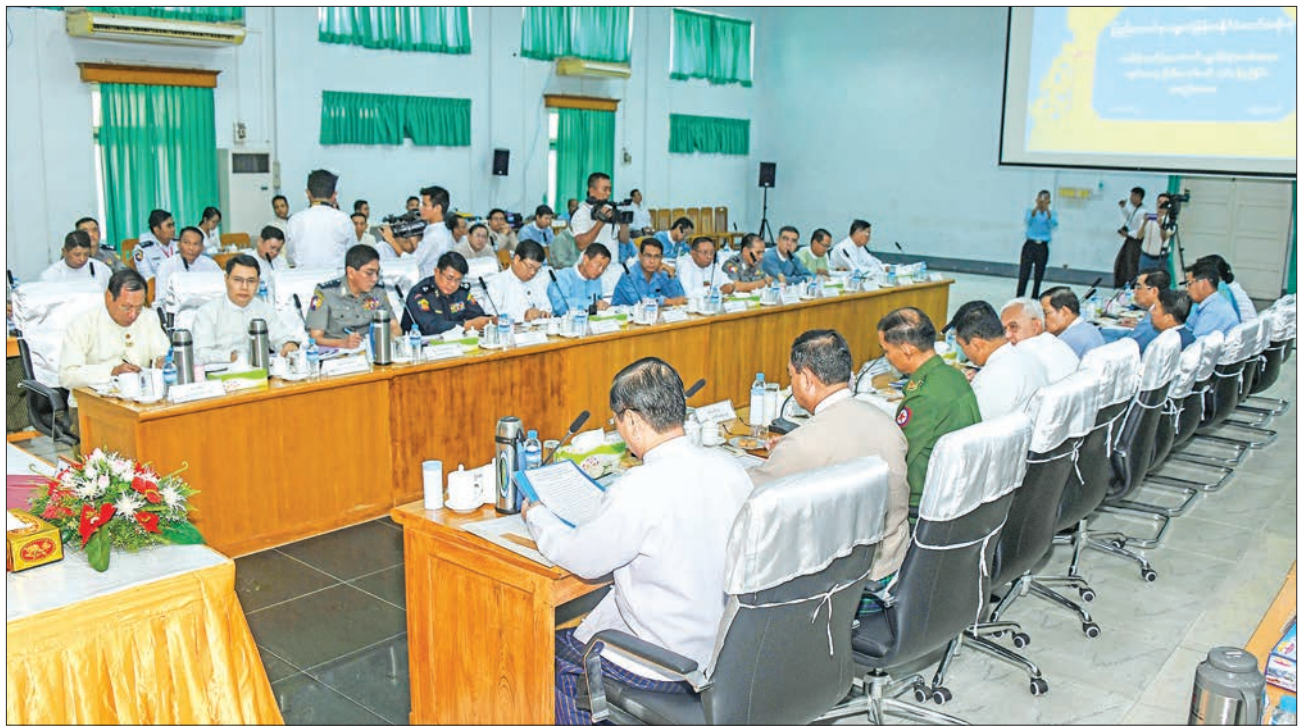
Vice President U Myint Swe addresses the coordination committee meeting for Kathina Robe Offering Ceremony at the Ministry of Religious Affairs and Culture in Nay Pyi Taw yesterday.

THE Union Government Kathina Robe Offering Ceremony Steering Committee meeting was held yesterday morning in the assembly hall of the Ministry of Religious Affairs and Culture. The meeting was addressed by Vice President U Myint Swe, patron of the steering committee. In his address the Vice President said an eleven member Union Government Kathina Robe Offering Ceremony Steering Committee headed by himself had been formed to successfully hold the Union Government Kathina Robe Offering Ceremony in the compound of the Sasana Maha Beikmandaw building at Uppatasanti Pagoda, Nay Pyi Taw. A 20-member working committee led by Depu-