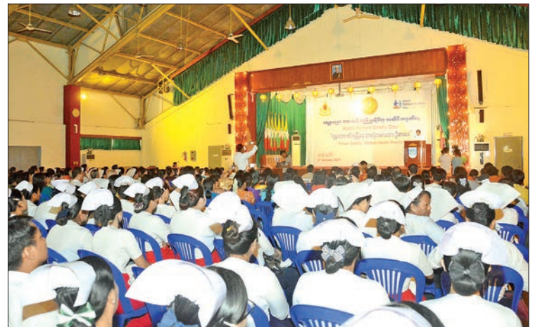
The commemoration to mark World Patient Safety Day held at the University of Nursing, Yangon, yesterday.