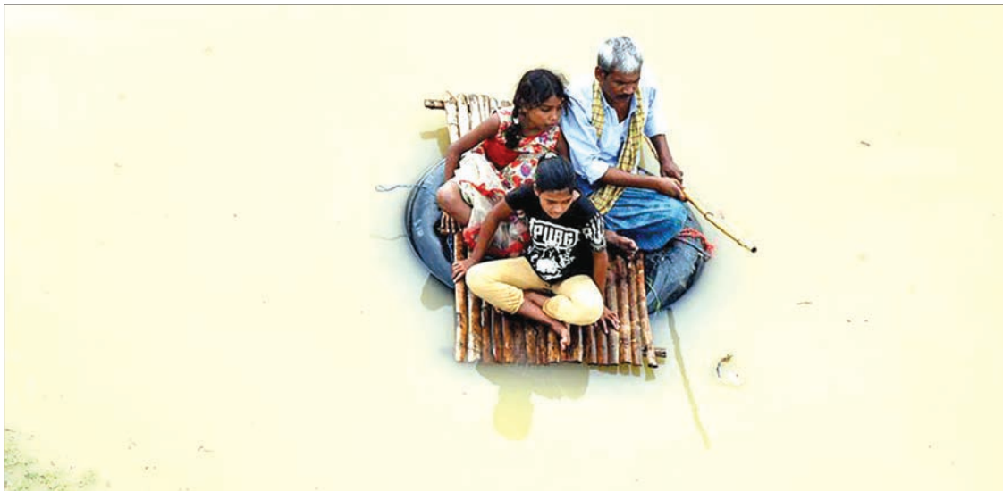
Residents move on a makeshift raft in India's eastern state Bihar on 2 October, 2019. As many as 42 people have died since last week in rain-related incidents in India's eastern state of Bihar, media reports said on Wednesday.

The India Meteorological Department (IMD) has predicted that heavy rainfall is very likely at isolated places in Bihar on Thursday. —Xinhua ■