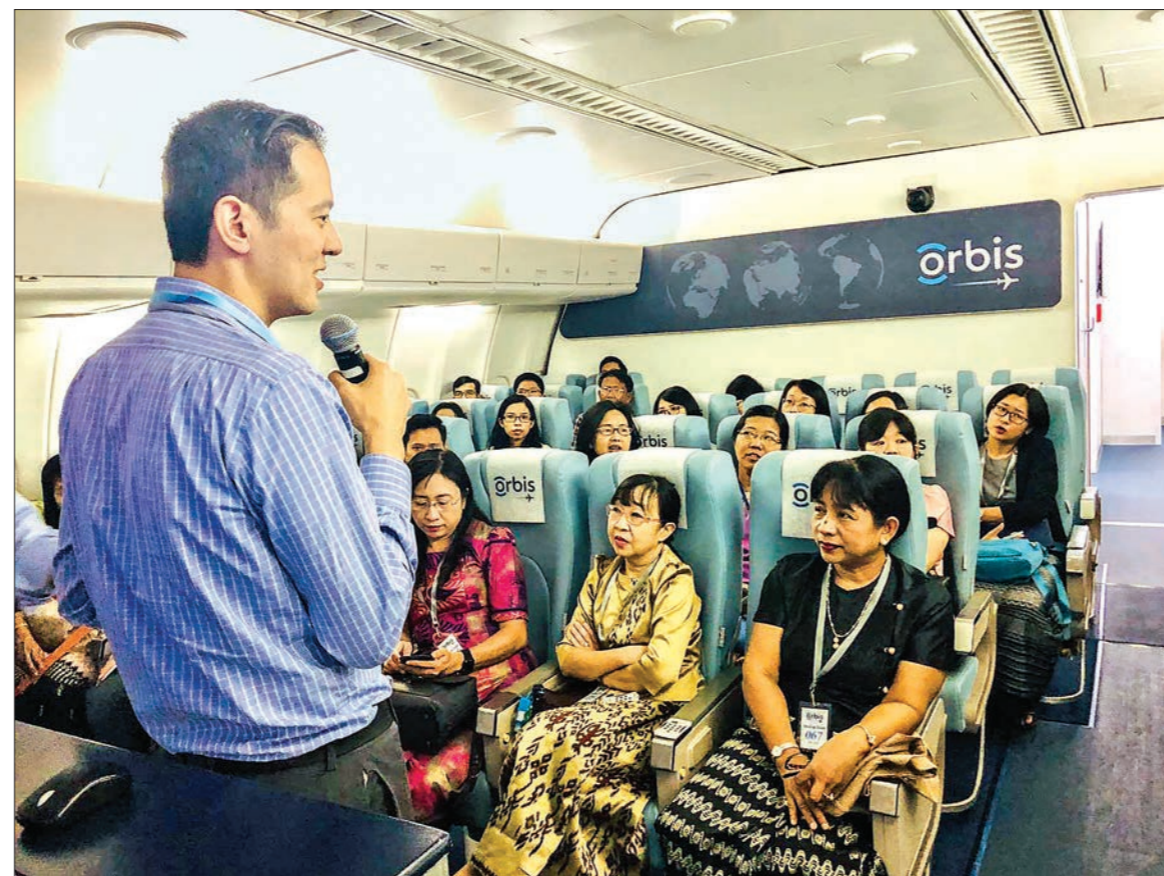
There were 38 ophthalmologists and 7 cabin crew on Orbis this time.

reviews the list of patients first and the Orbis team then further reviews the list and gives suggestions, comments and decisions as necessary.