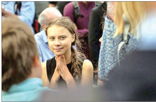
Bookmakers are tipping teenage activist Greta Thunberg for the Nobel Peace Prize but observers are sceptical.

Odds from bookmakers such as Ladbrokes indicate the 16-year-old activist is the one to beat for the Nobel Peace Prize after she launched a school strike that inspired millions to join her "Fridays for Fu-