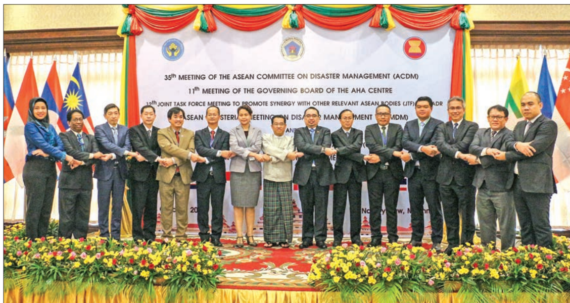
Attendees pose for a photo at the third day of the 35th Meeting of the ASEAN Committee on Disaster Management (ACDM) in Nay Pyi Taw yesterday.