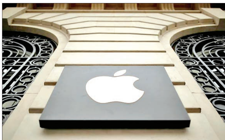
The man filed suit in a Moscow court asking for one million rubles ($15,000) after an incident this summer in which a cryptocurrency called “GayCoin” was delivered via a smartphone app, rather than the Bitcoin he had ordered.

The suit was filed on September 20 and the court will hear the complaint on October 17, according to information on its website.—AFP ■