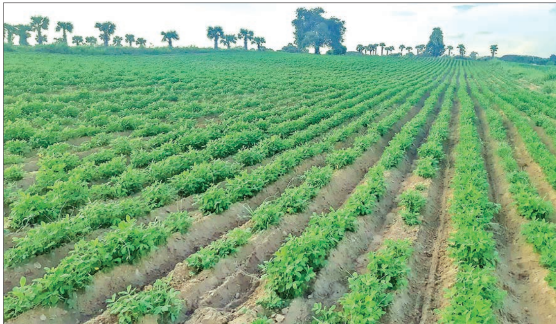
A peanut plantation in Wundwin Township, Mandalay Region.

PEANUT farmers in Htanaungkone village, Wundwin Township, Mandalay Region said they are expecting a good yield from crops planted in the mid-monsoon season.