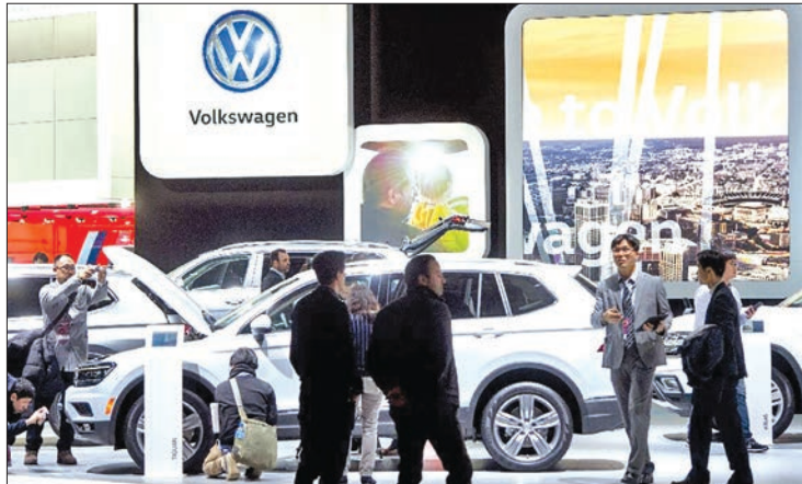
Attendees look at the the Volkswagen lineup of cars and SUVs during the 2017 North American International Auto Show in Detroit, Michigan on 9 January, 2017.

“Since the Chinese market is a key market for the German auto industry, the German auto industry has been severely damaged by US customs policy. The behavior of the USA is thus the opposite of alliance policy,” Dudenhoeffer stressed. —Xinhua ■