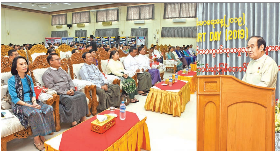
Union Minister Dr Myint Htwe addresses the ceremony to commemorate World Heart Day 2019 at the Ministry of Health and Sports, Nay Pyi Taw yesterday.

A CEREMONY to commemorate World Heart Day 2019 and commencement of preventive works on heart and cardiovascular disease was held at Ministry of Health and Sports, Nay Pyi Taw yesterday morning.