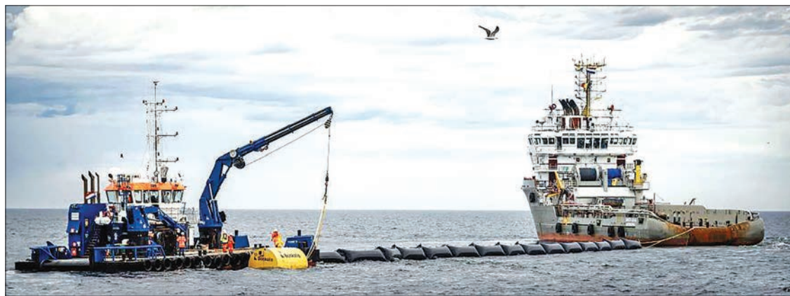
The project by The Ocean Cleanup, a Dutch non-profit group, involves a supply ship towing a floating boom that corrals marine plastic with the aim of cleaning half of the infamous patch within five years.

The system includes a tapered three-metre skirt to catch plastic floating just below the surface.—AFP ■