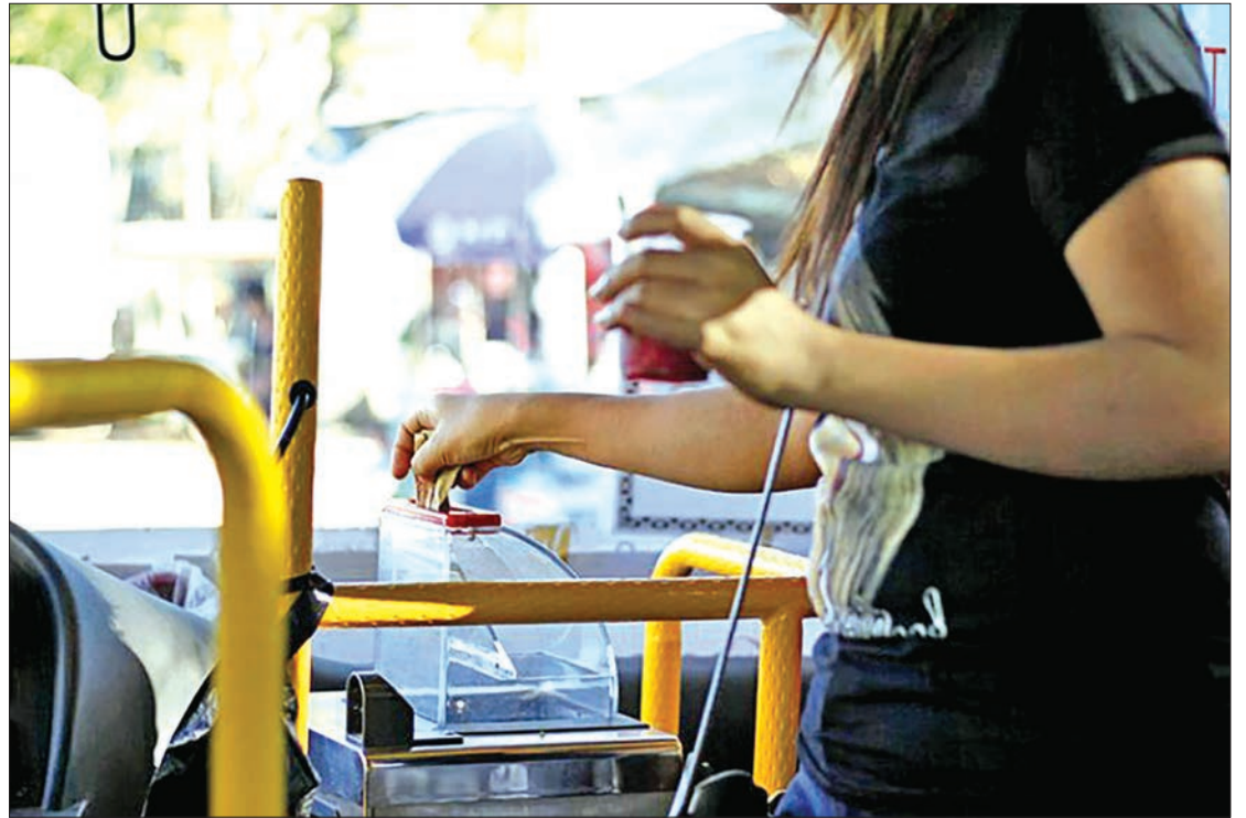
A passenger drops money into a cash box in the YBS bus in Yangon.

The YRTA will have the personal information of every single