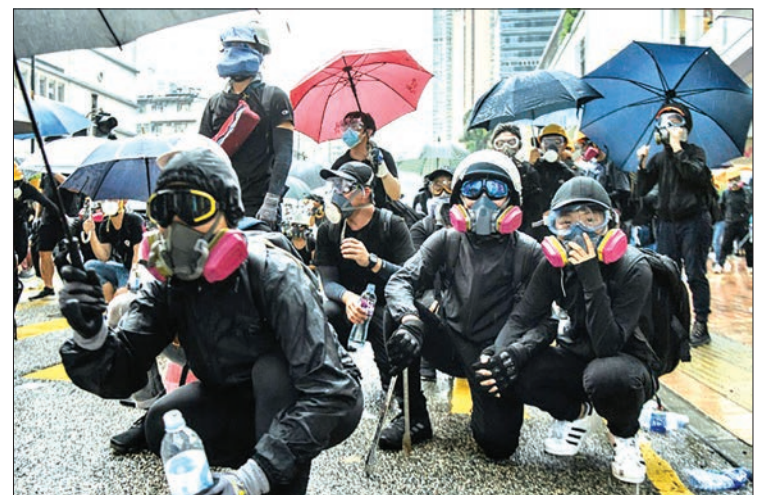
Protesters have been wearing masks to protect themselves from tear gas and hide their identities in Hong Kong.

Reports of the face mask ban lifted the Hong Kong stock market, which ended the day 0.3 per cent higher. —AFP ■