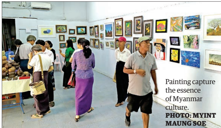
Painting capture the essence of Myanmar culture.