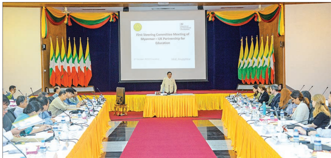
Union Minister Dr Myo Thein Gyi addresses first committee meeting of Myanmar-UK Partnership for Education (MUPE) at the Ministry of Education in Nay Pyi Taw yesterday.

THE first steering committee meeting of Myanmar-UK Partnership for Education (MUPE) was held at the Ministry of Education in Nay Pyi Taw yesterday morning.