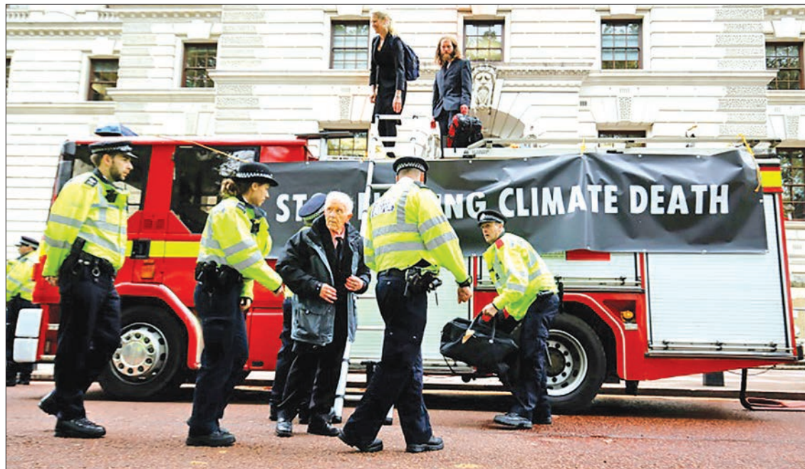
Four people were arrested on suspicion of criminal damage following the incident.

LONDON — Members of the environmental activist group Extinction Rebellion on Thursday used a decommissioned fire engine to spray fake blood over the front of Britain's finance ministry in London.