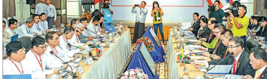
Ninth Myanmar-Thai Joint Coordinating Committee (JCC) ministerial level meeting in progress.

From the Myanmar side, Deputy Minister for Transport and Communications, Depu-