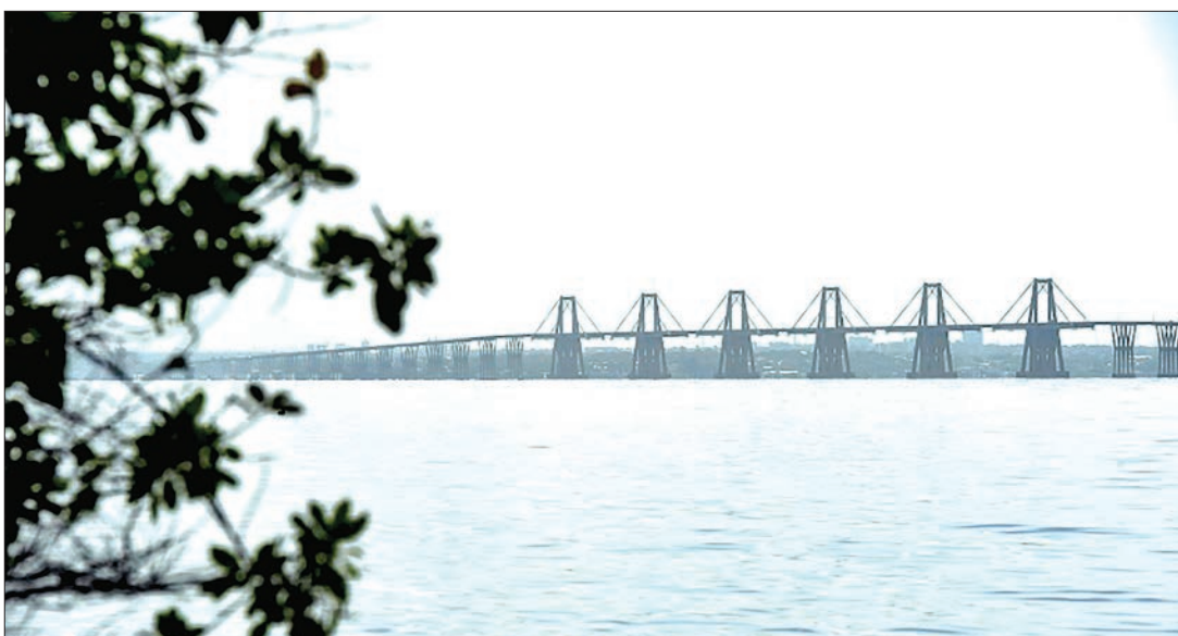
Venezuela is home to the world’s biggest proven oil reserves. PHOTO: AFP

Russia is a key international supporter of Venezuela and has made a number of investments in the country through the oil giant Rosneft. —AFP