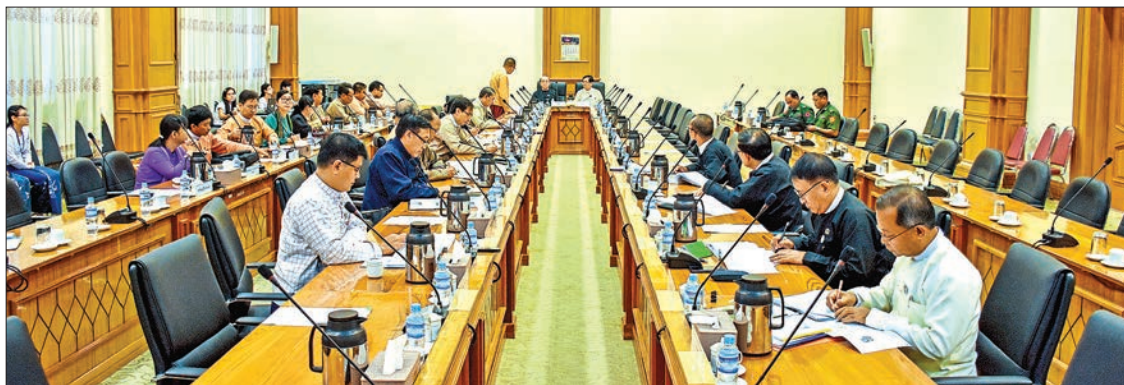
Joint Committee on Amending the 2008 Constitution meeting held in Nay Pyi Taw yesterday.

MEETING 46/2019 of the Joint Committee on Amending the 2008 Constitution was held at the Pyidaungsu Hluttaw Building D in Nay Pyi Taw yesterday morning.