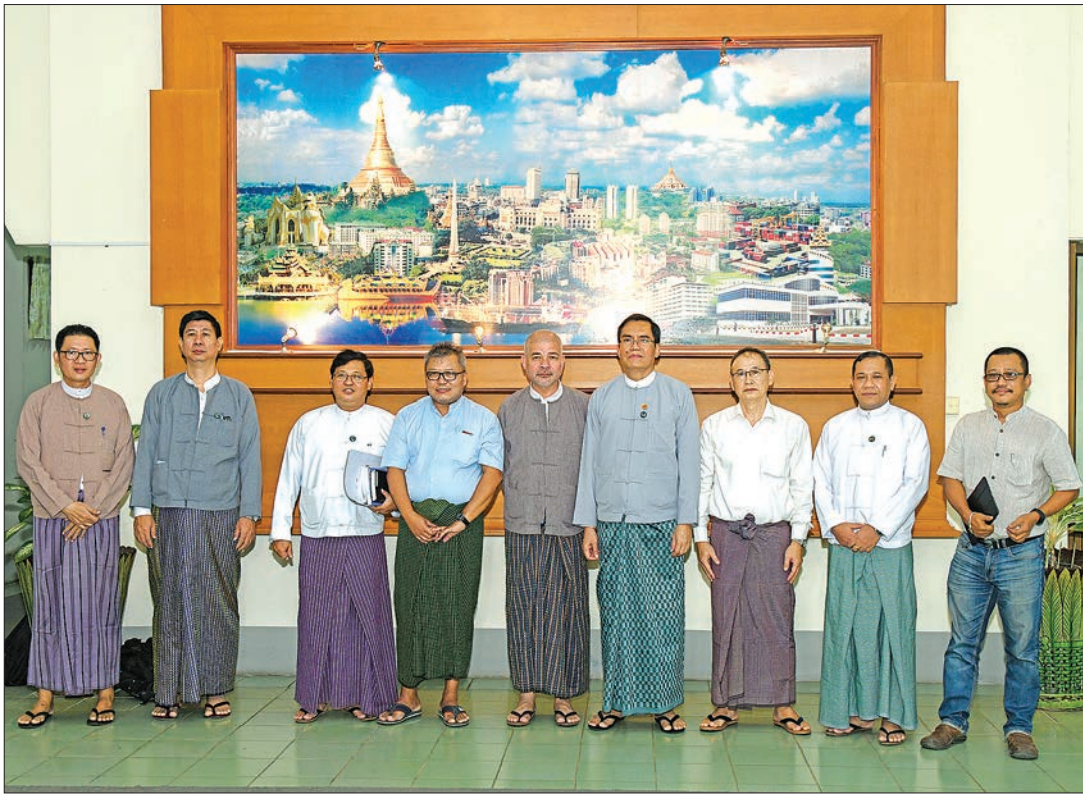
Deputy Minister for Information U Aung Hla Tun and a delegation led by U Aye Chan Naing, CEO of DVB Media Group pose for a photo at the Ministry of Information yesterday.

DEPUTY MINISTER for Information, U Aung Hla Tun, received U Aye Chan Naing, CEO of DVB Media Group, and