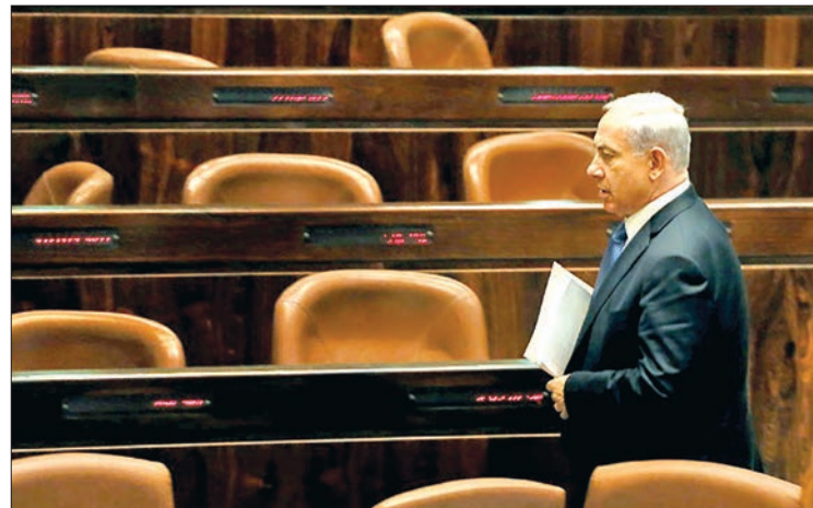
Israeli Prime Minister Benjamin Netanyahu is still scrambling to find a path to extend his long tenure in power as the new parliament elected on 17 September is set to be sworn in.

Lieberman has declined to endorse either Netanyahu or