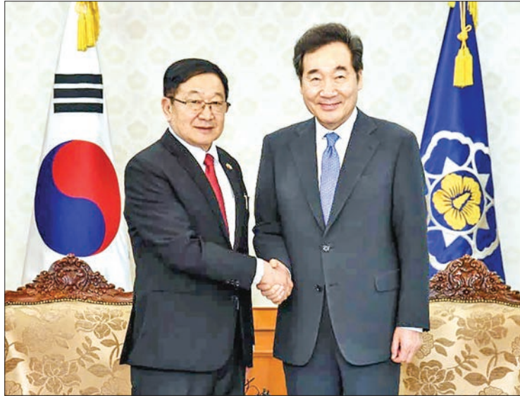
Pyithu Hluttaw Speaker U T Khun Myat (Left) shakes hands with Prime Minister of the Republic of Korea Mr Lee Nak-yon in Seoul.