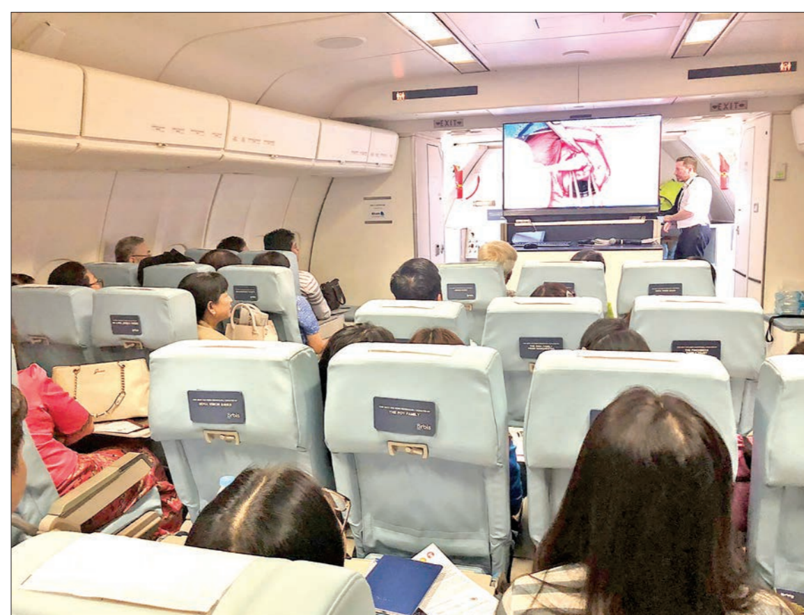
The Orbis flying hospital houses a state-of-the-art teaching facility.

A light will go on during class to signal the beginning of an