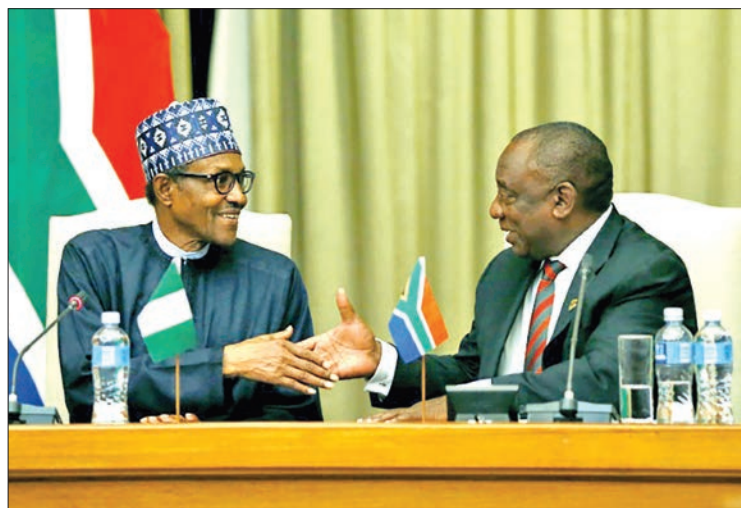
Handshake: Buhari, left, and Ramaphosa.

Mobs descended on foreign-owned stores in and around Johannesburg in early September, destroying properties and looting. "We call for the strengthening and implementation of all the necessary measures to pre-