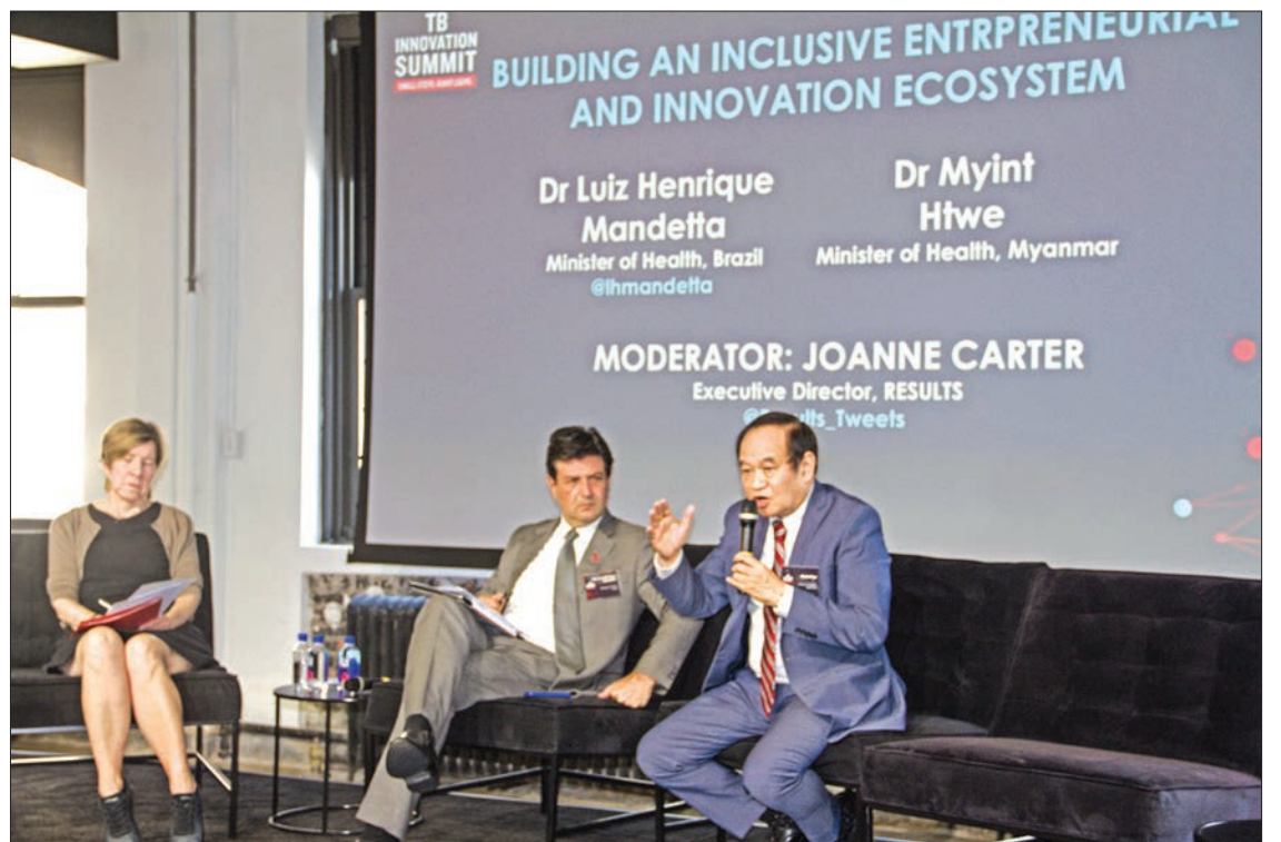
Union Minister Dr Myint Htwe delivers the speech at the high level and related meetings on Universal Health Coverage (UHC) in New York, United States on September 23.

Afterwards, the Union Minister met with KIRK Humanitarian Group Chairman and