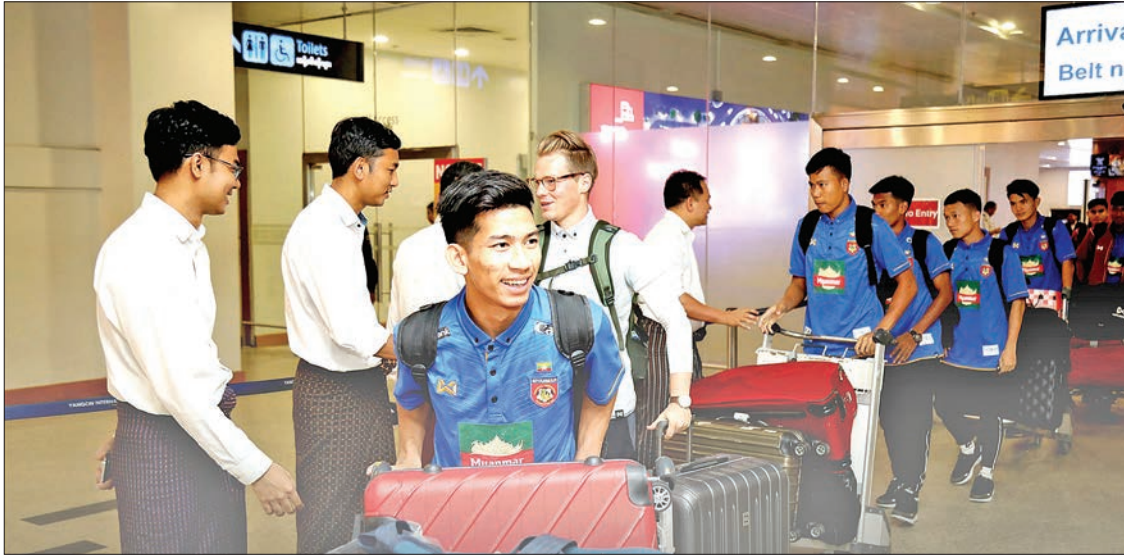
The Myanmar U-19 football players (in blue jerseys) were welcomed by officials from the Myanmar Football Federation yesterday at the Yangon International Airport.

AFTER grabbing the silver medal at the Chinese Taipei Football Association's Invitational Cup, the Myanmar U-19 men's national football team arrived back at Yangon International Airport yesterday afternoon.