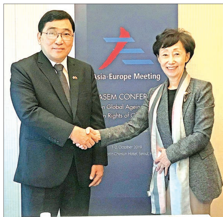
Union Minister Dr Win Myat Aye shakes hands with Ms Choi Young-ae, the Chairperson of the National Human Rights Commission of ROK.

In making discussions with Minister of Gender Equality and Family Ms Lee Jung-ok, the Union Minister exchange views on women's participation in democratic reform of Myanmar, gender equality and the role of women in the Union Peace Conference—21 st Century Panglong, the efforts of government in establishing a democracy federal union, the formation of Myanmar National Committee for Women's Affairs with the participation of government ministries, women organizations and civil societies, prevention against gender based violence, justice for the victims in gender based violence, rehabilitation works, vocational trainings, implementation of joint communique on Prevention and Response to Conflict-Related Sexual Violence, Protection Women against Women in