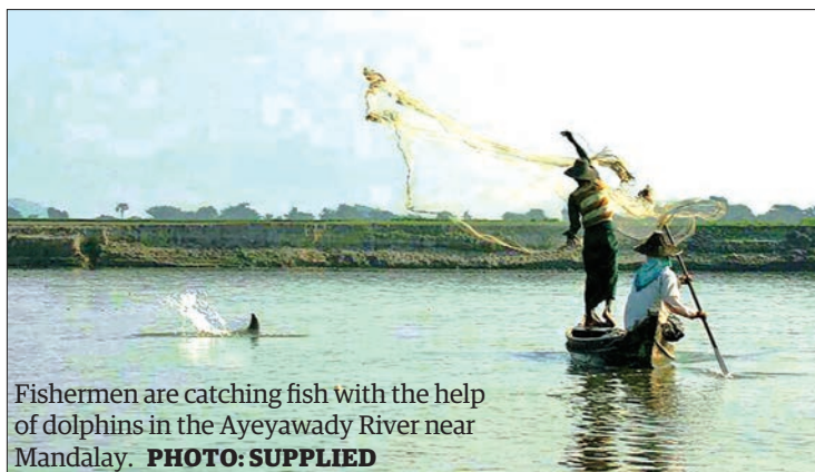
Fishermen are catching fish with the help of dolphins in the Ayeyawady River near Mandalay.

“This year, Japanese visitors came for video shooting for more than one month. We were booked for the entire day, and they paid high rates. Local people are also interested in watching fishing with the dolphins.