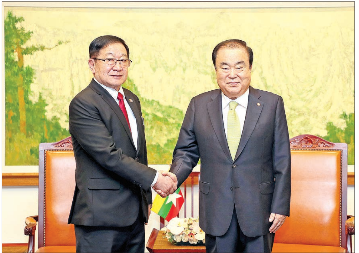
Pyithu Hluttaw Speaker U T Khun Myat is welcomed by the Republic of Korea's National Assembly Speaker Mr Moon Hee-sang at National Assembly Building in Seoul yesterday.