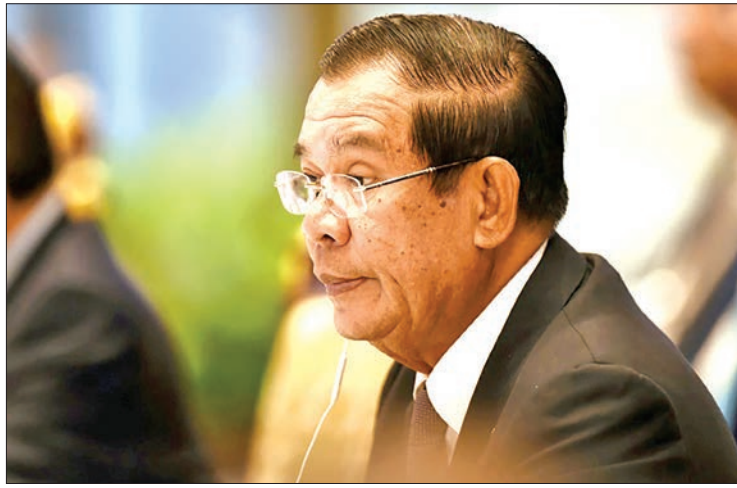
Hun Sen, who has ruled Cambodia, for 34 years, has hit back at his rival with a new barrage of arrests and threats.

"Those who join the campaign to destroy the country and peace on November 9 will be prosecuted," Hun Sen warned Wednesday in a typically bombastic speech. In his absence, Rainsy's opposition Cambodia