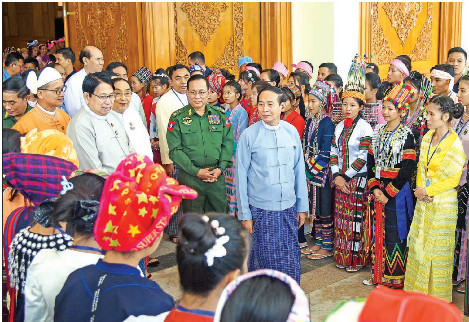
President U Win Myint greeting students from Batch 3 of University for the Development of the National Races at the Presidential Palace in Nay Pyi Taw yesterday.

capacity of teachers was pivotal to education reform to meet international norms, and that they were urged to continue life-long learning to develop professional skills and to share their knowledge again as only those who were seeking knowledge continuously could survive in the changing trend of globalization to be able to enjoy future opportunities.