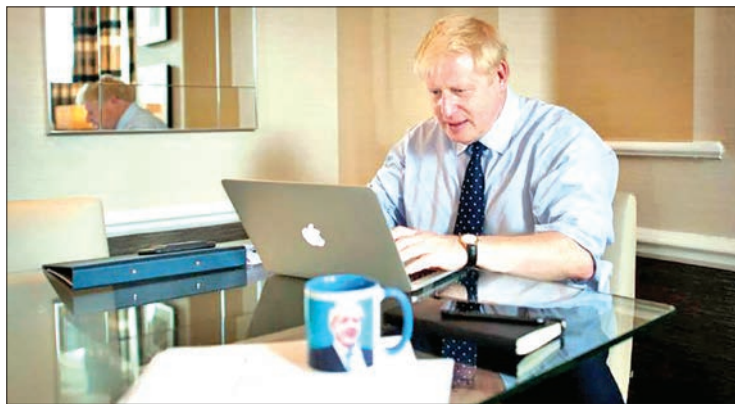
Britain's Prime Minister Boris Johnson prepared his keynote speech for the annual Conservative Party conference in Manchester, northwest England, on 1 October, 2019 which he'll deliver on the final day on 2 October, 2019.

His proposals focus on finding an alternative to her controversial "backstop" plan, which aims to keep an open border between British Northern Ireland and EU member Ireland after Brexit. The current arrangement would keep Britain in an effective