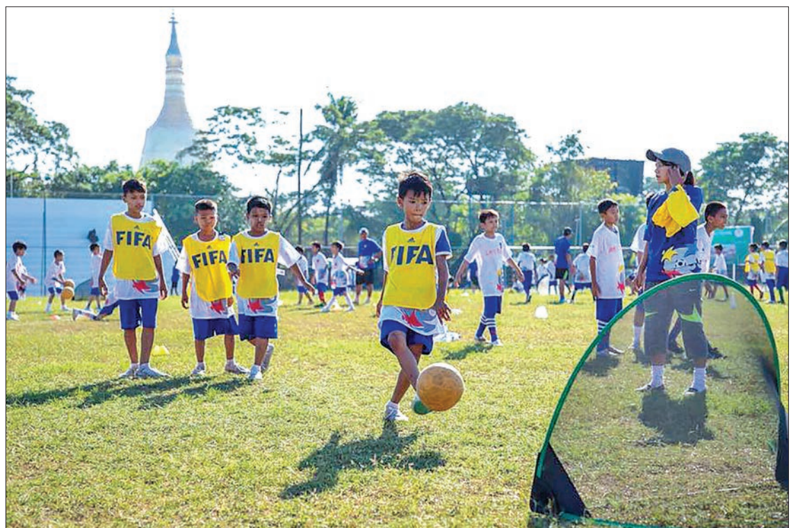
A boy shoots a ball into a net during a grassroots football festival in Bago.

WITH the aim of identifying, grooming, and training the next generation of youth footballers, a grassroots football festival and an U-14 tournament will be held in Sittway this month, according to the Myanmar Football Federation.