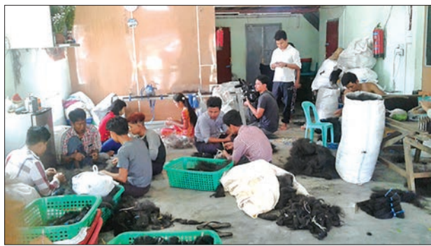
Singaporean filming crew shooting business in exporting human hair in Pyawbwe Township.

The film crew first filmed women donating hair at Yegu Myoma Monastery in Mayangone Township, Yangon. They took scenes of the presiding abbot sharing how donating hair is a meritable act and the longest hair donated in record was the 550 feet long 'Shwe-ze-pin da-dar' (Golden