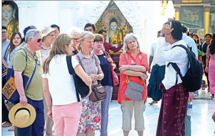
A tour guide explains about the history of the Shwedagon Pagoda in Yangon.

such as Shwedagon pagoda and Botahtuang pagoda, the tour police can screen QR codes from tour guides' ID cards, which are issued to them on hand-phones. Thus, the tourist police can determine whether they are local guides or not. So, we have already made arrangements for the tour police to use technology to check whether tourists are hiring local tour guides or not. For this, the tourist police will have to undergo training next month,” she added.