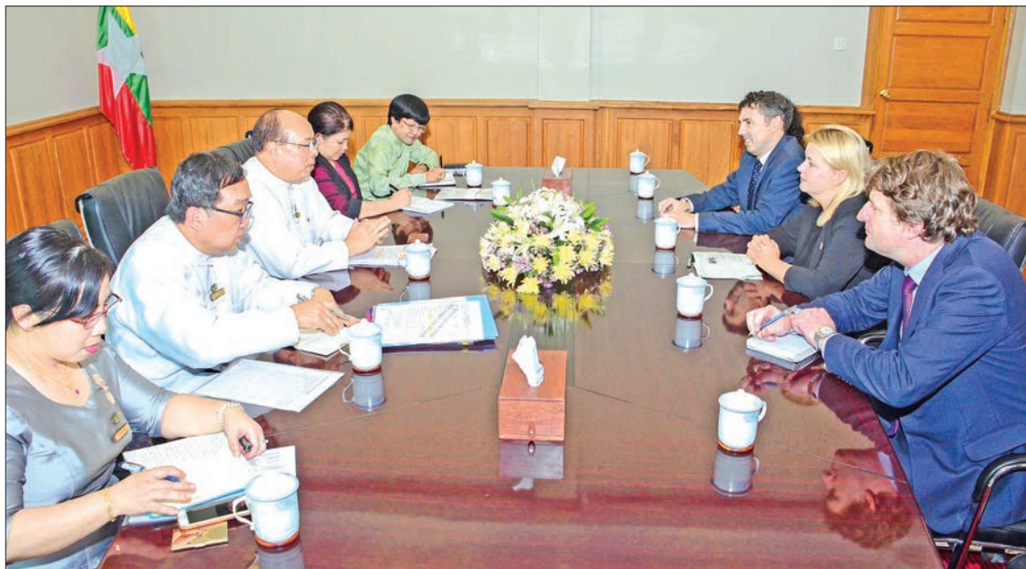
Union Minister U Thaug Tun meeting with Baroness Elizabeth Grace Sugg, British Parliamentary Under-Secretary of State for International Development in Nay Pyi Taw.