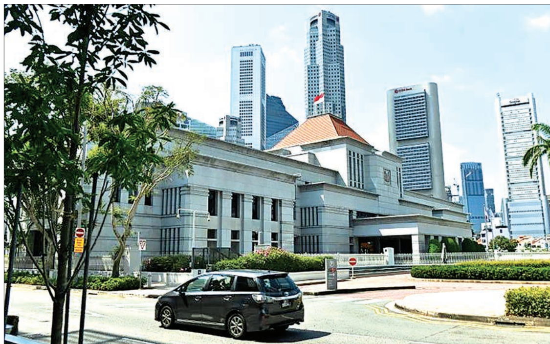
Authorities in tightly controlled Singapore — long criticised for restricting civil liberties — insist new measures are necessary to stop falsehoods circulating.

Authorities in the tightly controlled country — long criticised for restricting civil liberties