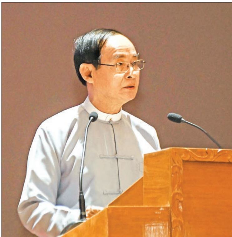
President U Win Myint delivers the speech at the meeting with students from University for the Development of the National Races of the Union in Nay Pyi Taw yesterday.

PRESIDENT U Win Myint received graduates from the University for the Development of the National Races of the Union yesterday morning at the Presidential Palace in Nay Pyi Taw.