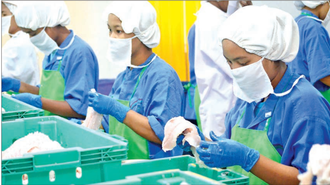
Labourers processing fish for export at a marine product factory.

EXPORT earnings from the fisheries sector in the period from 1 October, 2018 to 20 September, 2019 in the 2018-19 financial year reached US$709 million, an increase of $21.9 million from the year-ago period, according to statistics released by the Commerce Ministry.