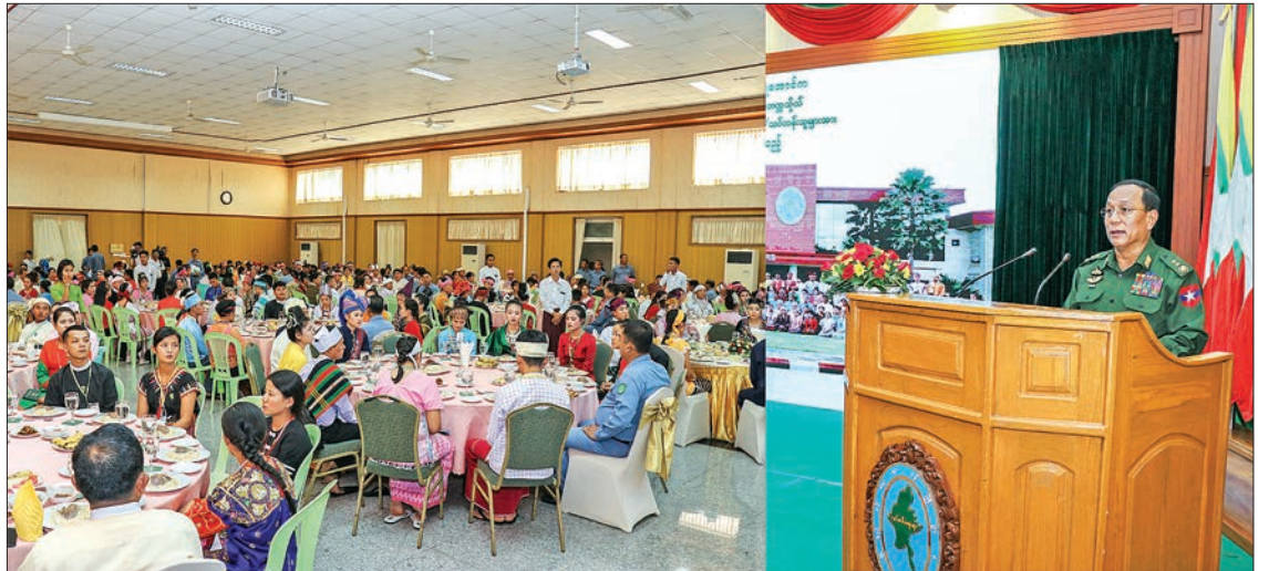
Union Minister Lt-Gen Ye Aung delivers the speech to congratulate the National Races University students at the luncheon in Nay Pyi Taw yesterday.