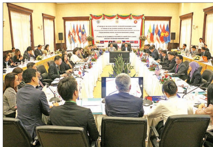
The second day of 35 th Meeting of ASEAN Committee on Disaster Management (ACDM) takes place at Shwe San Eain Hotel in Nay Pyi Taw.