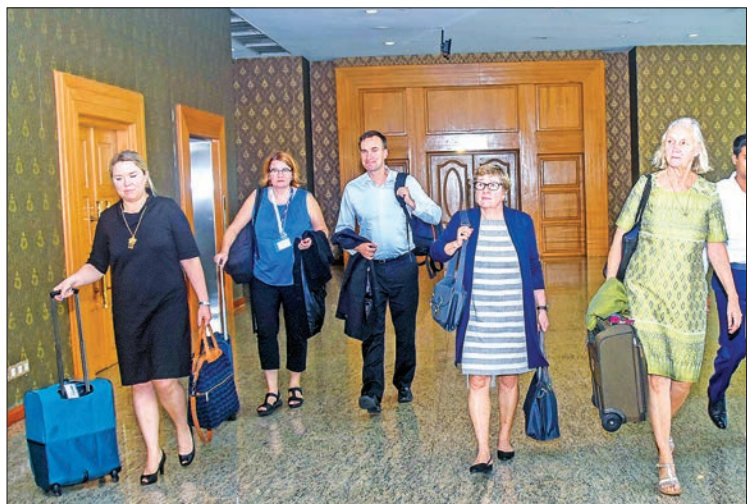
A delegation of Finland led by Ms Nina Irmeli Vaskunlahti, Under-Secretary of State for external economic relations in Nay Pyi Taw.

THE delegation of Finland led by the Under-Secretary of State for external economic relations at the Ministry of Foreign Affairs, arrived in Nay Pyi Taw at 12:30 pm.