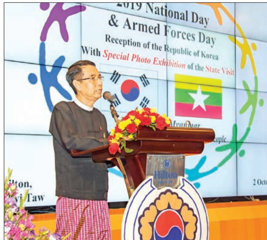
Union Minister Dr Aung Thu addresses the reception of the Republic of Korea National Day and the Armed Forces Day in Nay Pyi Taw.

Also present at the event were U Myo Nyunt, Chairman of the Constitutional Tribunal of the Union, U Hla Thein, Chairman of