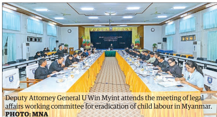
Deputy Attorney General U Win Myint attends the meeting of legal affairs working committee for eradication of child labour in Myanmar.

LEGAL affairs working committee for eradication of child labour in Myanmar held its third meeting at the Union Attorney-General's Office in Nay Pyi Taw on 1 October.