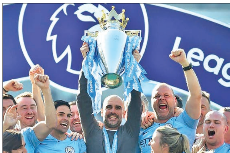
Manchester City manager Pep Guardiola holds the Premier League trophy.