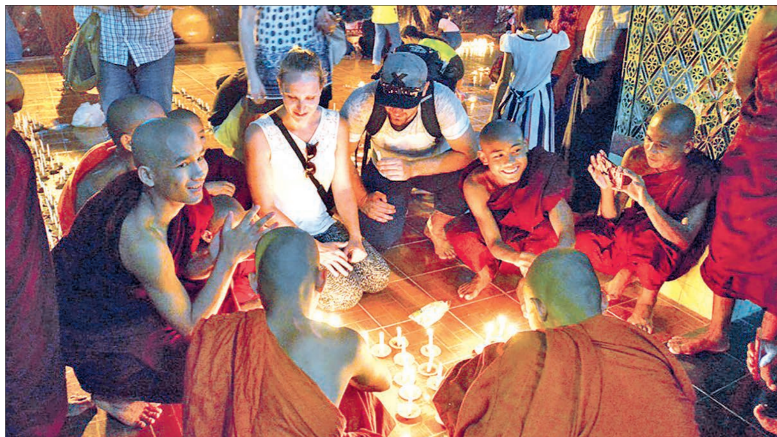
Tourists observe the Buddhist traditions at a monastery in Mandalay.

The tourism industry benefits all the stakeholders from horse carriage drives, tour guides and companies to hotels, restaurants, transporters and souvenir shops. The food and beverage industry and agro-industry are also enjoying the indirect benefits of the tourism business. Generally, a