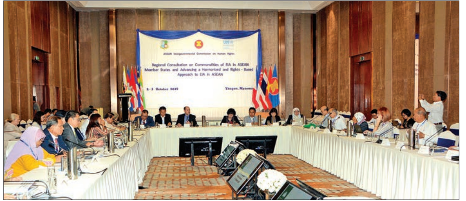
ASEAN Intergovernmental Commission on Human Rights (AICHR) held a meeting in Yangon yesterday.

of ASEAN countries to the AICHR, environment and human rights experts from ASEAN regional and international organizations, experts from international organizations, civil society organizations and representatives of Ministry of Foreign Affairs and Ministry of Natural Resources and Environmental Conservation.—MNA (Translated by Kyaw Zin Tun)