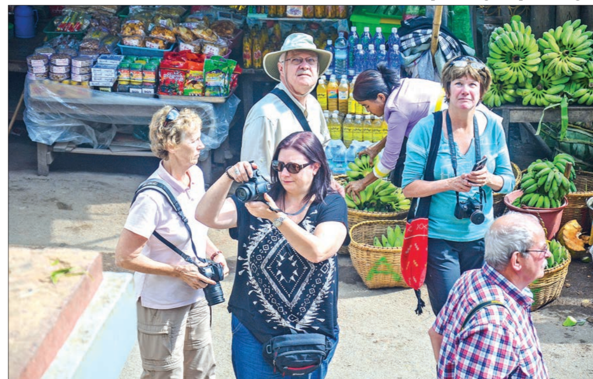
International travellers visit an open market in Mandalay.

Women are joining the tourism sector that generates more jobs than other industries. If compared with other industries, the number of women taking part in the industry is two times higher. Their roles range from handicraft business to hospitality services. So, women are earning income for their households, and in some cases, they the breadwinners of a household, thus helping improve the socio-economic and living standards their families. So we must promote the role of women in the tourism industry. They should enjoy equal rights with their male