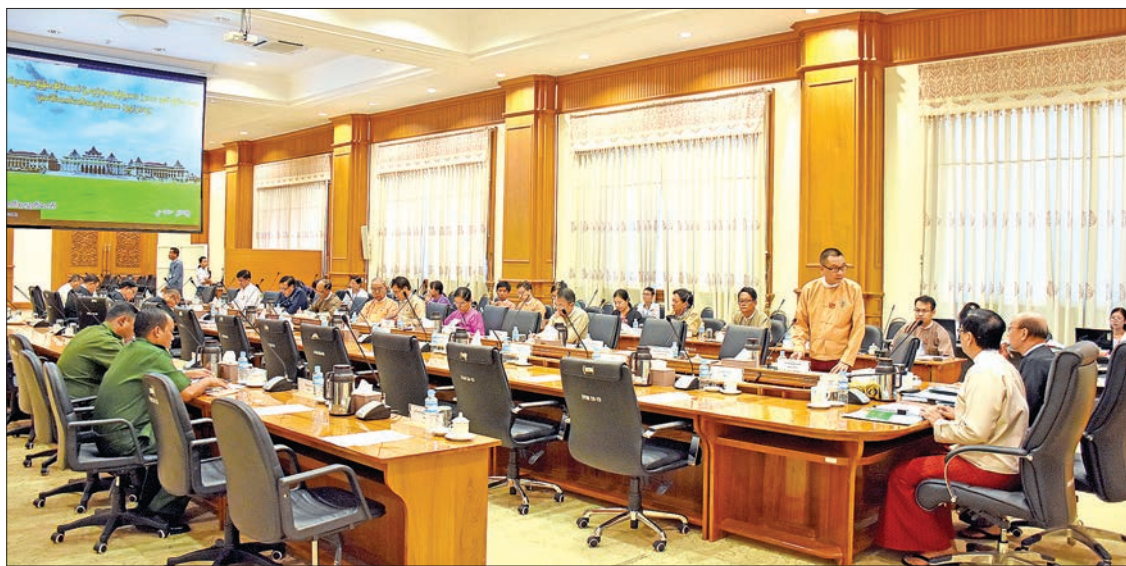
Meeting 45/2019 of the Joint Committee on Amending the 2008 Constitution held at Pyidaungsu Hluttaw Building D in Nay Pyi Taw yesterday.