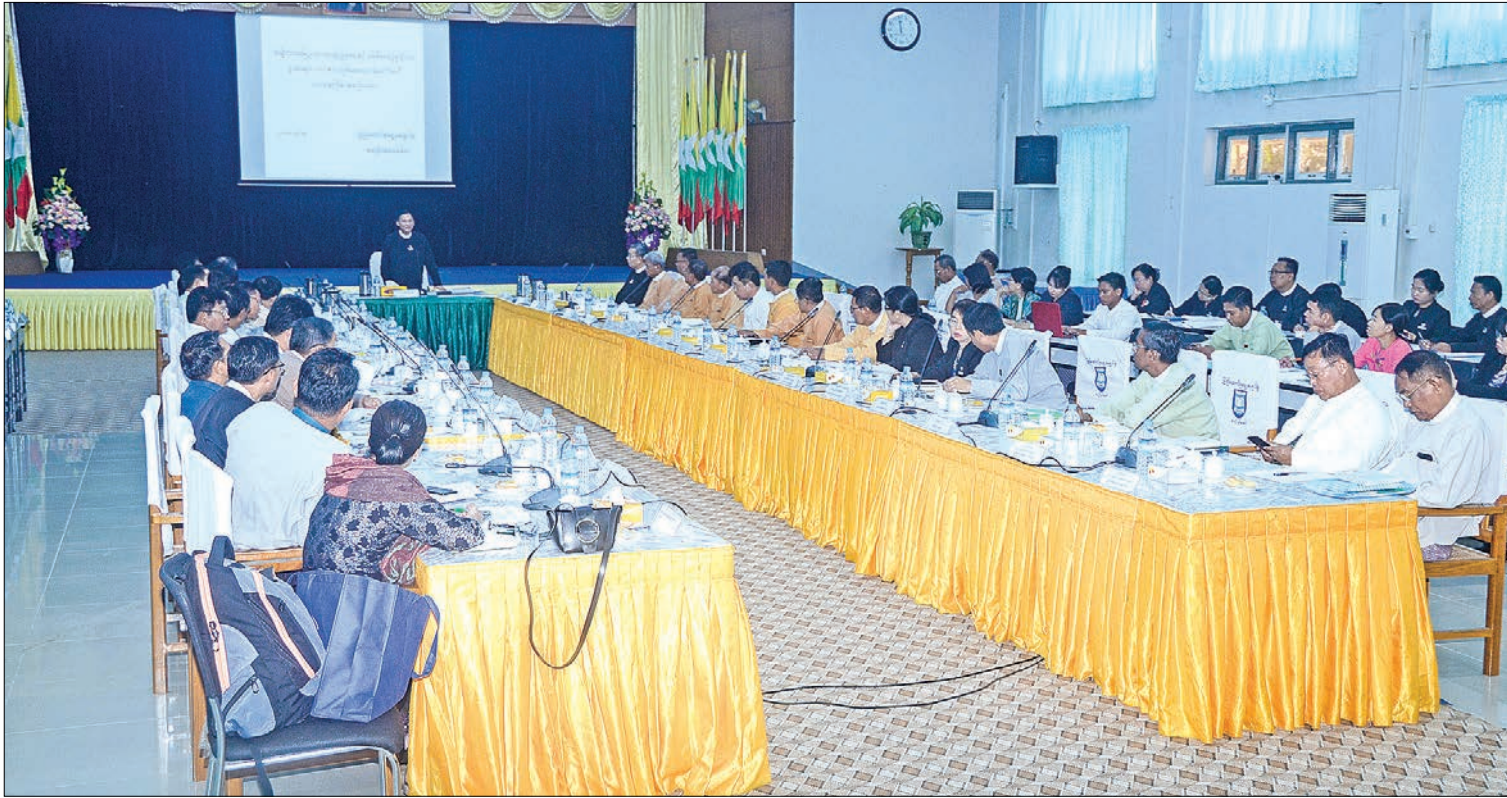
Union Attorney-General U Tun Tun Oo addresses the work Committee meeting on Drafting the National Land Law and Harmonization of Laws Related with Land Management in Nay Pyi Taw yesterday.

THE Work Committee on Drafting the National Land Law and Harmonization of Laws Related with Land Management held its first meeting at the Office of the