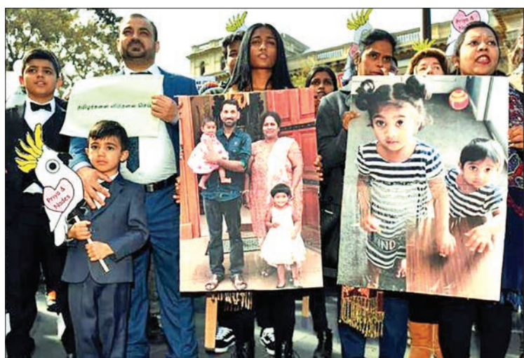
Protesters hold up placards in Melbourne on 1 September, 2019, during a rally in support of a Tamil refugee family of four — including two Australian-born toddlers — who have been moved to the remote Australian detention centre on Christmas Island.

SYDNEY — The United Nations has called on Australia's government to release a Tamil asylum seeker family from offshore detention, weighing in on a case that has galvanised huge public support.