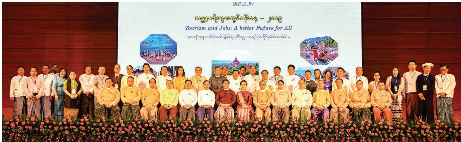
State Counsellor Daw Aung San Suu Kyi and Vice President U Henry Van Thio pose for documentary photo together with chairpersons, secretaries from Myanmar Tourism Federation and the 11 associated groups, the members of National Tourism Development Central Committee at the event to mark the World Tourism Day 2019 in Nay Pyi Taw yesterday.