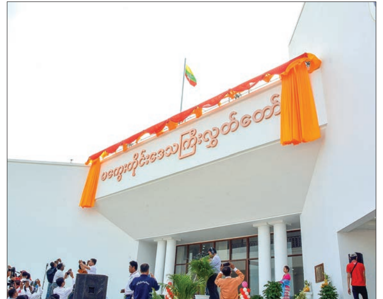
Pyithu Hluttaw Speaker U T Khun Myat, Regional Chief Minister Dr Aung Moe Nyo and Magway Region Hluttaw Speaker U Tar unveil new building of Magway Region Hluttaw in Magway yesterday.

THE new building of the Magway Region Hluttaw was officially opened with a ceremony yesterday morning with Pyidaungsu Hluttaw Speaker U T Khun Myat unveiling the building.