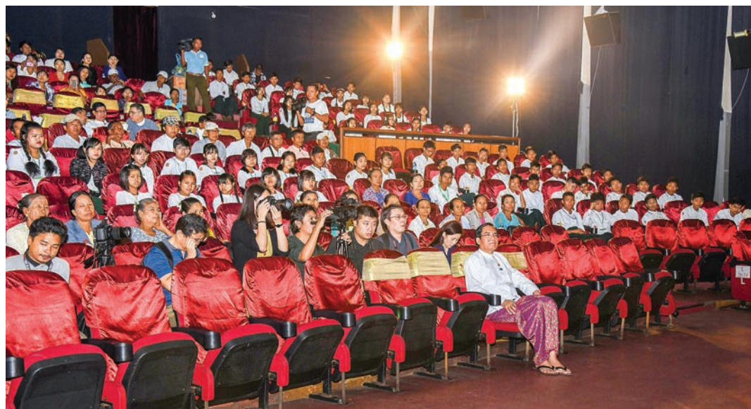
Ambassador of China to Myanmar Mr Chen Hai delivers the speech at the opening ceremony of 2019 Chinese Movie Festival in Nay Pyi Taw yesterday.

The opening ceremony was then continued where Ambas-