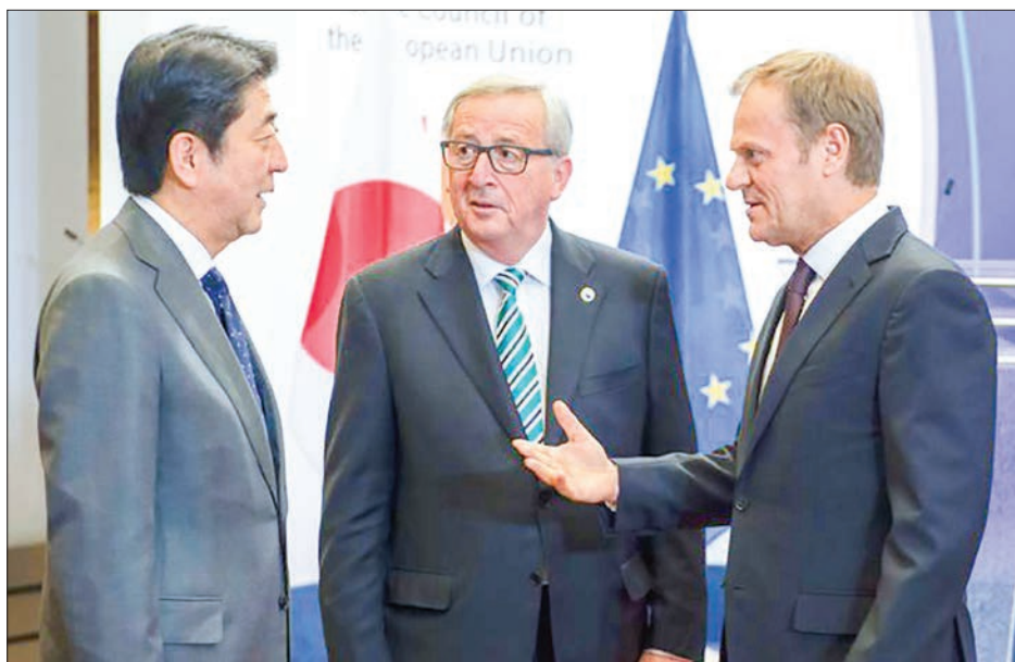
European Council President Donald Tusk (right) and European Commission chief Jean-Claude Juncker (center) with Japanese Prime Minister Shinzō Abe in Brussels in May last year.

With Chinese-financed, opaque infrastructure development leaving some central Asian and Balkan countries with heavy debt, critics say President Xi Jinping's signature project is intended