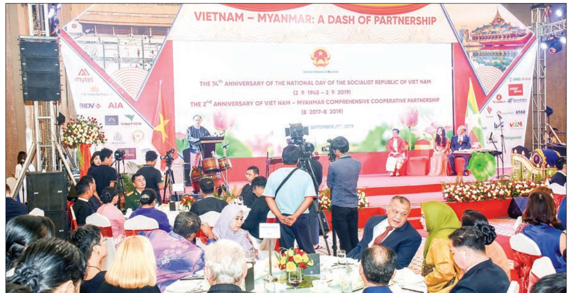
Union Minister U Thant Sin Maung addresses the event to mark 74 th Anniversary of Viet Nam's National Day and 2nd anniversary of Viet Nam-Myanmar Comprehensive Cooperation in Yangon.

THE 74 th Anniversary of Viet Nam's National Day and the 2 nd anniversary of Viet Nam-Myanmar Comprehensive Cooperation were commemorated at Melia Hotel in Yangon yesterday evening.