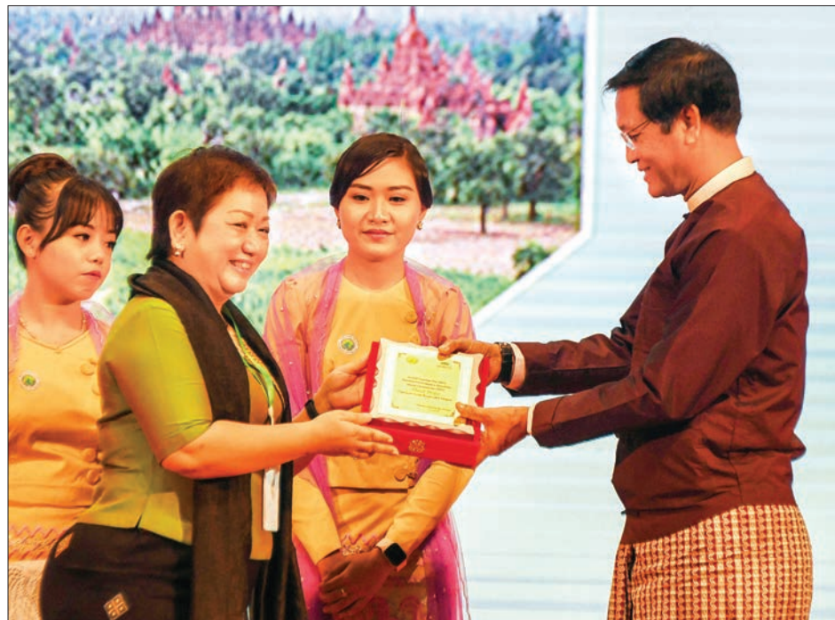
Vice President U Henry Van Thio presents to third award for best services in the category of joint-venture hotels to representative from Chatrium Hotel Royal Lake Yangon.