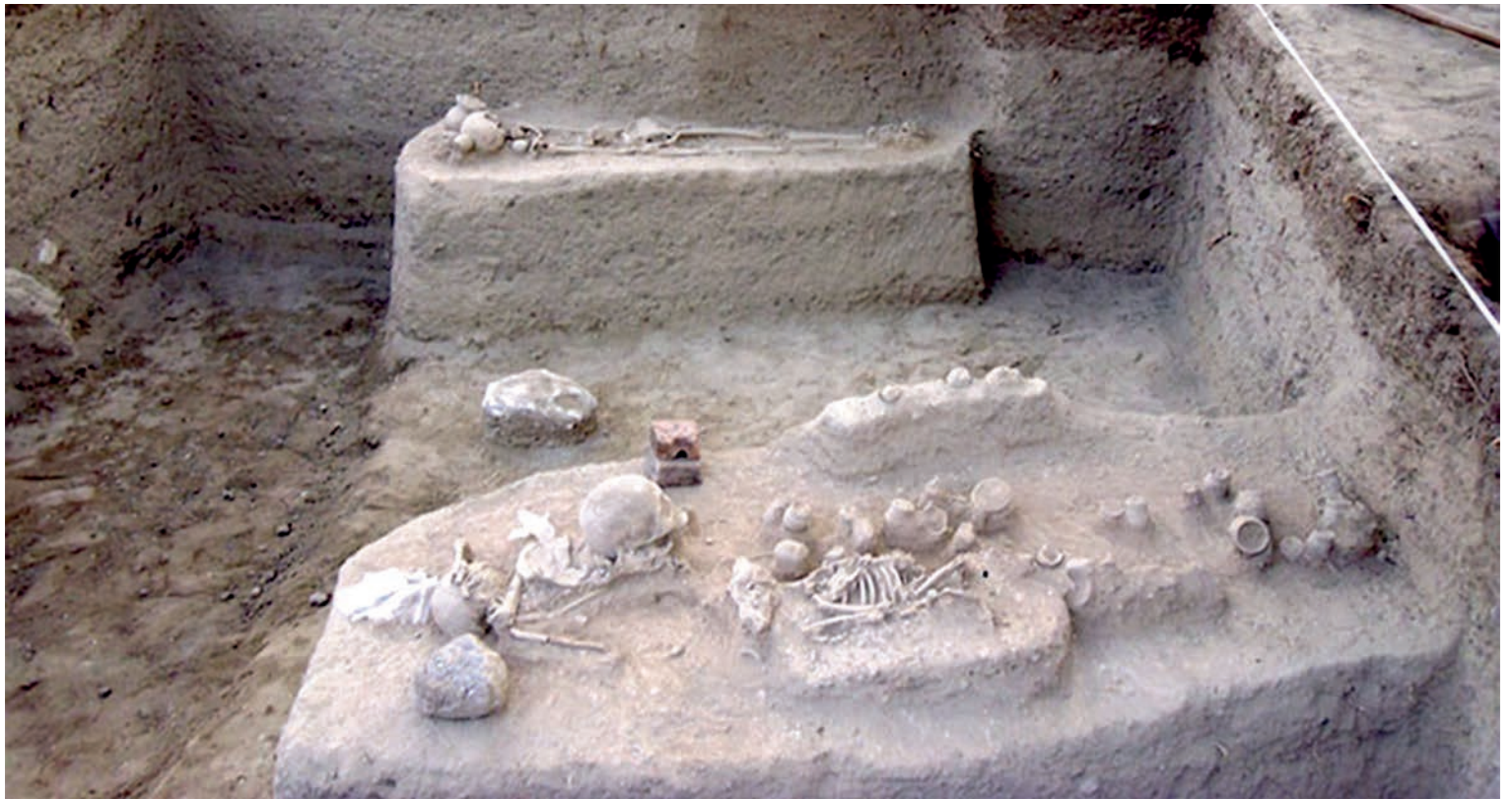
A portion of the Bronze Age cemetery uncovered by archaeologists in Sagaing Region.