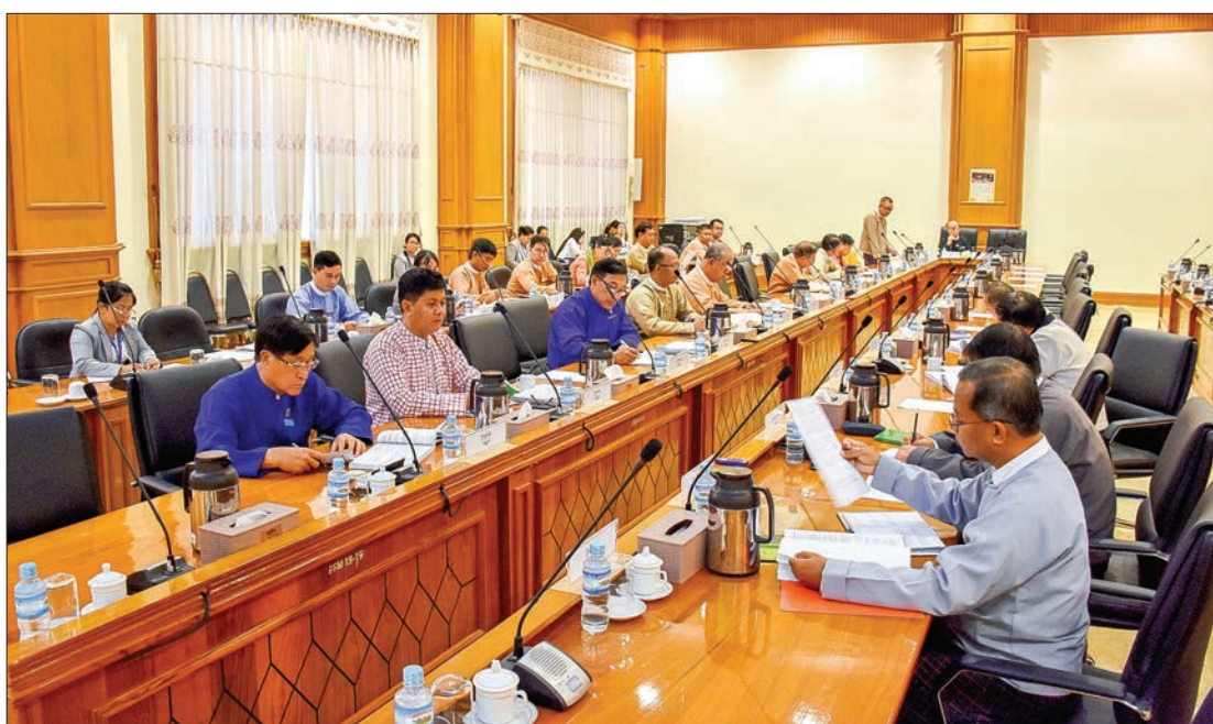
Meeting 42/2019 of the Joint Committee on Amending the 2008 Constitution in progress in Nay Pyi Taw yesterday.

MEETING 42/2019 of the Joint Committee on Amending the 2008 Constitution was held at Pyidaungsu Hluttaw Building D in Nay Pyi Taw yesterday morning.