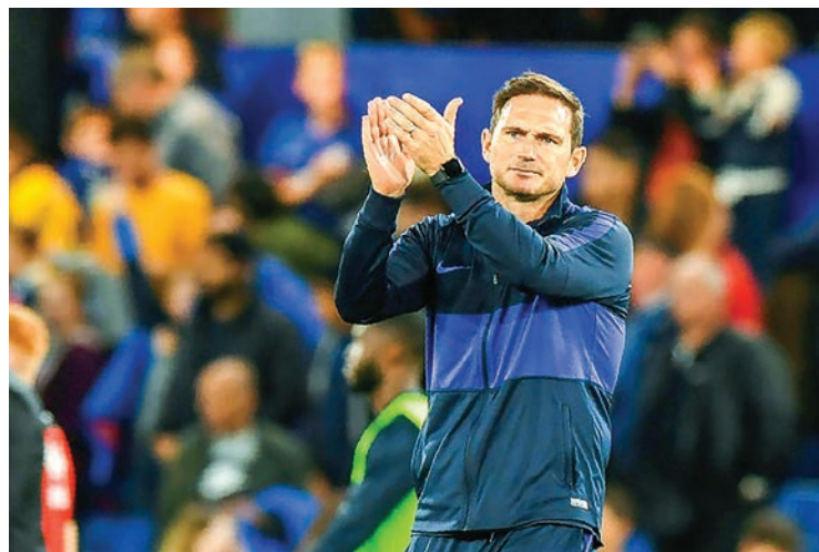
Chelsea manager Frank Lampard is confident his young team are on the right track.

Tammy Abraham, who has scored seven times this term, and Mason Mount have been the