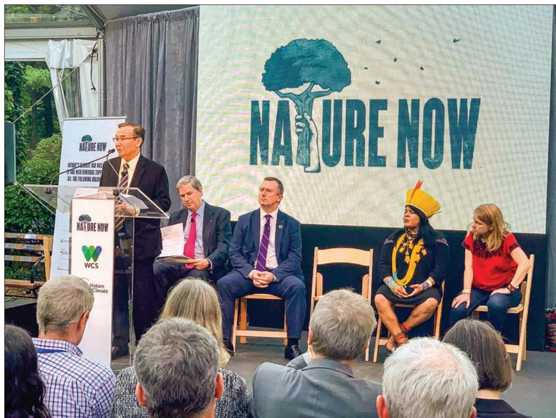
Union Minister for Natural Resources and Environmental Conservation U Ohn Win delivers a speech at the opening plenary of Building a Resilient Future Day event in New York on 22 September.

It was co-organized by the WCS, UNDP, Global Wildlife Conservation, World Resource Institute and Rain Forest Foundation (Norway). The event discussed conservation of natural forests, sustainability and socio-economic development for indigenous people and the crucial role of nat-