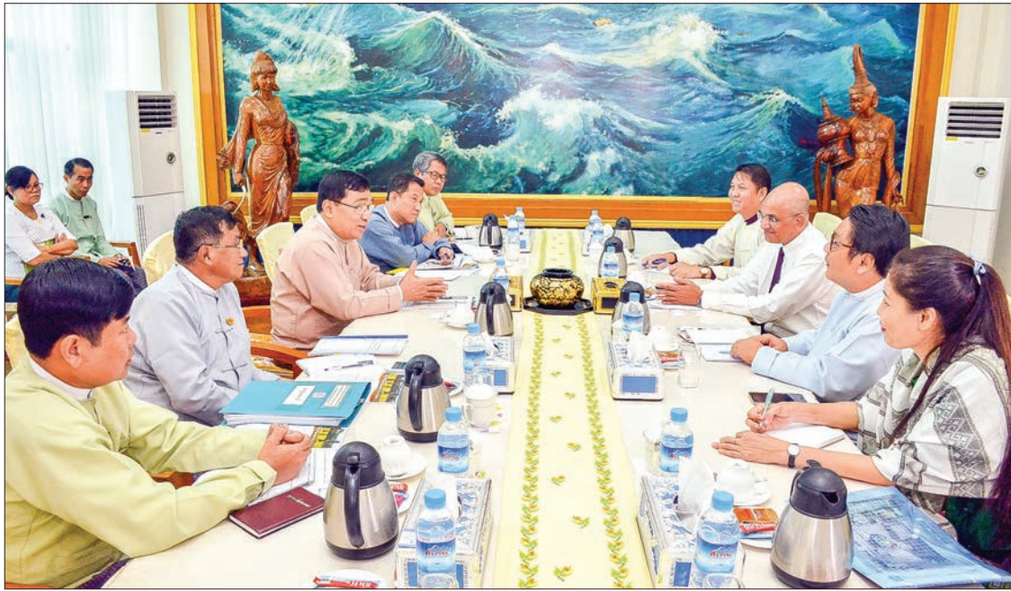
Union Minister Dr Win Myat Aye holds talks with a delegation from World Vision International Myanmar at the office of the Ministry of Social Welfare, Relief and Resettlement in Nay Pyi Taw yesterday.