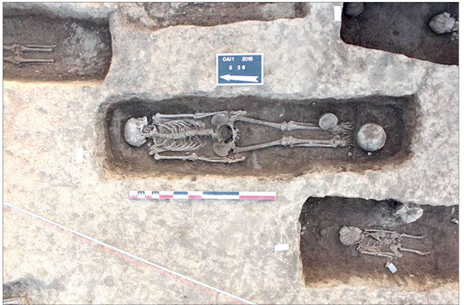
A complete human skeleton.

Experts assumed that early Myanmar humans in the pre-historic era lived in scattered areas as small villages.