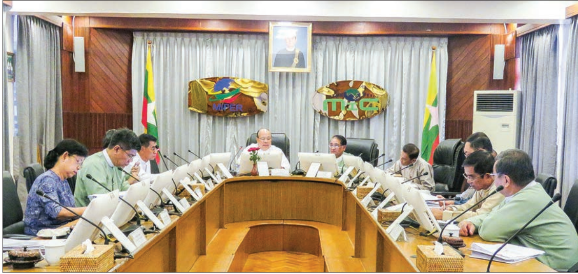
Chairman of MIC U Thaug Tun addresses the Myanmar Investment Commission meeting in Yangon yesterday.

THE Myanmar Investment Commission (MIC) yesterday approved six projects in the live-stock, manufacturing, hotels and tourism, other services, and mining sectors.