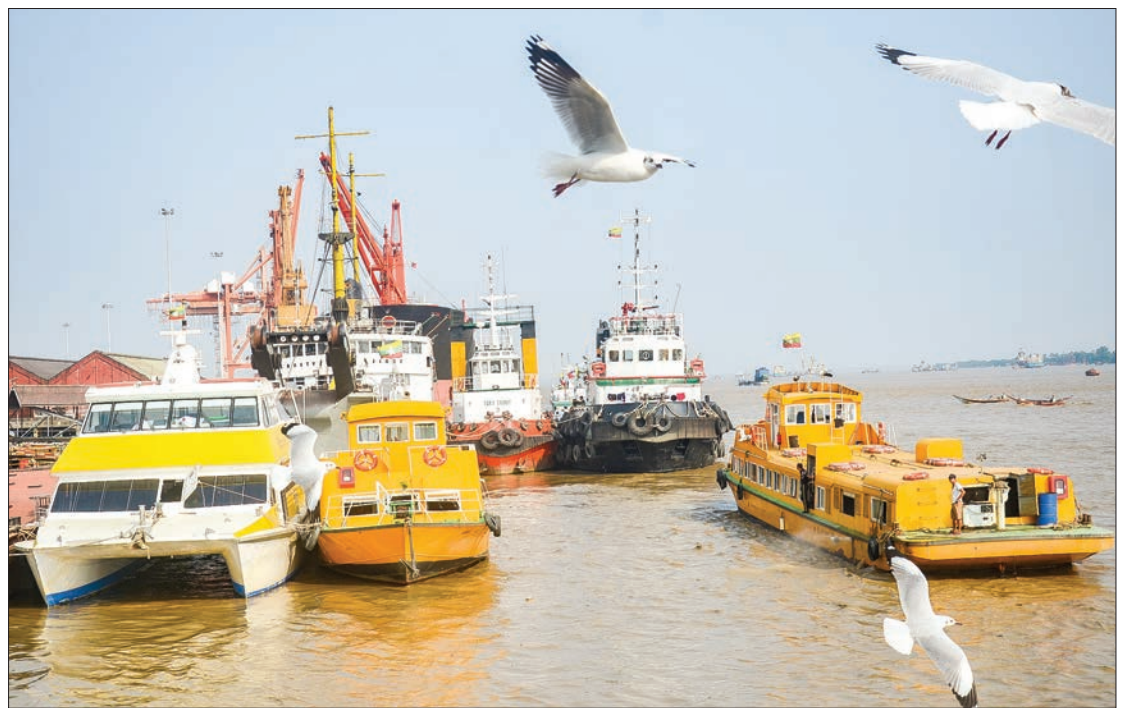
Yangon water buses dock at the jetty in Yangon.

"Water bus operation is being suspended because of a massive upgrade. The water buses have been in use for two years. So, we need to upgrade the vessels as well as the jetty. Once we receive 18 new water vessels, we will replace the old vessels with the new