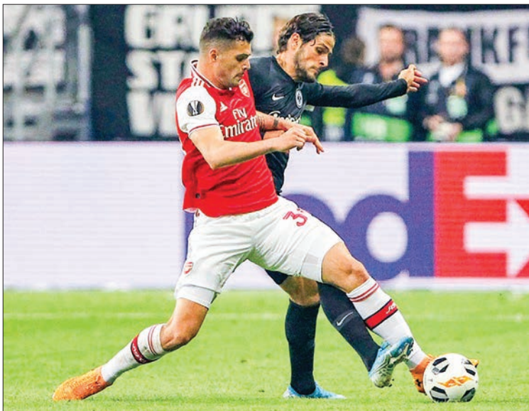
Granit Xhaka (left) has been named Arsenal's new captain.

LONDON — Arsenal manager Unai Emery hopes to change “outside” perceptions of Granit Xhaka after naming the Swiss midfielder as the Gunners' new