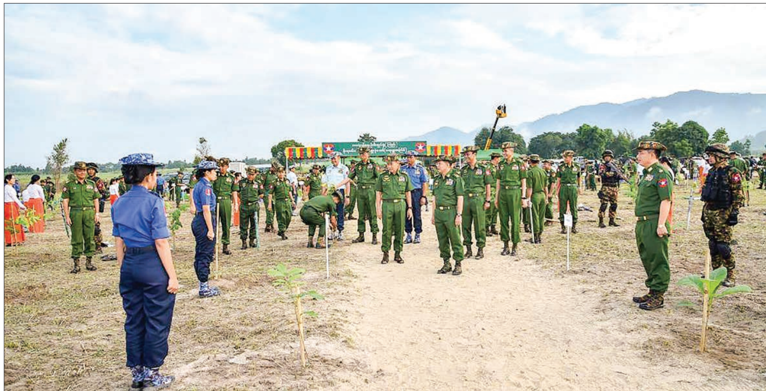
Senior General Min Aung Hlaing looks around tree planting ceremony to mark 150 th birth anniversary of Mahatma Gandhi in the compound of the Office of the Commander-in-Chief of Defence Services yesterday.

Mahatma Gandhi personally led the mourning of Bogyoke Aung San's assassination in July 1947, said Senior General Min Aung Hlaing. He said this commemorative event values Gandhi's nonviolence approach,