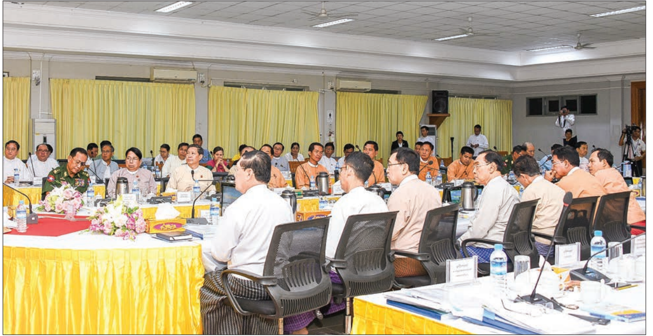
Vice President U Myint Swe addresses the third coordination meeting of MNCLE at the Ministry of Labour, Immigration and Population in Nay Pyi Taw, yesterday.

V ICE President U Myint Swe, in his capacity as Chairman of the Myanmar National Committee on Child Labour Eradication (MNCLE) addressed the third coordination meeting of the said committee held at the meeting hall of the Ministry for Labour, Immigration and Population, Nay Pyi Taw, yesterday afternoon.