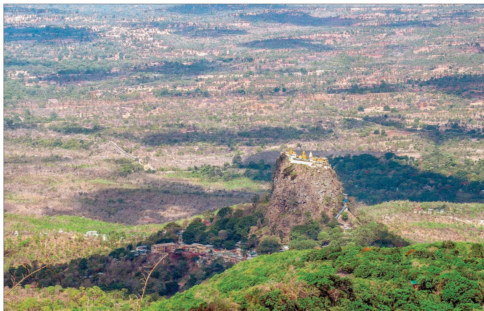
An area spanning over 360 square miles around Mandalay Region's Mount Popa has good potential as a UNESCO Global Geopark site.

UNESCO Global Geoparks, together with the other two UNESCO site designations Biosphere Reserves and World Heritage Sites, give a complete picture of celebrating our heritage while at the same time conserving the world's cultural, biological and geological diversity, and promoting sustainable economic development. While Biosphere Reserves focus on the harmonized management of biological and cultural diversity and World Heritage Sites promote the conservation of natural and cultural sites of outstanding universal value, UNESCO Global Geoparks give international recognition for sites that promote the importance and significance of protecting the Earth's geodiversity through actively engaging with the local communities. In case an aspiring UNESCO Global Geopark includes a World Heritage Site or Biosphere Reserve, a clear justification and evidence has to be provided on