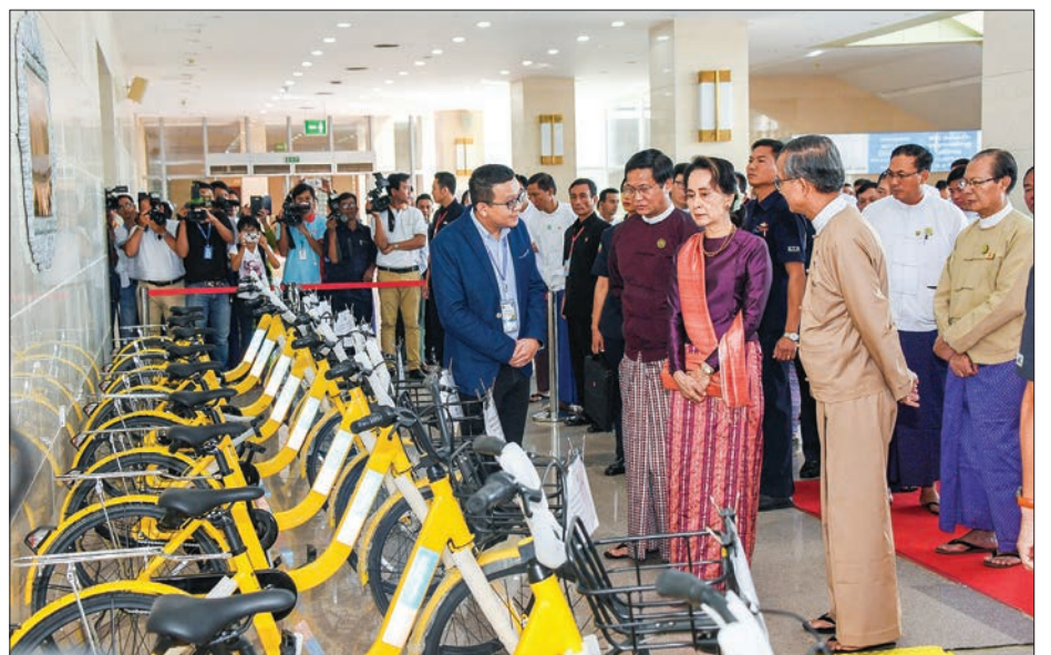
State Counsellor Daw Aung San Suu Kyi, Vice President U Henry Van Thio, Union ministers and dignitaries observe bicycles displayed at the event to mark the World Tourism Day 2019 in Nay Pyi Taw yesterday.

W ORLD Tourism Day 2019 was organized at the Myanmar International Convention Center II in Nay Pyi Taw yesterday, under the theme of 'Tourism and Job: A Better Future for All'