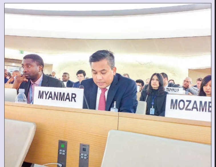
Permanent Representative of Myanmar U Kyaw Moe Tun.

The other 7 countries - Angola, Cameroon, Democratic Republic of the Congo, India, Japan, Nepal and Ukraine - did not support the resolution and abstained in the voting. Cuba did not participate in the voting — MNA ■