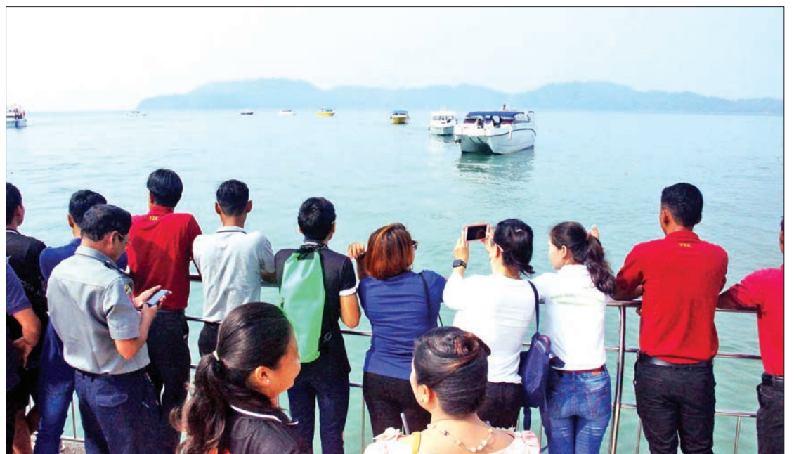
Travellers visit with boats along Kawthoung's spectacular stretch of coast.

There are 30 untouched islands featured in the archipelago trips in Kawthoung District. Of them, visitors can make day trips