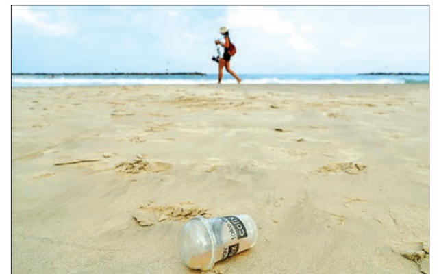
Waste litters beaches all over the world, but one South Korean mayor found there wasn't enough on his local coastline, so he trucked in a tonne of rubbish for volunteers to pick up.

“We brought in waste styrofoam and other coastal trash gathered from nearby areas so the 600 participants could carry out clean-