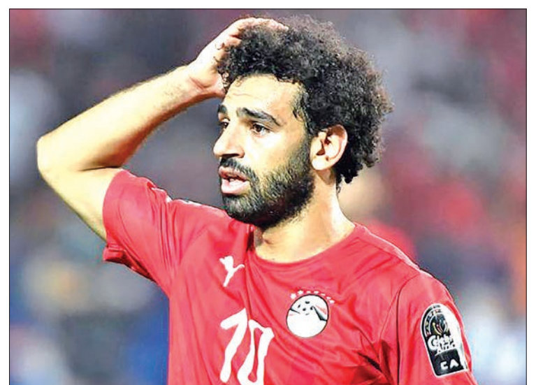
Salah hinted at his disappointment through his social media activity.

The statement released late Tuesday said the association had sent its votes officially to FIFA on August 15 and they were registered on August 19.—AFP ■