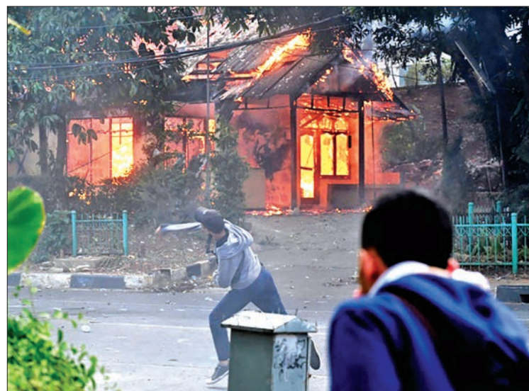
A building goes up in flames in Jakarta as a protester hurls rocks at police during violent demonstrations against the government’s proposed change to the criminal code.

There has also been a backlash against a separate bill that critics fear would dilute the powers of Indonesia’s corruption-fighting agency — known as the KPK — including its ability to wire-tap graft suspects.—AFP ■