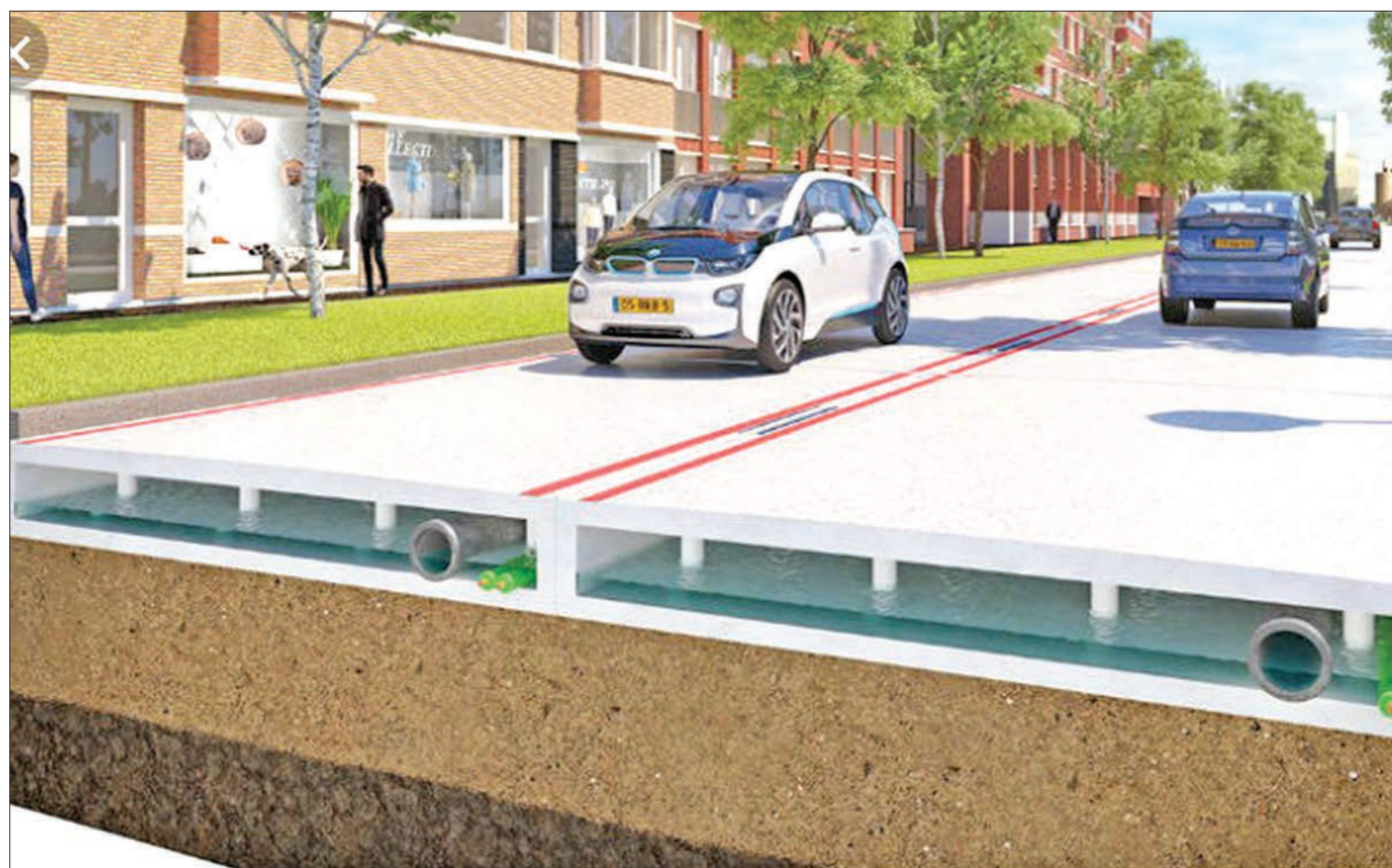
A process that creates plastic pellets from bottles and bags and melts them into asphalt makes for stronger roads and less waste.

When asphalt concrete, which is a mixture of solid bitumen and construction aggregates, such as: different grades of small rock or shingle, cement and coarse sand prepared at a mixing plant, are introduced in the road constructions, they are far less polluting. That reduced the effects of the bitumen significantly and the residents in the vicinity of the road construc-