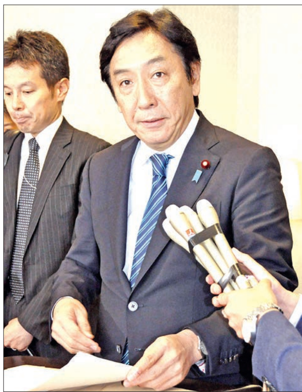
Economy, Trade and Industry Minister Isshu Sugawara.

"Every (Japanese) automaker continues to make efforts to be the best