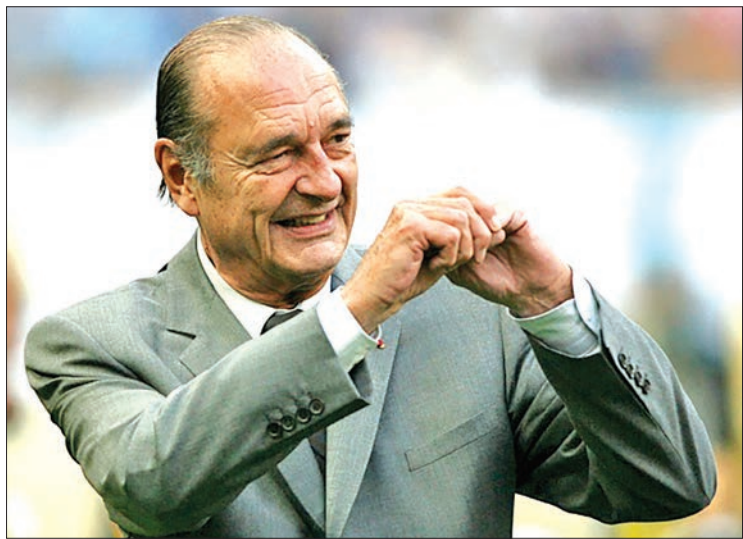
A file photo dated 15 May, 2007 shows that former French President Jacques Chirac gestures before his handover ceremony in Paris, France.