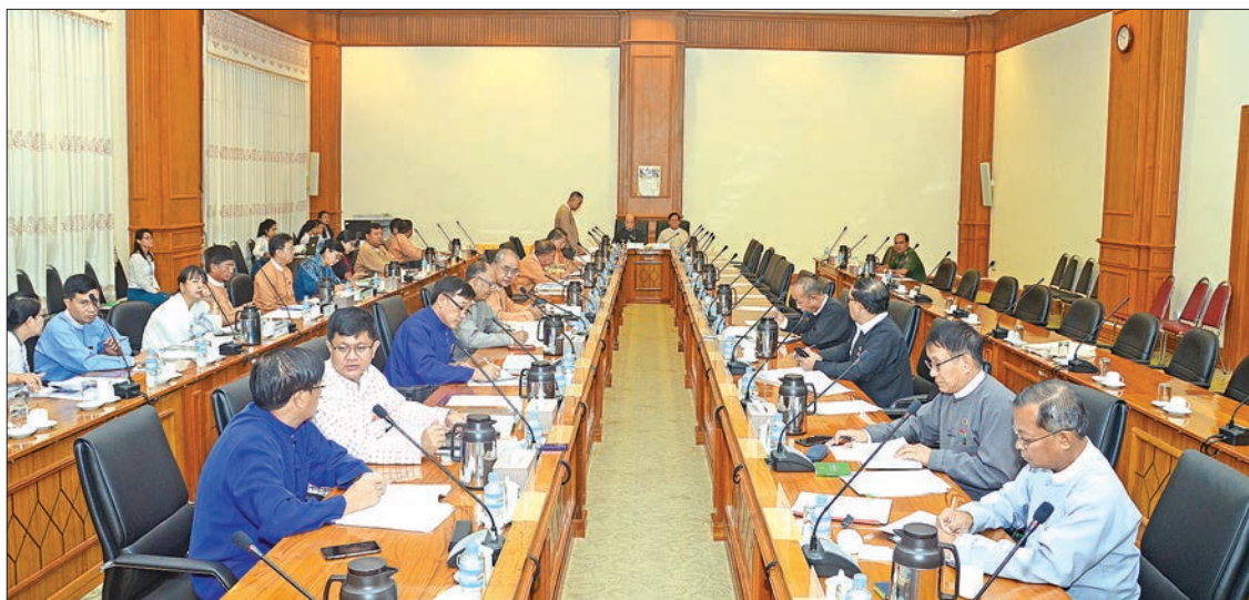
Meeting 41/2019 of Joint Committee on Amending the 2008 Constitution held in Nay Pyi Taw yesterday.

MEETING 41/2019 of the Joint Committee on Amending the 2008 Constitution was held at Pyidaungsu Hluttaw Building D in Nay Pyi Taw yesterday morning.