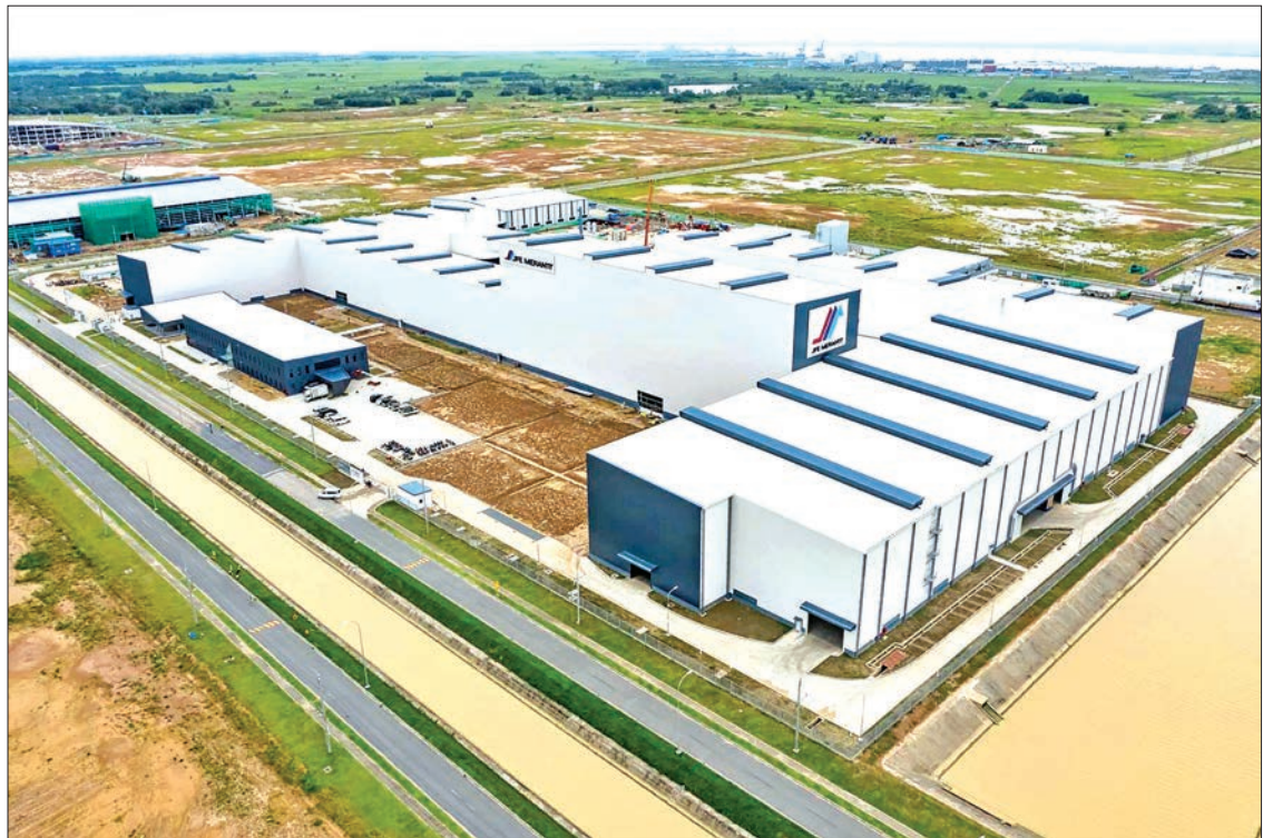
Photo shows JFE Meranti Myanmar (JMM) factory in Thilawa Special Economic Zone.

The joint venture has received a total investment of US$85 million.—Zarni Maung (Translated by GNLM)