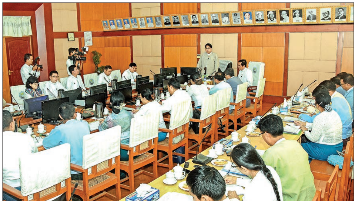
Union Minister for Information Dr Pe Myint delivers the speech at the meeting with the heads of the Information and Public Relations Department from the states and regions in Nay Pyi Taw yesterday.