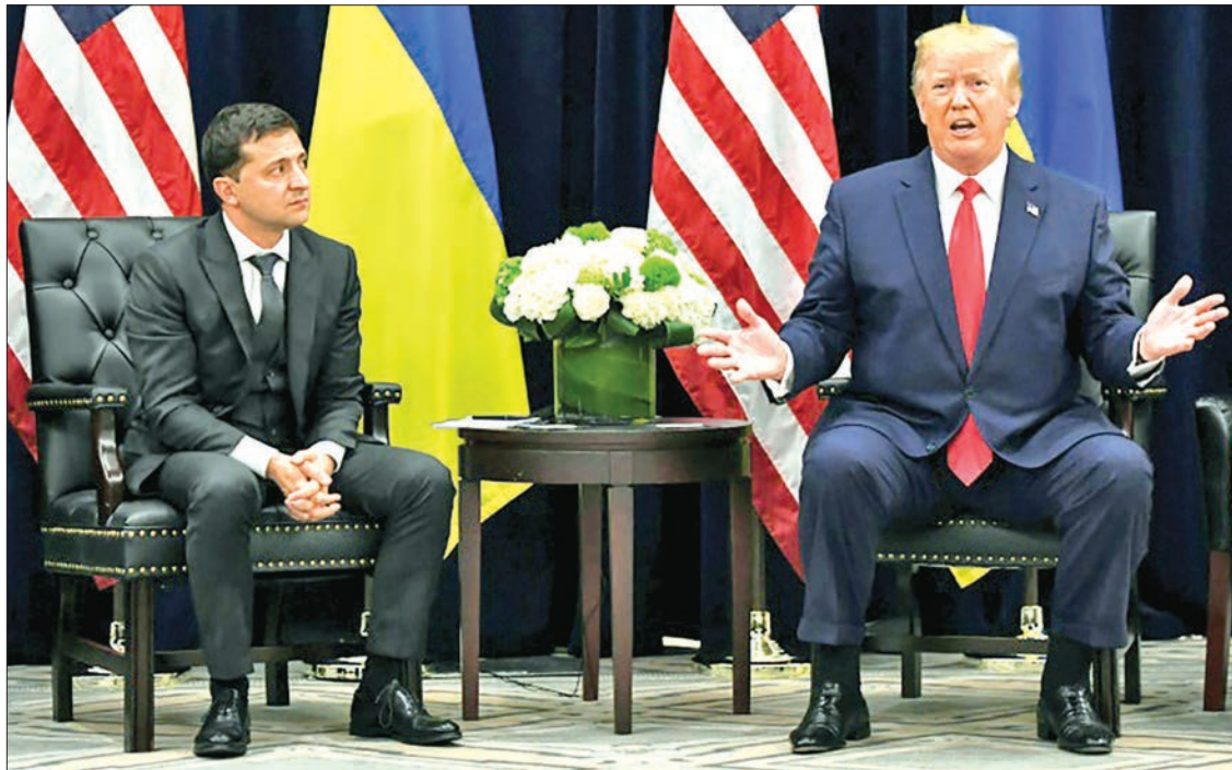
US President Donald Trump insisted he exerted “no pressure” on Kiev — a claim echoed by Ukrainian leader Volodymyr Zelensky, who appeared side-by-side with Trump at a long-planned meeting on the sidelines of the UN General Assembly.

Top Democratic Senator Chuck Schumer told reporters the complaint was “very troubling” — an assessment echoed by Republican Senator Ben Sasse, who said that “there’s obviously lots that’s very troubling