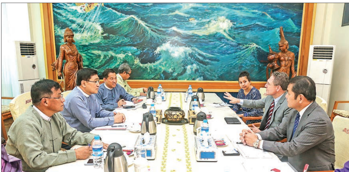
Union Minister Dr Win Myat Aye holds talks with guests in Nay Pyi Taw yesterday.