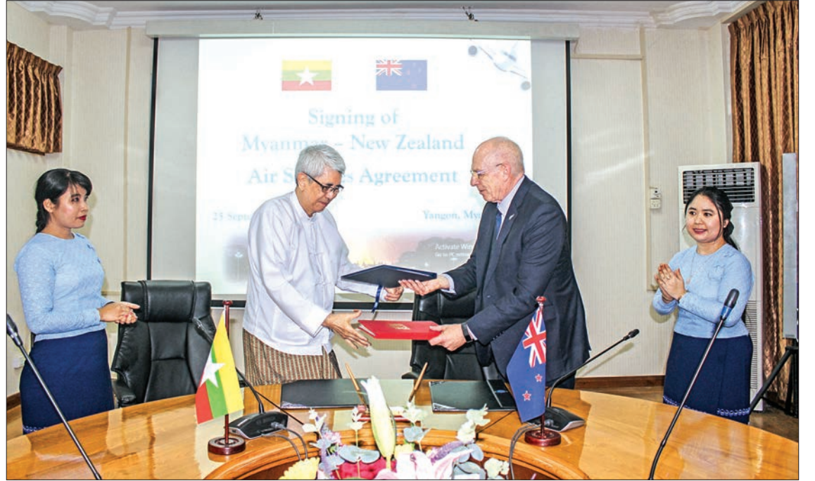
Deputy Minister U Kyaw Myo and Ambassador of New Zealand Mr Stephen Marshall participate in a signing ceremony for exchange of notes for air services between Myanmar and New Zealand in Yangon.