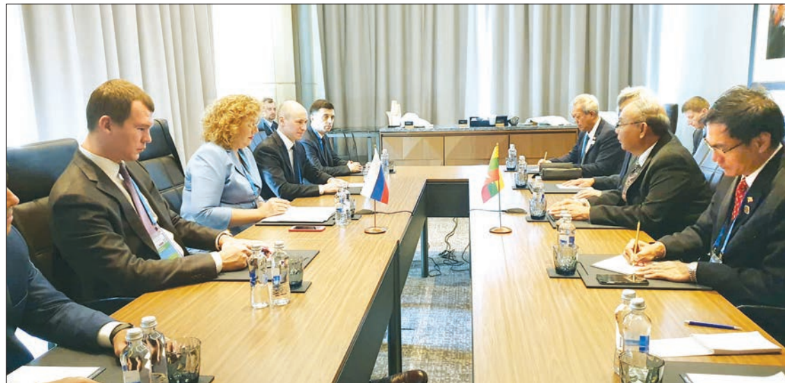
Amyotha Hluttaw Speaker Mahn Win Khaing Than meets with the Deputy Chairman of the State Duma, Ms Olga Yepifanova on 23 September.

the attending delegation leaders delivered their addresses during the Plenary Session.