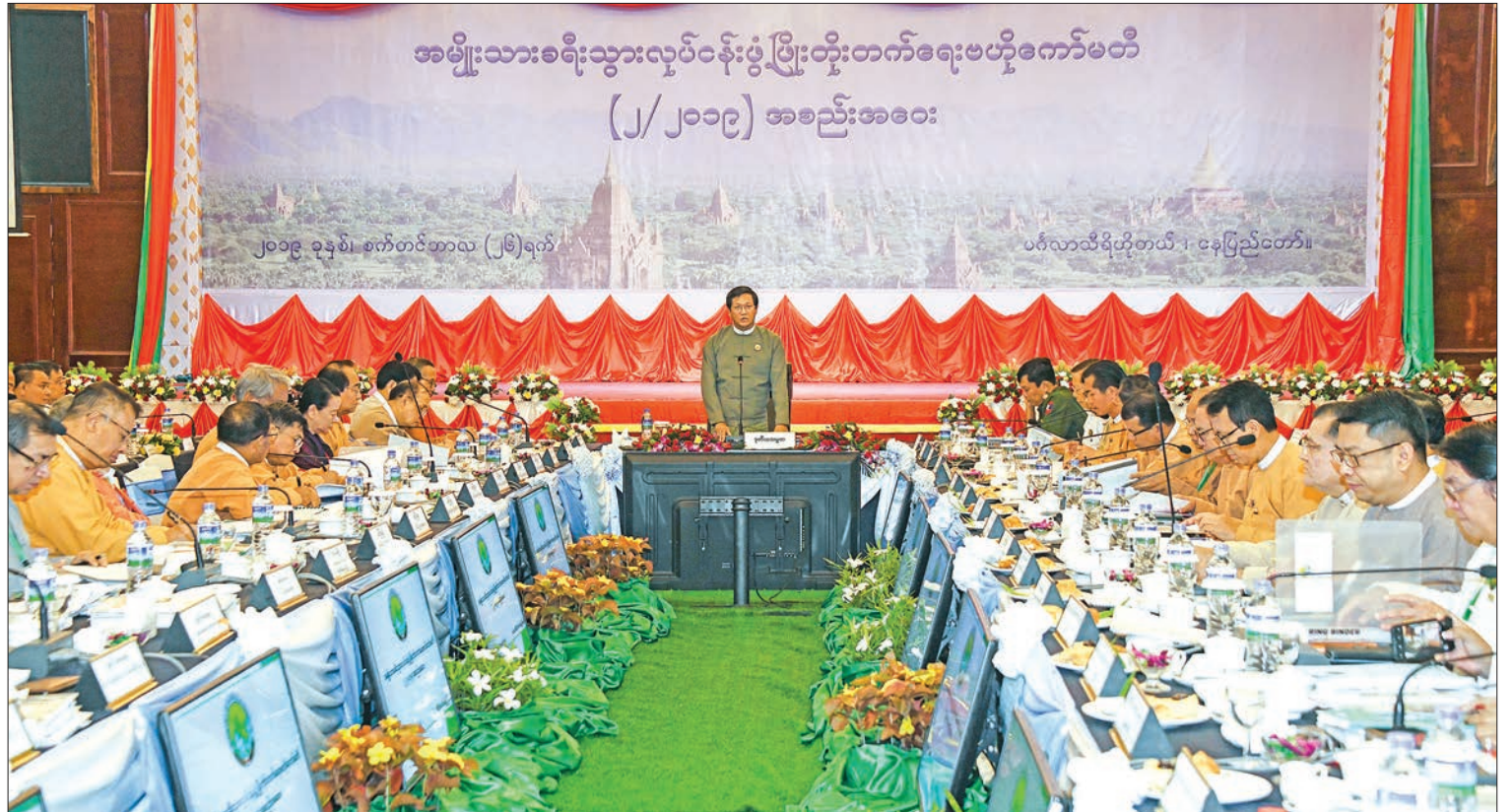
Vice President U Henry Van Thio addresses the meeting of National Tourism Development Central (NTDC) Committee at Mingala Thiri Hotel, Nay Pyi Taw yesterday.

Tourism has established the Myanmar Tourism Master Plan 2013-2020 as a guide to future works. It was learnt that the ministry was cooperating with the World Tourism Organization and development partner organization Luxembourg Development Agency to draw up projects for the 2020 to 2025 period. Tourism required cooperation with all sectors and cooperation between private entities and relevant departments was required. State/Region governments were also learnt to be coordinating and drawing up region wise tourism master projects that would increase local participation.