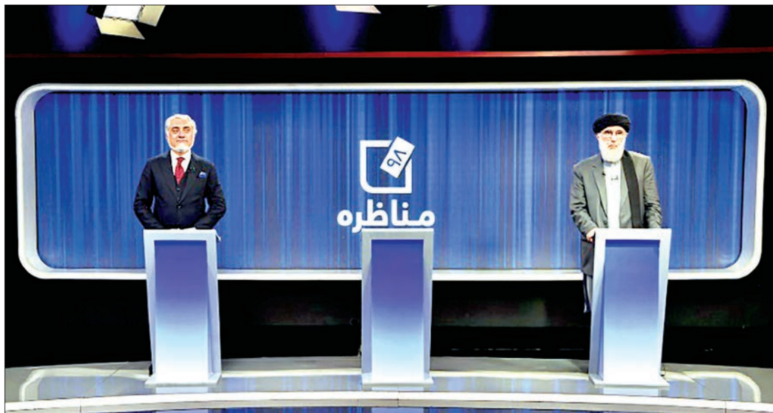
Afghan presidential candidates Abdullah Abdullah (left) and Gulbuddin Hekmatyar take part in a presidential debate at Tolo News TV station in Kabul. Current President Ashraf Ghani faced derision when he declined to participate.

Both claimed victory in the 2014 election — a vote so tainted by fraud and violence that it led to a constitutional crisis and forced then-US President Barack Obama to push for a compromise that saw Abdullah awarded the subordinate role.—AFP ■