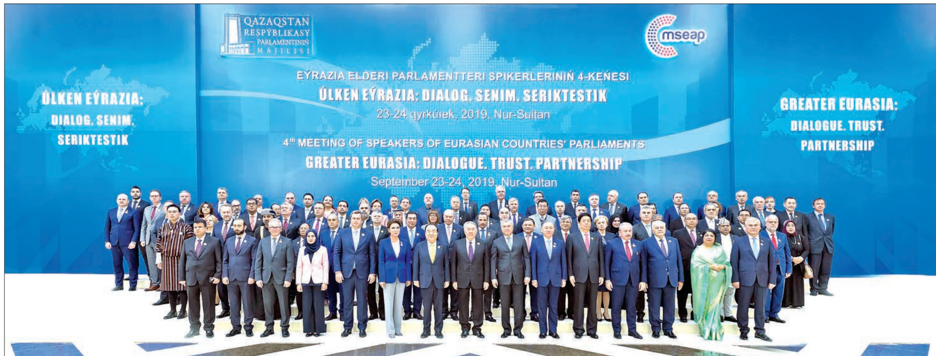
Amyotha Hluttaw Speaker Mahn Win Khaing Than and attendees pose for a documentary photo at the 4 th Meeting of Speakers of Eurasian Countries' Parliaments in Nur-Sultan.