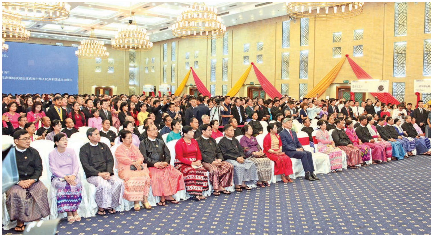
Vice President U Myint Swe delivers the speech at reception to mark the 70 th Anniversary of the Founding of the People's Republic of China (PRC) at Myanmar International Convention Center-II in Nay Pyi Taw yesterday.

it was an honor to see the rapid social and economic developments of the PRC. Furthermore due to the efforts made during the past 70 years, more than 700 million of PRC's population was freed from poverty. It has now become a country with the most rapid economic development in the world and had become the second biggest economically powerful country in the world. It was seen happily as the most successful country. During these years the PRC's economy developed significantly.