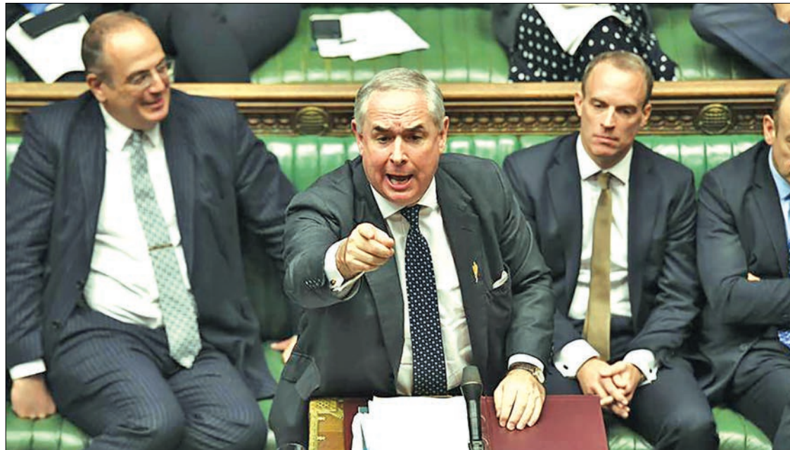
Britain's Attorney General Geoffrey Cox (Front) speaks at the House of Commons in London, Britain, on 25 September, 2019.

He said: "I think the (Supreme) court was wrong to pro-