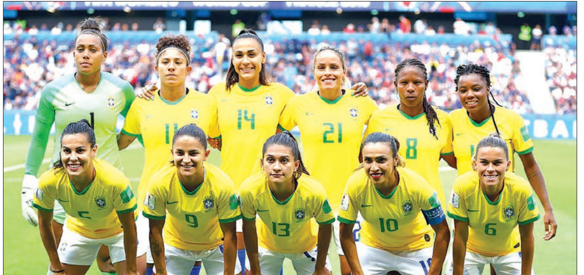
The Brazil women's national football team pose for a group photo at an international football match.

The competition with world class teams will help prepare team Myanmar for the upcoming 2019 South East Asian Games,