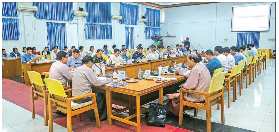
Union Ministers U Min Thu and Dr Win Myat Aye attend the coordination meeting for discussing more effective responses to natural disasters and better cooperation of the relevant ministries and states/regions in Nay Pyi Taw yesterday.

Union Minister U Min Thu then said the State Counsellor has instructed the relevant ministries to review the appropriateness of existing short and long-term plans with the ongoing