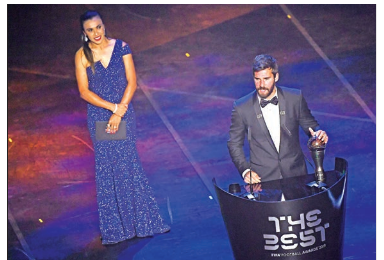
Liverpool's Alisson Becker is nearing a return from a calf injury.

"Before that happens we would prevent any of our players turning out for the national side."—AFP ■