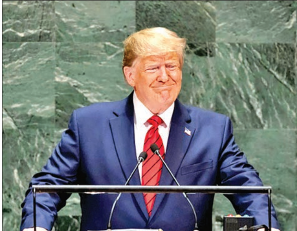
President Donald Trump used his UN address to hit out at China's trade 'abuses'.

The dollar steadied versus the euro and yen amid renewed trade fears as Trump adopted a hard line on China. The pound meanwhile dropped as British MPs returned to parliament one day after a momentous Supreme Court ruling that Prime Minister Boris Johnson's decision to suspend parliament ahead of Brexit was unlawful. "Markets have taken a bit of tumble on fears US president Trump could be impeached, while the (UK) drama... is just as intoxicating as the Brexit