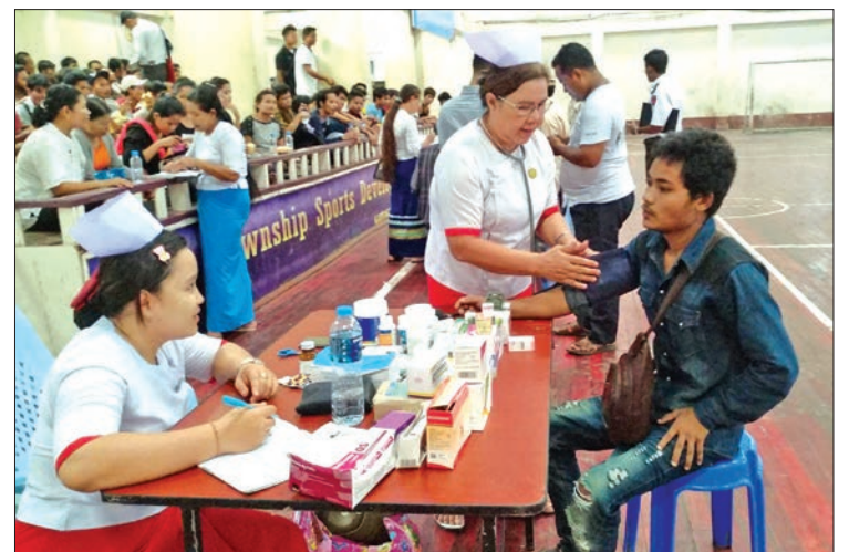
Township Public Health Department staff provide healthcare to the workers in Kawthoung.