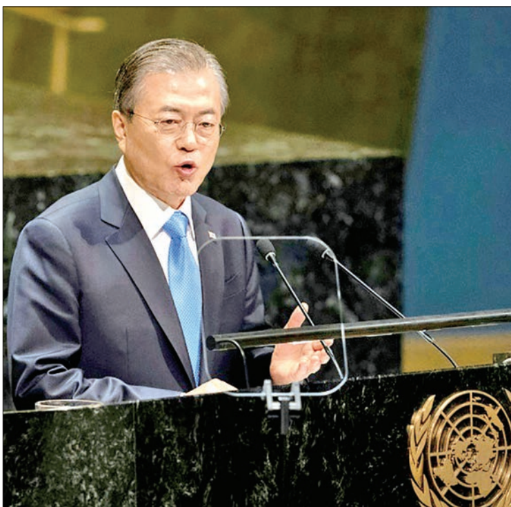
South Korean President Moon Jae-in laid out his rosy vision for the last Cold War frontier in an address to the UN General Assembly.

NEW YORK—South Korean President Moon Jae-in on Tuesday proposed that the United Nations create an “international peace zone” to replace the peninsula’s divide, saying the idea would both reassure the North and inspire the world.