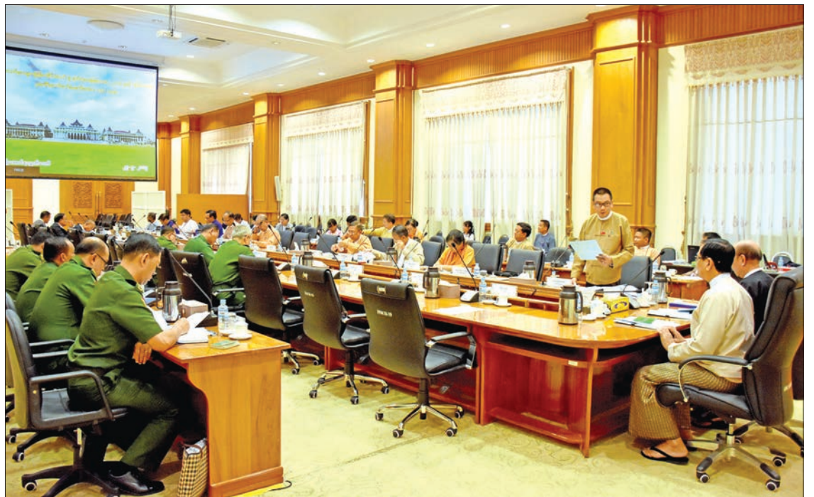
Joint Committee on Amending the 2008 Constitution holds its 40/ 2019 meeting in Nay Pyi Taw yesterday.