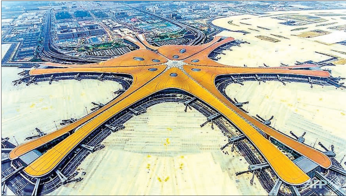
The terminal of the new Beijing Daxing International Airport.

BEIJING—Chinese President Xi Jinping on Wednesday announced the official opening of the Beijing Daxing International Airport. Xi, also general secretary of the Communist Party of China Central Committee and chairman of the Central Military Commission, attended the operation ceremony of the airport on Wednesday morning.—Xinhua ■