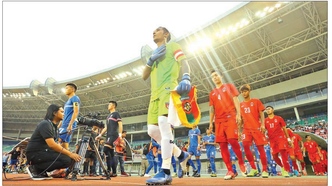
The Myanmar national team (right side) walk into the Mandalay Thiri Football Stadium on 19 March before a FIFA friendly match against Chinese Taipei.

their special training session on 25 September and will leave for Kyrgyzstan next month. Myanmar have met Kyrgyzstan twice