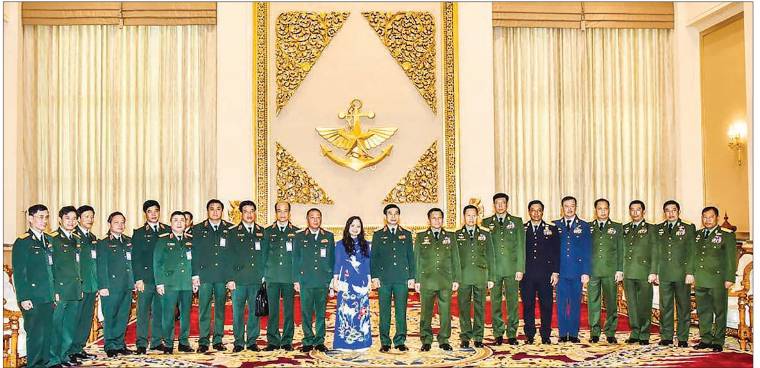
Senior General Min Aung Hlaing and Senior Lieutenant General Phan Van Giang pose for a group photo together with senior military officers of both countries in Nay Pyi Taw yesterday.

During the meeting, they discussed the need for unity, cooperation and strengthened relations among the militaries of ASEAN member nations in order to ensure sustainable development and stability within the region.