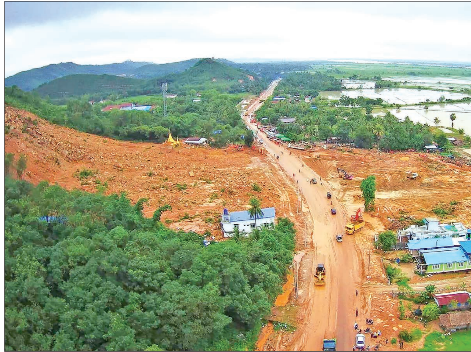
Photo shows an aerial view of the area of deadly landslide that struck a village in Paung Township in August, 2019.

The emergence of a storm depends of three fundamental factors; the factor is low pressure area followed by the second factor of high temperatures on the sea water and third one is the acidity rate high on low pressure area. The earth rotates at a sloping 23 degree centigrade around its own axis and completes one revolution around the sun about 365 days, thus making the wind move quickly here and there as the