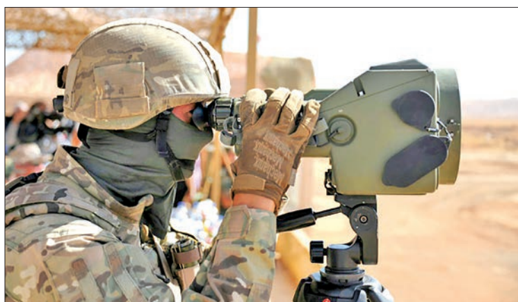
Russian military support has allowed Syrian government forces to retake large parts of Syria from rebels and jihadists since 2015, and now they control around 60 percent of the country.

YAFUOR (Syria)—Wearing clean bullet-proof vests and knee pads, fighters from a new Syrian army battalion showcase the skills they have learned from Russia's military advisers. In the countryside west of Damascus, the soldiers carry out a mock assault, fire mortar rounds and rockets, perform mine-clearing and first aid exercises. Large clouds of dust rise over the training camp as troops in camouflage fatigue open fire.