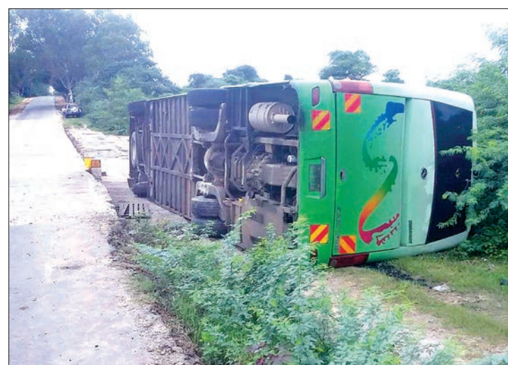
A passenger bus carrying 45 passengers turned over in Mahlaing Township.

A PASSENGER bus overturned on the morning of 25 September near Thapyaypin village in Mahlaing Township after the driver lost control of the vehicle while trying to avoid a head-on collision with a car. Thirteen passengers were injured in the accident.