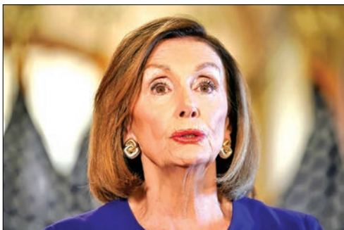
Nancy Pelosi, the speaker of the US House of Representatives, had resisted calls for Donald Trump’s impeachment for months, preferring to focus on the 2020 election.

WASHINGTON—Top US Democrat Nancy Pelosi Tuesday announced the opening of a formal impeachment inquiry into Pres-