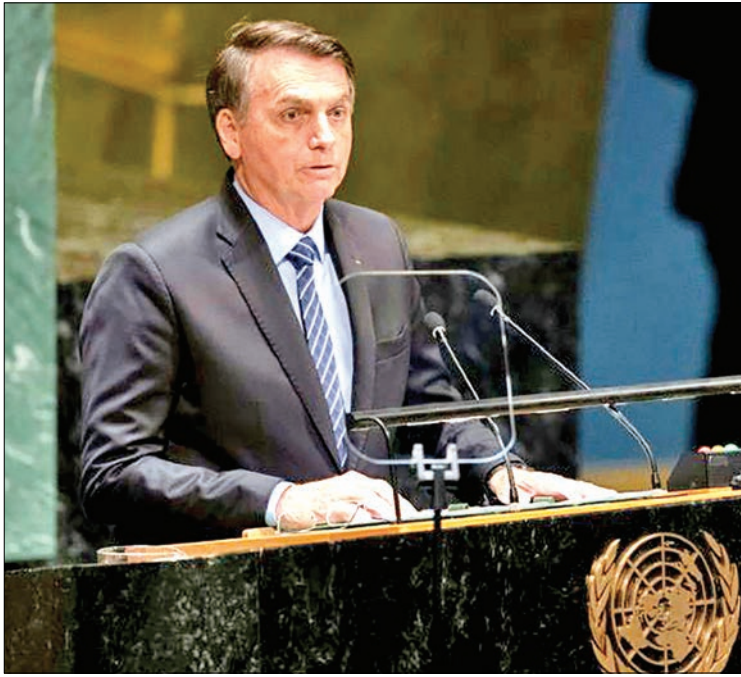
Jair Bolsonaro, President of Brazil, tells the UN General Assembly that the Amazon rainforest is sovereign territory.

UNITED NATIONS—Brazil’s President Jair Bolsonaro said Tuesday it was a lie that the Amazon was being devastated by fire and accused countries critical of him of having a “colonialist spirit.” Speaking first at this year’s UN General Assembly, the far-right leader also heaped praise on