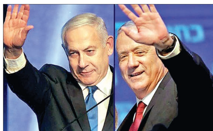
The combination picture created on 18 September 2019 shows, Benny Gantz (R) waving to supporters in Tel Aviv early on 18 September 2019, and Israeli Prime Minister Benjamin Netanyahu (L) addressing supporters at his Likud party's electoral campaign headquarters in Tel Aviv early on 18 September 2019.

"I therefore believe that the right path for the state of Israel today is to build as broad a governing coalition as possible," Riv-