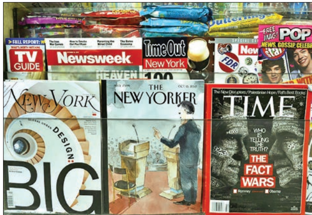
Launched in 1968 'New York' magazine has become a prominent voice in culture and lifestyle in its home city and beyond.

magazine, as was 2007's "American Gangster" starring Denzel Washington. New York Media also owns a stable of websites on style (The Cut), food (Grub Street) and pop culture (Vulture). The company was running at a loss before the announcement, according to the New York Times. Vox Media, a child of the internet, was founded in 2005 originally as a network of sports websites. In recent years Vox and New York Media have sought to diversify, into podcasts, video production and event organizing. —AFP ■