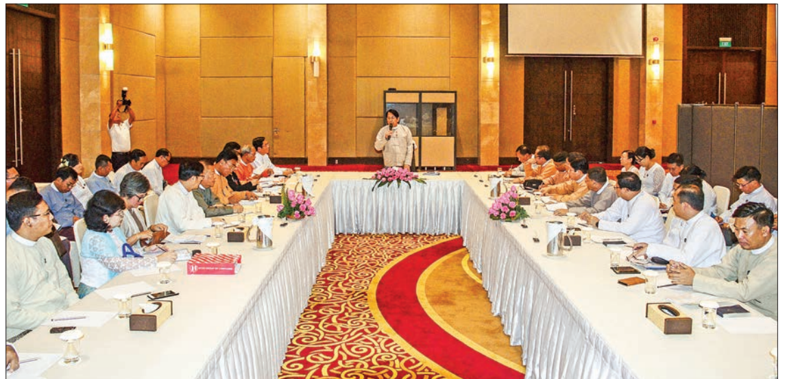
Union Minister for Information Dr Pe Myint addresses the meeting on development of community centers in Nay Pyi Taw yesterday.

At the meeting, they discussed community based mobile libraries, computer courses, children's reading rooms, mini museums, public talks, reading sessions and contests which are conducted in collaboration with Daw Khin Kyi Foundation. They also discussed funds for the activities.—MNA ■(Translated by Alphonsus)