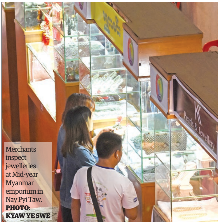
Merchants inspect jewellery at Mid-year Myanmar emporium in Nay Pyi Taw.