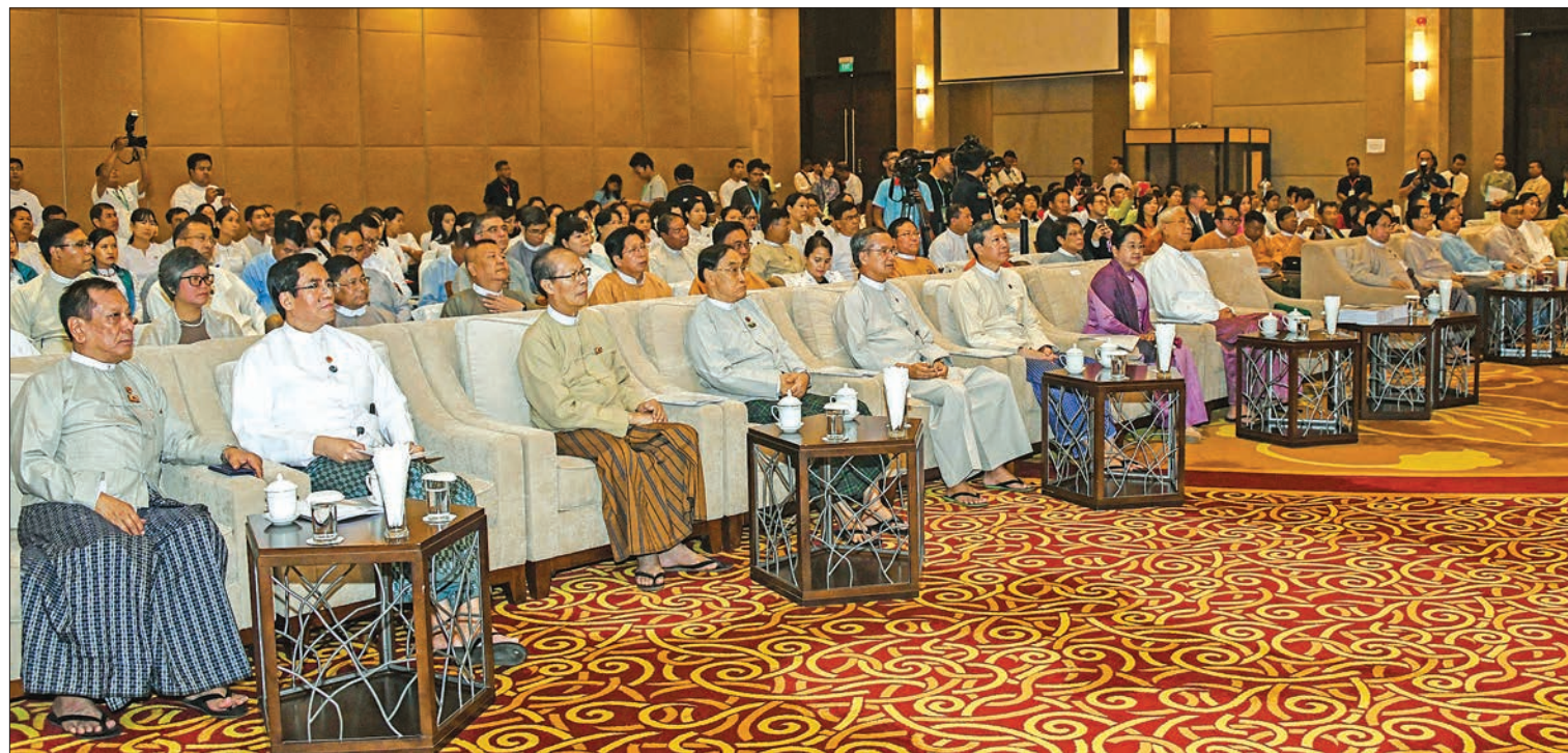
State Counsellor Daw Aung San Suu Kyi delivers the speech at the handover ceremony in Nay Pyi Taw yesterday.

It had developed into a State project. It had been proven that the mobile libraries could reach many corners of the country, and the project is therefore handed over to the government.