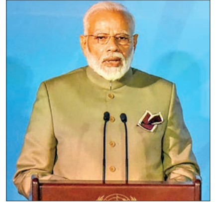
The decision to honor Narendra Modi provoked several withering op-eds and the ire of three Nobel prize winners, citing rising attacks against minorities under his tenure.

NEW YORK—Indian Prime Minister Narendra Modi on Tuesday brushed aside an outcry from human rights activists to receive an award from the Gates Foundation in New York for his efforts to end open defecation. The decision to honor the Indian leader provoked several withering op-eds and the ire of three Nobel prize winners, citing rising attacks against minorities under Modi’s