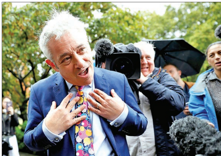
Speaker of the House of Commons John Bercow announcing that parliament will return to work on Wednesday.

The judgement has hit Johnson's authority, prompting calls for his resignation and cast further doubt on his promise to pull Britain out of the EU on October 31, come what may. The Conservative leader landed back in London at around 10:30am (0930 GMT) after his trip to New York, heading straight into a political maelstrom triggered by Tuesday's damning court ruling that his decision to suspend parliament for five weeks was unlawful. Britain's right-wing tabloids reacted angrily to the ruling, with The Sun saying it