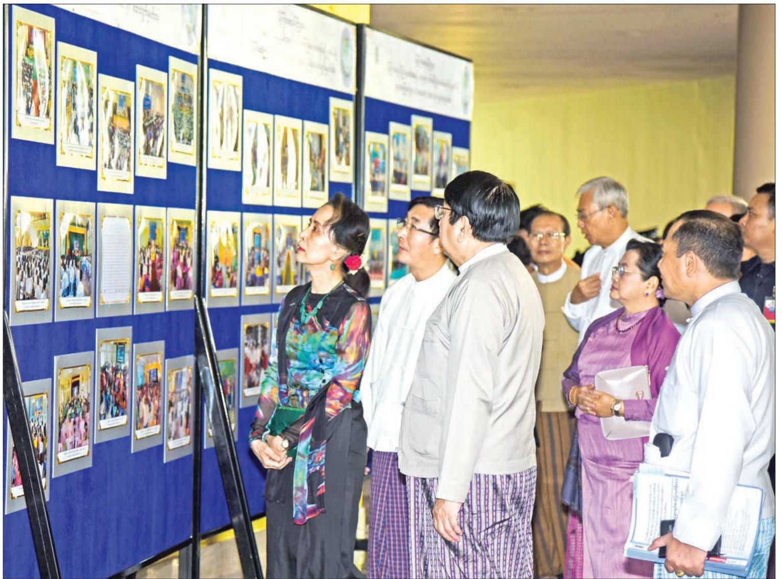
State Counsellor Daw Aung San Suu Kyi, former President U Htin Kyaw and wife, and dignitaries looking at documentary photos on activities of community centres displayed at the ceremony to hand over mobile libraries of Daw Khin Kyi Foundation to Ministry of Information in Nay Pyi Taw yesterday.