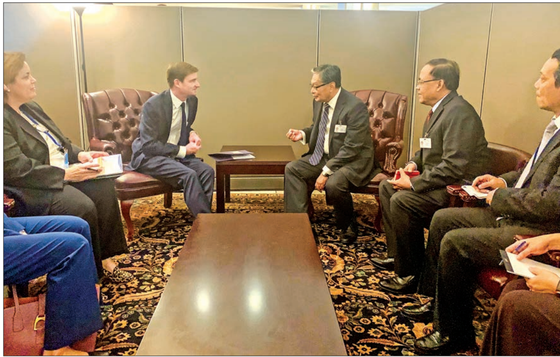
Union Minister U Kyaw Tint Swe meets US Under Secretary of States for Political Affairs Mr David Hale in New York on 23 September.

U Kyaw Tint Swe, Union Minister for the Office of the State Counsellor who is currently in New York attending the 74 th Session of the United Nations General Assembly, met with US Under Secretary of States for Political Affairs Mr David Hale at the United Nations Headquarters on 24 th September 2019.