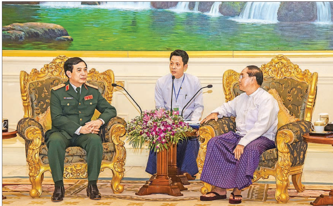
Vice President U Myint Swe meets with Senior Lieutenant General Phan Van Giang, the Chief of the General Staff of the Viet Nam People's Army in Nay Pyi Taw yesterday.