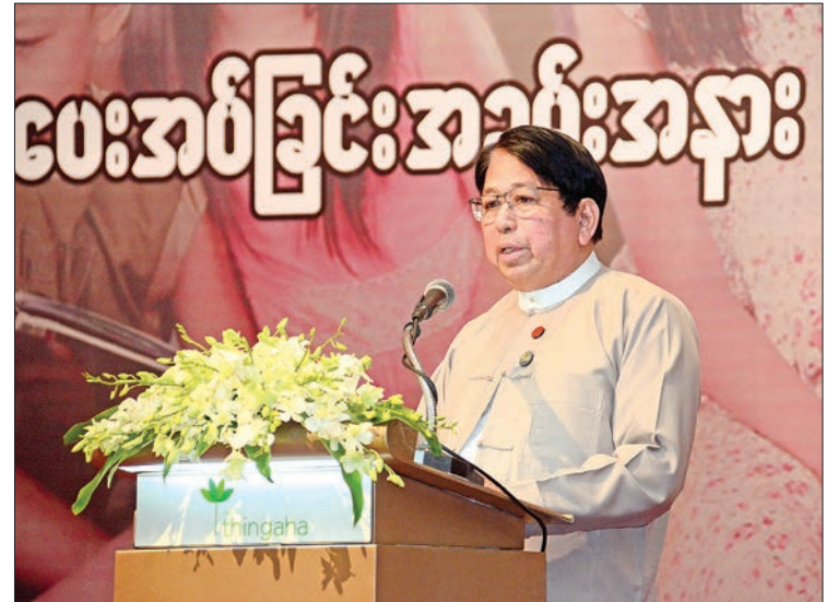
Union Minister for Information Dr Pe Myint delivers the speech at the handover ceremony in Nay Pyi Taw yesterday.

The State Counsellor and the attendees posed for documentary photos before closing the ceremony. After greeting those present at the ceremony, they looked around the displays of documentary photos about inauguration ceremonies of community centres, their