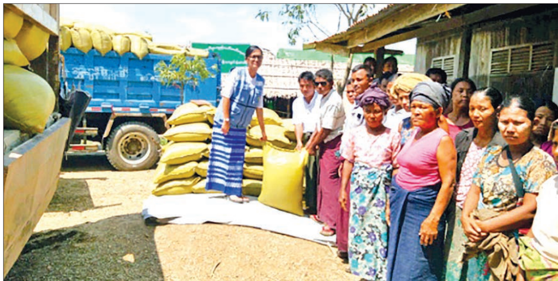
Officials from Disaster Management Department distribute rice bags to displaced people at IDP camps in MraukU Township, Rakhine State.

The officials also went to Tein Nyo Village and provided 852.5 bags of rice for one month to 2,842 displaced people of 712 households at the village's IDP camp.—MraukU (IPRD) ■ (Translated by Kyaw Zin Tun)