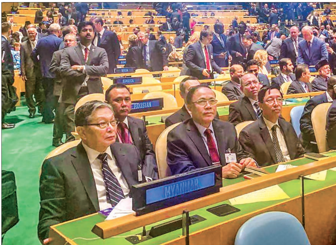
Myanmar delegation led by Union Minister U Kyaw Tint Swe attends 74th Session of United Nations General Assembly held in New York on 24 September 2019.