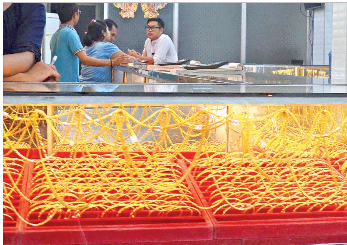
Gold jewelry seen at shop in downtown Yangon.

The prices moved in the range of K1,099,000 (1 July) and 1,149,400 (31 July) in July. Last month, the prices ranged between K1,141,5000 and K1,263,000.—GNLM ■ (Translated by Ei Myat Mon)