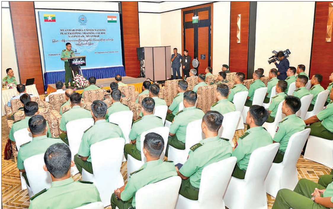
Vice Senior General Soe Win delivers the opening speech at the ceremony of Myanmar-India United Nations Peacekeeping Training Course in Nay Pyi Taw yesterday.

AN opening ceremony of the 7 th Myanmar-India United Nations Peacekeeping Training Course jointly organized by the Myanmar Tatmadaw and India's military for the Myanmar Tatmadaw to participate in UN peacekeeping operations was held at the Park Royal Hotel in Nay Pyi Taw