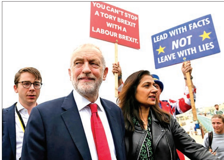
Jeremy Corbyn has tried to embrace both wings of his party by leaving the ultimate decision on Brexit to voters.

It would not see Labour officially campaign for either option and instead try to "build maximum consensus". The third motion, proposed by Corbyn himself and backed by the executive, would see the party come to some sort of decision "through a special