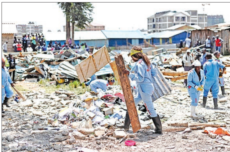
Rescuers are at work around a collapsed school building, on September 23, 2019 in Nairobi.

Under the new system, travelers are required to download the app in advance, and at the e-Gate they scan their IC passport and QR code created with the app.— Kyodo News ■