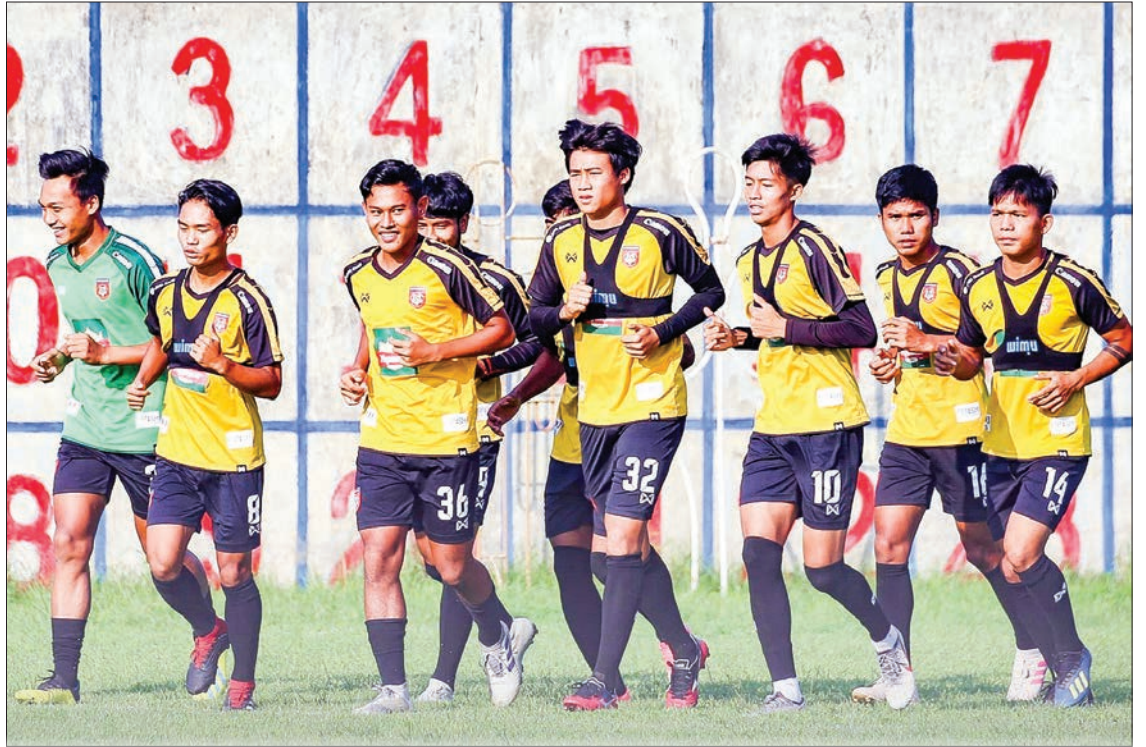
The Myanmar U-22 footballers begin training yesterday for 2019 SEA Games.