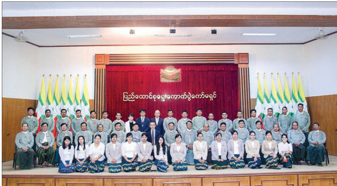
Chairman of Union Election Commission U Hla Thein poses for the documentary photo with staff members of UEC and attendees in Nay Pyi Taw yesterday.