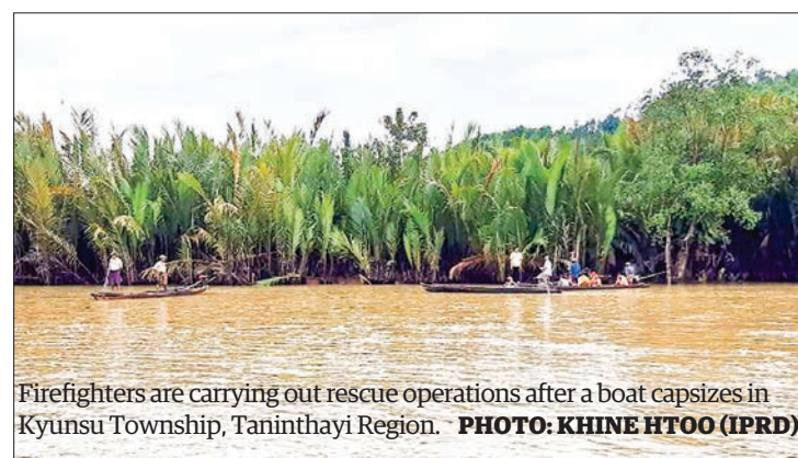
Firefighters are carrying out rescue operations after a boat capsizes in Kyunsu Township, Taninthayi Region.

A boat carrying 16 persons from Waryit village-tract in Kyunsu Township, Taninthayi Region capsized around 2 pm