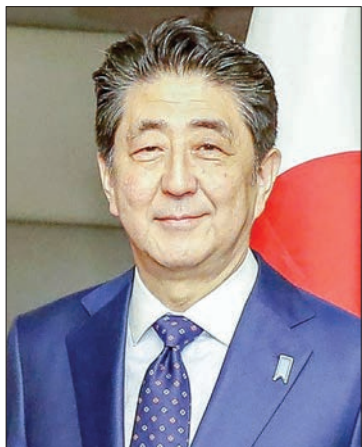
File photo shows Japanese Prime Minister Shinzo Abe.

High on the priority list for Japan is to secure assurances from the United States that it