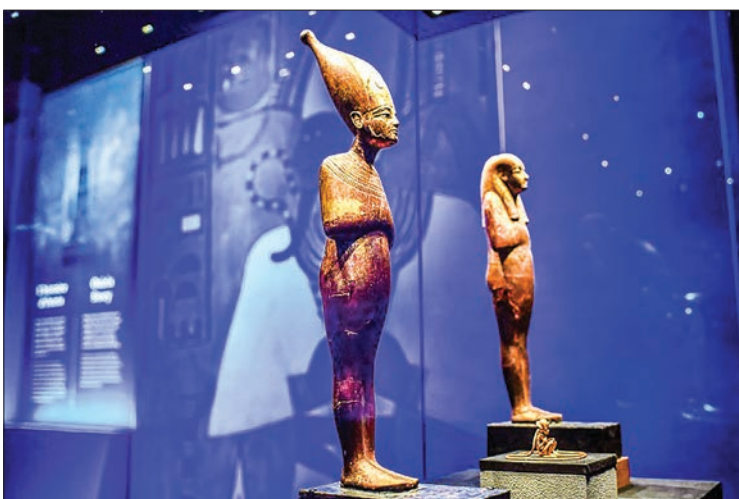
Egyptian authorities say the show displays the largest number of Tutankhamun artefacts ever to have left Cairo.

But Ishiguro insists there is no inherent danger in machines becoming self-aware or surpassing human intelligence. “We don’t need to fear AI or robots, the risk is controllable,” he said. “My basic idea is that there is no difference between humans and robots.” — AFP ■