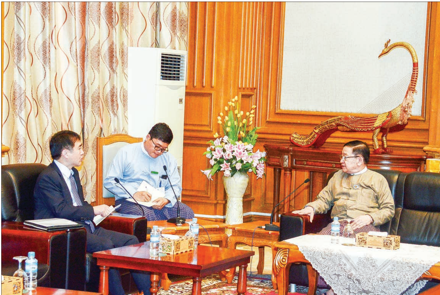
Speaker of Pyithu Hluttaw U T Khun Myat meets with Ambassador of the Republic of Korea Mr Lee Sang-hwa in Nay Pyi Taw yesterday.