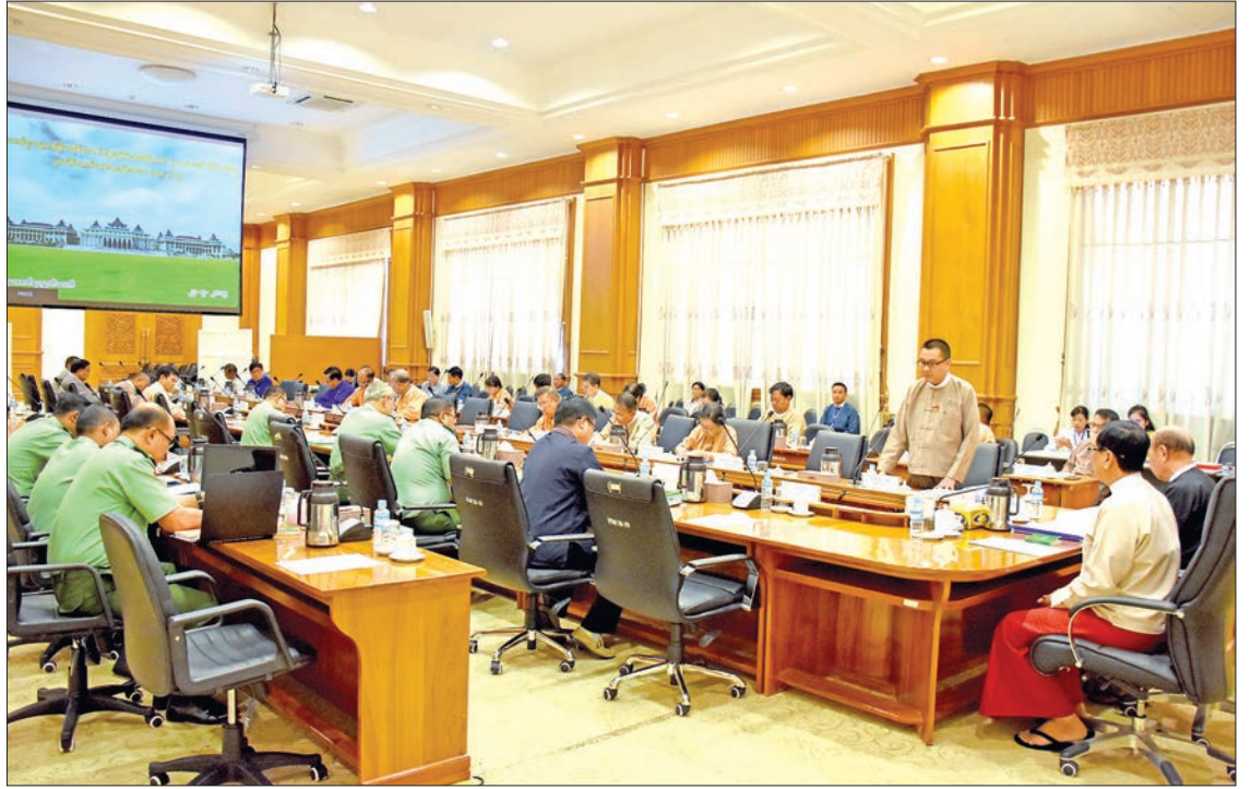
Meeting 38/2019 of the Joint Committee on Amending the 2008 Constitution in progress in Nay Pyi Taw yesterday.