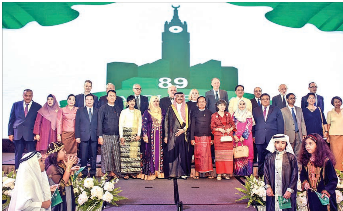
Union Minister U Han Zaw, Yangon Region's Chief Minister U Phyo Min Thein, Saudi Ambassador to Myanmar Mr Sahal Moustafa Ahmed Ergesous and their wives and attendees pose for a photo at the celebration of Saudi National Day in Yangon.

THE Embassy of Saudi Arabia celebrated the Saudi National Day, at the Wyndham Grand Hotel in Yangon yesterday evening. It was attended by Union Minister for Construction U Han Zaw and wife, and the event started with national anthems of