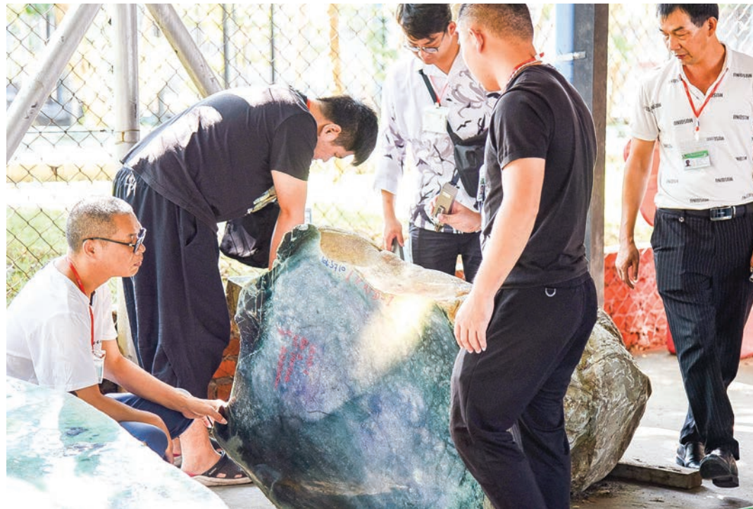
Traders evaluate jade stones at the 8 th day of Mid-Year Myanmar Gems Emporium in Nay Pyi Taw.