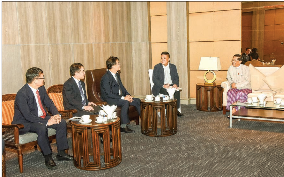
Union Minister U Min Thu meeting with Korean Deputy Minister Mr Yoon Jong-In at Hilton Hotel in Nay Pyi Taw yesterday.

Mr Yoon Jong-In, the Vice Minister for Interior and Safety of ROK, expressed thanks for organizing the forum to Union Minister for Union Government