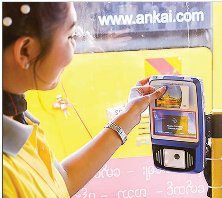
YBS staff demonstrates use of e-ticket machine with the card payment system.

“The electronic ticketing system is complex, and it will