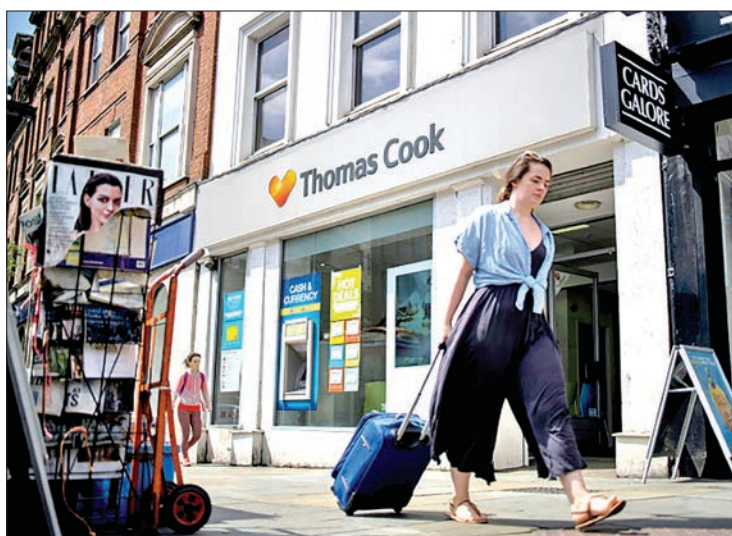
The operator needed £200 million ($250 million) to save it from collapse.

"All customers currently abroad with Thomas Cook who are booked to return to the UK over the next two weeks will be brought home as close as possible to their booked return date," the government said.— AFP ■