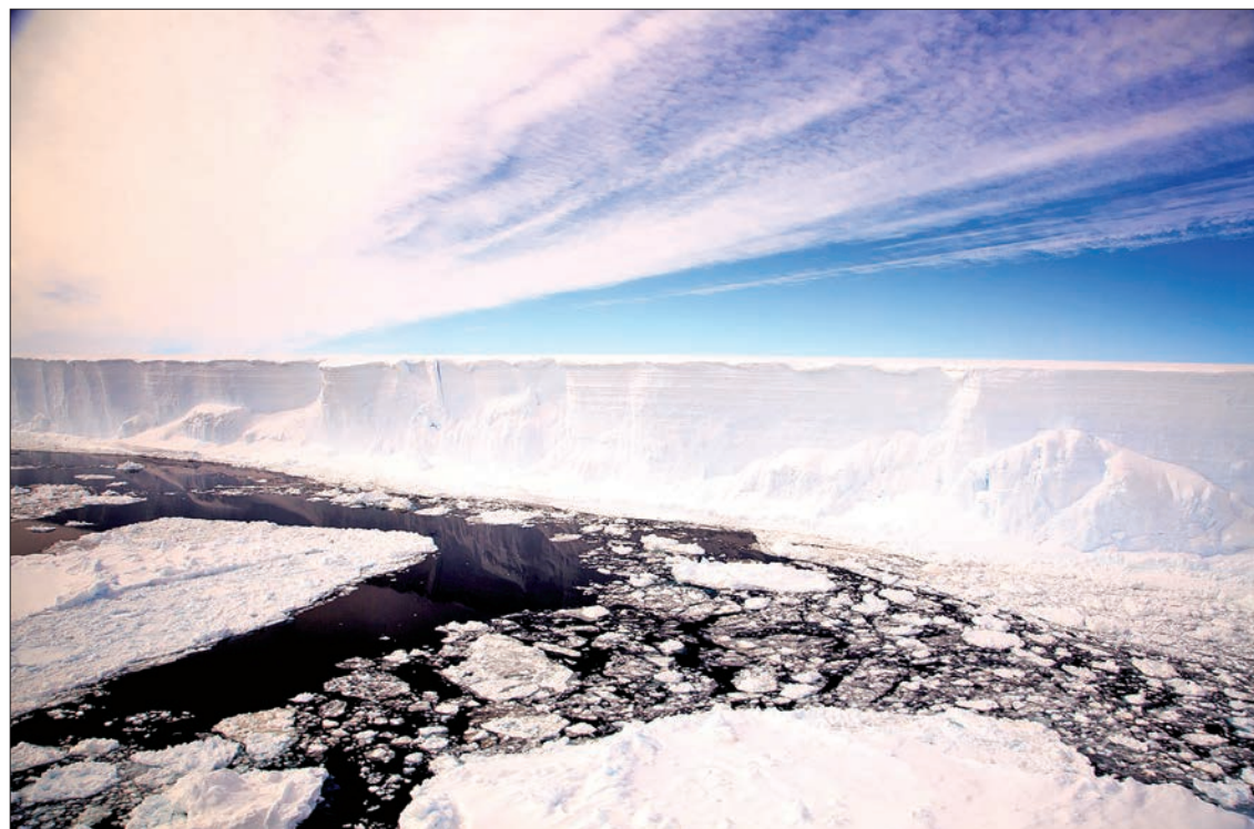
The file photo taken on 22 November 2017 from the British Antarctic Survey Twin Otter aircraft shows the Larsen C iceberg.

biguity. The studies we have in hand tell us that West Antarctica has passed a tipping point. It has become unstable and will discharge all its most vulnerable ice into the ocean. Period.