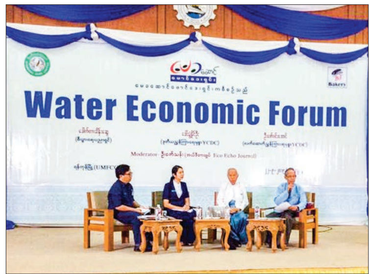
Water Economic Forum held at the UMFCFI in Yangon on 22 September.

The YCDC has also planned to get water from the new projects of Kokkowa and Toe rivers.—Aung Thura (Translated by Aung Khin)