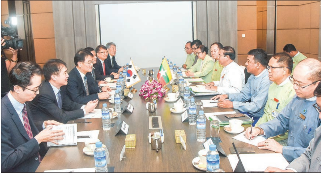
Ministry of Office of the Union Government Deputy Minister U Tin Myint holds talks with a delegation led by the Republic of Korea Vice Minister of the Interior and Safety Mr Yoon Jong-In in Nay Pyi Taw yesterday. PHOTO: