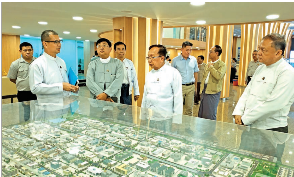
Union Minister for Construction U Han Zaw observes the scale models of real estate projects for urban development at the Yangon City gallery in Yangon yesterday.

UNION MINISTER for Construction U Han Zaw visited the Construction, Housing and Infrastructure Development Bank in Dagon Township, Yangon, yesterday morning.