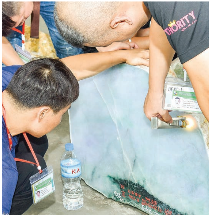
Jade merchants check the quality of a jade stone during the mid-year Myanmar Gem Emporium in Nay Pyi Taw.