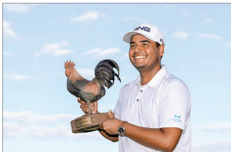
Colombia's Sebastian Munoz poses with the trophy after winning his first US PGA Tour title in a playoff at the Sanderson Farms Championship.

LOS ANGELES (UNITED STATES)—Sebastian Munoz parred the first playoff hole on Sunday at the Sanderson Farms Championship to beat Im Sung-jae and earn his first US PGA Tour victory.