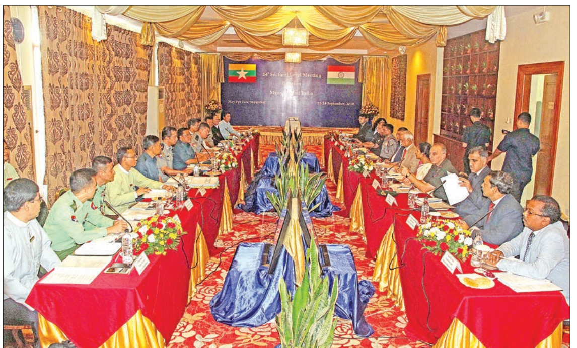
The 24 th Myanmar-India border officials' regional level meeting held in Nay Pyi Taw yesterday.