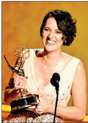
Phoebe Waller-Bridge won Emmys for best actress in a comedy and best comedy writing.

in show business — the dragons who shot for 70 nights straight in freezing