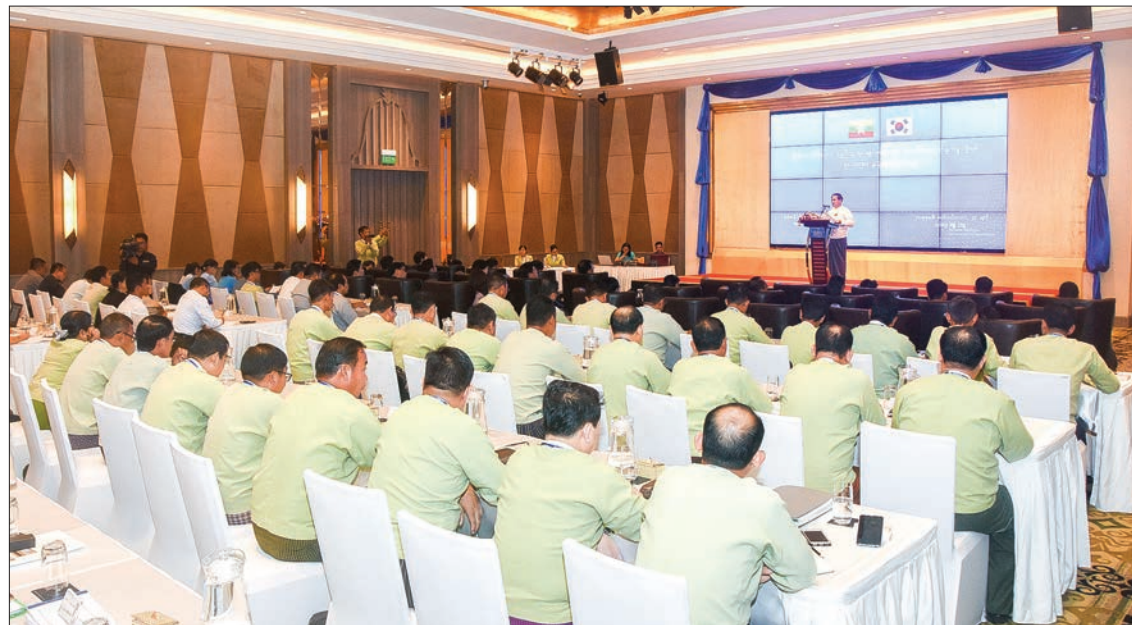
Deputy Minister U Tin Myint delivers the speech at the forum between Ministry of Union Government Office and the Ministry of the Interior and Safety of the Republic of Korea in Nay Pyi Taw yesterday.