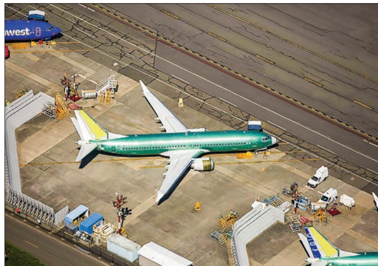
Boeing 737 MAX airplanes were grounded worldwide after the Lion Air and Ethiopian Airlines crashes in 2018.

to comment, referring questions to the Indonesian authorities.