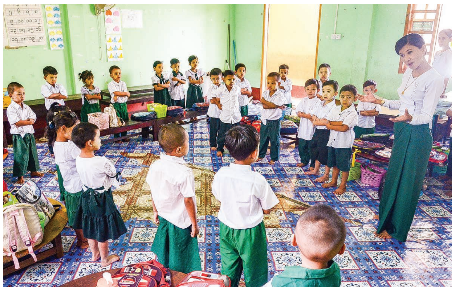
Pre-primary level of learning is of utmost importance for proper development of learning abilities throughout life.

Of the three main levels mentioned above the most important is the “Pre-primary and Primary Level” which relate to the “formative” years of the child and is said to include the most “receptive” learning period of it’s entire life. Hence pre-primary level of learning is of utmost importance for proper development of learning abilities throughout life. The Government is giving much attention to “learning and early development” of the Child. It has also made “primary education” compulsory and delivered free of charge. It is also taking measures to regulate “Child Learning and Development” by the Private sector undertakings to ensure quality of “education” and guard against