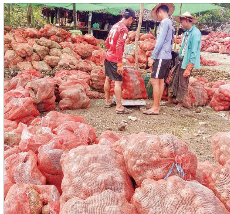
Elephant foot yams flows into market in Hpa-an.