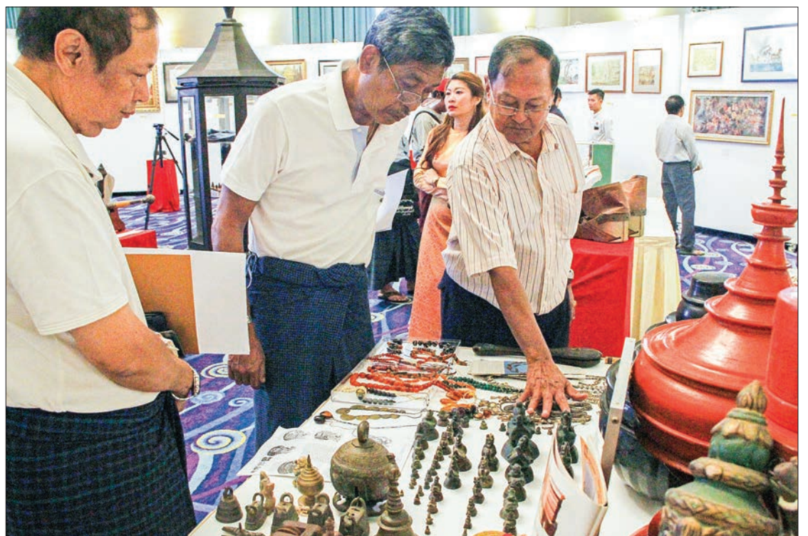
Visitors observe art works displayed by Myanmar artists at the Inya Lake Hotel in Yangon on 21 September.

The prices ranged from 500US$ to 10,000US$. As this is an auction, there is also a hard floor price and items go to the highest bidder. As there are works of famous Myanmar artists, there has been a lot of interest. Officials of embassies