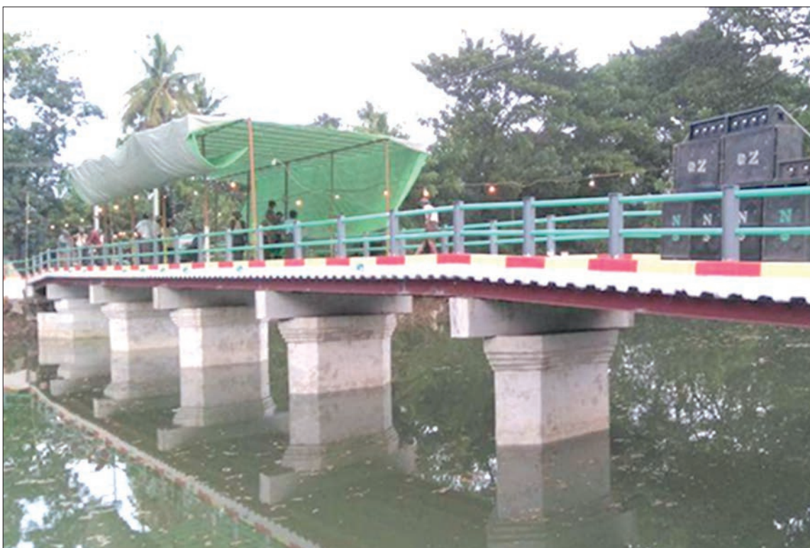
The Walmyolae Bridge is expected to facilitate swift commodity flow in the region.

Construction of the bridge commenced on 28 May 2018 and it is scheduled to be completed by the end of September 2020. Once completed, local people will be able to use it in all season with greater ease, thereby contributing to improving their education,