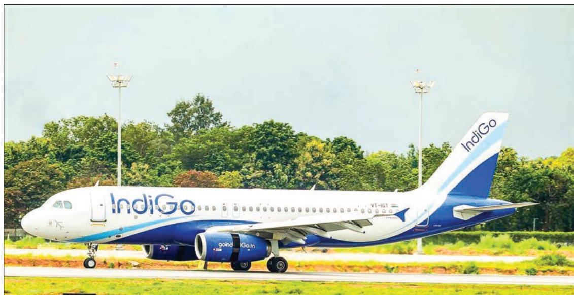
Welcoming IndiGo’s inaugural flight at Yangon International Airport Terminal 1 yesterday.

The celebration event was held at Terminal 1 and graced by U Kyaw Myo, Deputy Minister for the Ministry of Transport and Communications, India’s Ambassador to Myanmar Mr. Saurabh Kumar, and U Khin Aung Tun, Vice Chairman of Myanmar Tourism Federation. Officials from the Department of Civil Aviation, Myanmar Tourism Federation, IndiGo team, YIA officials and airline partners were also present at the event.—GNLM ■