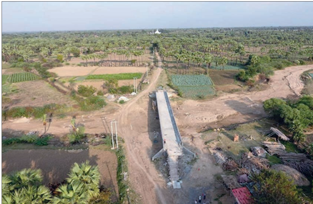
The rural bridge over Thinpon Creek in Wundwin Township, Mandalay Region was built with K220 million.