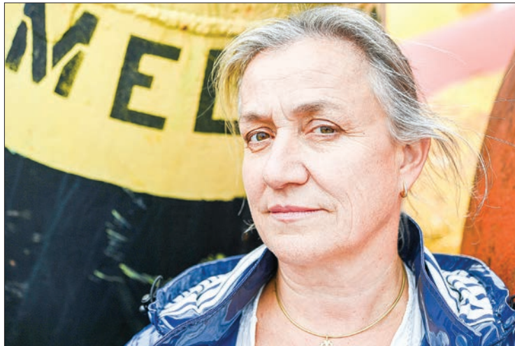
French pulmonologist Irene Frachon poses on 17 September 2019 at the commercial port in Brest, western France.

Drug manufacturer Servier and nine subsidiaries are charged with fraud for allegedly concealing Mediator’s risks, while the ANSM drug watchdog is being pursued for negligence