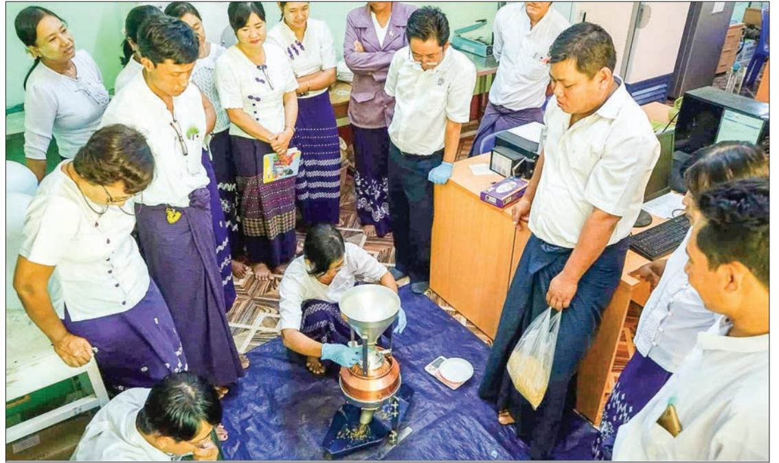
Officials from the Agricultural Department conducts agricultural training courses in cooperation with the Japan International Cooperation Agency.