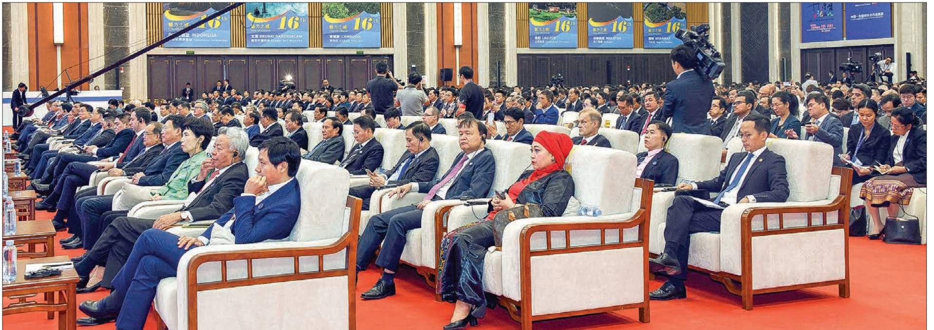
Vice President U Myint Swe addresses the opening ceremony of 16 th China-ASEAN Expo and the 16 th China-ASEAN Business and Investment Summit at Nanning International Convention Centre yesterday.