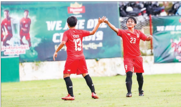
Myanmar’s women footballers celebrate their victory after defeating the Old Star men’s football team in their friendly match at Taunggyi Stadium yesterday.

The friendly match for the national women’s football team was aimed to help the national women’s team to promote themselves among their fans across Myanmar, officials said.—Lynn Thit (Tgi)