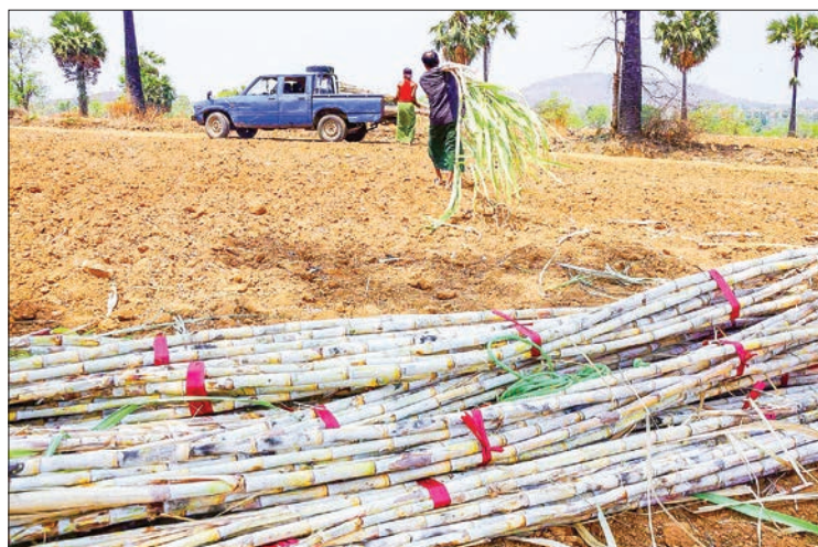
Farmers collect sugar cane in the field of Tela Village in Meikhtila Township.

161,800 hectares (400,000 acres) of sugarcane plantations, and produced more than 470,000 tons of sugar last year, a vol-