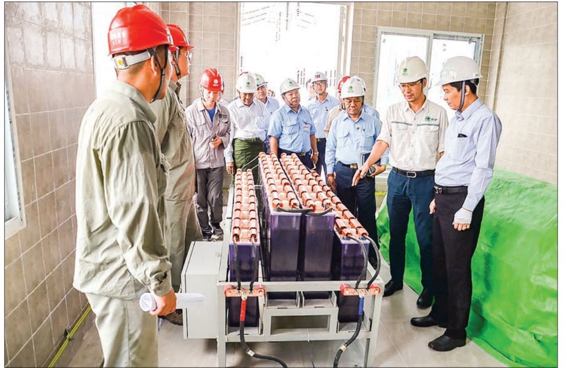
Deputy Minister Dr Tun Naing inspects the 230-KV sub-power station in Shwebo yesterday.

He called upon the employees to carry out maintenance of equipment and cables in attempts to supply electricity to the people with full voltage.—MNA ■ (Translated by Kyaw Zin Lin)