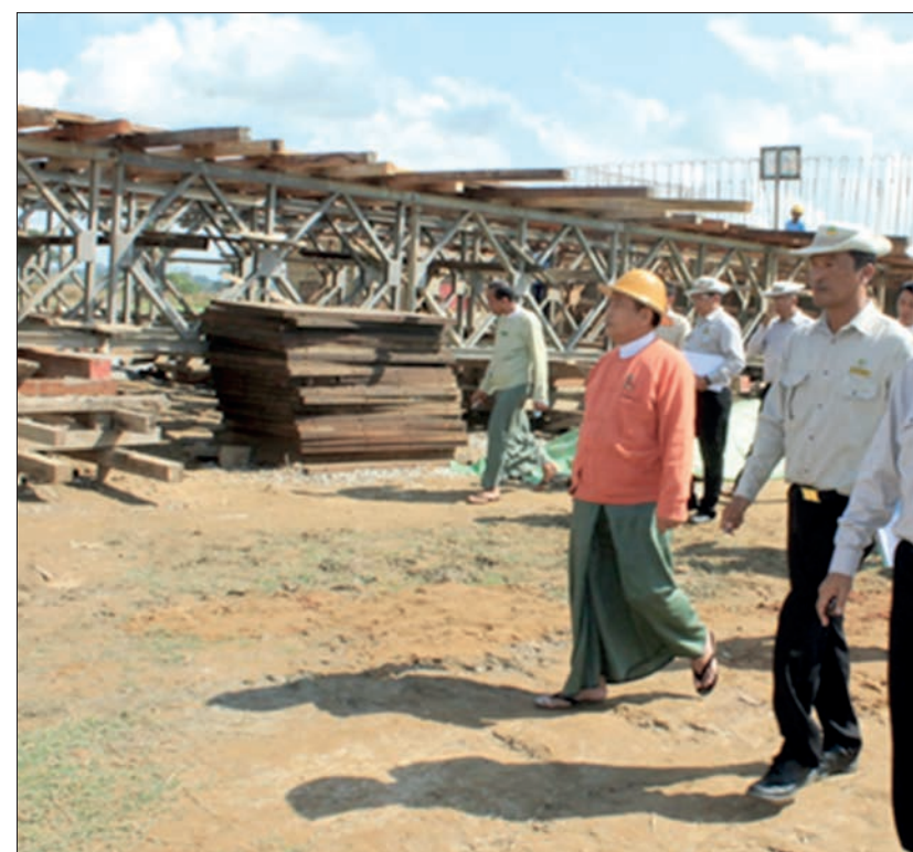
The new inter-village rural bridge was built on a self-reliant basis in Nattalin Township.

According to the chief minister, the facility under construction is located on the road to link the Yangon-Bago-Mawlamyaing