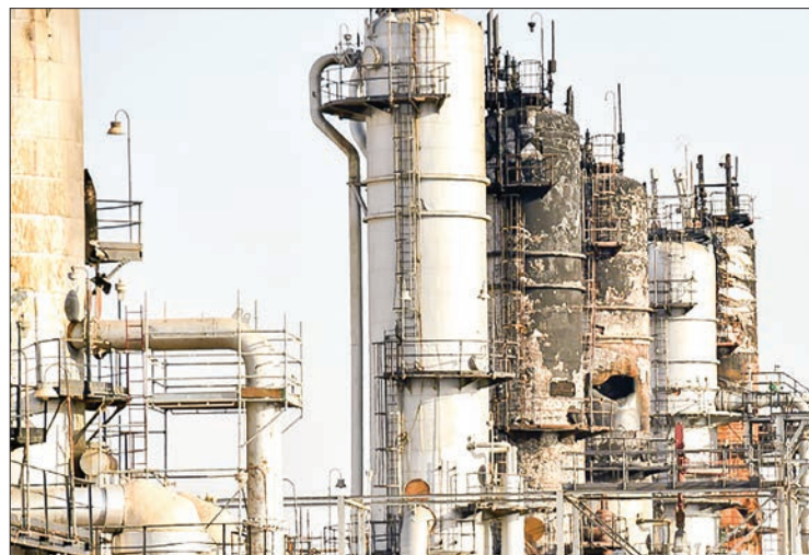
A damaged installation at Saudi Arabia's Abqaiq oil processing plant.

ABQAIQ (Saudi Arabia)—Saudi Arabia on Friday revealed extensive damage to key oil facilities following weekend aerial strikes that were blamed on Iran, but vowed to quickly restore full production even as regional tensions soar.