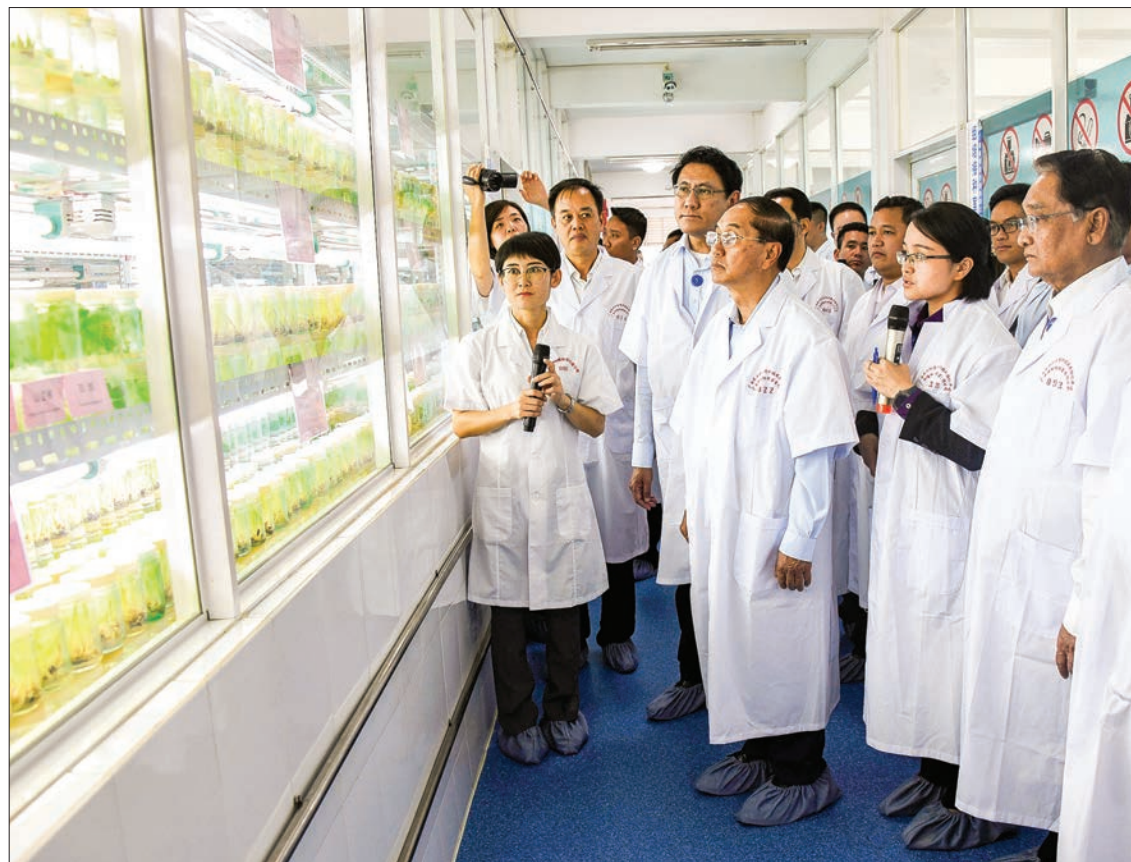
Vice President U Myint Swe visits the Guangxi Academy of Agricultural Sciences in Nanning yesterday.

In this regional development, PRC's rapid economic development, regional integration and China-ASEAN cooperation were playing an important role. Regional development creates a lot of job opportunities and raised the income and social life of the people benefiting millions of people in ASEAN and PRC. ASEAN benefits a lot from PRC's peaceful development and PRC becomes the most important trading partner country