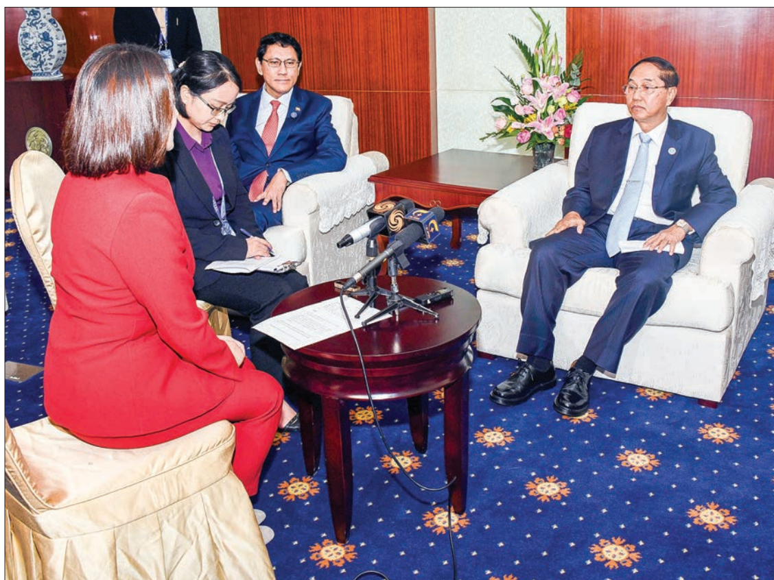
Vice President U Myint Swe receives the journalists from news media at Liyuan State Guest House.

Myanmar has selected Magway Region, Magway town as Myanmar's exhibit in 16 th China-ASEAN Expo. The exhibit displays Myanmar's agriculture, forest, gem and food products and will also include a discussion on Myanmar export product promotion said the Vice President.