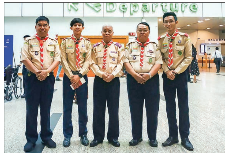
Myanmar Scout delegation pose for documentary photo at Yangon International Airport.