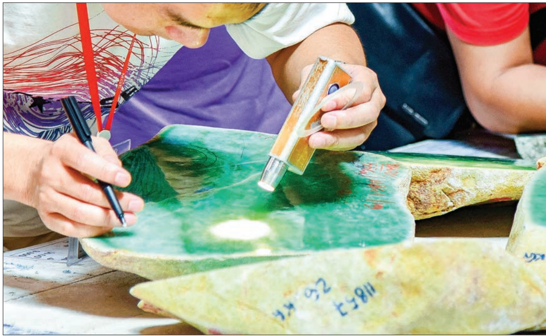
A man evaluates the jade lot on 6 th day of mid-year Myanmar Gem emporium.