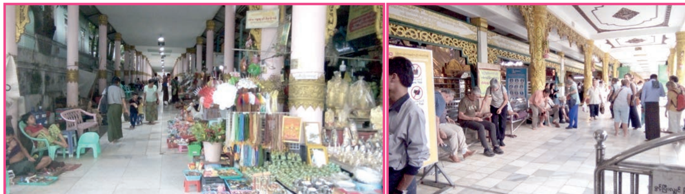
The entrance archway to the Reclining Buddha.

I was amazed with his answer. Actually, I didn't realize how valuable and beneficial a Buddhist religious site for a non-Buddhist. That was my new experience.