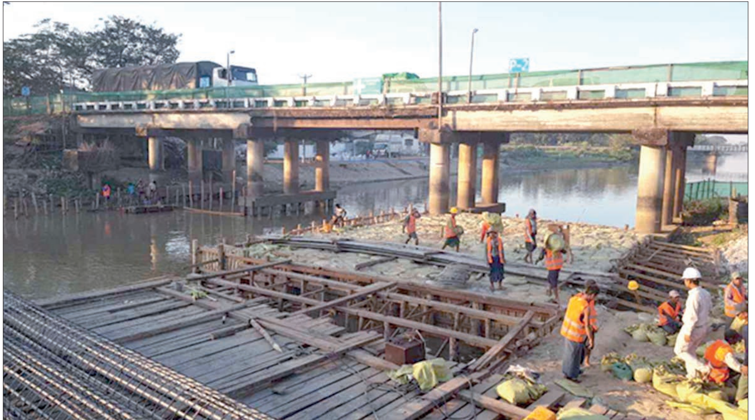
Chief Minister of Bago Region U Win Thein inspects construction of the Bago Bridge (Kawa) in Kawa Township.

The bridge measuring 600 feet long and 30 feet wide is being constructed with an allotted fund of K 270 million of the regional government's funds. The bridge has a 3 ft. long pedestrian walkway on each side and can withstand up to 60 tons of weight.