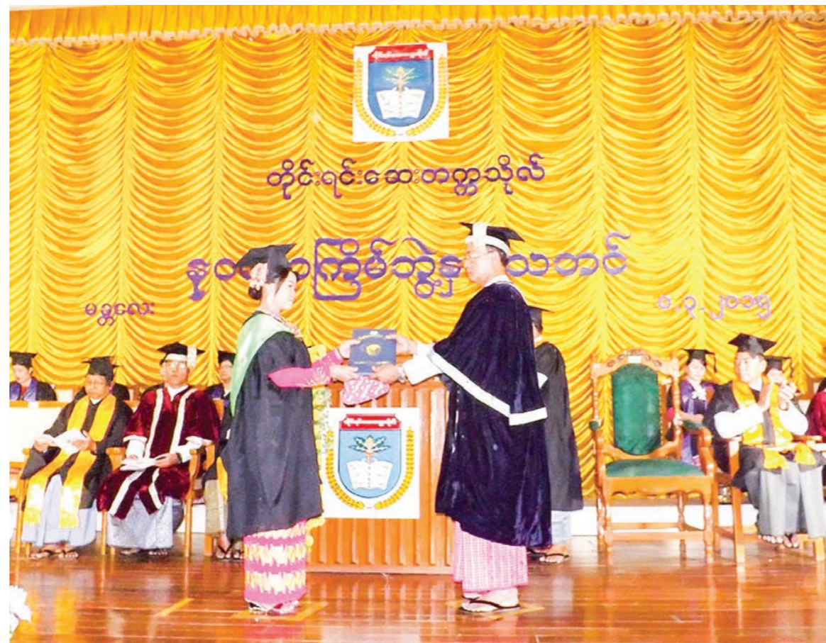
A student receives academic degree from the Mandalay University of Traditional Medicine during convocation.

The new generation is the next level of humanity's development so the future of the country depends on new generation and they play an important role in the development of the country including traditional medicine. According to the book entitled "Milestones of Traditional Medicine