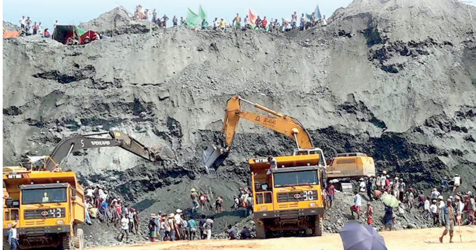
Excavators operate in a jade mine in Hpakant, Kachin State.