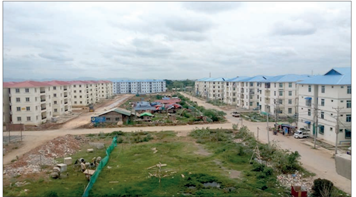
Photo shows "Mya Yi Nandar" Affordable Housing Complex in Chanmyathazi Township, Mandalay Region.

A RURAL bridge over Thinpon Creek in Hsinthae Village, Wundwin Township in Mandalay Region was constructed at a cost of more than Ks. 220 million donated by local people, according to an official who is responsible for construction of the bridge. The facility was built under the supervision of prominent Buddhist monks. The importance of the bridge and difficulties of the locals were presented to the regional government. The Chief Minister of Mandalay Region Dr. Zaw Myint Maung pledged to allocate Ks. 65 million for