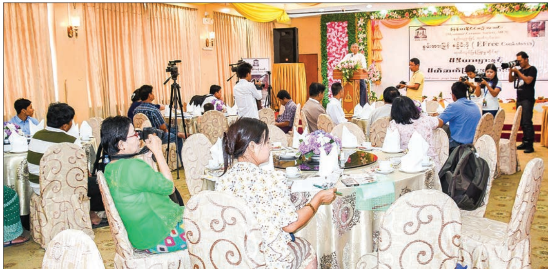
The ceremony to introduce distribution of improved cookstoves to people in six regions and states being held in Yangon yesterday.

OVER 900,000 improved cookstoves would be distributed to the people in Nay Pyi Taw, Mon State, Ayeyawady Region, Bago Region, Yangon Region and Shan State free this year.