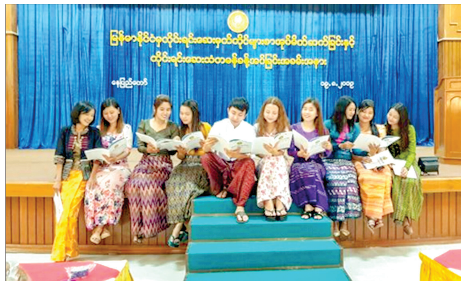
The book, entitled "Milestones of Traditional Medicine in Myanmar", launching event together with appointing ceremony for a goodwill ambassador for traditional medicine held on 19 August 2019.

According to the thematic report on children and youth of the 2014 Myanmar Population and Housing Census, the population of children aged 0-17 and youths aged 15-29 comprised 46.5 percent of the total popu-