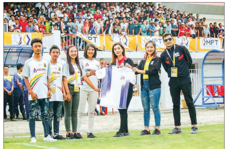
Artistes (black) offer jerseys to Shan United fans last season at the General Aung San Shield Final.

Second-placed City move to within two points of leaders Liverpool, who face Chelsea at Stamford Bridge on Sunday.—AFP ■