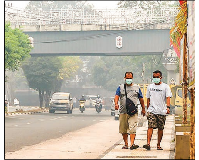
Residents wear mask during thick haze and limited visibility during forest fire in Palangkaraya, Central Kalimantan, Indonesia on 20 September 2019.

“Optimism that we can contain the fires ourselves does not help while children suffer even more from the effect of toxic pollutants compared with adults,” it said. “We need all the help we can get. Now.” — Kyodo News ■