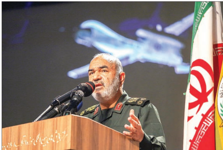
Revolutionary Guards commander Major General Hossein Salami warns Iran is ready for any scenario after Washington ordered reinforcements to the Gulf following attacks on Saudi oil installations it blames on Tehran.

Washington approved the deployment of troops to Saudi Arabia at “the kingdom's request,” Defence Secretary Mark Esper said, noting the forces would be “defensive in nature”