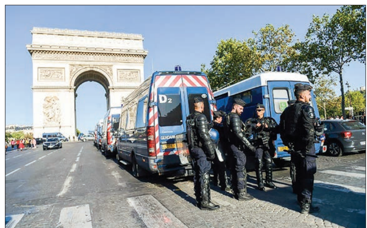
Dozens of demonstrators were arrested at yellow vest protests in Paris on Saturday.

Macron on Friday called for “calm”, saying that while “it's good that people express themselves”, they should not disrupt a climate protest and cultural events also due to go ahead on Saturday.—AFP ■