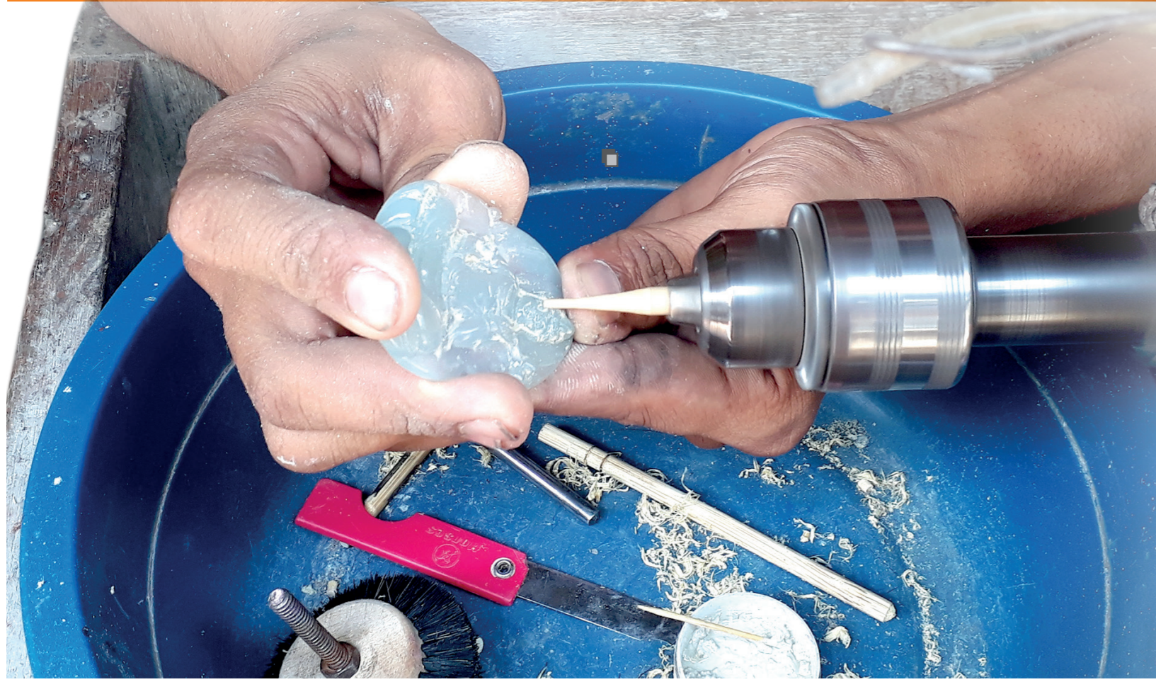
A piece of jade is cut and shaped at a jade factory.