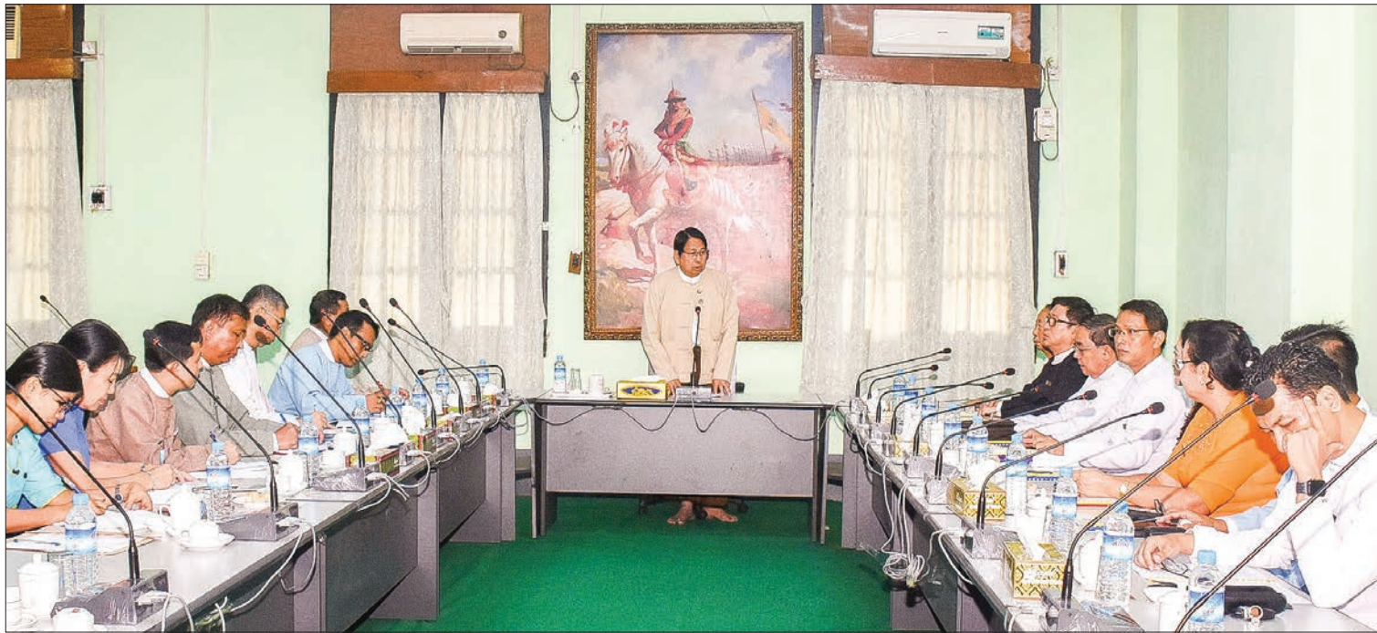
Union Minister Dr Pe Myint delivers the address at the meeting with personnel from Myanmar Newspaper Publishers and Rotary Press Business Owner Association in Yangon yesterday.

OFFICIALS from the Ministry of Information, led by Union Minister for Information Dr Pe Myint and officials from the