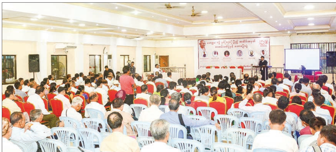
The paper reading session to mark 150 th anniversary of the birth of Mahatma Gandhi at Shree Bhutnath Mahadev Temple in Yangon yesterday.

PAPER reading session that marked 150 th anniversary of the birth of Mahatma Gandhi was held at Shree Bhutnath Mahadev Temple in Yangon yesterday.