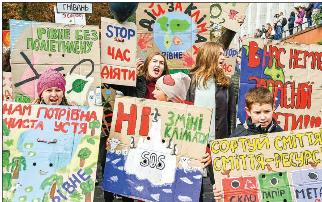
Children hold placards and shout slogans during the “School strike for climate”, as part of a march called “For the climate in Ukraine” in the center of Kiev on 20 September 2019.

From Berlin to Boston, Kampala to Kiribati, Seoul to Sao Paulo, protesters brandished signs with slogans including “There is no planet B” and “Make The Earth Great Again.”