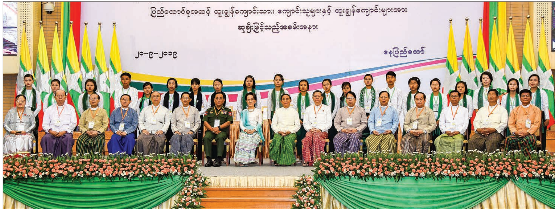
President U Win Myint, State Counsellor Daw Aung San Suu Kyi and Union Ministers pose for photo together with the outstanding students who passed 2019 matriculation exam at the award-giving ceremony in Nay Pyi Taw yesterday.