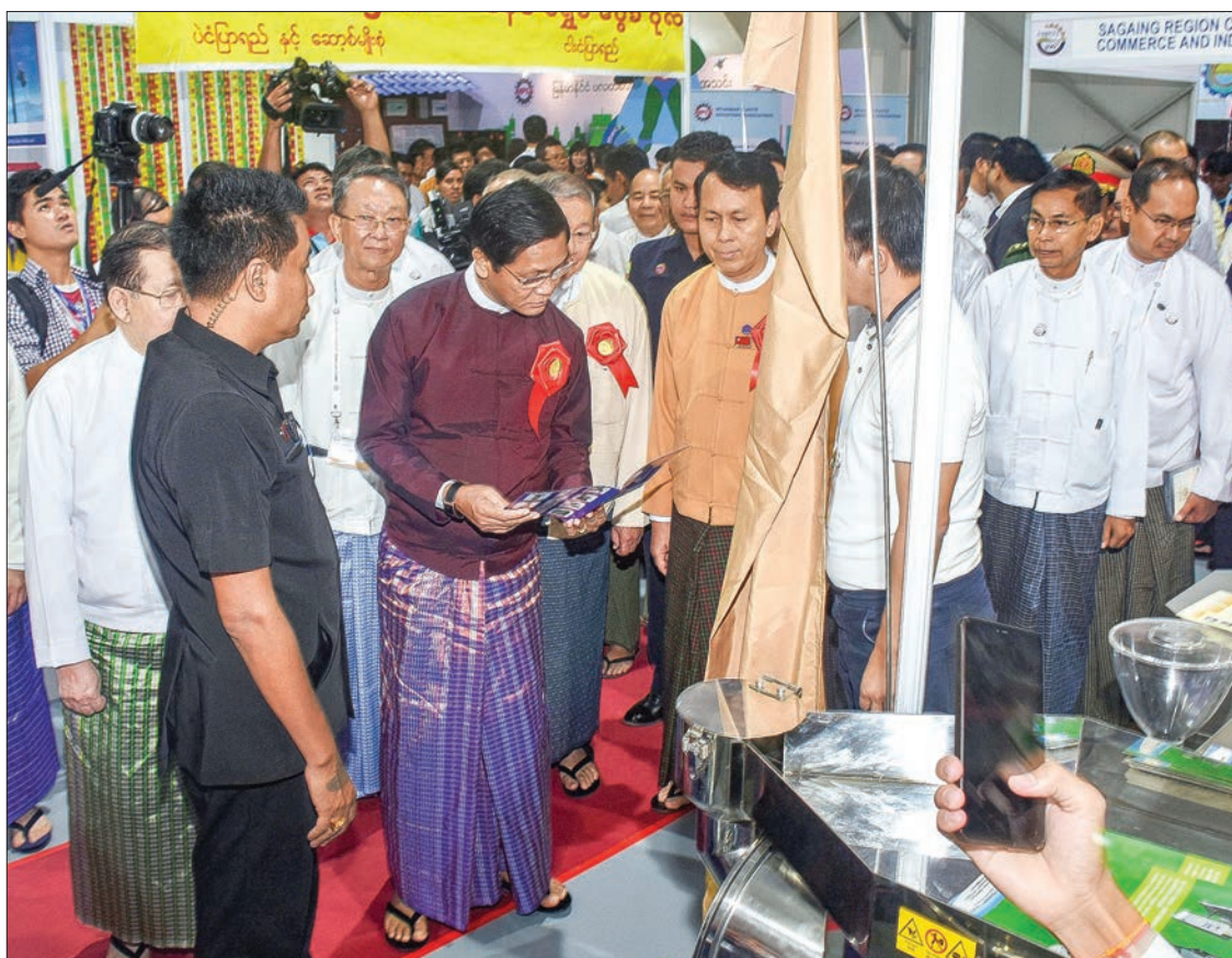
Vice President U Henry Van Thio visits the exhibition showcasing products at the opening ceremony of Union of Myanmar Federation of Chambers of Commerce and Industry Centennial International Expo 2019 in Yangon yesterday.