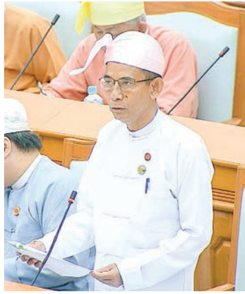
Union Minister for Agriculture, Livestock and Irrigation Dr Aung Thu.

Next, Pyidaungsu Hluttaw Speaker informed the Hluttaw of the receipt of a bill amending the Constitution for the second time signed and submitted by 145 Pyidaungsu Hluttaw representatives including U Sai Than Naing of Kayin State constituency 5 on 18 September 2019. As per Pyidaungsu Hluttaw Rule section 135 a Joint Committee to Study the Bill to amend the Con-