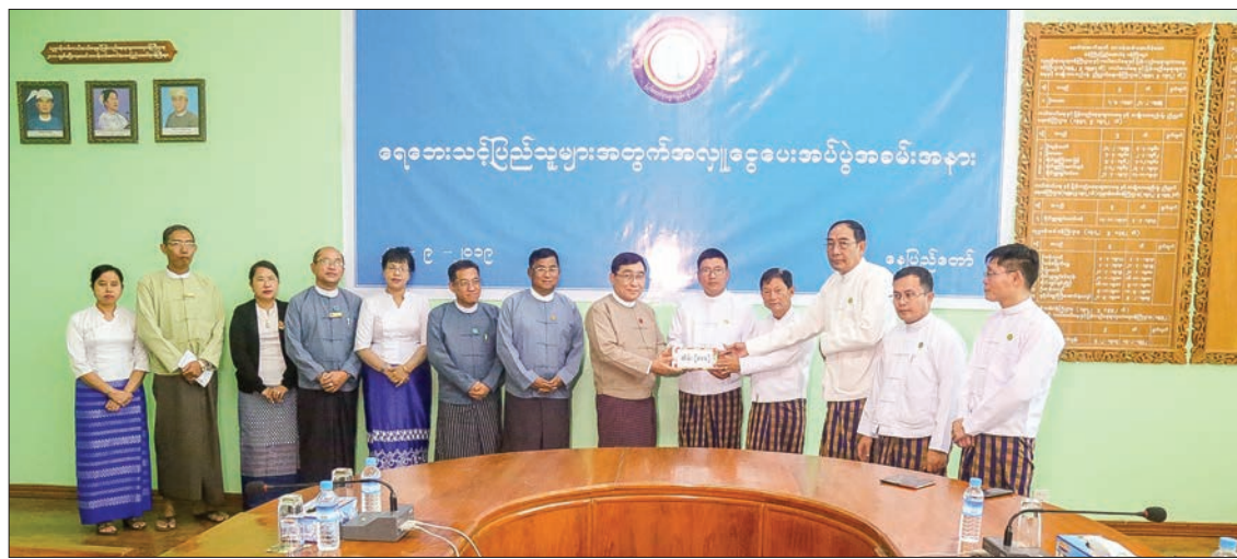
Union Minister Dr Win Myat Aye accepts cash donation for flood victims from officials of Myanmar Edible Oil Dealers Association in Nay Pyi Taw yesterday.