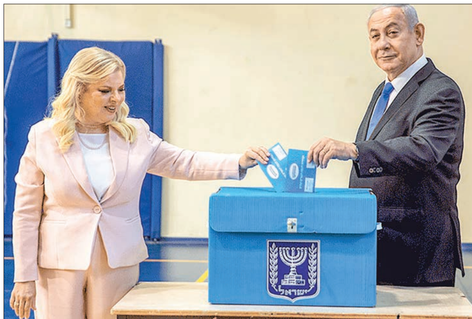
Israeli Prime Minister Benjamin Netanyahu and his wife Sara casts their votes at a voting station in Jerusalem on 17 September, 2019.

Gantz responded by saying he would have to be prime minister in a unity