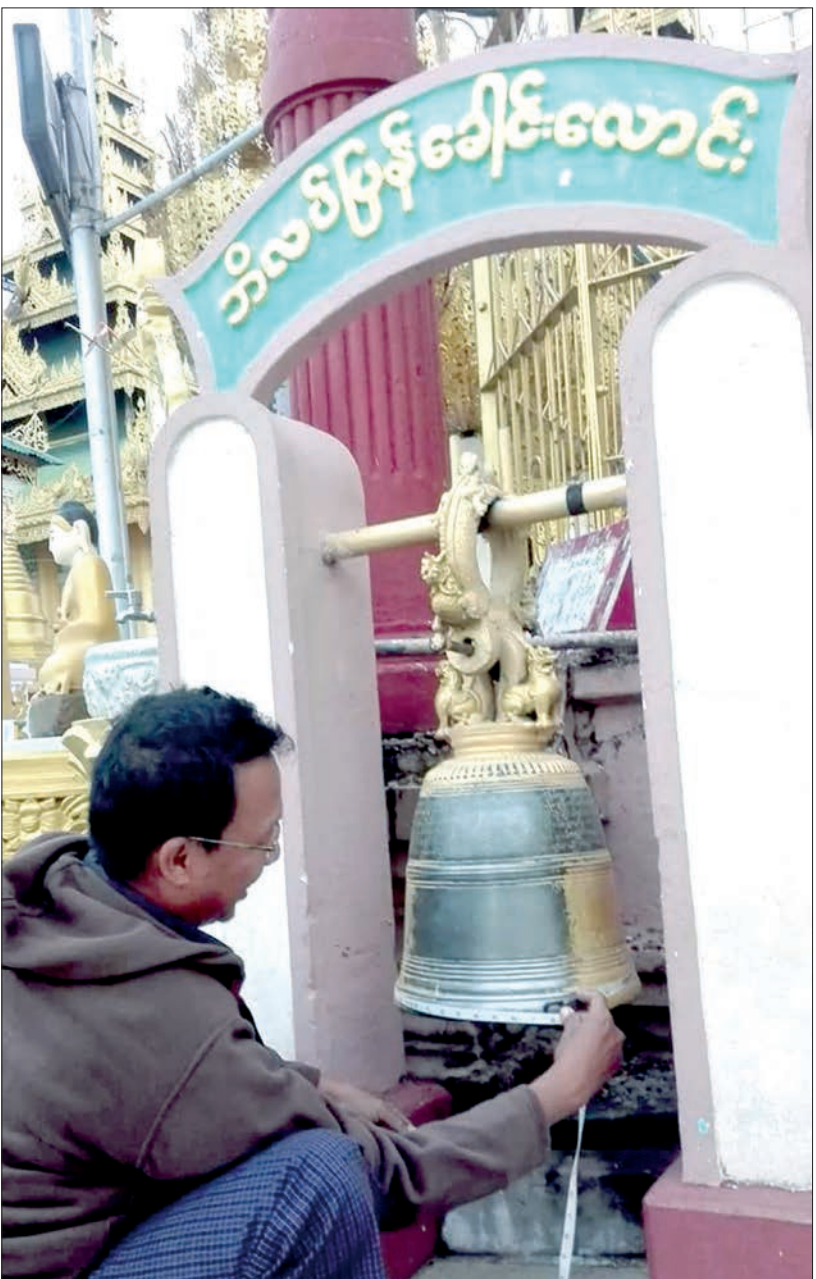
A researcher records the measurements on the bell.

No. 51/ D, Kabar Aye Pagoda Road, 10th Quarter, Mayangone Township, Yangon. Ph: 09-797109000/ 01-658210/ 01-658220.