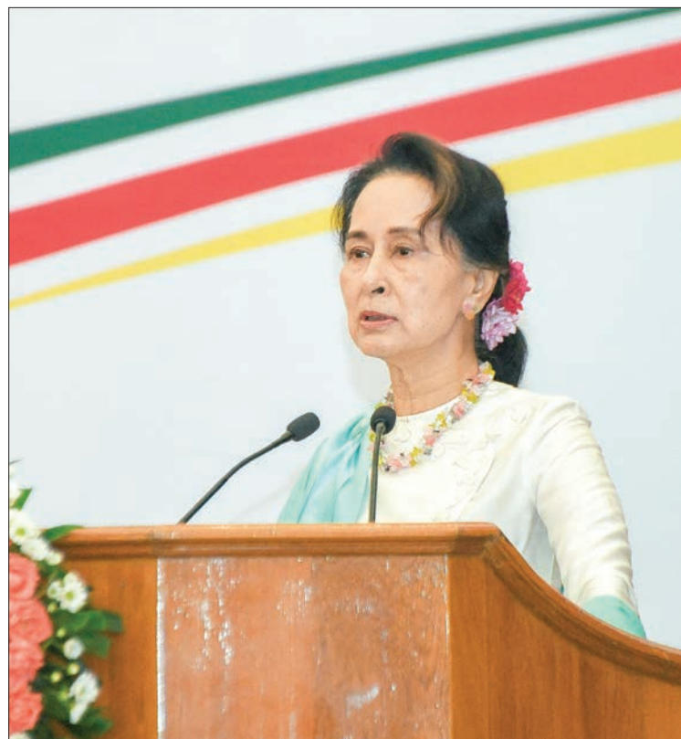
State Counsellor Daw Aung San Suu Kyi delivers the speech at the ceremony to honour most outstanding matriculation students in 2018-2019 Academic Year in Nay Pyi Taw yesterday.