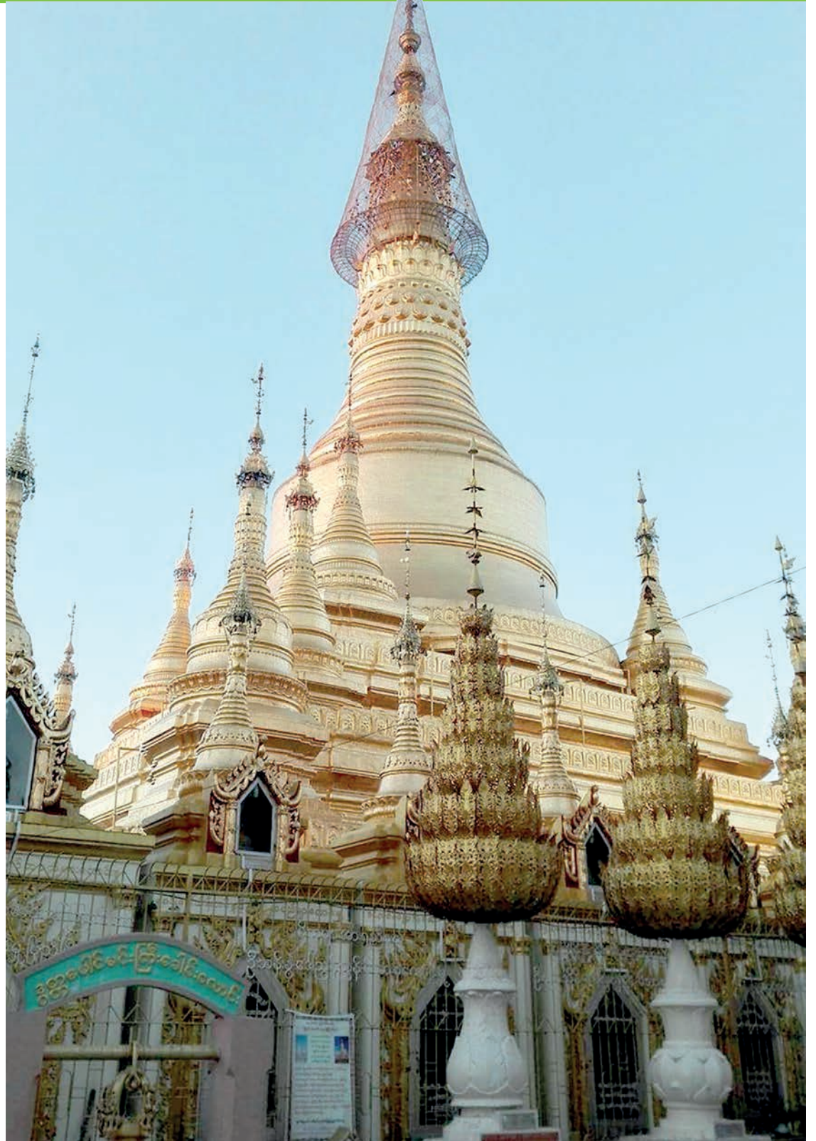
Shwehsandaw Pagoda.

Poet Pyay Nawade composed a Ratu poem dedicating to the Lord Buddha, saying that “Sri Kestra,