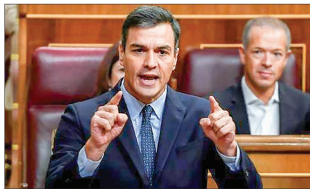
Spain's Socialist premier Pedro Sanchez said it would have been irresponsible to form a coalition with the radical leftwing Podemos. PHOTO: AFP

The committee said the results did not include 14 polling stations where verifications were still ongoing.—AFP ■