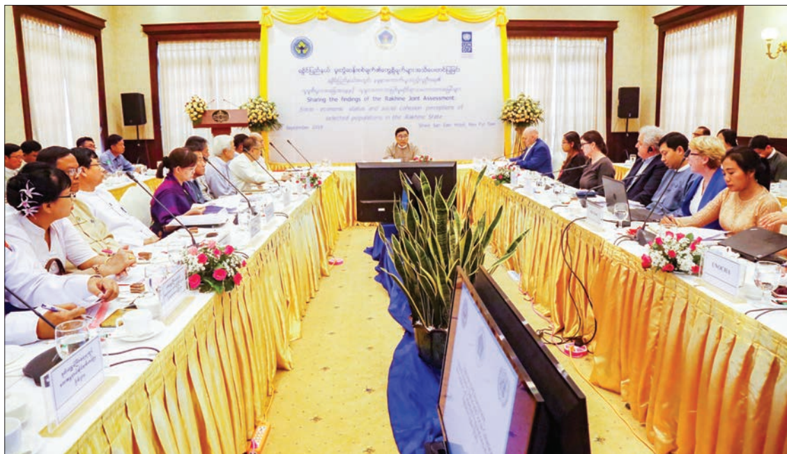
Union Minister Dr Win Myat Aye attends the ceremony of Sharing the findings of the Rakhine Joint Assessment held in Nay Pyi Taw yesterday.

The Union Minister also disclosed the findings have indicated that underdevelopment was the main reason of the problems; access to food, nutrition, education and healthcare services is not too much different among different communities; availability of hygiene water is still a grave problem in most of the villages; lower education level and lesser employment opportunities are the underlying causes for temporary jobs.