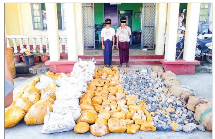
Two suspects arrested with confiscated raw jade stones.