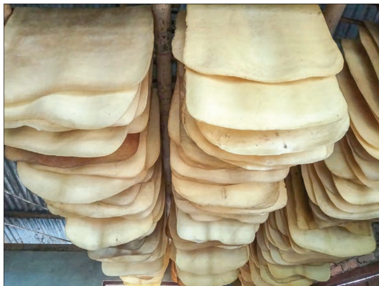
Production of rubber latex sheets goes down as the temperature of the local weather increases.

At present, Myanmar is exporting only rubber sheets owing to lack of machines and technology. Therefore, the MRPPA called for the establishment of special rubber zones in the regions and states to produce value-added rubber and quality