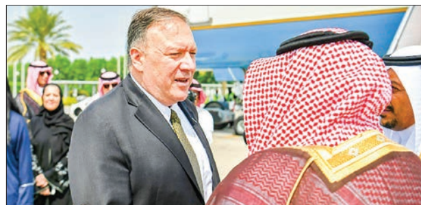
US Secretary of State Mike Pompeo speaks with a Saudi official before boarding his flight from Jeddah, Saudi Arabia to the UAE.

ties in Riyadh and Abu Dhabi, Pompeo said there was an "enormous consensus in the region" that Iran carried out the attacks, despite its denials and Yemeni rebels' claims that they were responsible.