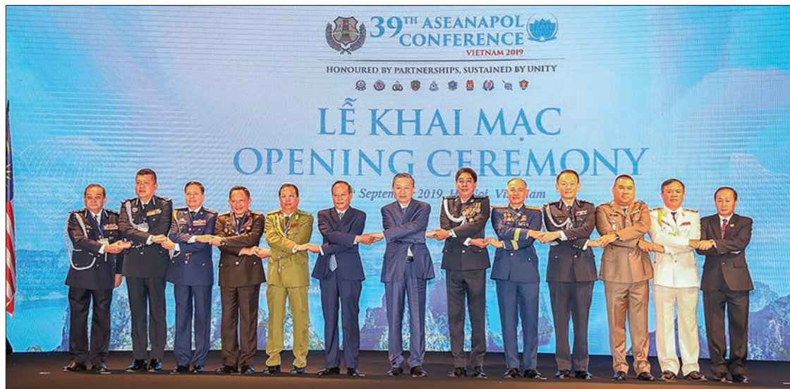
Chief of Myanmar Police Force Lt-Gen Aung Win Oo, Police Chiefs from ASEAN member countries, Minister for Public Security General Tao Lam pose for a documentary photo at the 39 th ASEAN Chiefs of Police Conference in Hanoi, Viet Nam.

During the conference, they discussed cooperation of the international countries in combating transnational crimes, using high technologies and exchange of information.