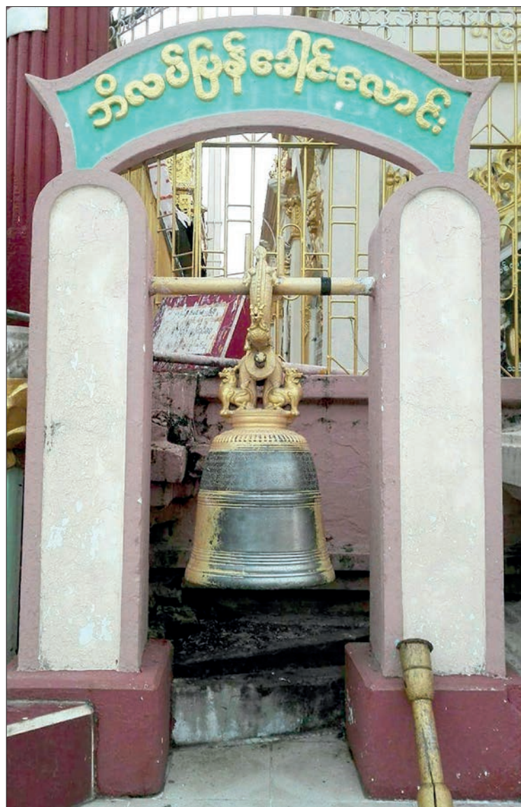
Bell which returned from England.

M YANMAR has been preserving many historic bells similar to the royal bells of kings in Konbaung era. The bell which returned from England hung on the platform of Shwehsandaw Pagoda in Pyay is one of the historic ones. The bell is significant because it reached Britain from Shwehsandaw Pagoda of Pyay and returned to home.