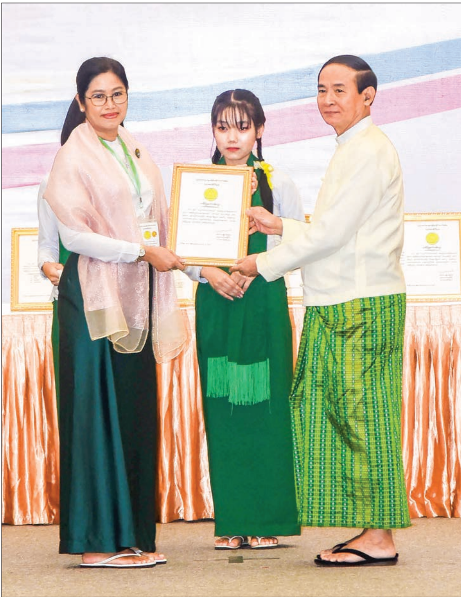
President U Win Myint presents second prize to the No 2 Basic Education High School (Sangyaung) at the award-giving ceremony in Nay Pyi Taw yesterday.