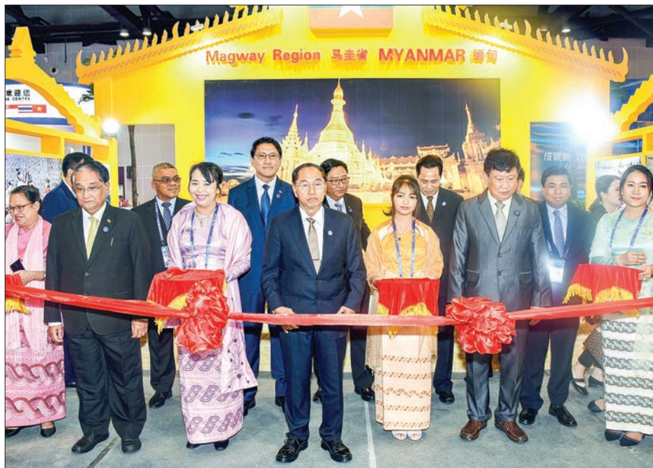
Vice President U Myint Swe cuts ribbon to open the Myanmar exhibition at Nanning International Convention and Exhibition Center in Nanning yesterday.