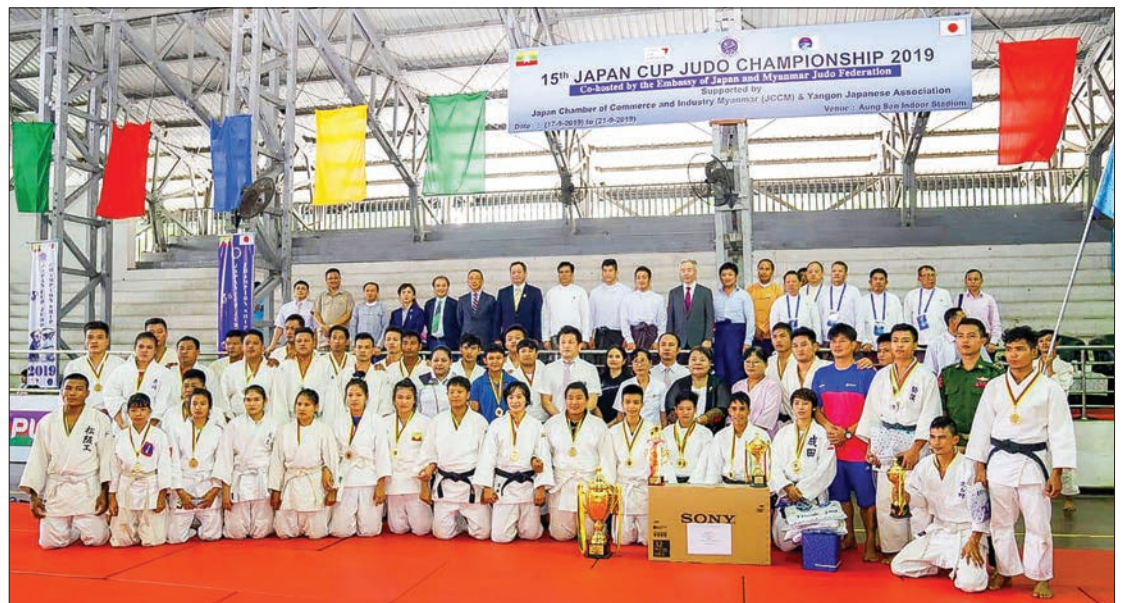
A visiting Judo team from Japan pose for a photo with the winners of the 15 th Japan Cup Judo Championship and Myanmar Judo athletes yesterday at the Aung San Indoor Stadium in Yangon.

A team of Judo athletes from Japan, led by Mr. Kosei Inoue, the director of the youth team of the International Judo Federation of Japan and Sydney Olympics gold medalist (100-kg Judo event), demonstrated their skills and new tactics yesterday at the Aung San Indoor Stadium in Yangon.