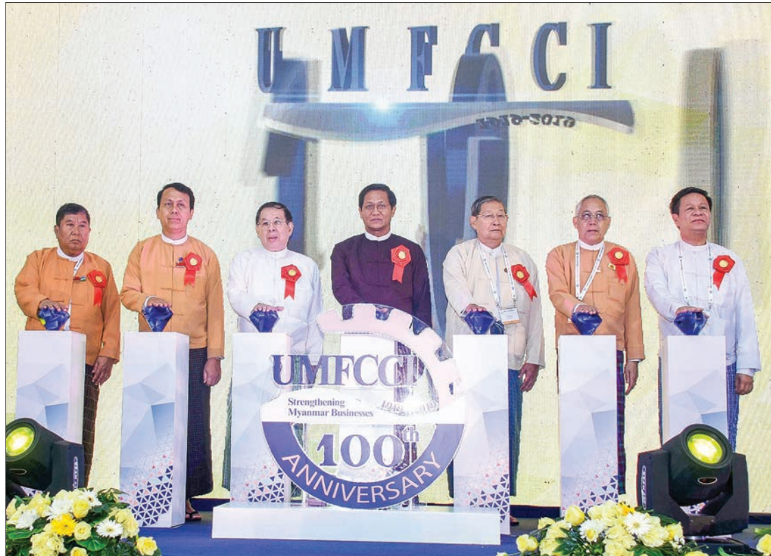
Vice President U Henry Van Thio Union minister, deputy minister and dignitaries open the Union of Myanmar Federation of Chambers of Commerce and Industry (UMFCCI) Centennial International Expo 2019 in Yangon.

In his speech Vice President U Henry Van Thio said UMFCCI was formed in pre-independent period of 1919 as Burmese Chamber of Commerce and as of 2019, it has proudly reached its centennial. With an aim for UMFCCI to support economic development this Centennial Expo was conducted on its centennial. As known to everyone holding an international expo like this brings forth opportunities to exhibit the country's products as well as to introduce international