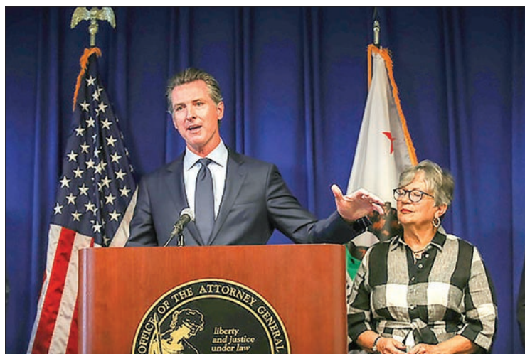
California Gov. Gavin Newsom speaks during a news conference at the California justice department on 18 September, 2019 in Sacramento, California.

But the decision to bar California, a Democratic stronghold, from setting stricter regulations