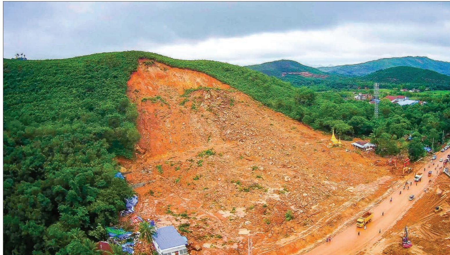
Photo shows an aerial view of the area of deadly landslide that struck a village in Paung Township in August, 2019.

Myanmar's geographic location and incredible physical diversity means climate change takes many forms – in the dry zone, temperatures are increasing and droughts becoming more prevalent, while the coastal zone remains at constant risk from intensifying cyclones. And extreme flooding in the current wet season has already seen over 190,000 people seek emergency shelter, with the damage to homes, schools and farms compounding the impact of last year's floods, and those from the year before.