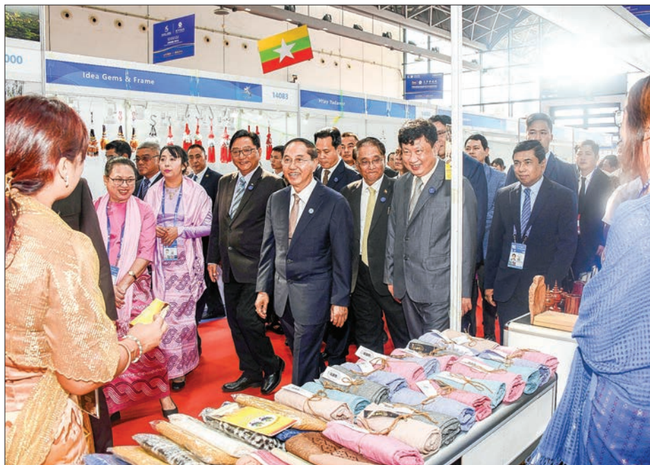
Vice President U Myint Swe observes Myanmar exhibition showcasing traditional costumes at Nanning International Convention and Exhibition Center in Nanning yesterday.