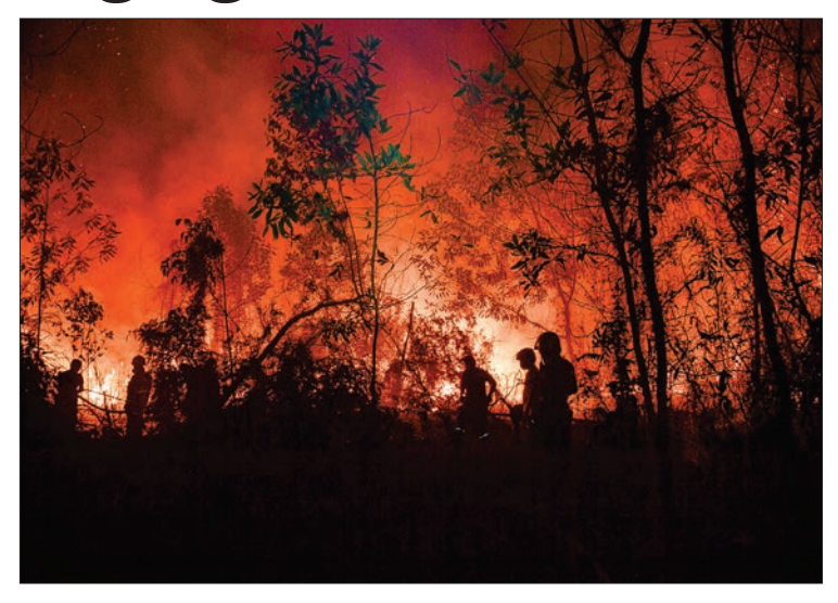
The fires – usually started by illegal burning to clear land for farming – have unleashed choking haze across Southeast Asia.

JAKARTA (Indonesia)—Indonesia has arrested nearly 200 people over vast forest fires ripping across the archipelago, police said Monday, as toxic haze sends air quality levels plummeting and sparks flight cancellations.