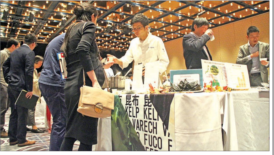
Photo taken on 16 September 2019 shows staff from Maruzen NayaShoten kelp retailer showcasing their products at the JETRO Premium Japan Food Showcase in Sydney.

Cooking workshop coordinator Pamela Woods said that while impressed by the selection of seafood on display, she was also keen to find options for individuals with dietary restrictions.