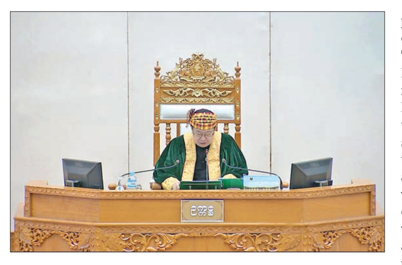
Pyithu Hluttaw Speaker UT Khun Myat.

In Fiscal Year 2019-2020 K 485.814 million from Union capital fund was allocated for upgrading a road 1 mile 3 furlong road