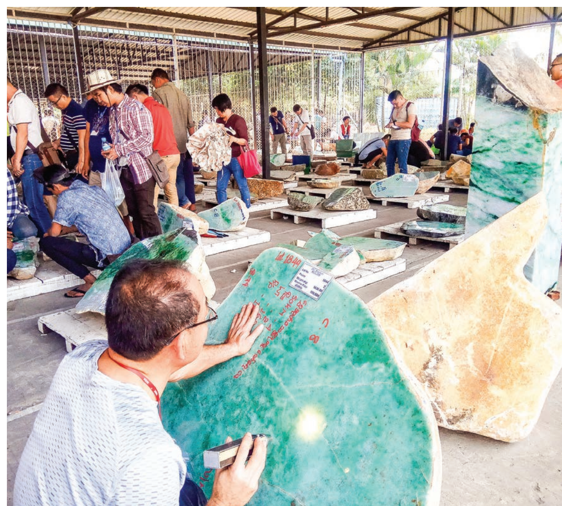
Myanmar has been known throughout for the high quality beautiful and rare rubies in Mogok and best quality ade in Phakant and Khamti.

Second Round Bidding was held in 1996 and six Companies won 9 Blocks (Au, Cu, Pb, Zn, Ag) including notorious Moedi London Stock Exchange (LSE),