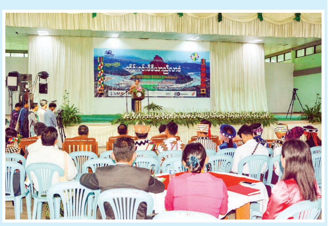
Kachin State Chief Minister Dr Khet Aung addresses the 7<sup>th</sup> Ethnic Media Conference in Myitkyina Township, Kachin State.

The discussions will be made by officials from the Ministry of Information, Myanmar