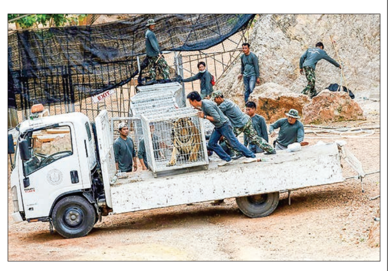
More than half the 147 tigers removed from a Thai temple since 2016

But in 2016 park officials began a lengthy operation to remove the big cats amid allegations of mismanagement, and claims the creatures were being exploited.