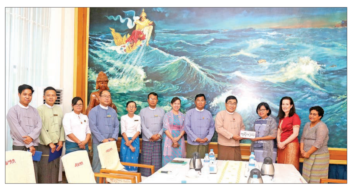
Union Minister Dr Win Myat Aye accepts a donation from the Early Childhood Intervention Team, aimed at repairing a project building in Paung Township.