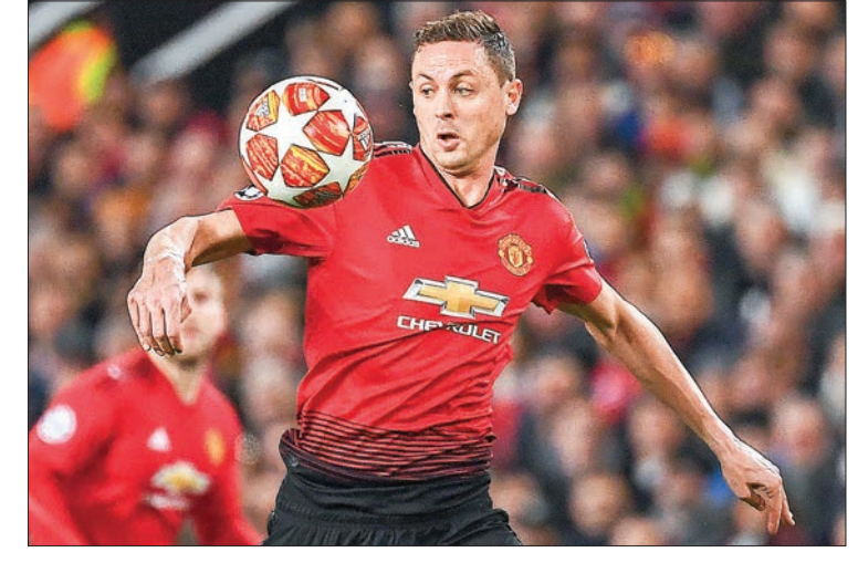
Manchester United midfielder NemanjaMatic.

the opportunity to play. It's not always normal in big clubs that you get that opportunity so young and Manchester United is giving opportunity to the guys who grew up here in the academy and that's good."