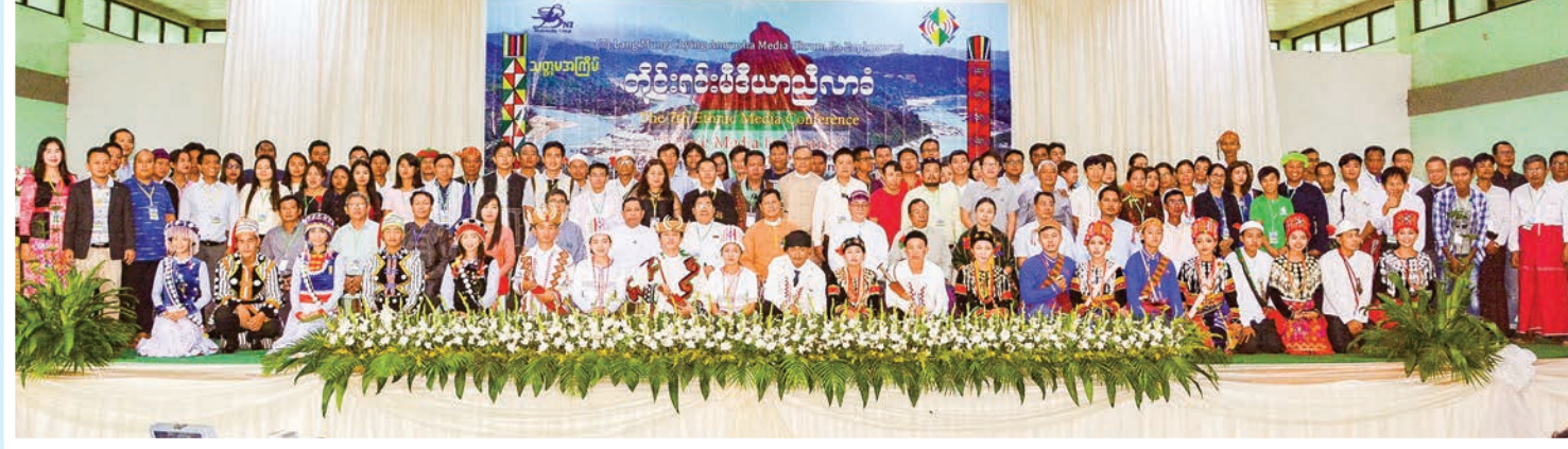
Kachin State Chief Minister Dr Khet Aung poses for a documentary photo with attendees of the 7th Ethnic Media Conference.

Press Council, media experts from local and ethnic media, media network groups, political parties, religious and social communities and officials from the Embassy of the United States in Myanmar.