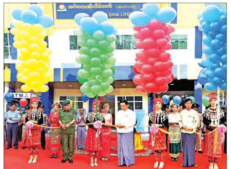
Managing Director and officials of Innwa Bank cut ceremonial ribbons to open Innwa Bank Ltd's new branch in Bhamo Township, Kachin State yesterday.