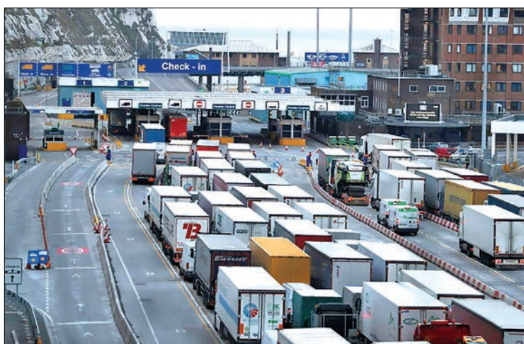
A government study warned of queues at British ports in the event of a no-deal Brexit.

“All the industries that matter will be ready for a no-deal Brexit,” Johnson told reporters.