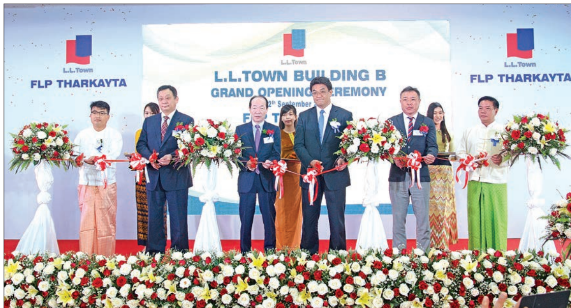
Officials cut ribbons at the opening ceremony.