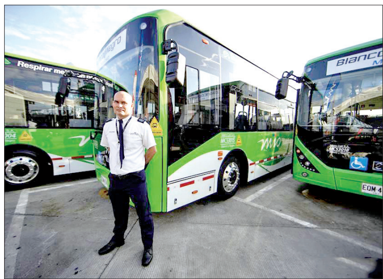
A driver stands in front of a Chinese-made electric bus ready to leave for Cali at a bus station in Yumbo, Colombia, Sept. 10, 2019.