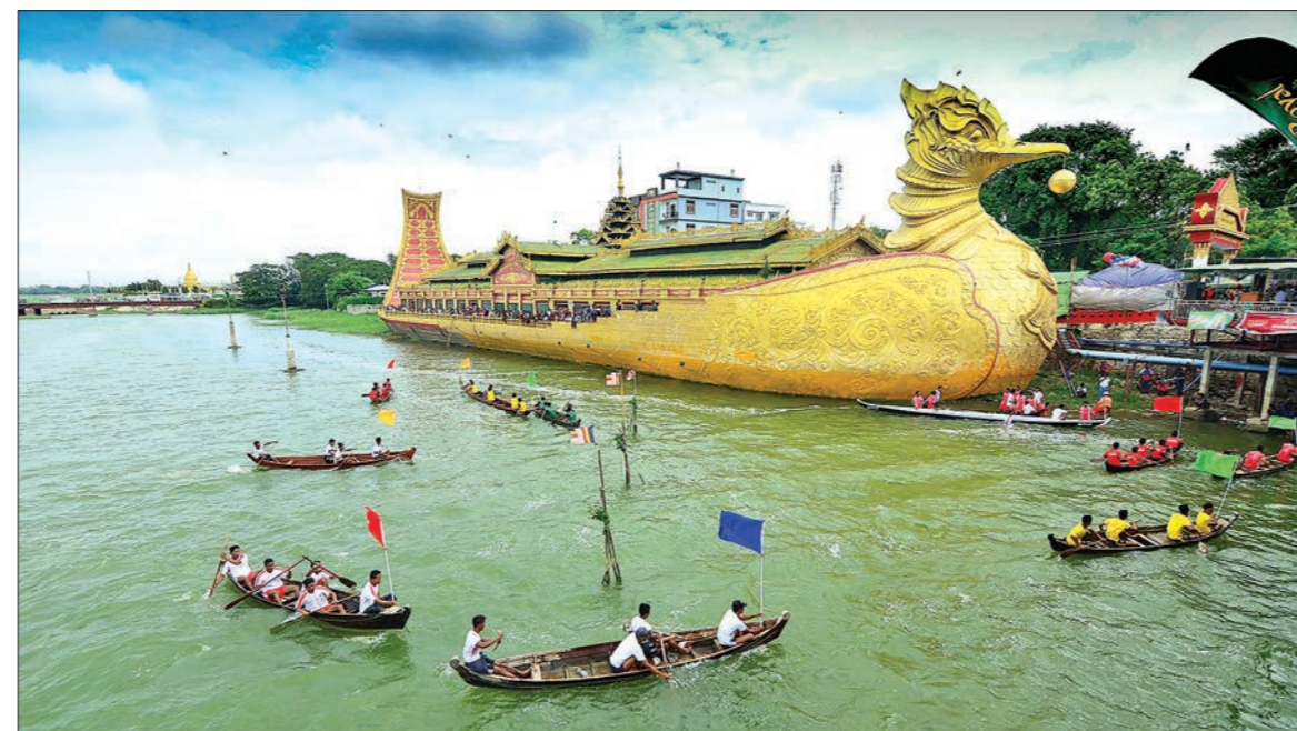
Traditional boat race is a symbol of patriotism.

trol boats have their own musical band with Yey Kin songs to escape the monotony and to keep them always alert. Today Yey Khin and Yey Kin are mixed up, especially