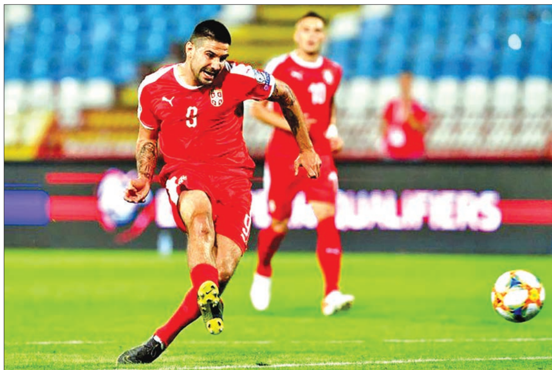
Police conduct raids in London, Monaco and Belgium linked to Serbia's striker Aleksandar Mitrovic's transfer to Newcastle United.

BRUSSELS — Police investigating suspected fraud linked to the transfer of Serbia striker Aleksandar Mitrovic to Newcastle United have made seven raids in Belgium, Monaco and London,