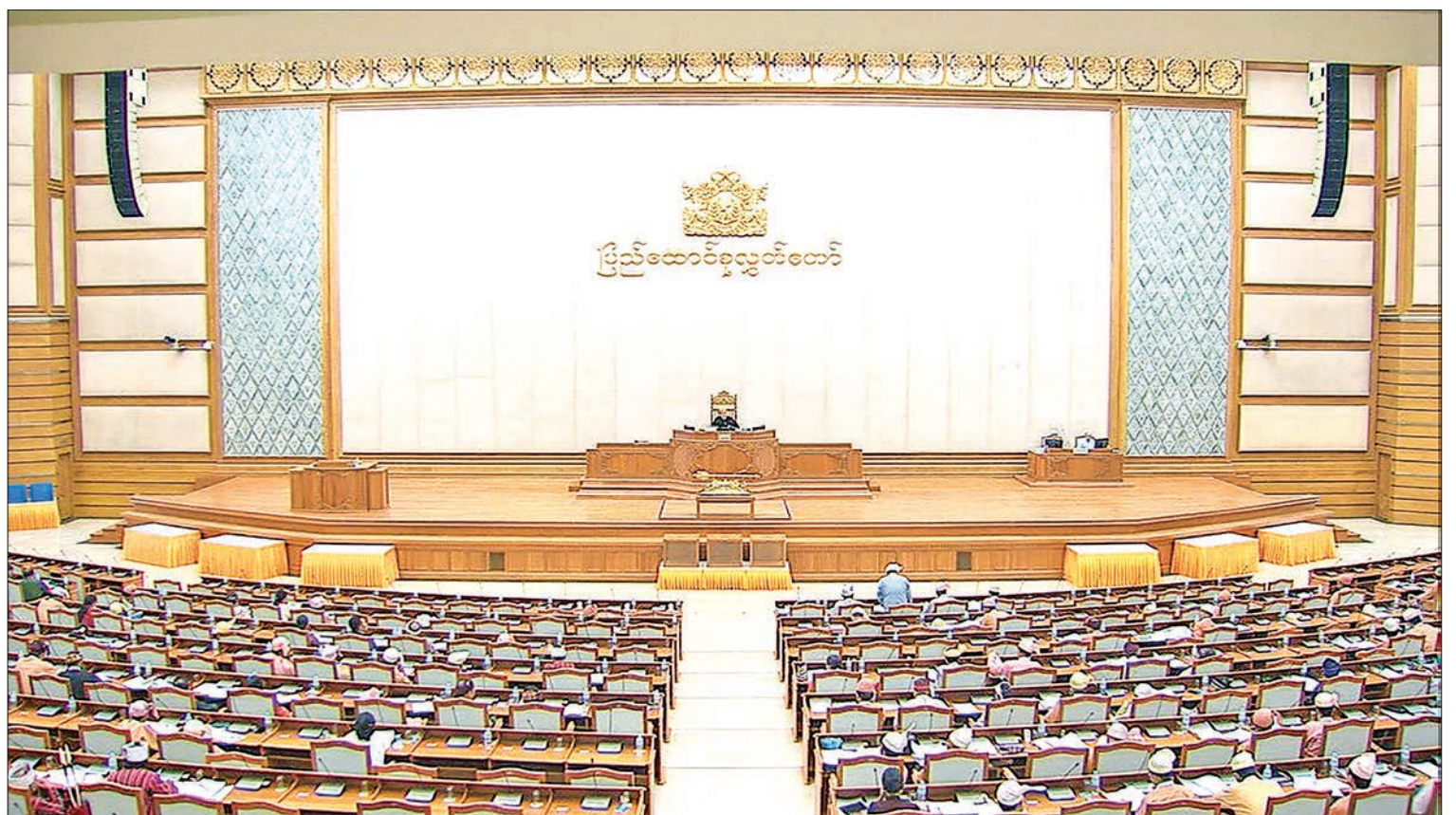
The Second Pyidaungsu Hluttaw convenes its 23rd-day meeting, 13th Regular Session, in Nay Pyi Taw.