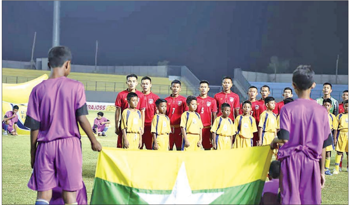
The Myanmar U-16 boys football team sing the national anthem during an international match against Timor Leste on 29 July, 2018.