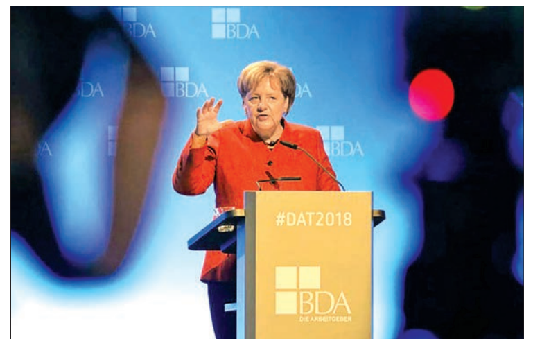
(FILE) German Chancellor Angela Merkel speaks during the Deutscher Arbeitgebertag congress, organised by the Confederation of German Employers' Associations (BDA) and gathering German employers in Berlin on November 22, 2018.

The new basic pension, which German Federal Labor Minister Hubertus Heil (SPD) plans to introduce in 2019, would not be “sufficiently on target,” Bertelsmann noted.—Xinhua ■