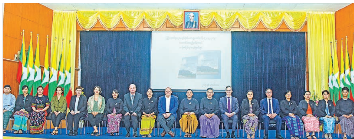
Union Attorney-General U Tun Tun Oo poses for a documentary photo at the meeting to explain the assessment report on Moving Forward the Rule of Law: Strategic Plan 2015-2019 yesterday.

THE Union Attorney-General Office held a meeting yesterday to explain the assessment report