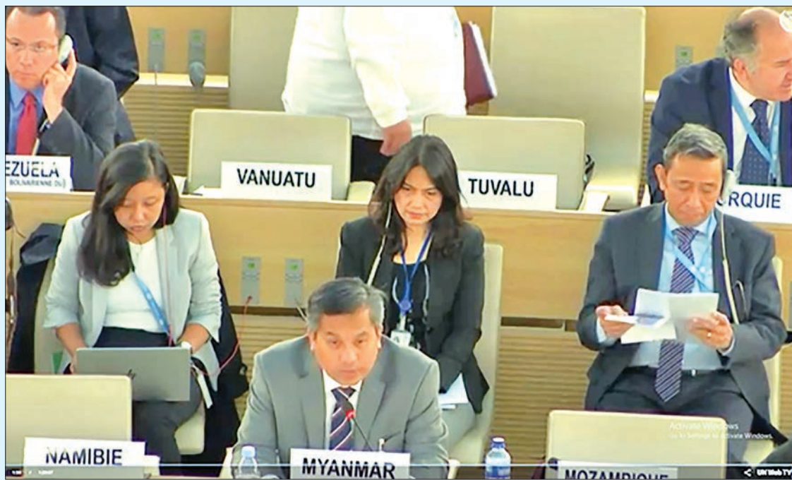
Myanmar Permanent Representative to UN U Kyaw Moe Tun.

At the Interactive dialogue with IIM, Permanent Repre-