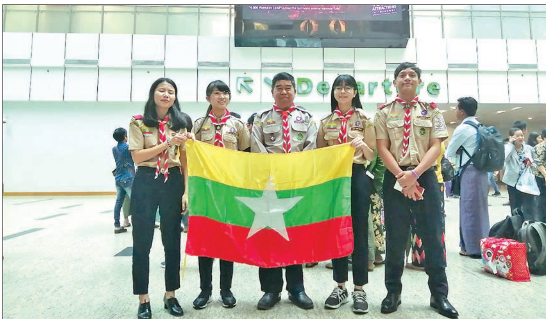
The Myanmar Scout delegation poses with the National Flag at Yangon International Airport before departing for ASEAN Scout Youth Forum 2019 to be held in Singapore.

MYANMAR Scout delegation left for the ASEAN Scout Youth Forum 2019 which Singapore will host for the first time.