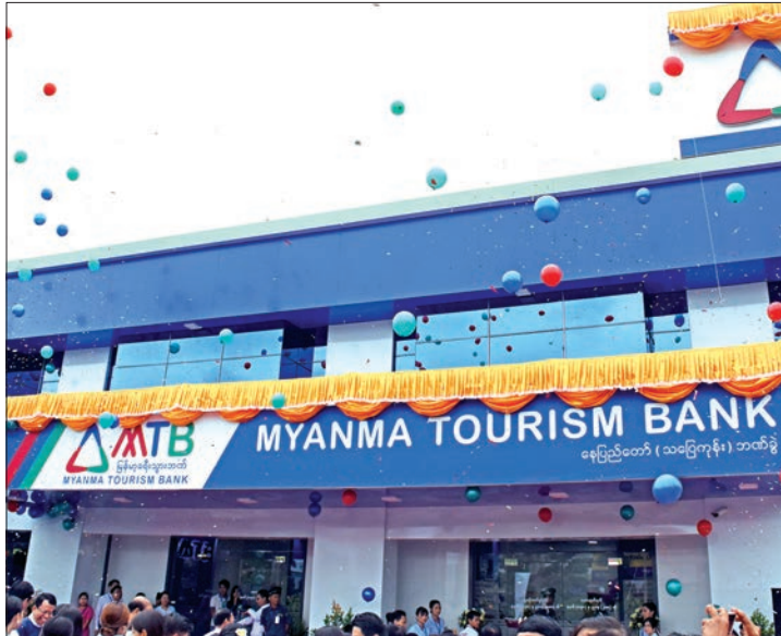
Union Minister Thura U Aung Ko, MTB Chairman U Yan Win and officials unveil signboard of Myanmar Tourism Bank branch in Thabyaygon depot, Nay Pyi Taw.

THE Myanmar Tourism Bank inaugurated their third branch bank with a ceremony in front of the branch in Thabyaygon depot, Nay Pyi Taw yesterday.