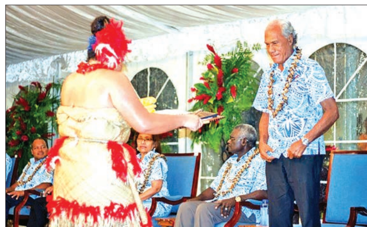
Tonga’s Prime Minister Akilisi Pohiva had suffered from ill health for several years.

WELLINGTON — Tonga’s prime minister Akilisi Pohiva died in an Auckland hospital after years of ill health, New Zealand officials said Thursday, hailing the 78-year-old as a democratic