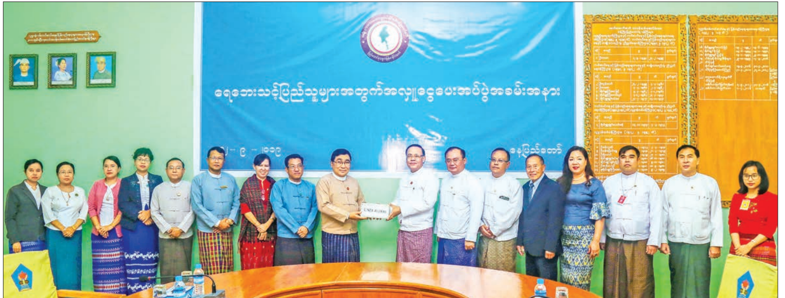
Union Minister U Kyaw Tin hands over cash donated by Myanmar families in California to Union Minister Dr Win Myat Aye yesterday.

Union Minister Dr Win Myat Aye received the donations and gave certificates of honour in return. He spoke at the donation ceremony and