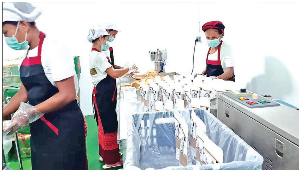
Labours work at jaggery powder factory in Yesagyo Township, Magway Region

“To extend the business, we plan to purchase jaggery from local farmers and produce its powder in the factory. So, local farmers will be able to save 50 per cent of the expenditure on fire wood. We also plan to produce high-quality toddy juice