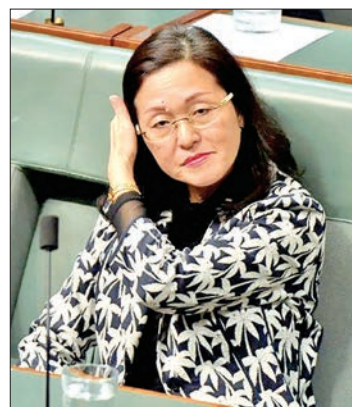
Gladys Liu, the first Chinese-Australian woman elected to the country’s parliament, has been accused of being a member of organisations linked to China’s ruling party.

Morrison on Wednesday said Liu’s initial denial came in