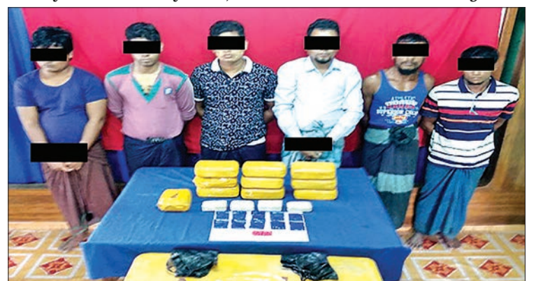
Six suspects from Myoma Kahnyintan Village, Maungtaw, seen with stimulant tablets seized from their home.