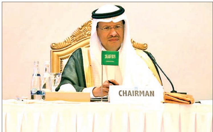
Saudi Arabia has been shouldering the burden of oil output cuts that came into effect in January, but other producers – notably Nigeria and Iraq – stand accused of exceeding their quotas.