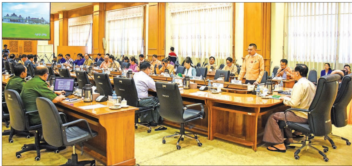
The Joint Committee on Amending the 2008 Constitution holds Meeting No. 35/2019 yesterday.