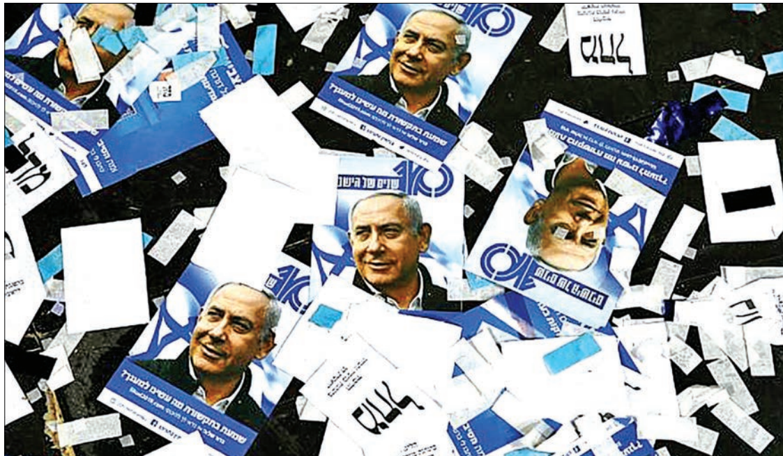
FILE PHOTO: Likud party campaign material and posters of Prime Minister Benjamin Netanyahu strewn on the floor following election night at the party’s Tel Aviv headquarters, 10 April, 2017.

However, Netanyahu said he holds Hamas accountable for