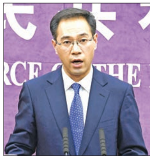
Chinese Commerce Ministry spokesman Gao Feng.