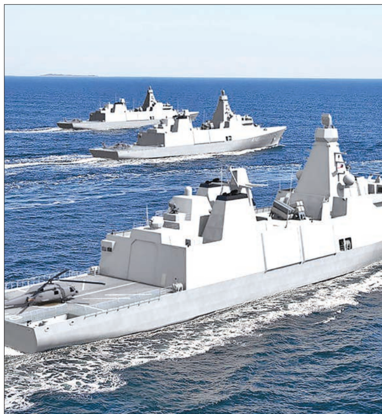
FILE PHOTO: The Babcock International consortium said it will begin manufacturing the five Type 31 general-purpose frigates in 2021 and deliver them in 2027.