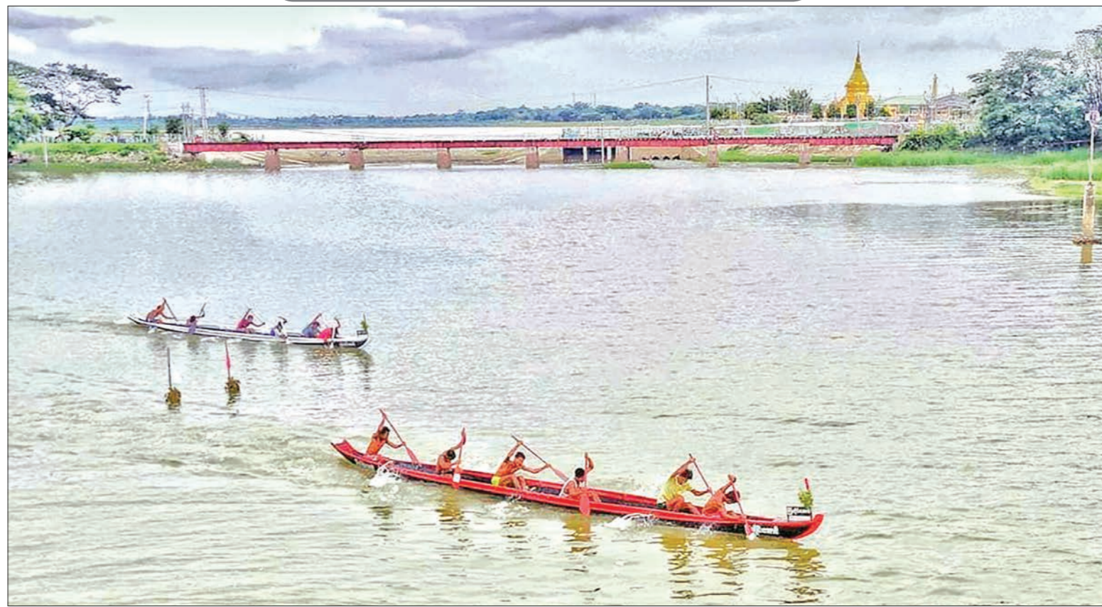
Traditional boat race held at Meiktila's Phaung Daw Oo Pagoda Festival.

Throughout her history Land and Water Forces, constantly reinforced by her rulers of the past and present. In the past, Myanmar kings always marched whether to battles or royal ceremonial progress or inspection of their kingdom with yey-arr [ရေအား] and kyi-arr [ကြည့်အား]. Therefore these two forces must be always strong fresh and well trained. The month Tawthalin [September] the 6 th month of Myanmar Lunar Calendar is the most appropriate month for the exercise of Myanmar water forces and recruiting new blood into it. Because the monsoon has receded, element wealth permitting, fine and calm become all aquatic bodies in land and outside. Myanmar kings held without fail their Regatta Festival