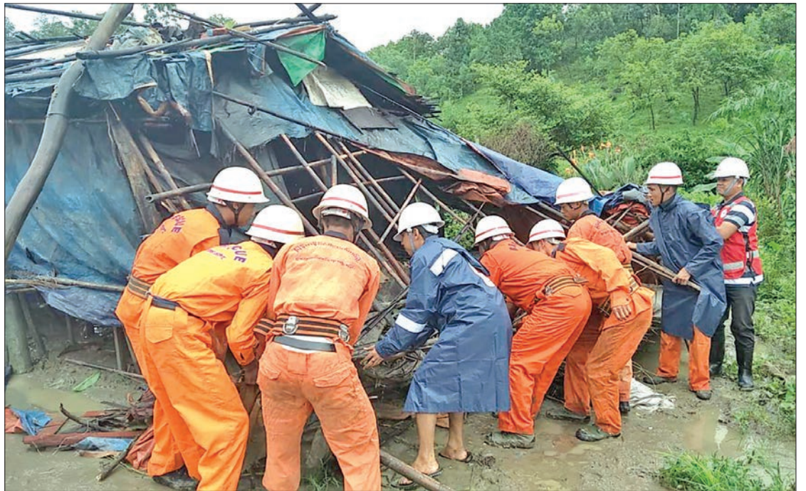
Firefighters conduct rescue operation at a site where a house is destroyed by torrential rain in Maungtaw.