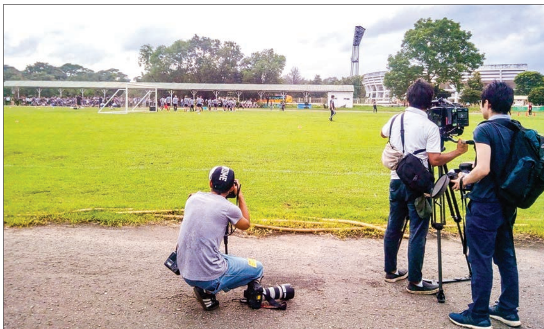
Nippon TV film crew shoot Japanese soccer team doing exercise for FIFA World Cup 2022 qualification showdown.

NIPPON TV is shooting a documentary on preparation for the FIFA World Cup 2022 by the Japanese soccer team, which is staying in Myanmar for Asian Qualifiers of the World Cup 2022.