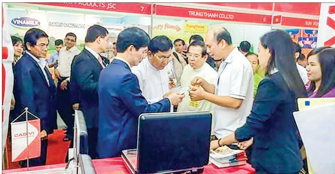
Fair's 2018 edition.

HANOI (VNA) — The biggest annual Vietnamese goods fair in Myanmar will take place in Yangon from December 19 to 22.