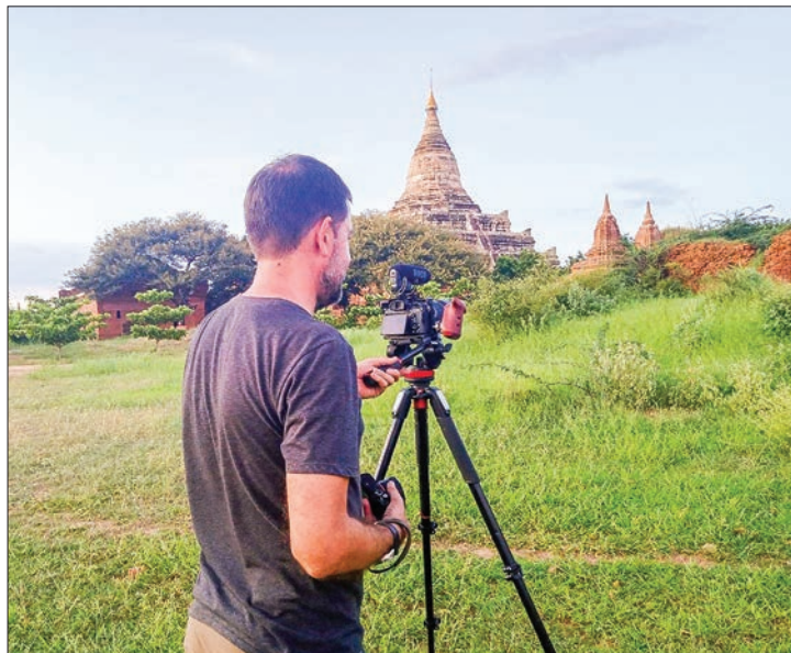
A travel documentary crew shoots stupas in Bagan yesterday.

A TELEVISION channel based in the United Kingdom took a travel documentary in Mandalay Region yesterday.