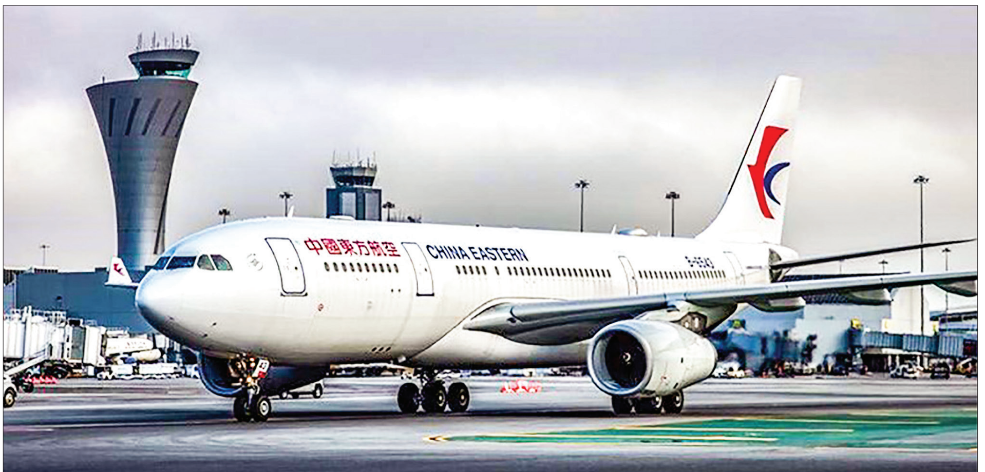
(FILE) China Eastern Airlines launches direct flight between Yangon and Shanghai on 19 June this year.