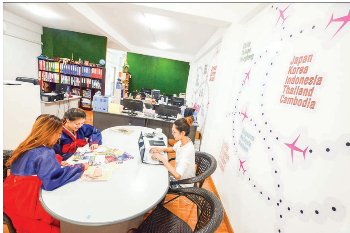
A travel agent service office in Yangon.

ed to grow by an average of 8% annually in the next 20 years. The global average of expected growth in air travel is 3.9%.