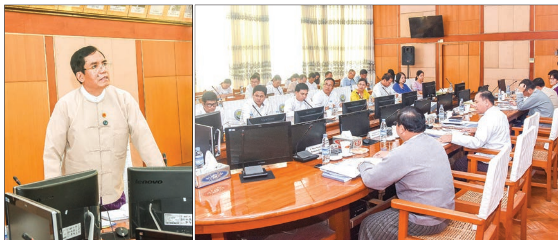
Deputy Minister for Information U Aung Hla Tun delivers the speech at the BGB coordination meeting at the Ministry of Information in Nay Pyi Taw yesterday.

THE Broadcasting Governing Body held its 5/2019 coordination meeting at the Ministry of Information in Nay Pyi Taw yesterday afternoon.