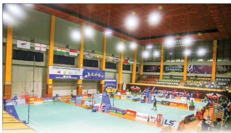
The photo shows the National Badminton Stadium in Yangon where the Myanmar International Series 2019 takes place.

Zaw Lin Htoo will also play against Indonesia's Krishana Adi Nugraha. The quarter finals will be held on 13 September and the semifinals will take place on 14 September. All finals have been scheduled for 15 September. — Kyaw Khin