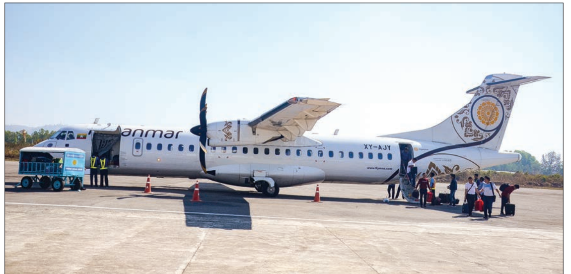
Passengers arriving with Myanmar National Airline ATR 72 plane at Heho Airport.

According to IATA analysis, air travel in Myanmar is expect-