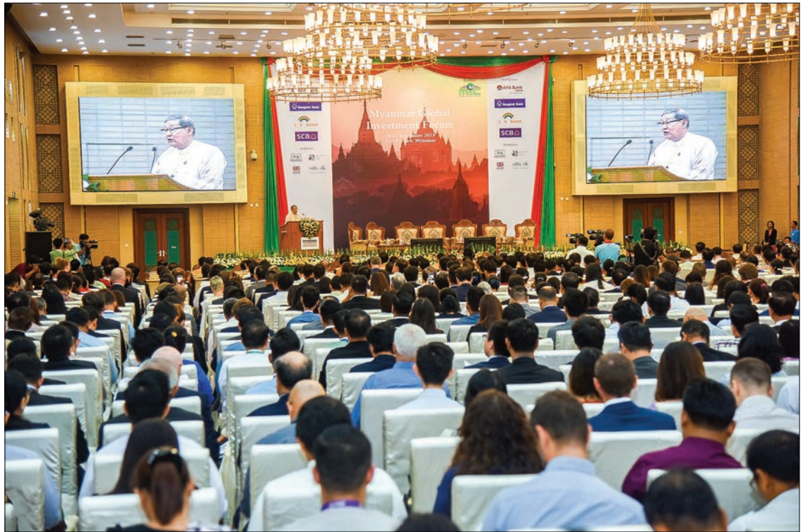
Union Minister for Planning and Finance U Soe Win delivers the speech at the 'Myanmar Global Investment Forum' at Myanmar International Convention Center-2 in Nay Pyi Taw.

The opening ceremony of the forum was also attended by Union Minister for Transport and Communications U Thant Sin Maung, Union Minister for Electricity and Energy U Win Khaing, Union Minister for Commerce Dr Than Myint, Union Minister for Ethnic Affairs Nai The Lwin, Chief Ministers of States/Regions, Deputy Ministers, ministers of State/Region governments, parliamentary representatives, senior departmental officials, local and