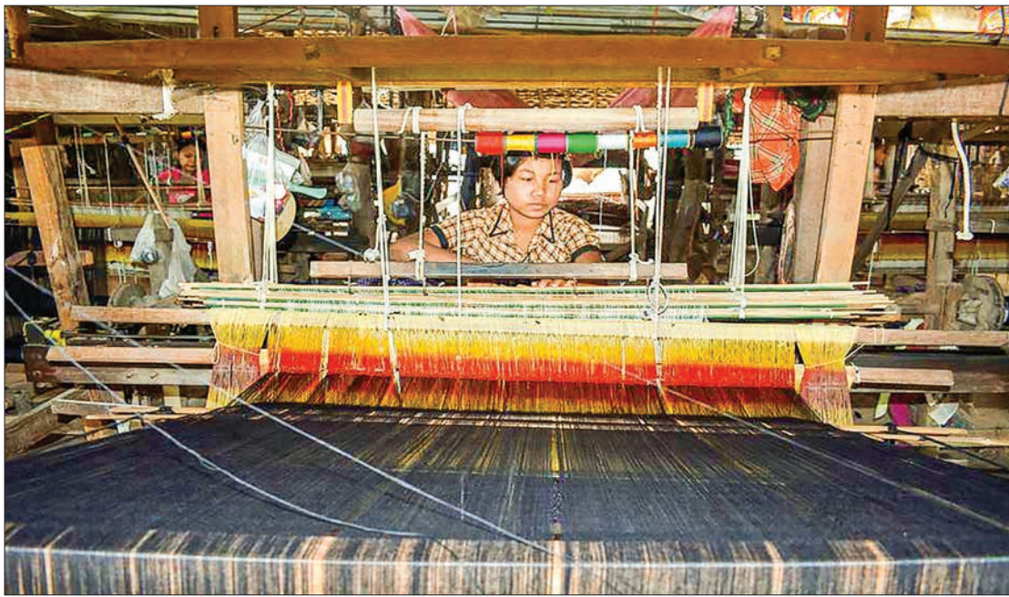
A woman is weaving traditional fabrics on a loom in Monywa.

WITH traditional weaving businesses facing a decline in Kyouksitpone Myauk Village of Monywa Township, jobs for weavers are drying up, which is forcing them to turn to other sources of livelihood, according to U Khine Zaw Lat, the Village Administrator.