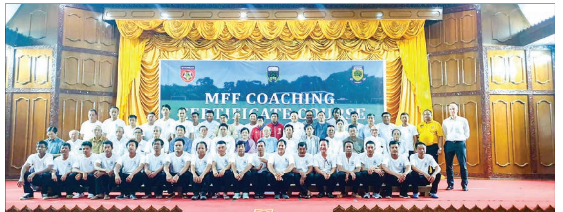
Officials and trainees of MFF Coaching Certificate Course pose for a group photo at the Diamond Jubilee Hall of the University of Yangon on 9 September.