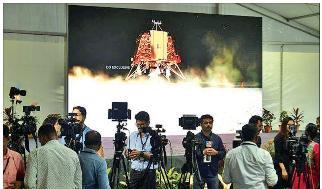
The emerging Asian giant's most complex space mission, carrying an orbiter, lander and rover, was almost entirely designed and made in India.

Indian media reports have said that the lander suffered a "hard landing", possibly damaging it and the rover inside. —AFP ■