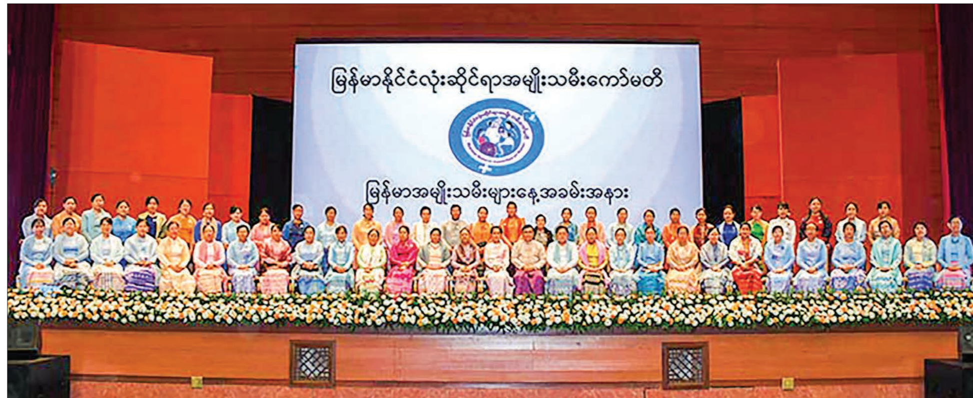
State Counsellor Daw Aung San Suu Kyi, members of the Myanmar National Committee for Women, Deputy Ministers and their wives and Hluttaw representatives pose for the documentary photo at the event to mark Myanmar Women's Day in Nay Pyi Taw on 3 July, 2019.

I was positively surprised and proud to discover that Myanmar has moved up to the top ten Asian countries list for gender equality according to the 2018 Global Gender Gap Report while China was ranked 103 and Japan ranked at 110. This prompted me to reflect and explore why Myanmar women gender inequality gap has been narrowed in recent years. Changing political landscape as the result of Myanmar political transition since 2011 may have contributed to this shift towards gender equality. The new political environment has created a space for all sectors within Myanmar society to improve gender equality in political, economic, health, security, academe, and media arena. Myanmar government and civil society had collaboratively stepped up their efforts to address gender inequalities in education, health, economic opportunity and to advance women into leadership roles and decision-maker levels.