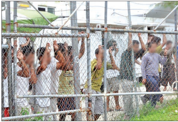
(File) Asylum seekers stand behind a fence in Oscar compound at the Manus Island detention centre in Papua New Guinea, Friday, March 21, 2014.

PORT MORESBY — Only a handful of people remained at a remote migrant detention centre on Papua New Guinea's Manus Island Tuesday, as authorities quietly empty a facility often dubbed "Australia's Guantanamo".