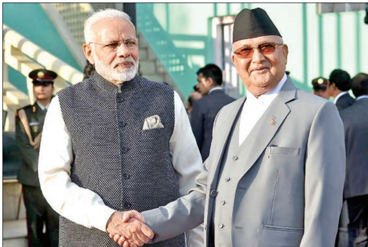
(FILE) Nepali Prime Minister K.P. Sharma Oli greets on 11 May Indian Prime Minister Narendra Modi, who has cast his visit as part of his "neighbourhood first" policy.

KATHMANDU — The prime ministers of Nepal and India jointly inaugurated a cross-border petroleum pipeline on Tuesday.