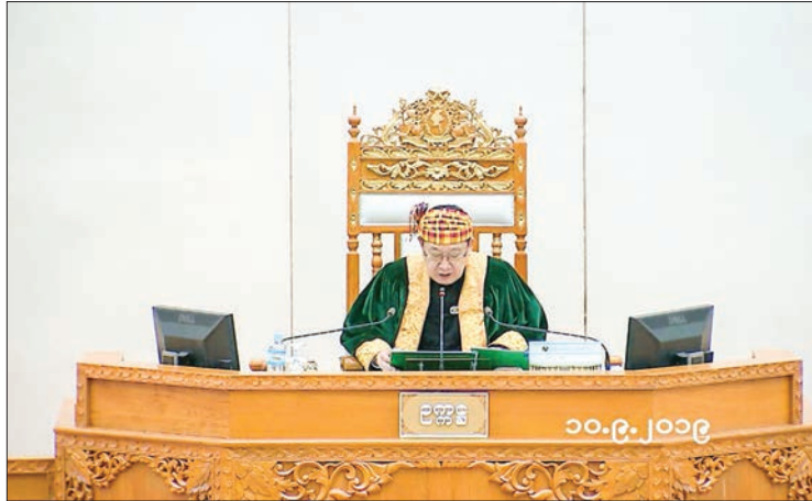
Pyithu Hluttaw Speaker U T Khun Myat.

In the question and answer session that the day's Hluttaw program starts off Dr U San Shwe Win of Yekyi constituency first asked if there was a plan to establish a rehabilitation hospital for persons with disabilities in upper Myanmar to effectively implement enactments in the Rights of Persons with Disabilities Law 2015 and Rule 2017. Union Minister for Health and Sports Dr Myint Htwe said a hospital in Mandalay Region Madaya Township will be renamed and organized as a rehabilitation hospital for persons with disabilities where medical as well as surgical treatments can be conducted for persons with disabilities. The matter will be submitted to the Union Government so that the hospital can be renamed and organized as a rehabilitation hospital for persons with disabilities said the