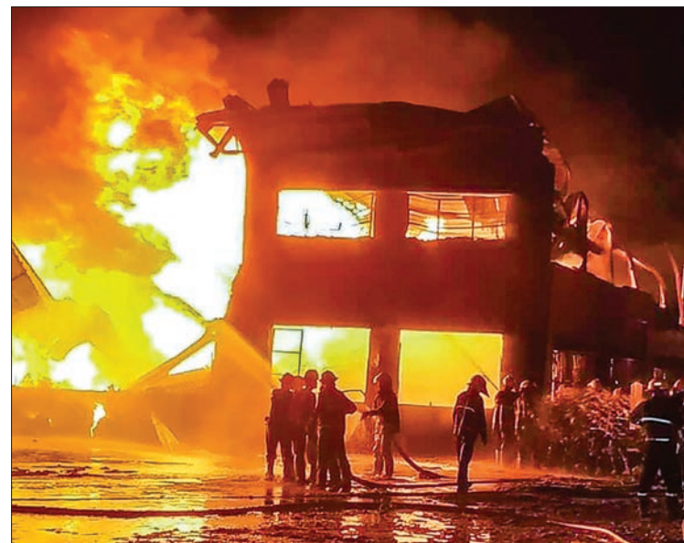
Firefighters extinguish a fire at a storage house in Industrial Zone-1 in Dagon Seikkan Township.