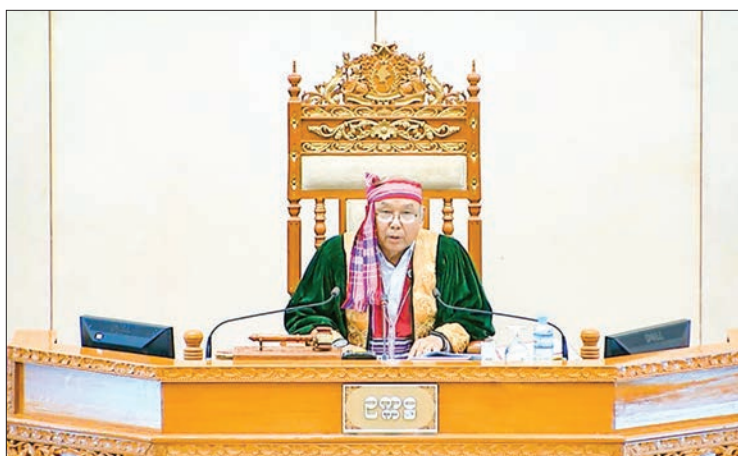
Amyotha Hluttaw Speaker Mahn Win Khaing Than.

In the question and answer session, questions raised by U Kyaw Thaug of Sagaing Region constituency 1 on a plan made for pensioners of various departments to enjoy social security health care services; U Kyaw Ni Naing of Shan State constituency 11 on a plan to upgrade