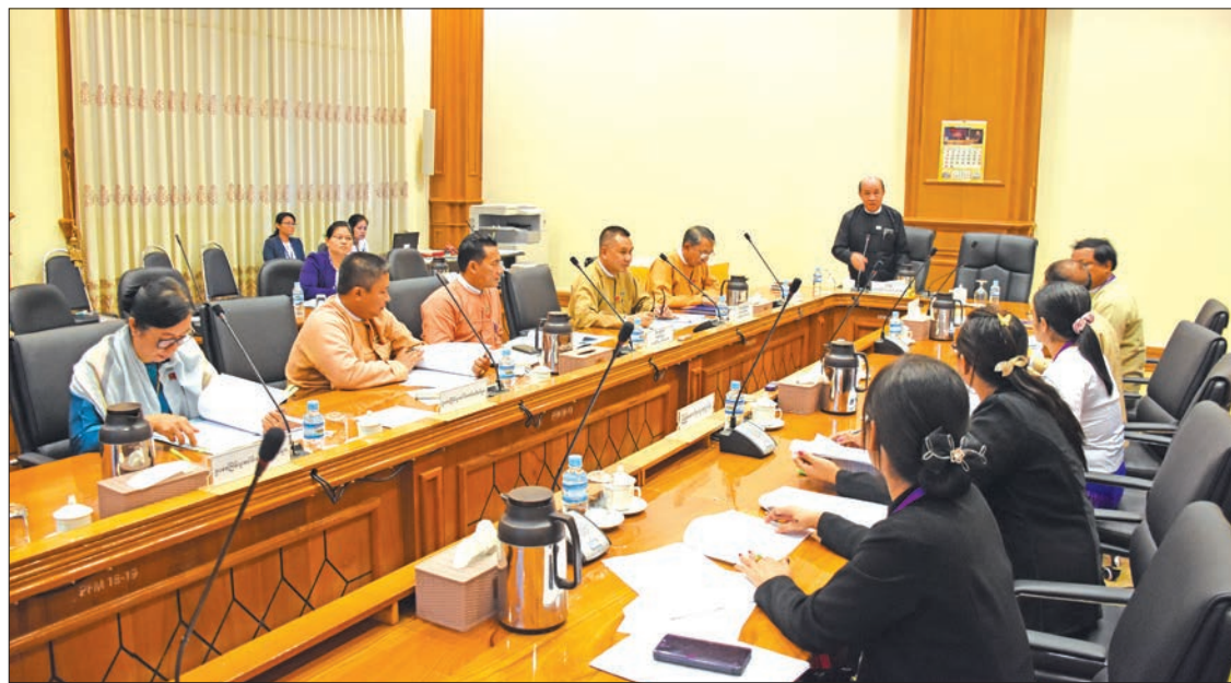
Pyidaungsu Hluttaw Joint Bill Committee holds the meeting on controversial 2019 Protection of New Plant Species Bill in Nay Pyi Taw yesterday.