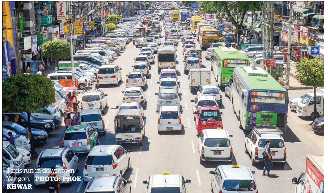
Taxis run in downtown Yangon.

“When the registration process was started, over 100-200 taxis were applying for registration