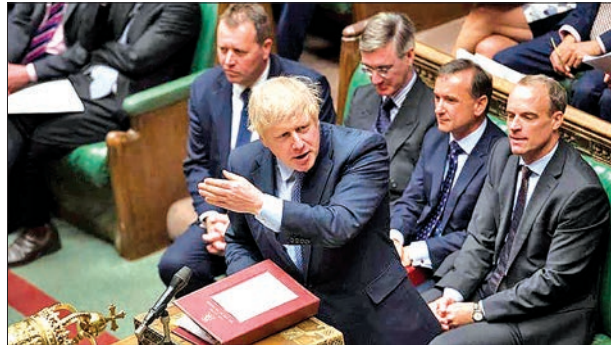
Prime Minister Boris Johnson gesturing as he speaks in the House of Commons in London.

He held a cabinet meeting later on Tuesday to plot his next move after a series of defections and expulsions left him far short of a parliamentary majority and unable to garner enough votes from MPs