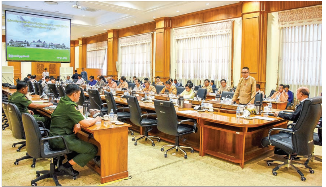
Pyidaungsu Hluttaw Deputy Speaker U Tun Tun Hein attends the meeting 34/2019 of the Joint Committee on amending the 2008 Constitution in Nay Pyi Taw yesterday.