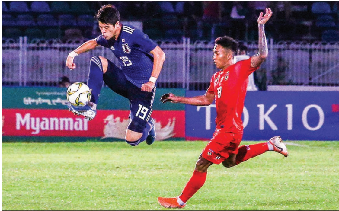
Japan's Hiroki Sakai (L) controls the ball beside Myanmar's Kaung Sithu during the Qatar 2022 World Cup qualifying football match between Myanmar and Japan in Yangon on 10 September 2019.

In the second leg of the second round Group F of the 2022 World Cup Qualifiers, Myanmar will meet Mongolia on 19 November 2019, Japan on 26 March 2020, Kyrgyzstan 31 March 2020 and Tajikistan 9 June 2020. — Kyaw Khin