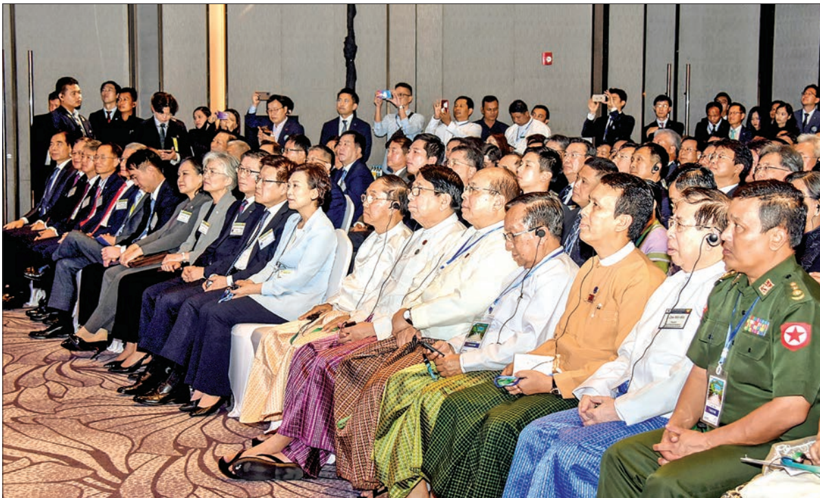
South Korean President Moon Jae-in delivers the address at the Business Forum in Yangon yesterday.