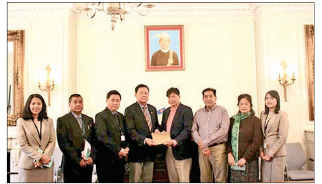
Ambassador U Kyaw Swar Min accepts aid for flood victims from Natural Disaster Emergency Relief Committee - UK.