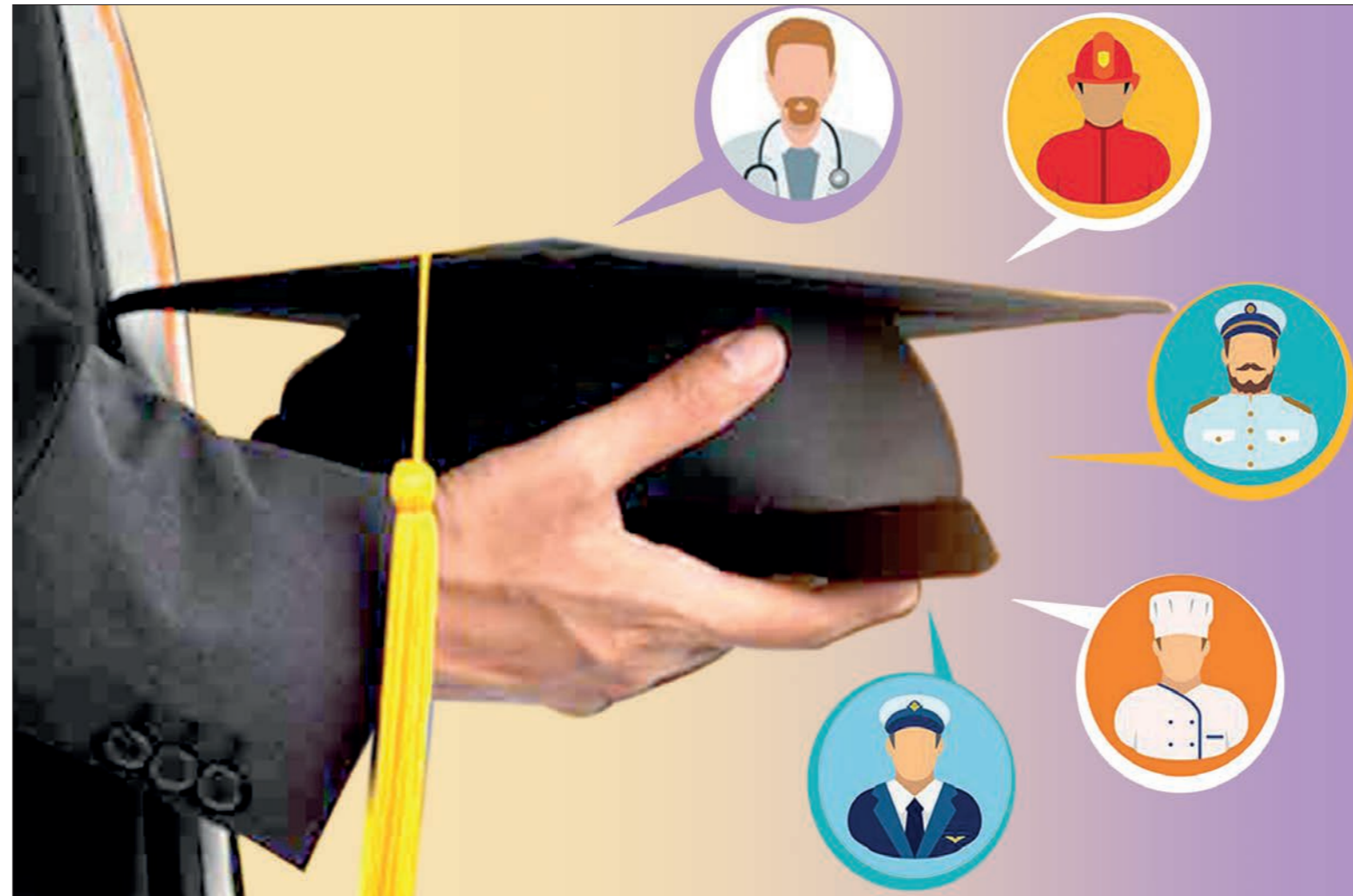
Enhancing graduate employability is a key priority for higher education.

In some cases, the demand may be low although the supply is high as the latter doesn't meet the academic qualification of a particular demand. But in other cases business companies face a shortage of required employees and a high cost of providing courses for recruits as the supply of professionals for a particular job