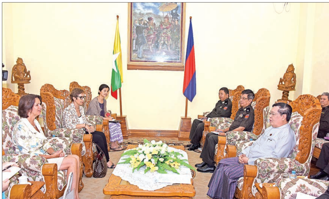
Union Minister U Thein Swe meets with Special Envoy of the United Nations Secretary-General on Myanmar Ms Christine Schraner Burgener in Nay Pyi Taw yesterday.