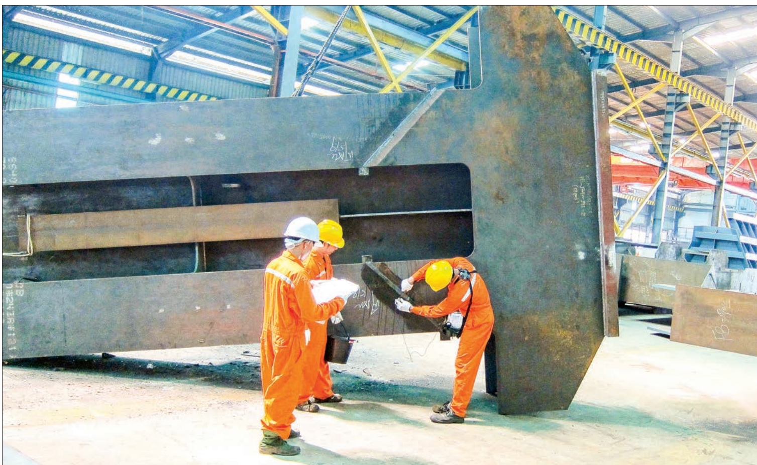
Fabricating a steel structure for steel Mill.

More and more local steel fabrication companies entered into the market as industrial sector and construction sector booms. Office buildings, banks, car showrooms, shopping