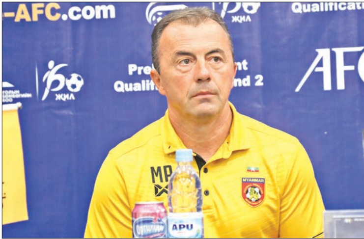
Myanmar national football team's head coach, Miodrag Radulović, at a pre-match conference yesterday in Ulaanbaatar, Mongolia, ahead of the 2022 World Cup Qualifiers between Myanmar and Mongolia.

THE Myanmar national football team will take on Mongolia's national team at the 2022 World Cup Qualifiers at 3.30 p.m. (Myanmar Standard Time) today at the Football Stadium in Ulaanbaatar, Mongolia.