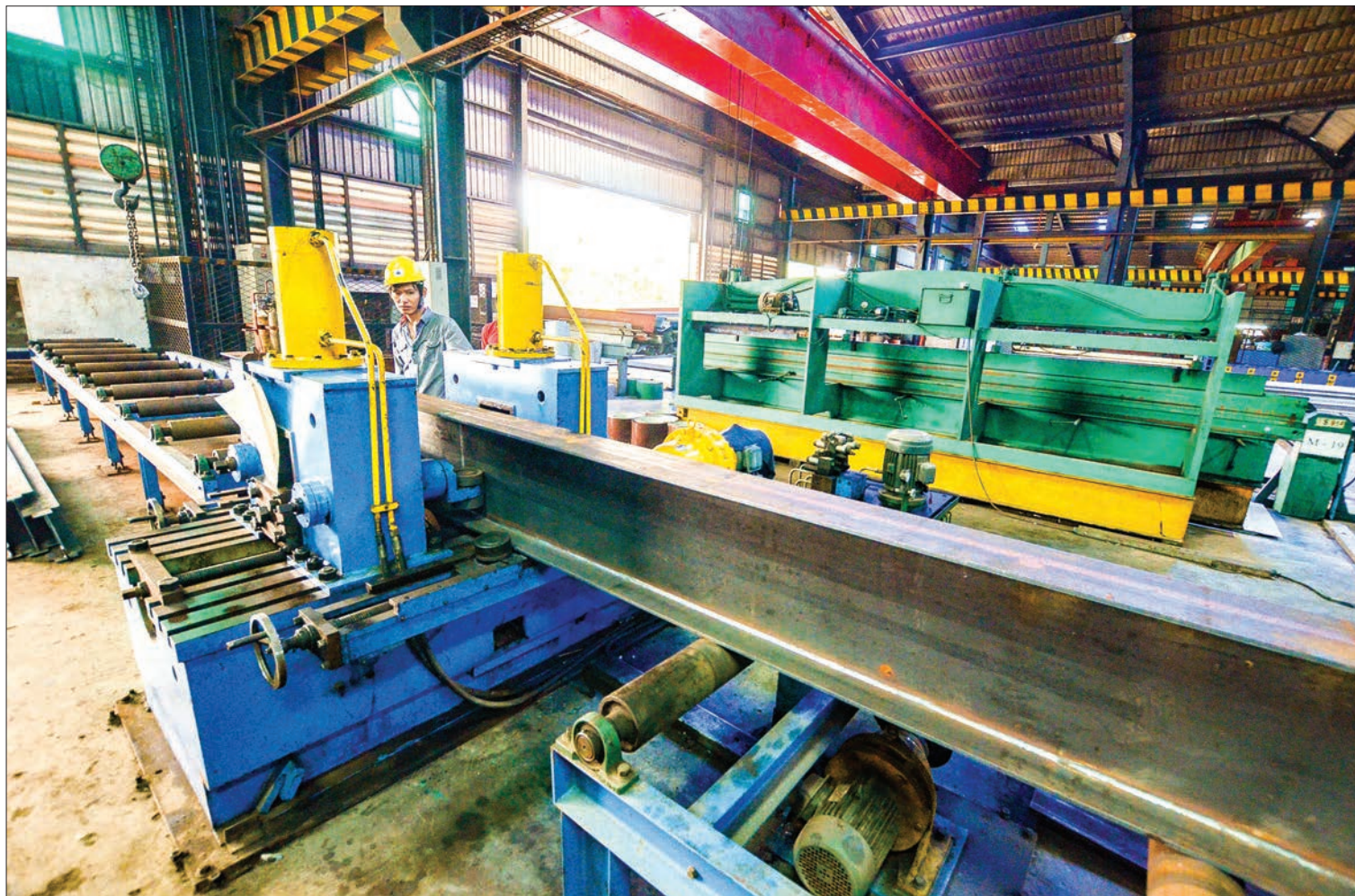
Hydraulic straightening machine in SMI.

malls as well as houses were quickly constructed with steel structures in addition to factory buildings. In addition to I and H beams, local steel companies were producing box columns for high-rise buildings and bridges.