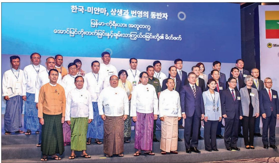
Vice President U Myint Swe, ROK' President Moon Jae-in, Union Ministers and representatives from the two countries pose for a photo at the launching ceremony of industrial complex in Yangon yesterday.

renovations and further bridge construction."