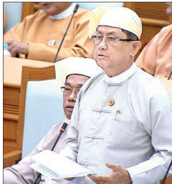
Deputy Minister U Maung Maung Win.