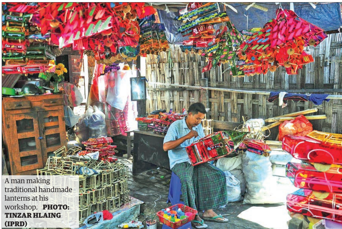
A man making traditional handmade lanterns at his workshop.

Myanmar traditional lanterns are usually made ahead of the Thadingyut Festival at 42 nd street, southern part of Ward 840 in Mahaangmyay Township, Mandalay Region. Most of the lanterns are purchased from Kyauk-