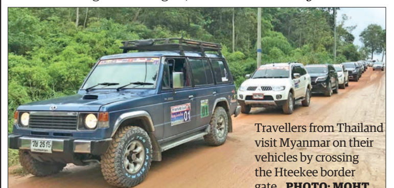
Travellers from Thailand visit Myanmar on their vehicles by crossing the Hteekee border gate.