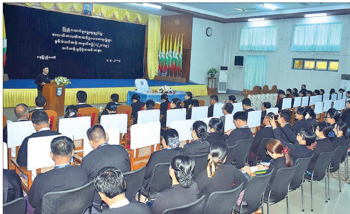
Union Attorney-General U Tun Tun Oo delivers the opening speech at the 1/2019 law officers' refresher course at the Office of the Union Attorney-General in Nay Pyi Taw yesterday.

Mr Hur Yin then signed the MoU with Deputy Mayor U Soe Lwin.—MNA ■ (Translated by Zaw Htet Oo)