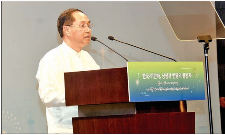
Vice President U Myint Swe.