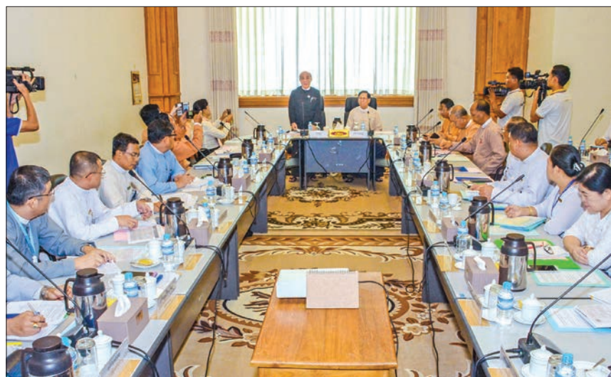
Pyidaungsu Hluttaw Deputy Speaker U Tun Tun Hein delivers the speech at the fourth coordination meeting for observing 2019 International Democracy Day at Pyidaungsu Hluttaw yesterday.