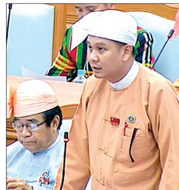
MP Dr Myat Nyana Soe.

of Pyidaungsu Hluttaw to take the loan, and MoPF's Deputy Minister also supported the motion.