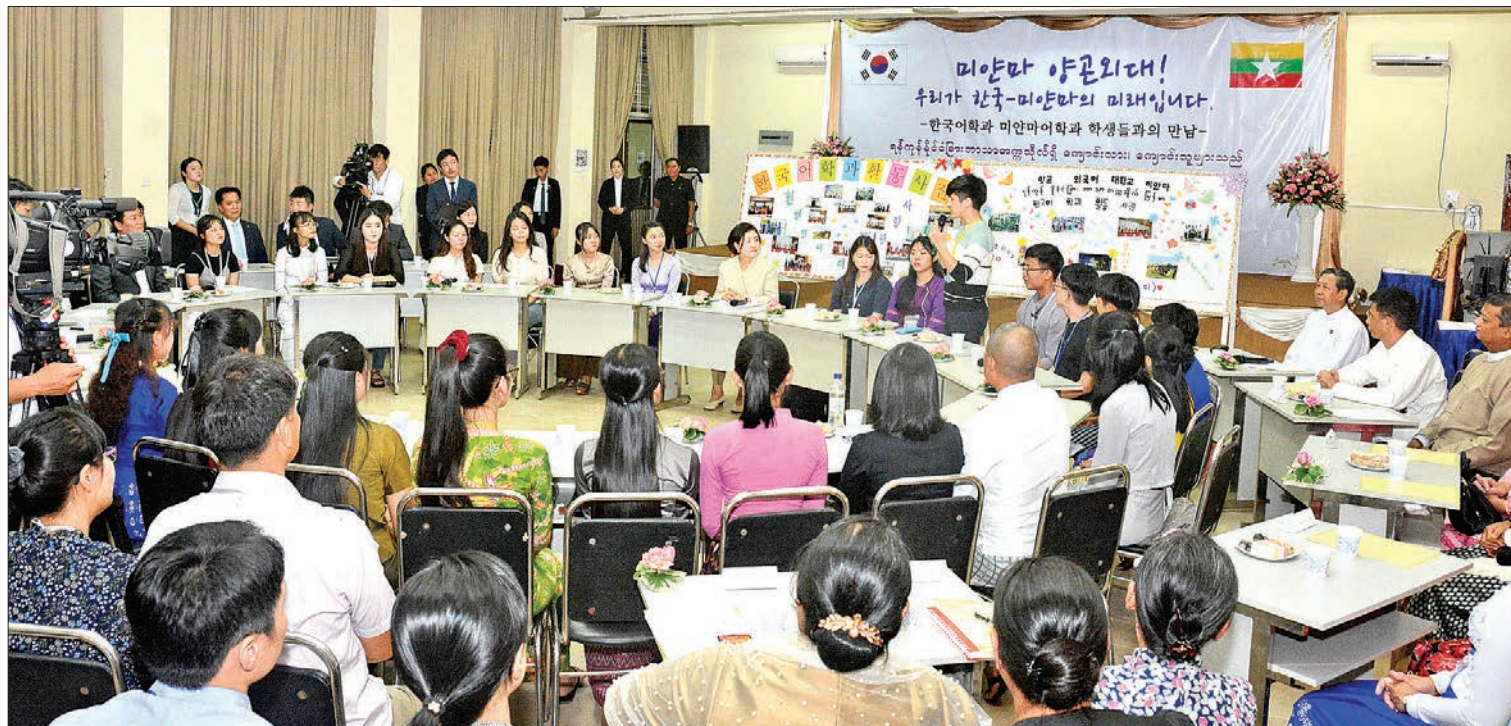
Korean First Lady Kim Jung-sook meets with students at the University of Foreign Languages in Yangon yesterday.