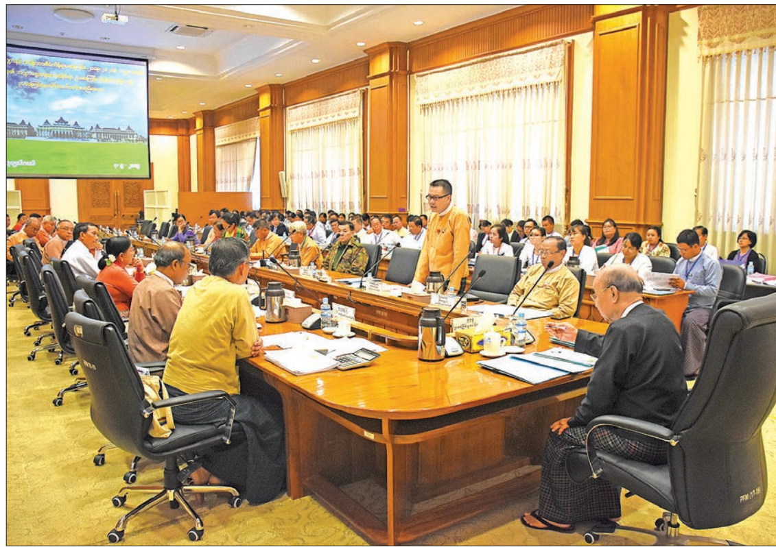
Pyidaungsu Hluttaw Joint Bill Committee holds the meeting in Nay Pyi Taw yesterday.