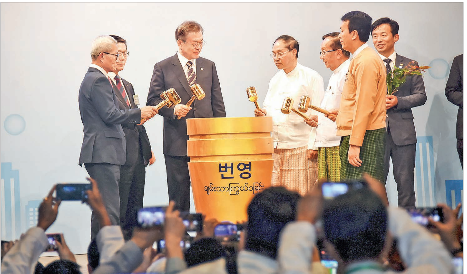
South Korean President Moon Jae-in, Vice President U Myint Swe and dignitaries strike a ceremonial stake to signify the beginning of the Myanmar-Korea industrial complex.

A LAUNCHING ceremony of the joint industrial complex between Myanmar and the Republic of Korea was held yesterday afternoon together with a forum to discuss a partnership for development and prosperity.