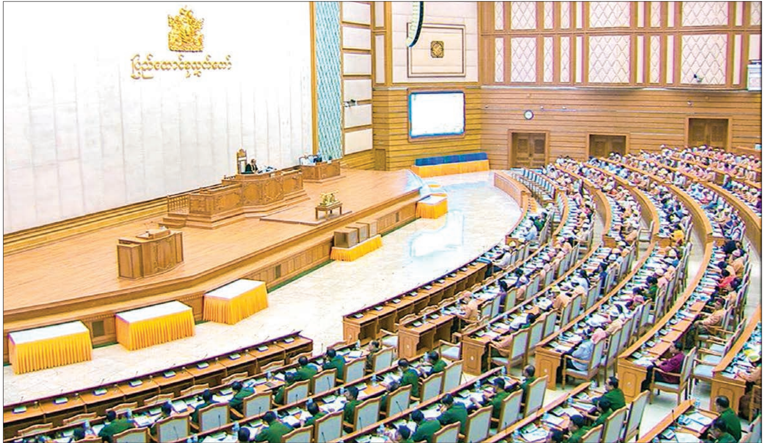
Pyidaungsu Hluttaw is being convened in Nay Pyi Taw yesterday.