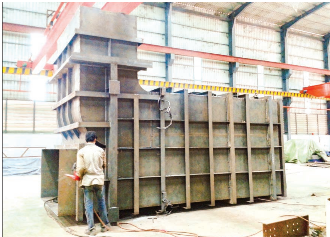
Fabricating a factory smoke stack.

The sooner these transitions and reforms were accomplished to Ministry of Construction and Ministry of Industry, the better it'll be for Myanmar steel industry. And the sooner such transitions and reforms were accomplished in other ministries, the better it'll be for the country, the people and the economy.