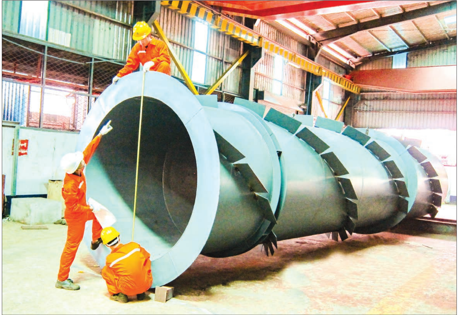
Fabricating a factory chimney.

The first steel structure building in Myanmar, if not Asia, was reported to be the New Court Building constructed in Yangon during the colonial period. The British Governor of Myanmar Sir Harcourt Butler laid the foundation stone for the New Court Building in March 1927. Steel frames produced by Dorman & Long Company were used to construct this building and this company also provided steel frames for the famous Sydney Harbour Bridge in Australia. During the colonial period of early 19th and 20th century, iron works and steels were produced in the west only. New Court Building was the latest heritage