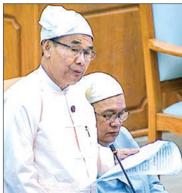
Union Minister U Ohn Win.