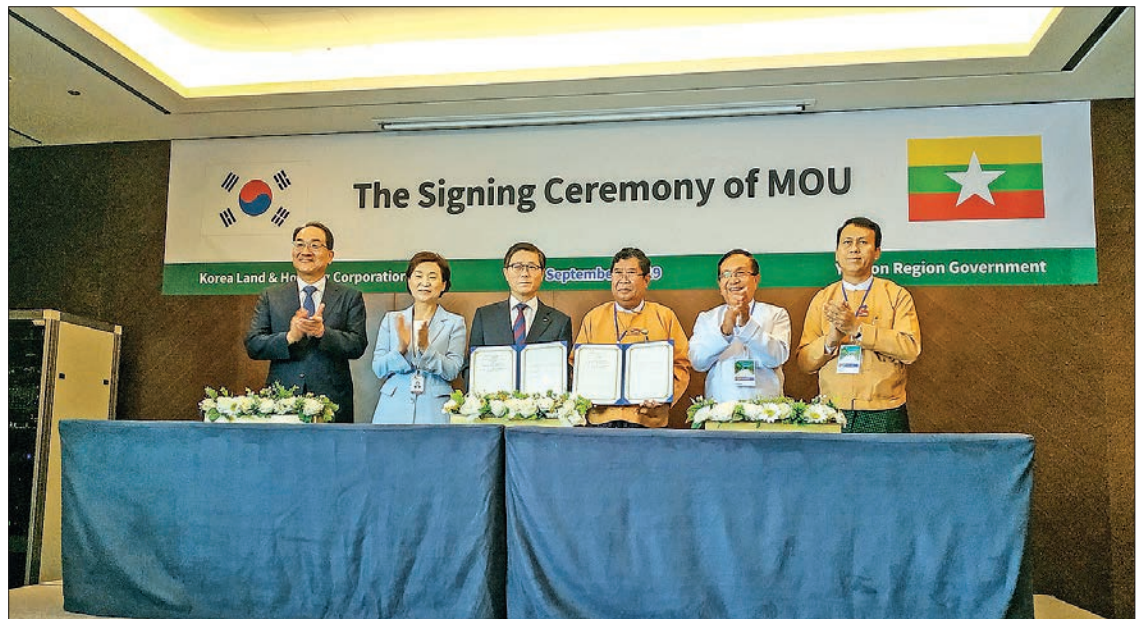
An MoU signing ceremony between Yangon Region Government and Korea Land and Housing Corporation for a feasible study of the New Dala City Project held in Yangon yesterday.

According to the programme, KB Kookmin Bank first played an introductory video and