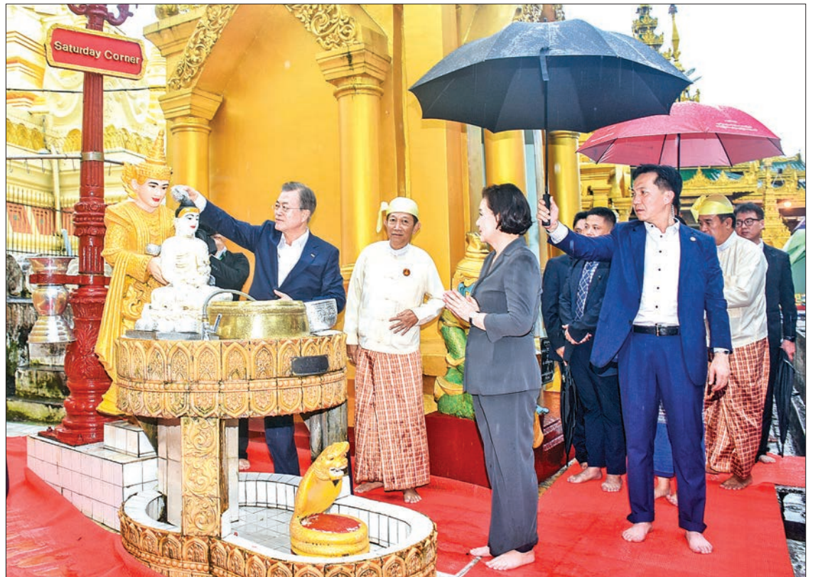
President Moon Jae-in and First Lady Kim Jung-sook perform religious ritual at Shwedagon Pagoda in Yangon yesterday.