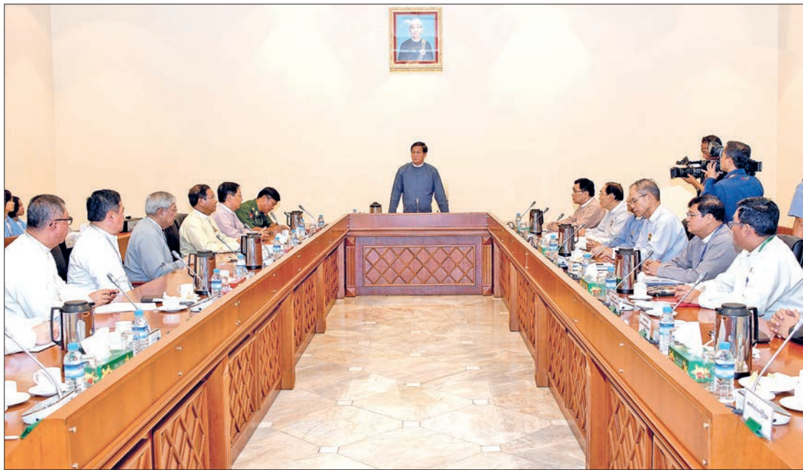
Vice President U Henry Van Thio addresses the ceremony to accept donations from the Road and Bridge B.O.T Entrepreneurs Association to provide aid to flood-affected regions.

He said as the culture of cooperation between the government, the public, businesses and humanitarian organizations increase, they will be able to