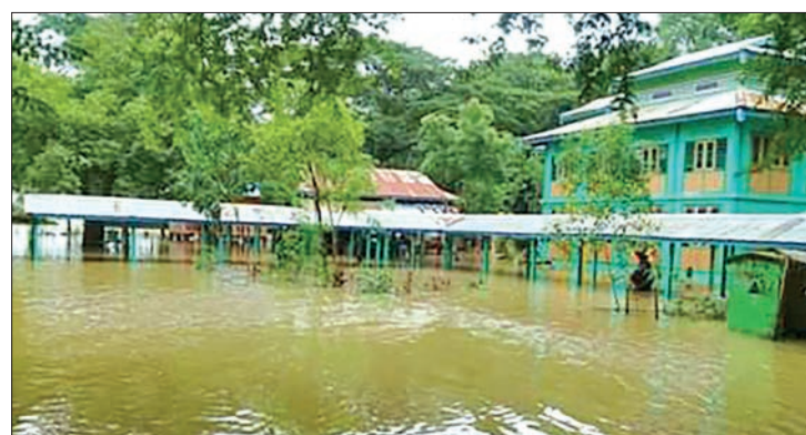
Schools and houses are submerged in flood water after heavy rain in Bago Region.

SONE wards and some village-tracts in the east of Zigon Township were flooded with 3 feet of water from the Minbu and Bawbin creeks on 1 September due to the continuous and heavy rainfall in Bago Region.