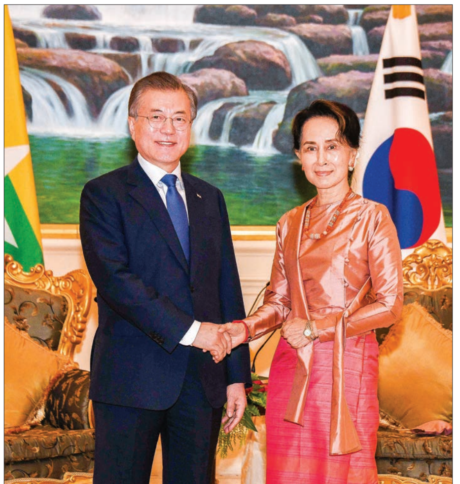
State Counsellor Daw Aung San Suu Kyi greets Mr Moon Jae-in, President of the Republic of Korea, at the Presidential Palace in Nay Pyi Taw yesterday.

S TATE Counsellor Daw Aung San Suu Kyi held a separate talk with Mr Moon Jae-in, the visiting President of Republic of Korea, at the Envoys Hall of the Presidential Palace in Nay Pyi Taw at 4 pm yesterday.