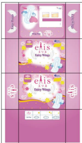
Fig.7 - Reduced Development View