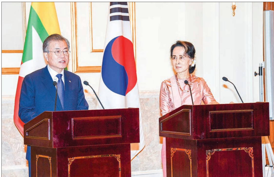
State Counsellor and Foreign Minister Daw Aung San Suu Kyi and President of the Republic of Korea Moon Jae-in hold a joint press conference at the Presidential Palace in Nay Pyi Taw yesterday.