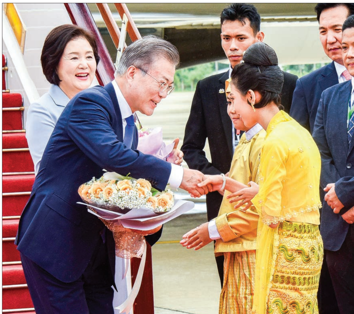
President of the Republic of Korea Moon Jae-in and First Lady Kim Jung-sook accept bouquets from children at the Nay Pyi Taw International Airport yesterday.