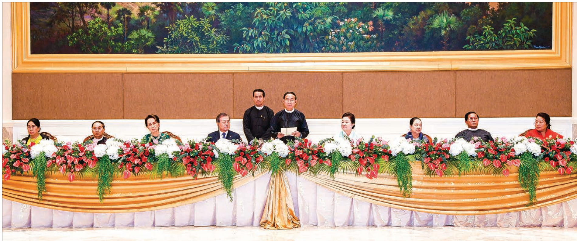
President U Win Myint and First Lady Daw Cho Cho, State Counsellor Daw Aung San Suu Kyi and Vice Presidents attend the state dinner together with President of the Republic of Korea Moon Jae-in, and First Lady Kim Jung-sook at the Presidential Palace in Nay Pyi Taw yesterday.

P RESIDENT U Win Myint hosted a state dinner in honour of the visiting president of the Republic of Korea, Moon Jae-in, and First Lady Kim Jung-sook at the Presidential Palace in Nay Pyi Taw yesterday evening.