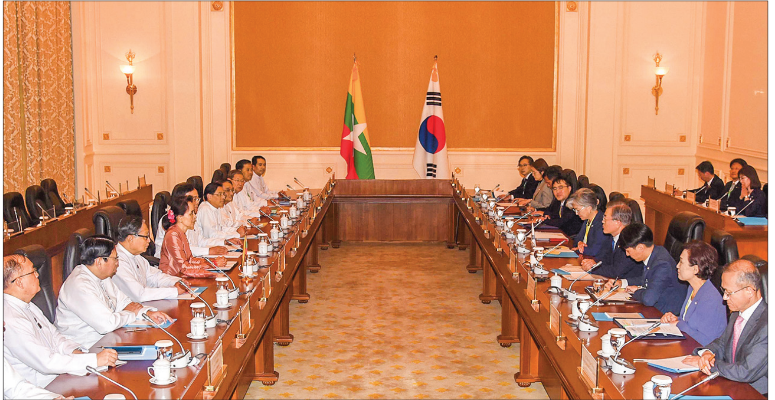
State Counsellor Daw Aung San Suu Kyi holds talks with Mr Moon Jae-in, President of the Republic of Korea, at the Diplomatic Hall of the Presidential Palace in Nay Pyi Taw yesterday.

state-level participation of Myanmar in the 30 th anniversary of the ASEAN-ROK Dialogue Relations and the first Mekong-Korea Summit which will be held in Busan in November this year, digital display of cultural and scenic views of Bagan, which has recently been awarded UNESCO World Heritage status, at the ASEAN Culture House in Busan to create awareness about Myanmar among the Korean people, possible assistance of ROK in celebrating the 100 years anniversary of Yangon University, ROK support to the efforts of Myanmar government in Rakhine issue, ceremony to establish Korea-Myanmar Industrial Complex in Yangon, and recruitment of more