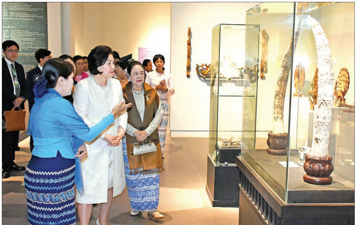
First Lady Daw Cho Cho and First Lady of the Republic of Korea Mrs Kim Jung-sook observe items displayed at the National Museum in Nay Pyi Taw yesterday.