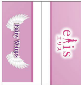
Fig.4 - Left Side View