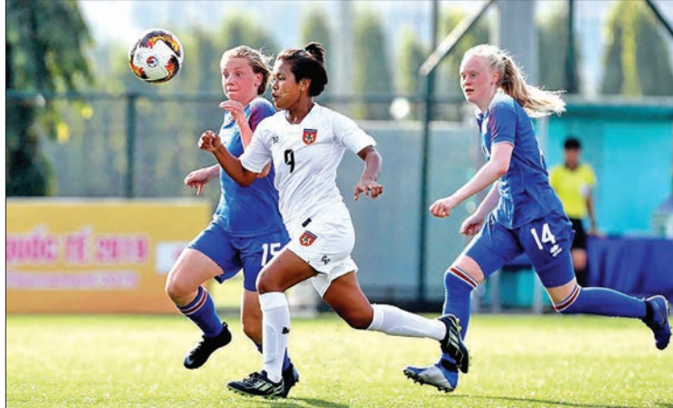
Myanmar footballer (white) and Iceland footballers (blue) vie for the ball in the match of Viet Nam International U-15 Girl's Football Tournament in Hanoi, Viet Nam on 3 September.

Teams from Myanmar, Hong Kong (China), Iceland, and host Vietnam are participating