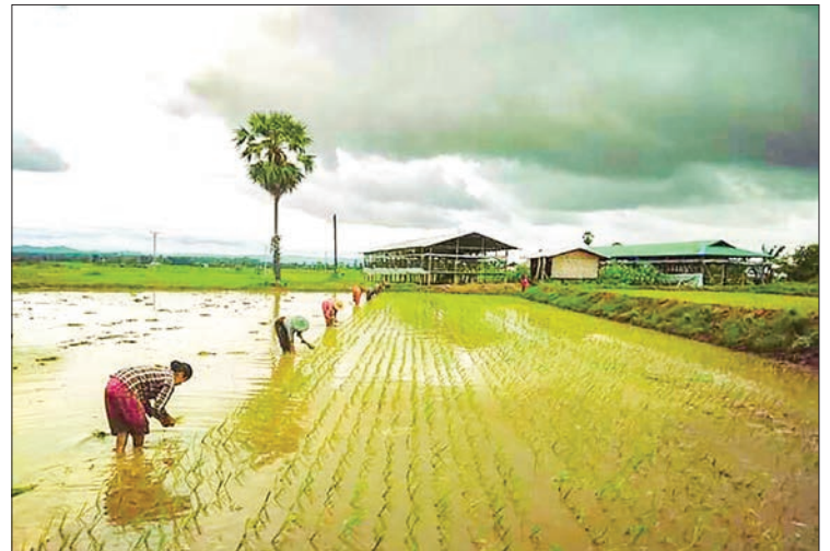
Women farmers plant rice saplings on rain-fed field in the outskirts of Sagaing.

cords, a total of 1,784,192 acres of monsoon paddy was planted in the 2016-2017FY, and 1,471,638 acres of paddy was sown in the 2017-2018FY. In the current FY,