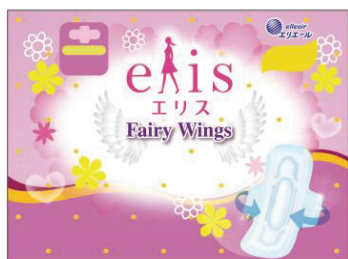
Fig.5 - Top View