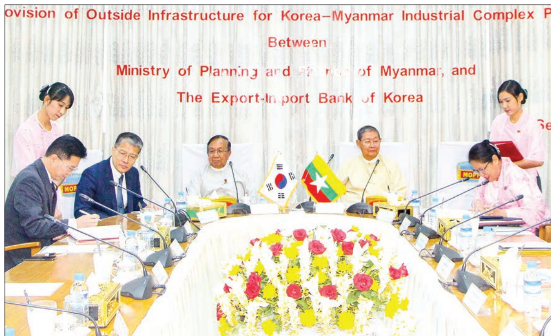
Union Minister for Planning and Finance U Soe Win and Union Minister for Construction U Han Zaw witness the signing ceremony between Ministry of Planning and Finance and Export-Import Bank of Korea yesterday.