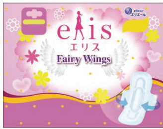
Fig.1 - Front View

Daio Paper Corporation, a company incorporated in Japan and having its registered office at 2-60, Mishimakamiya-cho, Shikokuchuo-shi, Ehime 799-0492 JAPAN, is the owner and proprietor of the following Design in the title of "Packages for sanitary Pads":