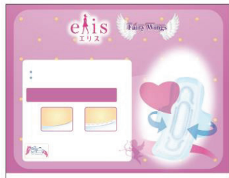
Fig.2 - Rear View