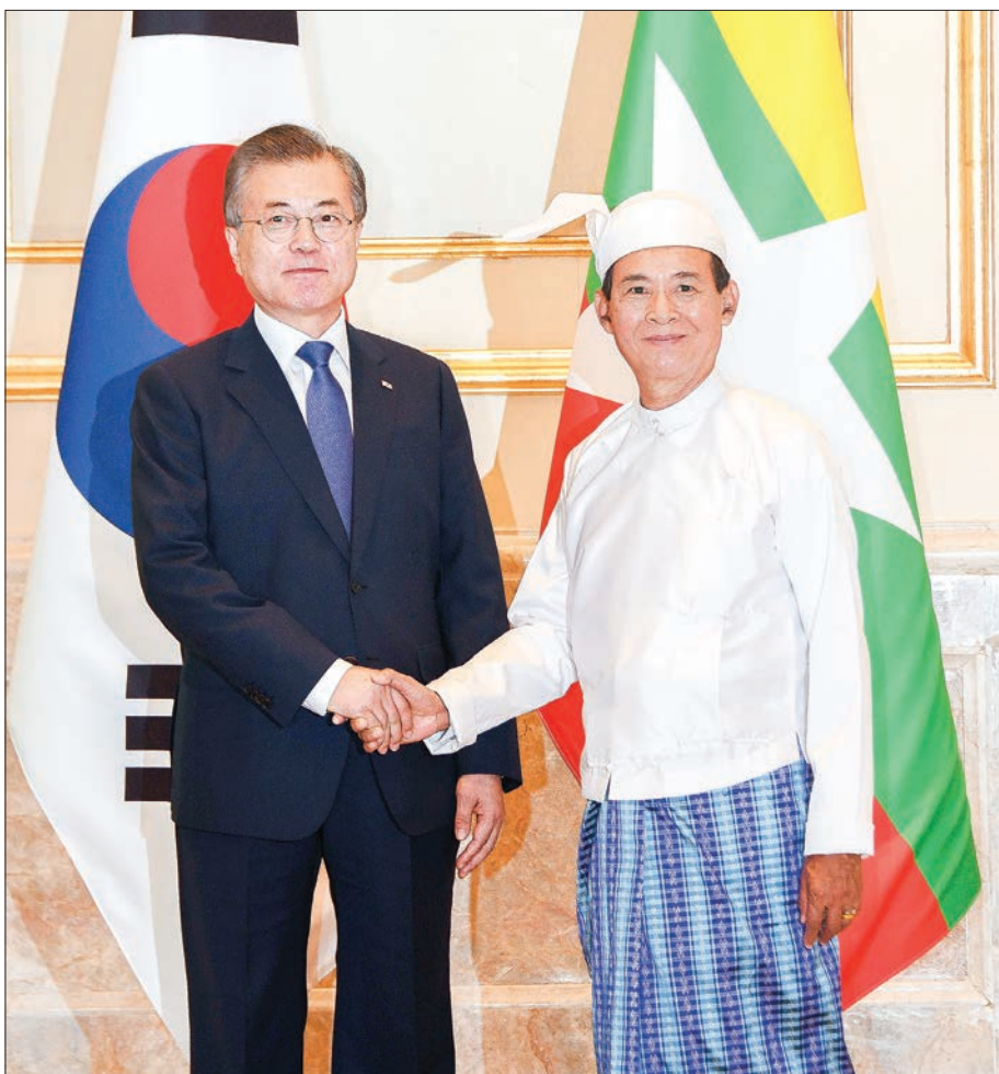
President U Win Myint and President of the Republic of Korea Moon Jae-in pose for documentary photo at the Presidential Palace in Nay Pyi Taw yesterday.

P RESIDENT U Win Myint and First Lady Daw Cho Cho welcomed President of the Republic of Korea Moon Jae-in and wife Kim Jung-sook at the Presidential Palace in Nay Pyi Taw on Tuesday afternoon.