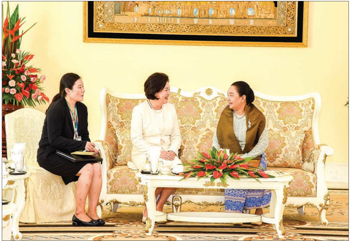
First Lady Daw Cho Cho meets with First Lady of Republic of the Korea Mrs Kim Jung-sook at the Presidential Palace guest hall in Nay Pyi Taw yesterday.