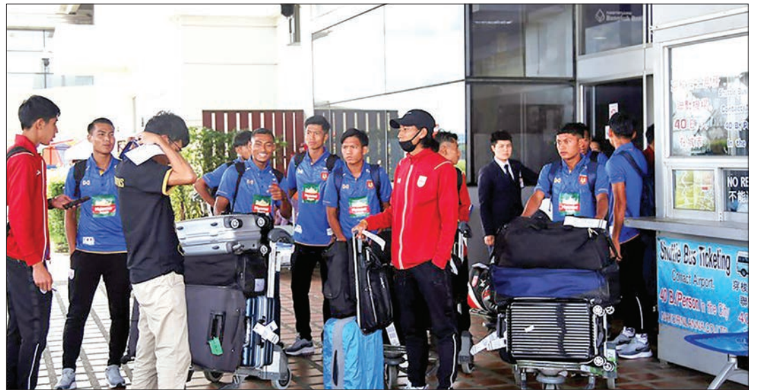
Myanmar national U-23 football team arrive in Chiang Rai City, Thailand on 3 September to play training matches on 5 and 8 September.