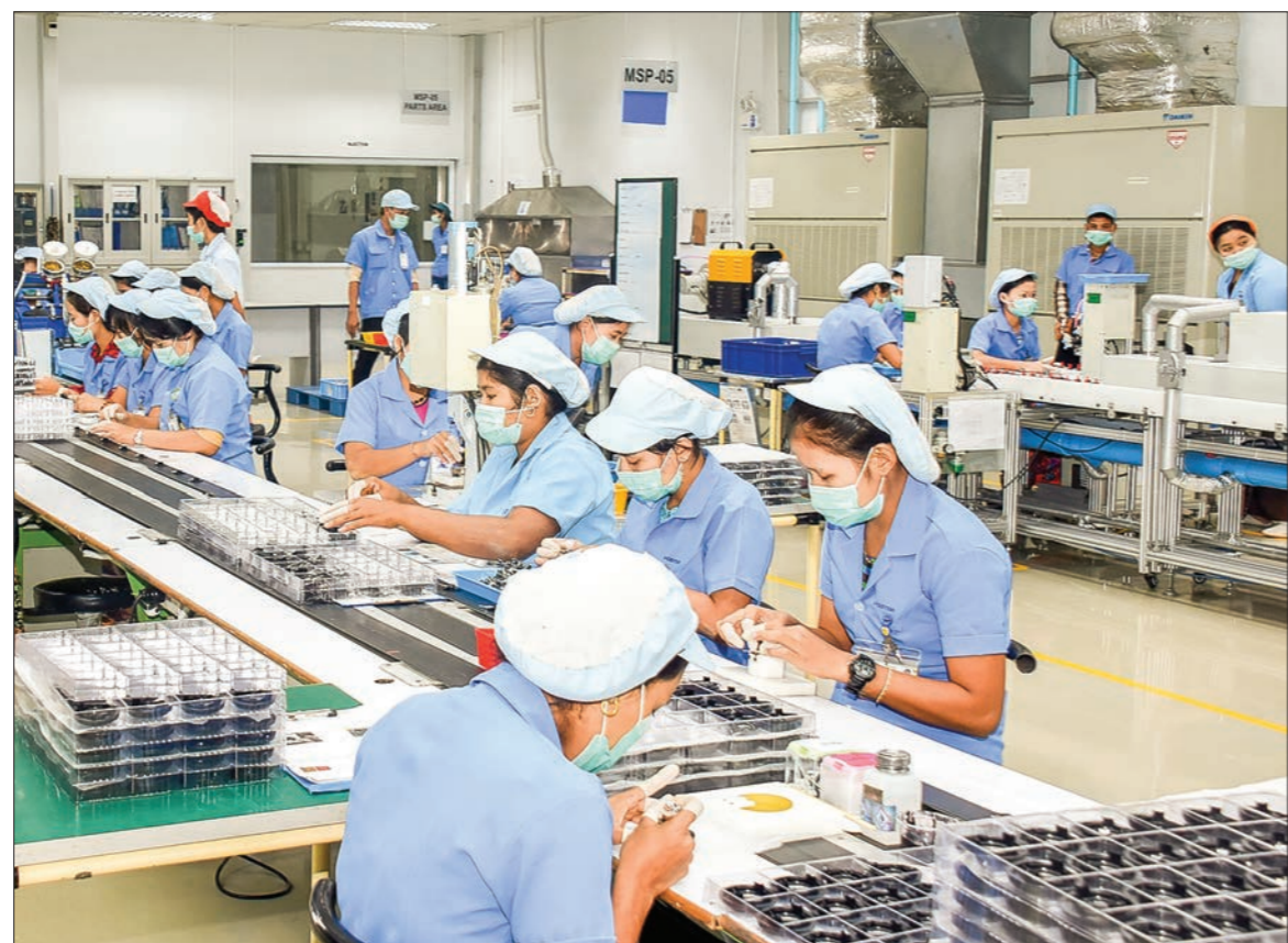
Workers at work in the production line of the Foster Electric Thilawa Co Ltd in Thilawa SEZ.