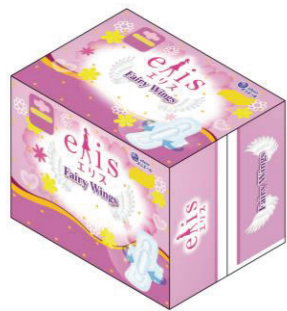
Fig.8 - Perspective View