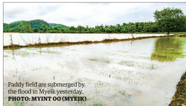
Paddy fields are submerged by the flood in Myeik yesterday.

FLOODS brought on by torrential rain have damaged 9,897 acres out of 81,523 acres of monsoon paddy cultivated in four townships of Myeik District, including Taninthayi Township, in the current fiscal year, according to the Myeik District Agriculture Department.