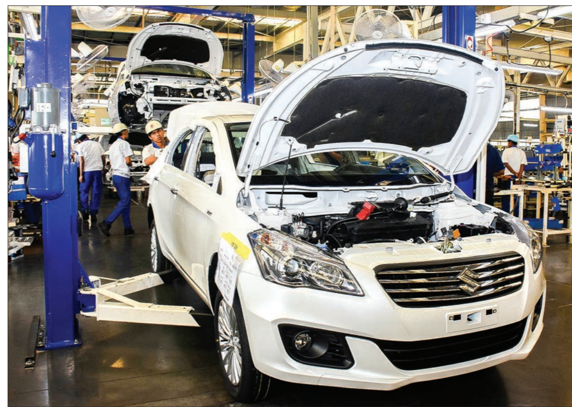
Workers are seen at the assembly line of the Suzuki Thilawa Motor Co. Ltd at Thilawa SEZ.

As far as the training goes, such courses could perhaps be conducted in line with the Occu-