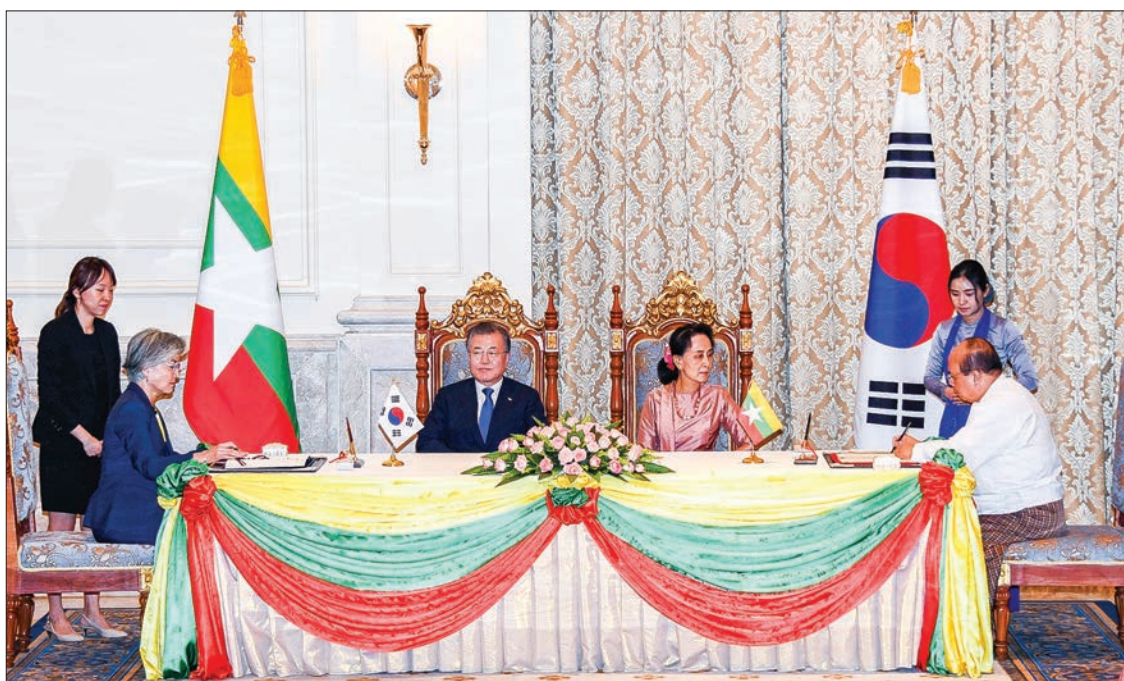
State Counsellor Daw Aung San Suu Kyi and President of the Republic of Korea Moon Jae-in witness the signing of MoU by Union Minister for Investment and Foreign Economic Relations U Thaung Tun and ROK's Minister for Foreign Affairs Ms Kang Kyung-wha in Nay Pyi Taw yesterday.