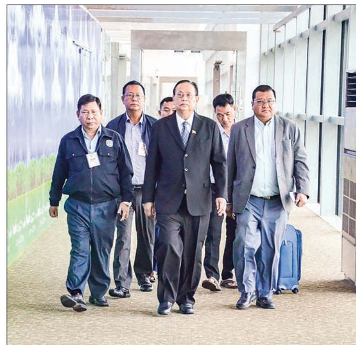
Union Minister U Win Khaing seen off by officials at the Yangon International Airport yesterday.

UNION Minister for Electricity and Energy U Win Khaing left Yangon for Thailand by flight yesterday morning to attend the 37 th ASEAN Ministers on Energy Meeting and related meetings, which are scheduled to take place on 4-6 September in Bangkok, Thailand.