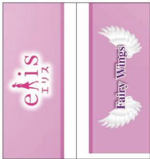
Fig.3 - Right Side View