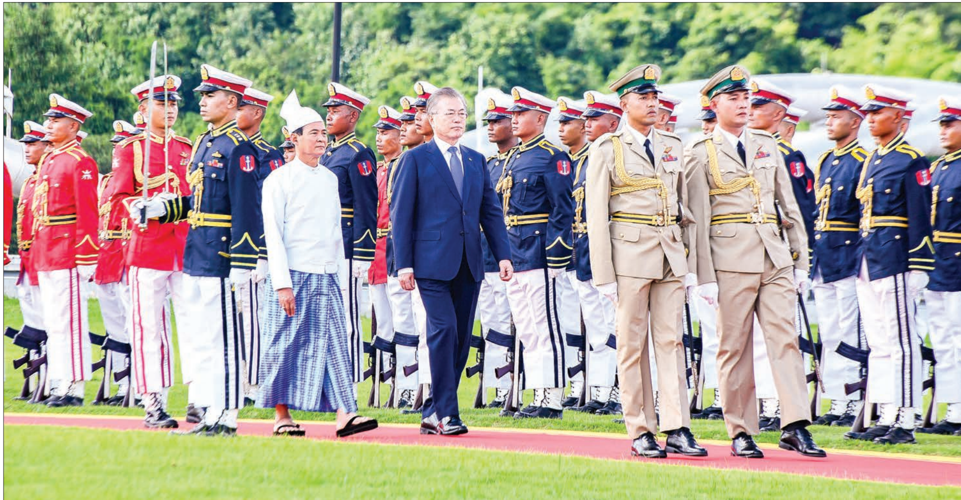
President U Win Myint and President of the Republic of Korea Moon Jae-in inspect the Guard of Honour in Nay Pyi Taw yesterday.