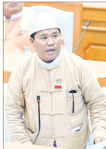
MP U Than Soe.

targeted at 16 per cent for FY 2017-2018 and by end March of FY 2017-2018 this also remains within target at 6 per cent.