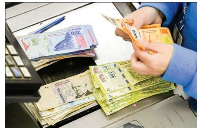
Argentina has been in recession since 2018, with inflation soaring 25 per cent in the first six months of the year.

Lacunza, less than two weeks in the job after replacing Nicolas Dujovne, also announced initiatives to postpone the payment of bonds to institutional investors, relieving the pressure on international reserves so they can be used to stabilize the currency.—AFP ■