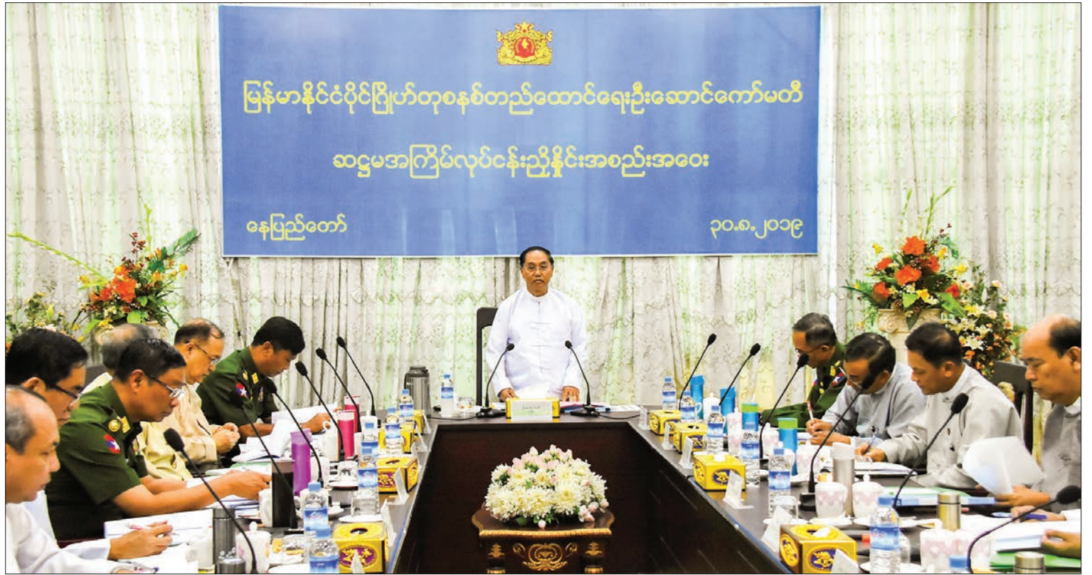
Vice President U Myint Swe addresses the 6 th coordination meeting of the committee on establishing satellite system in Nay Pyi Taw yesterday.

Coordination meetings were held by the steering committee starting from April 2017 and had conducted five meetings where 26 decisions were made. Of these, 19 were conducted and seven were still to be done. Decisions made at the first to fourth meetings were explained in the past meetings. Seven decisions were made in the fifth leading committee meeting out of which five were conducted while two were still being conducted. Of