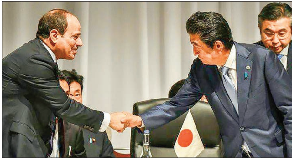
The conference attracted more than 40 top African leaders.

anese Prime Minister Shinzo Abe made a thinly veiled dig at Beijing’s policy, which has come under fire for loading African countries with debt.