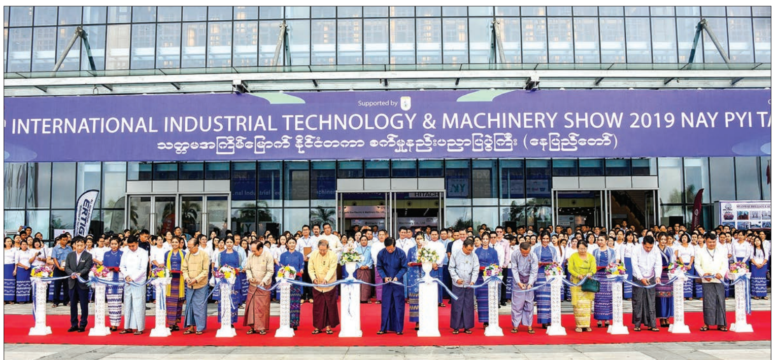
Vice President U Henry Van Thio and dignitaries cut ribbon to open the 7 th Int'l Industrial Technology & Machinery Show" 2019 in Nay Pyi Taw yesterday.

They looked around the exhibition booths of industrial technology companies, Directorate of Industrial Collaboration (DIC), Directorate of Industrial Supervision and Inspection, No. 1 Heavy Industrial Enterprise, No. 2 Heavy Industrial Enterprise, No. 3 Heavy Industrial Enterprise, Myanma Pharma-