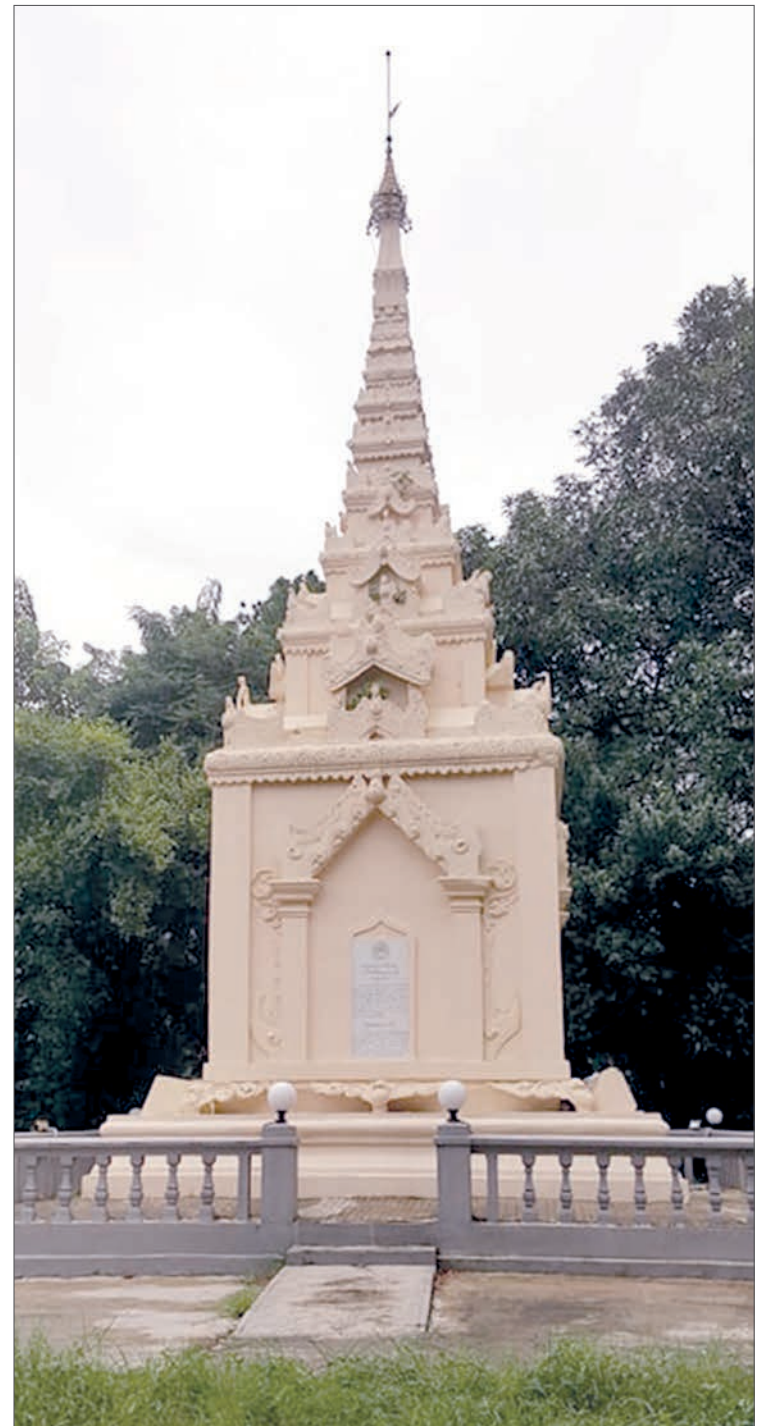
Suphaya Latt's tomb in Kandawmin Park, Yangon.

vember 1925. The corpse was buried at the aforesaid grave. The ceremony was attended by 90 members of the Sangha and British Commissioner Sir Harcourt Butler. At the ceremony, the corpse was honoured by eight white umbrellas and 30-gun salute.