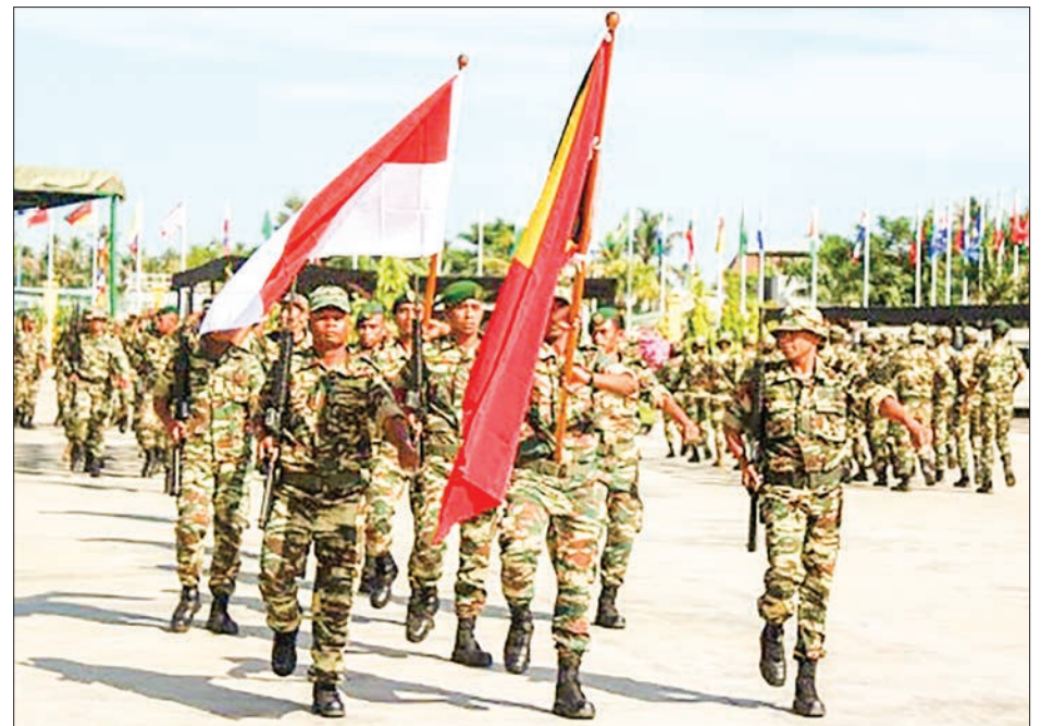
FILE PHOTO : East Timorese troops parade carrying an Indonesian flag seen at left and the East Timor flag at right during rehearsals for the 20 May Independence day celebrations in Dili on 17 May, 2012. PHOTO:AFP

East Timor President Francisco Guterres, who belongs to the opposition, has repeatedly called for new Cabinet nominations.—Kyodo News ■