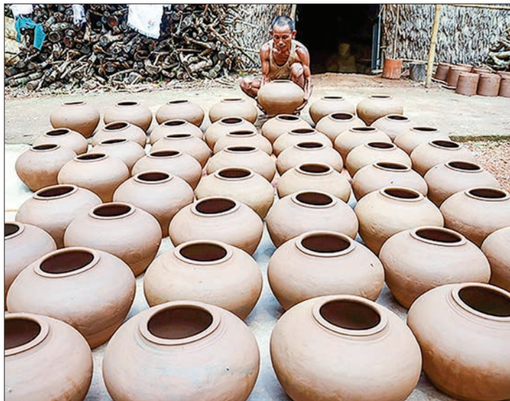
A man drying clay pots in the sun. Informal businesses face hurdles accessing financial support.

"We are making arrangements to issue recommendation letters to 100 more SMEs. We are