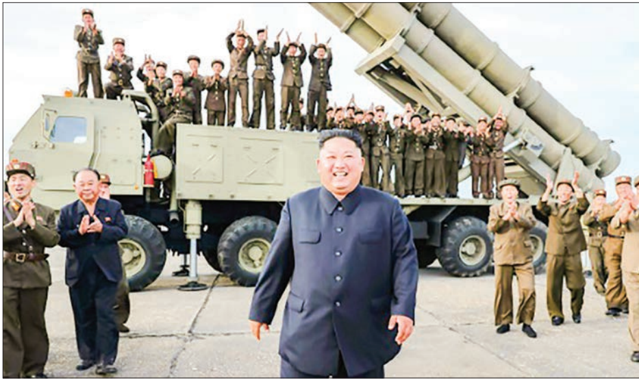
The consolidation of Kim Jong Un's power comes as nuclear talks between Pyongyang and Washington remain gridlocked.