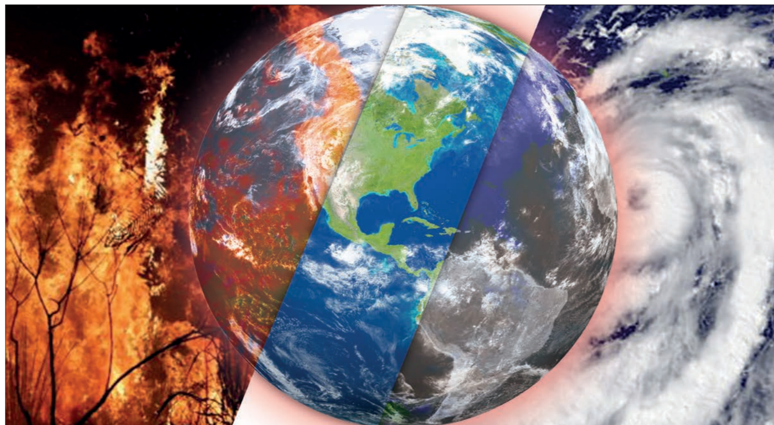
Unless the effects of Climate Change can be mitigated, there is no telling what the future holds for mankind. GRAPHIC IMAGE: BT

Myanmar has been particularly hard hit recently by the emerging weather patterns. Parts of Myanmar have suffered heavy rainfalls while other parts have suffered rising temperatures and droughts. Myanmar's main rivers flow North to South and the multitude of rivulets big and small, flow into the main rivers criss-crossing the whole country. There has been much water flowing into these rivers due to heavy rainfall in most areas. These water resources are a boon for agriculture at normal times but poses grave danger to human settlements and even to agriculture when climate and the weather plays havoc with them. With the heavy rains, rivers are swollen and the water level sometimes exceeds the danger point. Many dams on the major rivers are at the point of overflowing with the excess water flowing through the spillways in large volumes, sometimes threatening to flood and even wash away the