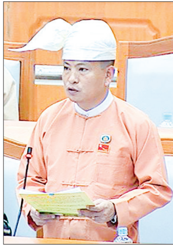
MP U Whey Tin.