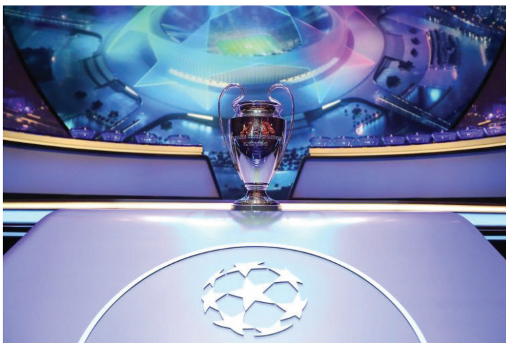
The Champions League group stage draw took place in Monaco on Thursday.

1997 and lost in the final in 2013. Now coached by Antonio Conte, Inter beat Barcelona in the semi-finals en route to winning