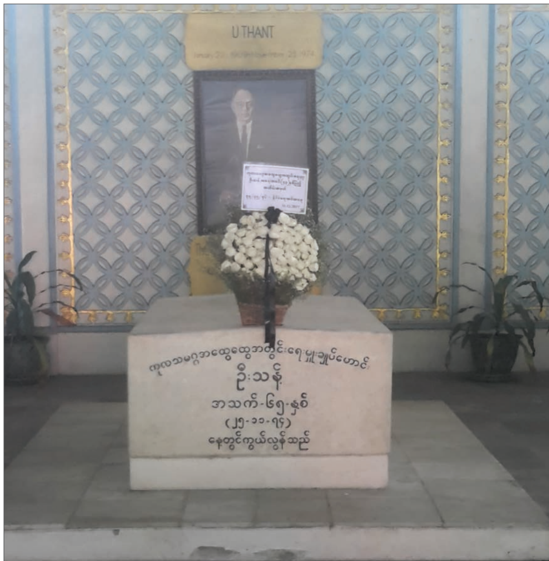
U Thant's tomb in Kandawmin Park, Yangon.

He wrote Galon Dipani articles in Thuriya daily in 1930 when farmer uprisings were led by Saya San, to stand with