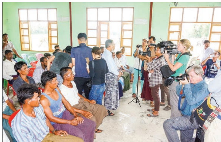
Journalists interview local ethnic Rakhine people, Hindus, and Muslims in Shwezar Village.

have visited the township once in 2016, eight times in 2017, 20 times in 2018, and five times so far this year. —MNA ■