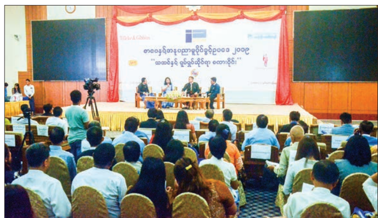
Artistes discuss on Literature and Art Copyright Law 2019 in Yangon yesterday.