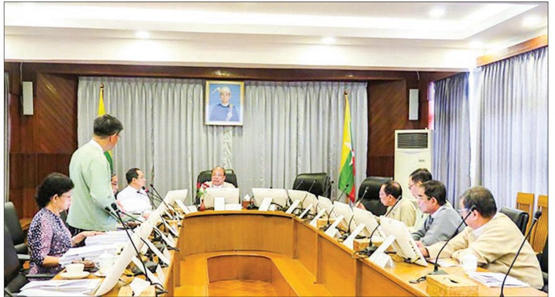
Chairman of the MIC Union Minister U Thaug Tun attends the Myanmar Investment Commission (MIC) meeting (14 / 2019) in Yangon on 30 August, 2019.