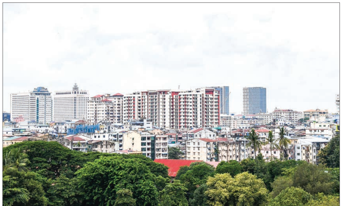
File photo shows an aerial view of Yangon City with high-rise buildings.