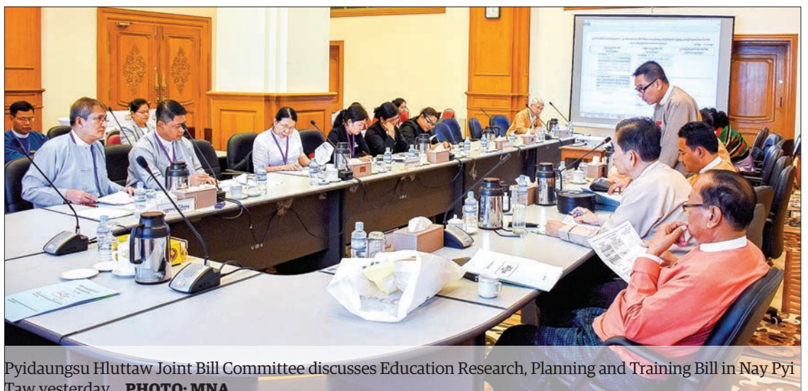
Pyidaungsu Hluttaw Joint Bill Committee discusses Education Research, Planning and Training Bill in Nay Pyi Taw yesterday.