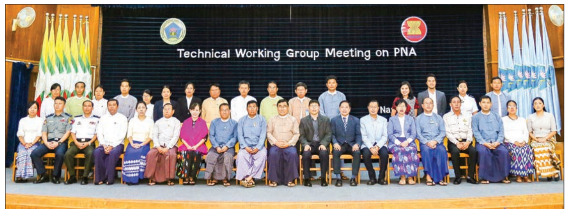
Union Minister Dr Win Myat Aye and attendees pose for a documentary photo at the technical working group meeting on Preliminary Needs Assessment (PNA) in Nay Pyi Taw yesterday.

A TECHNICAL working group met yesterday for the first time to implement ASEAN recommendations in the Preliminary Needs Assessment (PNA) of the ASEAN-Emergency Response and Assessment Team (ASEAN-ERAT), which was approved in April this year.