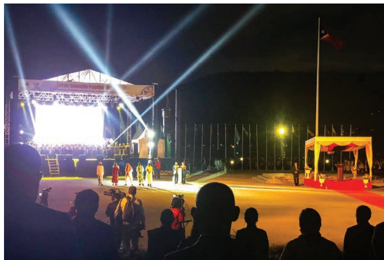
Union Minister for Information Dr Pe Myint attends the celebrations of 20 th anniversary of referendum in Timor-Leste yesterday.

Then, President of Democratic Republic of Timor-Leste Francisco Guterres delivered an opening speech and presented awards to the outstanding persons for the welfare of his country.