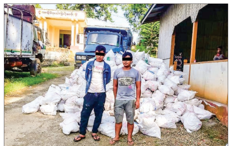
Two suspects arrested with confiscated raw jade stones in Phakant Township of Kachin State.

The Township Police seized the consignment, and initiated