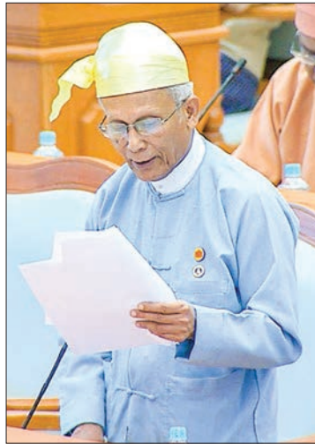
Deputy Governor U Soe Thein.

Money supply growth rate was targeted at 13 per cent for FY 2016-2017 and by end March of FY 2016-2017 it remains within the target at 9 per cent. It was