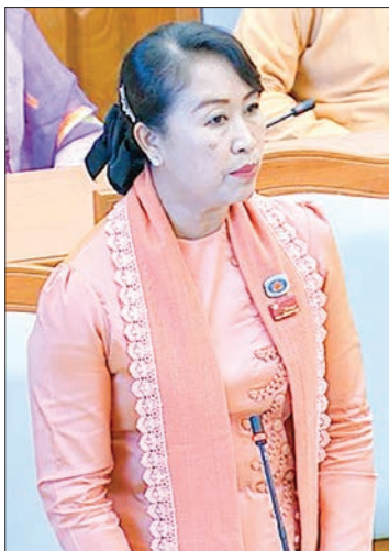
MP Dr Khin Soe Soe Kyi.