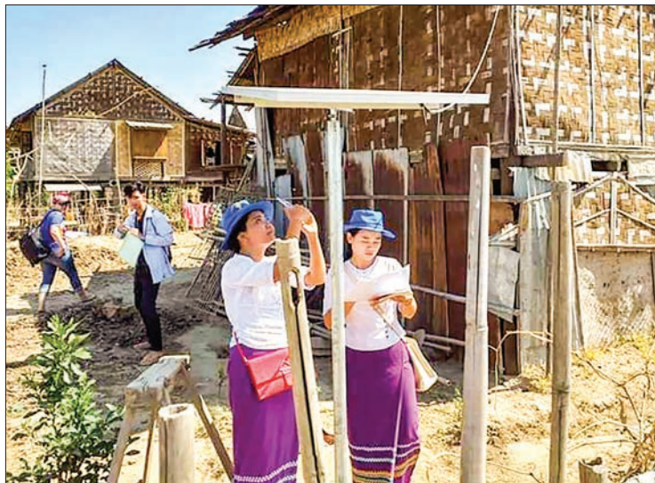
Rural Development Department staff inspect the installation of solar panel system at a village in Pyapon Township.

"Our Rural Development Department is implementing this project to supply electricity to villages which are 10 miles away from the power grid. This project is part of the National Electrification Project. The project will involve two