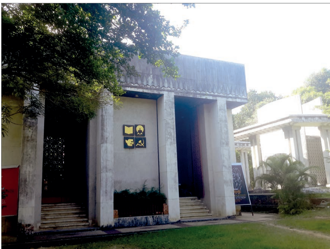
Thakin Kodaw Hmaing Mausoleum Kandawmin Park, Yangon.