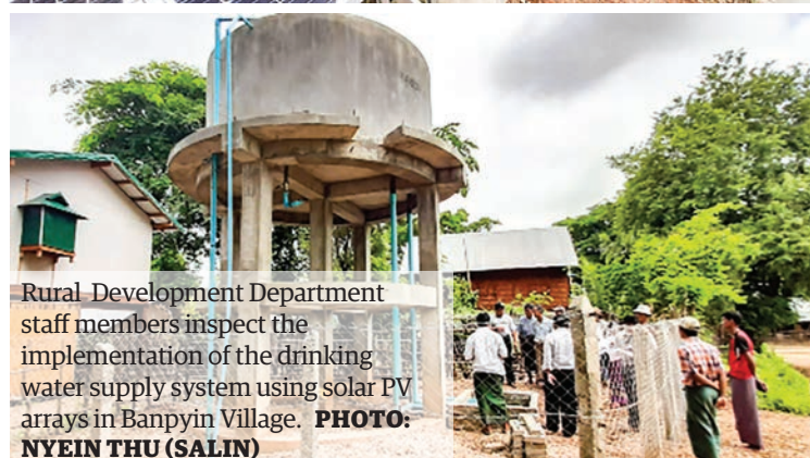
Rural Development Department staff members inspect the implementation of the drinking water supply system using solar PV arrays in Banpyin Village.