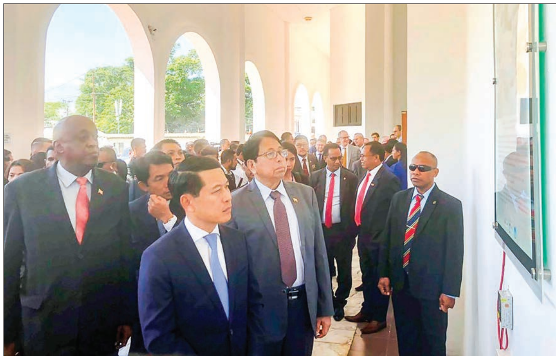
Union Minister Dr Pe Myint looks around at the exhibition of 20 th anniversary of independence referendum in Timor-Leste. PHOTO: MNA