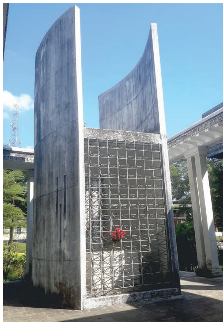
Daw Khin Kyi Mausoleum.