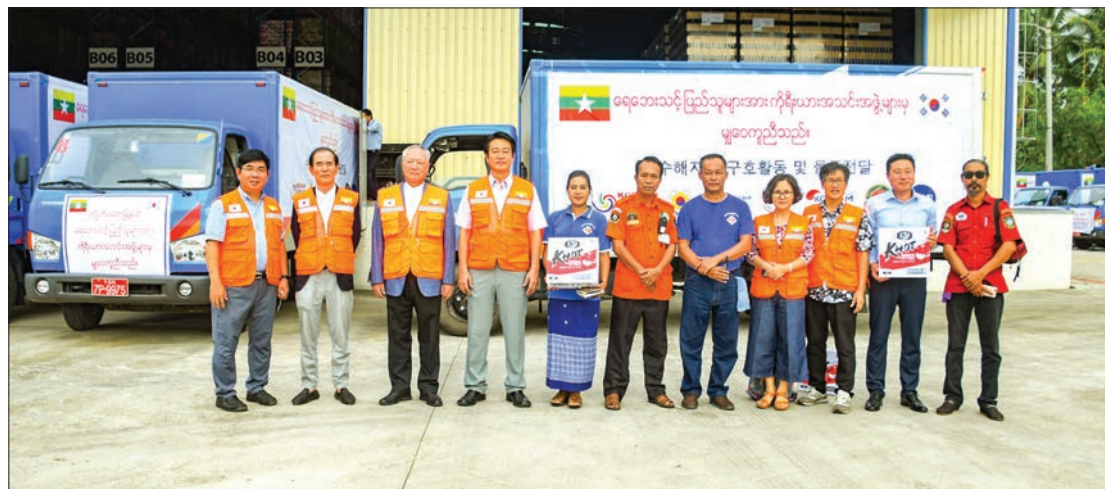
Korean Association in Myanmar donates aids to flood victims in Kyeikmaraw Township, Mon State, yesterday.

KOREAN Association in Myanmar donated aid worth of K60 million to flood affected people in six villages in Kyeikmaraw Township, Mon State, yesterday.