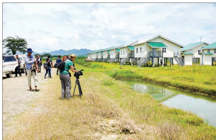
Journalists visit houses for returnees in Kyeinchaungtaung Village.