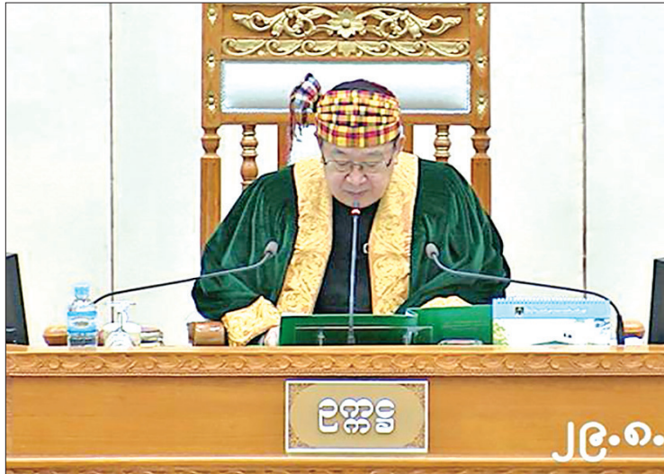
Pyithu Hluttaw Speaker U T Khun Myat.

After obtaining the decision of the Hluttaw, Pyithu Hluttaw Speaker U T Khun Myat announced the Hluttaw agreeing to discuss the motion and announced further for Hluttaw representatives who want to