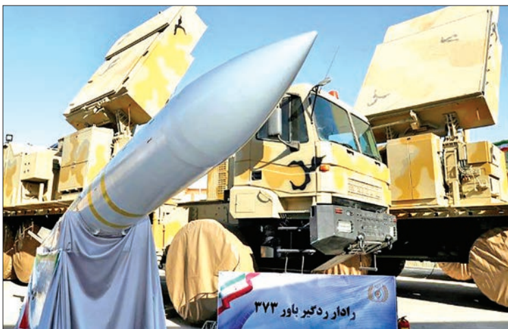
Tehran has breached certain limits on its nuclear production after the US pulled out of the 2015 accord.

“We will always advocate for the full respect by all sides of the UNSC resolutions and that includes the JCPOA,” she said.—AFP ■