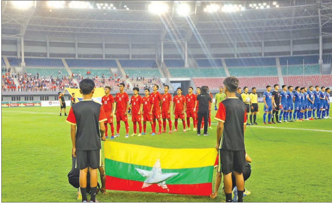
Myanmar national footballers (red) sing the national anthem during the international friendly match against Chinese Taipei team on 19 March at the Mandalay Thiri Stadium in Mandalay.

THE national football teams of Myanmar and China will play a friendly match today in Langfang City, China.