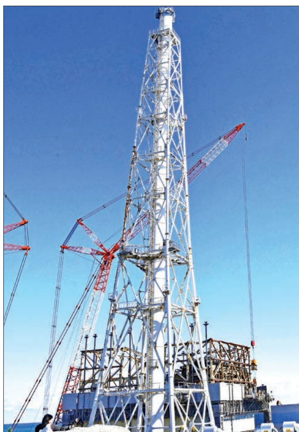
File photo taken in November 2018 shows preparation under way for dismantling an exhaust pipe used by the disaster-hit Fukushima Daiichi nuclear power plant’s No. 1 and No. 2.

Regulators are stepping up scrutiny over tax-saving measures taken by digital hegemony such as Facebook, Apple Inc., Amazon.com Inc. and Google LLC, including transferring locally derived revenues to a unit in a country with lower tax rates.—Kyodo News ■