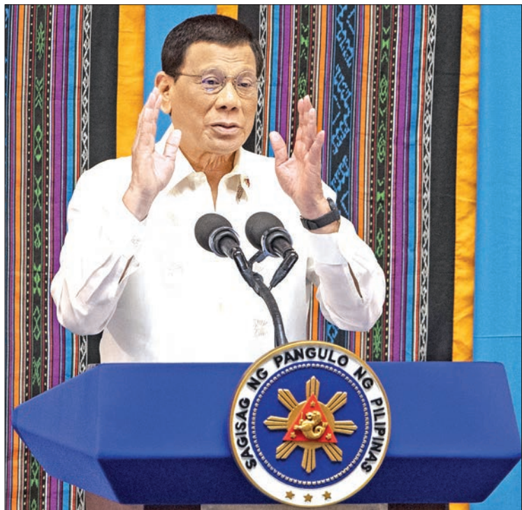
FILE PHOTO: Philippine President Rodrigo Duterte during his State of the Nation on 22 July. PHOTO: AFP