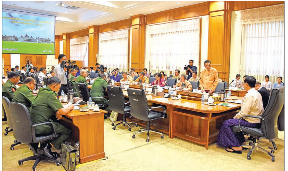
Joint Committee on Amending the 2008 Constitution holds 30/2019 meeting in Nay Pyi Taw.