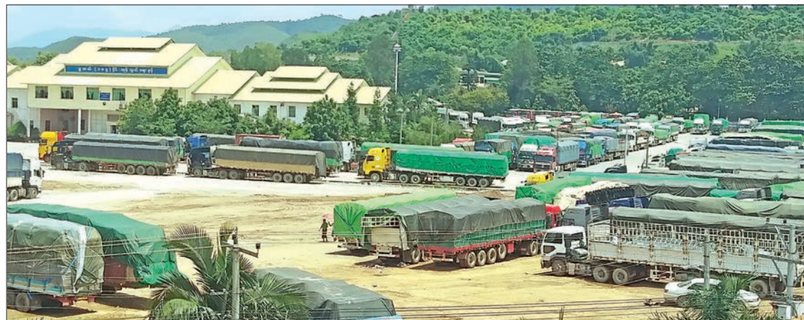
Trucks seen at the 105-mile trade zone in Muse, northern Shan State.

Earlier, Muse and Chinshwehaw gates witnessed trade worth million dollars. At present, the trade value at the gates is estimated to be in just six figures. Trading has halted in some places. The Muse 105-mile trade zone