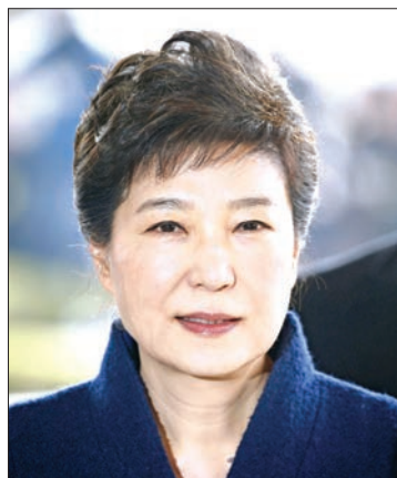
Former South Korean President Park Geun Hye. (File photo)

SEOUL — South Korea’s Supreme Court on Thursday nullified a lower court ruling that sentenced former President Park Geun Hye to 25 years in