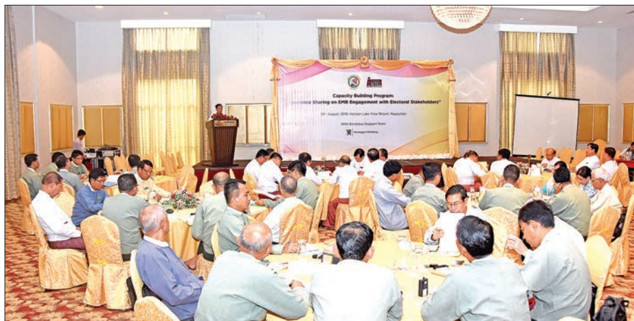
Union Election Commission Chairman U Hla Thein addresses the Capacity Building Program: Experience sharing on EMB engagement with Electoral Stakeholders in Nay Pyi Taw.