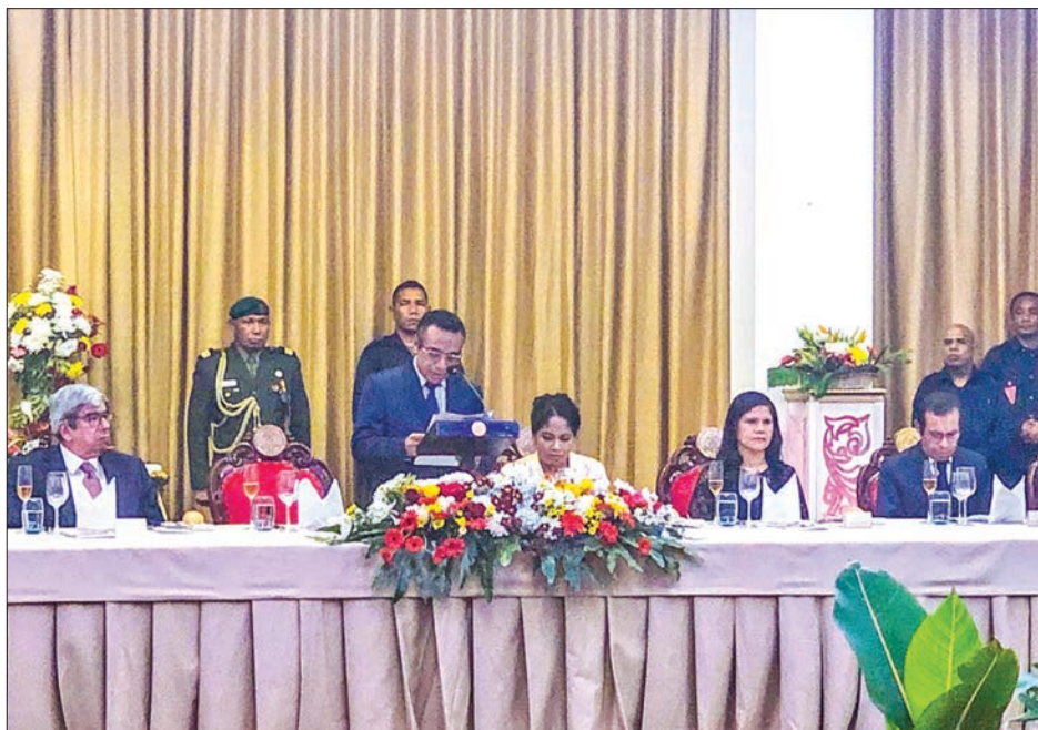
Union Minister for Information Dr Pe Myint attends the state dinner hosted by President Mr Francisco Guterres Lu-Olo and First Lady at the capital Dili of the Democratic Republic of Timor-Leste.