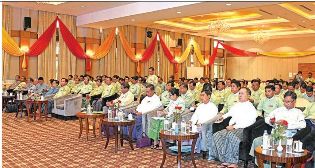
Union Minister U Min Thu delivers the speech at the opening ceremony of second workshop in Nay Pyi Taw yesterday.

THE General Administration Department held a second workshop to identify the detailed plans for implementing the sector-wise projects included in its draft reform framework.