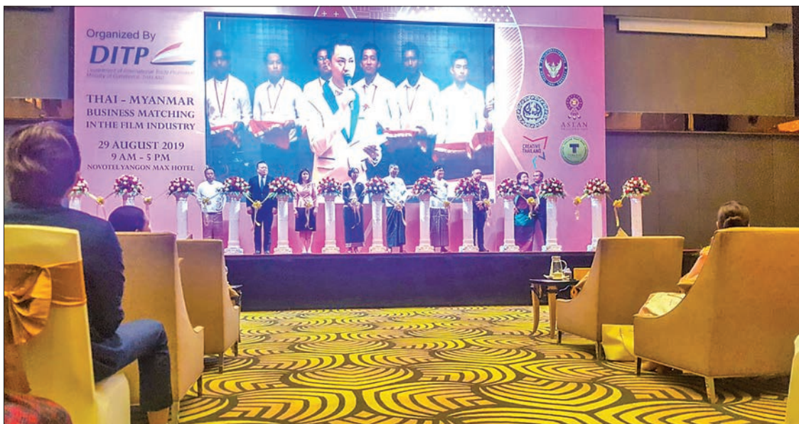
The opening ceremony of 3 rd Thai-Myanmar business matching in the film industry held in Yangon on 29 August.