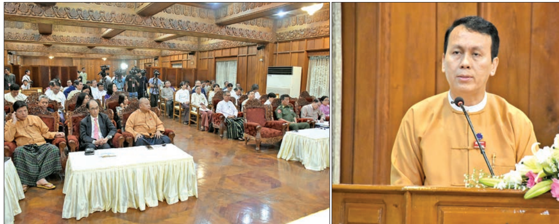
Yangon Region Chief Minister U Phyo Min Thein delivers the opening speech at the signing ceremony for developing housing real estate information system in Yangon.

“Yangon is where migrants mostly come and settle. However, it has no reliable source of real estate information, which leads to difficulties in charting current prices, identifying tax avoidance, and contributes to market instability, so some buyers suffer. It is