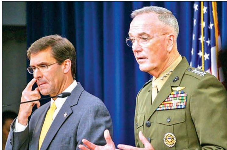
“I’m not using the ‘withdrawal’ word right now,” said General Joseph Dunford, chairman of the US Joint Chiefs of Staff (r), with Defence Secretary Mark Esper by his side.

Defence Secretary Mark Esper, standing next to Dunford, also said a deal with the Taliban must guarantee that Afghanistan “is no longer a safe haven for terrorists to attack the United States.”—AFP ■