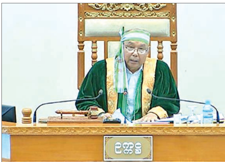
Amyotha Hluttaw Speaker Mahn Win Khaing Than.

In the question and answer session Union Minister for Social Welfare, Relief and Resettlement Dr Win Myat Aye first responded to a question raised by Daw Nan Moe Moe Htwe of Kayin State constituency 4 on arrangements made for people for Kayin State Hlaingbwe Township who were in a camp after displaced by conflicts in Myaing Gyi Ngu. The Union Minister said provision of food and relief goods, health care and health education, security and rule of law and providing education were conducted in cooperation between relevant Union ministerial departments and the State Government. Once the National Strategy for the Closure of IDP Camps in Myanmar was ap-