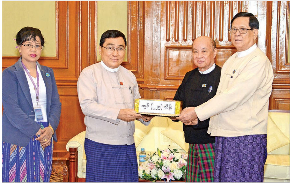
Pyithu Hluttaw Deputy Speaker U Tun Tun Hein and Amyotha Hluttaw Deputy Speaker U Aye Tha Aung hand over cash donations for flooded-affected people to Union Minister Dr Win Myat Aye in Nay Pyi Taw.