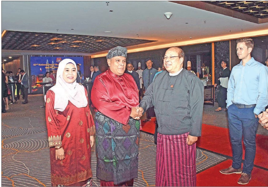
Union Minister U Thaung Tun welcomed by Malaysian Ambassador Mr. Zahairi Bin Baharim at the celebration of 62 nd National Day of Malaysia, 56 th Malaysia Day and 86 th Armed Forces Day in Yangon yesterday.

Bilateral trade between the two countries has also remained strong over the years, reaching some US$ 738 million