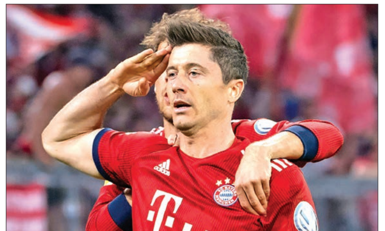
Lewandowski is one of Bayern's highest paid stars.

Lewandowski wrote himself into Bayern folklore by scoring five goals in just nine minutes during a Bundesliga match in 2015.