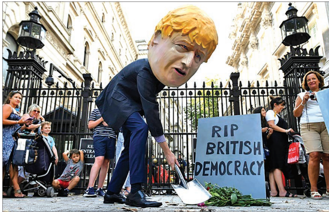
Demonstrators decried Boris Johnson's suspension of parliament weeks before the Brexit cutoff date.

Opponents labelled the suspension a “coup” and a “constitutional outrage” and it prompted immediate court bids in London and Edinburgh to halt the pro-