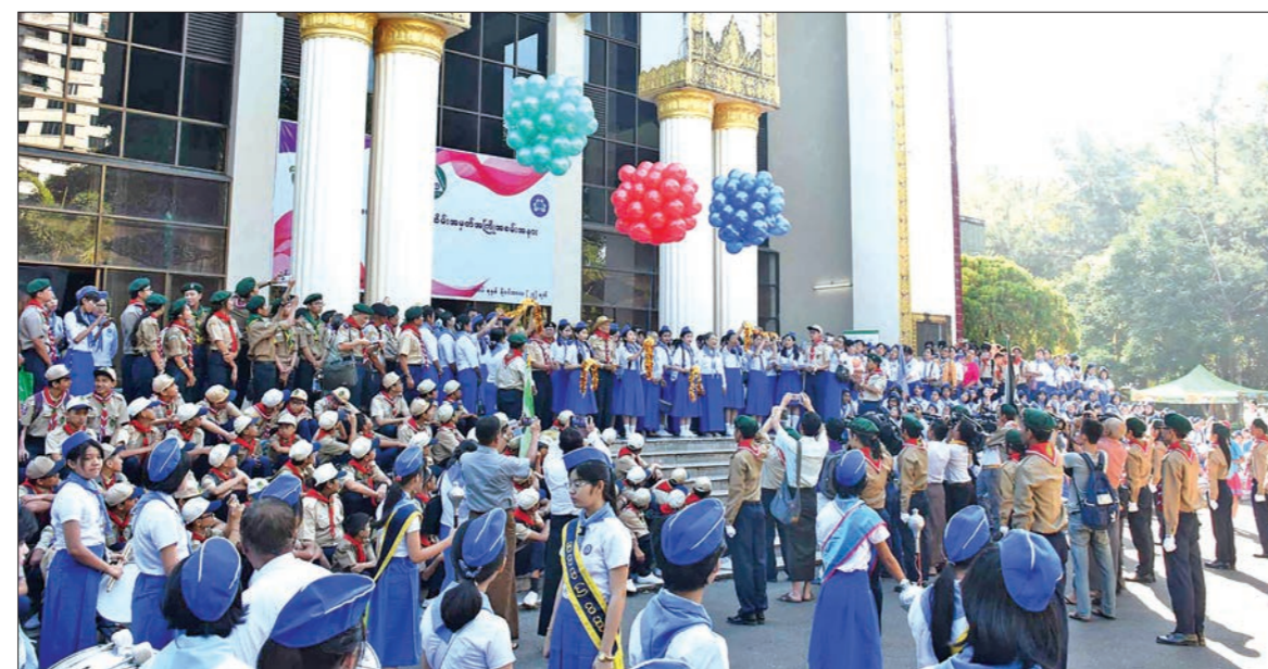
Myanmar scouts pose for photo with dignitaries at National Strategic Planning Workshop.

to help others, they must be independent and always ready for their work. They are trained to be sharp-eyed, active, cooperative, and free from politics. They must become models who are outstanding in their studies, pursuing a simple life, and having a strong determination. Scouting is an inclusive movement.