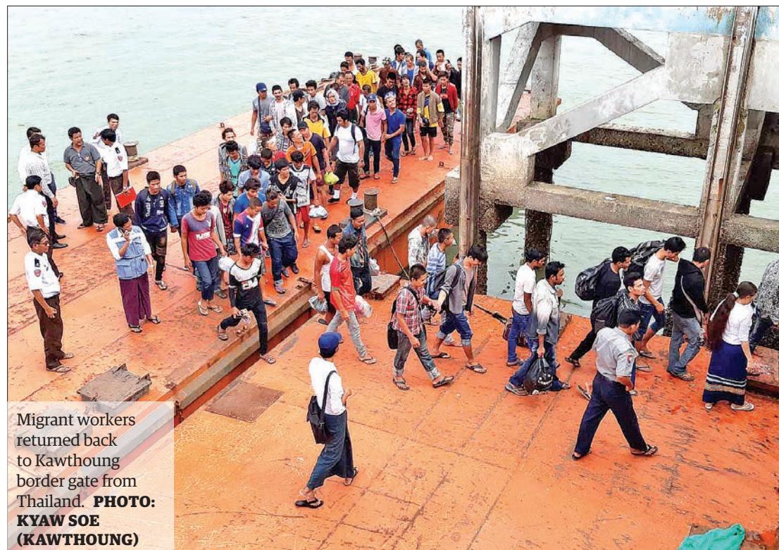
Migrant workers returned back to Kawthoung border gate from Thailand.

A team of officials from the Thailand Immigration Department, led by Myanmar Labor Attache U Kyaw Soe Wai, handed over 78 migrant workers to Myanmar authorities on Wednesday evening at the Kawthoung border gate.