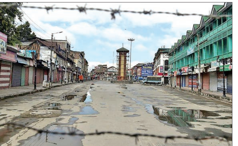
The lockdown in Kashmir began in early August.

Foreign Office, in a statement Tuesday, said it was "extremely concerned by reports that a member of our team has been detained returning to Hong Kong from Shenzhen. We are providing support to his family and seeking further information from authorities in Guangdong Province and Hong Kong." -Kyodo News