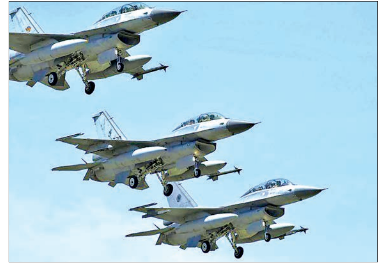
FILE PHOTO: A fleet of Taiwan's F-16 fighter jets fly in formation over the eastern Hualien air base, 17 August, 2004.

"China will take all necessary measures to safeguard our interests including imposing