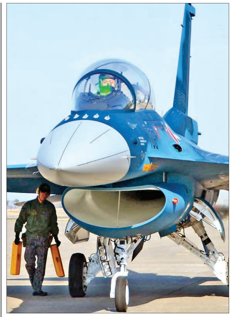
Photo taken in 2015 shows an F-2 fighter jet of the Japanese Air Self-Defence Force.

For every additional kilogram of nitrogen fertilizer per hectare, yields may rise up to five percent, but childhood stunting increases as much as 19 per cent and future adult earnings fall by up to two percent compared to those not affected.—AFP ■