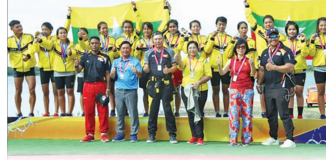
The Myanmar women's boat team celebrate after winning the 2,000-meter small boat race at the World Dragon Boat Racing Championship.

In the women's 2,000-meter Small Boat race, the Myanmar U-24 team won gold (10 minutes and 28.797 seconds), while the Thailand team won silver (10 minutes and 31.854 seconds) and the United States team won the