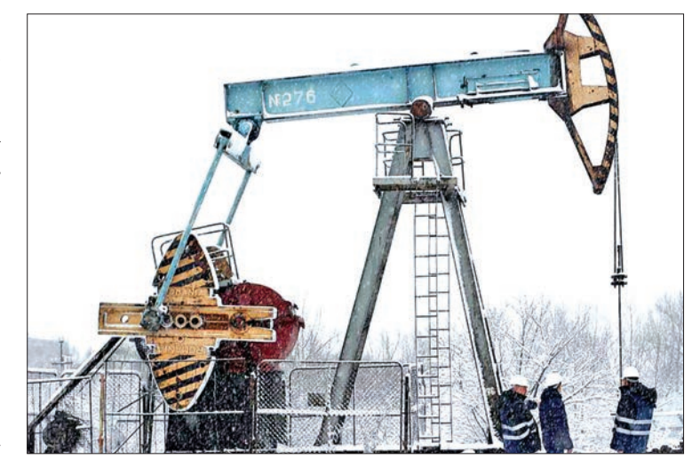
A oil pumpjack hard at work pumping oil.

Unlike petrol and diesel, hydrogen produces no pollution when burned. It is already used by some car manufacturers to power vehicles and may also be burned to generate electricity. But until now the wide-scale roll-out of hydrogen technology has been prohibited by the high