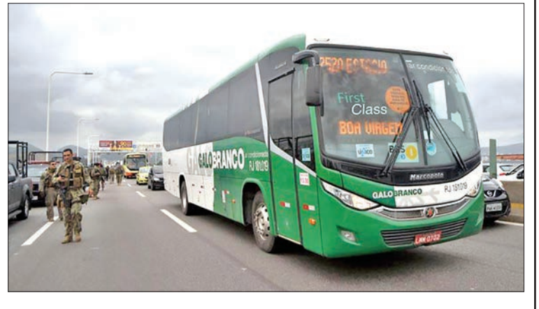
The bus in which a gunman held 31 hostages before being shot dead by police is being taken away, in Rio de Janeiro, Brazil, on Tuesday.

A live broadcast of the scene showed several ambulances parked nearby, receiving hostages as they were released one by one.—AFP