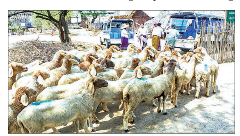
Loans granted under the Emerald Green project to breeders is helping to boost livestock sector in rural area of Myanmar.

LOANS granted under the Emerald Green project to breeders have helped boost the livestock sector this year, according to Daw Khin Soe Win, the head of