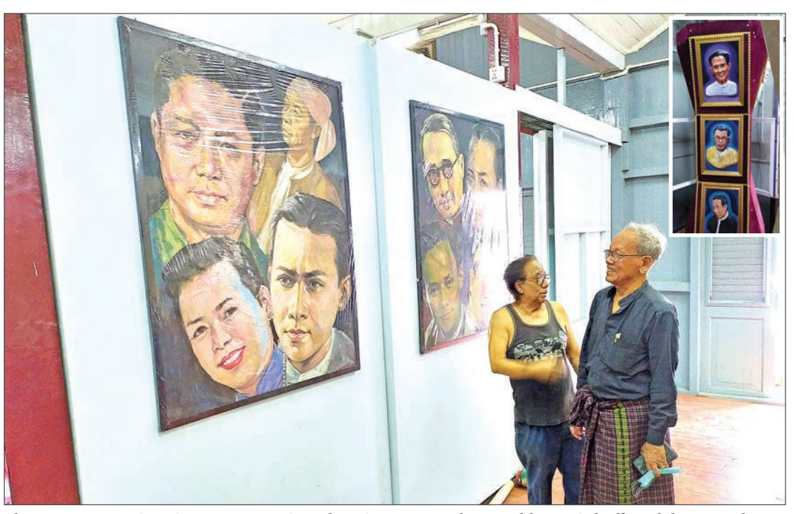
The Myanmar Motion Picture Museum is undergoing an upgrade to enable movie buffs and the general public to learn about the history of Myanmar movies.

"The MMPM plans to showcase the history of Myanmar movies. Currently, we are doing the renovation. The renovation is expected to be completed in October. As it is a historical museum, we have to be careful while conducting research. So, it will take a bit more time. This museum will showcase the history of movies. The museum will be visited by actors and audiences as well as the general public. As history can be forgotten after a long time has passed, we