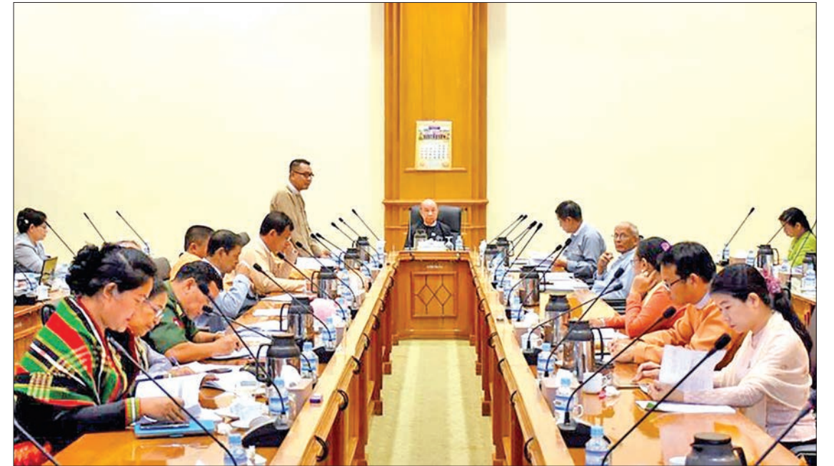
Pyidaungsu Hluttaw Joint Bill Committee meeting in progress in Nay Pyi Taw yesterday.