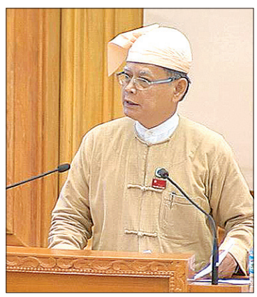
MP U Aung Min.

The Deputy Minister said they collected funds from the ministry's various departments and handed over K400 million to their general excess funds and received permission from the Ministry of Planning and Finance to purchase the radios through a call for tender in the Kyemon Daily.