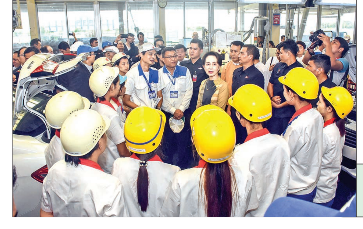
(Translated by Aung Khin)

The Thilawa SEZ has provided over 20,000 jobs to workers including over 9,000 permanent workers at factories. The 405-hectre Zone A was launched for commercial purpose on 23 September 2015, and 87 firms have been permitted to do their business there. The Zone B has been implementing phase by phase and 18 business firms have been approved for this area.—MNA