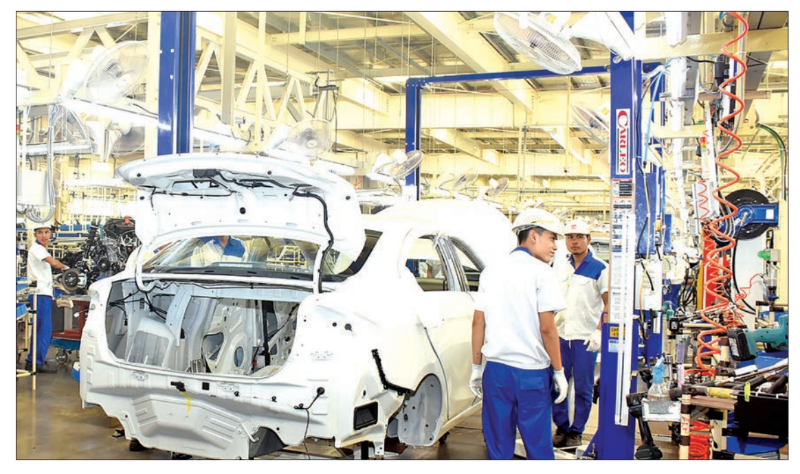
Workers are seen at the assembly line of the Suzuki Thilawa Motor Co. Ltd at Thilawa SEZ.

Companies in the promotion area of the Thilawa Special Economic Zone (SEZ) accounted for over 75 per cent of the total investment. A company exporting at least 75 per cent of the production, in terms of value, is deemed a Free Zone investor and is exempt from corporate tax for 7 years from the time it starts commercial operations. Companies such as logistics which support export-oriented manufacturing can also be considered free zone companies. Domestic-oriented manufacturing companies are regarded as promotion zone companies, and they are eligible for a five-year tax holiday on corporate tax.