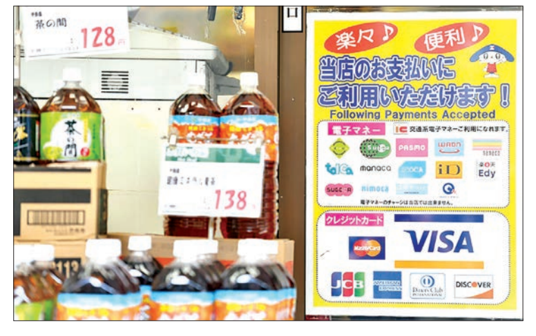
Payment cards are used for small transactions such as at vending machines or convenience stores but cash remains king.

At Katsuyuki Hasegawa's bike repair shop customers are