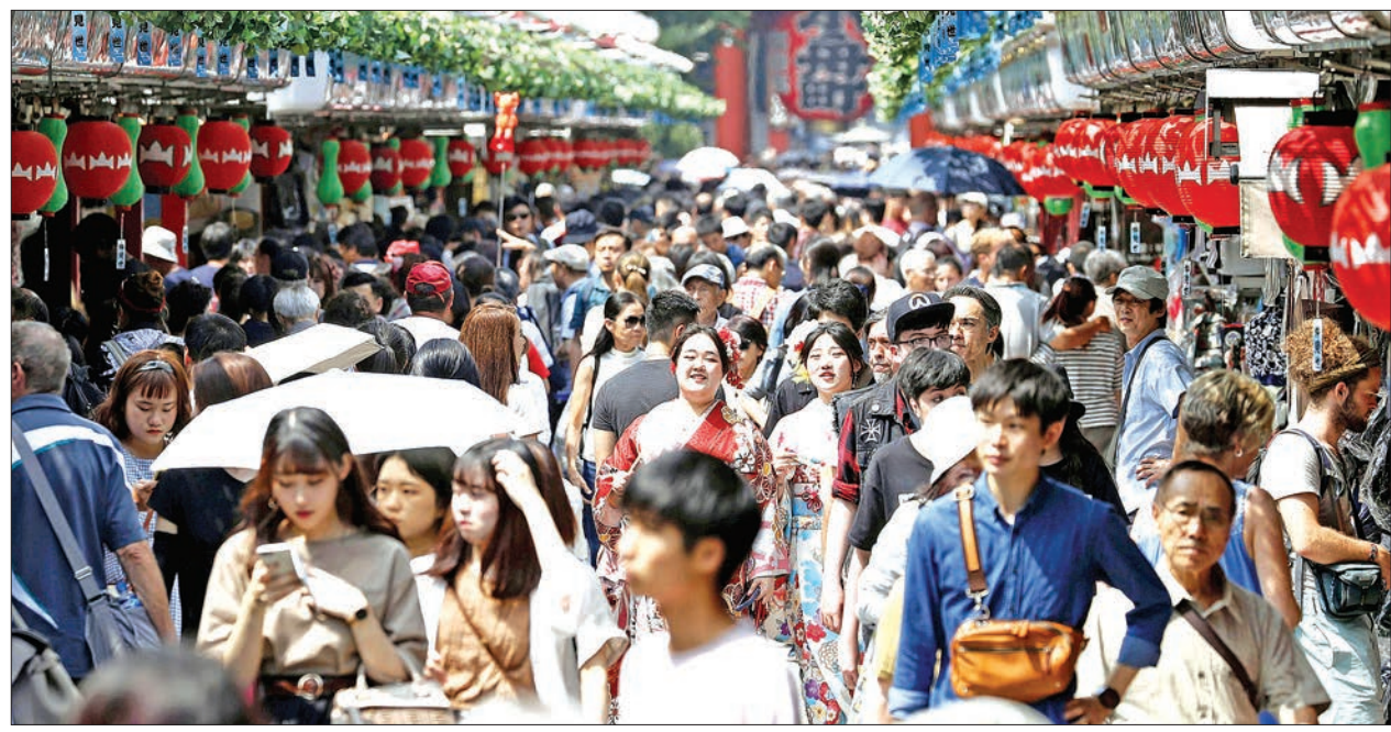
Nakamise shopping street in Tokyo's Asakusa district is crowded with tourists.

The row over wartime labor that developed into a tit-for-tat trade dispute has led to cancellations or reductions of flights linking cities in the two countries and affected new hotel bookings by South Koreans. —Kyodo News ■