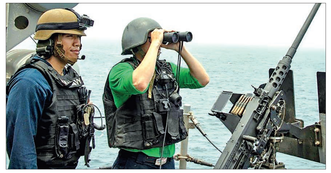
The US Navy is already keeping watch on the Strait of Hormuz and trying to build a coalition of partners to help.

Washington has since July called on around 60 countries including Japan to join its operation to secure the narrow waterway, one of the most volatile transit routes for the