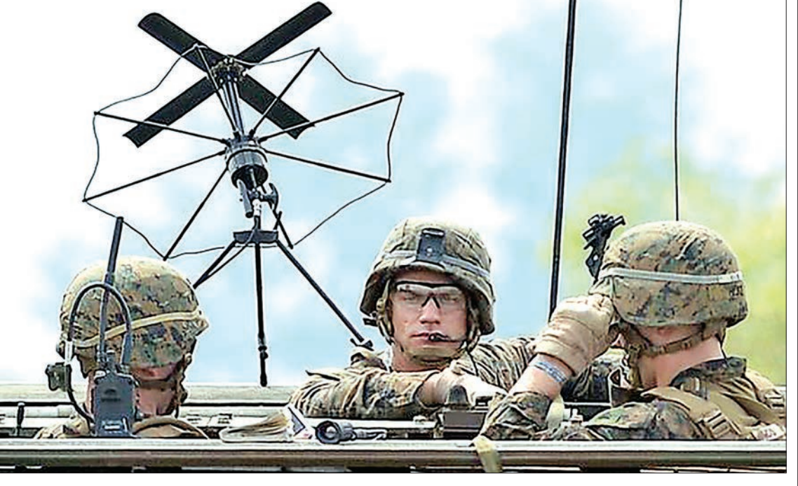
FILE PHOTO: US marines on exercise from their base in Okinawa, Japan.

He also pointed out the importance of improving ties between Japan and South Korea and beefing up their cooperation, as the United States shares the same perception with the two Asian allies that North Korea is a "near-term threat" and China is a "long-term strategic threat to stability in the region and the world." The force realignment plan revised by Japan and the United States in 2012 stipulates that approximately 9,000 of the about 19,000 Marines in Okinawa will be relocated outside Japan, to such places as Guam and Hawaii.--Kyodo News