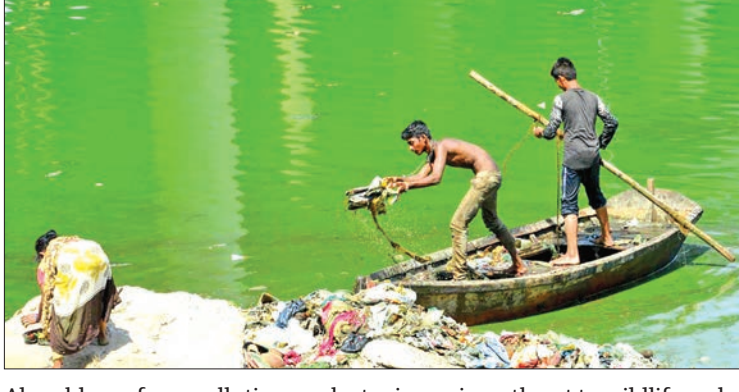
Algae bloom from pollution can be toxic, posing a threat to wildlife and people.

Japan has been considering co-developing the future fighters with US or British companies, the sources said, noting US defence giant Lockheed Martin Corp. may be the top option for a partner. A "hybrid model" of the US military's stealth F-22 and F-35 fighter jets, both of which Lockheed Martin was engaged in developing, is thought to be a possibility.—Kyodo News