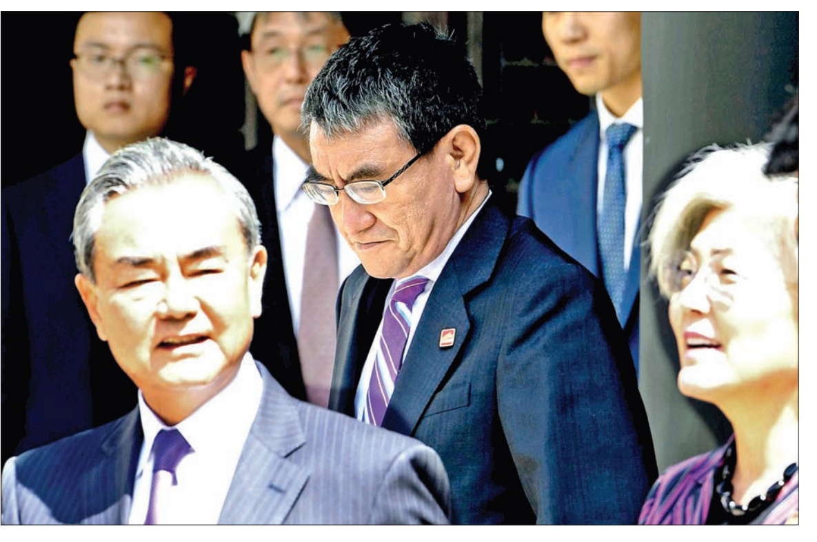
(From I) Chinese Foreign Minister Wang Yi, Japanese Foreign Minister Taro Kono and South Korean Foreign Minister Kang Kyung Wha are pictured after their talks in Beijing on 21 August, 2019.

accelerate negotia-- asks Japan and South tions to reach regional free trade agreements.--Kyodo News