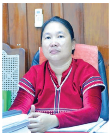
Yangon Region Minister for Kayin Ethnic Affairs Naw Pan Thinzar Myo.

At the same time, we are trying out utmost to create a more attractive and foreign in-