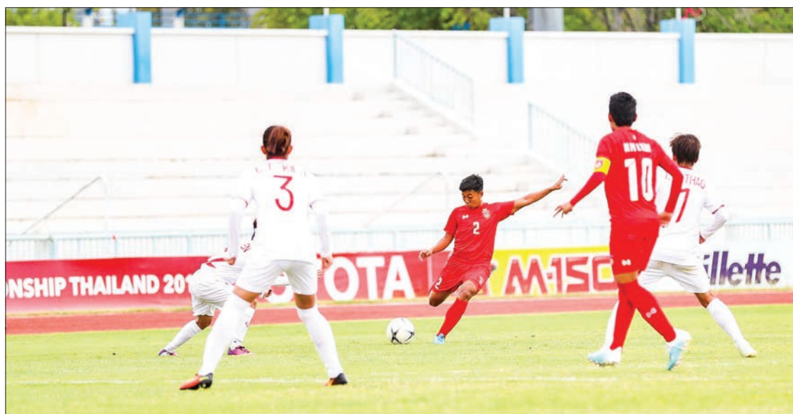
A Myanmar player (red) prepares to kick the ball during the group stage match of the AFF Women's Championship 2019 against Viet Nam in Thailand on 20 August.