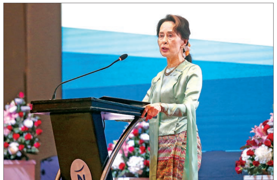
State Counsellor Daw Aung San Suu Kyi addresses the Myanmar-Japan-US Forum on Fostering Responsible Investment in Yangon on 20 August 2019.

A FORUM to discuss fostering responsible investment took place at Novotel Yangon Max Hotel in Yangon yesterday morning.