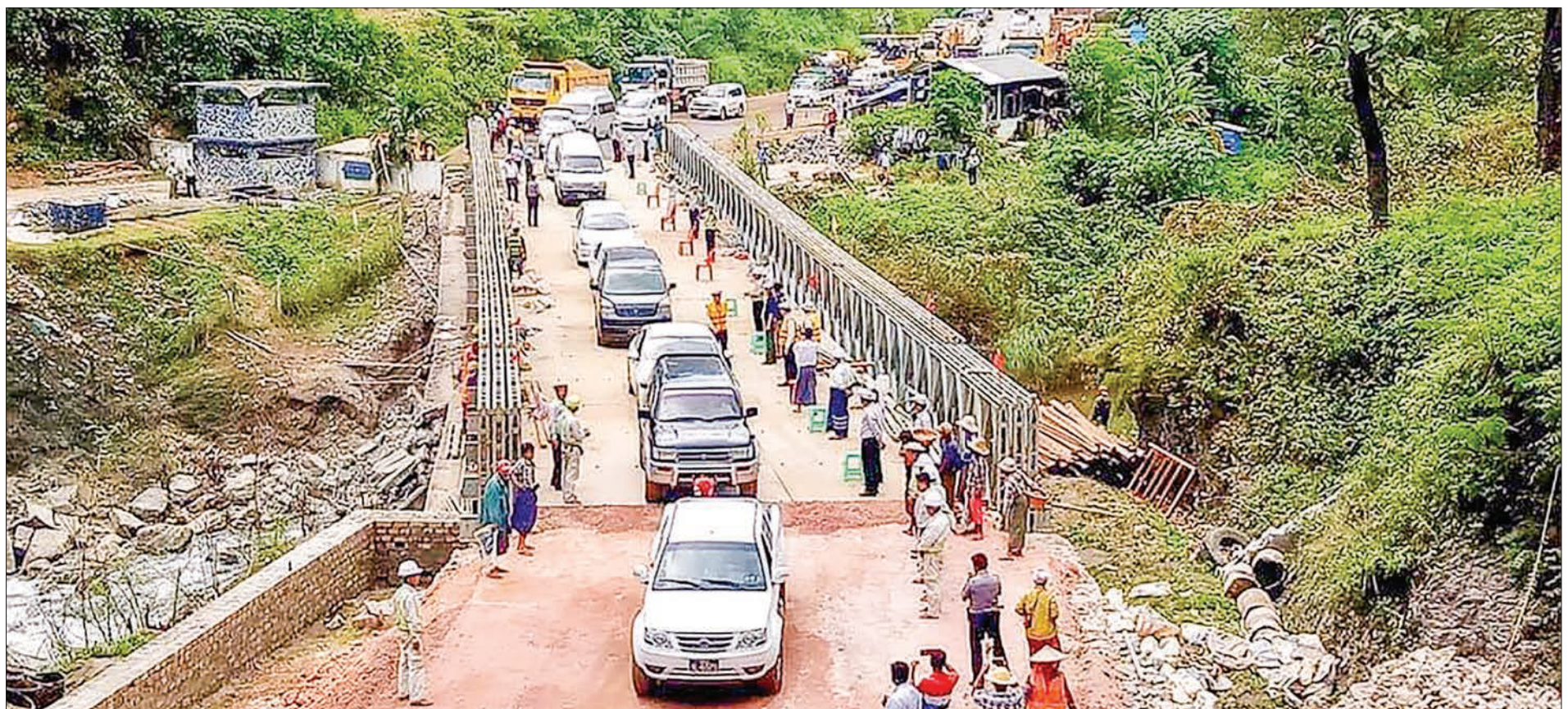
Traffic returns to normal on Gote Twin Bridge on the Mandalay-Lashio-Muse Union Road on 20 August 2019. (NEWS ON PAGE-1)