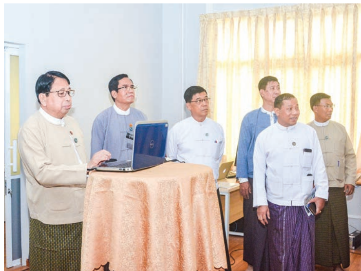
Union Minister for Information Dr Pe Myint opens the News Room of the website of the Ministry of Information yesterday.

The Union Minister then gave advice on securing securing rights to state information and the easy flows of news and information. The officials are instructed by the Union Minister to do more research and