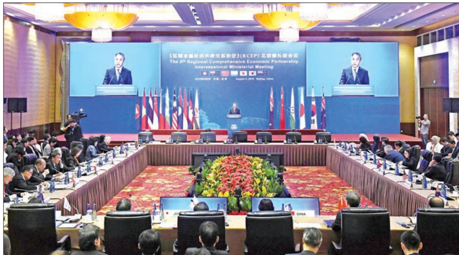
Ministers from 16 Asia-Pacific countries begin talks in Beijing on 3 August, 2019, aimed at concluding the Regional Comprehensive Economic Partnership agreement.

BANGKOK — Amid concerns over rising trade tensions and uncertainty about global economic growth, officials of 16 Asia-Pacific countries have voiced their commitment to speeding up negotiations for an Asia-wide free trade pact, with the hopes of concluding it by November, Thailand said Tuesday.