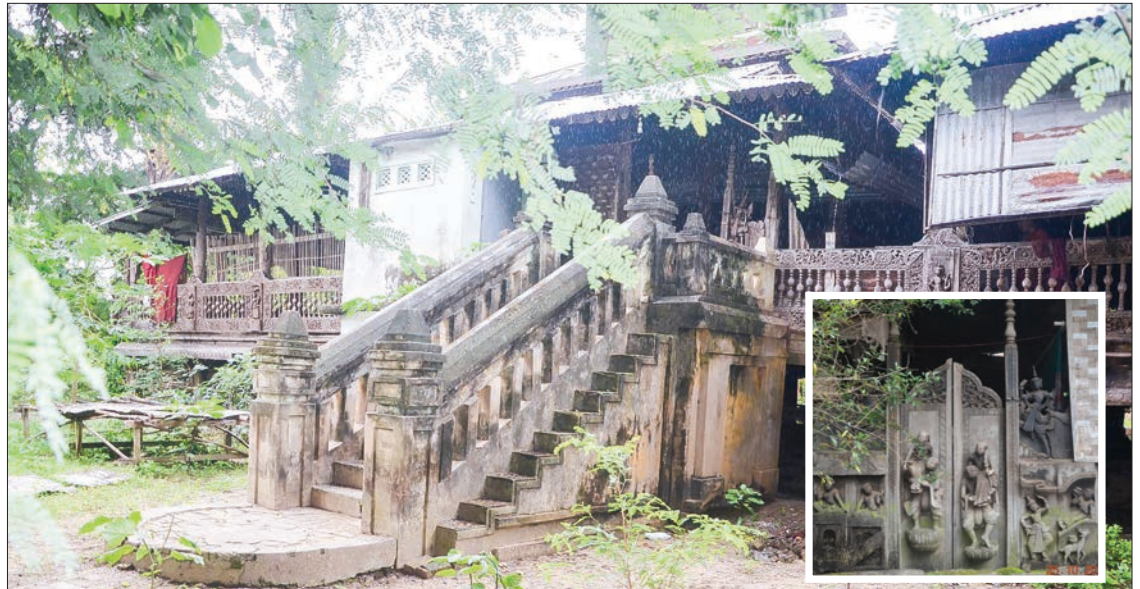
Yokesone Kyaung with woodcarvings is the oldest surviving monastery.

"Although there are many Bagan-style buildings in Magway Region, few local travellers visit the region. Therefore, we are making arrangements for one-day trips for local and foreign travellers so they can visit Yokesoan Kyaungs in Saku and Pwintbyu townships, and observe the unique traditional hairstyle, known as sayitwaine, worn by young girls in Yayboatgyi Village of Pwintbyu Township. Currently, the trip plan is being drawn by My Apex Tour Company in Magway Region with the help of with Yangon tour companies. The tour companies will initially visit the regions to include them in their trip plans. I will be