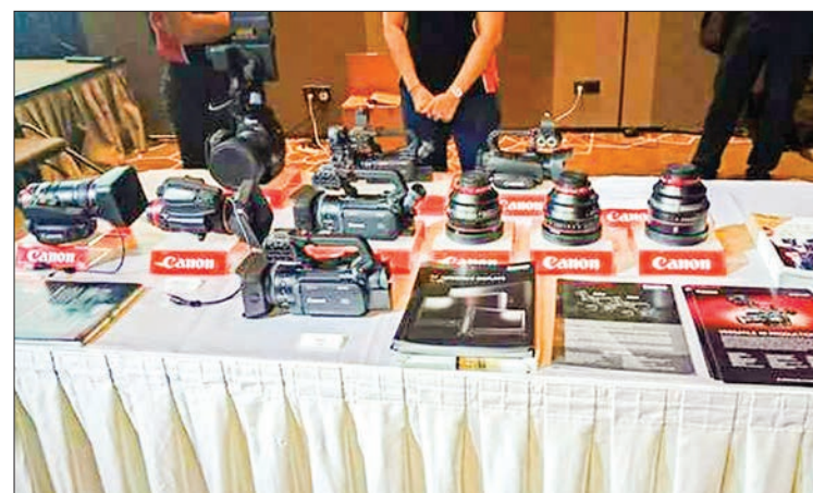
Canon cameras displaying at the event.

Canon products were imported and distributed in Myanmar by Myanmar Golden Rock International Co., Ltd.—GNLM