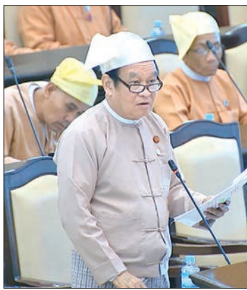
Union Minister for Health and Sports Dr Myint Htwe.

In the asterisk marked question session, Dr Kyaw Ngwe of Magway constituency 10 asked if there was a plan to establish sub rural health centres in remote villages of Yesagy Township. Union Minister for Health and Sports Dr Myint Htwe replied that of the remote villages in Yesagy Township, 23 were found to be populated sparsely and thus there was no plan to establish sub rural health centres there. However planning and organization setup group had already agreed to setup a sub rural health centres in