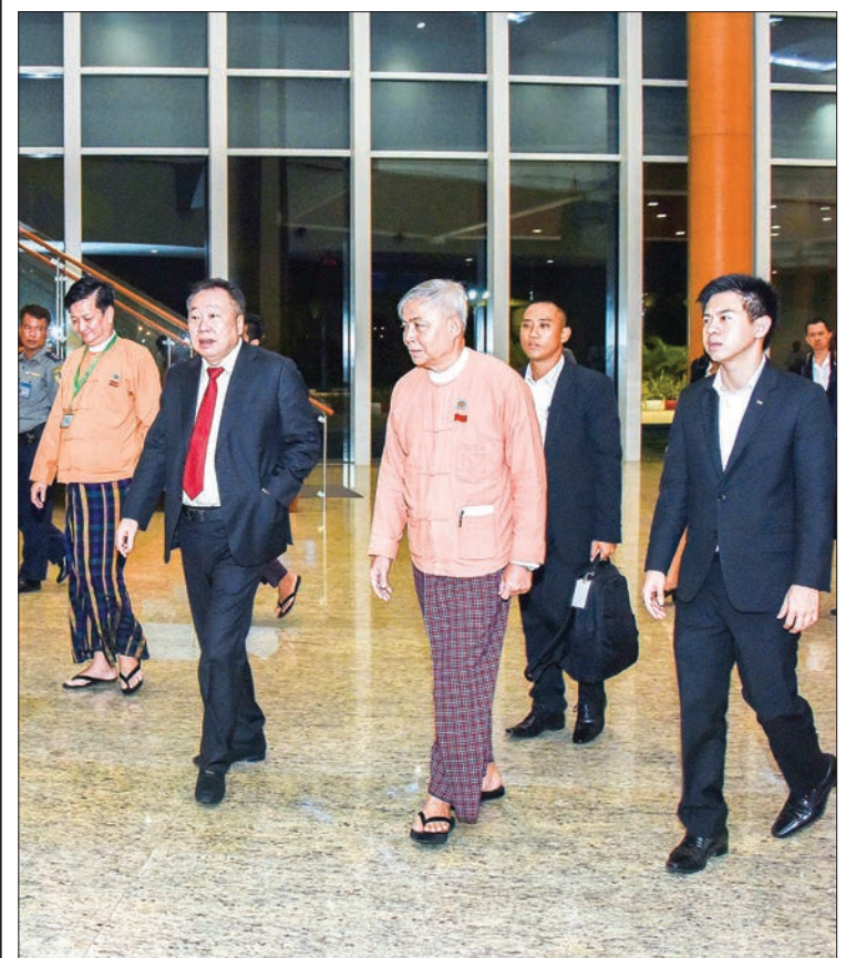
First Deputy Speaker of the House of Representatives of the National Assembly of Thailand Mr Suchart Tonjaroen leaves Nay Pyi Taw yesterday.

MR SUCHART TONJAROEN, the First Deputy Speaker of the House of Representatives of the National Assembly of Thailand, and party concluded the two-day goodwill visit in Myanmar yesterday.