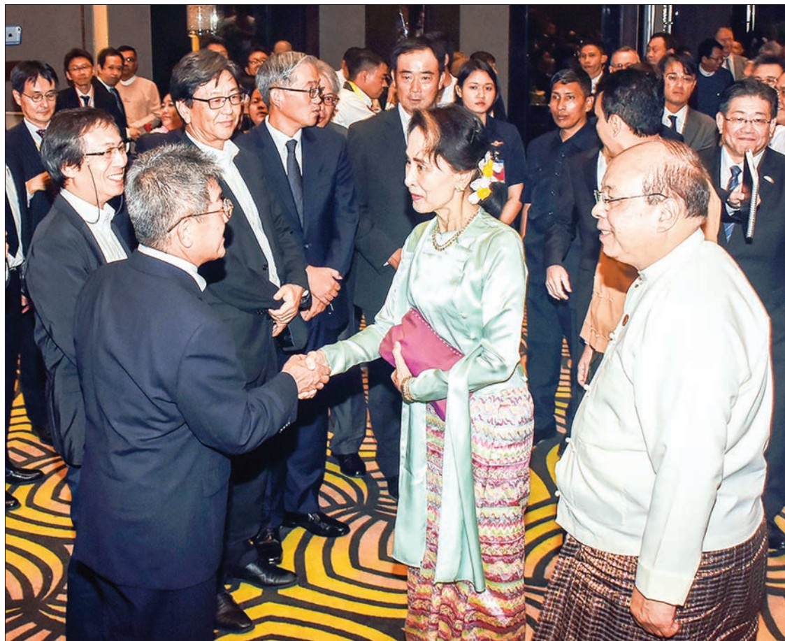
State Counsellor Daw Aung San Suu Kyi greets investors from Japan and US at the Myanmar-Japan-US Forum in Yangon yesterday.