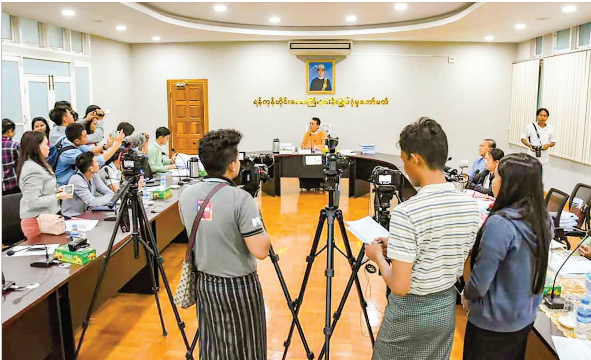
The Yangon Region Chief Minister answers the queries raised by journalists.