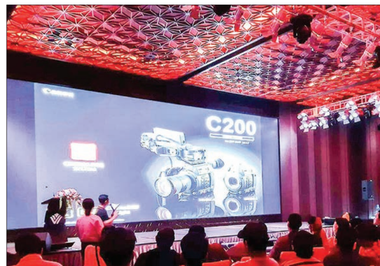
An official explains about the function of the 4KUHD Canon Cinema C200 Video Camera.

Construction of the project is slated to start by the end of September this year and is expected to create around 100,000 job opportunities.