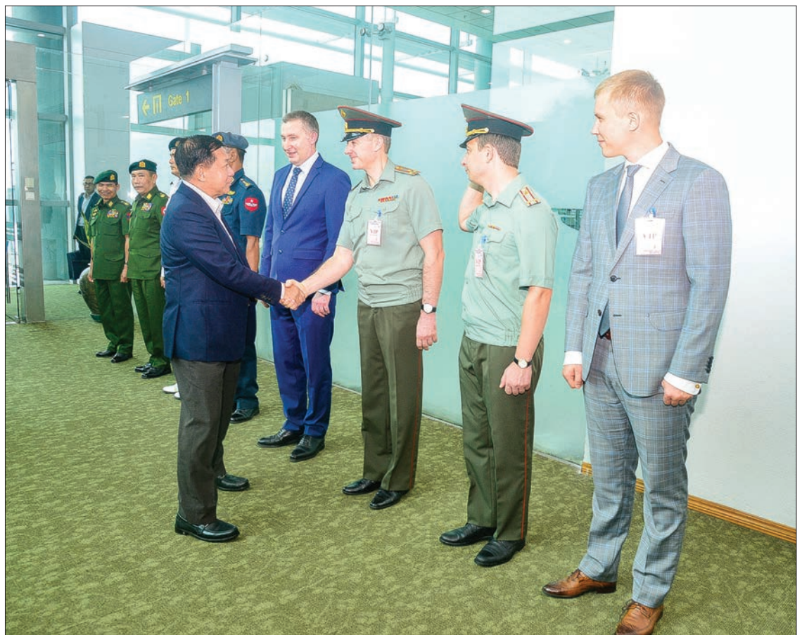
Senior General Min Aung Hlaing seen off by Russian Deputy Minister of Defense Colonel General Alexander V. Fomin and officers at Domodedovo International Airport.