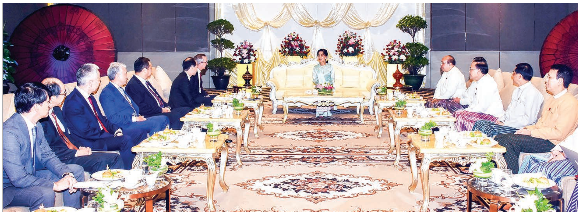
State Counsellor Daw Aung San Suu Kyi meeting with ambassadors, representatives of the respective embassies from Japan and the US at the Myanmar-Japan-US Forum in Yangon yesterday.