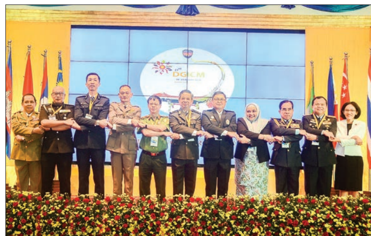
Participants pose for a documentary photo at the 23 rd ASEAN Directors-General of Immigration Departments and Heads of Consular Affairs Divisions of Ministries of Foreign Affairs Meeting (DGICM) in Nay Pyi Taw.

The 23 rd DGICM is held together with its related meetings of the 3 rd ASEAN Heads of Major Immigration Checkpoints Forum (AMICF) and the 14 th ASEAN Immigration Intelligence Forum (AIIF) on 19 th August and the 14 th DGICM + Australia Consultation.—MNA (Translated by Aung Khin)