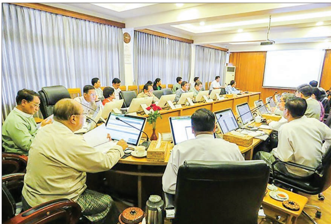
The Myanmar Investment Commission (MIC) meeting (13 2019) convened at the meeting room of the MIC on the morning of 13 th August 2019 in Yangon.

and the majority of foreign investment flowed to manufacturing and industrial sectors. “Yangon Region Chief Minister U Phyo Min Thein said that he wants to make Yangon into an environmentally friendly and livable city. In addition he also pledged to implement a plan to promote foreign investment in the region, he added.