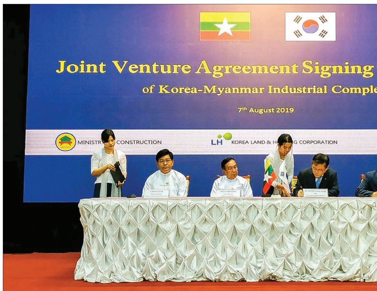
Myanmar’s Urban and Housing Development Department signed an agreement with Korea Land and Housing Corporation to jointly establish a US$ 110-million industrial complex in Hlegu Township 7 August.

More than half of foreign investment inflows into Yangon Region this fiscal year came from China, said an official from the Yangon Region Investment Committee. “Yangon Region welcomed 113 foreign investment projects in the current financial year in which 65 projects were from China. China topped the list of foreign investors in Yangon Region,” he said. He continued that foreign investment in Yangon Region during this fiscal year totaled over US$ 210 million