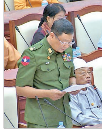
Deputy Minister for Home Affairs Maj-Gen Aung Thu.

The detailed policy for pardons and amnesties were kept as secret for the country's stability but the pardons and am-