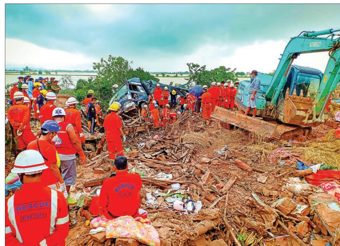
Firemen carrying out rescue operations in landslide affected area in Paung.