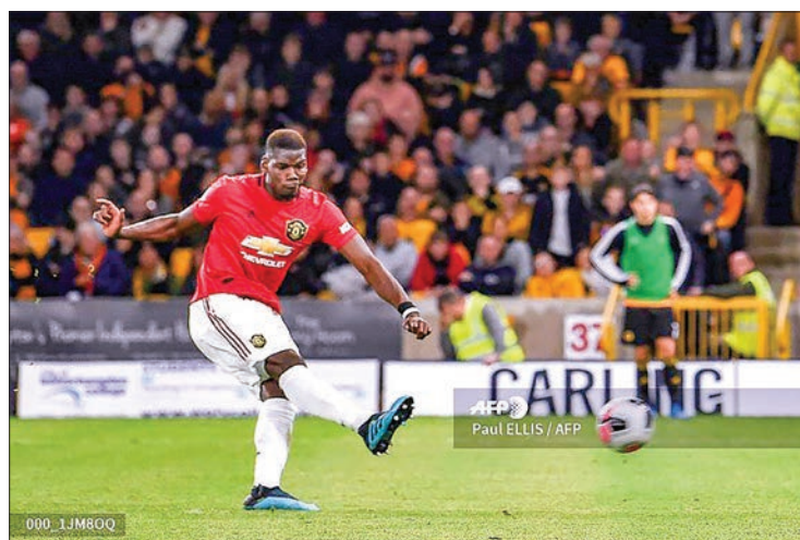
Paul Pogba received racist abuse on social media after missing a penalty against Wolves.

LONDON (United Kingdom)— Manchester United said they "utterly condemn" the racist abuse their World Cup-winning midfielder Paul Pogba received after he missed a penalty in the 1-1 draw with Wolverhampton Wanderers on Monday.