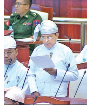
MP U Nyan Tun.

In replying to a question raised by U Ye Lwin of Ahlon constituency on a plan to construct police hospitals in cities like Yangon and Mandalay to provide health care for police personnel and their families, Deputy Minister for Home Affairs Maj-Gen Aung Thu explained that arrangements were made to employ a total of 2,610