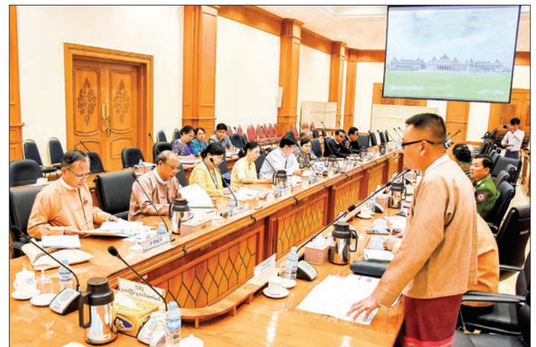
Pyidaungsu Hluttaw Joint Bill Committee holds the meeting on the Union Budget Bill for 2019-2020 FY yesterday.