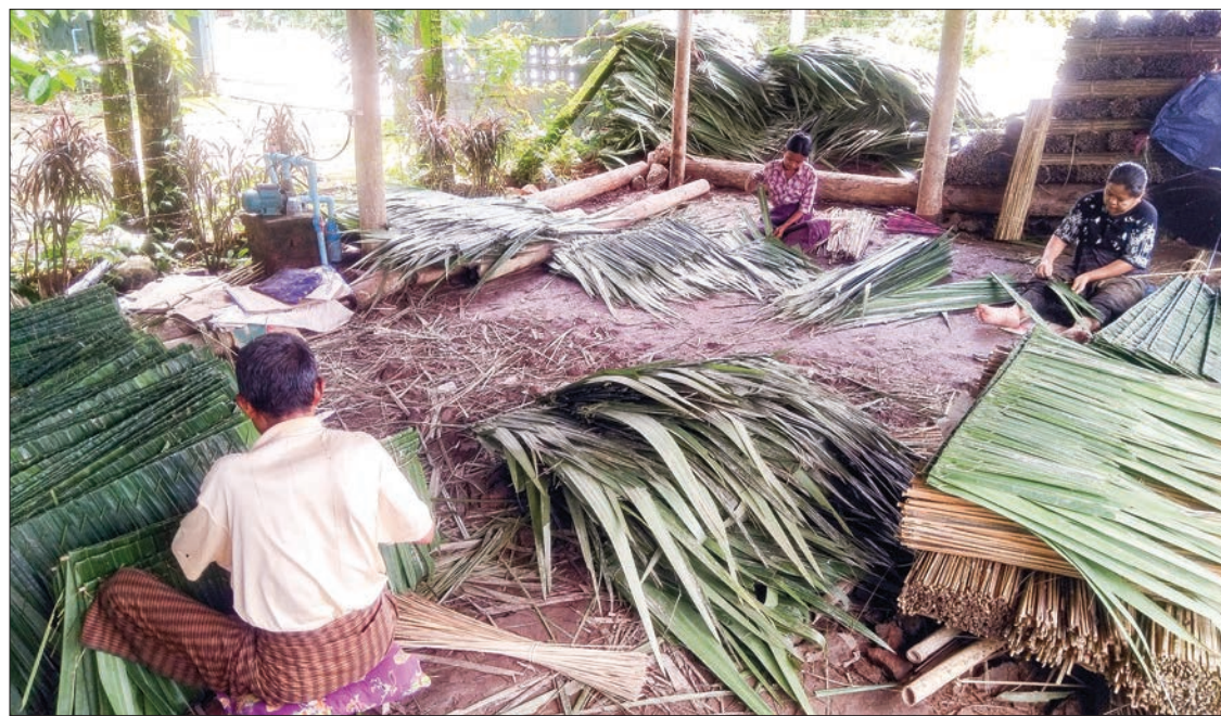
Workers making Nipa palms thatches in Chaungzone Township, Mon State.

WITH the price of nipa palm thatches rising in Chaungzone Township, Mon State due to high demand from Yangon, Bilin, Kyaukhto, and Mudon townships, nipa palm businesses are earning a good income, according to locals.