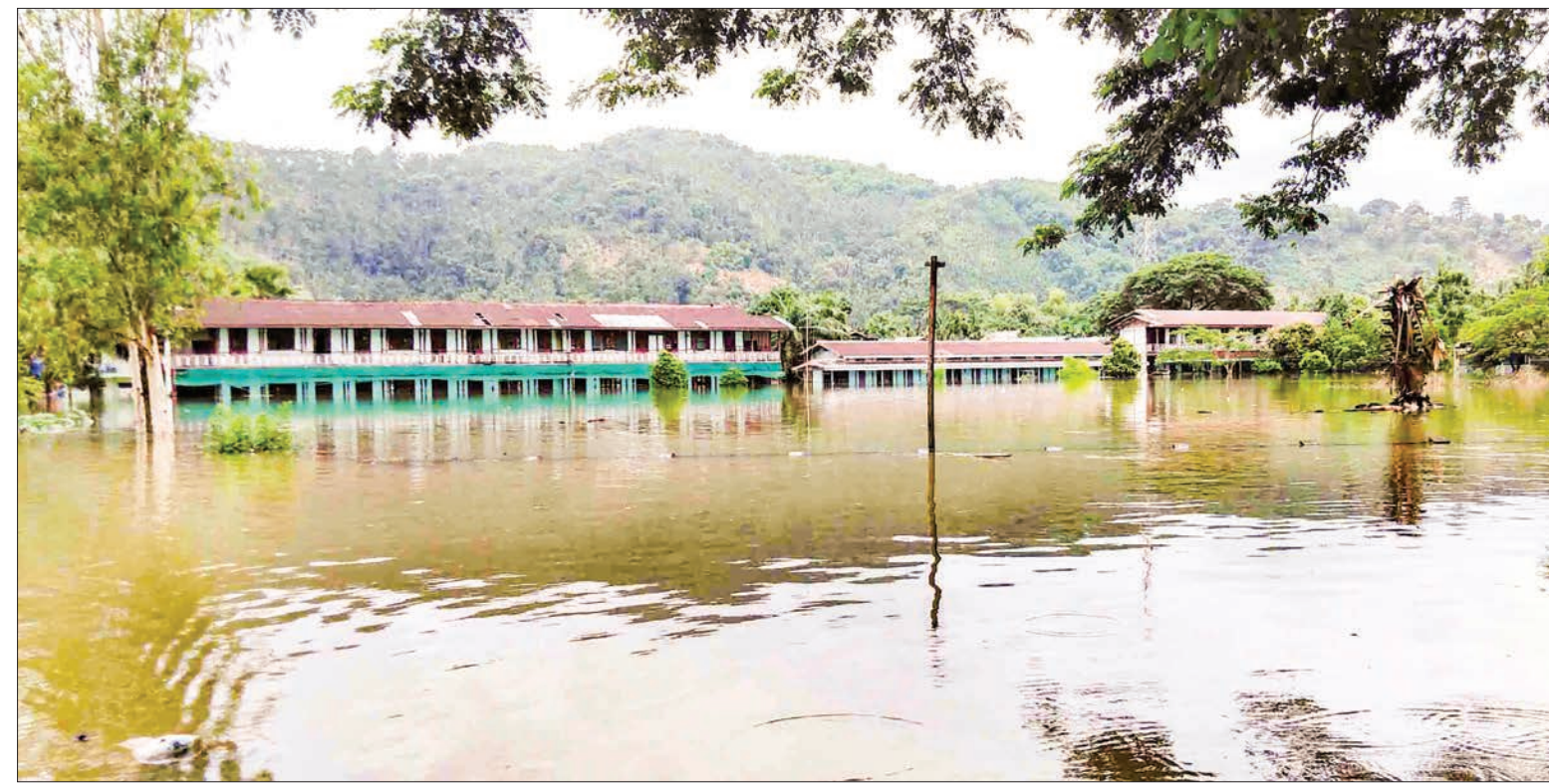
The school building is submerged by flood in Myeik.

The natural disaster killed at least 138,000 persons and destroyed USD 10 billion worth of property. Failure to provide help in time had also increased the number of death and the amount of property lost. In one incident, the father survived, but lost all his three children and wife, as he could not hold them till morning.