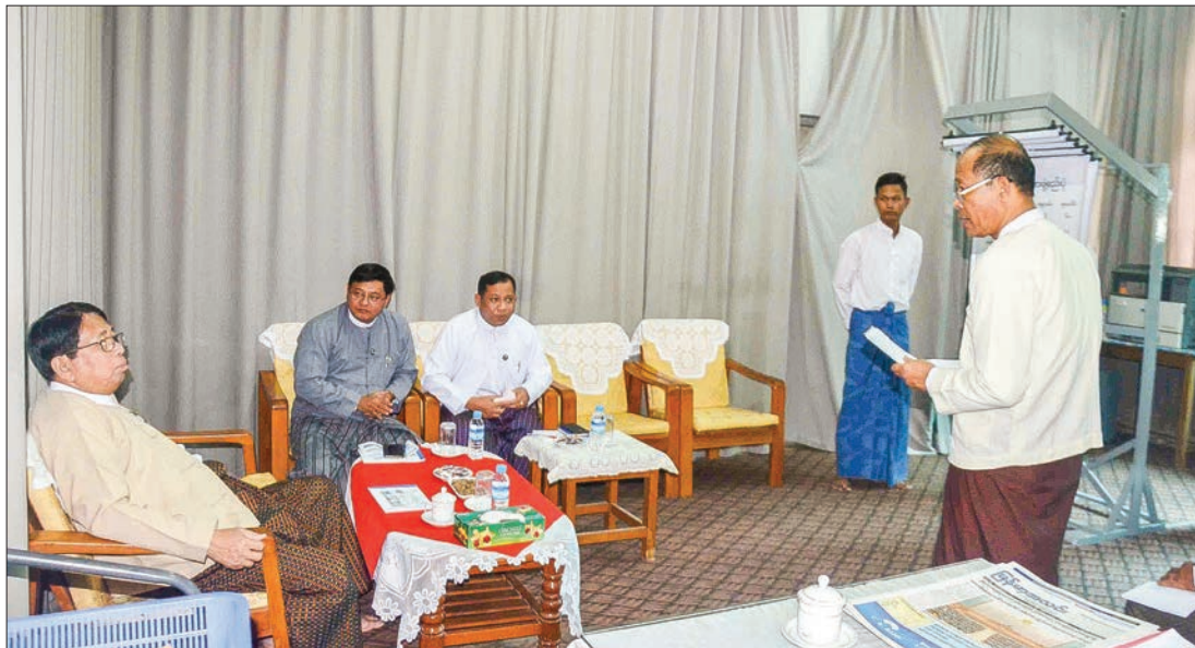
Union Minister for Information Dr Pe Myint meets with staff from Sub-printing house in Mandalay yesterday.

UNION MINISTER for Information Dr Pe Myint inspected the Mandalay Bureau of MRTV and Sub-printing house in Mandalay yesterday morning.