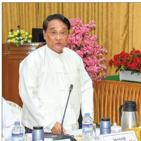
Union Minister for Commerce Dr Than Myint.