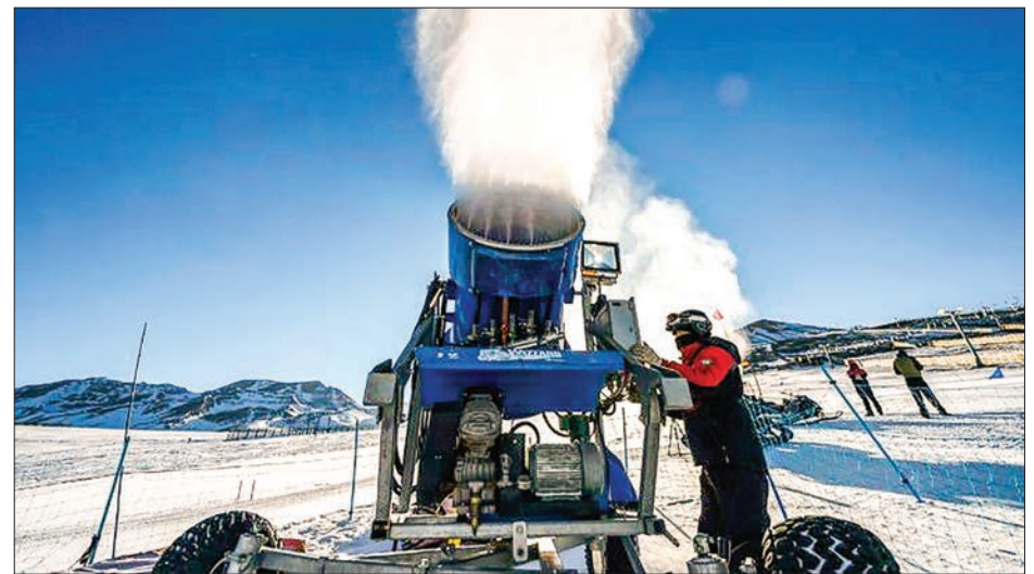
A cannon sprays artificial snow on a ski slope at El Colorado skiing center, in the Andes, some 30 km from Santiago.

mean the snow line — above which snow never melts all year round — keeps creeping upwards. The snow melt is even more pronounced in the central zone due to pollution from the Chilean cap-