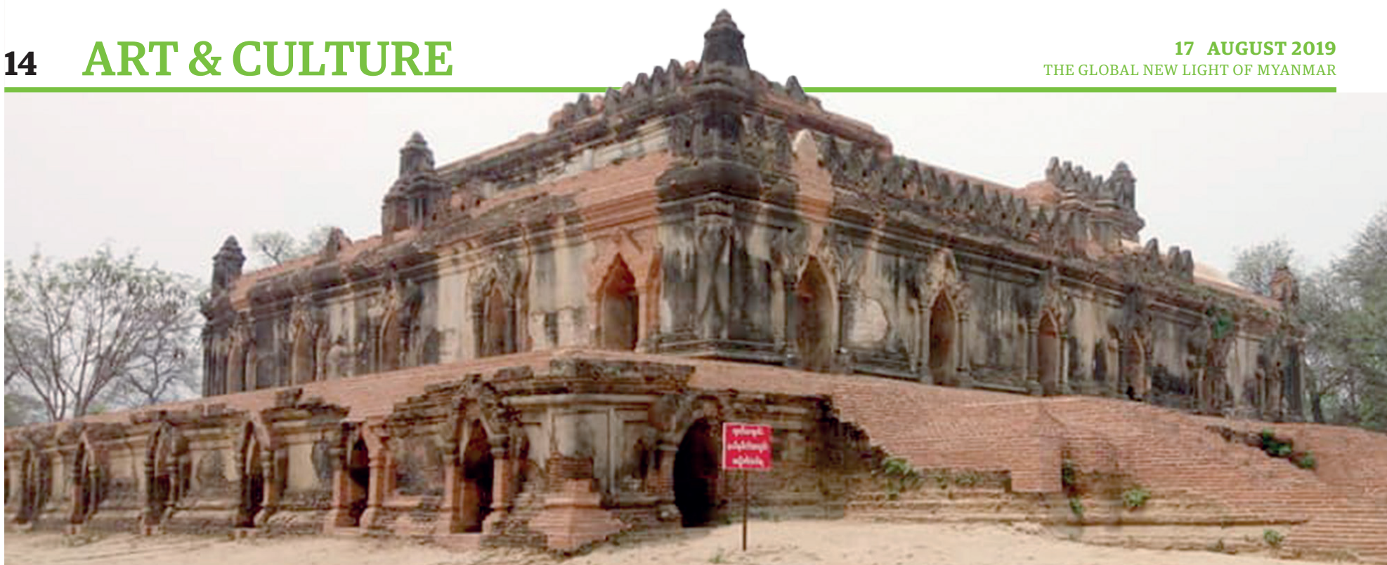
Nanmadaw Mei Nu brick monastery in YeU Township.