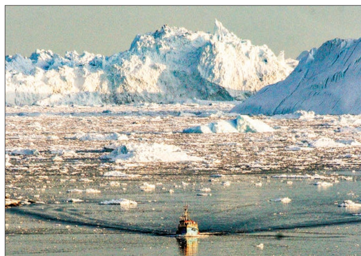
The president has been curious about the area's natural resources and geopolitical relevance, the paper reported.

The world's largest island has suffered from climate change, scientists say, becoming a giant melting icicle that threatens to submerge the