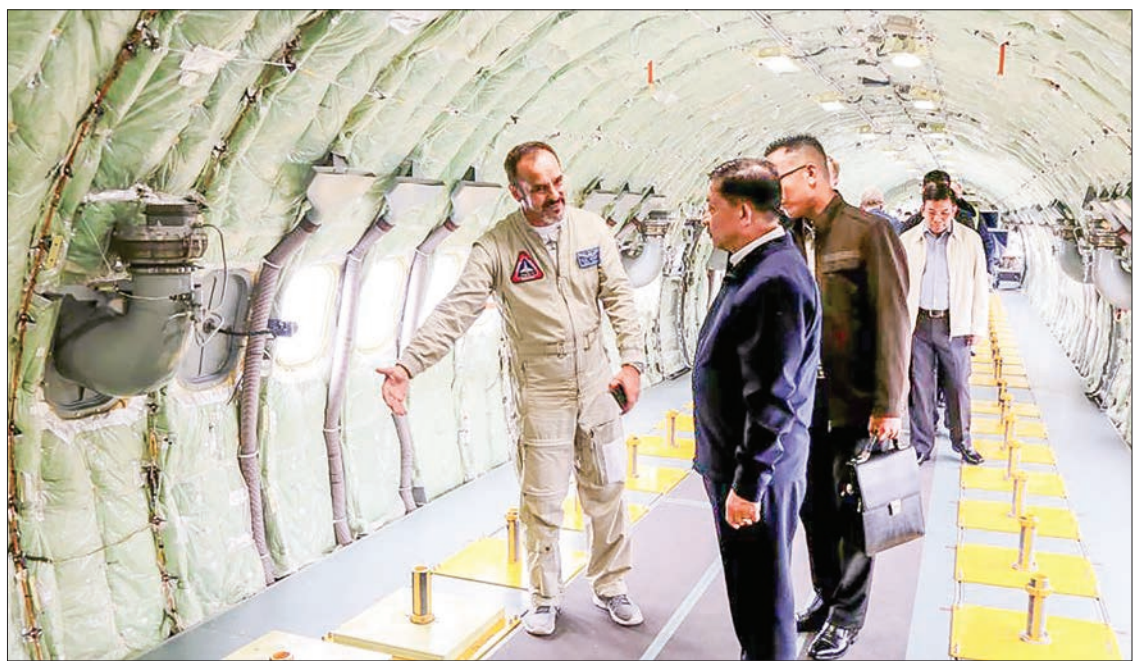
Senior General Min Aung Hlaing visits Zhukovsky International Airport in Russia.