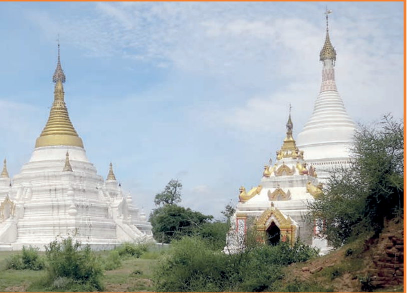
Ancient Pagodas in Phalankhon.