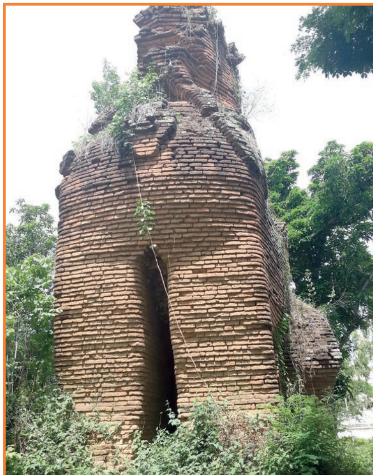
Damaged lion statue in Phalankhon village.

Religious monuments including pagodas built by Nanmadaw Mei Nu and U Oh are located around Phalankhon Village and its environs. Pagodas are situated in wide precincts fencing with high walls. The Assessment on Nanmadaw Mei