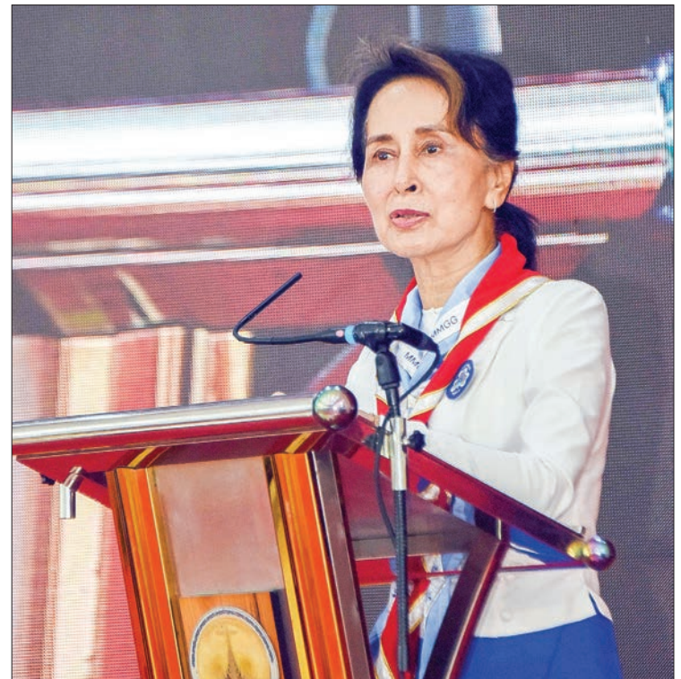
State Counsellor Daw Aung San Suu Kyi delivers the opening speech at the meeting with guides and the scouts at the Mandalay City Hall in Mandalay yesterday.