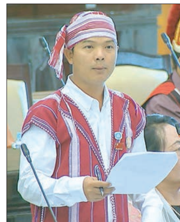
MP Saw Sha Phaung Ewa.

the Union Government Deputy Minister U Tin Myint tabled a motion for Hluttaw to approve the Word Change Bill. The motion was supported by U Mya Min Swe of Magway Region constituency 9. Amyotha Hluttaw Speaker obtained the decision of the Hluttaw and approved the bill.