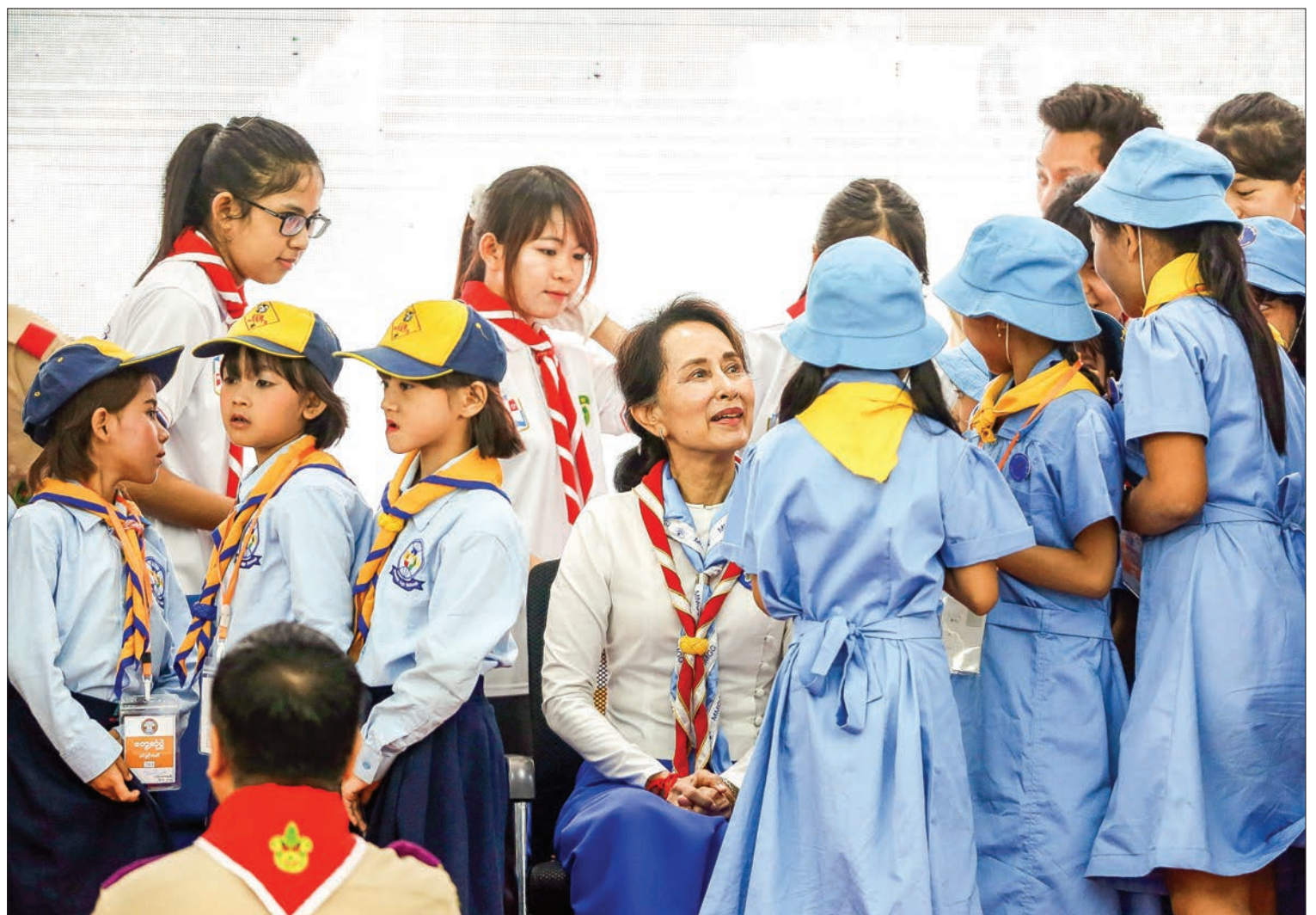
State Counsellor Daw Aung San Suu Kyi chats with the girl guides from Myanmar Scouts Federation at the Mandalay City Hall yesterday.

Before the ceremony, the Head of the Myanmar Scouts