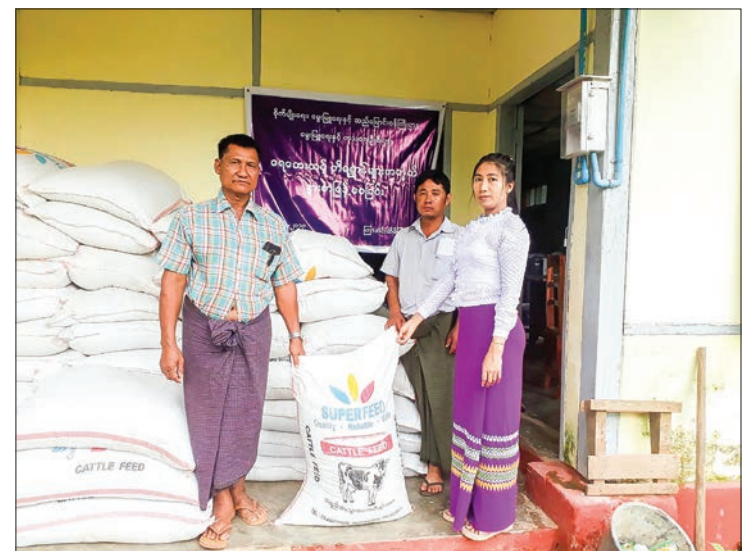
Township Livestock Breeding and Veterinary Department officials provide bags of cattle feed in Kyainseikgyi.