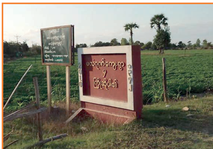
Entry to Phalankhon village.

Crown Prince Sagaing became the seventh king in Konbaung era on 7 June 1819. Wife of Crown Prince Mei Nu became the First Queen of the southern royal building with the title of Thiripawara Maha Razein-