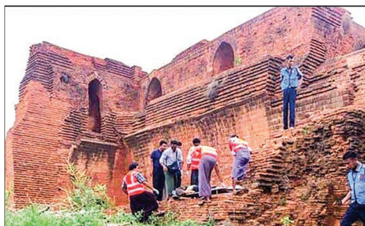
Authorities and rescue team members prepare to carry the dead body from a compound of Laymyathnar Pagoda in Bagan.