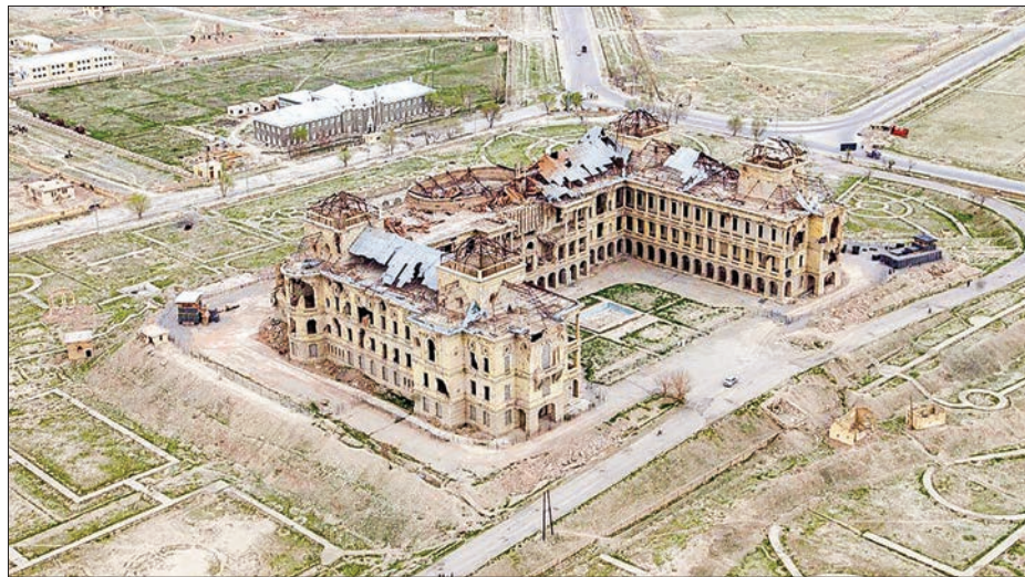
FILE PHOTO: 2005: Aerial view of the Darul-Aman palace, the former house of Afghan King Amanullah (1920-1929), taken from an ISAF helicopter

They have just days to finish a total renovation of the once-ruined Darulaman Palace, a hulking showpiece of Afghan architecture that came to symbolise the country's turmoils during decades of war. With questions looming over Afghanistan's future and a possible deal between the US and the Taliban imminent, the war-torn nation is this month hoping to briefly celebrate