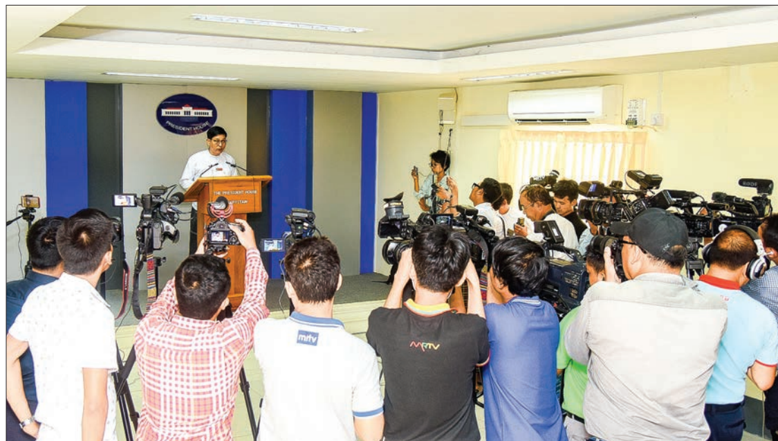
Government spokesperson U Zaw Htay addresses press conference in the Presidential Palace in Nay Pyi Taw yesterday.

U Zaw Htay said the attacks in Nawngkhio killed nine soldiers, three police officers and three civilians while leaving a soldier, two police officers and ten civilians wounded. He said they attacks have cost more than K200 million losses in arms and ammunitions for the Defence Services Technology Academy and Myanmar Police Force.