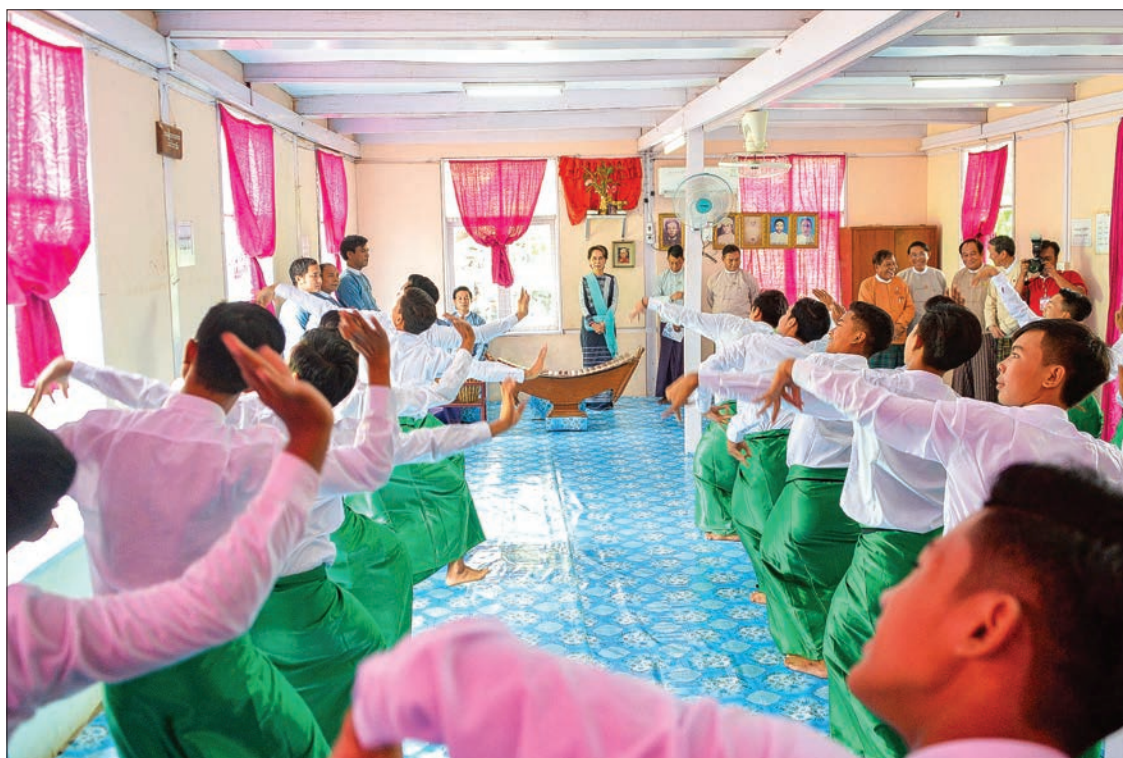
State Counsellor enjoys the performance of a dance troupe at the State School of Fine Arts (Mandalay) in Mandalay yesterday.

Daw Aung San Suu Kyi advised the young guides and scouts to develop themselves as a valuable person for the organization, although they have joined the group due to the persuasion of their parents or their own decision.