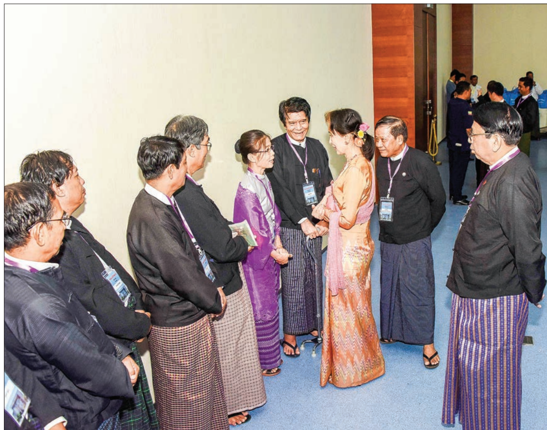
State Counsellor Daw Aung San Suu Kyi greets writers as she arrives at the dinner at Mandalay Convention Center in Mandalay yesterday.

She said literature has altered the world and being able to write was a necessity towards critical thinking. She said poems and stories used to be taught orally in the past but actual writing was required to probe deeper into one's thoughts.