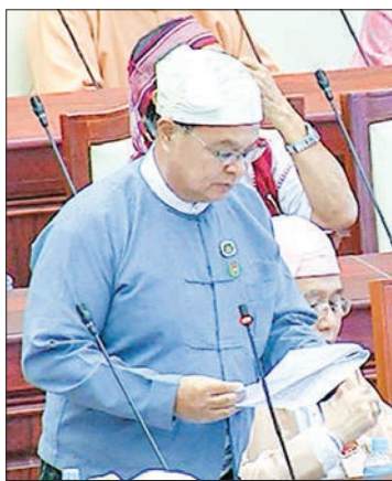
MP U Steven.

In the question and answer session, a question was raised by U Kyaw Aung Lwin of Sedoktara constituency on a plan to construct an embankment to protect from erosion in Sedoktara Town by Hsi Mi Creek was answered by Deputy Minister for Transport and Communications U Kyaw