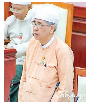
Deputy Minister U Kyaw Myo

Next a motion urging the Union Government to study and review the severe climate change and rising temperature that occurs in 2019 due to deteriorating natural environment, prevent severe effect on natural environment for the benefit of the country and future generation in accordance to the law and reinforce recovery and re-development works tabled by U