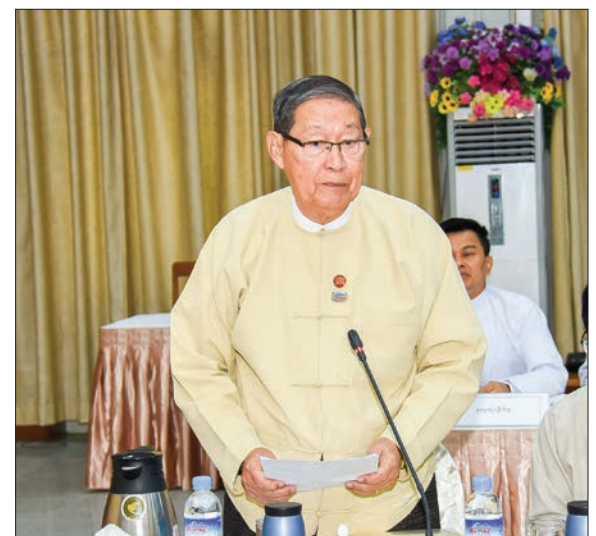
Illegal Trade Eradication Steering Committee Vice Chairman Union Minister for Planning and Finance U Soe Win.