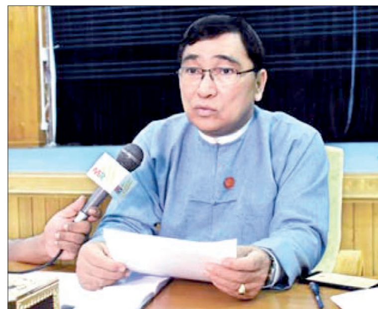
Dr Win Myat Aye (Union Minister)

This misfortune taught us the lesson that landslides cause massive fatalities, while annual floods do not.