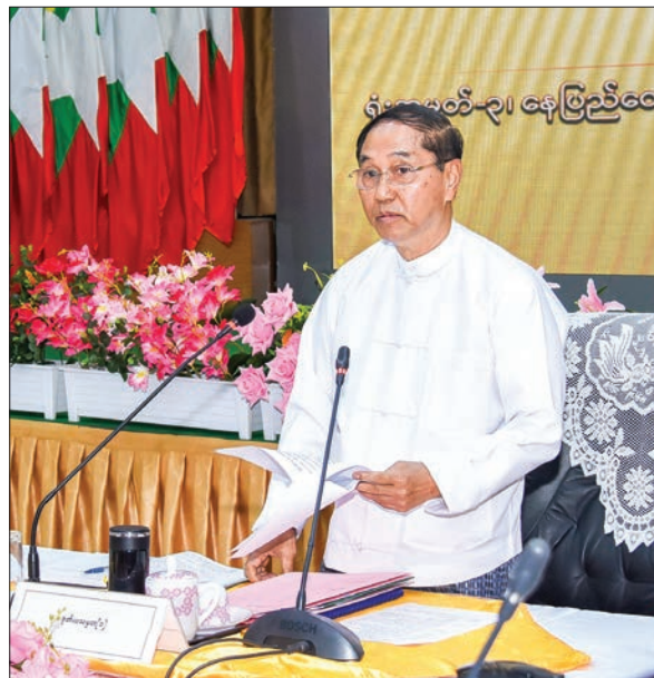
Vice President U Myint Swe delivers the opening speech at the coordination meeting of Illegal Trade Eradication Steering Committee at Ministry of Commerce in Nay Pyi Taw yesterday.

V ICE President U Myint Swe, Chairman of the Illegal Trade Eradication Steering Committee attended and addressed a first coordination meeting of Illegal Trade Eradication Steering Committee held at Ministry of Commerce meeting hall in Nay Pyi Taw yesterday morning.