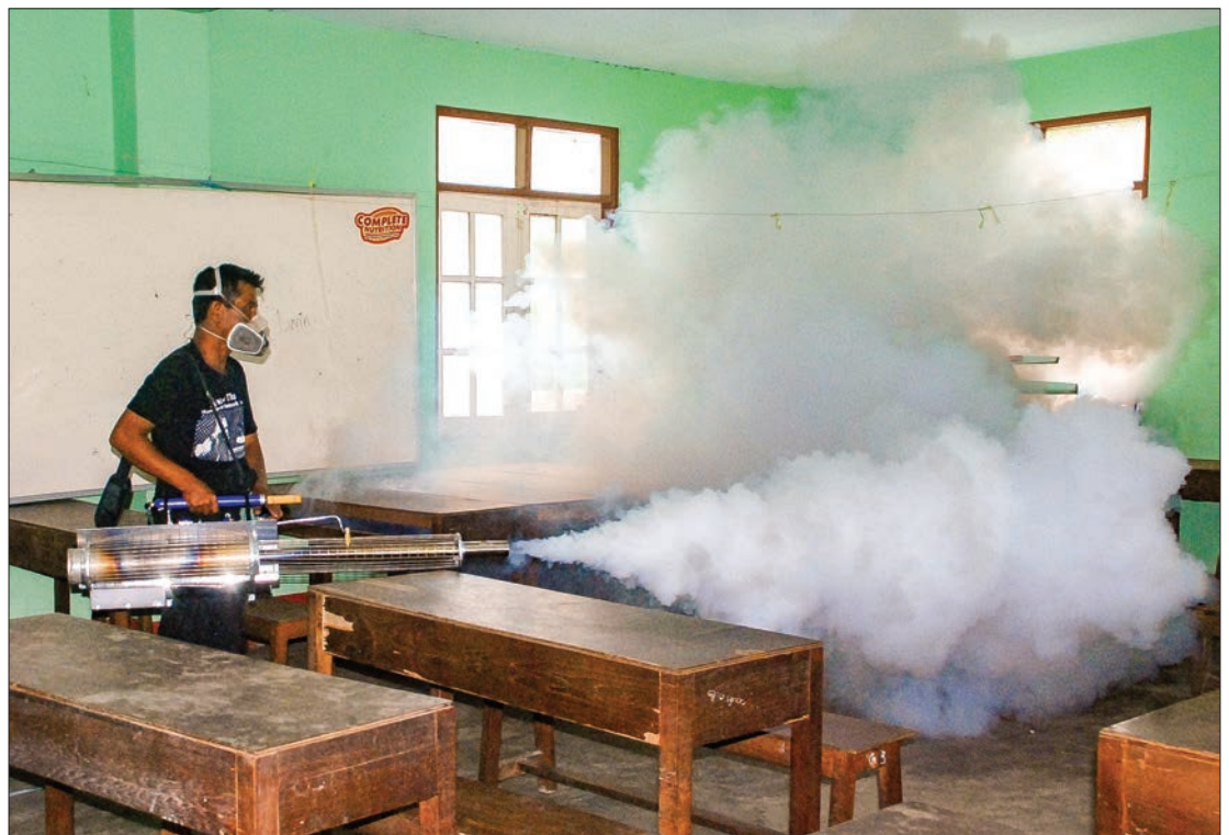
A health worker fumigates a classroom in taking measures against dengue.

The department has taken preventive and control measures against dengue under a