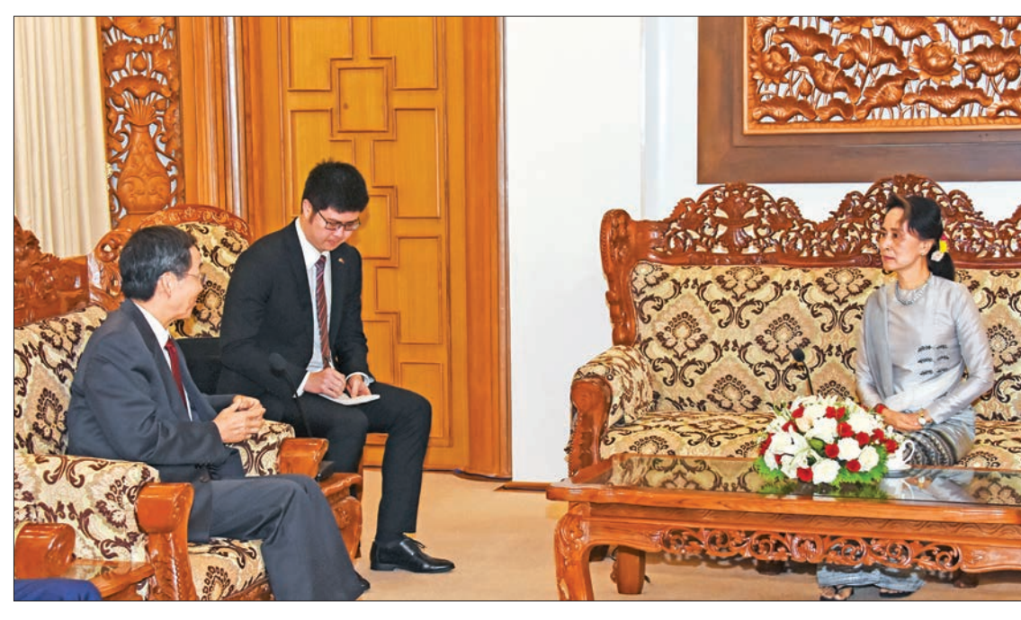
State Counsellor Daw Aung San Suu Kyi meets with Mr Sun Guoxiang, Special Envoy for Asian Affairs of the Ministry of Foreign Affairs of the People's Republic of China, in Nay Pyi Taw yesterday.

cordially discussed matters relating to the recent developments in national reconciliation and peace process, progress on the bilateral consultation with Bangladesh for early commencement of repatriation of the verified displaced persons from Rakhine State and the constructive support extended by China to the Myanmar Government's efforts in this regard. —MNA