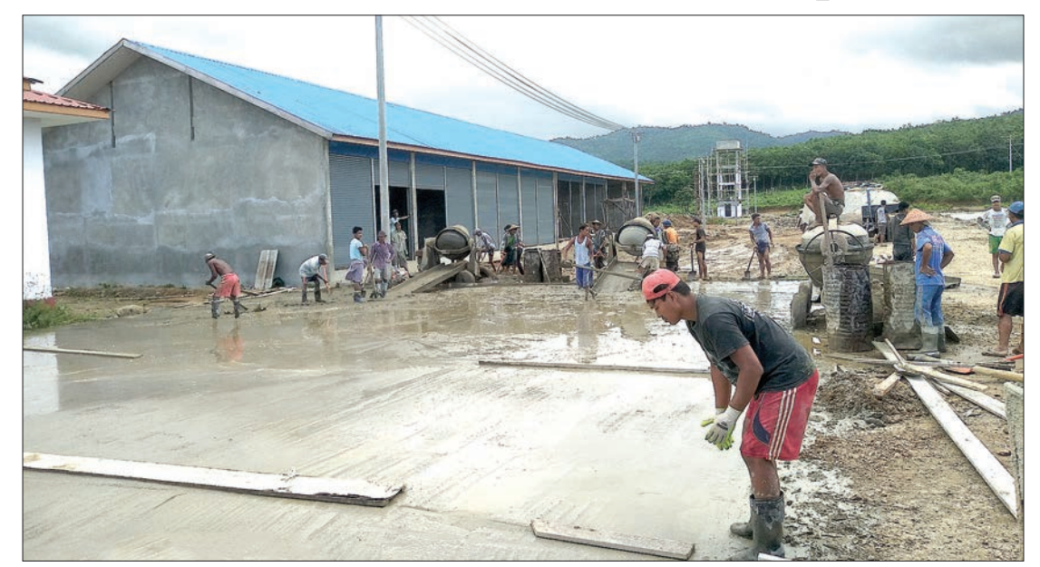
Labourers work at the construction site of an express car terminal near Mohnyin Degree College in Kachin

"The express bus terminal is being constructed by the Red Shan (Shan Ni) National Development Company Limited. To build the e terminal, a contract was signed on 31 December, 2016. The construction of the terminal was started with the permission of the state government. The terminal will include 48 shops measuring 26x40x23 feet each, 28 rooms for express Association car gates, 20 stalls, which will include bathrooms, eight warehouses measuring 26x40x23 feet each, one car workshop center with a passengers' concourse building, and one administrator office. The current price of each shop is over K70 million. At present, the work is 95 per cent complete. As soon as the installation