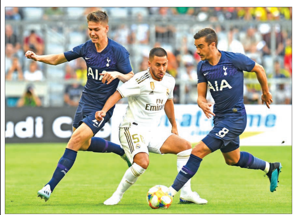
Eden Hazard joined Real Madrid from Chelsea in July.

Bale's agent told AFP Zidane was a "disgrace" and if the Frenchman had hoped to push the deal over the line, he would be disappointed as Madrid changed their mind over the fee.—AFP ■