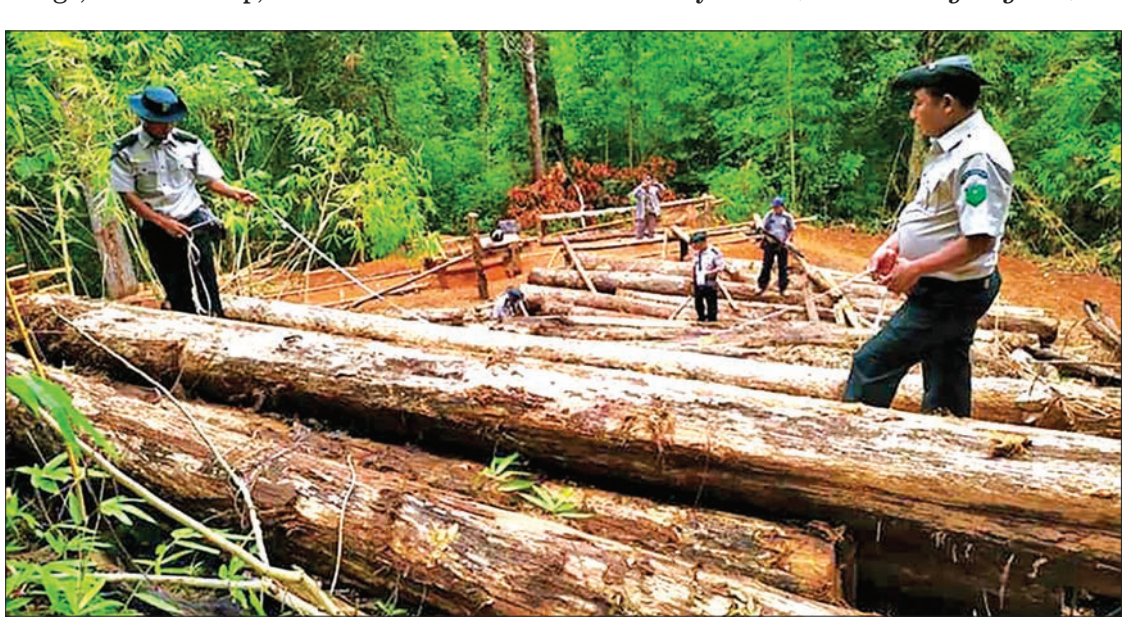
Officials inspect seized illegal timber in Sagaing Region.

During the period, a total of 616 people have been arrested in relation to cases of illegal harvesting of timber, and 299 vehicles, 29 tractors, 33 htawlargyi, 183 motorbikes, 33 three-wheel motorbikes, 100 water vessels, seven guns, 6 trailers, 201 sawmills, and 111 chain saws have been seized, according to the Sagaing Region Forest Department.—Myo Win Tun (Monywa) (Translated by Hay Mar)