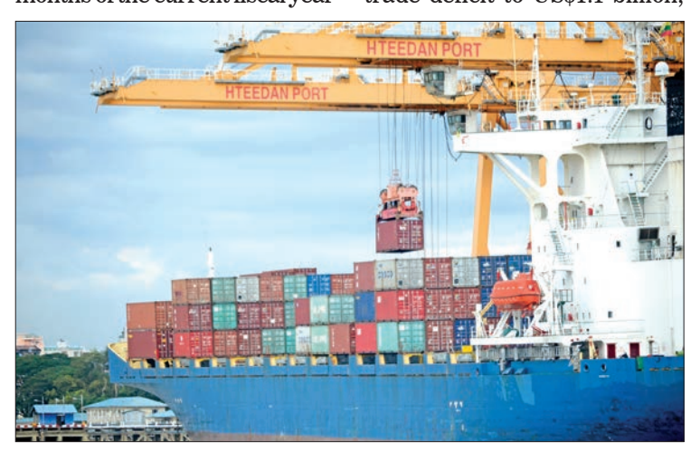
A cargo ship loading containers at a shipping container port in Yangon.

A FALL in imports in the last ten has helped narrow Myanmar's trade deficit to US$1.1 billion,