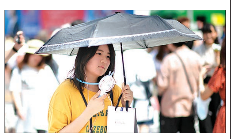
A woman uses a portable fan to cool herself as Japan suffers from a heatwave.

Of the total people requiring hospital treatment, around 55 per cent of them were aged 65