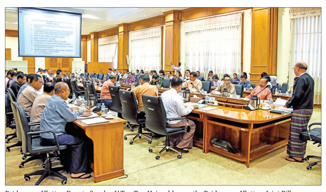
Pyidaungsu Hluttaw Deputy Speaker U Tun Tun Hein addresses the Pyidaungsu Hluttaw Joint Bill Committee meeting in Nay Pyi Taw yesterday.