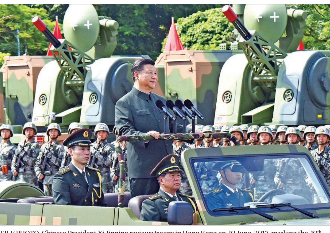
FILE PHOTO: Chinese President Xi Jinping reviews troops in Hong Kong on 30 June, 2017, marking the 20<sup>th</sup> anniversary of Hong Kong's handover. PHOTO: KYODO NEWS

In a related move, US Secretary of State Mike Pompeo met with China's top foreign policy official Yang Jiechi on Tuesday in New York, and apparently discussed the situation in Hong Kong. Pompeo and Yang, director of the Office of the Foreign Affairs Commission of the Communist Party of China Central Committee, "had an extended exchange of views on US-China relations," the State Department said, without elaborating.—Kyodo News ■