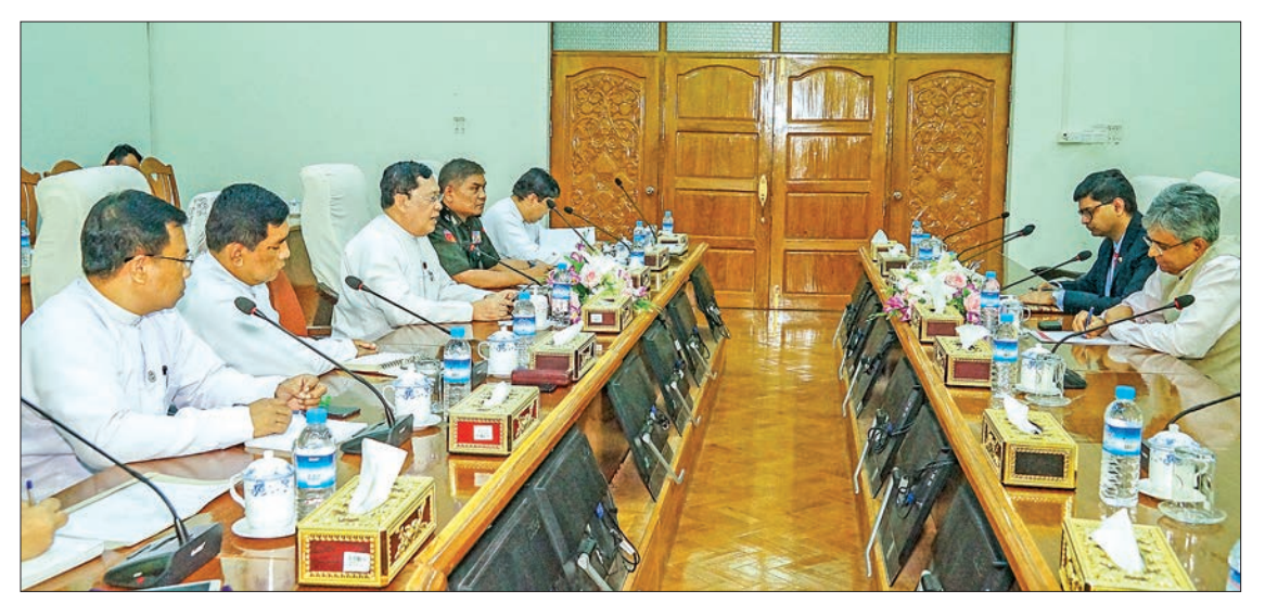
Union Minister U Thein Swe holds a meeting with Indian Ambassador Mr Saurabh Kumar at the Office of the Ministry of Labour, Immigration and Population in Nay Pyi Taw yesterday.