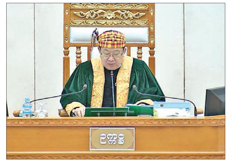
Pyithu Hluttaw Speaker UT Khun Myat.

MP U Sai Tun Sein of Mongpyin constituency said the government is tasked with providing suitable compensation for domestic workers as well. He agreed with the fact to enact policies and laws to boost the national economy and employment op-