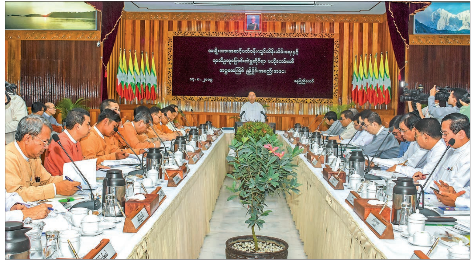
Vice President U Myint Swe addresses the 8<sup>th</sup> coordination meeting of the Central Committee on National-Level Environmental Conservation and Climate Change in Nay Pyi Taw.

Some significant steps of the committee in adopting environmental policy and procedures helped the government to issue 'National Environmental Policy', 'Myanmar Climate Change Policy', 'Myanmar Climate Change Strategy (2018-2030), and 'Myanmar Climate Change Master Plan (2018-2030)'. The 'National Level Waste Management Strategy and Action Plan (2018-2030)' had been adopted and it would be published soon. It included the pledges and the international norms of practices on environmental and environmental changes suggested by the stakeholders who partici-