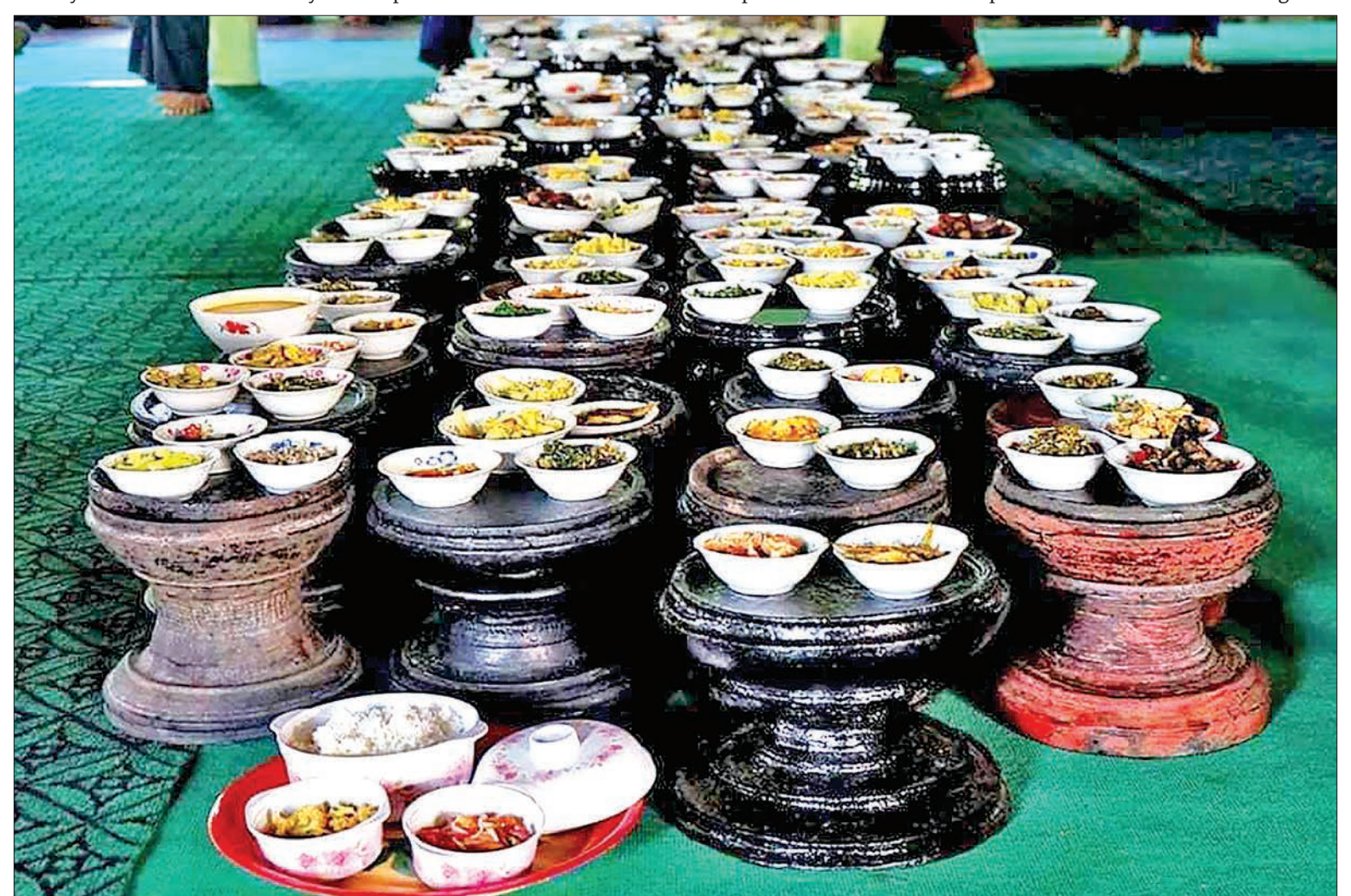
Traditional large bowls with stand and cover of lacquer for offering of food to monks. Food offered to monks chosen by casting lots became a common tradition in Myanmar.

above seven types of food offering to the monks. Since that time Lord Buddha approved all Salka bhat – food offered to monks