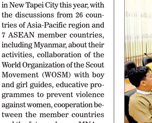
JOINT Committee on scrutinizing the second bill for amending 2008 Constitution holds a meeting at the Pyidaungsu Hluttaw building yesterday.

THE Joint Committee to Scrutinize Second Bill for Amending 2008 Constitution met at the Building D of Pyidaungsu Hluttaw in Nay Pyi Taw yesterday.