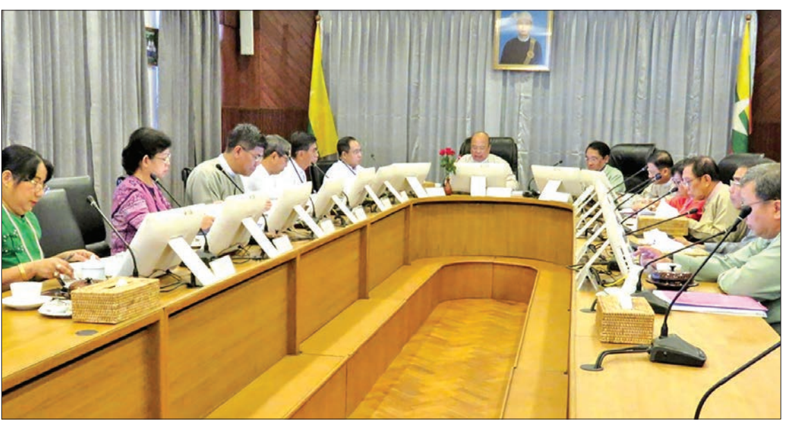
Union Minister U Thaung Tun, Chairman of the MIC, chairs the Myanmar Investment Commission (MIC) meeting (13 / 2019) in Yangon on 13 August 2019.

The sector with the largest share of investment has been oil and gas, accounting for 27.72 per cent of the total permitted foreign investment, following by the power sector (26.18 per cent), and the manufacturing sector (13.82 per cent).—MNA