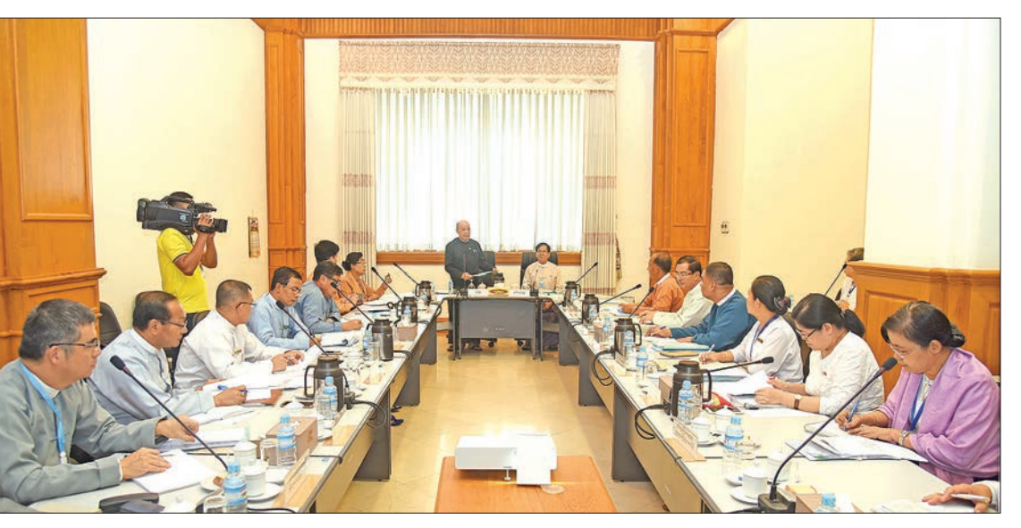
Pyidaungsu Hluttaw Deputy Speaker U Tun Tun Hein delivers the speech at the International Democracy Day Organizing Steering Committee meeting in Nay Pyi Taw yesterday.

The chairmen and secretaries of working committees