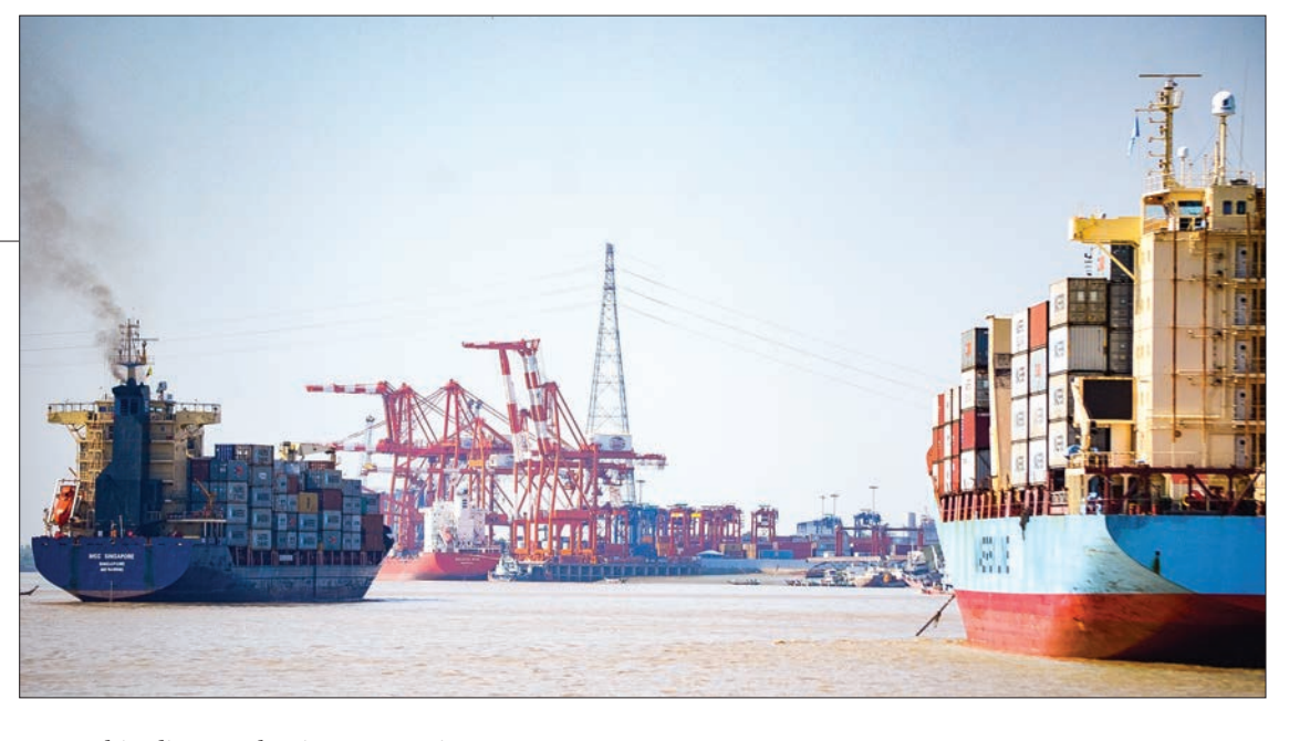
Cargo ships lie at anchor in Yangon River.

ented sectors, and in line with government strategy, it will help diversify the economy to develop more added value and productive industries. This should result in new opportunities for women to enter the labour market and access better paid jobs. In addition, the project will increase the transparency of trade rules and potentially address barriers that female-led businesses face when integrating into export value chains. It will also support the advocacy efforts of business associations, including women entrepreneurs associations. - GNLM