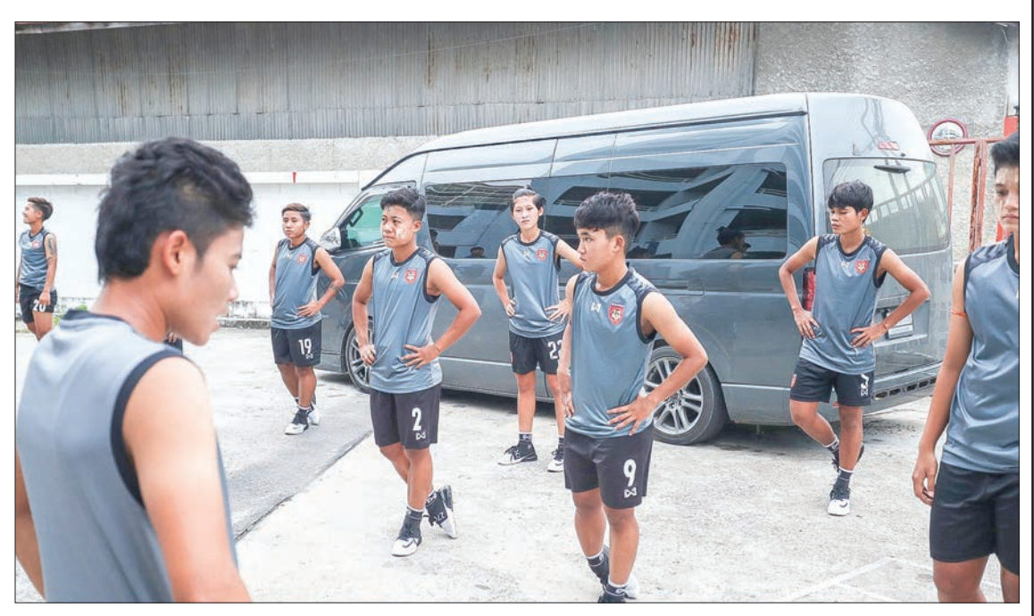
The Myanmar women's national football team undergo light training on 13 August at the Chon Inter Hotel in Chonburi, Thailand.