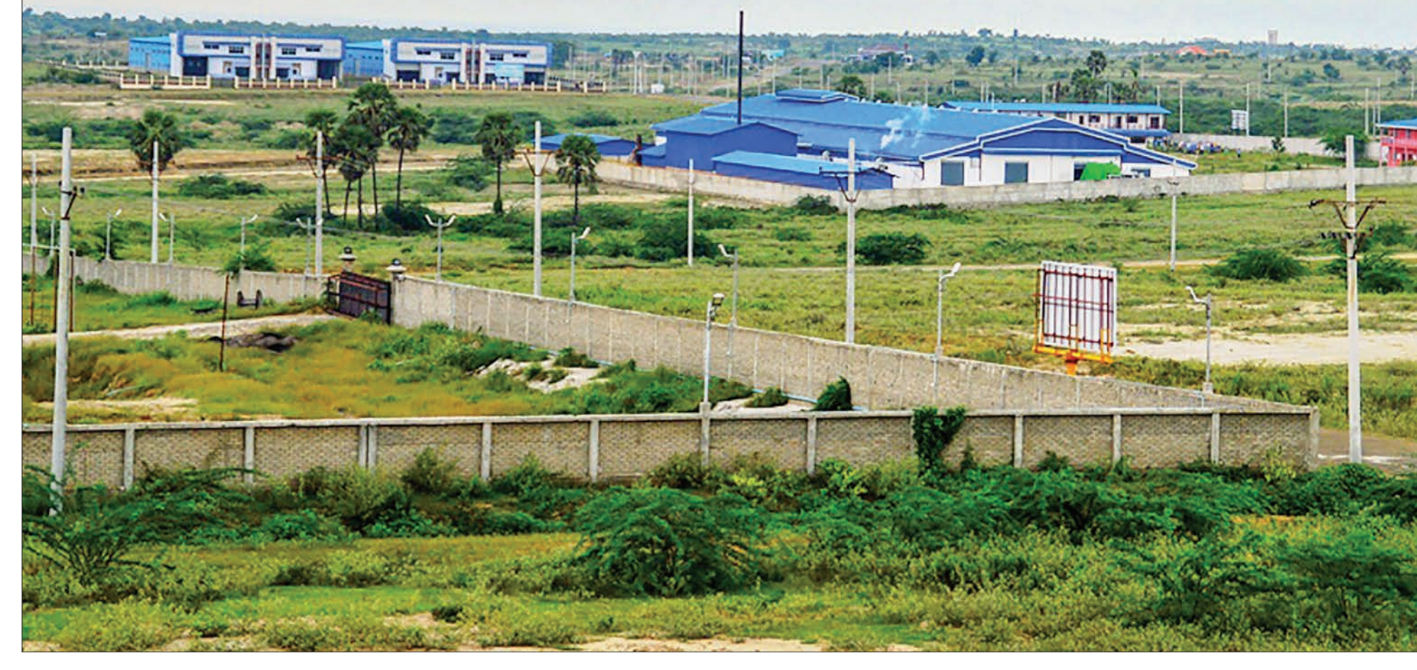
Some foreign companies become operational in twelve sectors in Myotha Industrial Park.