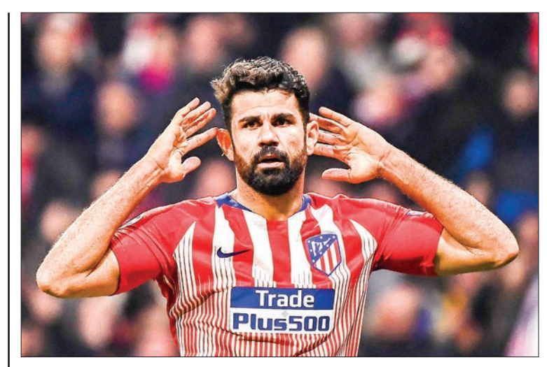
Diego Costa has agreed to pay 1.7 million euros to settle a tax case, Spanish media reports.