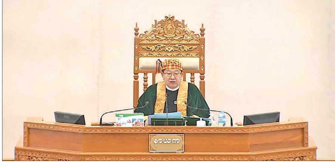
Pyidaungsu Hluttaw Speaker UT Khun Myat.

A total of K 22.5 million were made by Pyithu Hluttaw representatives (K 8,640,000), Pyithu Hluttaw Speaker (K 6,360,000), Amyotha Hluttaw representatives (K 4,480,000) and Amyotha Hluttaw Speaker (K 3,020,000).