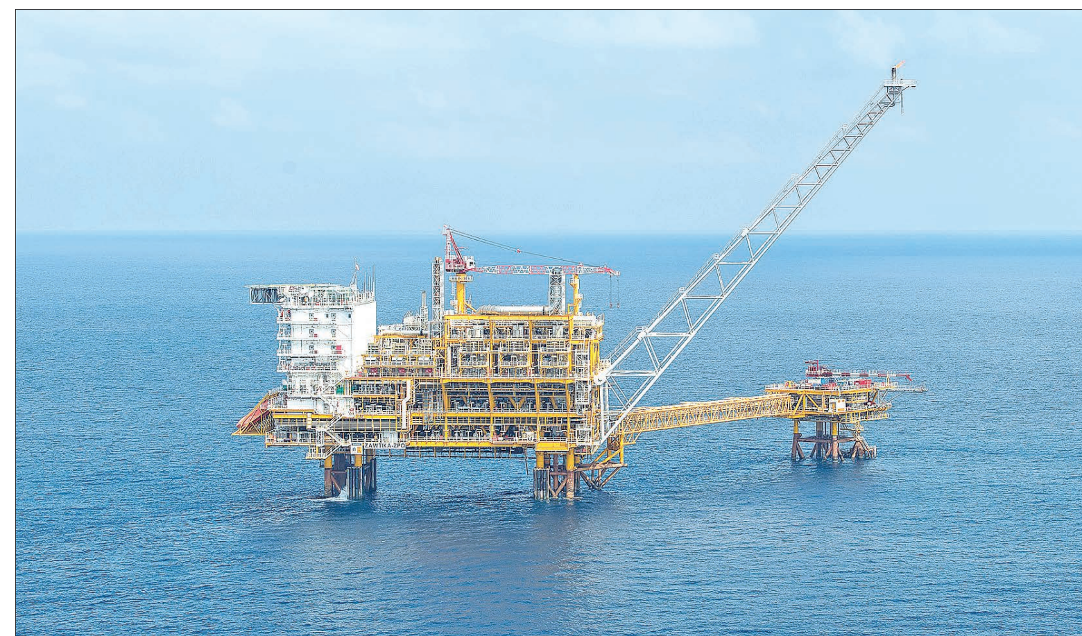
An offshore project of PTTEP.

Call Thinn Thin May, 09251022355, 09974424848