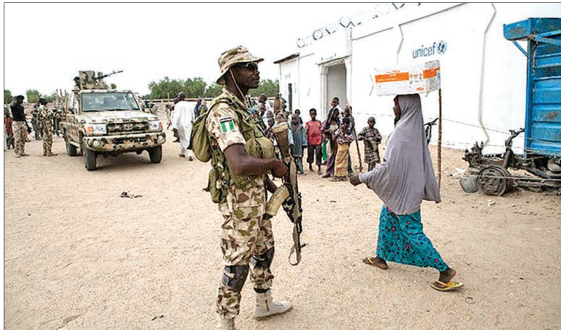
At least 20,000 people have been killed and more than 2.6 million people made homeless in northeast Nigeria since the Boko Haram launched an insurgency in 2009.

The jihadists are notorious for stepping up attacks during the Eid season, prompting heightened security across the region. —AFP ■