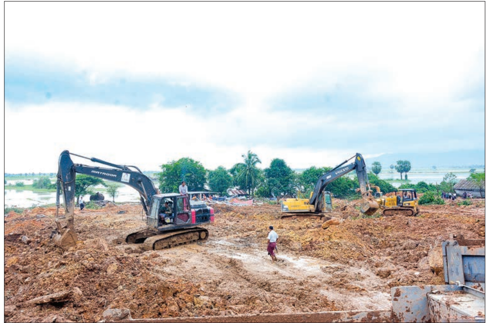
Vice President U Henry Van Thio inspects the landslide in Thae Byu Gon Village in Paung Township yesterday.

C HAIRMAN of the National Disaster Management Committee and Vice President U Henry Van Thio presided over a ceremony yesterday morning to provide relief assistance for the flood victims in Mon State.