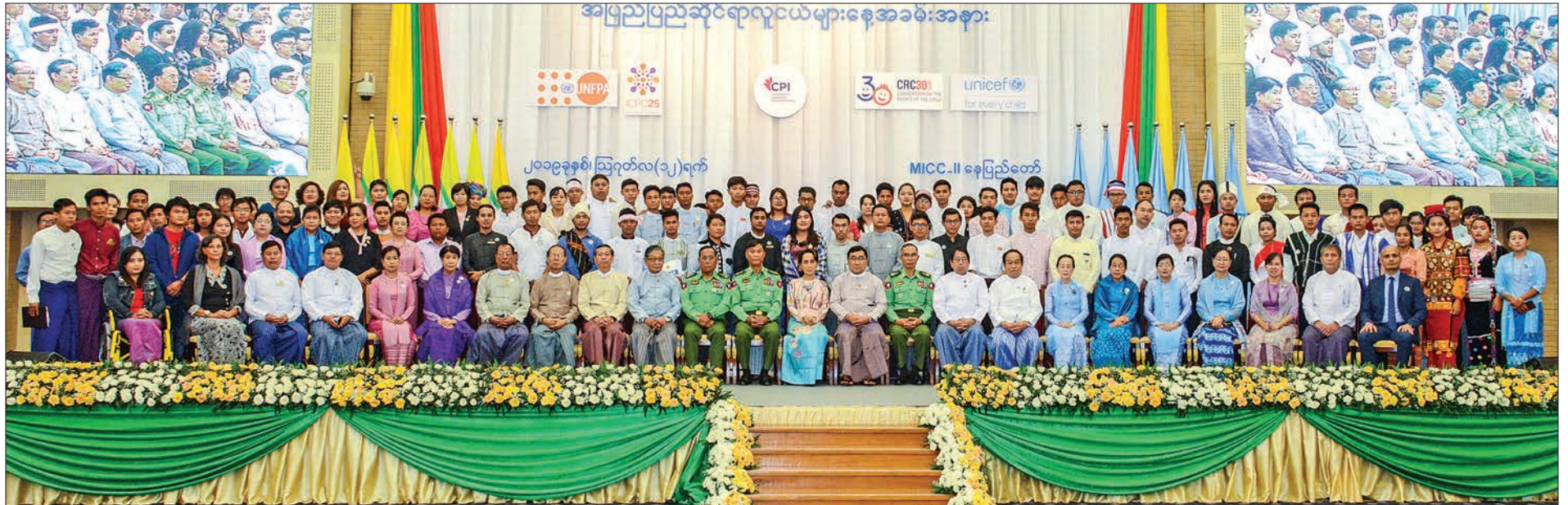
State Counsellor Daw Aung San Suu Kyi, Union Ministers, Nay Pyi Taw Council Chairman and officials pose for a group photo together with representatives of women organizations and youth organizations at the International Youth Day ceremony 2019 in Nay Pyi Taw yesterday.