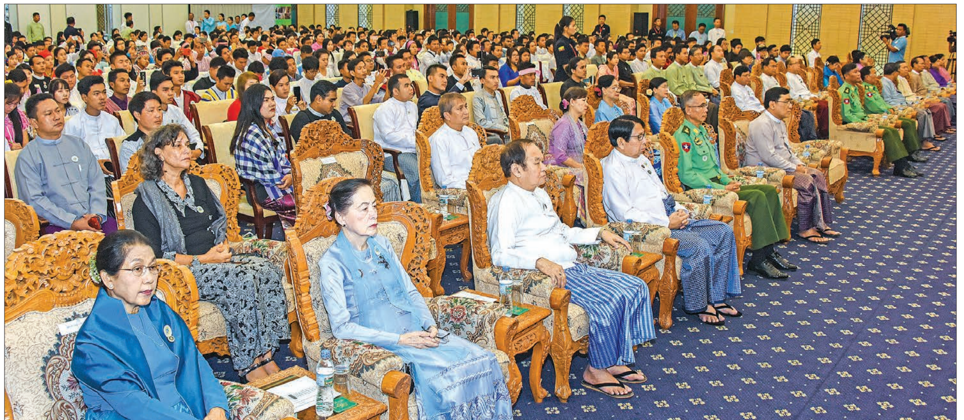
State Counsellor Daw Aung San Suu Kyi delivers the opening speech at the International Youth Day ceremony in Nay Pyi Taw yesterday.