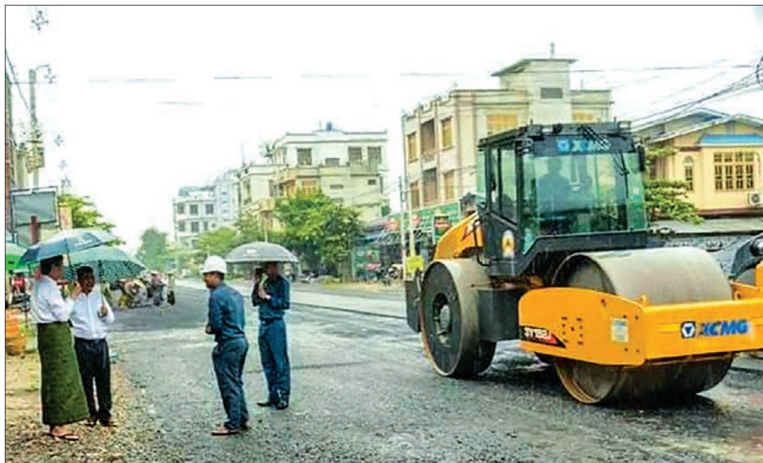
MCDC staffs inspect upgrading a road in Chanayethazan Township, Mandalay.

The MCDC is currently upgrading 774, 807 feet (146.744 miles) long asphalt and concrete roads in Mandalay City for city development. — Aung San Maung ■