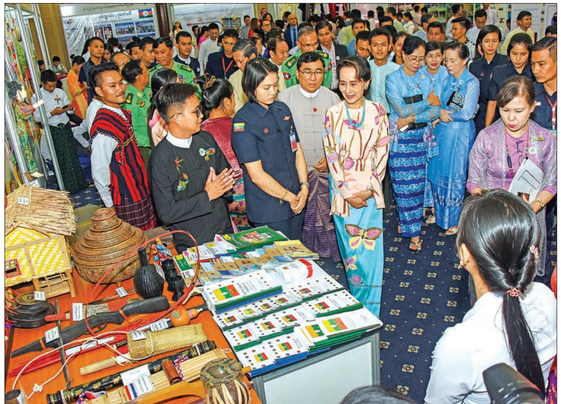
State Counsellor Daw Aung San Suu Kyi observes a booth at the International Youth Day ceremony in Nay Pyi Taw.

The main thing was to provide confidence to all Myanmar citizens who went through the education system to have a belief that they were people who would benefit the world. Some thought that this was something only an outstanding person could do. No. Whether a person was of high or low status, from urban or rural area, where ever they were they can all live a meaningful life that benefitted their neighbors. First was to have this will. Nowadays everyone had high values. It must not be forgotten that each one was a part of all. Life would be