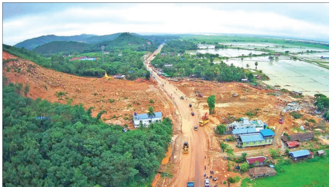
Photo shows an aerial view of the deadly landslide area in Paung Township yesterday.

Vice President U Henry Van Thio inspected the site of the landslide again yesterday, and made arrangements with the