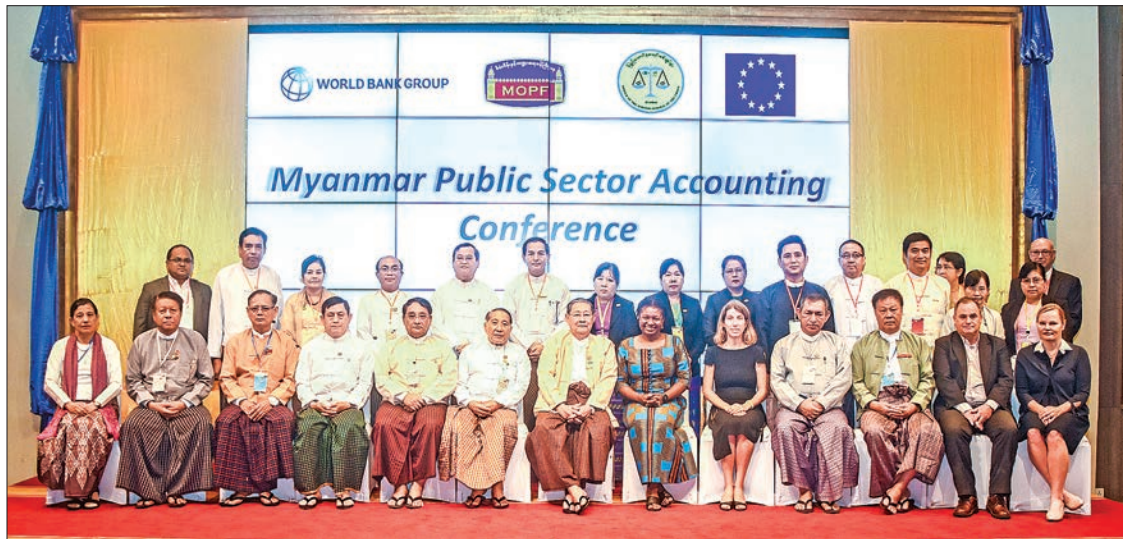
Union Auditor-General U Maw Than, Union Ministers Dr Than Myint, U Soe Win and attendees pose for the photo at the Myanmar Public Sector Accounting Conference in Nay Pyi Taw.

THE Office of the Auditor General of the Union and the Ministry of Planning and Finance jointly organized the 'Myanmar Public Sector Accounting Conference' in Nay Pyi Taw yesterday with the support of the European Union Trust Fund and the technical assis-