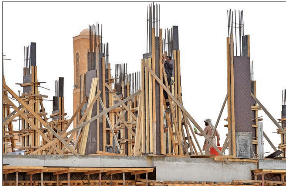
File photo shows labourers work on the construction of a house in the Saudi capital Riyadh on 17 April 2019.

"Despite lower oil prices during the first half of 2019, we continued to deliver solid earnings and strong free cash flow underpinned by our con-