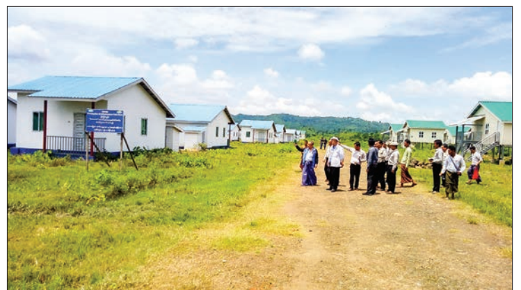
Deputy Minister U Kyaw Linn and authorities inspect houses to be used for the returnees in Maungtaw.