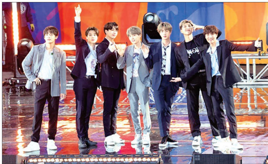
The pause may only last a few weeks, with the massively popular boy band due to play a controversial show in Saudi Arabia in October.

"If you run into BTS at an unexpected place, we ask for the fans' consideration to allow the members to enjoy their private time."