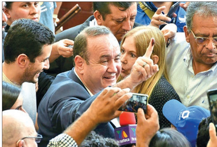
Conservative Alejandro Giammattei will be Guatemala's next president.

Giammattei will take over in January from corruption-tainted President Jimmy Morales, who congratulated his successor and promised a "transparent and orderly" transition. He will be under immense pressure from the United States to implement a controversial migration pact that would allow Washington to send most Honduran and Salvadoran asylum seekers who passed