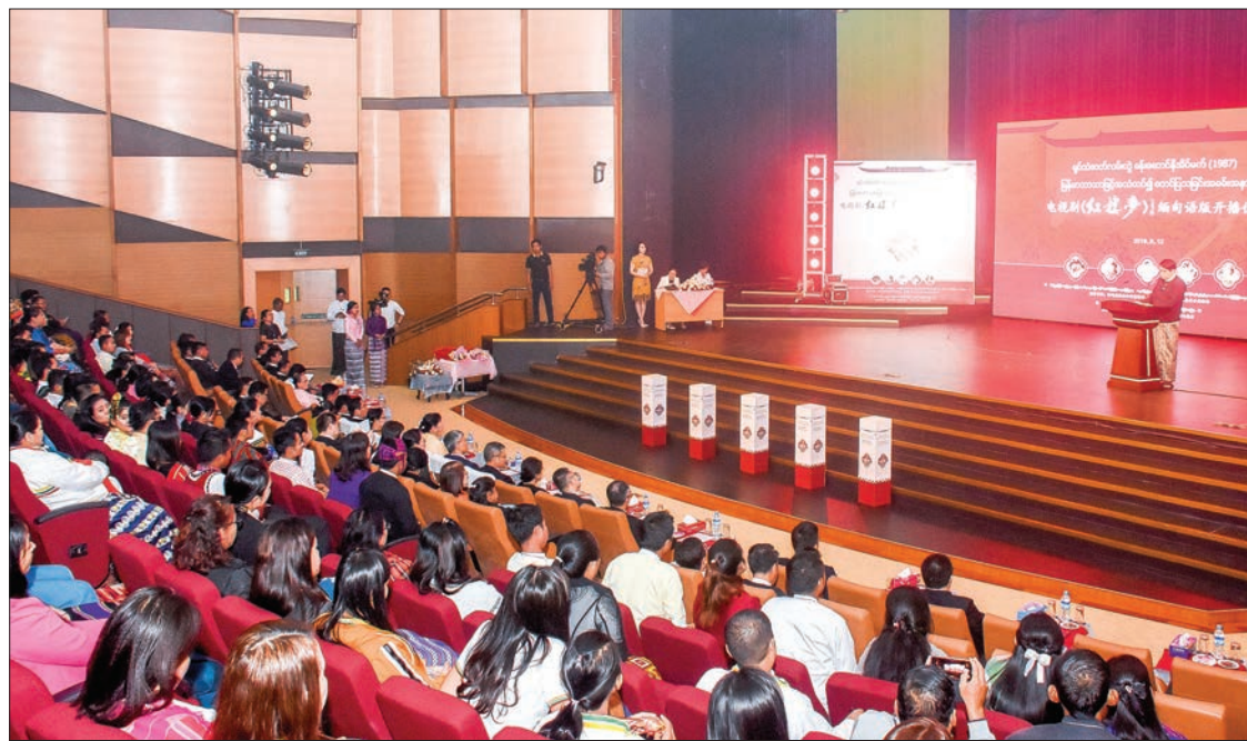
Union Minister for Information Dr Pe Myint delivers the speech at the ceremony to launch Chinese TV series 'Dream of the Red Chamber' dubbed in Myanmar language in Nay Pyi Taw yesterday.

Union Minister for Information Dr Pe Myint then