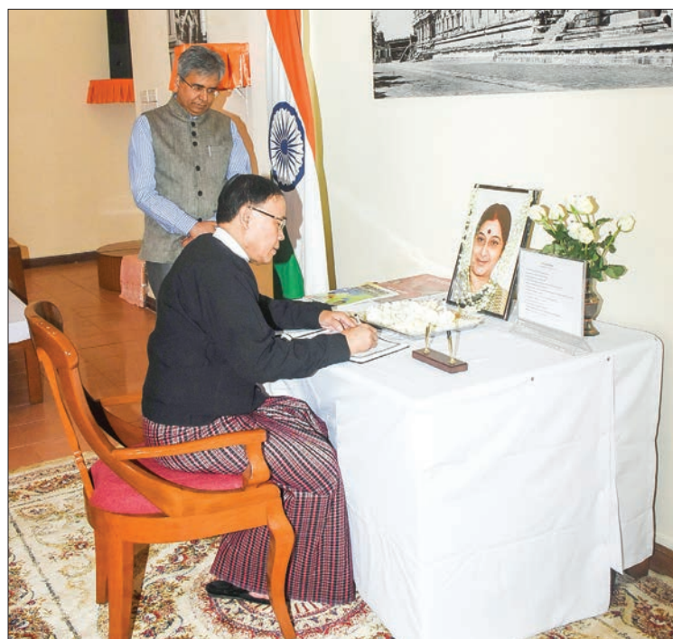
Union Minister U Kyaw Tin signs book of condolences for the Minister of External Affairs of India, Smt Sushma Swaraj at the Indian Embassy in Yangon yesterday.

The Union Minister for International Cooperation, U Kyaw Tin, signed the book of condolences for the Minister of External Affairs of India, Smt Sushma Swaraj, at the Indian Embassy on Merchant Road,