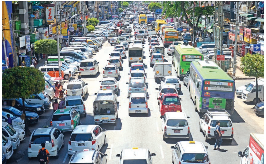
Taxis run in downtown Yangon.

were started in 2002 to bring transport services on par with Yangon's image as a commercial hub and for regulating the taxi service.