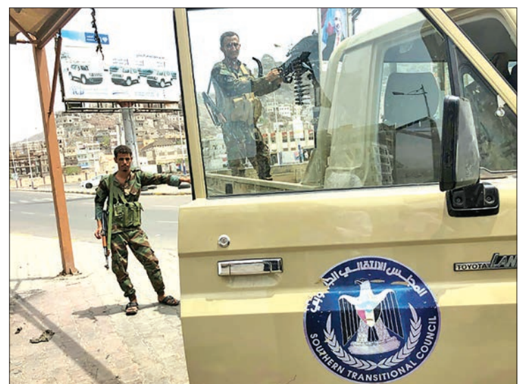
Yemeni separatists who seek an independent south say they are ready for Saudi-brokered peace talks after days of deadly fighting with pro-government forces in the southern city of Aden.

Separatists and government soldiers have theoretically been allied in a Saudi-led coalition against the Iranian-supported Huthi rebels since 2015. Huthi forces control vast swathes of Yemen's north, including the capital Sanaa.—AFP ■