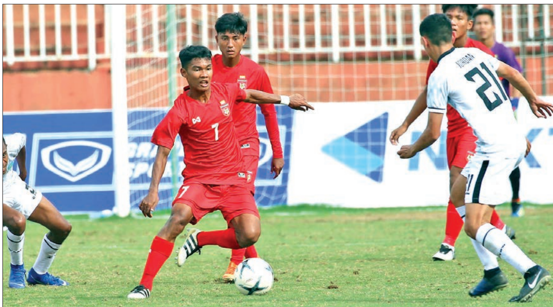
A Myanmar U-18 player (red) vies for the ball with Brunei player (white) at the Binh Duong Fields in Ho Chi Minh City, Viet Nam on 12 August.