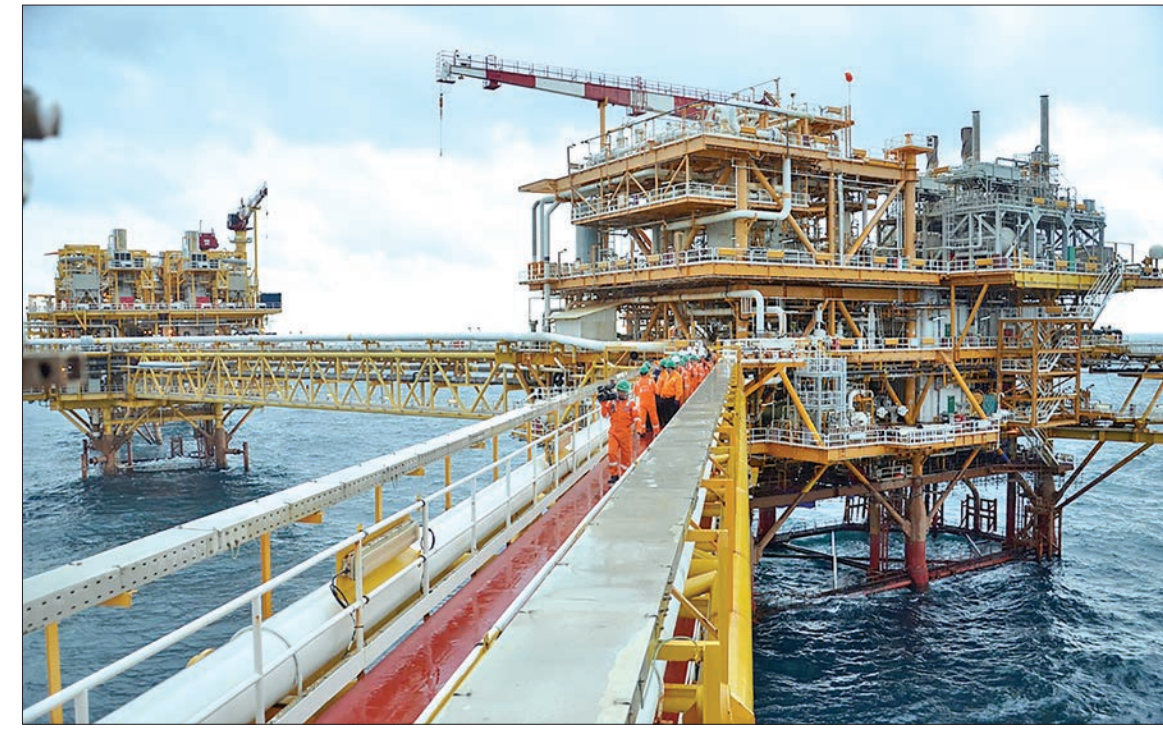
Yadana offshore natural gas production project in Mottama Gulf.

An announcement was made on the 68 th Independence Day on 4 th January 2016 that a natural gas reservoir was found at the preliminary oil field Shwe Yee Tun (1) in Block A-6 at western offshore of Myanmar. The similar announcement for commercial production was also issued for the Pyithit (1) and Shwe Yee Tun (2) oil fields in the block. These announcements brought real enjoy-