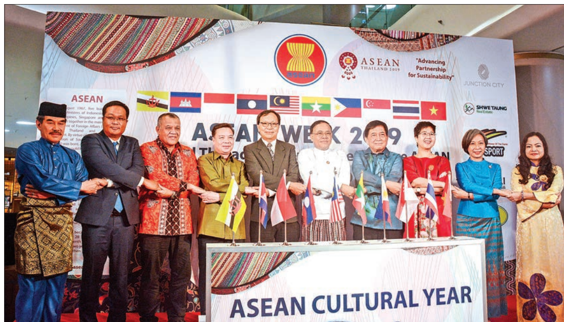
Union Minister U Kyaw Tin and ASEAN Ambassadors pose for the photo at the opening ceremony of the ASEAN Joint Cultural Event - "ASEAN Week 2019" in Yangon.

UNION Minister for International Cooperation U Kyaw Tin attended and made an inaugural remark at the opening ceremony of the ASEAN Joint Cultural Event - "ASEAN Week 2019" which was held at 11:30 am on 12 August 2019 at Side Atrium Hall of the Junction City in Yangon.