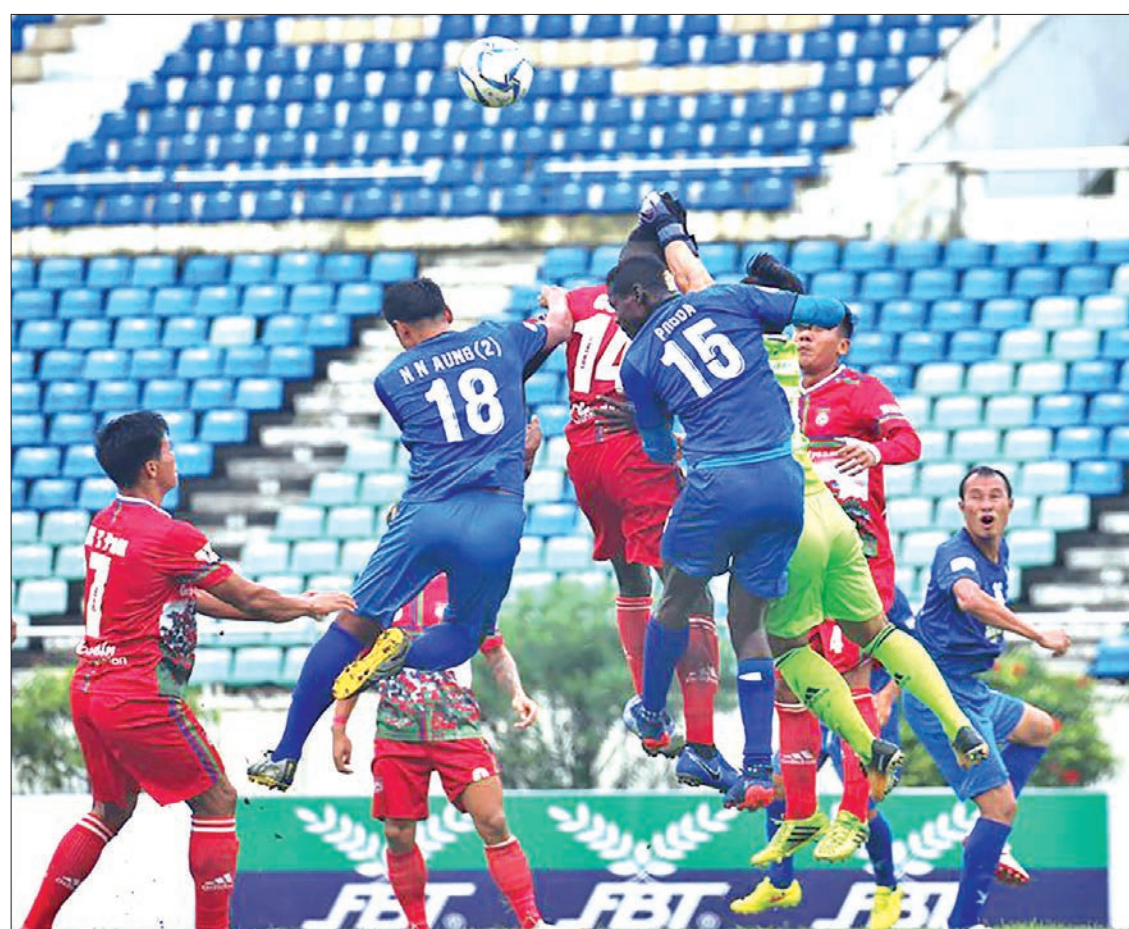
Chinland F.C. and Hantharwady F.C. players vie for the ball in their game week 20 match of MPT MNL 2019 at Thuwunna Stadium in Yangon on 12 August.