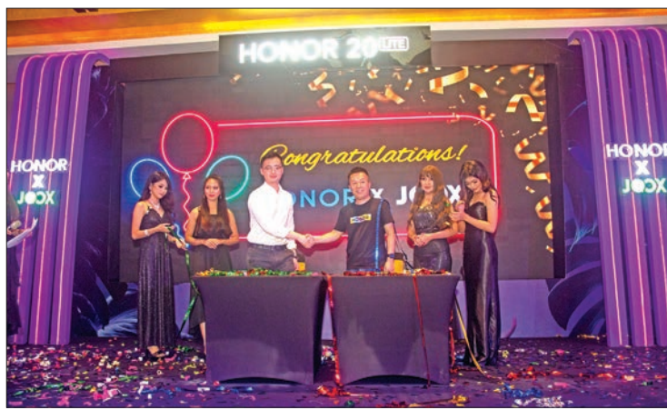
HONOR 20 Lite "Triple Lens Triple the Fun" will be available in Myanmar with 3D color gradient which is Phantom Blue and Phantom Red.

With the smartphone's signature look and feel, embodying the brand's design principles which appeal to younger, bolder consumers, it would be the ideal smartphone for those looking to make a statement, with its visually dynamic prism-shaped color gradient with a gleaming effect at the back, shining whenever it moves.—GNLM