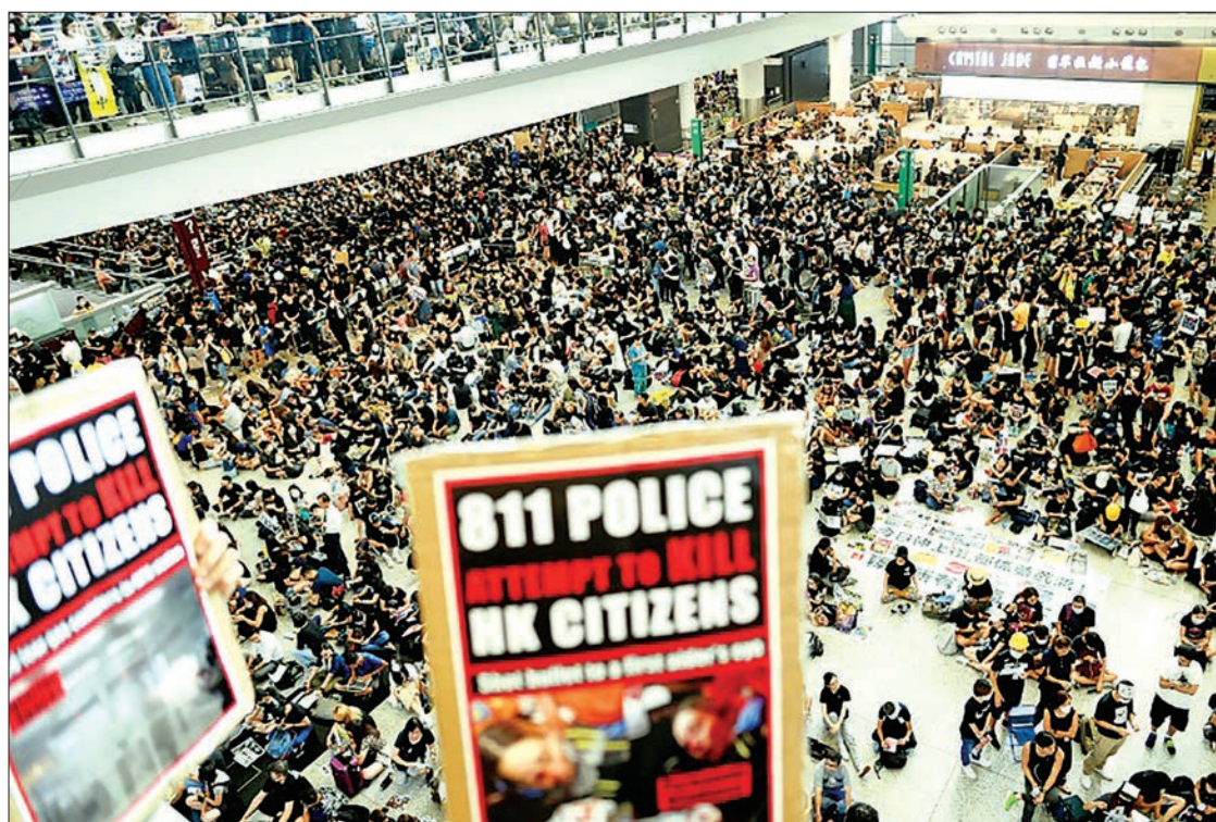
Thousands of pro-democracy protesters rally at Hong Kong's airport.

Kong International Airport have been seriously disrupted as a result of the public assembly at the airport today," it said in a statement.