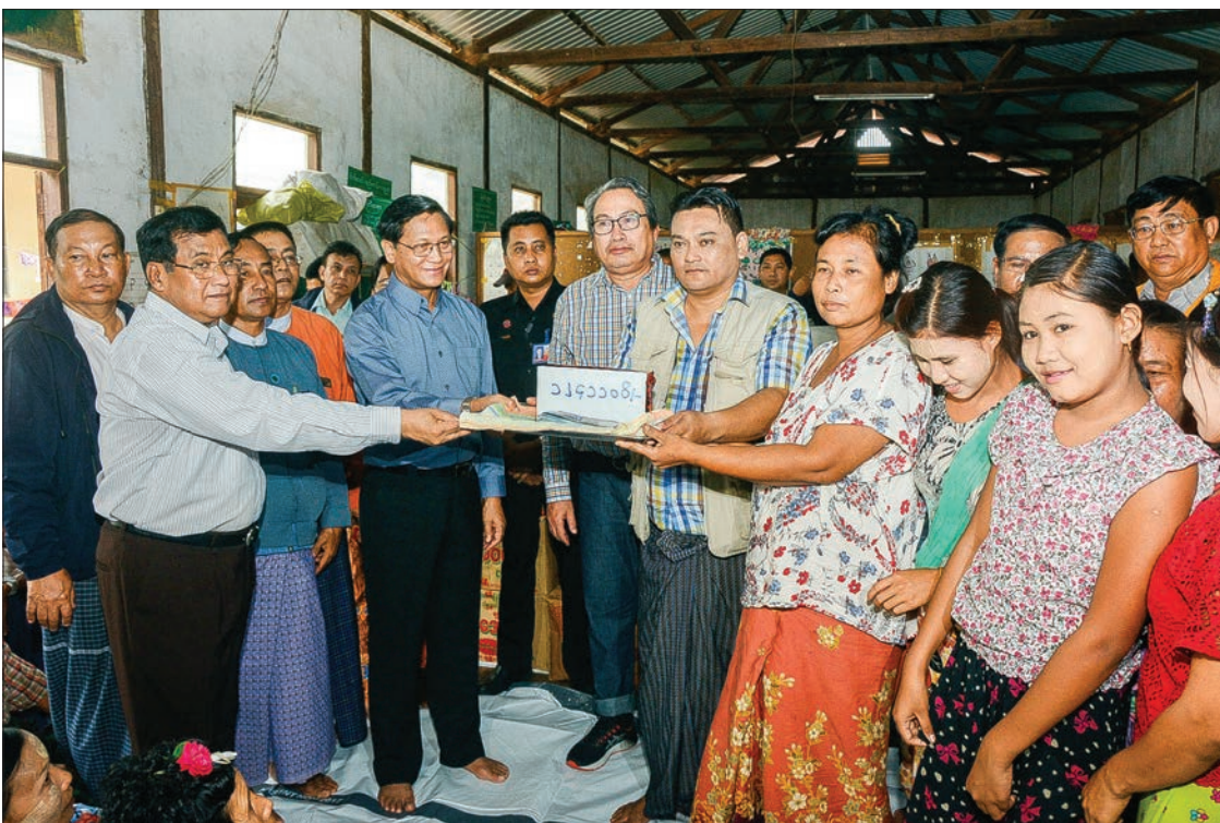
Vice President U Henry Van Thio presents cash assistance to flood victims at a temporary shelter in Kyaikmaraw, Mon State, yesterday.