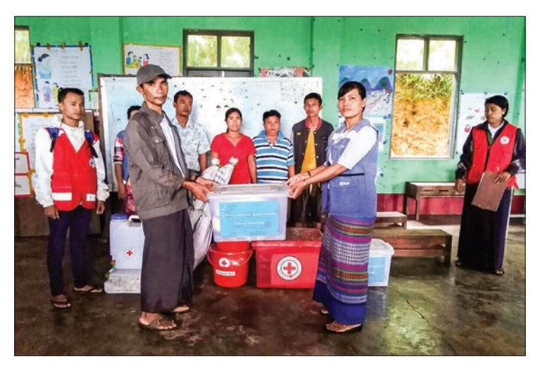
An official hands over aid to the flood victims.

Families of wrecked hoses in Pyin Nge Village and 20 partially collapsed houses were relocated to Yadanar Thiri Monastery with the help