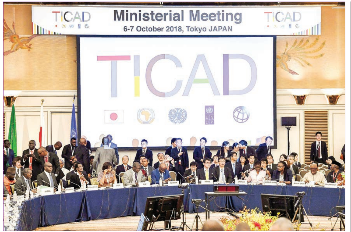
Ministers from Japan and African countries attend a two-day Tokyo International Conference on African Development in Tokyo on Oct. 6, 2018.