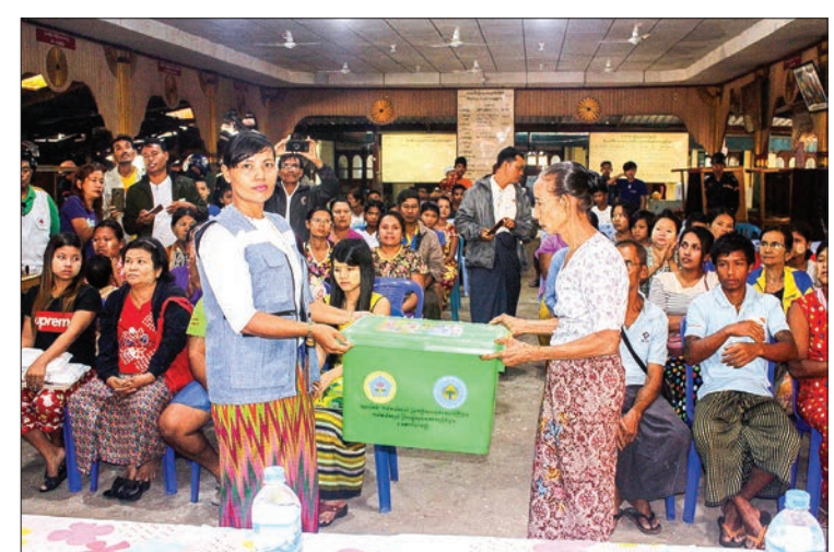
An official hands over aid to the flood victim in Myeik yesterday.

The Department of Disaster Management also provided six sets of 15 rescue equipment, K900,000 for constructing houses and K260,400 as rice ration to the six households of Pyin Nge village whose houses were destroyed by landslides. Myanmar Red Cross Society also provided six sets of construction equipment, a set of family accessories, hygiene kits and female sanitary kits. - Khine Htoo (Myeik IPRD) (Translated by Zaw Htet Oo) ■