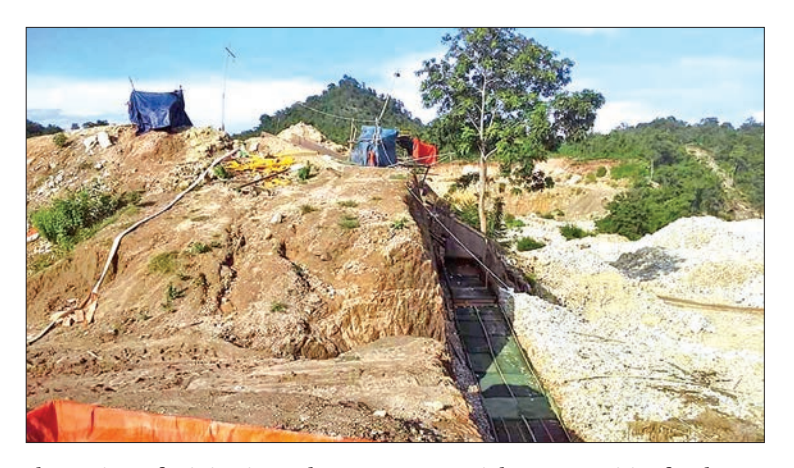
The project of mining intends to create more job opportunities for the locals and to fight illegal mining in Mogok.

Departments of township general administration, Mogok Gem Trade, Mining and forestry are working together for measurements. Plots will be allocated