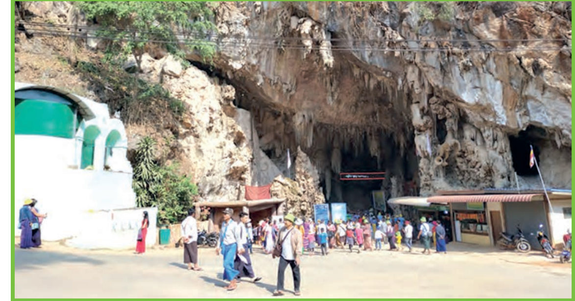
Htan San Cave.

Taunggyi Township had four towns – Taunggyi, Ayethaya, Shwenyaung and Kyauktalongyi – 51 wards, 24 village tracts and 371 villages. Taunggyi town had 22 wards, Ayethaya town had 12 wards and Shwenyaung town had 11