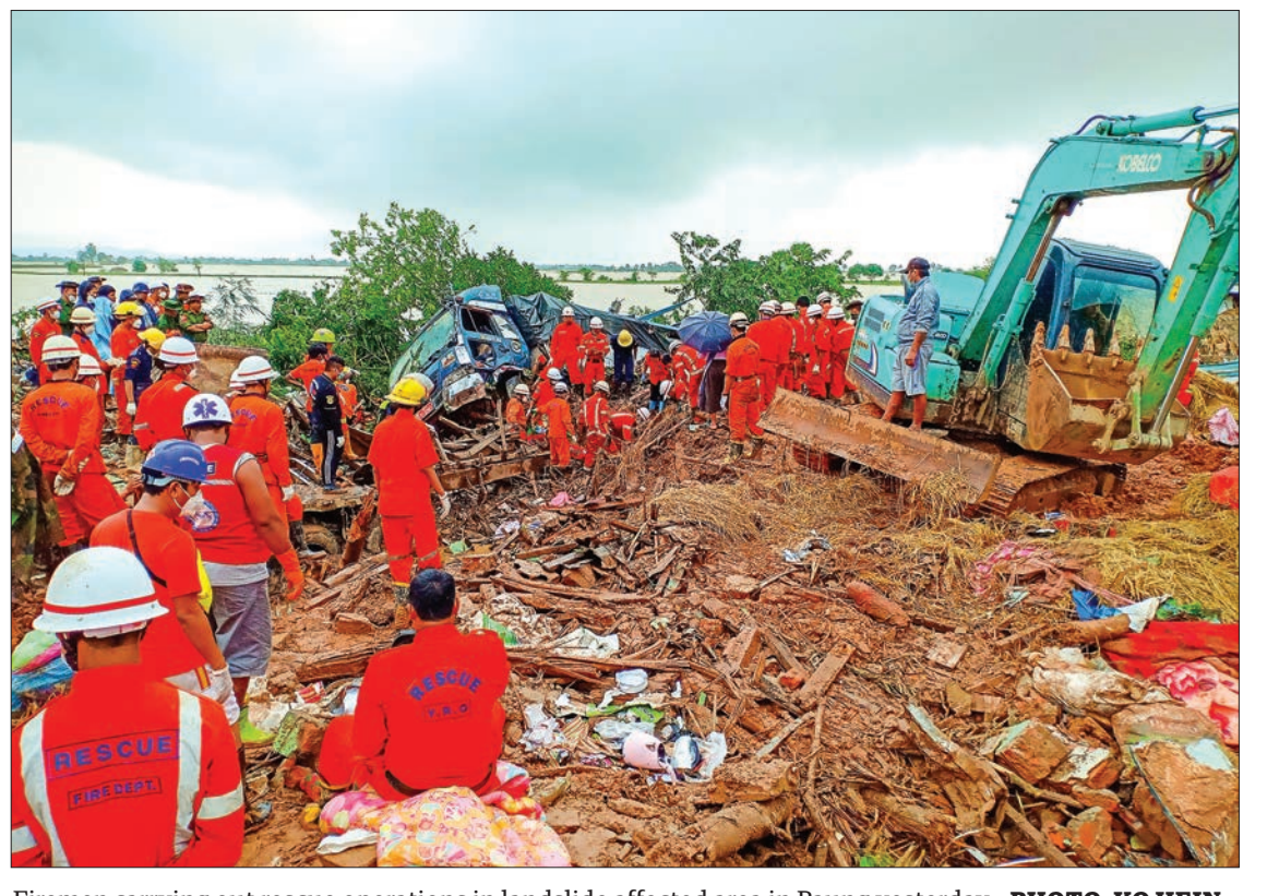
Firemen carrying out rescue operations in landslide affected area in Paung yesterday.