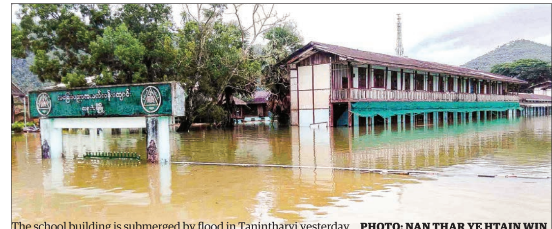
The school building is submerged by flood in Tanintharyi yesterday.