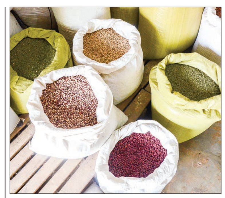
Pigeon peas are fetching around K900,000-K1 million per ton.

The 13 foreign bank branches that have been permitted by the Central Bank of Myanmar so far are MUFG Bank Ltd, Oversea-Chinese Banking Corporation Ltd., Sumitomo Mitsui Banking Corporation, United Overseas Bank Limited, Bangkok Bank Public Company Limited, Industrial and Commercial Bank of China, Malayan Banking Berhad (Maybank), Mizuho Bank Limited, Australia and New Zealand Banking Group Limited, The Joint Stock Commercial Bank for Investment and Development of Vietnam (BIDV), Shinhan Bank, E.Sun Commercial Bank Limited, and the State Bank of India.--Mon Mon ■ (Translated by EMM)