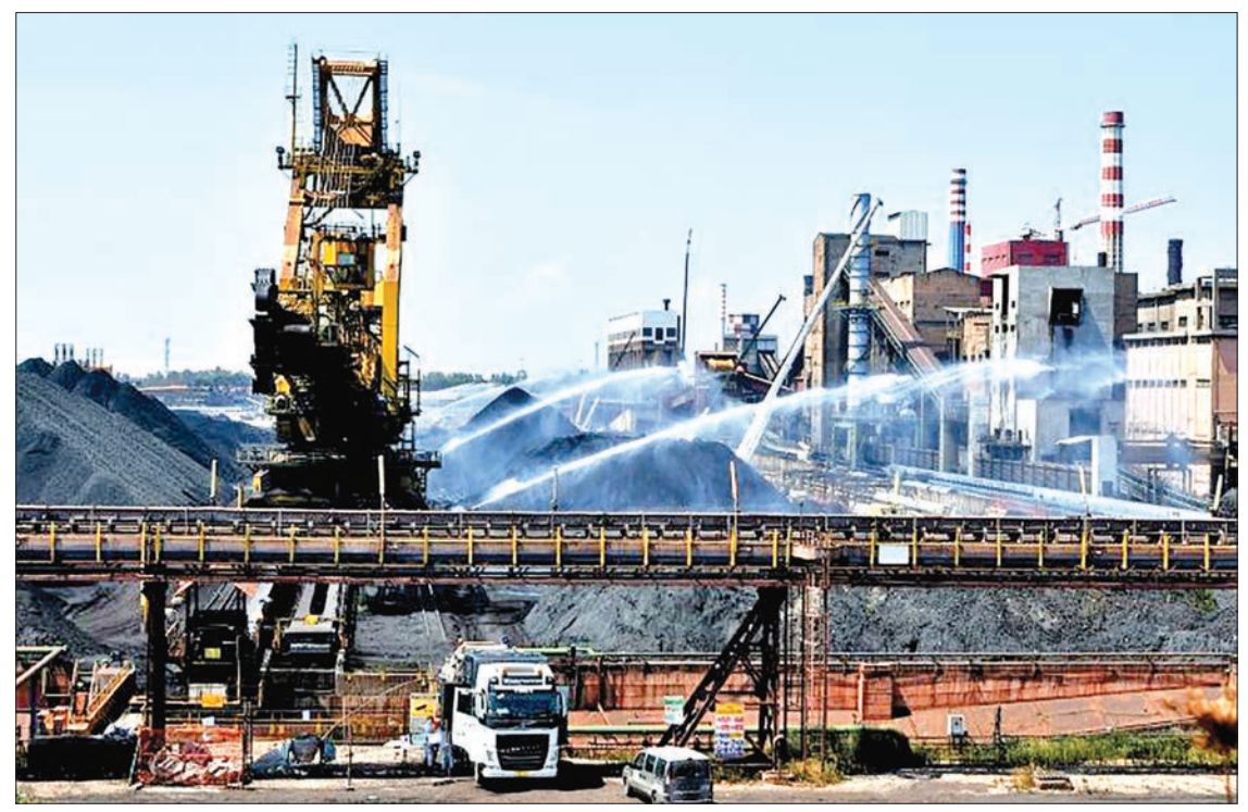
ArcelorMittal was granted a period of legal immunity to bring the Taranto plant up to environmental standards, but the Italian government revoked that in June.

AcelorMittal began leasing the plant—with an obligation to buy it—in November, and is investing 2.4 billion euros ($2.67 billion) to revive it, including 1.2 billion euros to curb pollution by 2024.