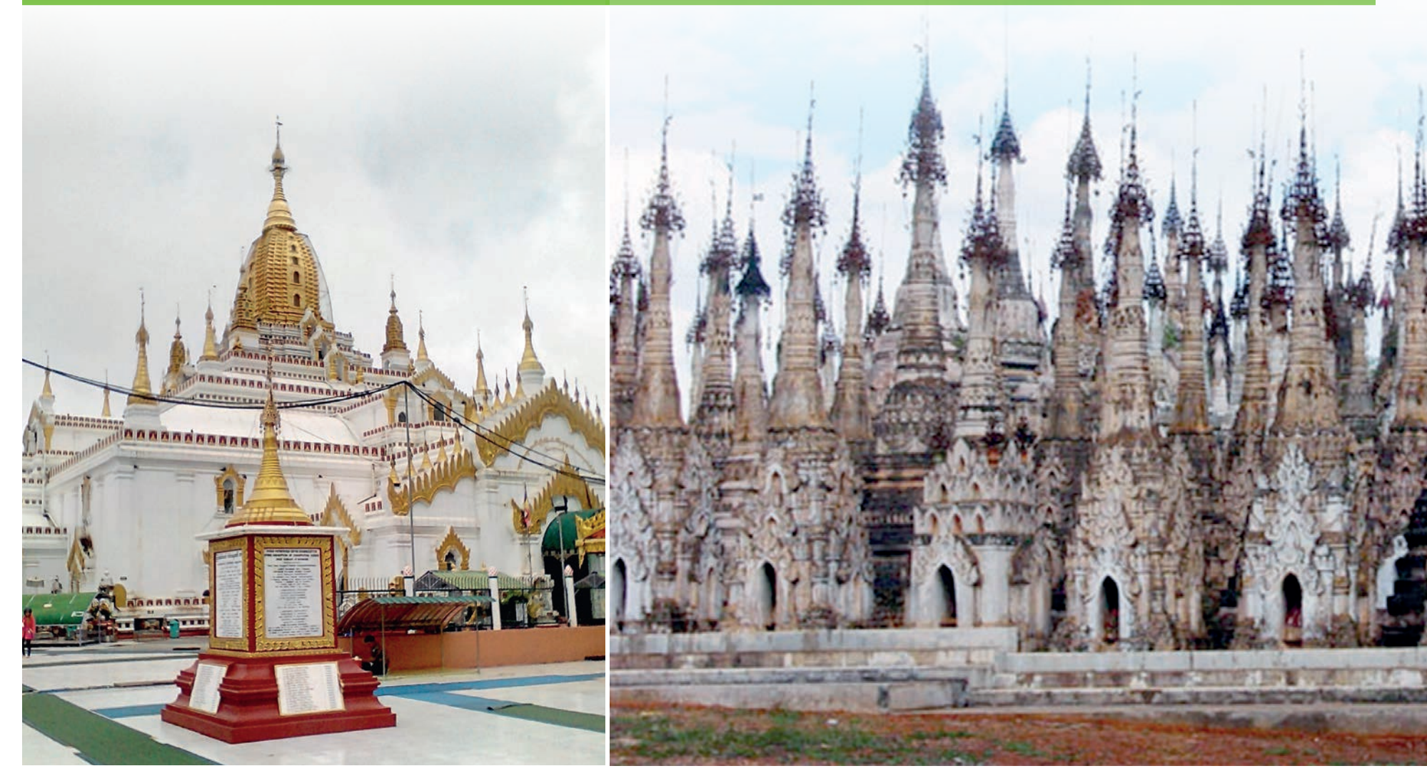
Sulamuni Pagoda.