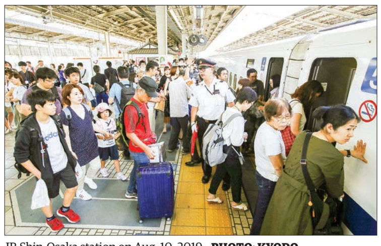
JR Shin-Osaka station on Aug. 10, 2019.

The rush of people returning home by bullet train and on expressways is expected to peak on Thursday.—Kyodo ■