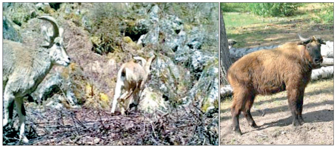
Takin, also called gnu goat, and mountain goats are rare mammals that inhabit in the Khakaborazi National Park.

Extremely rare plants in Myanmar such as local Black Orchid and Rare Tiger Orchid are the treasure of Putao. Varieties of orchids displayed for the visitors at the Khakaborazi National Park Exhibit Hall are the rare plants originated from Putao, Naung Mung, and Ma Chan Baw. Some