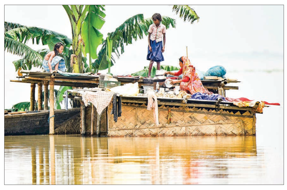
File photo shows members of an Indian family stand atop a hut at the flood affected area of Hatishila in Kamrup district of India's Assam state on 16 July 2019.

also lost their lives in Maharashtra, where several key towns have been underwater over the last few days, media reports said.