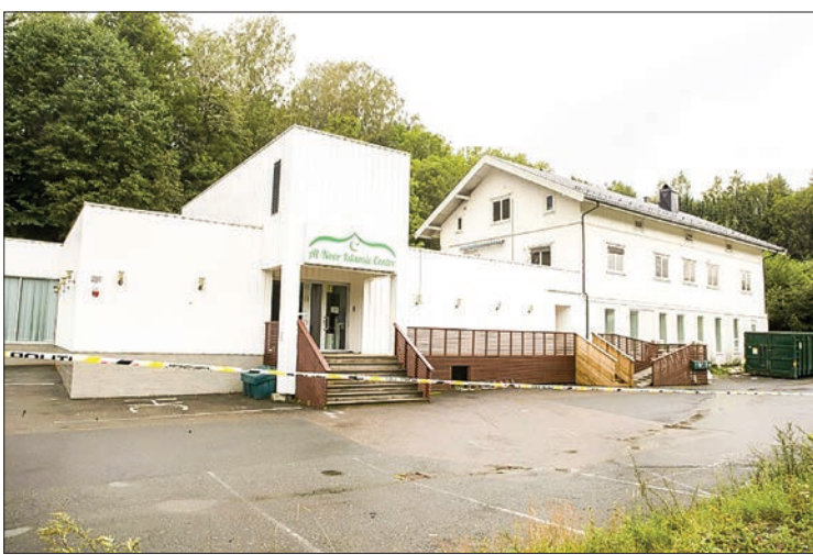
The Al-Noor Islamic Center near Oslo where a gunman opened fire before being overpowered by a 65-year-old.

There has been a recent spate of white nationalist attacks in the West, including in the United States and in New Zealand where 51 Muslim worshippers were killed in March at two mosques in the city of Christchurch.— AFP