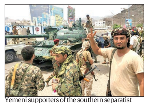
movement pose for a picture with a tank they confiscated from a military barracks in Aden where they have been fighting other forces loyal to the internationally recognised government.

"The coalition targeted an area that poses a direct threat to one of the important sites of the legitimate government," a statement said, calling on the separatist Southern Transitional Council (STC) to with-