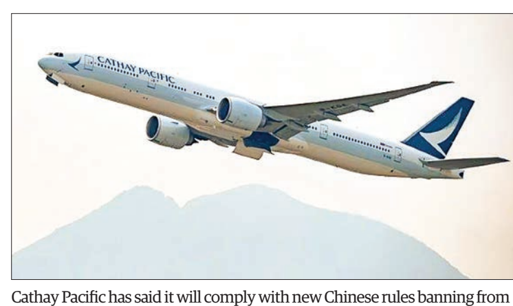
Cathay Pacific has said it will comply with new Chinese rules banning from its airspace staff who support Hong Kong's protesters.

It warned that staff deemed to support Hong Kong's "illegal protests" were banned from