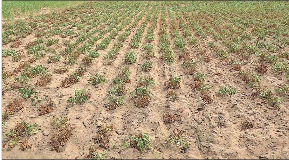
The drought troubles farmers and kills sesame plants in Magway Region.

cattle and drinking water. The situation at sesame farms is hopeless. But, we can expect groundnuts only when it rains these days. If there is no rain, the plants will turn into feedstuff for our draught cattle,” said U Myo Nyunt, a farmer from Htonpauk Village. “About 600 farmers from 17 villages in Magway Township and 13 villages in Minbu Township are growing sesame on a total of 1,500 acres of land using Good Agricultural Practices. Of them, 80 per cent of each acre of the crop has been affected by the drought,” said U Naing Win Latt, Project In-charge of PC (Progetto Continenti) Myanmar. About 70 tons of sesame grown using the GAP system was exported to Japan and other countries in 2017, and about 88 tons in 2018. —Zayatu (Magway) ■ (Translated by TTN)