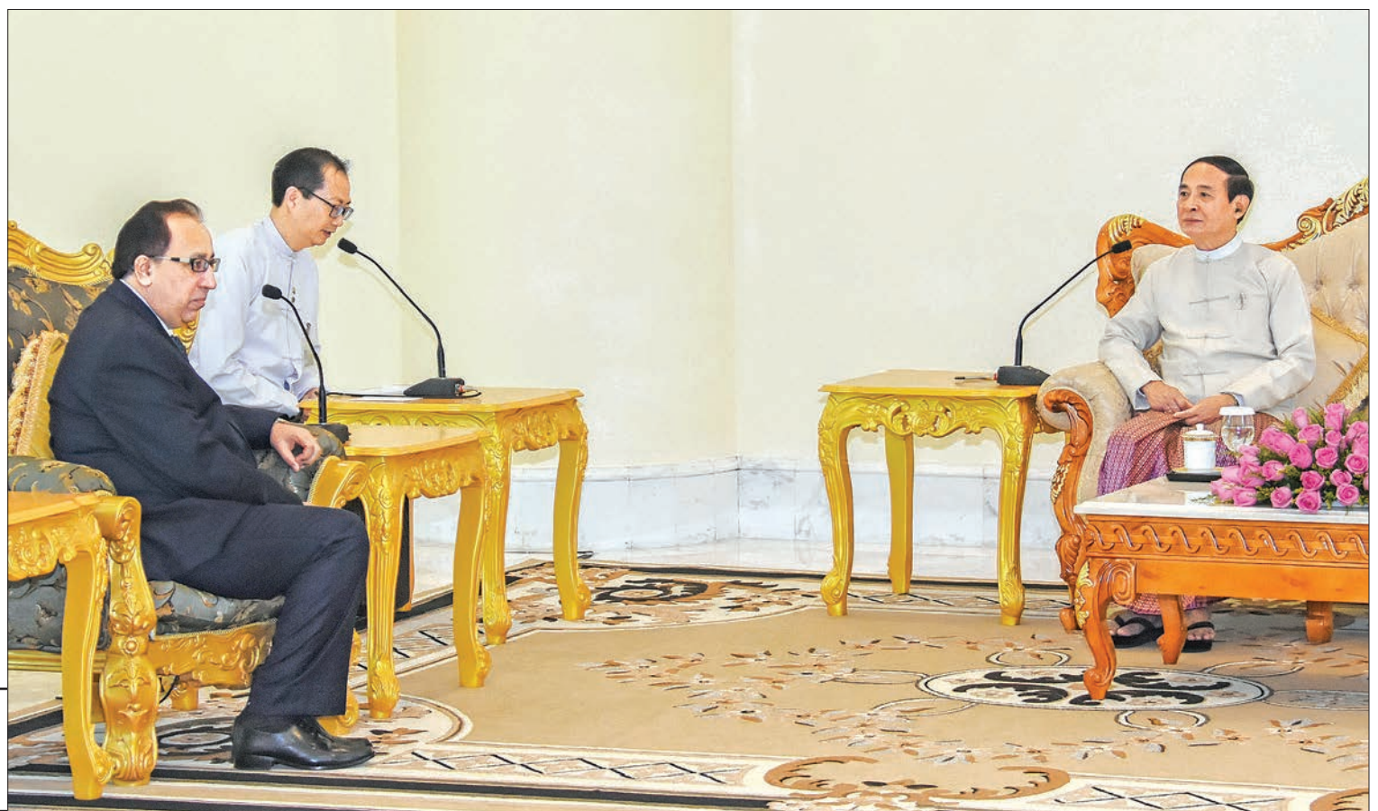
President U Win Myint meets outgoing Pakistani Ambassador Dr Khalid Hussain Memon in Nay Pyi Taw.

Also present at the meeting were Union Minister for the Office of the Union Government U Min Thu and officials.— MNA (Translated by Kyaw Zin Tun)