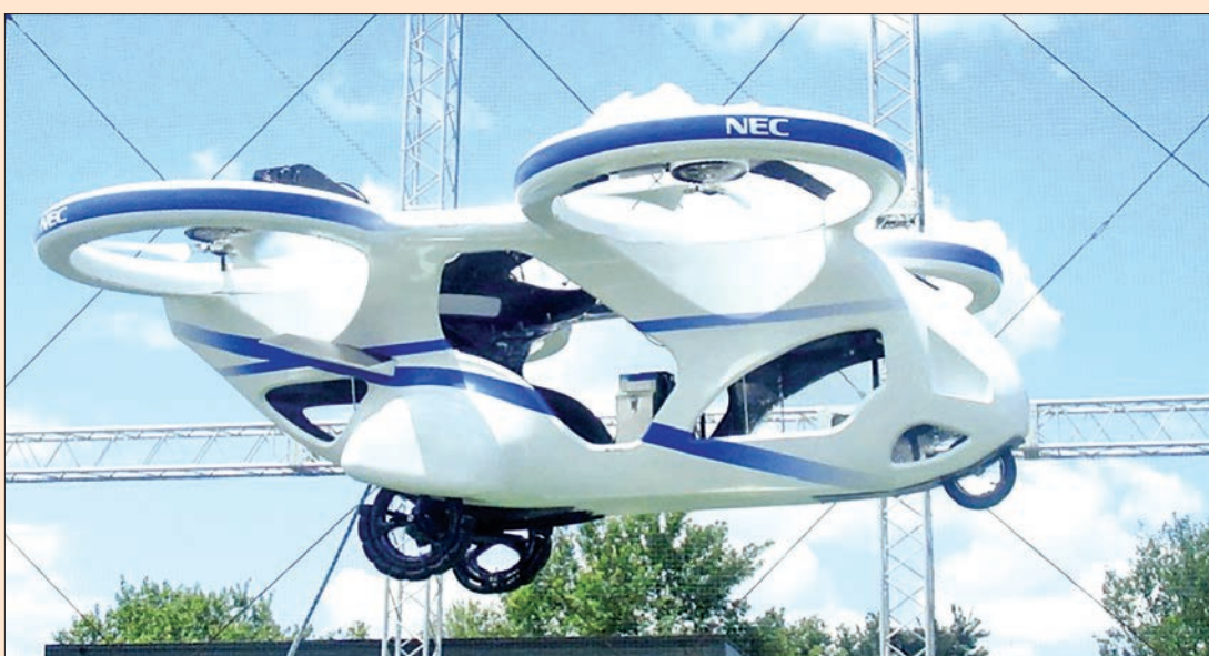
Flying vehicles are expected to be used for tourism, leisure activities, disaster relief, cargo transportation and easing of traffic congestion.