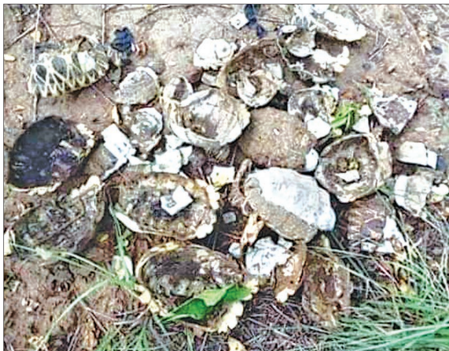
Remnants and shells of star tortoises, .

Around 60 star tortoises died due to extreme heat in March and April, said the administrator with the Shwesettaw Wildlife Sanctuary.—Zayyatu (Magway) (Translated by Win Ko Ko Aung)