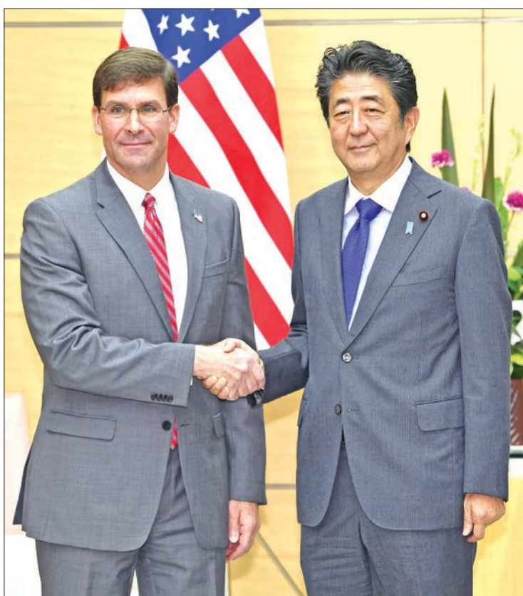
US Defence Secretary Mark Esper (l) and Japanese Prime Minister Shinzo Abe.

Enthusiasm for the plan among US allies has been mixed. Britain and Israel have announced their willingness to participate, while Germany has declined. In the meeting with Abe at the premier’s office, Esper lambasted China for destabilizing the Indo-Pacific region, saying “their military aggression and calculated strategy of predatory