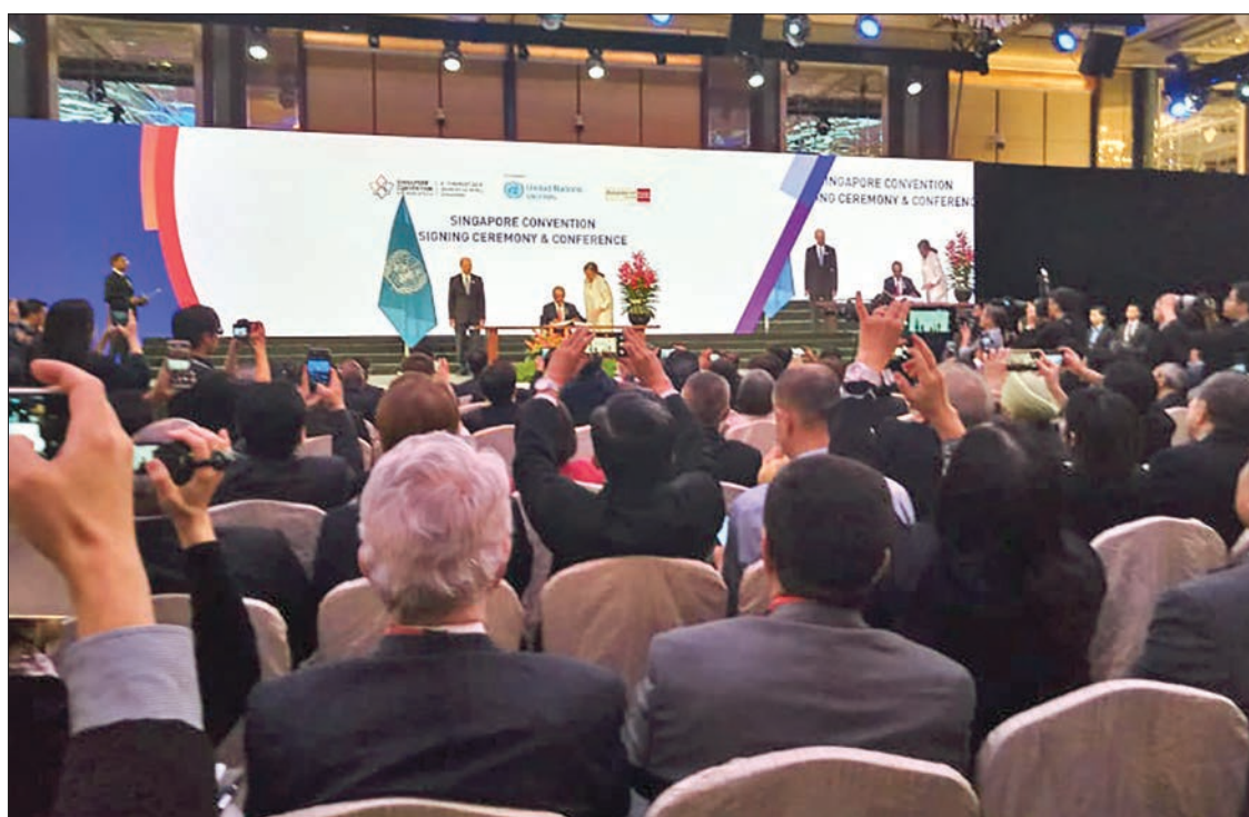
Union Minister Dr Than Myint attends the United Nation Convention on International Settlement Agreement on Mediation (Singapore Convention on Mediation) in Singapore.