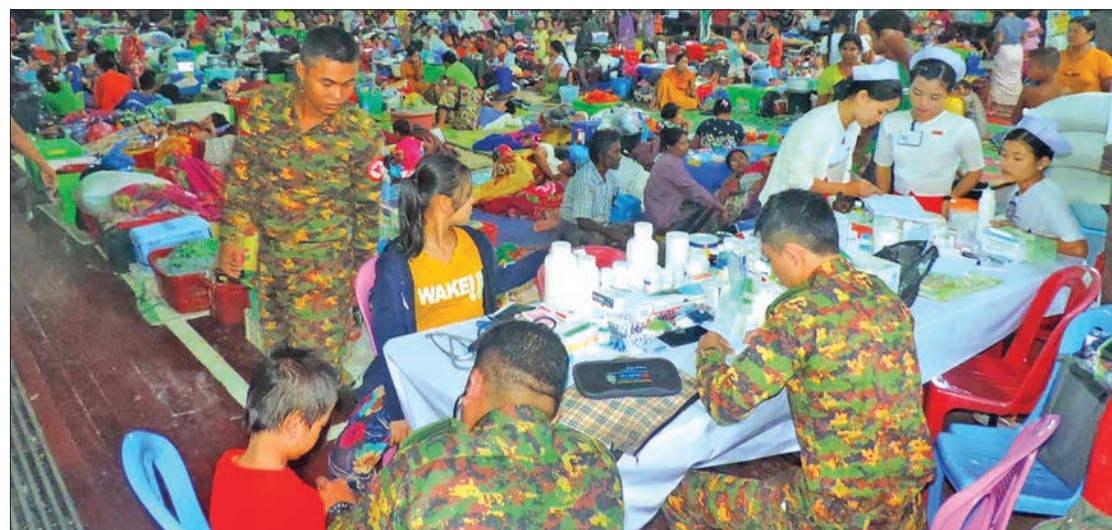
A Tatmadaw medical team providing medical check-up to flood victims at a temporary shelter in Kayin State.