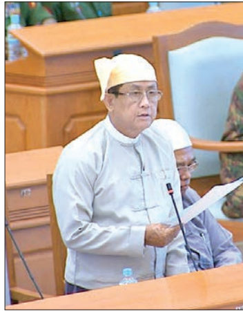
Deputy Minister for Planning and Finance U Maung Maung Win.