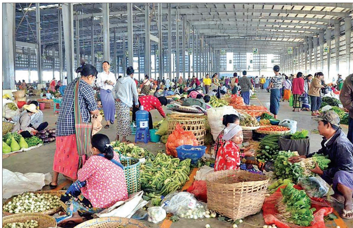
Vendors are seen at Danyingone wholesale fruit, vegetable and flower market in Yangon.