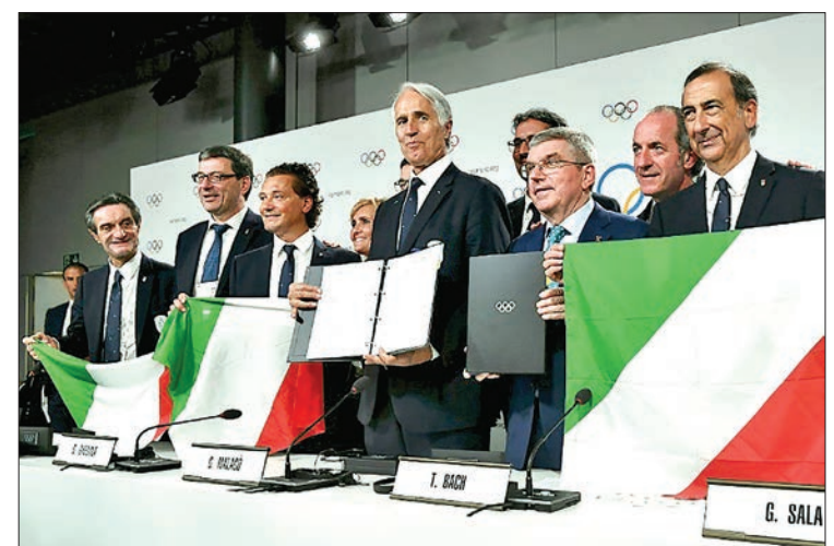
Italy risk suspension from the Olympic movement if a proposed new sports law is passed.