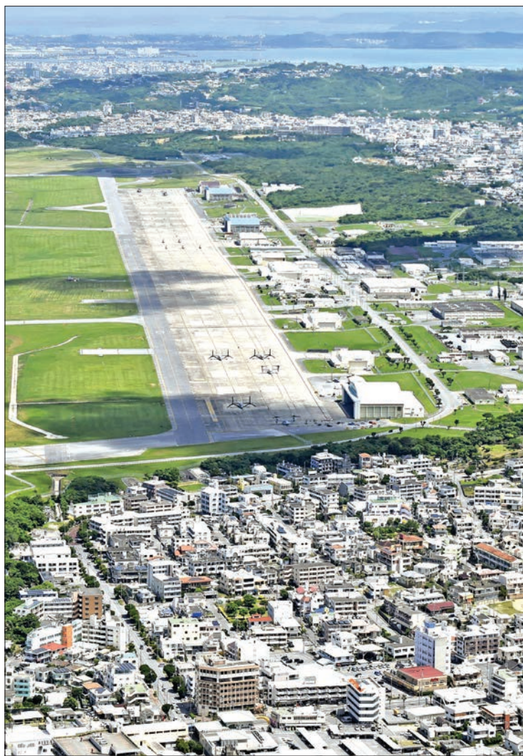
Photo taken from a Kyodo News helicopter on 16 September, 2018, shows US Marine Corps Air Station Futenma in Ginowan in Japan's southern island prefecture of Okinawa.

In August last year, the Okinawa government retracted its permission for the landfill work, citing weak ground found in the planned reclamation area.—Kyodo News ■