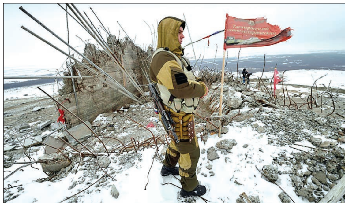
Kiev reported Tuesday that four soldiers died in a rocket-propelled grenade attack, the highest daily toll since a truce went into force on 21 July.

Ukrainian forces and pro-Russian separatists, who carved out two “people’s republics” in eastern Donetsk and Lugansk regions, have fought since April 2014, after the annexation of Crimea.—AFP ■