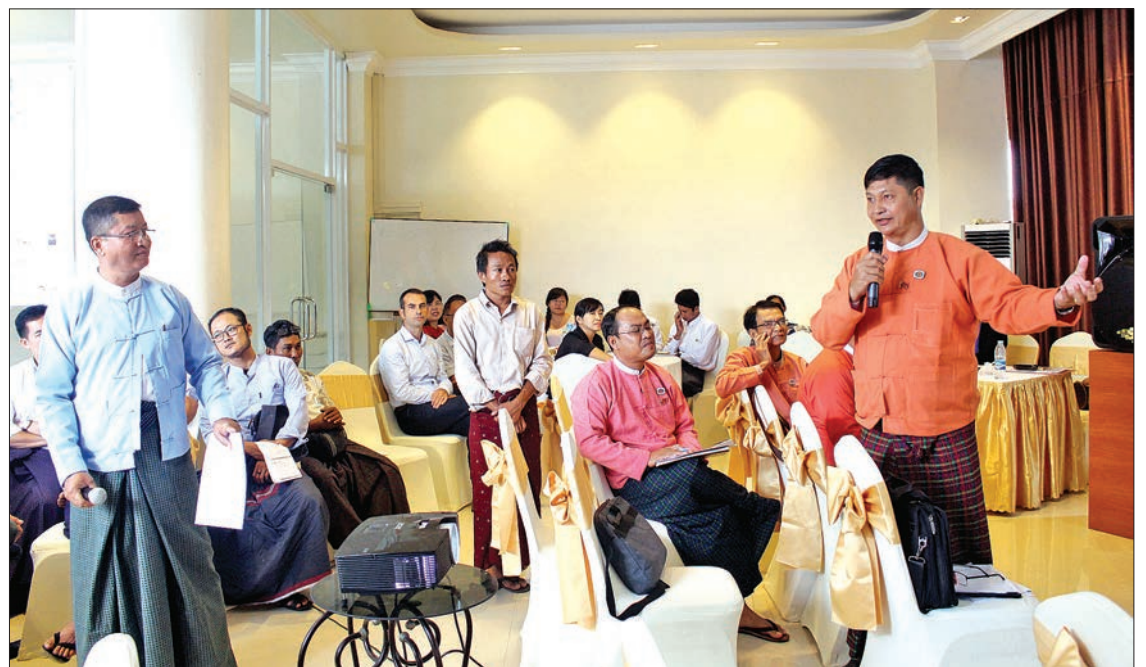
Participants discuss marine conservation for Myanmar at the workshop in Myeik.

Efforts on marine conservation will be concentrated over an area covering 1,830.77 square kilometres in Don Island at Kyunsu Township, and