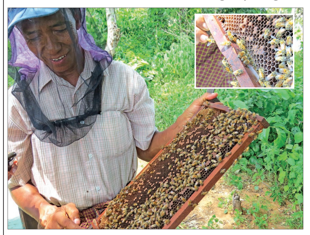
Bee-keepers inspect beehives for honey production in Magway.

A total of 86 beekeepers have produced honey on a manageable scale by placing around 13,000 beehives near local sesame and plum farms in Magway Region.