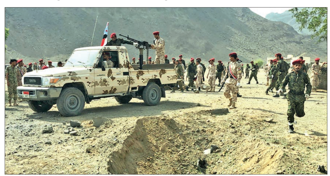
Yemeni security forces rush to the scene of a missile attack on a military camp west of Yemen's government-held second city Aden, on 1 August, 2019. PHOTO: AFP

The aerial attack hit as senior commanders were overseeing a passing out parade for newly graduated cadets at Al-Jala Camp, 20 kilometres (13 miles) from the centre of Aden.—AFP