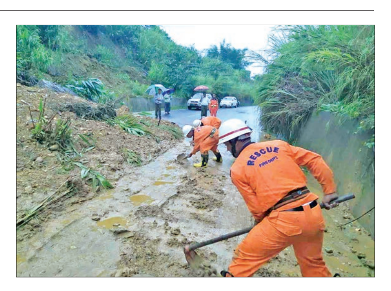
A member of a rescue team clearing the blockage on the Myitkyina-Tanai Road due to heavy rain in Mogoung Township of Kachin