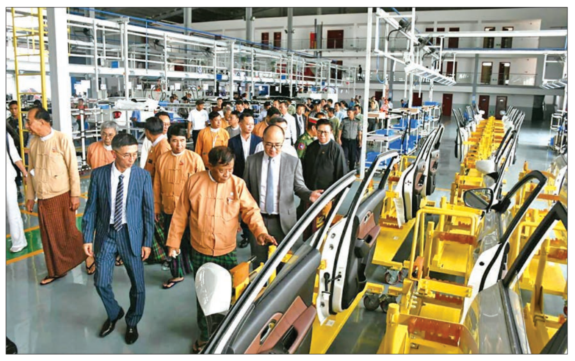
Chief Minister of Mandalay Region Dr Zaw Myint Maung and officials observe automobile plant of the Gold AYA Motors International Group in Myotha industrial park, Mandalay.

GOLD AYA Motors International Group in Myotha Industrial Park, Mandalay Region can manufacture 5,000 cars annually. They are to manufacture 10 models of 7