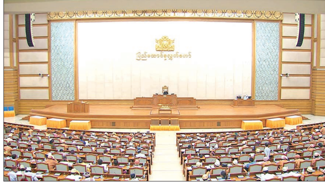
Pyidaungsu Hluttaw holds 7th day meeting of 13th regular session in Nay Pyi Taw yesterday.

He said voiced his opinion that while there may be facts that indeed require amending, negotiating the determination, possibilities and obligations would be the more suitable course of action. He said none of the members of the current constitution amendment committee are legal experts and thus, their meetings are akin to drafting a new constitution instead.