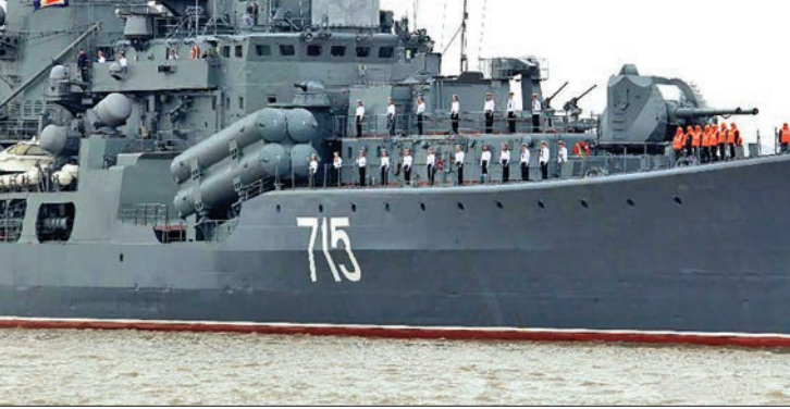
fleet enters a navy port in Shanghai on Sunday, May 18, 2014 for the China-Russia Joint Sea-2014 naval drills.

Russia held its first Ocean Shield drills in September 2018 in the Mediterranean.—Xinhua ■