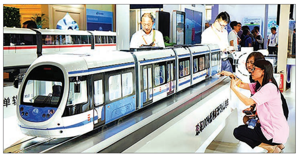
Visitors look at the latest models of urban rail trains shown at the International Urban Rail Exhibition in Beijing.

Construction of the subway line started at the end of 2016, and it will become the first fully-automatic driverless subway