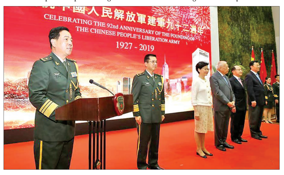
Guests attend a reception held to mark the 92^{nd} anniversary of the PLA's founding in Hong Kong, south China, 31 July, 2019. The Chinese People's Liberation Army (PLA) Garrison in the Hong Kong Special Administrative Region (HKSAR) hosted a reception on Wednesday to mark the 92^{nd} anniversary of the PLA's founding.

Armored vehicles, portable barbed wire and water cannon were showed before another scene in which scores of protesters were captured with their arms tied behind their backs. —Kyodo News