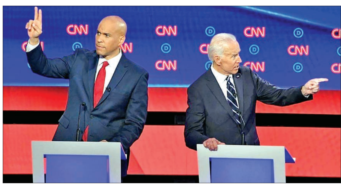
Democratic presidential hopefuls Former Vice President Joe Biden (r) and US Senator from New Jersey Cory Booker gesture during the second round of the second Democratic primary debate of the 2020 presidential campaign season.

Biden doubled down, telling potential voters to be cautious of a 10-year phase-in period pro-