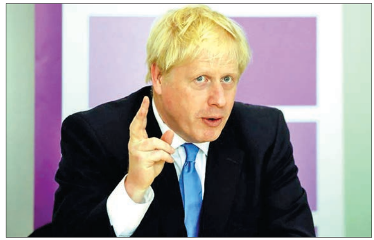
Prime Minister Boris Johnson's Conservative Party looks set to lose a byelection cutting his parlimantary majority to just one.

Finance minister Sajid Javid on Wednesday announced an extra £2.1 billion ($2.6 billion, 2.3 billion euros) to prepare for the possibility of no-deal, with a par-