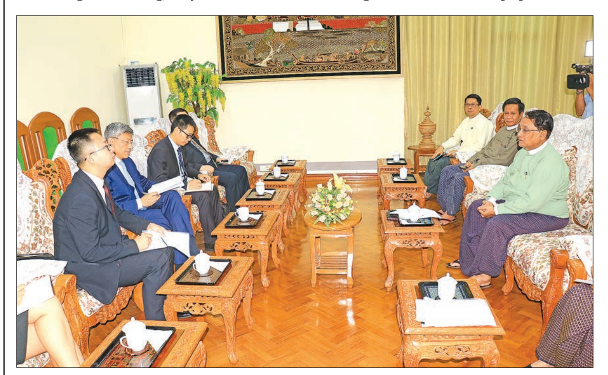
Union Minister Dr Than Myint discusses with Chinese Ambassador Mr Chen Hai in a meeting at his office in Nay Pyi Taw yesterday. PHOTO: MNA

der economic zone of Myanmar and China and enhancing people-to-people ties, intergovernmental and business relations between the two countries.—MNA (Translated by Kyaw Zin Lin)