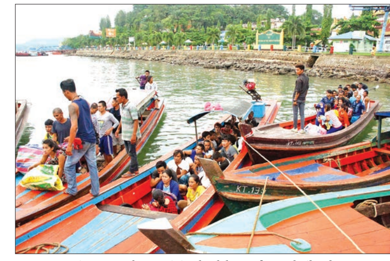
Myanmar migrant workers arriving back home from Thailand. PHOTO: