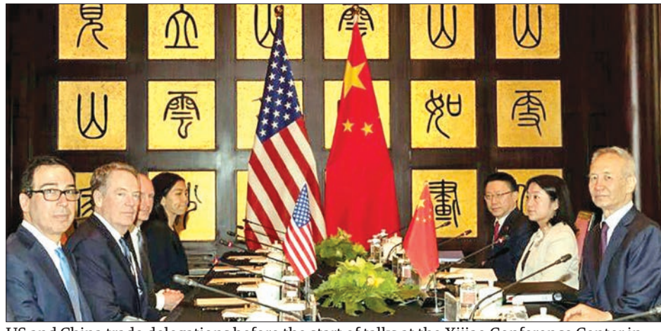
US and China trade delegations before the start of talks at the Xijiao Conference Center in Shanghai.

Chinese enterprises started approaching US suppliers in mid-July to