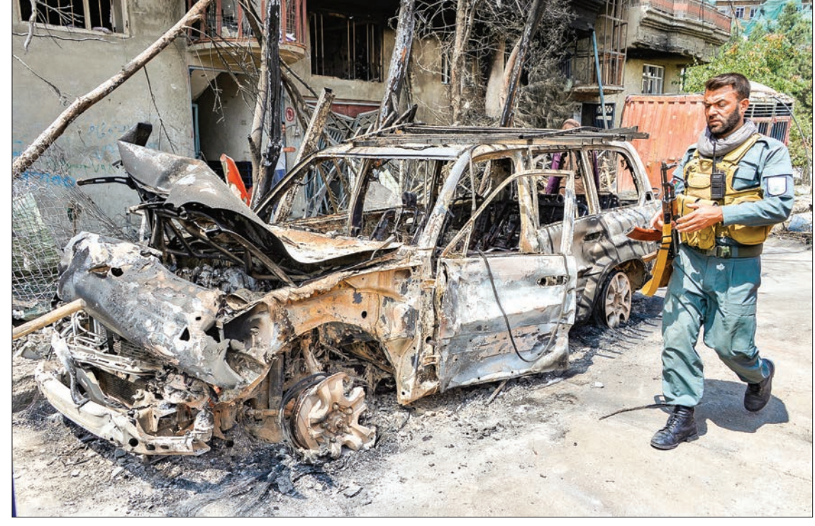
A member of Afghan security forces walk at the site of an attack in Kabul on 29 July 2019, a day after a deadly assault targeting a political campaign office. Deadly violence marred the start of Afghanistan's election season on the weekend, after President Ashraf Ghani insisted "peace is coming" to the war-torn nation.