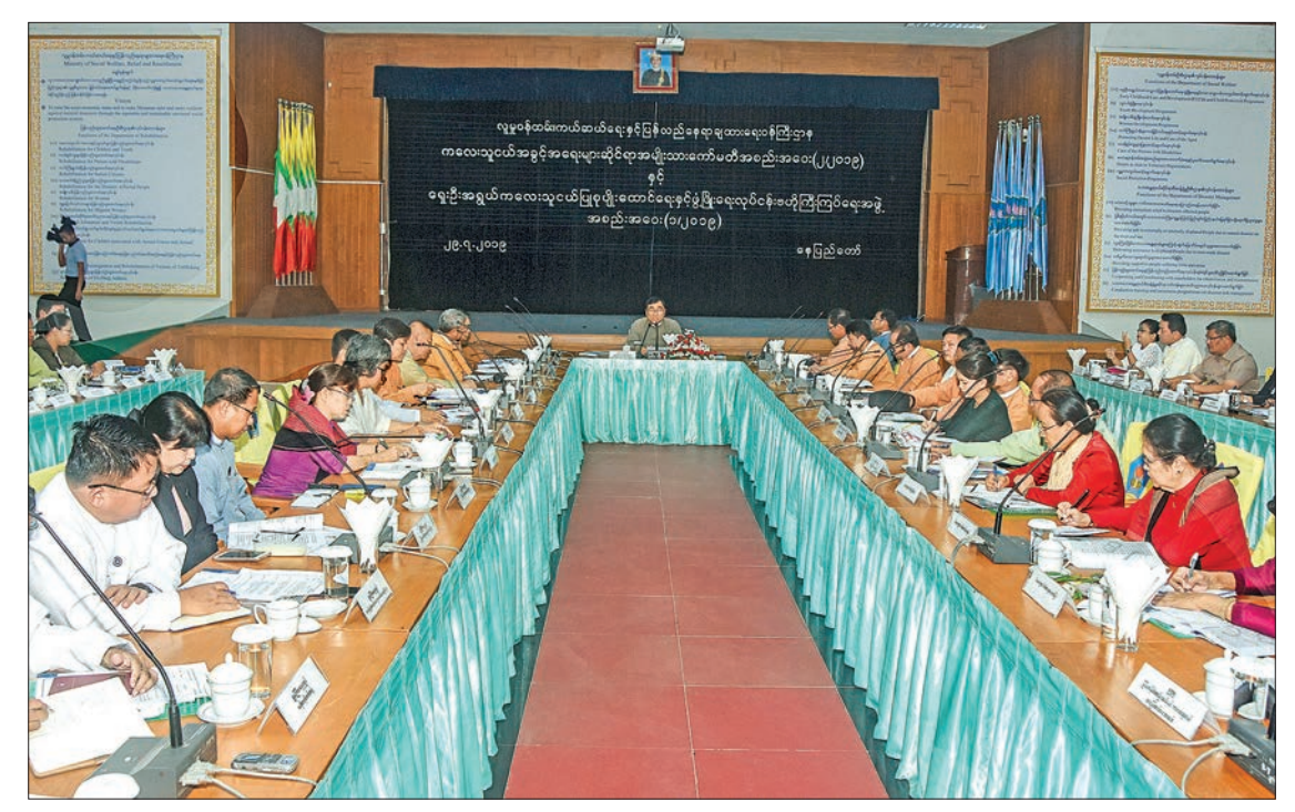
Union Minister Dr. Win Myat Aye delivers the speech at the National Committee for Children's Rights in Nay Pyi Taw yesterday.

The Union Minister remarked that there has been public misunderstanding and worry over the amended law,