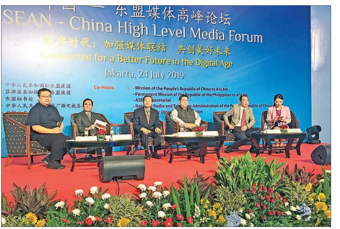
Deputy Minister for Information U Aung Hla Tun attends the ASEAN-China High Level Media Forum in Jakarta on 24 July.

At the forum, Deputy Minister U Aung Hla Tun took part as a panelist in the discussion of 'The Role of Media in Building a Closer ASEAN-China Community with a Shared