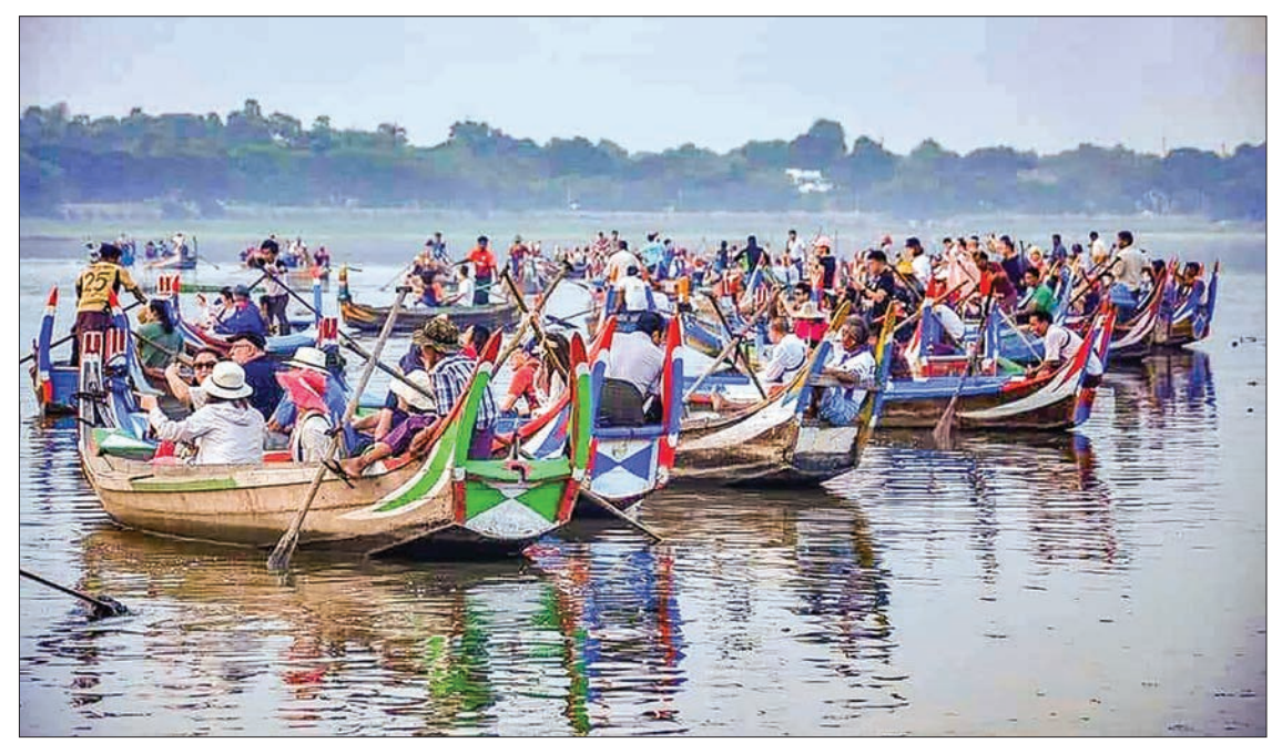
Tourists sitting on boats to watch sunset on Taungthaman Lake in Amarapura, Mandalay Region.

rivals from Asian countries has been increasing, with most tourists coming in from China. Tourist arrivals from China doubled in January this year against last year, followed by arrivals from France and Thailand. A high tourist inflow helps in the growth of