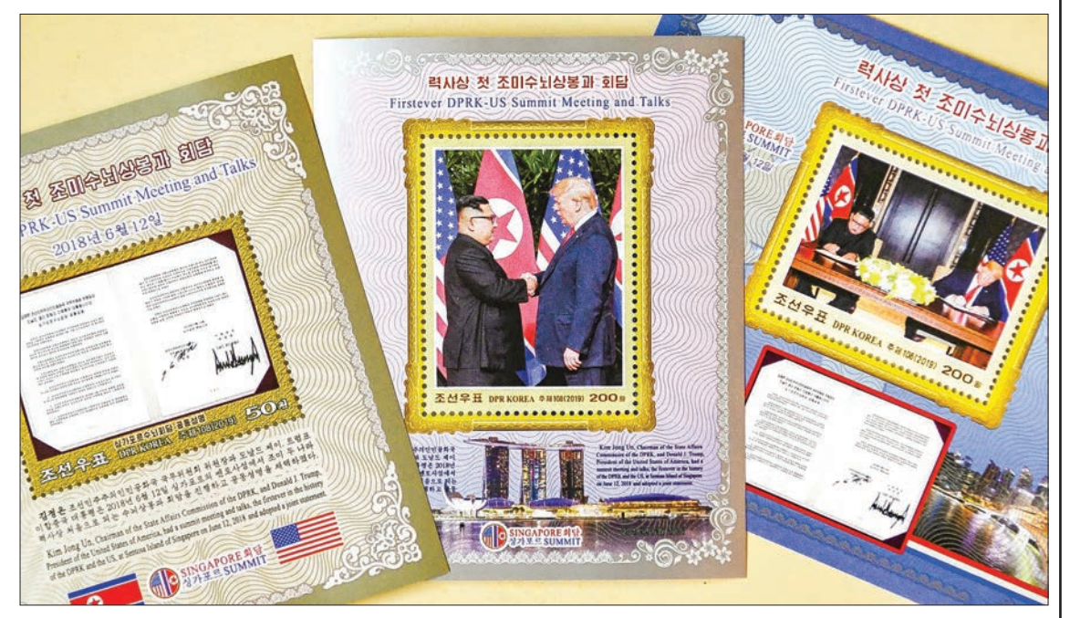
Stamps commemorating the first-ever US-North Korea summit in June 2018 are on sale in Pyongyang.

South Korean President Moon Jae In, who accompanied Trump to Panmunjeom, will not