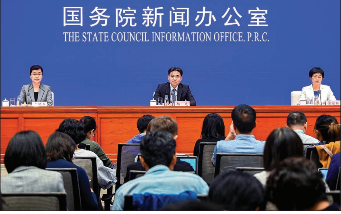
Yang Guang (c) and Xu Luying (r), spokespersons for mainland China's Hong Kong and Macao Affairs Office (HKMAO) of the State Council, attend a press conference in Beijing concerning the ongoing protests in Hong Kong on 29 July 2019.

But the cabinet-level Hong Kong and Macau Affairs Office merely reiterated its condemnation of the protests and Beijing's "strong" support for Hong Kong