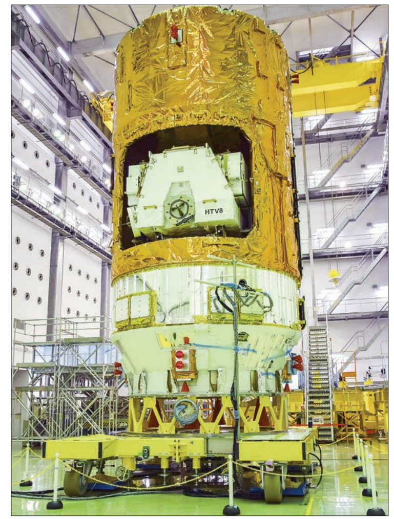
The Kounotori-8 unmanned cargo transporter is shown to the press on 19 July 2019, at the Tanegashima Space Center in Kagoshima Prefecture, southwestern Japan. The Japan Aerospace Exploration Agency plans to launch the cargo transporter on an H-2B rocket with supplies for the International Space Station in around September.

TOKYO — Japan will launch a rocket to the International Space Station in September containing an unmanned cargo transporter, the country's space agency said Monday.