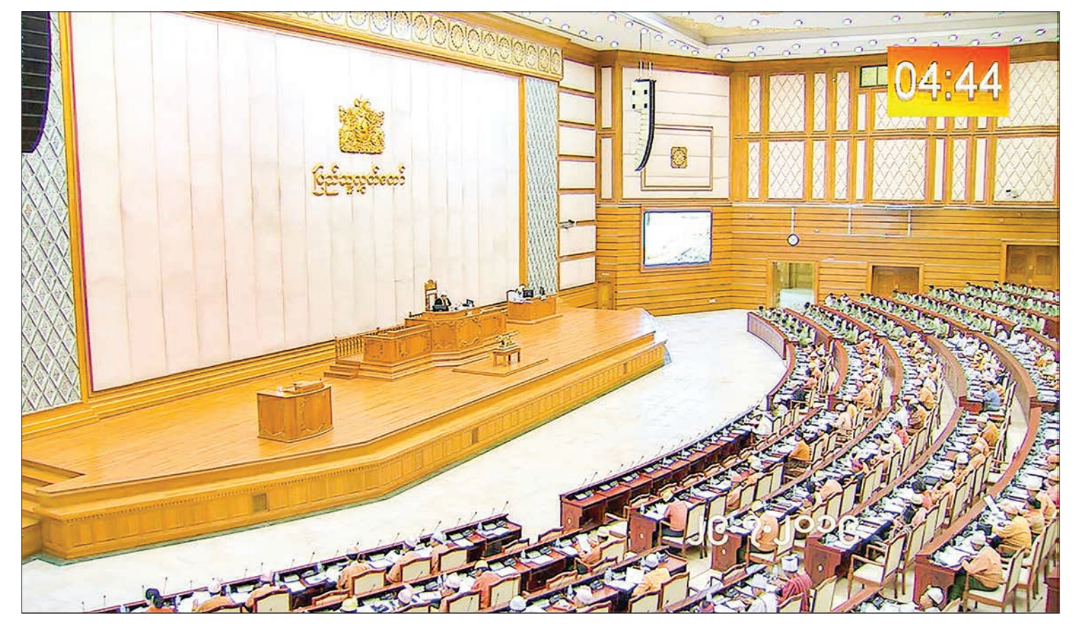
Pyithu Hluttaw convenes in Nay Pyi Taw yesterday.

THE 13<sup>th</sup> regular session L of 2<sup>nd</sup> Pyithu Hluttaw held its 5th day meeting yesterday, with the queries and proposal of MPs and a bill submitted by a committee.