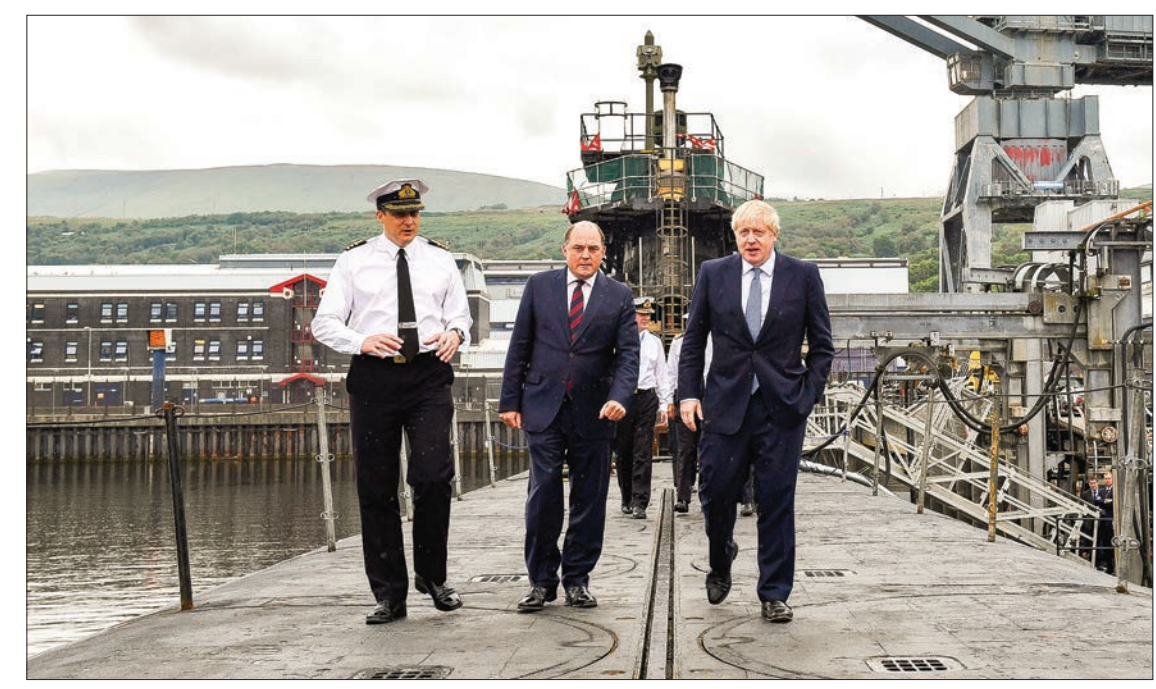
Britain's Prime Minister Boris Johnson (R) visits Vanguard-class submarine HMS Vengeance with Britain's Defence Secretary Ben Wallace (C) during a visit to Faslane Naval base (HM Naval Base Clyde), north of Glasgow in Scotland on 29 July 2019. New British Prime Minister Boris Johnson makes his first official visit to Scotland on Monday in an attempt to bolster the union in the face of warnings over a no-deal Brexit.

May was forced to resign after failing three times to get the Brexit deal through the House of Commons, in the process delay-