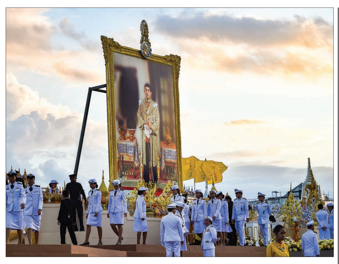
Thai officials walk in front of a portrait of Thai King Maha Vajiralongkorn during his 67<sup>th</sup> birthday celebrations in Bangkok on 28 July 2019.