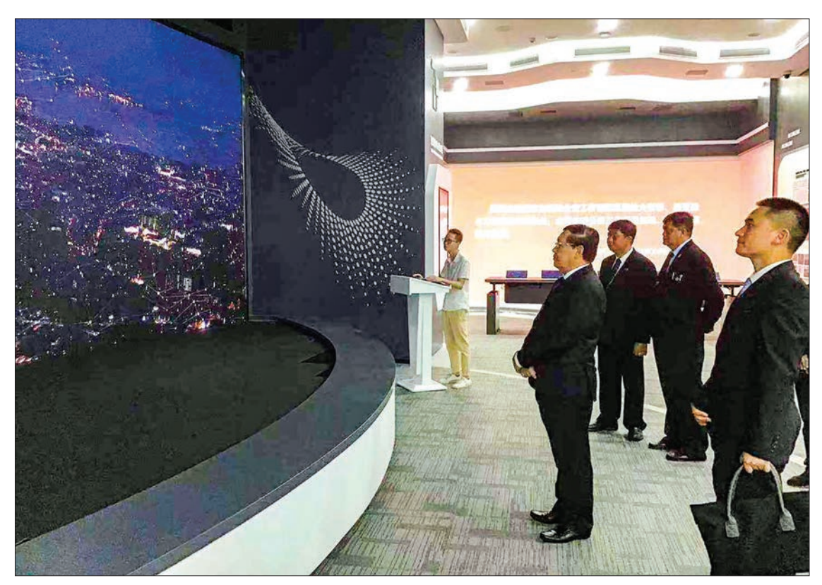
Union Minister U Thein Swe visits the command center of the Public Security Department in Guangdong Province, PRC.

Afterwards, the Union Minister met with Mr Li Chunsheng. the Vice-Governor of Guangdong province and its director of public security, where they discussed possible cooperation with Myanmar on the rule of law and apprehending foreign crime suspects.