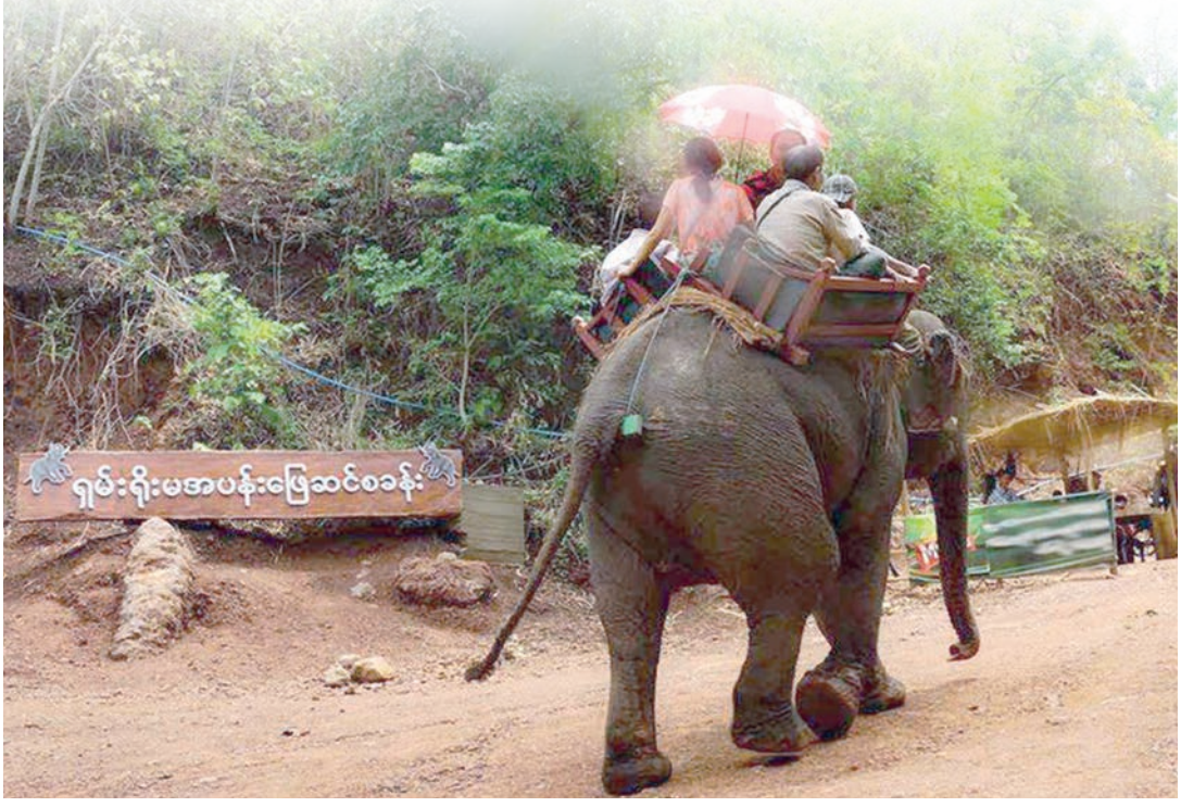
Visitors should enjoy elephant ride at Shan Yoma Elephant Camp in Kalaw Township, Southern Shan State.. PHOTO: SUPPLIED

Situated in Nant Pan Tet Village, a border village of Mandalay Region and Shan State and about 70 miles away from Meikhtila, vacationists can enjoy elephant rides in the forest, visit a village where mahouts reside, take bath in the waterfall's pond and take photos and videos in the camp, he added. The natural relaxation camp was opened to public on 13 February 2018. Visitors will be entertained by ten elephants including two baby elephants.