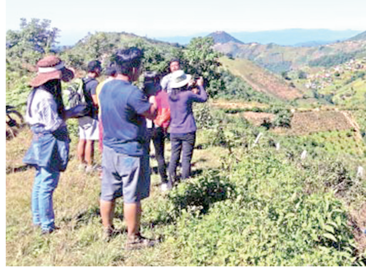
Beautiful landscape view of Kalaw.

Kalaw is cold and you would need to bring along warm clothes. It can be said that it is cold all the time. Sometime there were mists and fogs so some sort of headdress or hat is also required. Or else, you can certainly catch a cold or have a running nose.