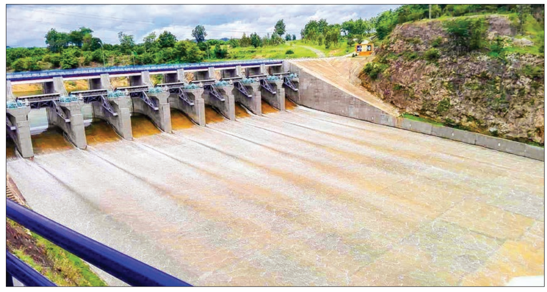
Kyeeohn-Kyeewa Dam in Pwintbyu Township, Magway Region, overflows 2.1 feet above its 340 feet mark yesterday.

water flowing into the spillway reaches the maximum high flood level and is likely to flood areas south of the dam. Yellow flags are set up at this stage to signify emergency level 2.