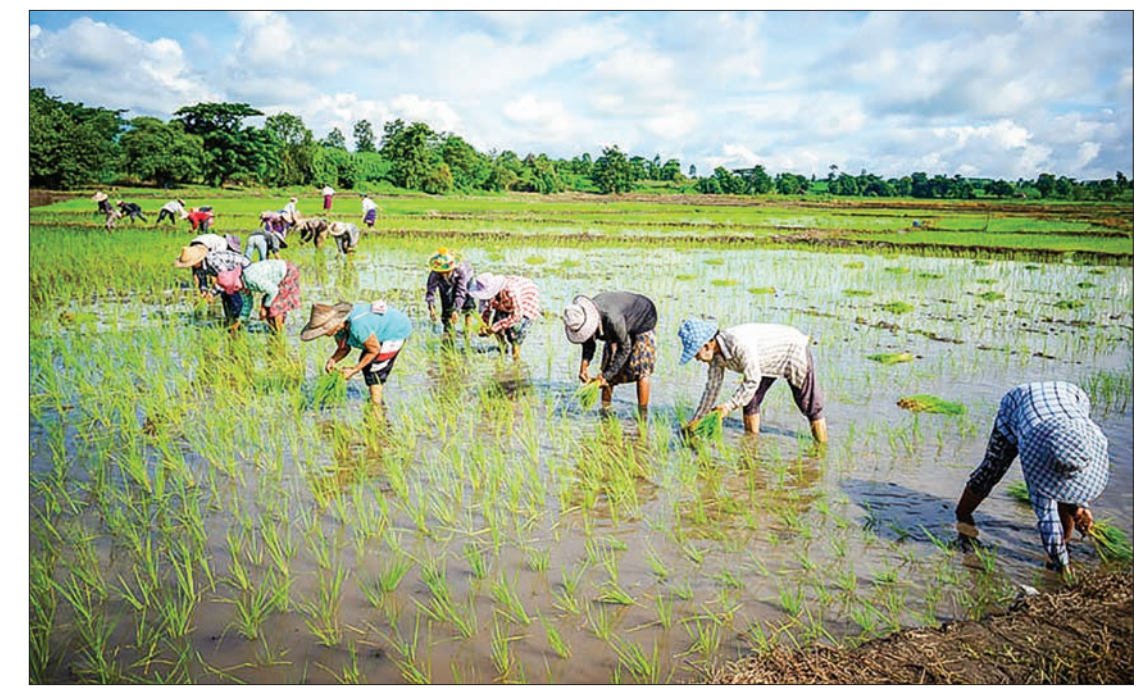
Farmers plant rice in a paddy field in Phaluu Gyi Village, Myawady District, Kayin State.

"Myanmar has shipped 1.514 million tonnes of rice and 381,000 tonnes of broken rice from 1 October to 19 July this fiscal year, receiving US$573 million from rice export. A total of rice export this year is likely to hit two million tonnes at least," said the deputy director general at the 21st regular meeting of Myanmar Rice Millers Association held in Yangon. The Ministry of Commerce is inspecting the rice mills to be able to produce good quality rice that depends on the systematic