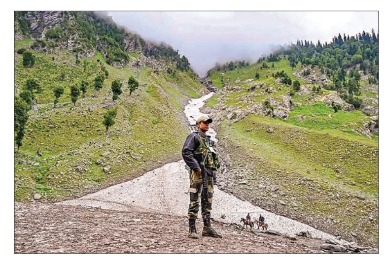
Officials said the movement of troops - set to rise to 20,000 - was to relieve exhausted personnel deployed since local civic polls last year and now monitoring an annual Hindu pilgrimage.

SRINAGAR (India) — Tensions in Indian-administered Kashmir rose on Sunday (July 28) over the weekend deployment of at least 10,000 paramilitary troops to the troubled region despite authorities' assertions the move was routine.