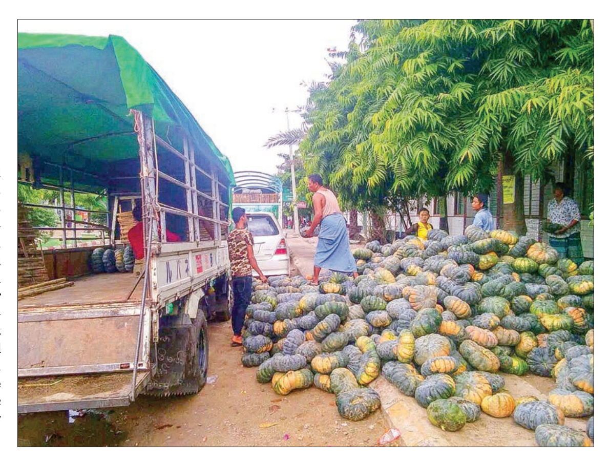
Farmers prepare to send pumpkins to the market in Lewe Township after the poor harvest this season.