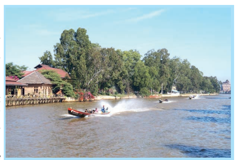
Boat ride is a breathtaking experience for visitors to Inle Lake.

Arrangements are being made to offer better services to holidaymakers who visit Shan Yoma Elephant Camp near Nant Pan Tet Village in Kalaw Township, Southern Shan State, said an official from the elephant camp. "We are currently preparing some exciting schedules for local visitors and foreigners. Apart from elephant ride, sightseers will be able to take a walk to a