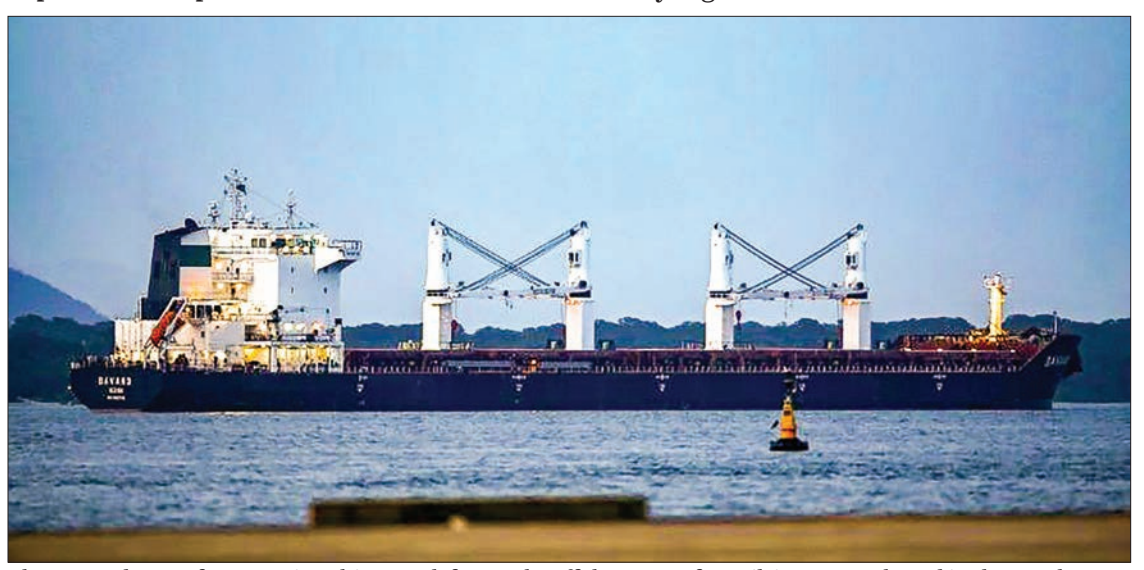
The Bavand, one of two Iranian ships stuck for weeks off the coast of Brazil, is seen anchored in the southern port of Paranagua.

Petrobras, whose stock is listed in the US and in Sao Paulo, confirmed it was refueling the ships. The Supreme Court order came after Iran's top envoy to Brazil told Bloomberg that Tehran could suspend imports from Brazil if the issue was not resolved. —AFP