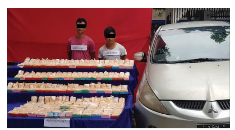
Suspects Khun San and Khun Sai seen with illegal drugs seized from them.