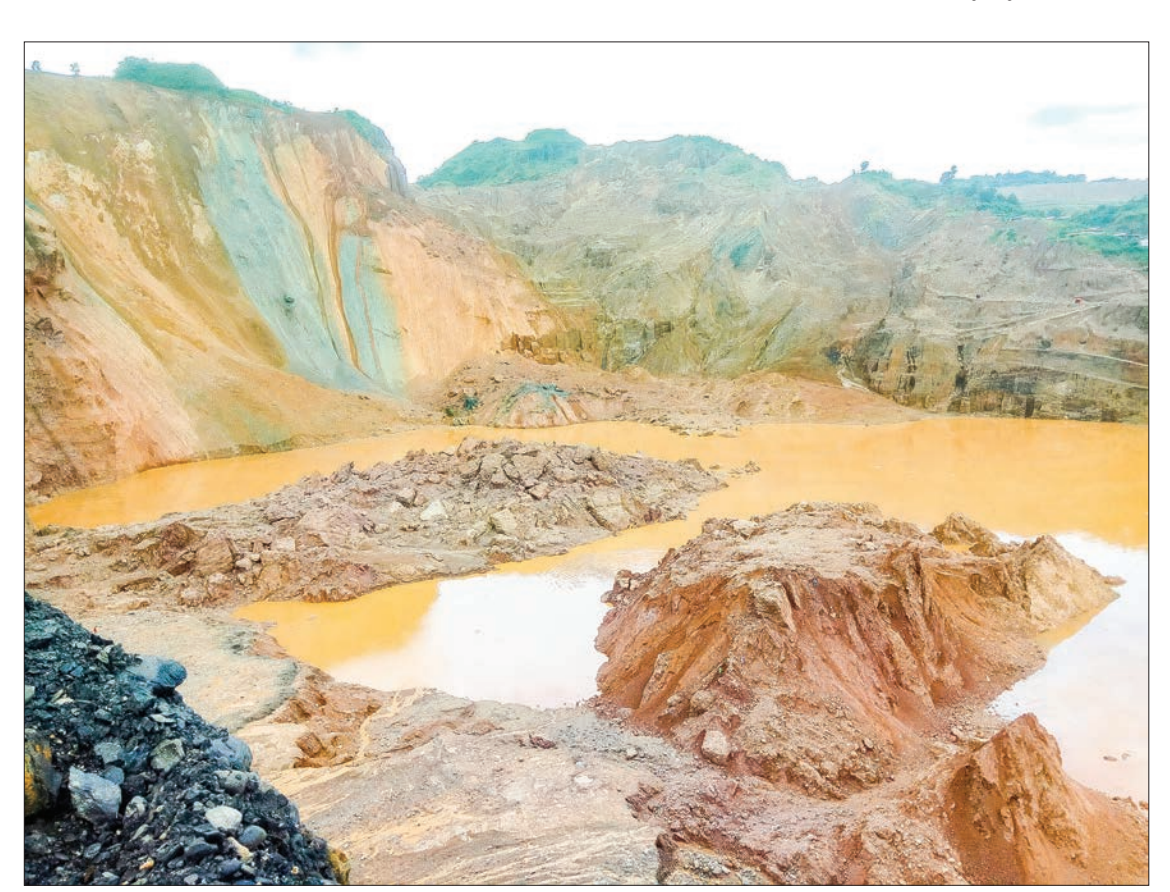
The site where deadly landslide happened at Hpakant jade mine in Kachin State on Sunday.