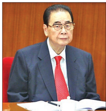
Former Chinese Premier Li Peng attends the celebration of the Communist Party's 90th anniversary at the Great Hall of the People on 1 July, 2011 in Beijing, China.