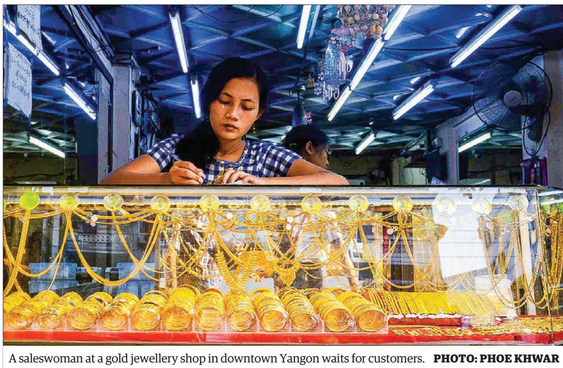
A saleswoman at a gold jewellery shop in downtown Yangon waits for customers.

strong gains in the global market, on the back of an escalating trade war between the US and