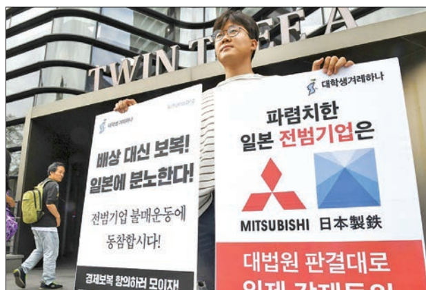
A man protests against Japan's decision to restrict exports outside the Japanese embassy in Seoul.

Japan on 4 July placed new restrictions on exports