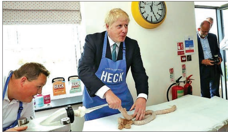
Besides his domestic battles, Johnson will have to try to secure a resolution to the stand-off with Iran.

Three years after the referendum vote to leave the European Union, Britain remains a member, after twice delaying its exit amid continued wrangling in