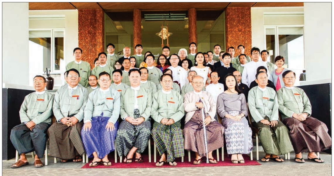
UEC Chairman U Hla Thein and UEC members, Chairman of Myanmar Press Council, and UNESCO officials pose for the photo at the meeting in Nay Pyi Taw yesterday.

He urged to avoid taking sides and reporting false news and spreading hate speech as it can cause undesired effect on election, to value an item of news and to follow media eth-