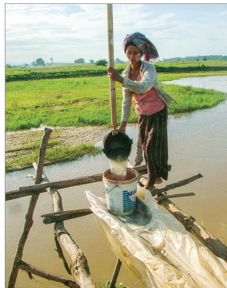
A woman filling up bucket with water from the creek to irrigate plantation.