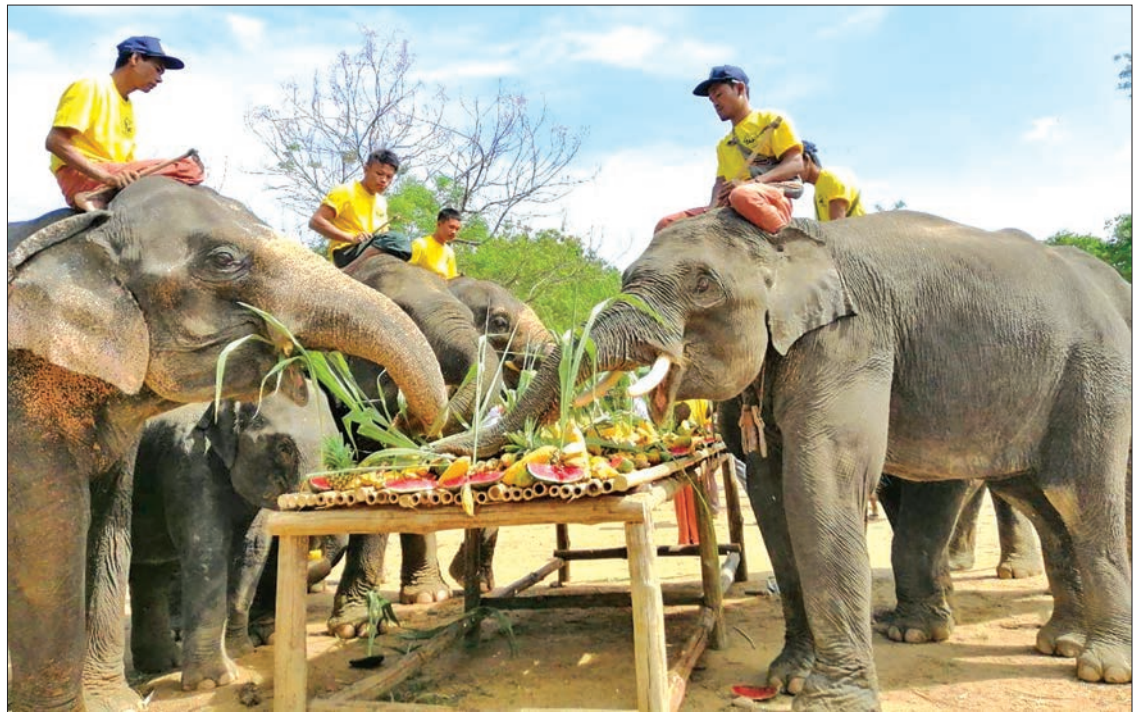
Mahouts feeding elephants at the opening ceremony of Bodhi Tahtaung elephant camp in Monywa, Sagaing Region.

The Chief Minister for Sagaing Region, Region Minister for Chin Ethnic Affairs and Managing Director of Myanmar Timber Enterprise opened the camp by cutting the ribbon.