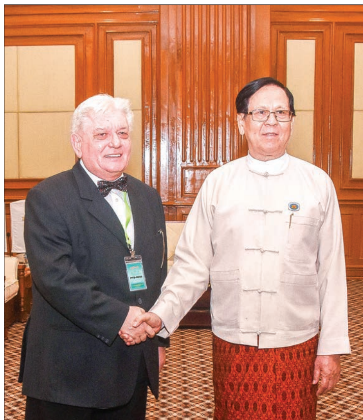
Amyotha Hluttaw Deputy Speaker U Aye Tha Aung shakes hands with Mr Miodrag Nikolin, Serbian Ambassador to Myanmar in Nay Pyi Taw yesterday.

During the meeting, they cordially discussed matters relating to giving the invitation letter of the President of the National Assembly of Serbia to attend the 141 st Assembly and related meetings of the Inter-Parliamentary Union (IPU) that will take place in Belgrade, Serbia on 13-17 October 2019 and boosting the interests of bilateral ties between the two countries. — MNA (Translated by Win Ko Ko Aung)