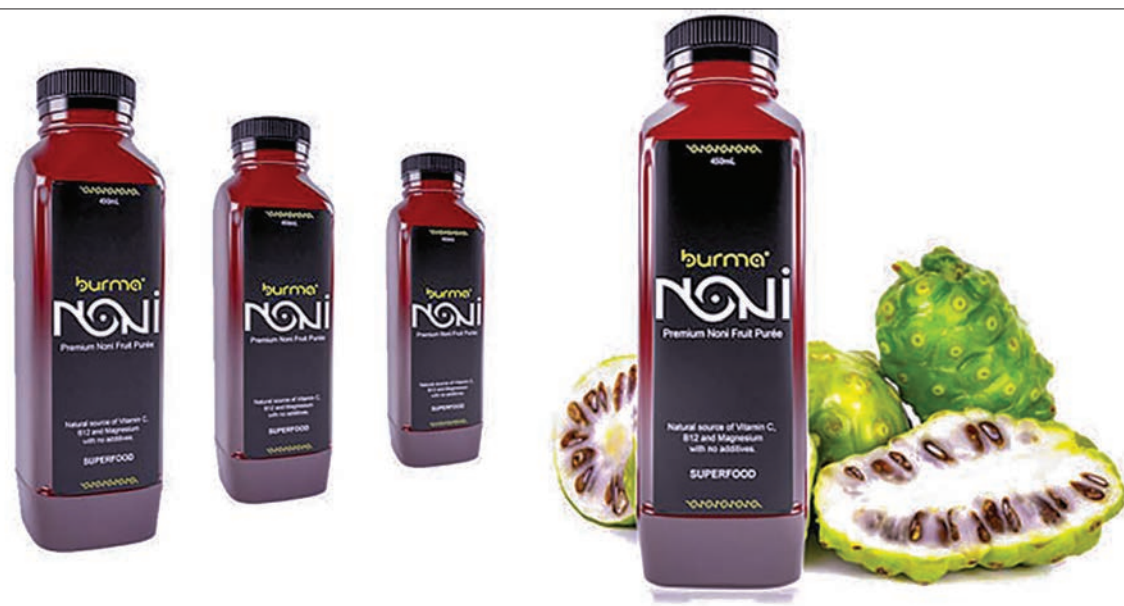
Myanmar Noni.

No. 51/ D, Kabar Aye Pagoda Road, 10th Quarter, Mayangone Township, Yangon. Ph: 09-797109000/ 01-658210/ 01-658220.