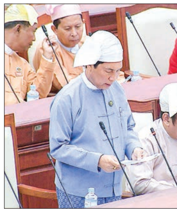
Union Minister for Industry U Khin Maung Cho.