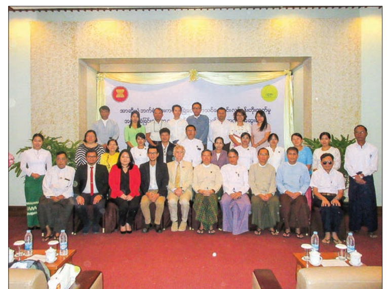
Union Minister Dr Myo Thein Gyi poses for the photo with attendees at the workshop in Nay Pyi Taw yesterday.

He said 2400 schools were closed due to 2008 Cyclone Nargis. The 2015 flood affected 4000 schools and destroyed 600 of them. Since the middle of 2008 reducing disaster risk was included in education and the government initiated Myanmar Disaster Reduction project (2017) in accordance with Sendai Framework for Action and ASEAN Agreement on Disaster Management and Emergency Response (AAD-