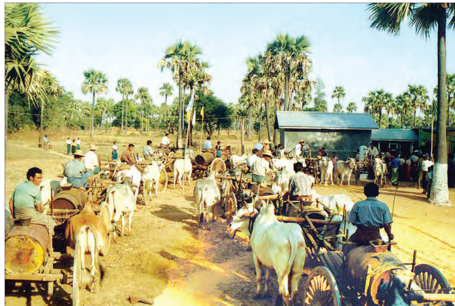
Villagers transport drinking water on their bullock carts in Tatkon Township.

gallons of water) is K 2200. But when the water is transported by their bullock-cart or by human labour, they forget to calculate the cost. In the arid zone, a 50-gallon water barrel cost K 200 at the tube-well. If the transport fee is added the cost will become K 700. It means that one unit of water or one cubic-foot of water or 220 gallons of water costs K 3080. So, a household in the arid zone that buys water at a village-owned tube-well has to pay at least K 46,200 per month. In the cities