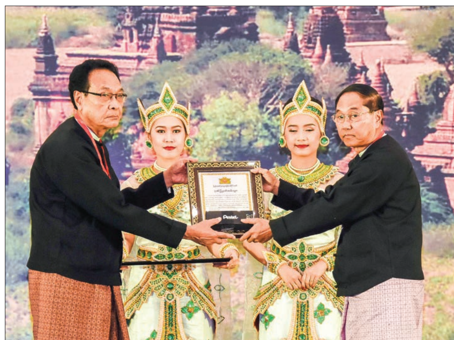
Vice President U Myint Swe presents the certificate of honour to Mandalay Region Finance Minister U Myat Thu.