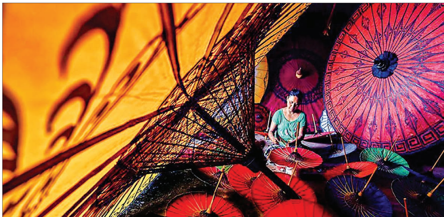
A woman painting decorative designs at the workshop of Shwesar Umbrella Business for the famous colourful handmade parasols in Pathein, Ayeyawady Region. Pathein parasols, Myanmar traditional umbrellas, have been exported to Asian countries and European countries.

viding attractions to entrepreneurs enable Start-ups to gain momentum, create jobs and support the economic development of a country.