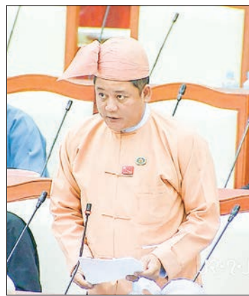
MP U Thant Zin Tun of Dekkhinathiri constituency.