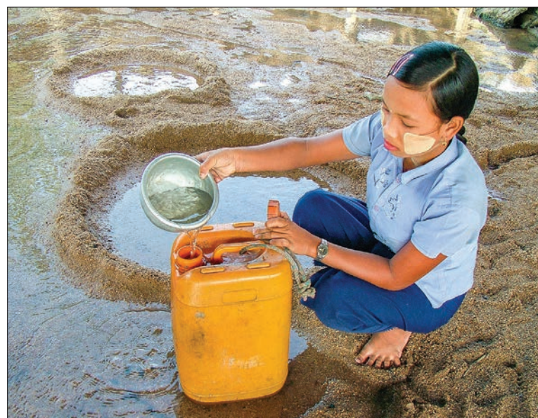
A rural village woman collecting drinking water.

Normally, the transport fee of a 50-gallon water barrel is K 500. The cost of one unit of water (one cubic-feet of water or 220