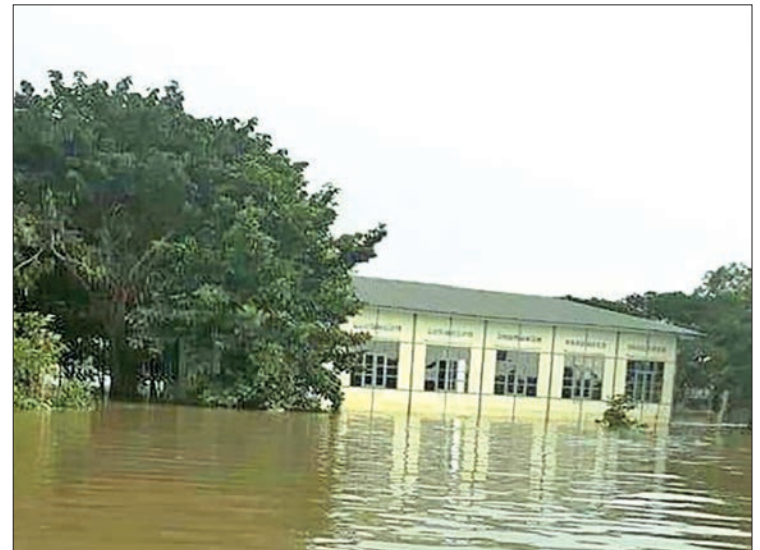
Basic education schools closed due to flooding by Ayeyawady River in Singu.