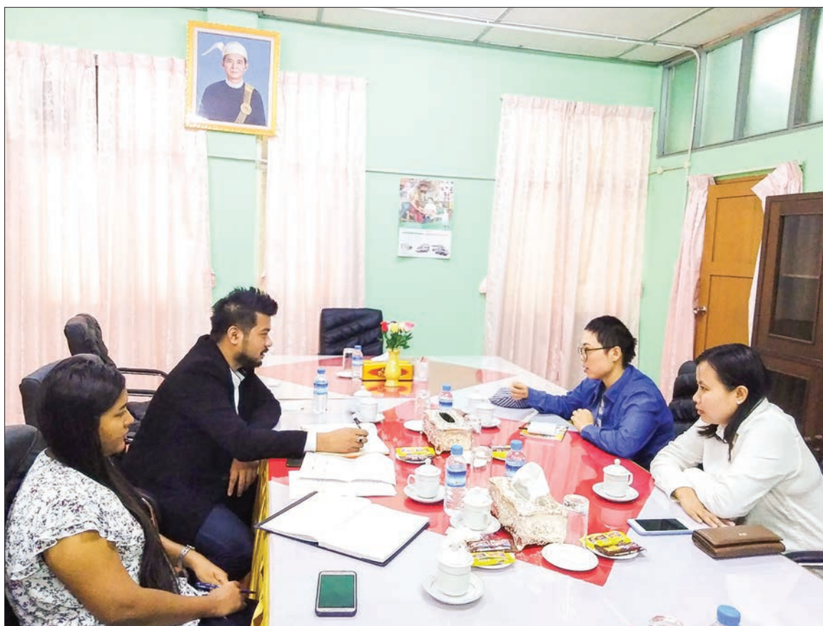
Directorate of Industrial Supervision and Inspection (DISI) of Ministry of Industry supports the Startup entrepreneurs and the MSME to get advice from the local experts.

Beginning from a few years ago, some of the ASEAN countries were found to be striving toward creating a good ecosystem for Start-ups. Creating a good ecosystem for Start-ups was considered as a first step toward developing good economic prospects for the country. There's a firm view that creating a workable situation for Start-ups, having a well-trained and qualified labour force and pro-