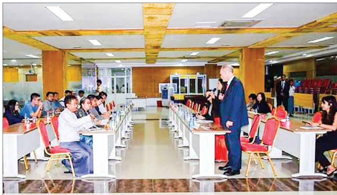
Representatives from Mandalay Region Chamber of Commerce and Industry (MRCCI) hold a meeting with US delegation in Mandalay.

MANDALAY Region Chamber of Commerce and Industry (MRCCI) met a US delegation on Monday to discuss agricultural exports to the US, bilateral trade promotion and providing technical assistance at the MRCCI hall inside the Yadanarbon center, Mandalay Region.