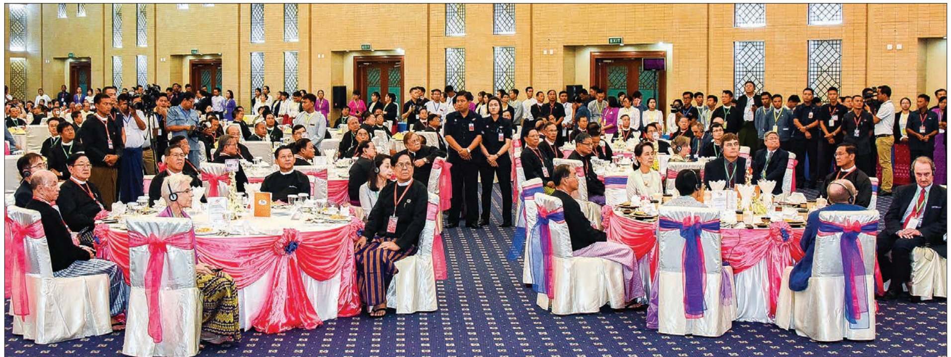
President U Win Myint delivers the address at the honouring ceremony for the Inscription of Bagan on the World Heritage List.

departments, the parliamentarians, the local people in Bagan, the associations, the artistes, and all the people concerned in this process.