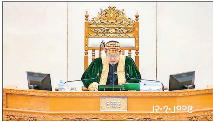
Pyithu Hluttaw Speaker U T Khun Myat.

U Saw Thalay Saw of Shwepyin constituency raised the first question enquiring about plan to relax travel restriction of foreigners to restricted area, issuing of instructions and notifications to departments on creating opportunity and informing relaxation made and plan to develop regions where development is lagging behind. Union Minister for Hotels and Tourism U Ohn Maung answered that news was timely released by the ministry and the Ministry of Information while regional travel work committees were formed in Nay Pyi Taw Council and all states and regions. These committees ought to coordinate and designate regions where tourists can travel safely, said the Union