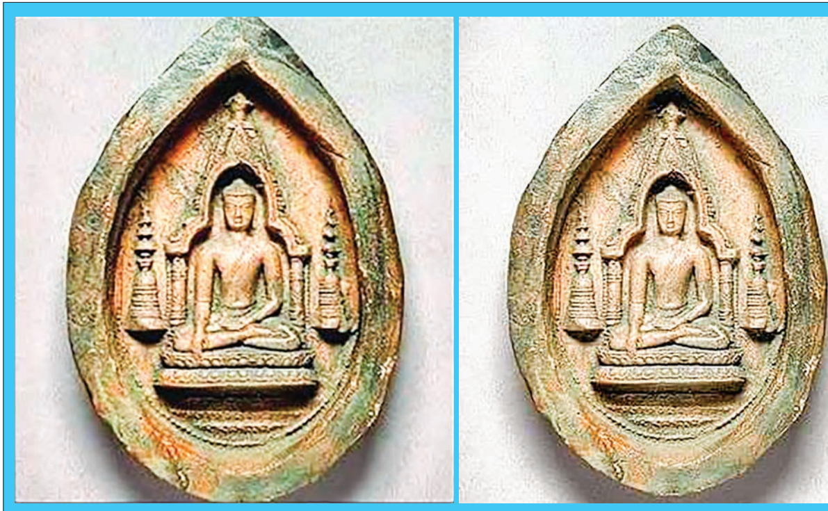
Terracotta votive tablets of Sri Ksetra.

Some persons travelling between India and Myanmar brought votive tablets to their regions. Then, they made the tablets themselves and produc-