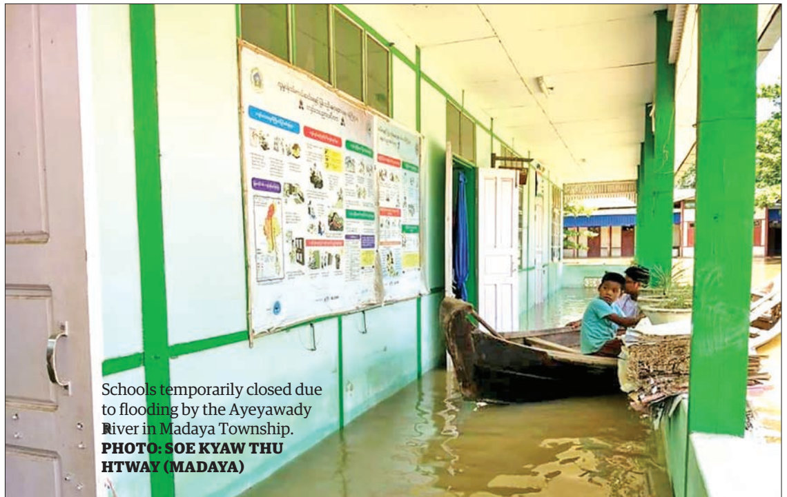
Schools temporarily closed due to flooding by the Ayeyawady River in Madaya Township.

There are 3,814 students attending the 26 schools, according to officials.—Soe Kyaw Thu Htway (Madaya) (Translated by Hay Mar)