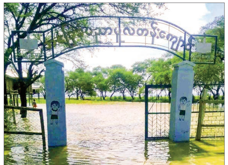
Basic education primary school in Pwintbyu Township, Magway Region, closed due to flooding.