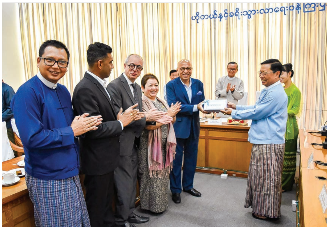
Union Minister for Religious Affairs and Culture Thura U Aung Ko accepts cash donation from donors in Nay Pyi Taw yesterday.

He said, "The Union Minister for Religious Affairs and Culture, officials from relevant ministries and the organizations from both the government and the private sectors are appreciated for their works in the whole process together with the experts from tourism industry." Then, Foreign Investment Hotels Association donated K. 10 million, Myanmar Hotelier Association K 1 million, Myanmar Tourism Federation K 500,000, and Myanmar Food