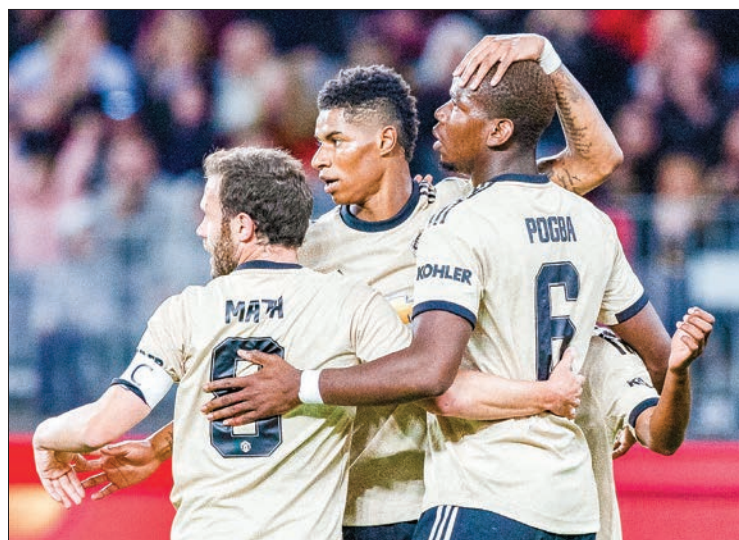
Marcus Rashford of Manchester United (C) celebrates scoring a goal with teammates Juan Mata (L) and Paul Pogba (R) after scoring a goal during their pre-season friendly match against Perth Glory at Optus Stadium in Perth on 13 July 2019.

"I think he is happy and brings everyone together, but I cannot speak for other people — I speak for myself.