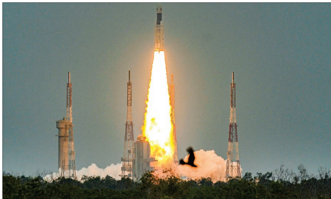
The Indian Space Research Organisation's (ISRO) Chandrayaan-2 (Moon Chariot 2), with on board the Geosynchronous Satellite Launch Vehicle (GSLV-mark III-M1), launches at the Satish Dhawan Space Centre in Sriharikota, an island off the coast of southern Andhra Pradesh state, on 22 July 2019. India launched a bid to become a leading space power on 22 July, sending up a rocket to put a craft on the surface of the Moon in what it called a "historic day" for the nation.