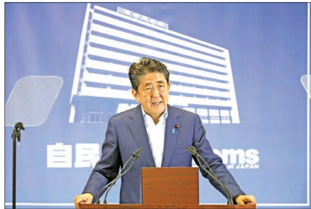
Prime Minister Shinzo Abe.

Asked about a reshuffle of his Cabinet and senior LDP executives, Abe, who is president of the party, said he has yet to decide and will take time to think about it.—Kyodo News ■