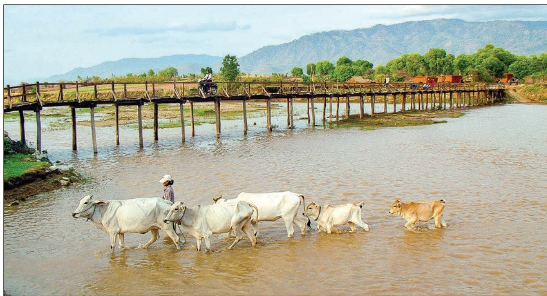
A farmer drives cattle to home after grazing them in Tatkon, central Myanmar.

Normally, a large cow is valued at over K1.6-2.3 million, but the suspension of trade has led to Chinese traders resorting to manipulating prices by offering a