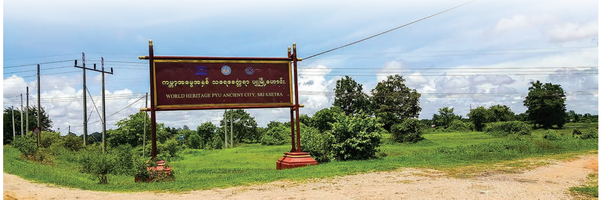
Sri Ksetra World Heritage zone in Pyay, Bago Region.

Although various types of hand postures (Mudra) and foot postures (Asana) of Lord Buddha were made on the tablets, the Buddha images in majority of votive tablets were expressed with the shape of touching the ground with fingers called Bhumi-phassa Mudra and the shape of taking intense concentration mind called Jhanasana. Likewise, the tablets in Pyu and Bagan eras were made with Buddha images in Bhumi-phassa Mudra and Jhanasana placed on the lotus flower thrones. It can be seen that votive tablets were carved with