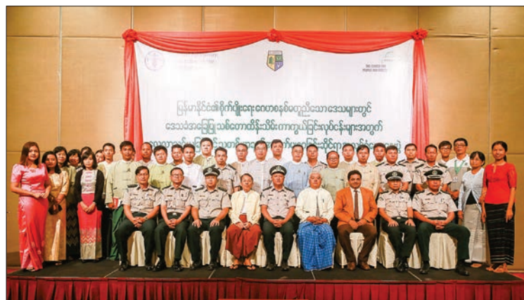
Deputy Director-General U Kyaw Kyaw Lwin and attendees pose for the photo at the workshop in Nay Pyi Taw.

A WORKSHOP on disseminating skills and information for conducting community-based forest conservation in regions with different agricultural systems was held at Thingaha Hotel in Nay Pyi Taw yesterday.