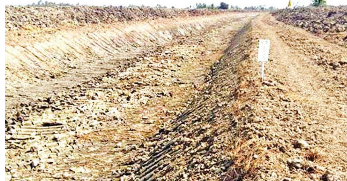
A tributary which flows into Thakhut River has been dredged.