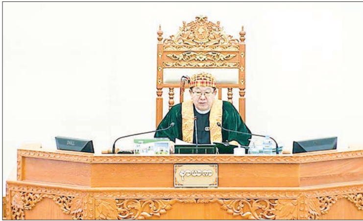
Speaker of Pyidaungsu Hluttaw U T Khun Myat.