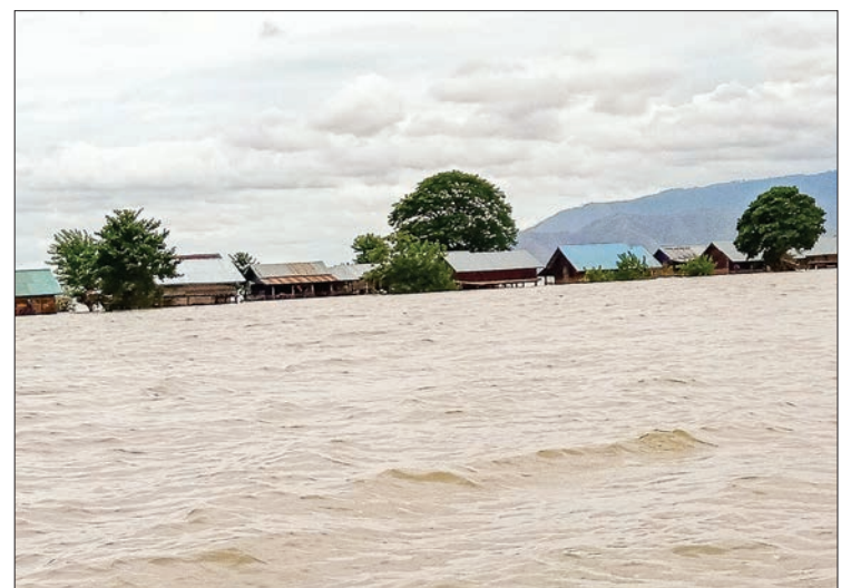
Houses are submerged by the flood in Htigyaing Township, Sagaing Region.