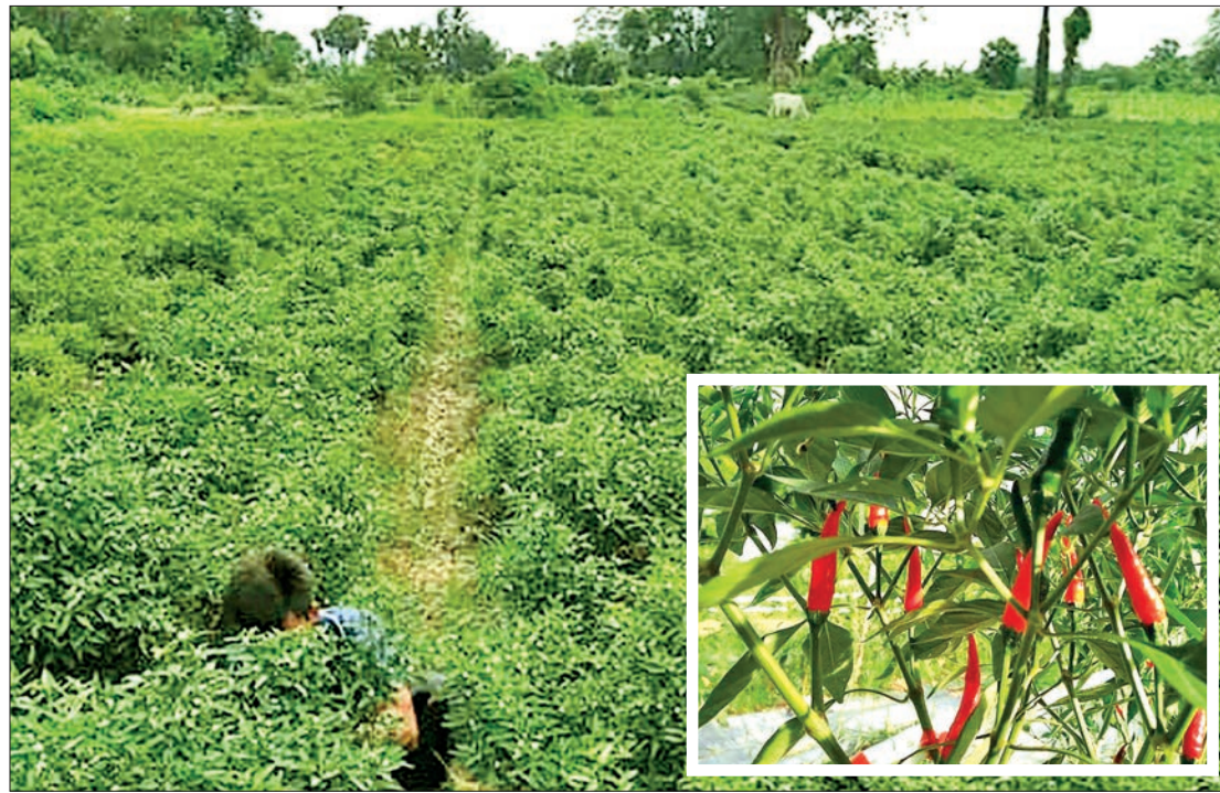
Chilli grower harvests chillies at the field in Monywa.