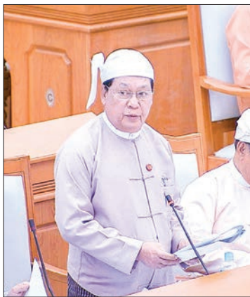
Union Minister U Thein Swe.