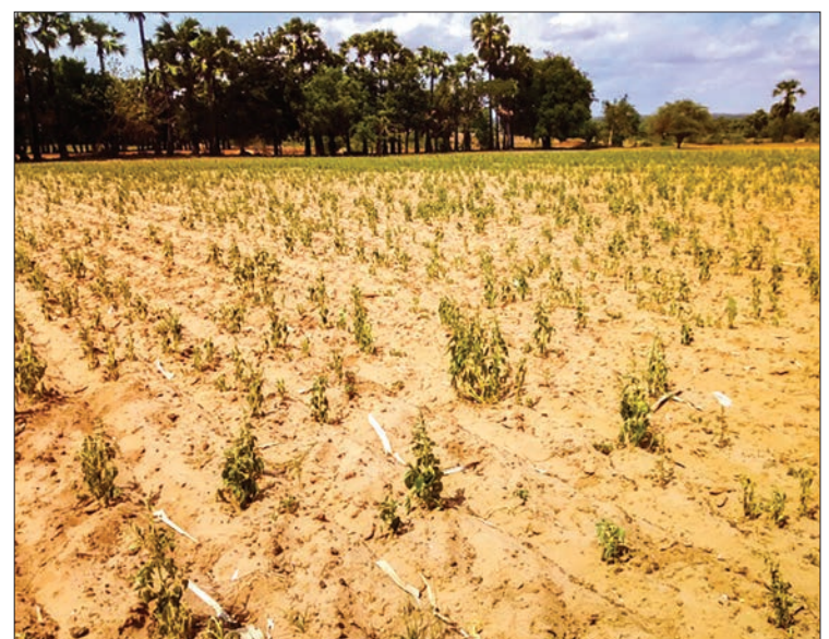
Drought devastated peanut and sesame fields in Ngathayauk.