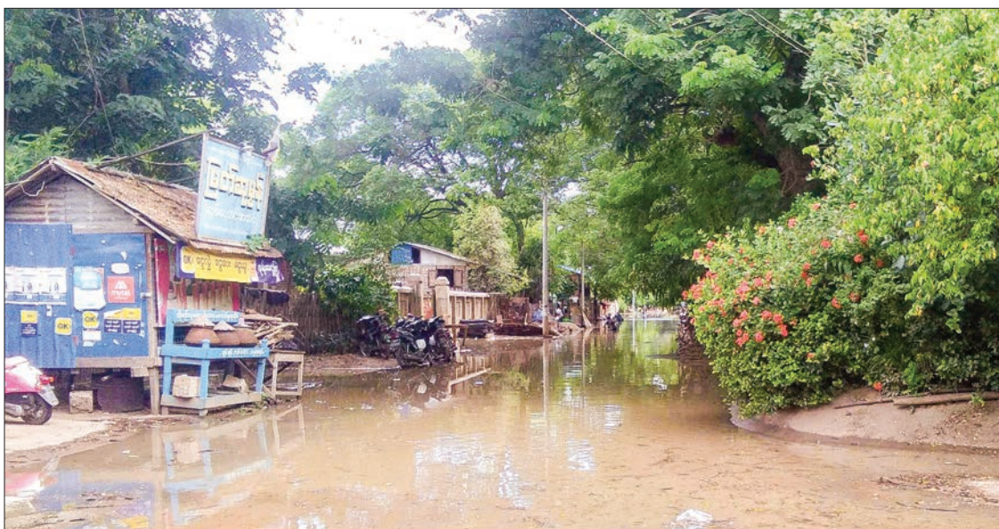
Number of houses flooding in NyaungU Township.