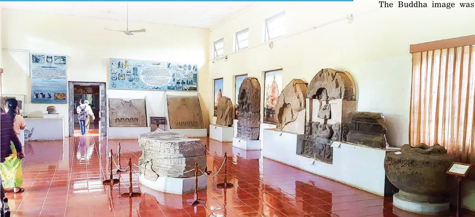
Sri Ksetra Museum.

the Lord Buddha or the Buddha-to-be rounded by disciples, wife and congregations. Mostly, the tablets in Bagan era were found with Buddha images flanked by disciples or Buddha-to-be.