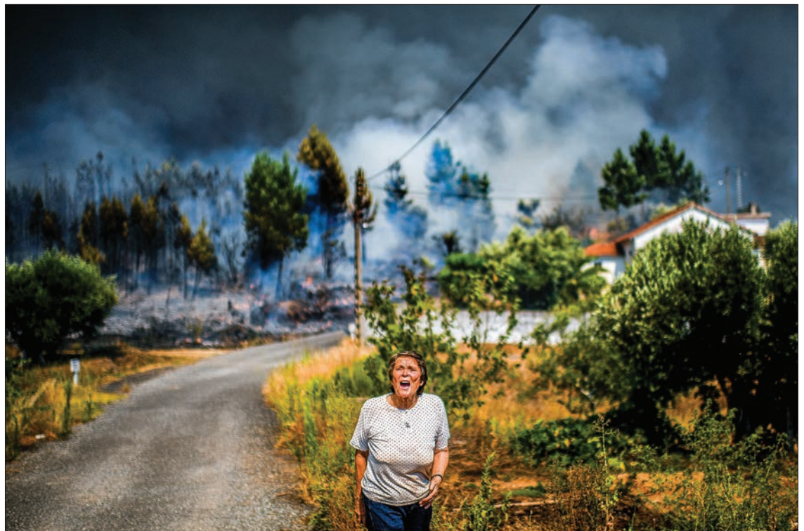
A villager shouts for help as a wildfire approaches a house at Casas da Ribeira village in Macao, central Portugal on 21 July 2019. Planes and helicopters joined nearly 2,000 firefighters in central Portugal on 21 July, 2019 to battle huge wildfires in a mountainous region where more than 100 people died in huge blazes in 2017. Around 20 people have been injured in the blaze, including eight firefighters and 12 civilians, according to the interior ministry.

In a message, he expressed his "solidarity with the hundreds fighting the scourge of the fires". — AFP ■