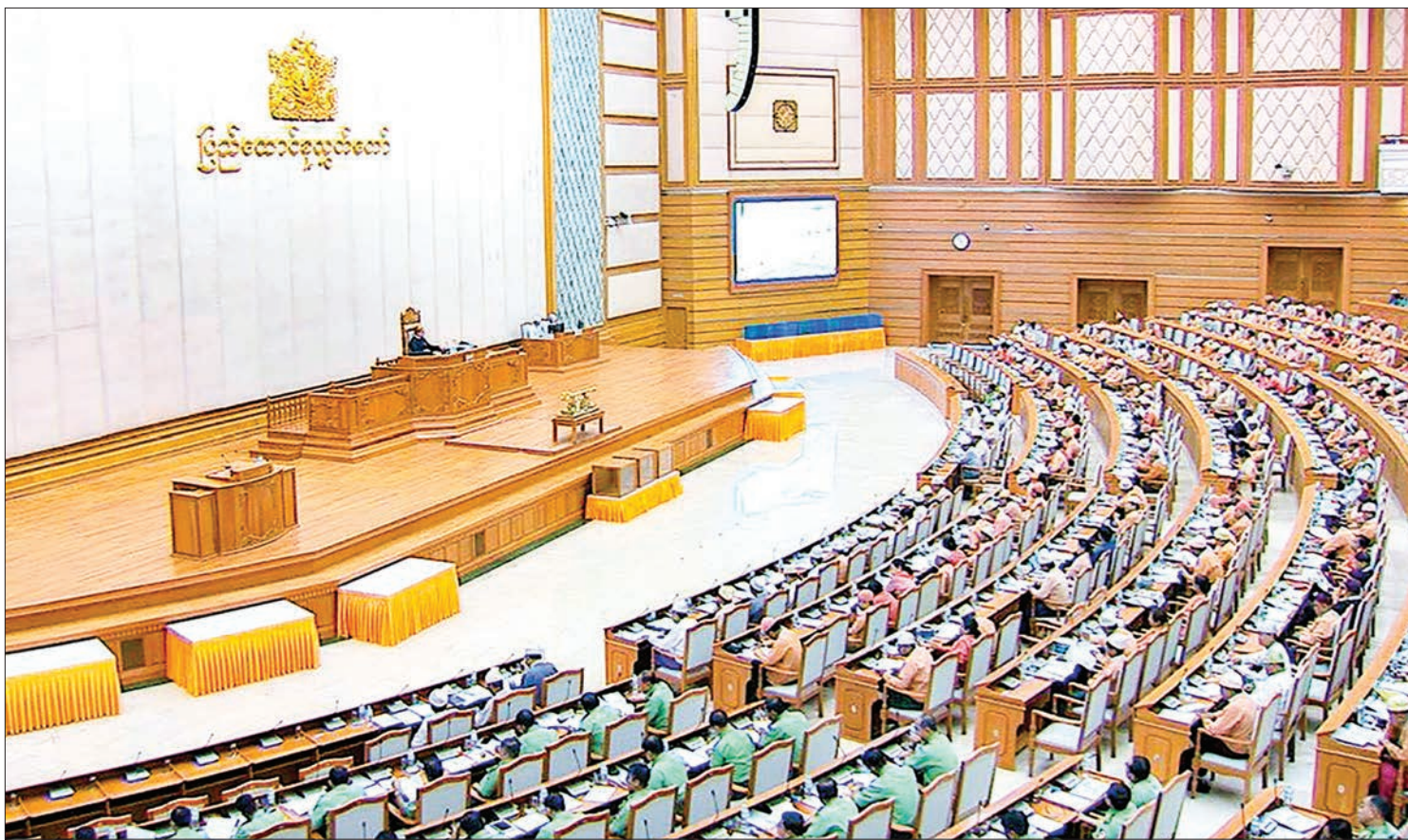
Pyidaungsu Hluttaw is being convened in Nay Pyi Taw on 22 July 2019.