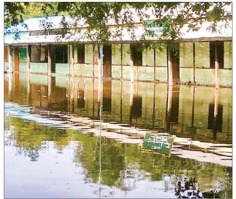
Schools are closed due to flooding by Ayeyawady River in Mandalay Region.