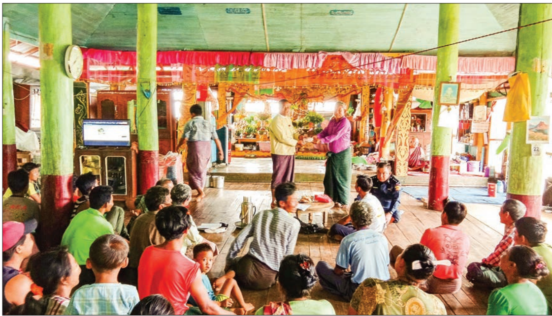
Township staff provide cash assistance to flood victims in villages in Htigyaing Township, Sagaing Region.