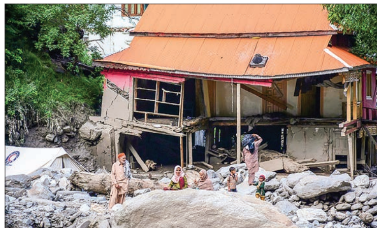
Twenty-three people from Laswa Valley are missing, presumed dead by officials, after flooding hit Pakistani Kashmir.

“We have nothing left here now except for the stones.” —AFP ■