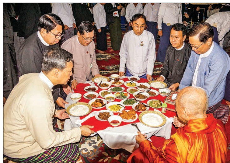
"Soon", a day meal, offered to the members of the Sangha at the City Hall in Yangon yesterday.