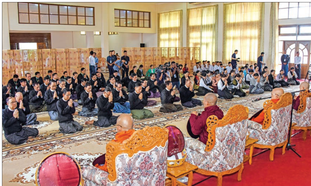
A ceremony to donate "soon", a day meal, and offertories to Members of the Sangha in Nay Pyi Taw to mark the 72 nd Martyrs' Day.

On the 72 nd Martyrs' Day, a donation ceremony was held at the Nay Pyi Taw Council Office yesterday morning and merit was shared for the leaders who sacrificed their lives for the country.