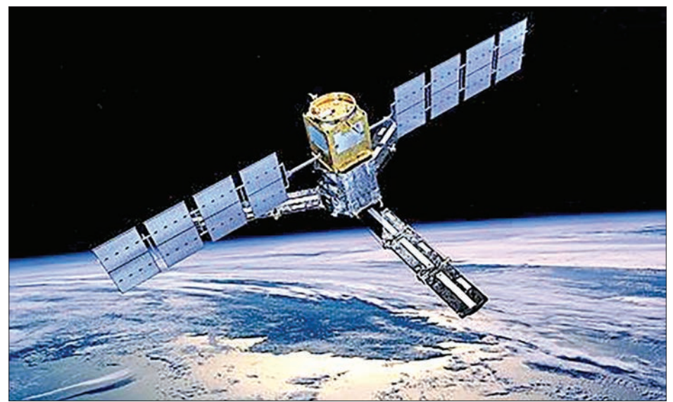
Galileo is intended to offer a superior accuracy of one metre (yard), compared to up to 10 metres for GPS.

Under the agreement covering the period through March 2022, Toyota and the Japan Aerospace Exploration Agency will develop, manufacture