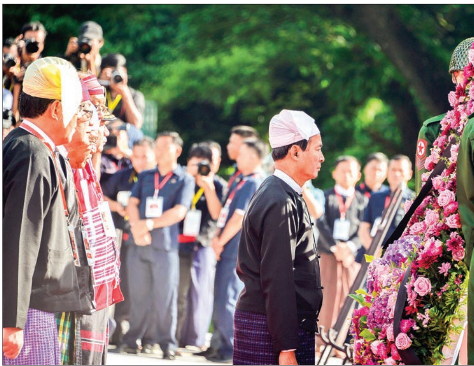
President U Win Myint pays tribute to Bogyoke Aung San and Martyrs at the Martyrs' Mausoleum yesterday.