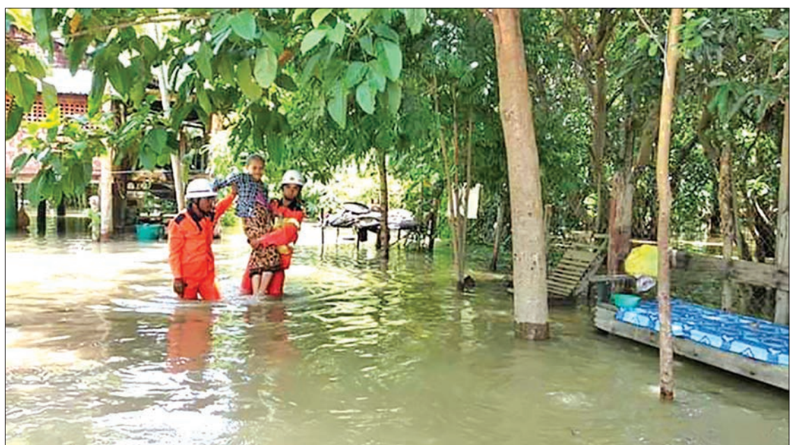
A member of rescue team carries an elderly woman at the outskirts of township in Mandalay Region.