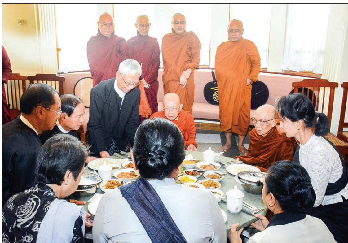
State Counsellor Daw Aung San Suu Kyi offers "soon" to Members of the Sangha at her residence in Yangon.