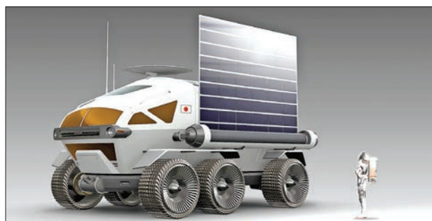
Supplied image shows a rover that Toyota Motor Corp. and the Japan Aerospace Exploration Agency will jointly develop to be sent to the Moon. Bridgestone Corp. will take part in research to develop tires for the rover.

TOKYO — Toyota Motor Corp. and Japan’s space exploration agency said they have signed a three-year agreement to jointly research and develop a rover to be sent to the Moon in 2029.