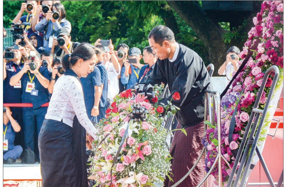
Daw Aung San Suu Kyi, daughter of Bogyoke Aung San, lays wreaths and pays tribute to Bogyoke Aung San and martyrs at the Martyrs' Mausoleum.