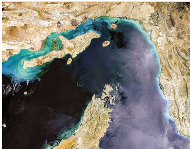
Satellite image of the Strait of Hormuz on 24 May, 2017.

The Defence Department said the Iranian craft was destroyed to defend US personnel, in response to the drone flying close to the US amphibian assault ship Boxer. “The Boxer took defensive action against an Iranian drone... (that) was threatening the