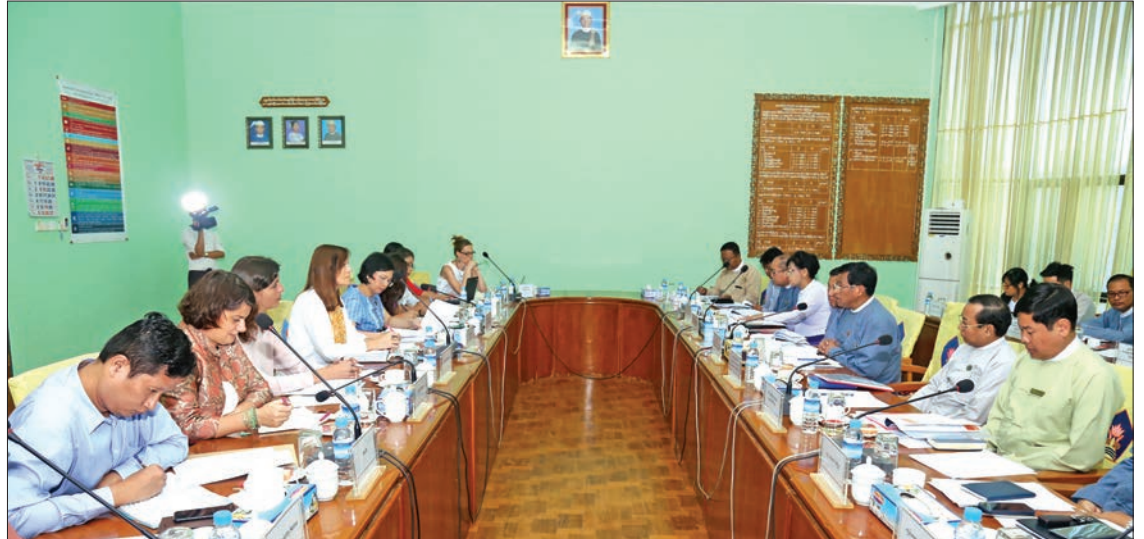
Deputy Minister U Soe Aung attends the coordination meeting on the UN's aid proposal for IDPs in Rakhine State and in Paletwa Township, Chin State.

The meeting then commenced and participants discussed the proposals for providing assistance with food security, nutrition, roofing and rescue equipment, education, healthcare, water purification and protecting vulnerable pop-