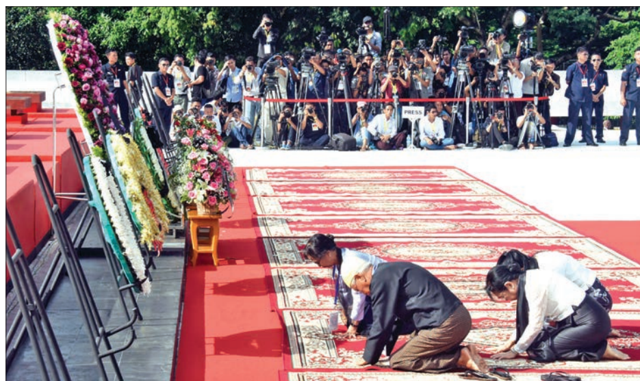
Family members of U Ba Win pay tribute to U Ba Win and martyrs at the Martyrs' Mausoleum.