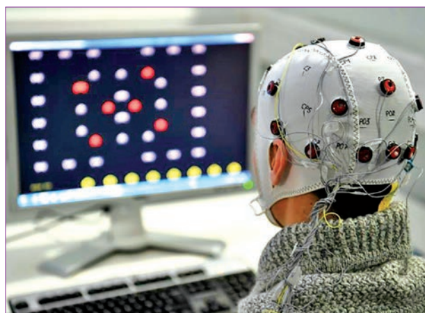
Progress is being made brain-computer interface technology, an example of which is seen at a French laboratory in 2017, but scientists say a vision outlined by Elon Musk to mesh brains and computers using artificial intelligence remains far off.

Musk said the goal was to make adding the brain-enhancing implants as easy a procedure as laser eye surgery.—AFP ■