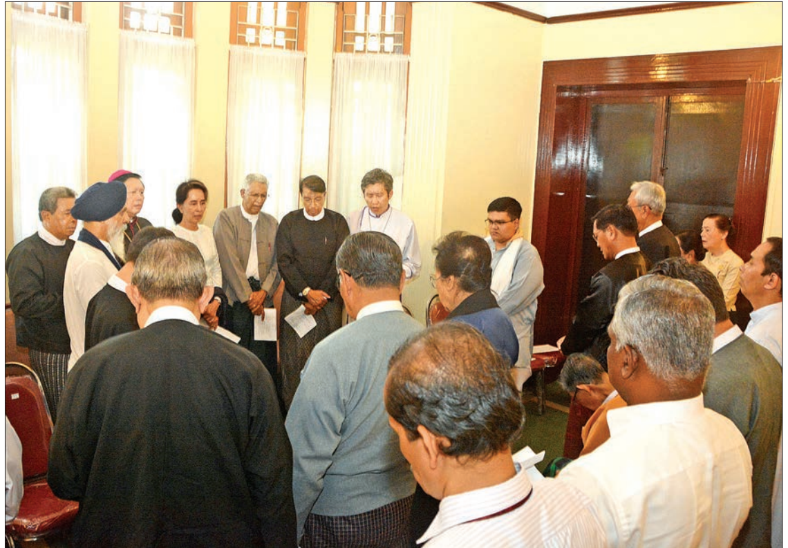
State Counsellor Daw Aung San Suu Kyi prays for national leader Bogyoke Aung San and other martyrs together with other religious leaders at her residence in Bahan Township, Yangon.