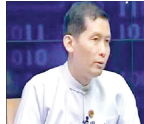
Deputy Minister Dr Tun Naing