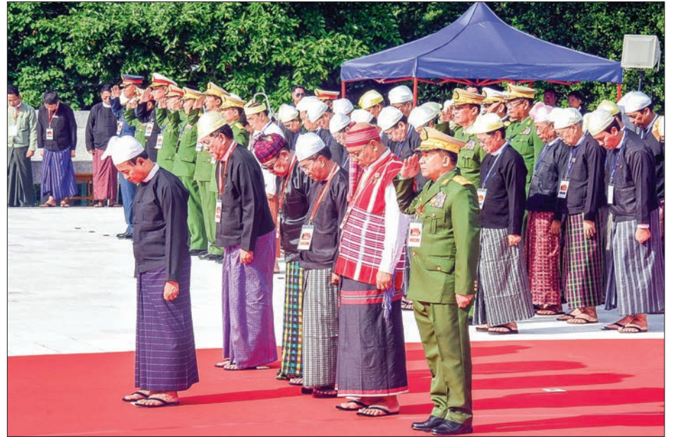
President U Win Myint and party pay tribute to Bogyoke Aung San and martyrs at the Martyrs' Mausoleum in Yangon on 19 July 2019.