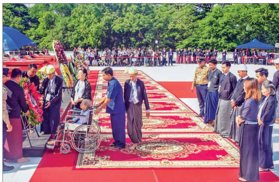
Family members of U Ohn Maung lay a wreath at the Martyrs' Mausoleum to pay tribute to U Ohn Maung and martyrs.