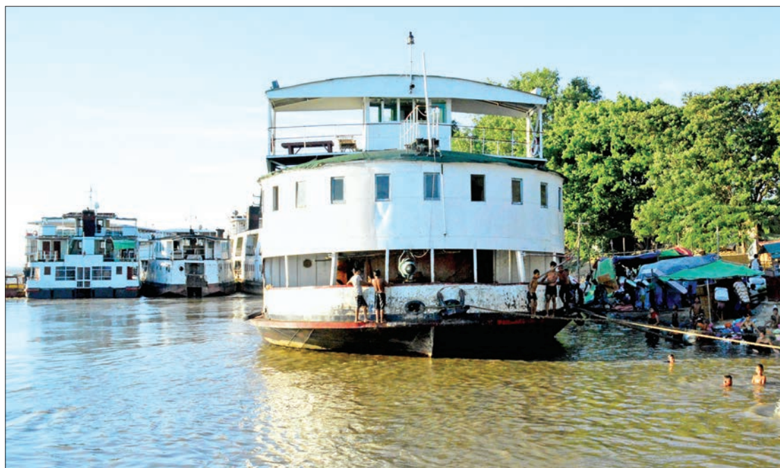
A vessel docks at a jetty in Ayeyawady River in Mandalay.

THE water level of Ayeyawady river reached its danger mark of 1,260 centimetre (230.745 inches) at Mandalay port at 6 pm yesterday after it passed 1253 centimetre at 3:30 pm in