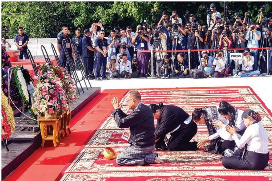
Family members of Thakhin Mya pay tribute to Thakhin Mya and martyrs at the Martyrs' Mausoleum.