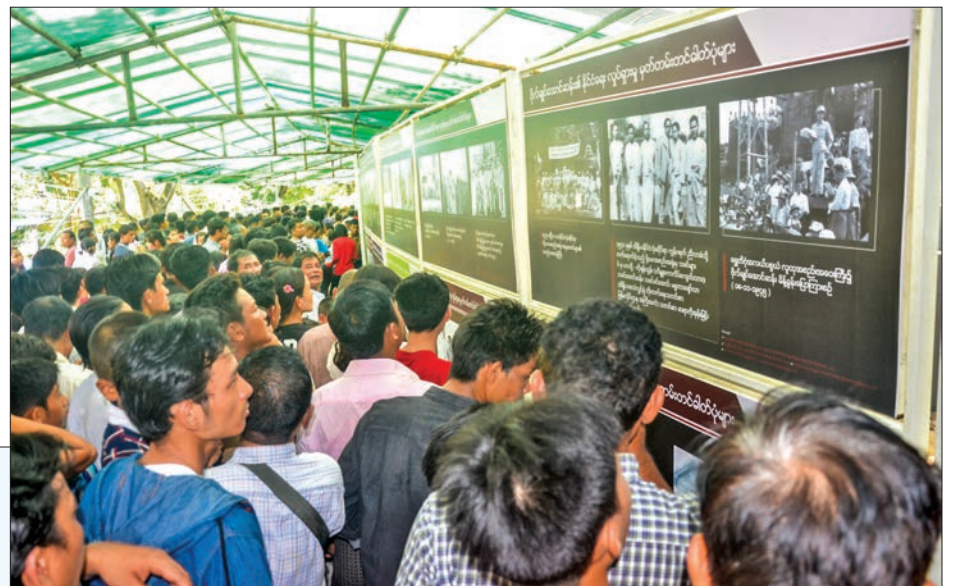
People visit Bogyoke Aung San Museum on the 72 nd Martyrs' Day yesterday.