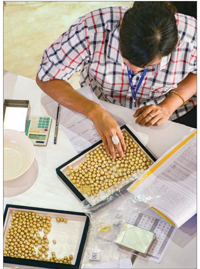
A trader chooses pearls at an emporium in Nay Pyi Taw.

As per the ministry's annual trade report, Myanmar's mineral