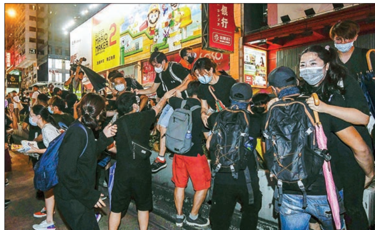
Protesters seeking the complete withdrawal of a suspended extradition bill leave after police tried to clear them from the streets in Hong Kong’s Kowloon area on 7 July, 2019.

were peaceful, some had turned violent with protesters clashing with riot police, leading to scores of injuries and dozens of arrests. —Kyodo News ■