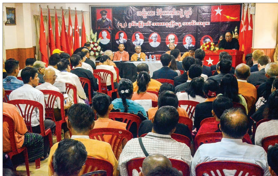
NLD members hold commemorating ceremony of 72 nd anniversary of the Martyrs' Day at their headquarters in Yangon yesterday.