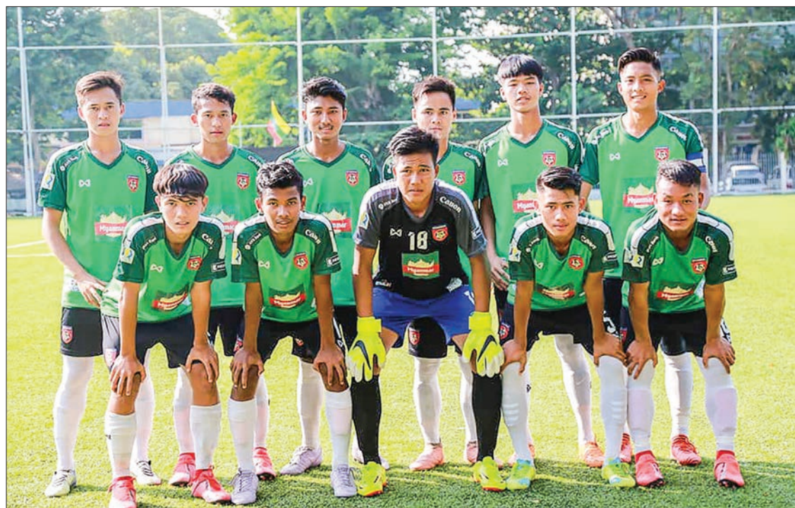
Players from MFF Youth FC pose for a group photo before the match against Ayeyawady U-21 team on 8 April.

There are 13 teams competing in the U-21 national league, and Rakhine United FC is sitting at the bottom of the table with 3 points from one win and 14 losses.—Lynn Thit (Tgi)