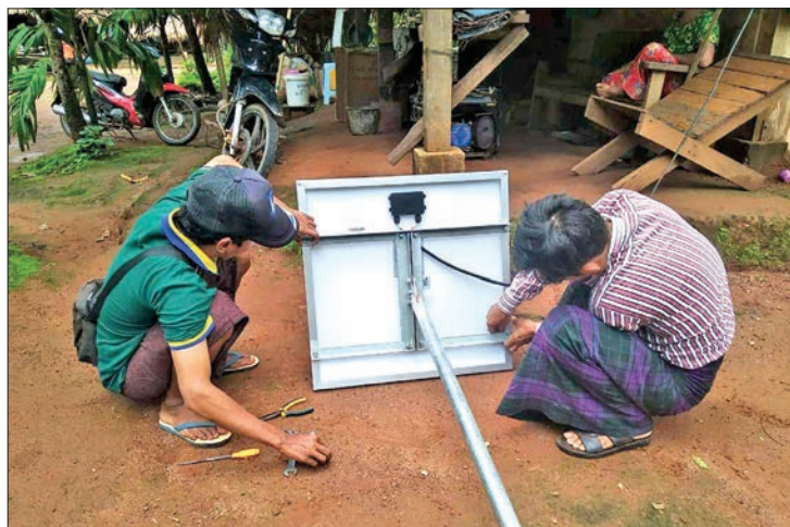
Electricians installing solar panel system at a village in Myeik Township, Taninthayi Region.

UNDER the National Electrification Plan, a new solar power project will be implemented in villages across Myeik Township in Myeik District of Taninthayi Region in the current