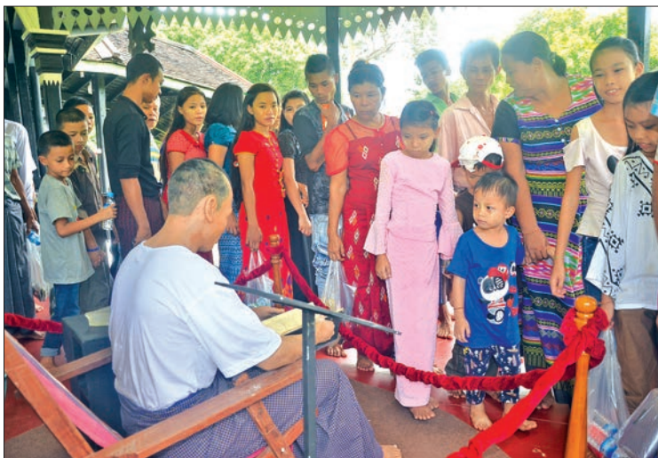
People visit Bogyoke Aung San Museum on the 72 nd Martyrs' Day yesterday.