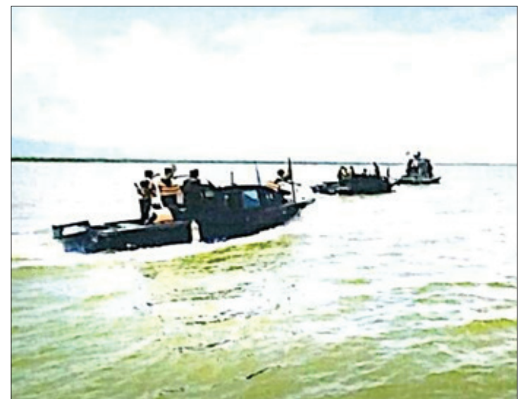
Myanmar and Bangladesh conduct naval patrol along the Naf River.