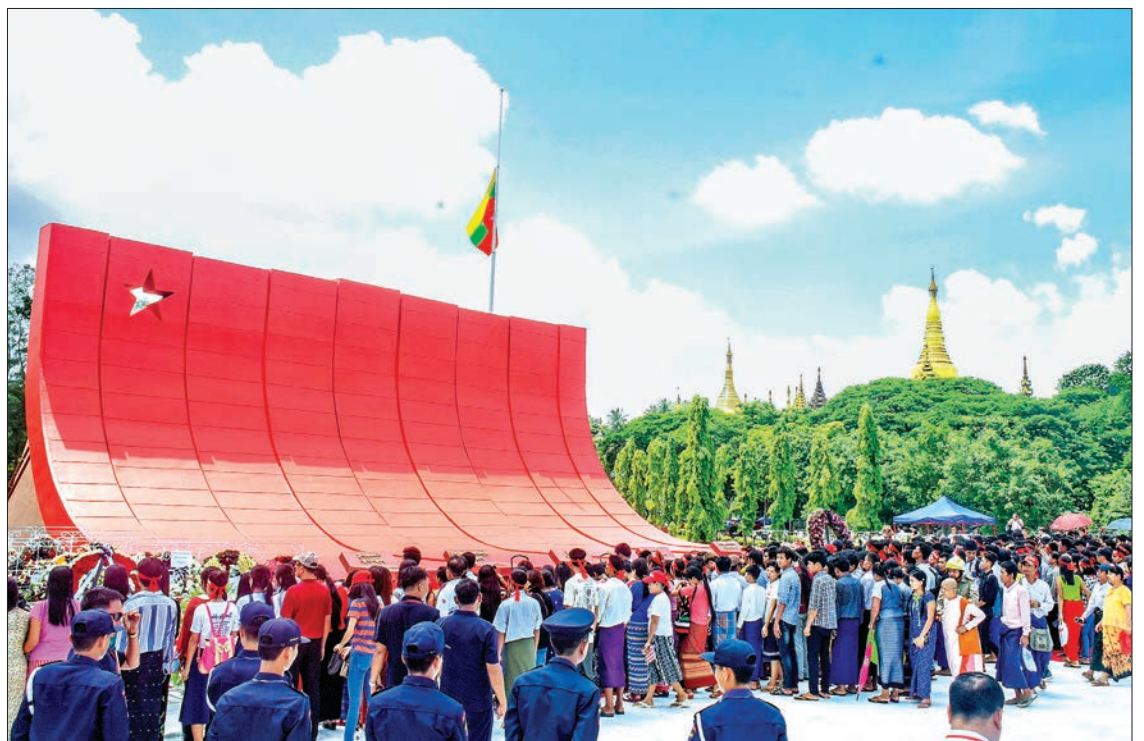
People pay tribute to Bogyoke Aung San and martyrs at the Martyrs' Mausoleum in Yangon yesterday.

A TOTAL of 76918 visitors observed the 72 nd Martyrs' day yesterday at the Martyrs' Mausoleum, the Bogyoke Aung San Museum (Yangon) and Secretariat Building (former Ministers' Office).