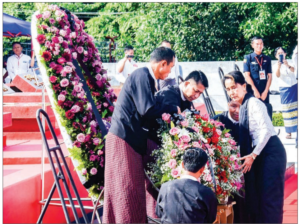
Daw Aung San Suu Kyi, daughter of Bogyoke Aung San, lays a wreath at the Martyrs' Mausoleum yesterday.

AT THE 2019 72 nd Martyrs' Day ceremony held yesterday at the Martyrs' Mausoleum in Yangon, President U Win Myint and State Counsellor Daw Aung San Suu Kyi laid wreaths at the monument of Bogyoke Aung San.