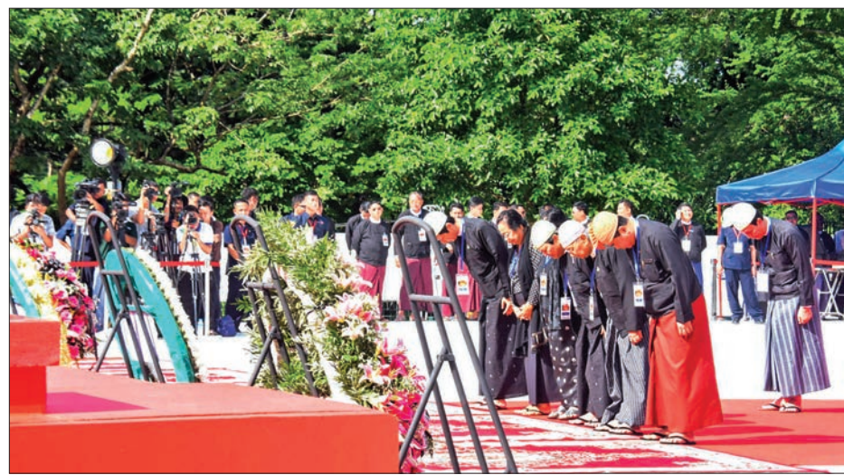
Family members of U Razak pay tribute to U Razak and martyrs at the Martyrs' Mausoleum.