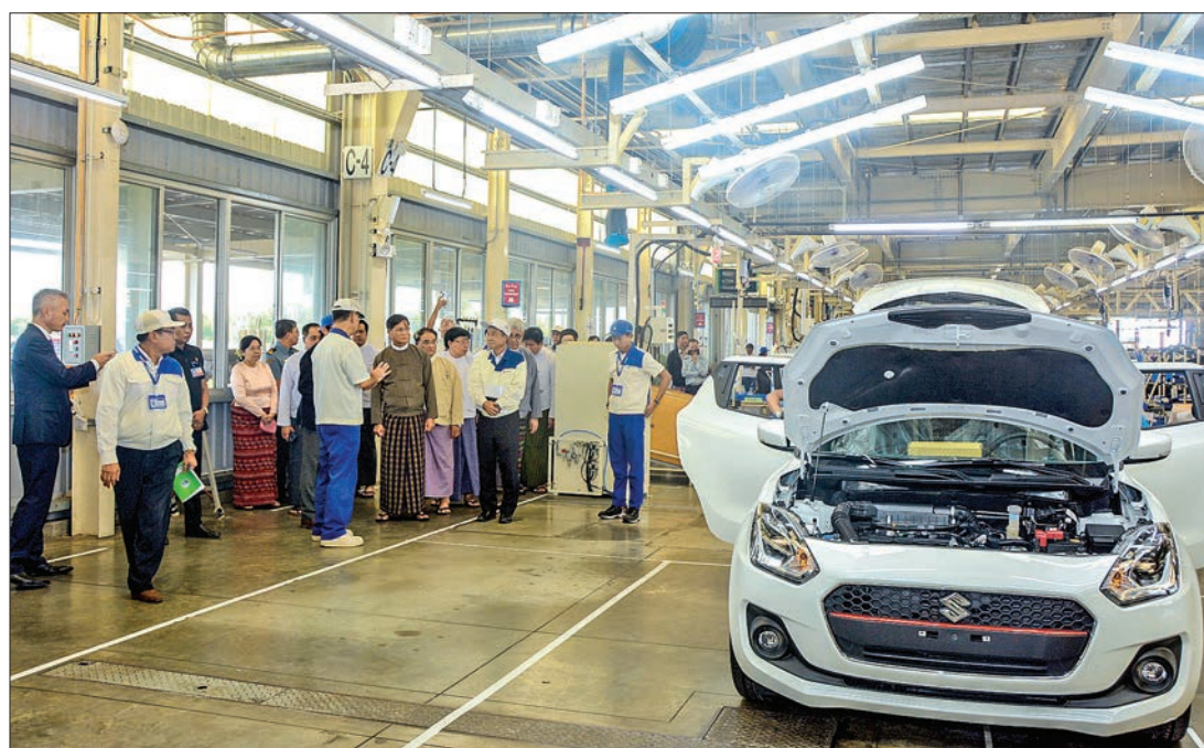
Vice President U Henry Van Thio inspects automotive assembly line at Suzuki Thilawa Motor Co Ltd at Thilawa Special Economic Zone's Zone A in Yangon yesterday.