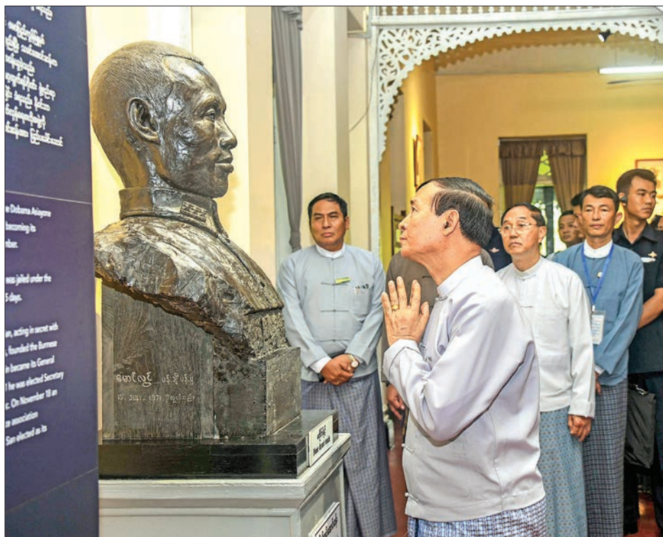
President U Win Myint pays tribute to Bogyoke Aung San statue at Bogyoke Aung San Museum in Yangon yesterday.