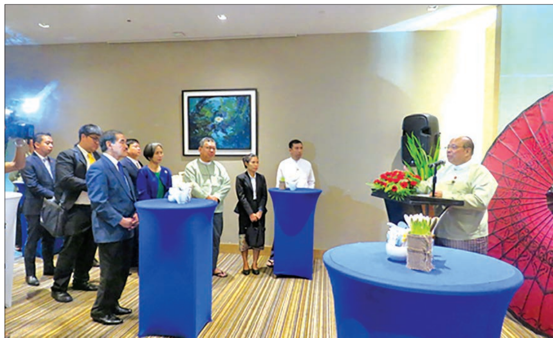
Union Minister U Thaug Tun delivers the speech at the meeting with ASEAN Heads of Mission in Yangon yesterday.

The Heads of Mission discussed the challenges that the investors faced in Myanmar and Union Minister responded the queries of the Ambassadors with regards to the investment promotion matters.—MNA