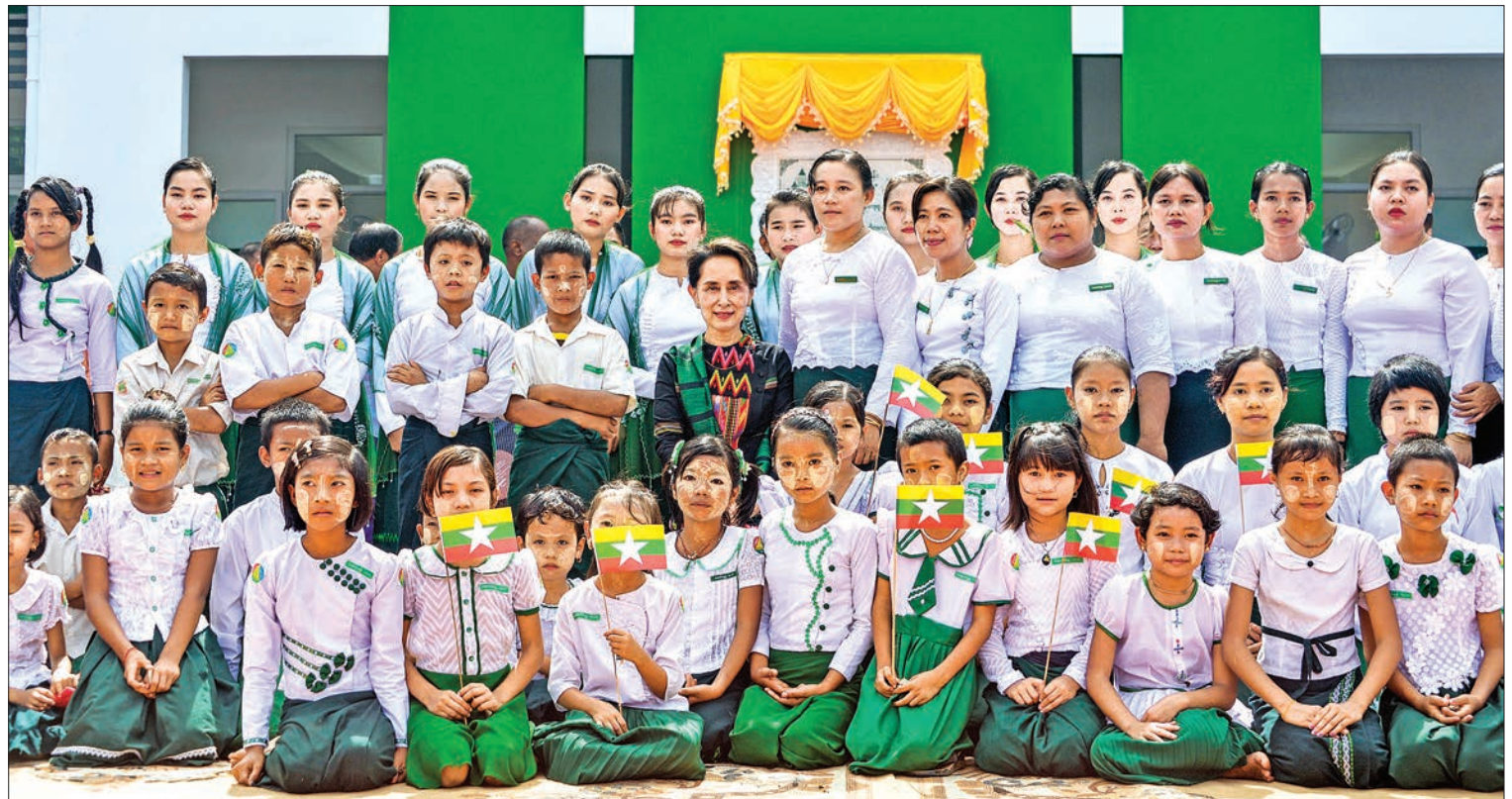
State Counsellor Daw Aung San Suu Kyi poses for a photo together with school children from Aung Zabu Monastic School of Aung Zabu Youth Development Philanthropy Centre in Kawhmu Township.

The ceremony was also attended by Union Ministers