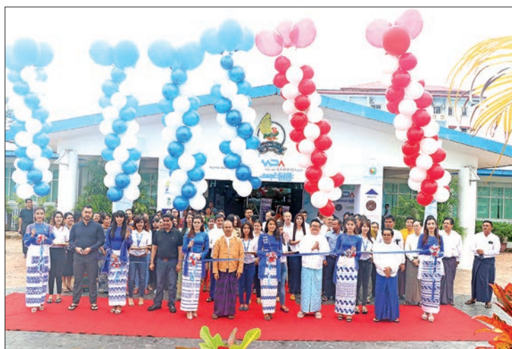
The 5 th Housing Expo of Myanmar Developer Association (MDA) opens at the Mingalar Parami Business Centre on the Parami Road in Yangon.