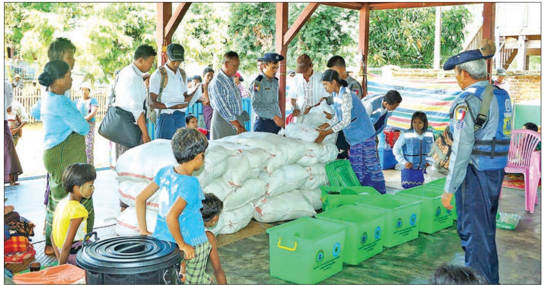
Authorities provide aid to flood victims in Katha Township.

Officials from the Disaster Management Department, Township Fire Services Department, Information and Public Relations Department, Rural Develop-