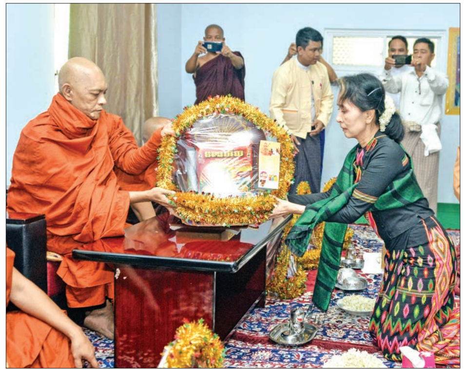
State Counsellor Daw Aung San Suu Kyi offers Waso robes and offertories to the Sayadaw of Aung Zabu Pariyatti Monastery in Kawhmu Township yesterday.