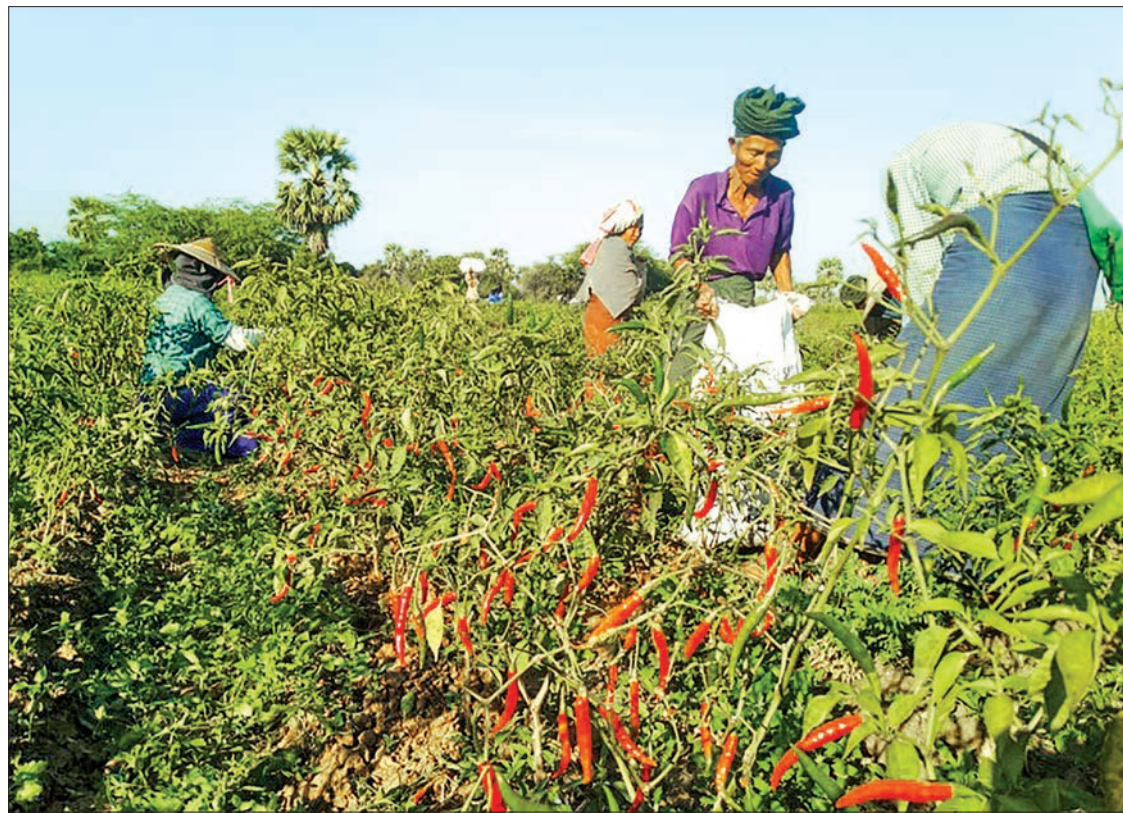
Farmers harvest chillies at a field in NyaungU, Mandalay Region.