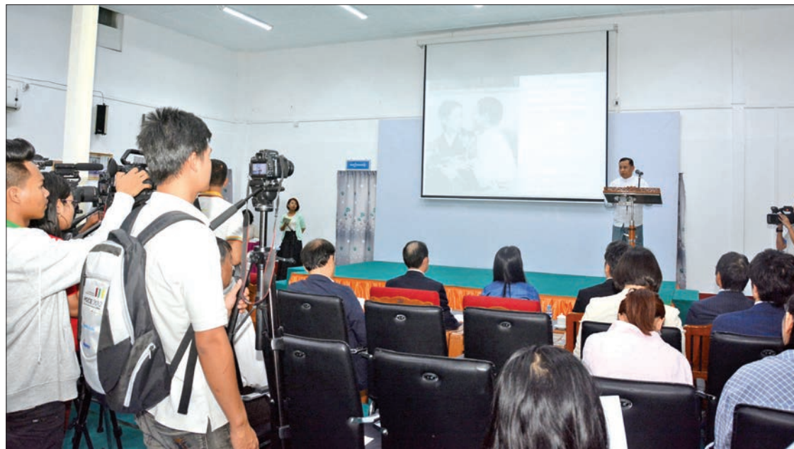
Director-General U Ye Naing delivers the speech at the press conference on digital restoration of the film “Japan Yin Thwe” in Yangon yesterday.

It is a love story about a Myanmar lad and a Japanese lass. It was a hit movie at that time in Myanmar.