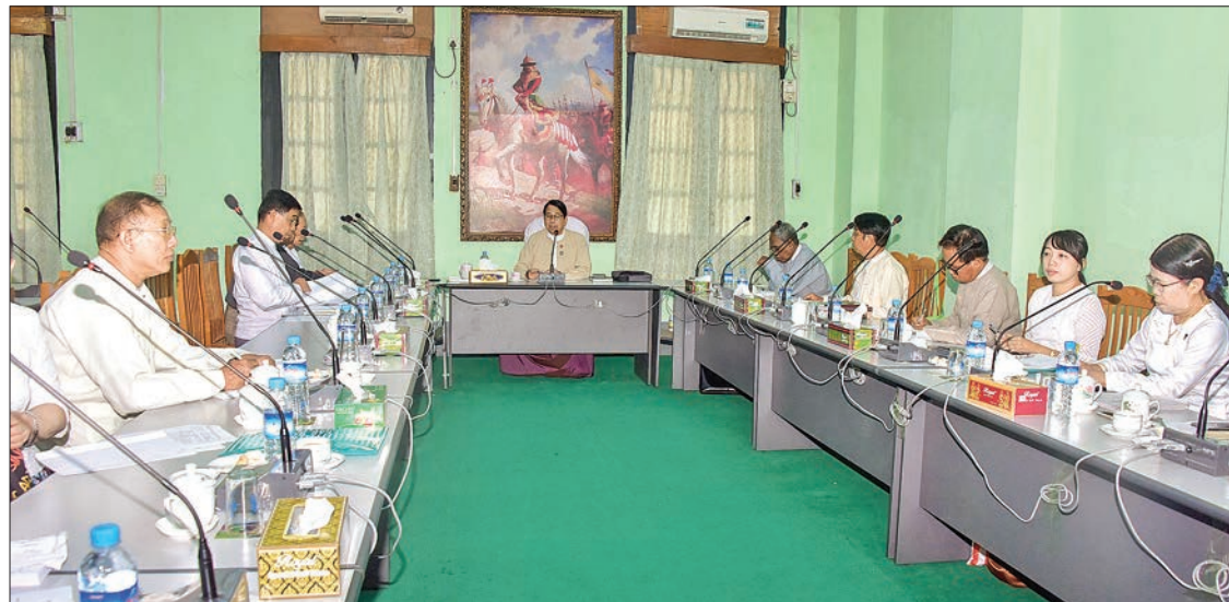
Union Minister for Information Dr Pe Myint attends the coordination meeting on republishing Myanmar Encyclopedia in Yangon yesterday.

COORDINATION meeting on republishing Myanmar Encyclopedia was held at Printing and Publishing Department on Theinbyu Road in Yangon.