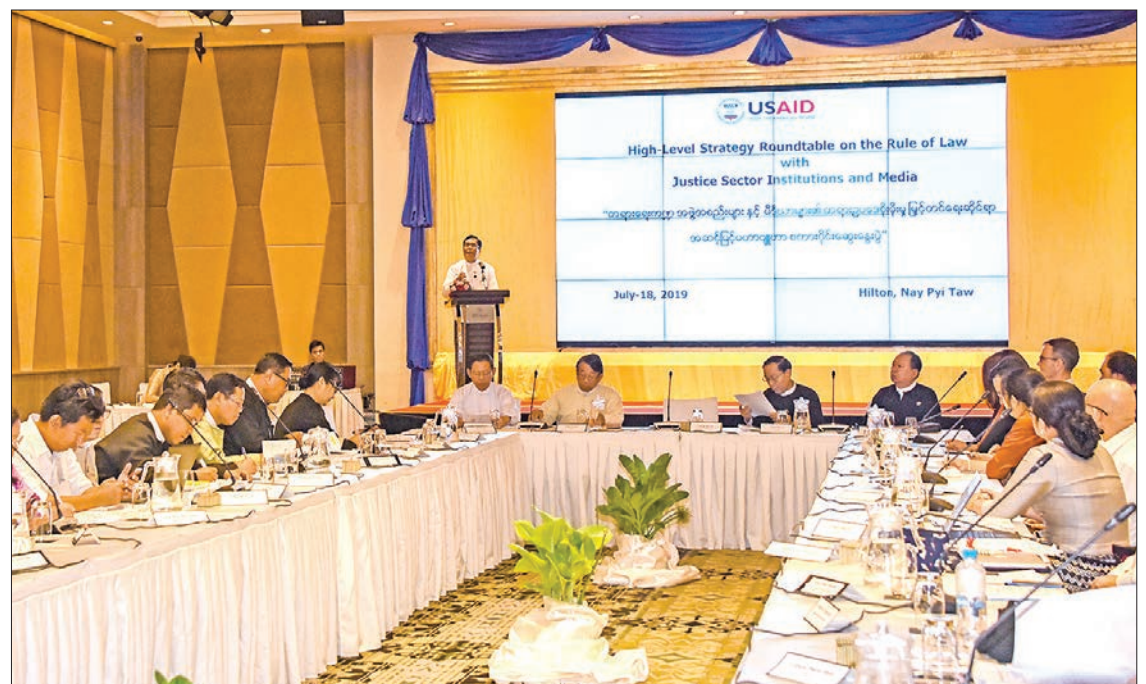
Deputy Minister for Information U Aung Hla Tun delivers the opening speech at the high-level strategy roundtable on the rule of law in Nay Pyi Taw yesterday.

“Media played an important role in our struggle for democracy and human rights. Now our country has reached on the right track to democracy but