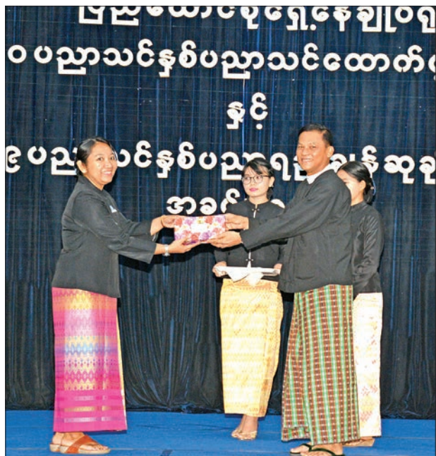
Union Attorney-General U Tun Tun Oo hands over stipends for students of the staff of the Office of Union Attorney-General to an official.